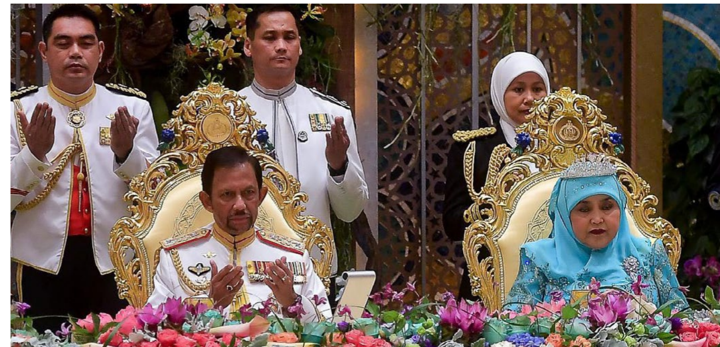
His Majesty Sultan Haji Hassanal Bolkhiah Mu'izzaddin Waddaulah ibni Al-Marhum Sultan Haji Omar 'Ali Saifuddien Sa'adul Khairi Waddien, Sultan and Yang Di-Pertuan of Brunei Darussalam and Her Majesty Duli Raja Isteri Pengiran Anak Hajah Saleha binti Al-Marhum Pengiran Pemancha Pengiran Anak Haji Mohamed Alam during the Royal Banquet.

BANDAR SERI BEGAWAN, July 15 - His Majesty Sultan Haji Hassanal Bolkhiah Mu'izzaddin Waddaulah ibni Al-Marhum Sultan Haji Omar 'Ali Saifuddien Sa'adul Khairi Waddien, Sultan and Yang Di-Pertuan of Brunei Darussalam and Her Majesty Duli Raja Isteri Pengiran Anak Hajah Saleha binti Al-Marhum Pengiran Pemancha Pengiran Anak Haji Mohamed Alam, graced a Royal Banquet in conjunction with His Majesty's 72 nd Birthday Celebration. The ceremony took place at the Banquet Hall of Istana Nurul Iman.