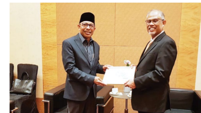
Yang Berhormat Dato Seri Paduka Awang Haji Suhaimi bin Haji Gafar, Minister of Development and His Excellency Masagos Zulkifli, the Minister of Environment and Water Resources of Singapore.

During the bilateral meeting with His Excellency Lawrence Wong and the Minister discussed on the issues of national