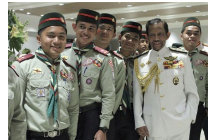
His Majesty mingled and received Junjung Ziarah from the personnel attending the banquet.