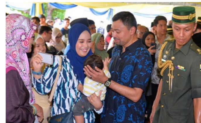
His Royal Highness Prince Haji Al-Muhtadee Billah, the Crown Prince and Senior Minister at the Prime Minister's Office during the Get-Together ceremony in Belait District.

His Majesty and members of the royal family proceeded down to the field to congratulate the performers as well as to greet the citizens and residents of the Belait District.