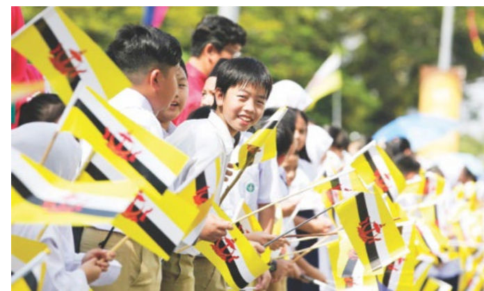
Students lining up the streets leading to the dais, waving mini flags.