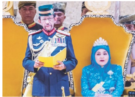
1. Make Islamic History a compulsory subject