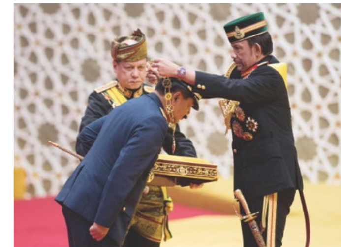
His Majesty conferring The Most Exalted Order of Paduka Keberanian Laila Terbilang, First Class (D.P.K.T.) to His Excellency Air Chief Marshal TNI Hadi Tjahjanto, the Commander of the Indonesian National Armed Forces.