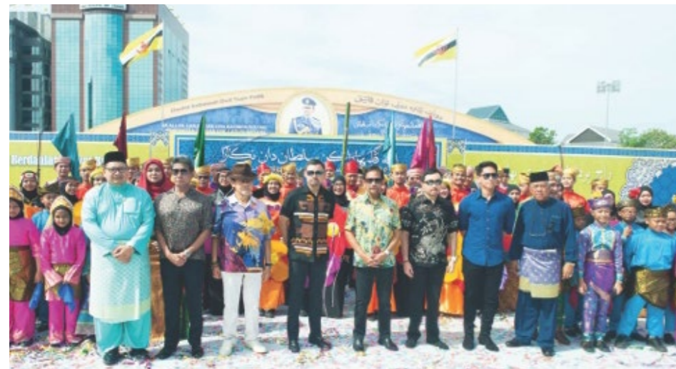
His Majesty the Sultan and Yang Di-Pertuan of Brunei Darussalam; His Royal Highness Prince Haji Al-Muhtadee Billah, the Crown Prince and Senior Minister at the Prime Minister's Office; His Royal Highness Prince 'Abdul Malik; His Royal Highness Prince 'Abdul Mateen; His Royal Highness Prince Mohamed Bolkiah; and His Royal Highness Prince Haji Jefri Bolkiah in a group photo with the performers.

Accompanying His Majesty were His Majesty's sons and brothers, His Royal Highness Prince Haji Al-Muhtadee Billah, the Crown Prince and Senior Minister at the Prime Minister's Office; His Royal Highness Prince 'Abdul Malik; His Royal Highness Prince 'Abdul Mateen; His Royal Highness Prince Mohamed