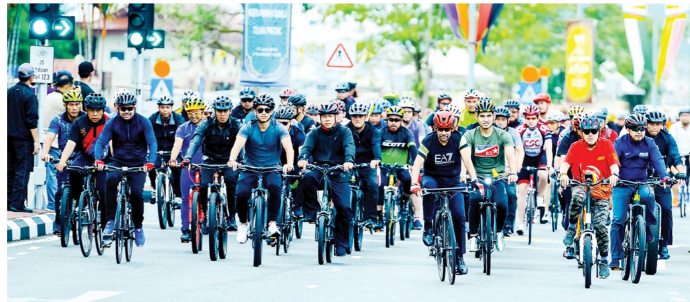
His Majesty Sultan Haji Hassanal Bolkiah Mu'izzaddin Waddaulah ibni Al-Marhum Sultan Haji Omar 'Ali Saifuddin Sa'adul Khairi Waddien, Sultan and Yang Di-Pertuan of Brunei Darussalam; His Royal Highness Prince Haji Al-Muhtadee Billah, the Crown Prince and Senior Minister at the Prime Minister's Office; His Royal Highness Prince 'Abdul Mateen; and His Royal Highness Prince Mohamed Bolkiah during the cycling event.

BANDAR SERI BEGAWAN, July 22 - The joyous early morning atmosphere enlivened the capital, with all levels of the community joining His Majesty Sultan Haji Hassanal Bolkiah Mu'izzaddin Waddaulah ibni Al-Marhum Sultan Haji Omar 'Ali Saifuddin Sa'adul Khairi Waddien, Sultan and Yang Di-Pertuan of Brunei Darussalam in the Royal Birthday Cycling Recreation 2018.