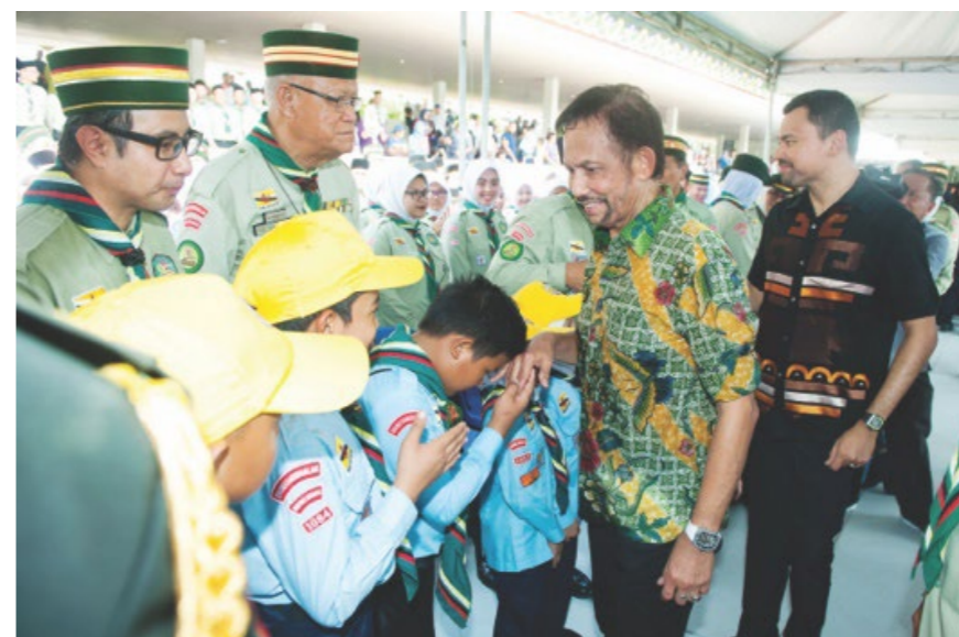
His Majesty the Sultan and Yang Di-Pertuan of Brunei Darussalam and His Royal Highness Prince Haji Al-Muhtadee Billah, the Crown Prince and Senior Minister at the Prime Minister's Office mingling with the public.