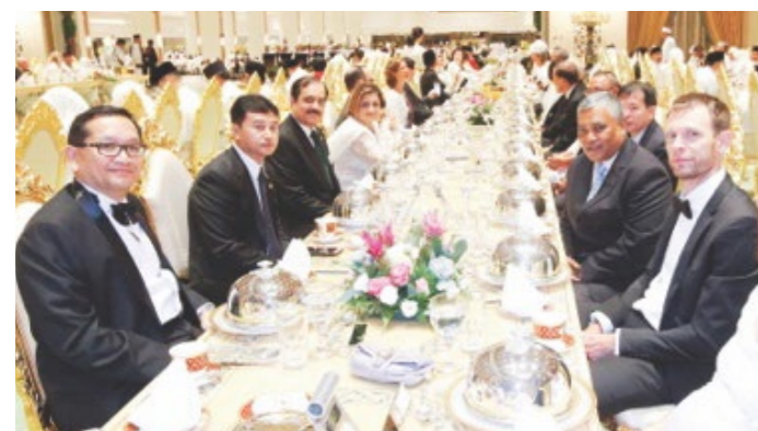
Among the special guests attending the banquet.

Also present were His Royal Highness Prince 'Abdul Malik and Yang Amat Mulia Pengiran Anak Isteri Pengiran Raabi'atul 'Adawiyah; His Royal Highness Prince 'Abdul Mateen; His Royal Highness Prince 'Abdul Wakeel; His Royal Highness Prince Mohamed Bolkiah and Her Royal Highness Pengiran Anak Isteri Pengiran Anak Hajah Zariah; His Royal Highness Prince Haji Jefri Bolkiah and Yang Amat Mulia Pengiran Anak Isteri Pengiran Norhayati; Her Royal Highness Princess 'Ameerah Wardatul Bolkiah; Her Royal Highness Princess Hajah Masna; Her Royal Highness Princess Hajah Amal Umi Kalthum Al-Islam; and other members of the royal family.