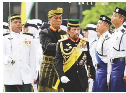
6. His Majesty's 72 nd Birthday Celebration: Grand Royal Birthday Parade