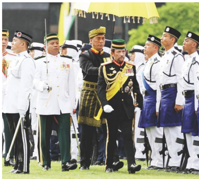
His Majesty inspecting the Guard of Honour mounted by personnel of the Royal Brunei Land Force, Royal Brunei Navy, Royal Brunei Air Force, Royal Brunei Police Force, the government departments and other uniformed organisations.

The combined bands of the Royal Brunei Armed Forces (RBAF) and the Royal Brunei Police Force accompanied the parade and march past in front of the Royal dais. The marching personnel's three chants of Daulat Kebawah Duli Tuan Patik with the fly-past of a RBAF fleet over the Taman.