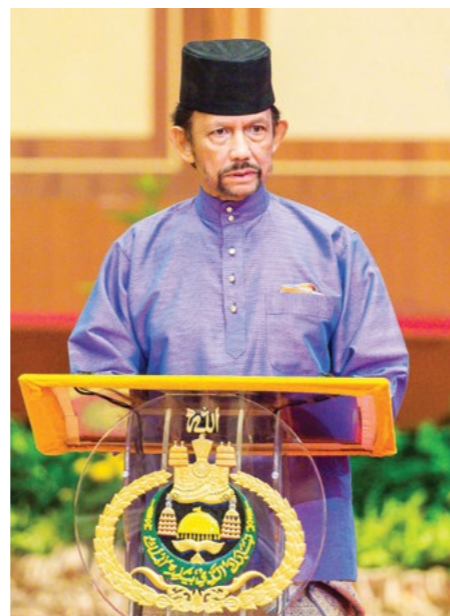
His Majesty Sultan Haji Hassanal Bolkiah Mu'izzaddin Waddaulah ibni Al-Marhum Sultan Haji Omar 'Ali Saifuddien Sa'adul Khairi Waddien, Sultan and Yang Di-Pertuan of Brunei Darussalam delivering a titah (royal speech) during the Yayasan Hari Raya Aidilfitri celebration.

Also present at the Hari Raya Aidilfitri Celebration were Her Majesty Duli Raja Isteri Pengiran Anak Hajah Saleha binti Al-Marhum Pengiran Pemancha Pengiran Anak Haji Mohamed Alam; His Royal Highness Prince Haji Al-Muhtadee Billah, the Crown Prince and Senior Minister at the Prime Minister's Office; Her Royal Highness Paduka Seri Pengiran Anak Isteri Pengiran Anak Sarah binti Pengiran Haji Salleh Ab. Rahaman; His Royal Highness Prince 'Abdul Malik, Chairman of the Board of Governors of Yayasan; Yang Amat Mulia Pengiran Anak Isteri Pengiran Raabi'atul 'Adawiyah binti Pengiran Haji Bolkiah; His Royal Highness Prince Mohamed Bolkiah; His Royal Highness Prince Haji Jefri Bolkiah; Her Royal Highness Princess Hajah Masna, Ambassador-at-Large at the Ministry of