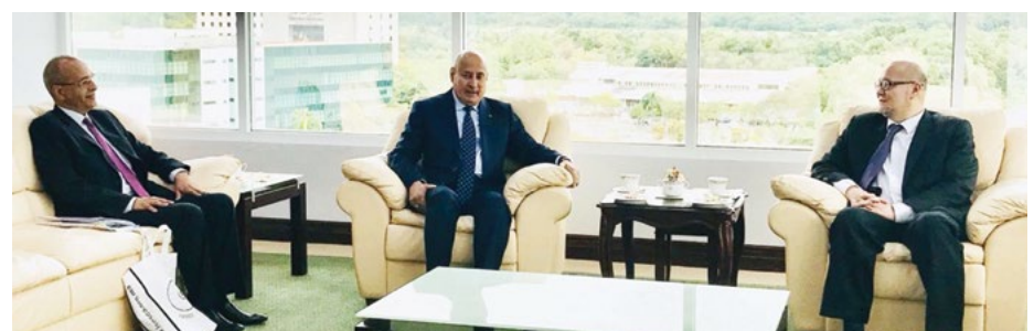
Yang Berhormat Dato Paduka Awang Haji Hamzah bin Haji Sulaiman, Minister of Education received a courtesy call from His Excellency Dr. Abdulaziz Othman Altwajiri, Director-General of I-SESCO.

Darussalam through science and technology, halal industry, renewable energy and 21 st century education focusing on school leaders and quality teachers were also discussed.