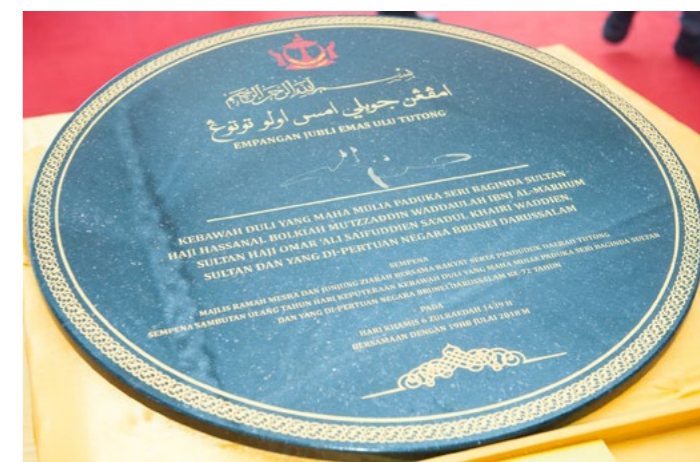
Name plaque of Empangan Jubli Emas Ulu Tutong.