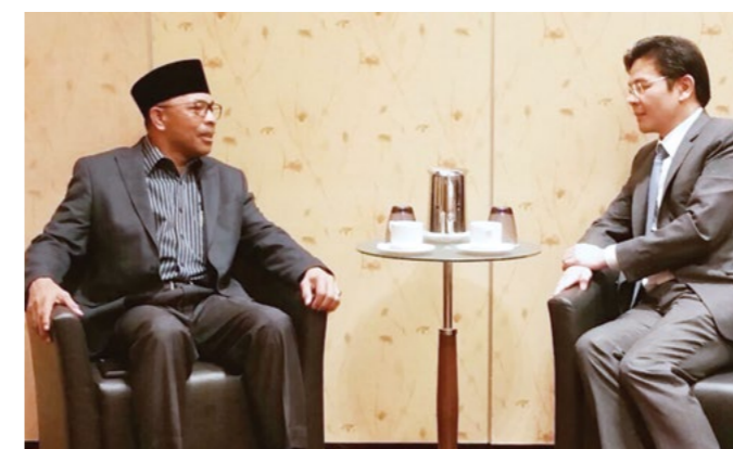
The Minister of Development and His Excellency Lawrence Wong, the Minister of National Development of Singapore.

During the bilateral meeting with His Excellency Masagos Zulkifli, both ministers discussed views on environmental and water issues of mutual interest and also updated on the progress in areas of collaboration and joint activities such as air quality monitoring, water resources management and environmental youth exchange. Under the framework of the Memorandum of Understanding (MoU) on Bilateral Partnership in Environmental Affairs between Brunei and Singapore, meetings and exchanges on environmental programmes ranging from solid waste management, air quality, water resources management and environmental education are held annually.