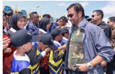
13. Get-Together and Junjung Ziarah Ceremony: Tutong District