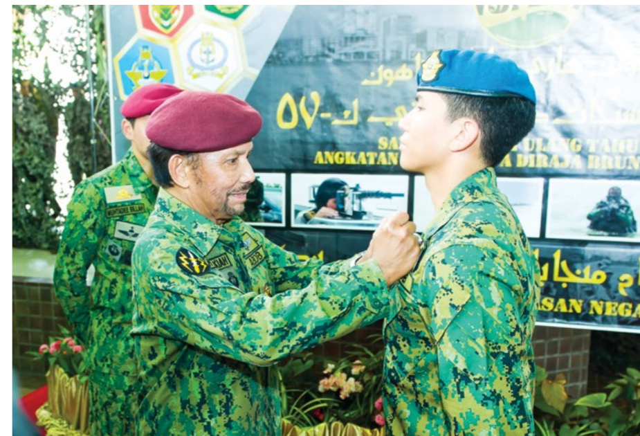
His Majesty awarding the Air Wing Badge to His Royal Highness Captain (U) Prince 'Abdul Mateen.

The ceremony concluded with the signing of the royal parchment, followed by a group photograph session with members of the Defence Executive Committee, service commanders, commandants, former deputy ministers of defence and former commanders of