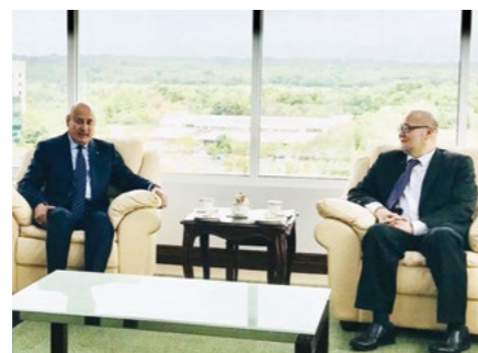
24. Minister of Education receives courtesy call