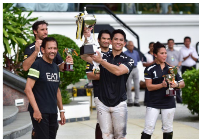
His Royal Highness Prince 'Abdul Mateen holds the trophy for winning the tournament.

Also in attendance were His Royal Highness Prince 'Abdul Wakeel; His Royal Highness Prince Mohamed Bolkiah and