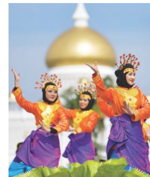
Performers during the event at the Taman Haji Sir Muda Omar 'Ali Saifuddin.