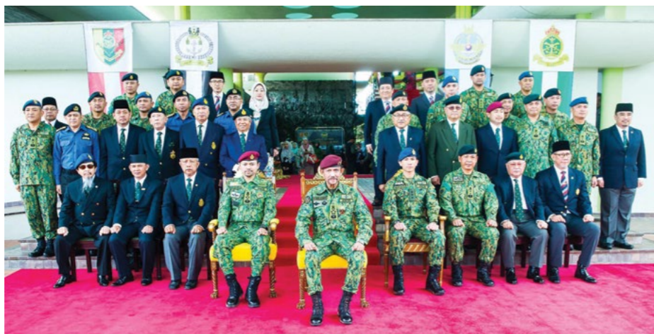
His Majesty in a group photograph session with members of the Defence Executive Committee, service commanders, commandants, former deputy ministers of defence and former commanders of the RBAF, as well as military and civilian directors and heads of units.

resist and avoid temptation by staying away from harmful and destructive activities," said His Majesty.