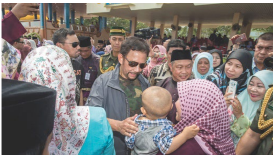
His Majesty the Sultan and Yang Di-Pertuan of Brunei Darussalam during the Get-Together and Junjung Ziarah Ceremony with the residents of the Tutong District.

An array of colourful performances by the youth in the district further enlivened the event. Carrying the theme 'Raja Unggul Negara Gemilang' or 'Noble Ruler, Prosperous Nation', the performances involved more than 272 participants comprising civil servants, primary and secondary school students, individuals from various levels of the society, Mukim and Village