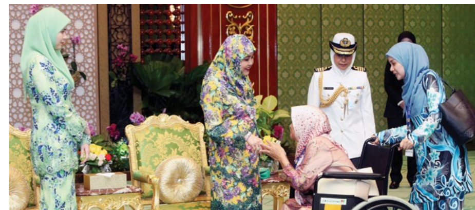
Her Majesty was accompanied by Her Royal Highness Paduka Seri Pengiran Anak Isteri Pengiran Anak Sarah binti Pengiran Haji Salleh Ab. Rahaman receiving a junjung ziarah from intending female pilgrims.