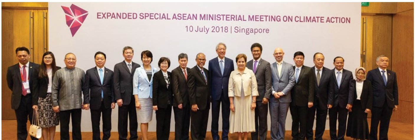
Yang Berhormat Dato Paduka Dr. Awang Haji Mat Suny bin Haji Mohd. Hussein, Minister of Energy and Industry and His Excellency Teo Chee Hean, Deputy Prime Minister of the Republic of Singapore with ministers from ASEAN and Plus Three Partners, ASEAN Secretary-General, COP23 Presidency representative, COP24 Presidency and the UNFCCC Executive Secretary.

REPUBLIC OF SINGAPORE, July 10 - The ASEAN Member States' Ministers in charge of climate change gathered in Singapore to convene the Special ASEAN Ministerial Meeting on Climate Action (SAMCA).