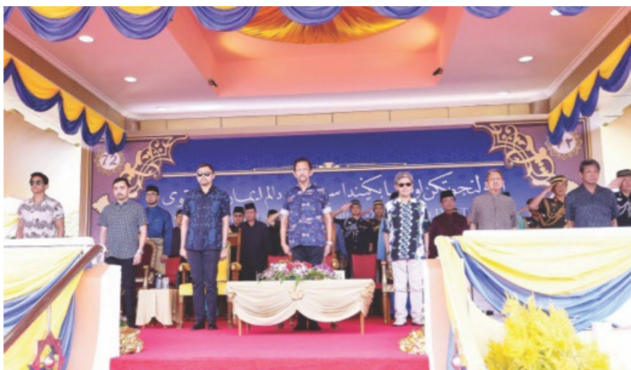
His Majesty Sultan Haji Hassanal Bolkiah Mu'izzaddin Waddaulah ibni Al-Marhum Sultan Haji Omar 'Ali Saifuddin Sa'adul Khairi Waddien, Sultan and Yang Di-Pertuan of Brunei Darussalam; His Royal Highness Prince Haji Al-Muhtadee Billah, the Crown Prince and Senior Minister at the Prime Minister's Office; His Royal Highness Prince 'Abdul Malik; His Royal Highness Prince 'Abdul Mateen; His Royal Highness Prince Mohamed Bolkiah; His Royal Highness Prince Haji Sufri Bolkiah; and His Royal Highness Prince Haji Jefri Bolkiah at the royal Get-Together ceremony in the Belait District.