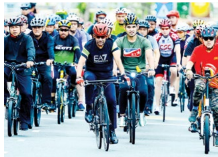
17. His Majesty joins Royal Birthday Cycling Recreation