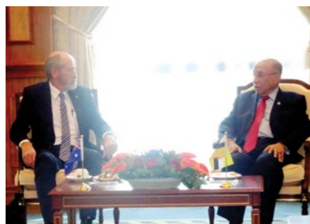
22. Courtesy call from the Australian Parliament delegation