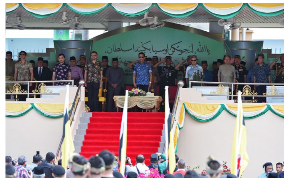
His Majesty the Sultan and Yang Di-Pertuan of Brunei Darussalam, is Royal Highness Prince Haji Al-Muhtadee Billah, the Crown Prince and Senior Minister at the Prime Minister's Office; His Royal Highness Prince 'Abdul Malik; His Royal Highness Prince 'Abdul Mateen; His Royal Highness Prince Mohamed Bolkiah; His Royal Highness Prince Haji Sufri Bolkiah; and His Royal Highness Prince Haji Jefri Bolkiah at the Get-Together ceremony in Temburong District.