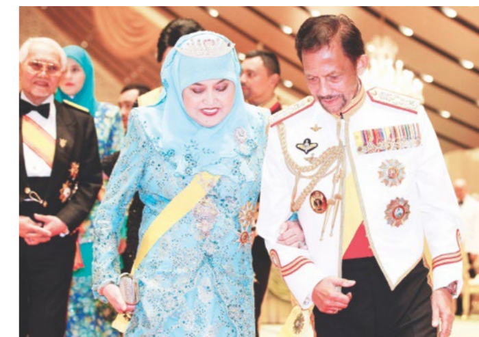
His Majesty Sultan Haji Hassanal Bolkhiah Mu'izzaddin Waddaulah ibni Al-Marhum Sultan Haji Omar 'Ali Saifuddien Sa'adul Khairi Waddien, Sultan and Yang Di-Pertuan of Brunei Darussalam and Her Majesty Duli Raja Isteri Pengiran Anak Hajah Saleha, proceeding to the Royal Banquet in conjunction with His Majesty's 72 nd Birthday Celebration.