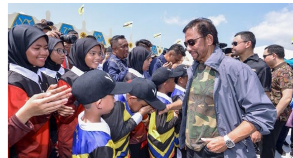
His Majesty Sultan Haji Hassanal Bolkiah Mu'izzaddin Waddaulah ibni Al-Marhum Sultan Haji Omar 'Ali Saifuddin Sa'adul Khairi Waddien, Sultan and Yang Di-Pertuan of Brunei Darussalam and members of the royal family being greeted by the people of Tutong District.

Hundreds of students lined up the streets leading up to the dais, waving mini flags, waiting to greet the arrival His Majesty and members of the royal family.