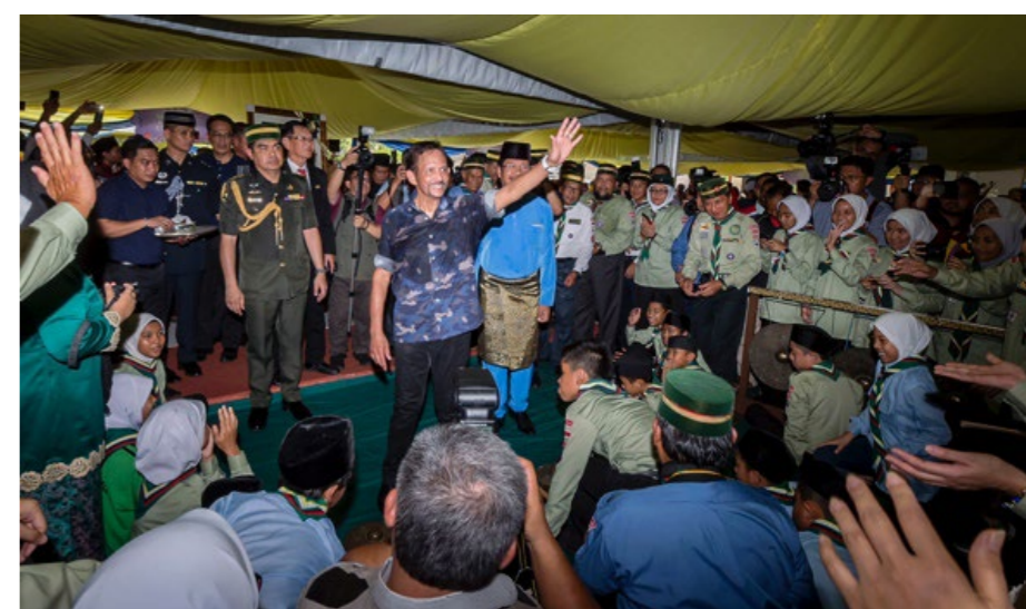
His Majesty the Sultan and Yang Di-Pertuan of Brunei Darussalam greeting people at the Get-Together ceremony in Belait District.

His Majesty and members of the royal family proceeded down to the field to congratulate the performers as well as to greet the citizens and residents of the Belait District.