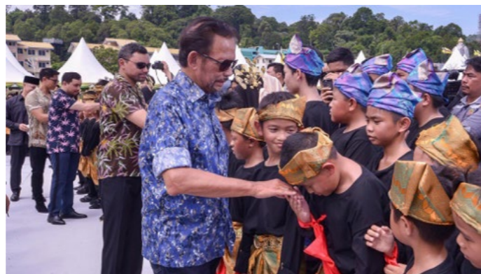
His Majesty the Sultan and Yang Di-Pertuan of Brunei Darussalam and members of the royal family receiving a junjung ziarah (meet and greet).

After the performance, His Majesty, accompanied by members of the royal family, went around the field for the Get-Together and Junjung Ziarah .