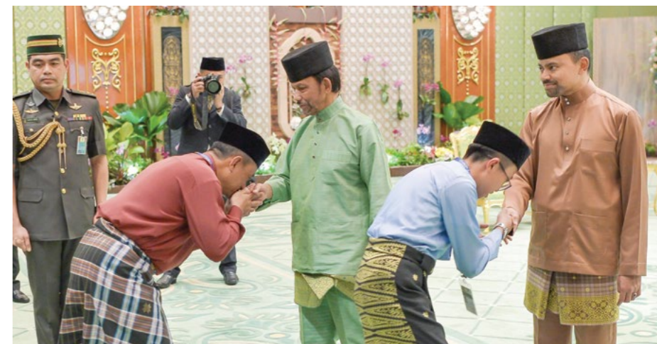
His Majesty accompanied by His Royal Highness Prince Haji Al-Muhtadee Billah, the Crown Prince and Senior Minister at the Prime Minister's Office, receiving a junjung ziarah from intending male pilgrims.

Prior to the junjung ziarah , the intending pilgrims were treated to a meal and performed a mass Zohor prayer at the palace and were later presented with a Kumia (personal gift) from His Majesty. The male pilgrims were each presented with a set of ihram garments (Haj attire) while the female pilgrims received a telekung (prayer robe).