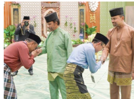
19. Audience and Junjung Ziarah for Intending Haj Pilgrims