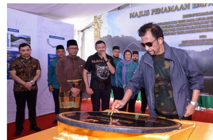
His Majesty signing the name plaque of the Empangan Jubli Emas Ulu Tutong.

The Tutong dam reservoir is designed to operate as a regulating reservoir and will release water into the Tutong River when the natural flow is insufficient to meet the required demand. Its operation will be integrated with the existing Benutan Dam and the gated Tutong downstream barrage of water supply intakes at Kuala Abang and Layong.