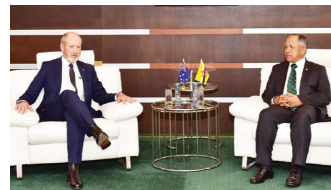
Yang Berhormat Pehin Datu Lailaraja Major General (Rtd) Dato Paduka Seri Haji Awang Halbi bin Haji Mohd. Yussof, the Second Minister of Defence and Mr. Rowan Ramsey, Member of Parliament of Australia during the courtesy call.

BOLKIAH GARISON, July 25 - Yang Berhormat Pehin Datu Lailaraja Major General (Rtd) Dato Paduka Seri Haji Awang Halbi bin Haji Mohd. Yussof, the Second Minister of Defence received a courtesy call from an Australian Parliament delegation led by Mr. Rowan Ramsey, Member of Parliament of Australia.