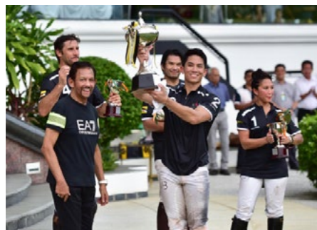
20. Brunei Polo Team wins Polo Tournament