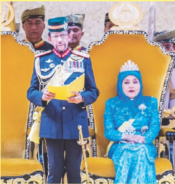
His Majesty Sultan Haji Hassanal Bolkiah Mu'izzaddin Waddaulah ibni Al-Marhum Sultan Haji Omar 'Ali Saifuddien Sa'adul Khairi Waddien, Sultan and Yang Di-Pertuan of Brunei Darussalam delivering a titah (royal speech) during the Audience and Investiture Ceremony held in conjunction with the Monarch's 72 nd Birthday Celebration at Balai Singgahsana Indera Buana of Istana Nurul Iman.

BANDAR SERI BEGAWAN, July 15 - His Majesty Sultan Haji Hassanal Bolkiah Mu'izzaddin Waddaulah ibni Al-Marhum Sultan Haji Omar 'Ali Saifuddien Sa'adul Khairi Waddien, Sultan and Yang Di-Pertuan of Brunei Darussalam stressed that all relevant parties should make Islamic History a compulsory subject at schools and studies centre under the related ministries and in the private sector.