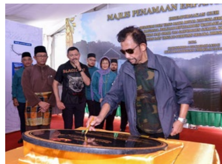
21. His Majesty officiates naming of Empangan Jubli Emas Tutong