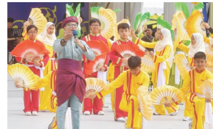
Performances carrying the the theme 'Kasih Rakyat Untuk Raja Yang Berkat'.