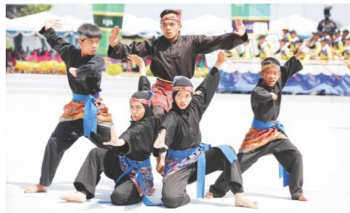
One of the performances by the youth in the district further enlivened the event.