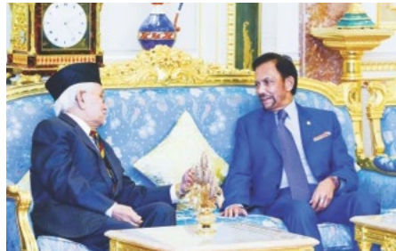
9. His Majesty's 72 nd Birthday Celebration: Audience Ceremony