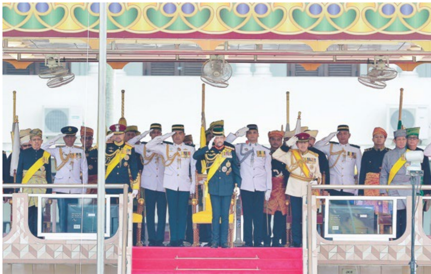
His Majesty Sultan Haji Hassanal Bolkiah Mu'izzaddin Waddaulah ibni Al-Marhum Sultan Haji Omar 'Ali Saifuddien Sa'adul Khairi Waddien, Sultan and Yang Di-Pertuan of Brunei Darussalam with His Royal Highness Prince Haji Al-Muhtadee Billah, the Crown Prince and Senior Minister at the Prime Minister's Office; His Royal Highness Prince Mohamed Bolkiah; His Royal Highness Prince Haji Sufri Bolkiah; and His Royal Highness Prince Haji Jefri Bolkiah receiving the Royal Salute.

BANDAR SERI BEGAWAN, July 15 - The 72 nd Birthday Celebrations of His Majesty Sultan Haji Hassanal Bolkiah Mu'izzaddin Waddaulah ibni Al-Marhum Sultan Haji Omar 'Ali Saifuddien Sa'adul Khairi Waddien, Sultan and Yang Di-Pertuan of Brunei Darussalam commenced with the traditional Grand Royal Birthday Parade or Guard of Honour at Taman Haji Sir Muda Omar 'Ali Saifuddien.