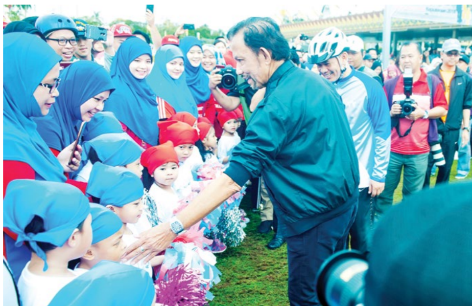
His Majesty with children of the Special Olympics Brunei Darussalam.

Apart from the Royal Birthday Cycling Recreation, His Majesty the Sultan and Yang Di-Pertuan of Brunei Darussalam took a closer look at the Bandarku Ceria activities, such as, the Special Olympics Brunei Darussalam exhibition; the 'First Aid Responding to an Emergency' Aid Showcase by the Brunei Darussalam Red Crescent Society; Talent Identification Program (TID) exhibition; a health and activeness programme, B-FIT4LIFE; cycling polo sport; an exhibition by the Department of Environment, Parks and Recreation, Department of Water Services and the Survey Department; archery activity organised by Al-Rafi Archery Brunei and a Paintball activity conducted by Paintball Arena Jerudong;