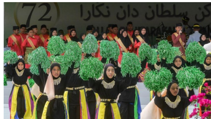
Special performance by more than 300 students from primary, secondary and Arabic schools as well as members of the Brunei Darussalam National Martial Arts Association (PERSIB).

The special performance with its theme 'Raja Prihatin, Mahkota Rakyat' (Concerned Monarch, Crown of the People) was presented by more than 300 students from primary, secondary and Arabic schools as well as members of the Brunei