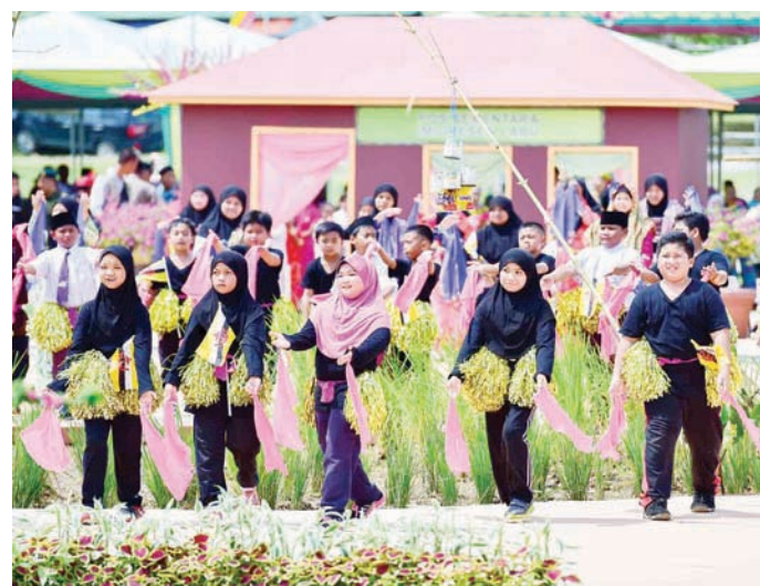
A special performance carrying the theme, 'Raja Masyhur, Negara Makmur' by 369 participants.

The cheers of 'Daulat Kebawah Duli Tuan Patik' were echoed by the Mukim and Village Penghulu, Kampung and Longhouse Chiefs, committee members and communities of the Temburong District. A special performance carrying the theme, 'Raja Masyhur, Negara Makmur' or 'Well Known Monarch, Prosperous Country' was performed by 369 participants consisting of 130 movement participants, 65 singing and voice background participants and 45 singers and traditional music participants. After the performance, His Majesty and members of the royal family received a junjung ziarah from the participants, committee members, citizens and residents of the Temburong District.