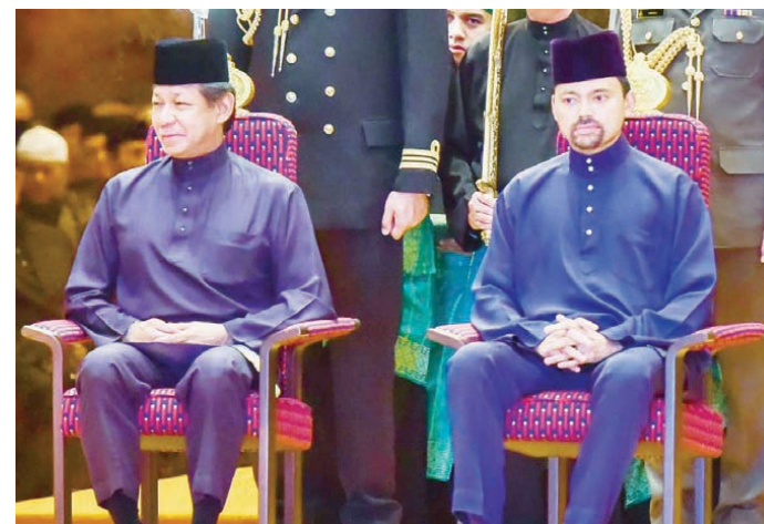
Also in attendance were His Royal Highness Crown Prince Haji Al-Muhtadee Billah the Crown Prince and Senior Minister at the Prime Minister's Office, His Royal Highness Prince Haji Sufri Bolkiah, His Royal Highness Prince Haji Jefri Bolkiah and His Royal Highness Prince 'Abdul Malik.