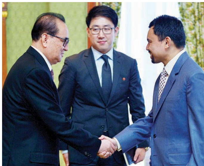
His Excellency Ri Su Yong, Minister External Democratic of Republic of Korea on August 12.

His Royal Highness Prince Haji Al-Muhtadee Billah ibni His Majesty Sultan Haji Hassanal Bolkiah Mu'izzaddin Waddaulah, the Crown Prince and Senior Minister at the Prime Minister's Office received in audience at Qashr Al-Meezan from: