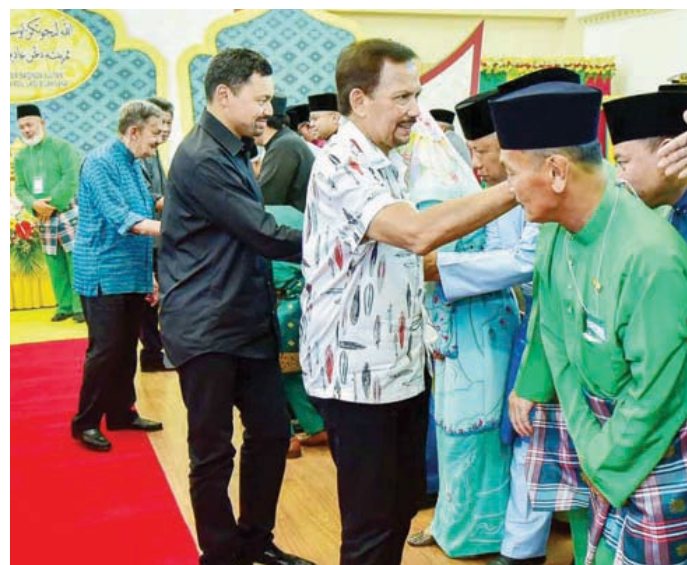
His Majesty Sultan Haji Hassanal Bolkiah Mu'izzaddin Waddaulah ibni Al-Marhum Sultan Haji Omar 'Ali Saifuddien Sa'adul Khairi Waddien, Sultan and Yang Di-Pertuan of Brunei Darussalam accompanied by His Royal Highness Prince Haji Al-Muhtadee Billah greeting Mukim Chiefs and Village Heads at the Get-Together Ceremony.