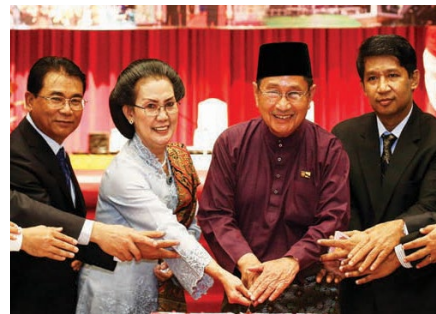
21. Reception in conjunction with Republic of Indonesia's 70 th National Day