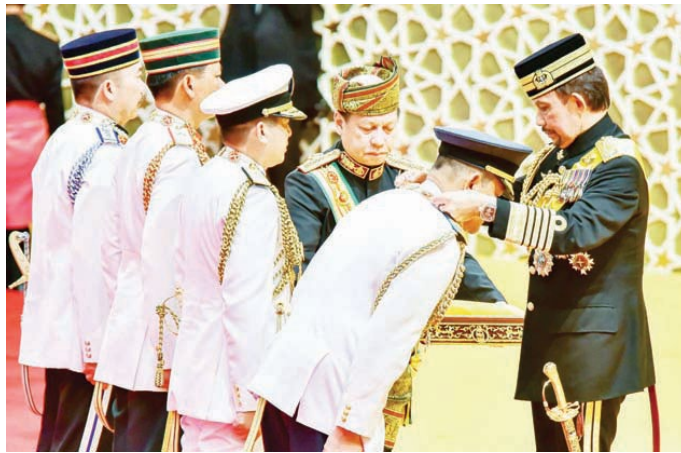
His Majesty first conferred The Most Gallant Order of Pahlawan Negara Brunei First Class (P.S.P.N.B) which carries the title Dato Seri Pahlawan to 4 recipients.