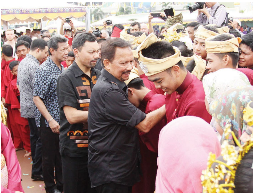
His Majesty and members of the royal family receiving a junjung ziarah from the participants involved in the special performance.

After the performance, His Majesty and members of the royal family received a junjung ziarah from the participants, committee members, citizens and residents of the Brunei Muara District.