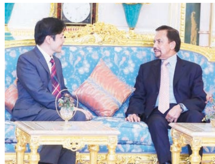
The Honorable Mr. Lawrence Wong, Singapore's Minister of Culture, Society and Youth and Second Minister of Communication and Information on August 15.