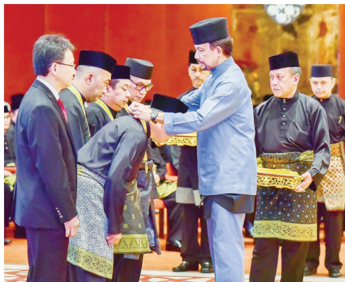
His Majesty the Sultan and Yang Di-Pertuan of Brunei Darussalam conferring State Decorations in conjunction with His Majesty's 69 th Birthday Celebration. (left and right).