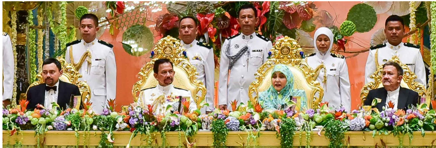
His Majesty the Sultan and Yang Di-Pertuan of Brunei Darussalam and Her Majesty Duli Raja Isteri Pengiran Anak Hajah Saleha binti Al-Marhum Pengiran Pemancha Pengiran Anak Haji Mohamed Alam, His Royal Highness Prince Haji Al-Muhtadee Billah, the Crown Prince and His Royal Highness Prince Haji Sufri Bolkiah during the Royal Banquet for uniformed officers.