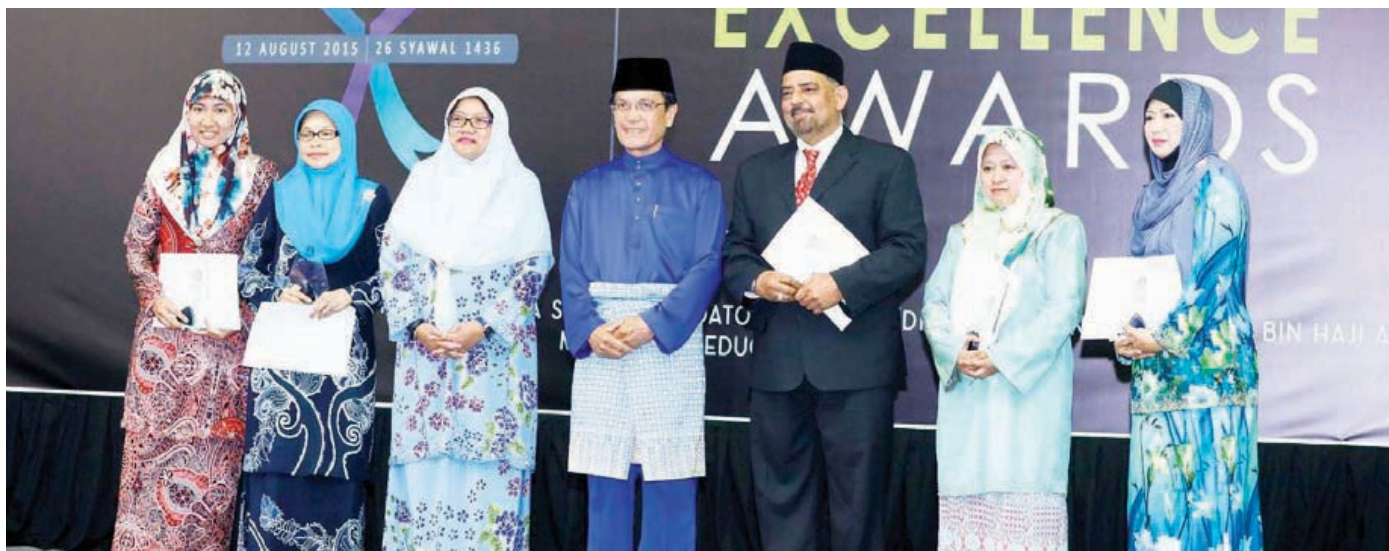
Minister of Education in a group photo with the 5 recipients (academic and non-academic staffs) of ITB that were awarded excellent in various categories.

TUNGKU LINK, August 12 - Five academic and non-academic staff from Institute Teknologi Brunei (ITB) were awarded as outstanding in various categories, teaching and learning, research and administration at the ITB Staff Excellence Awards held at ITB Multipurpose Hall.