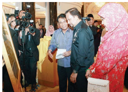
19. Foreign Representatives Chiefs appreciates His Majesty's leadership