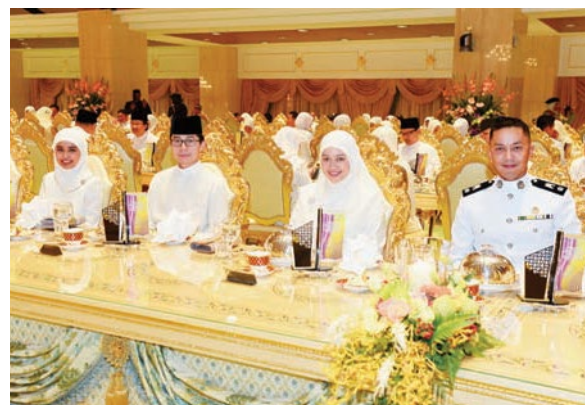
Among members of the Legislative Council and senior government officials present at the banquet.