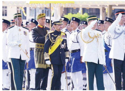
7. Grand Royal Birthday Parade