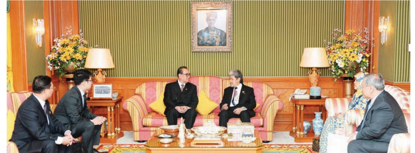
His Excellency Ri Su Yong, Minister External Democratic of Republic of Korea on August 12, also present was Her Royal Highness Princess Hajah Masna binti Al-Marhum Sultan Haji Omar 'Ali Saifuddien Sa'adul Khairi Waddien, Ambassador-at-Large at the Ministry of Foreign Affairs and Trade.

His Royal Highness Prince Mohamed Bolkiah ibni Al-Marhum Sultan Haji Omar 'Ali Saifuddien Sa'adul Khairi Waddien received in audience at the Balai Penghadapan Bukit Kayangan from: