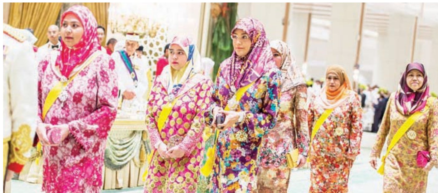
Her Royal Highness Princess Hajah Rashidah Sa'adatulk Bolkiah, Her Royal Highness Princess Hajah Majeedah Nuurul Bolkiah, Her Royal Highness Princess Hajah Hafizah Sururul Bolkiah, Her Royal Highness Princess 'Azemah Ni'matul Bolkiah, Her Royal Highness Princess Hajah Masna and Her Royal Highness Princess Hajah Nor'ain.