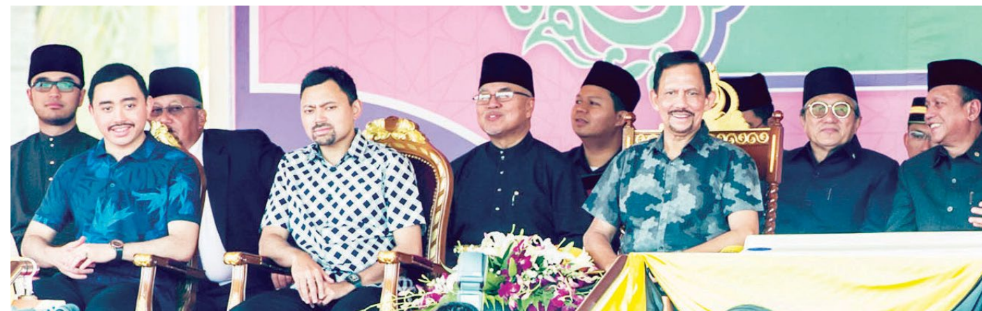
His Majesty Sultan Haji Hassanal Bolkiah Mu'izzaddin Waddaulah ibni Al-Marhum Sultan Haji Omar 'Ali Saifuddien Sa'adul Khairi Waddien, Sultan and Yang Di-Pertuan of Brunei Darussalam, His Royal Highness Prince Haji Al-Muhtadee Billah, the Crown Prince and Senior Minister at the Prime Minister's Office, His Royal Highness Prince Haji Jefri Bolkiah and His Royal Highness Prince 'Abdul Malik during the Get-Together Ceremony in Belait District.

KUALA BELAIT, August 22 - Padang Bandaran became the focus of thousands of citizens and residents in the Belait District this morning as they gather for the Get-Together and Junjung Ziarah Ceremony. Hundreds of miniature national flags waved by the students along the road as they and the hadrah blows welcomed the arrival of His Majesty Sultan Haji Hassanal Bolkiah Mu'izzaddin Waddaulah ibni Al-Marhum Sultan Haji Omar 'Ali Saifuddien Sa'adul Khairi Waddien, Sultan and Yang Di-Pertuan of Brunei Darussalam.