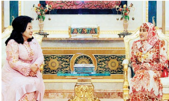
Yang Amat Berbahagia Datin Paduka Seri Rosmah Mansor, the spouse of Malaysia's Prime Minister on October 11.

Her Majesty Duli Raja Isteri Pengiran Anak Hajah Saleha binti Al-Marhum Pengiran Pemancha Pengiran Anak Haji Mohamed Alam consented to receive in audience at Istana Nurul Iman from: