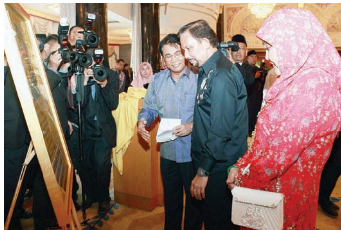
Their Majesties taking a closer look at a special portrait of His Majesty as a pesambah (souvenir) presented by the Chief of Foreign Diplomats.