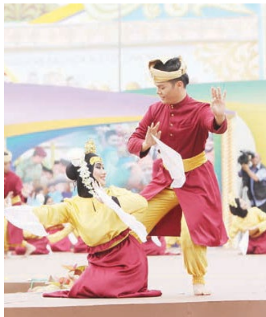
One of the special performances by youth during the ceremony.