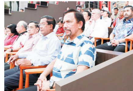
17. Glorify Singapore's 50 years of independence