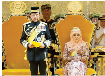
1. Improve Commitment to enhance self-determination