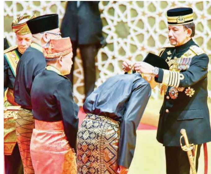
His Majesty conferring the Most Blessed Order of Setia Negara Brunei (S.N.B.) to 7 recipients