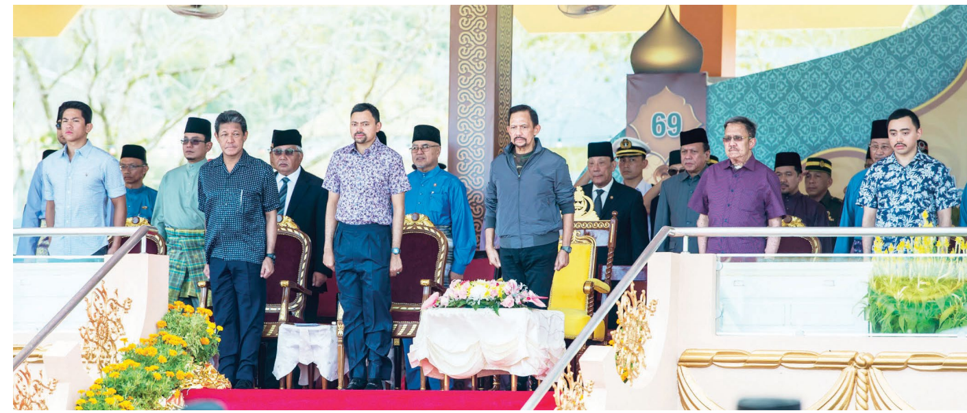
His Majesty Sultan Haji Hassanal Bolkiah Mu'izzaddin Waddaulah ibni Al-Marhum Sultan Haji Omar 'Ali Saifuddien Sa'adul Khairi Waddien, Sultan and Yang Di-Pertuan of Brunei Darussalam and His Majesty's sons and brothers during the Get Together and Junjung Ziarah Ceremony in Tutong District.

TUTONG, August 18 - Tutong was the first district in the series of visits by His Majesty Sultan Haji Hassanal Bolkiah Mu'izzaddin Waddaulah ibni Al-Marhum Sultan Haji Omar 'Ali Saifuddien Sa'adul Khairi Waddien, Sultan and Yang Di-Pertuan of Brunei Darussalam for the Get-Together and Junjung Ziarah Ceremony with the citizens and residents in conjunction with His Majesty's 69 th birthday celebration.