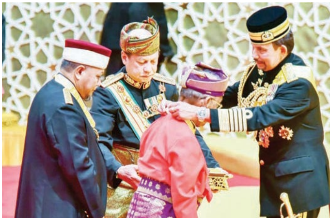
His Majesty then conferring The Most Honourable Order of Seri Paduka Mahkota Brunei Second Class (D.P.M.B.) which carries the title Dato Paduka to 2 recipients.