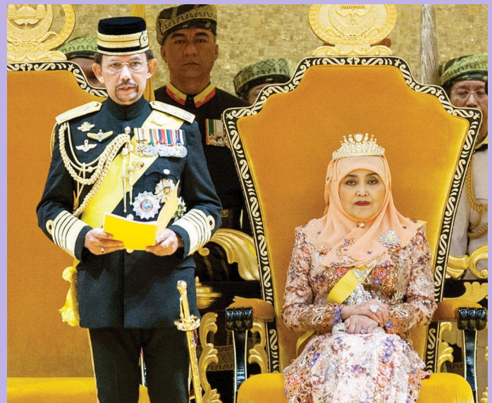
His Majesty Sultan Haji Hassanal Bolkiah Mu'izzaddin Waddaulah ibni Al-Marhum Sultan Haji Omar 'Ali Saifuddien Sa'adul Khairi Waddien, Sultan and Yang Di-Pertuan of Brunei Darussalam delivering a titah (royal speech) during the Audience and Investiture Ceremony held in conjunction with the Monarch's 69 th Birthday Celebration at Balai Singgahsana Indera Buana of Istana Nurul Iman.

His Majesty said, while facing the current economic challenges, all parties are required to improve commitment to enhance self-determination, in which nothing is more important than maintaining for the long term durability. His Majesty further said, the economic diversification measure must be continued as well, without neglecting the existing resources, and that is what we called as upgrade process, where all parties need to get involved.