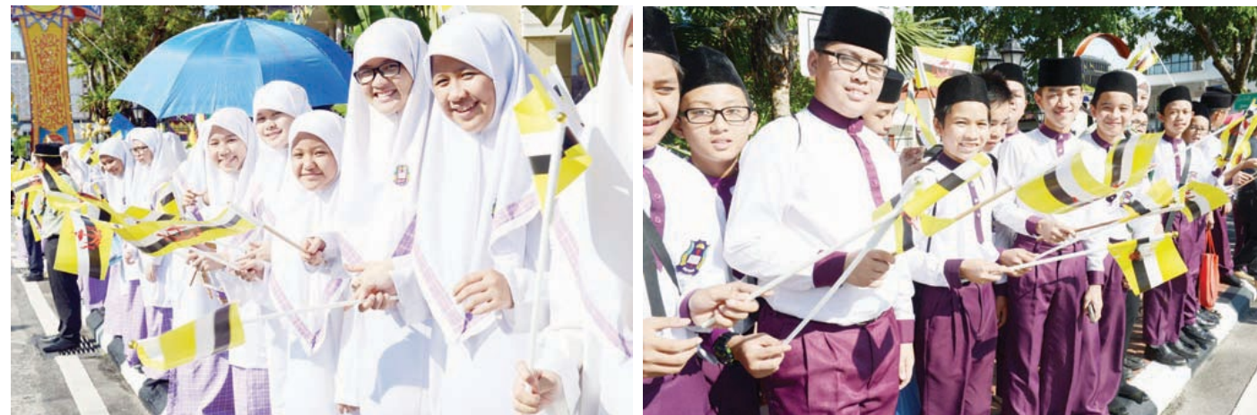
Thousands of students lined up waving miniature national flags to welcome His Majesty's arrival.

Three chants of 'Daulat Kebawah Duli Tuan Patik' was presented by all the teams participating is the highlight of the ceremony followed by a fly past of Brunei Air Force's aircrafts consisting of six helicopters, CN235 aircraft fleet over the Taman. This ceremony also marks the beginning of His Majesty's 69 th Birthday Celebration followed by a variety of entertainment events that has been set up in all four districts with the Get-Together and Junjung Ziarah Ceremony (meet and greet) for every district as the highlight of the celebration.