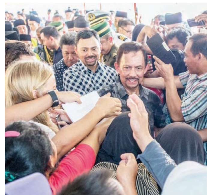
His Majesty and members of the royal family during the junjung ziarah (meet and greet) with the public.