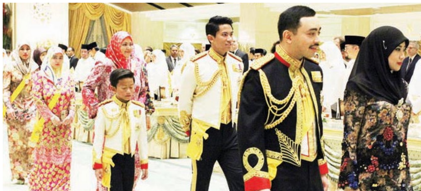
The arrival of His Royal Prince 'Abdul Malik and Yang Amat Mulia Pengiran Anak Isteri Pengiran Raabi'atul 'Adawiyah binti Pengiran Haji Bolkiah; His Royal Highness Prince 'Abdul Mateen; His Royal Highness Prince 'Abdul Wakeel; Her Royal Highness Princess Hajah Rashidah Sa'adatulk Bolkiah; Her Royal Highness Princess Hajah Hafizah Sururul Bolkiah; and Her Royal Highness Princess 'Azemah Ni'matul Bolkiah.

His Majesty and Her Majesty also consented to receive a junjung ziarah (meet and greet) from His Majesty's special guests. The banquet was further enlivened with a fireworks display at the compound of Istana Nurul Iman.