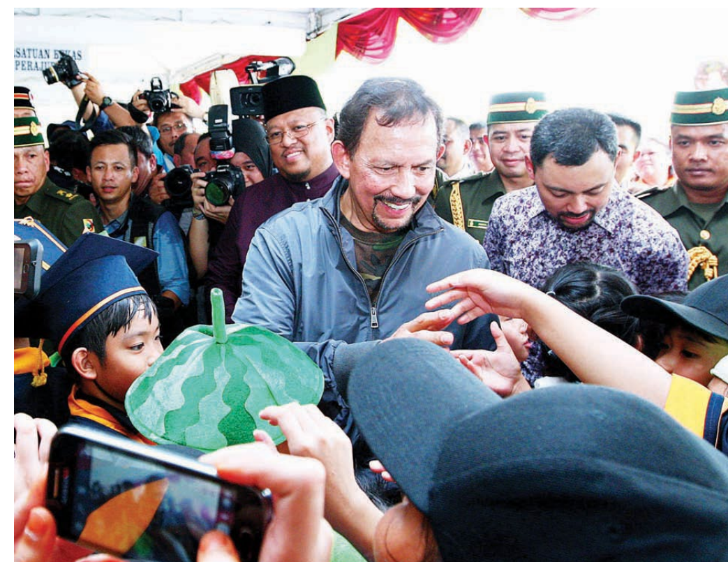
His Majesty Sultan Haji Hassanal Bolkiah Mu'izzaddin Waddaulah ibni Al-Marhum Sultan Haji Omar 'Ali Saifuddien Sa'adul Khairi Waddien, Sultan and Yang Di-Pertuan of Brunei Darussalam accompanied by His Royal Highness Prince Haji Al-Muhtadee Billah greeting people at the get-together ceremony.