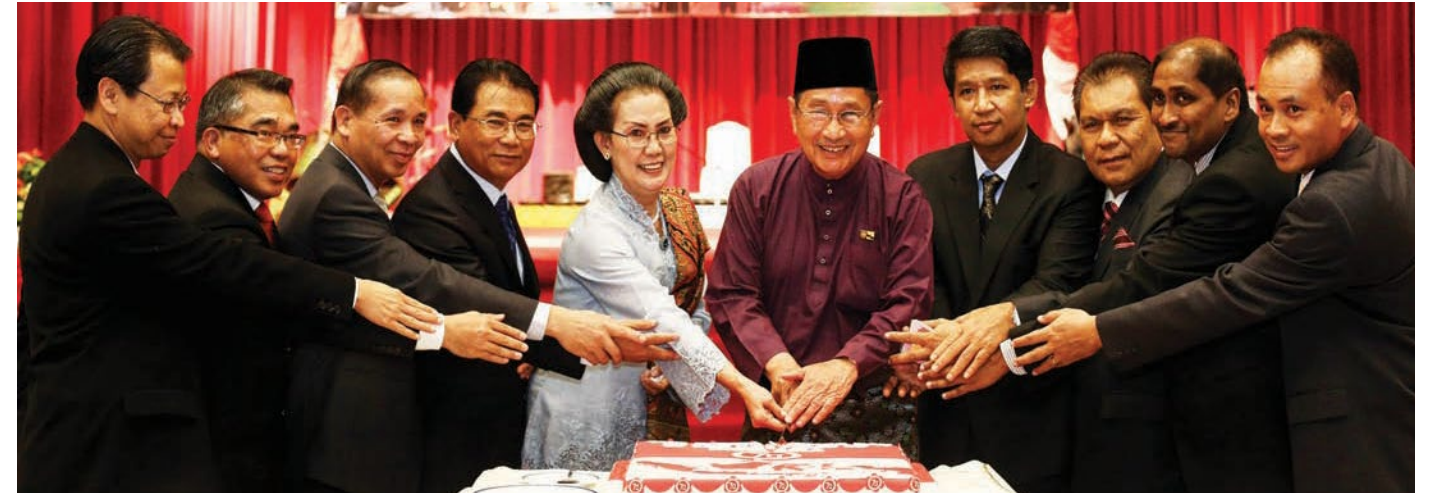
Minister of Home Affairs, Yang Berhormat Pehin Udana Khatib Dato Paduka Seri Setia Ustaz Haji Awang Badaruddin bin Pengarah Dato Paduka Haji Othman as representative of His Majesty's Government at the Reception Ceremony in conjunction with Republic of Indonesia's 70 th National Day.

BANDAR SERI BEGAWAN, August 24 – In conjunction with the Republic of Indonesia's 70 th National Day, Embassy of the Republic of Indonesia held a Reception Ceremony at the Rizqun International Hotel, Gadong.