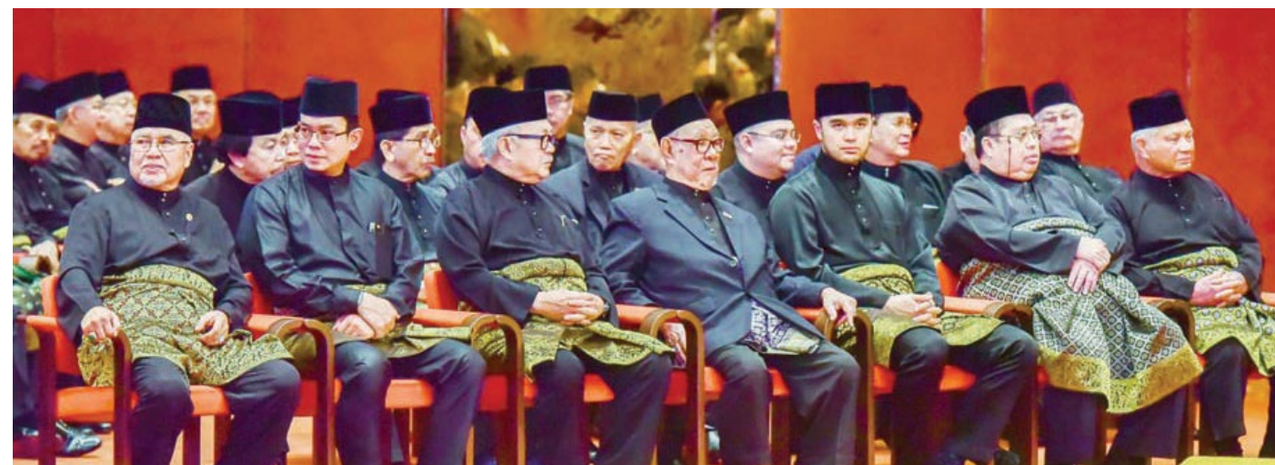
Among the Pengiran-Pengiran Cheterias, Cabinet Ministers, Pengiran-Pengiran Peranakan, members of Legislative Council, Deputy Ministers and Manteri-Manteri Pedalaman present during the ceremony.