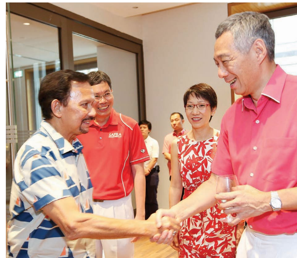
His Majesty Sultan and Yang Di-Pertuan of Brunei Darussalam was welcomed by His Excellency Lee Hsien Loong, the Prime Minister of the Republic of Singapore.

relations since 1984, while the spirit of friendship between both countries has long since been established before diplomatic relations are realised officially.