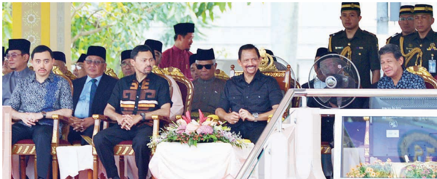
His Majesty Sultan Haji Hassanal Bolkiah Mu'izzaddin Waddaulah ibni Al-Marhum Sultan Haji Omar 'Ali Saifuddien Sa'adul Khairi Waddien, Sultan and Yang Di-Pertuan of Brunei Darussalam, His Royal Highness Prince Haji Al-Muhtadee Billah, the Crown Prince and Senior Minister at the Prime Minister's Office, His Royal Highness Prince Haji Jefri Bolkiah and His Royal Highness Prince 'Abdul Malik during the Get-Together Ceremony in Brunei-Muara District.

BANDAR SERI BEGAWAN, August 23 - Thousands of Brunei-Muara residents gathered at the Taman Haji Sir Muda Omar 'Ali Saifuddien to meet up close His Majesty Sultan Haji Hassanal Bolkiah Mu'izzaddin Waddaulah ibni Al-Marhum Sultan Haji Omar 'Ali Saifuddien Sa'adul Khairi Waddien, Sultan and Yang Di-Pertuan of Brunei Darussalam. Brunei-Muara District is the last district for the Get-Together and Junjung Ziarah Ceremony this year.