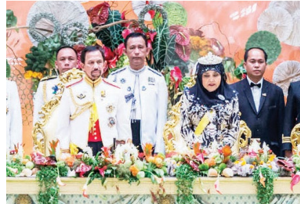
9. Royal Banquet