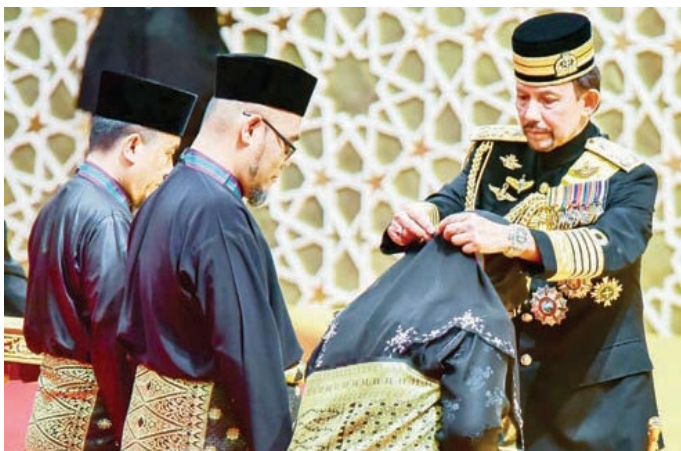
His Majesty conferring the Most Eminent Order of Islam Brunei (S.S.U.B.) to 3 recipients.