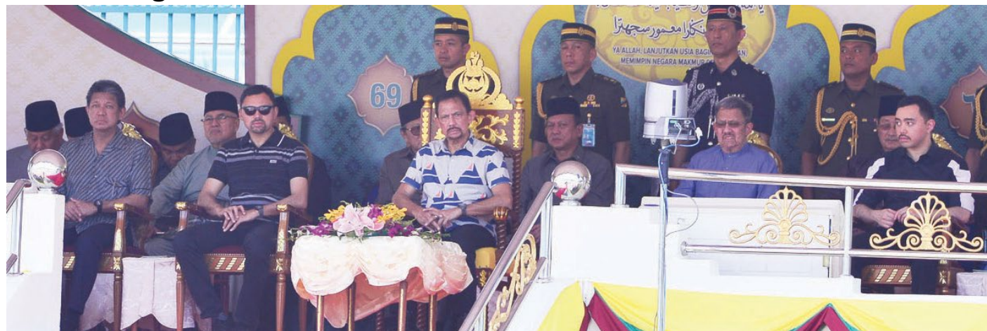
His Majesty Sultan Haji Hassanal Bolkiah Mu'izzaddin Waddaulah ibni Al-Marhum Sultan Haji Omar 'Ali Saifuddien Sa'adul Khairi Waddien, Sultan and Yang Di-Pertuan of Brunei Darussalam; His Royal Highness Prince Haji Al-Muhtadee Billah, the Crown Prince and Senior Minister at the Prime Minister's Office, His Royal Highness Prince Haji Sufri Bolkiah, His Royal Highness Prince Haji Jefri Bolkiah and His Royal Highness Prince 'Abdul Malik and during the Get-Together and Junjung Ziarah Ceremony in Temburong District.

TEMBURONG, August 20 - Temburong District was the second district to host the Get-Together and Junjung Ziarah Ceremony this year in conjunction with His Majesty's 69 th Birthday celebration, which took place at the Civic Centre Complex Padang in Bangar Town. His Majesty Sultan Haji Hassanal Bolkiah Mu'izzaddin Waddaulah ibni Al-Marhum Sultan Haji Omar 'Ali Saifuddien Sa'adul Khairi Waddien, Sultan and Yang Di-Pertuan of Brunei Darussalam was accompanied by His Royal Highness Prince Haji Al-Muhtadee Billah, the Crown Prince and Senior Minister at the Prime Minister's Office, His Royal Highness Prince Haji Sufri Bolkiah; His Royal Highness Prince Haji Jefri Bolkiah and His Royal Highness Prince 'Abdul Malik.