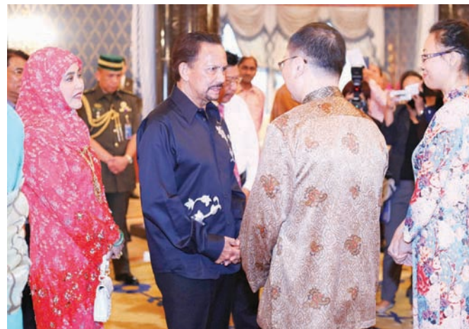
Their Majesties mingling with the Chiefs of Diplomatic Representatives and their spouses.