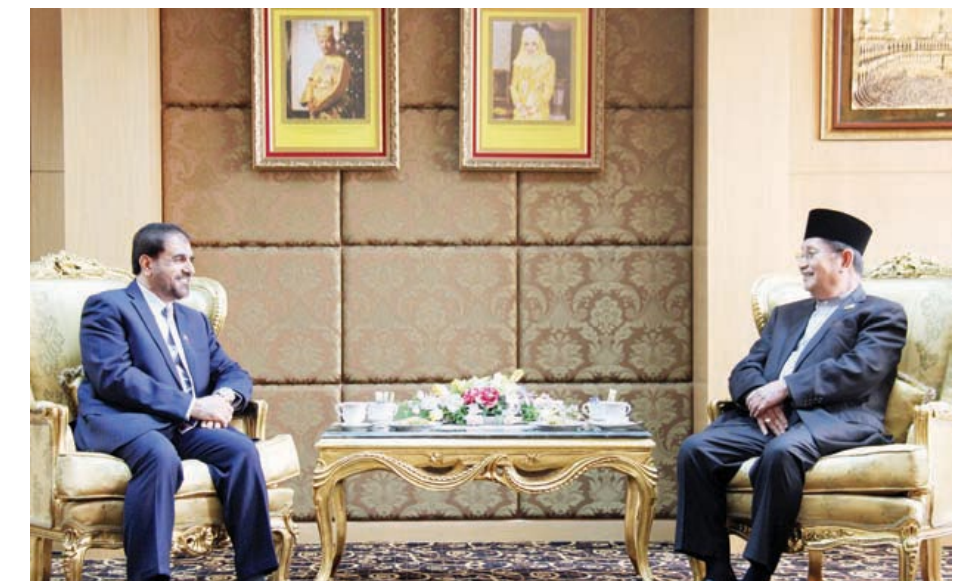
Minister of Home Affairs, Yang Berhormat Pehin Udana Khatib Dato Paduka Seri Setia Ustaz Haji Awang Badaruddin bin Pengarah Dato Paduka Haji Othman Saleh bin Ayel Al Amri, Adviser to the Minister for Workforce Care

The official visit, which began with an introductory exchange at the Department of Labour, Jalan Majlis Mesyuarat Negara was aimed at sharing and discussing good practices and experiences with regards to labour and employment laws. The delegation was briefed by the Department of Labour on the implementation of the Employment Order 2009, as well as the current foreign worker recruitment and protection practices in Brunei Darussalam.