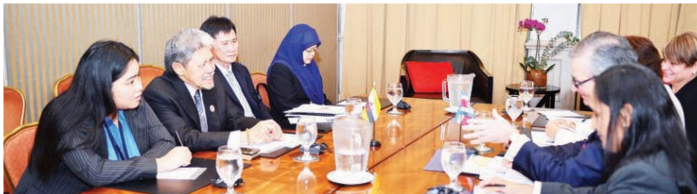
His Royal Highness in a bilateral meeting with His Excellency Manuel A. Gonzalez Sanz, Minister of Foreign Affairs of the Republic Costa Rica.

SAN JOSE, COSTA RICA, August 20 - His Royal Highness Prince Mohamed Bolkiah ibni Al-Marhum Sultan Haji Omar 'Ali Saifuddien Sa'adul Khairi Waddien, Minister of Foreign Affairs and Trade consented to pay a courtesy visit to His Excellency Luis Guillermo Solis Rivera, the President of the Republic of Costa Rica. Earlier, His Royal Highness held a bilateral meeting with His Excellency Manuel A. Gonzalez Sanz, Minister of Foreign Affairs of the Republic Costa Rica. At the meeting, His Royal Highness and His Excellency discussed bilateral matters and ways to enhance bilateral relations and cooperation. Brunei Darussalam and Costa Rica has established diplomatic relations