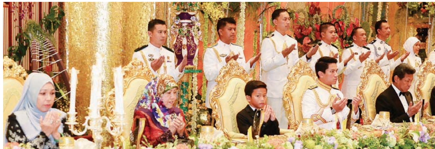
His Royal Highness Prince Haji Jefri Bolkiah, His Royal Highness Prince 'Abdul Mateen, His Royal Highness Prince 'Abdul Wakeel, Her Royal Highness Princess Hajah Masna and Her Royal Highness Princess Hajah Amal Umi Kalthum Al-Islam during the Royal Banquet for uniformed officers.