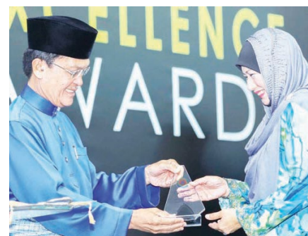
24. Five ITB Staffs receive Excellent Awards