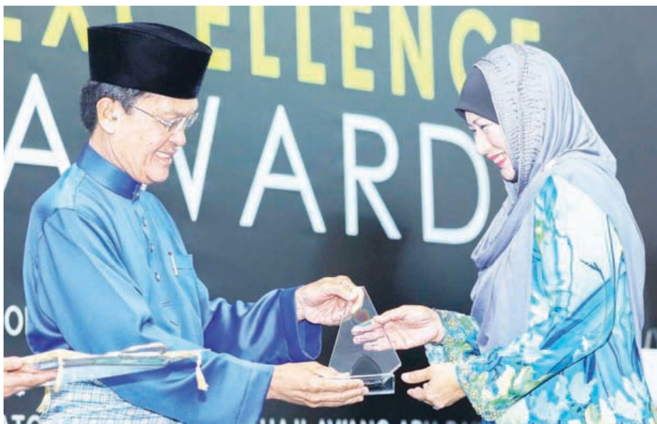
Minister of Education, Yang Berhormat Pehin Orang Kaya Seri Kerna Dato Seri Setia (Dr.) Haji Awang Abu Bakar bin Haji Apong giving the award to one of ITB's academic staff.

Presenting the awards to recipients was the Guest of Honour, Yang Berhormat Pehin Orang Kaya Seri Kerna Dato Seri Setia (Dr.) Haji Awang Abu Bakar bin Haji Apong