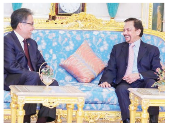
The Honorable Manuel 'Mar' Araneta Roxas II, Local and Internal Government Secretary of the Republic of Philippines on August 15.