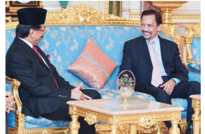
Yang Amat Berhormat Dato Seri Paduka Datuk Seri Panglima Musa bin Haji Aman, the Chief Minister of Sabah on August 15.