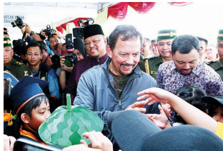
13. Get-Together and Junjung Ziarah Ceremony