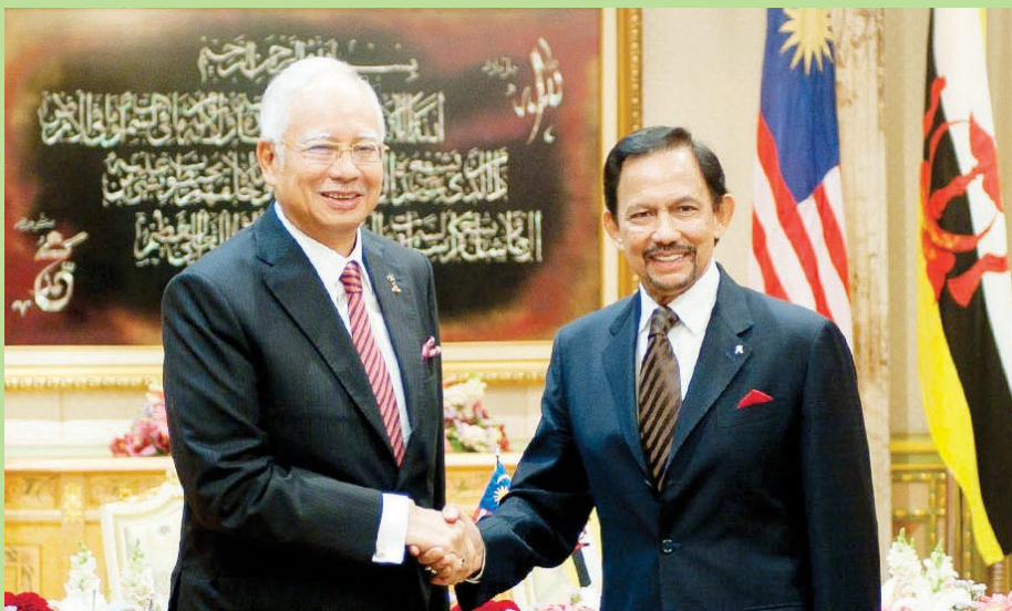
His Majesty Sultan Haji Hassanal Bolkiah Mu'izzaddin Waddaulah ibni Al-Marhum Sultan Haji Omar 'Ali Saifuddien Sa'adul Khairi Waddien, Sultan and Yang Di-Pertuan of Brunei Darussalam with Yang Amat Berhormat Dato' Laila Utama Dato' Sri Mohd. Najib bin Tun Haji Abdul Razak, Prime Minister of Malaysia, after the signing of 'Bilateral Agreement for Mutual Fibre Optic Exchange and Grant of IRU' between DST Communications Sdn. Bhd. and SACOFA Sdn. Bhd. in conjunction with the 19th Annual Consultation between the leaders of both countries.

BANDAR SERI BEGAWAN, August 11 - His Majesty Sultan Haji Hassanal Bolkiah Mu'izzaddin Waddaulah ibni Al-Marhum Sultan Haji Omar 'Ali Saifuddien Sa'adul Khairi Waddien, Sultan and Yang Di-Pertuan of Brunei Darussalam agreed to hold a bilateral meeting with the Prime Minister of Malaysia, Yang Behormat Dato Laila Utama Dato 'Sri Mohd. Najib bin Tun Haji Abdul Razak. During the meeting, His Majesty the Sultan and Yang Di-Pertuan of Brunei Darussalam and Prime Minister of Malaysia has talked about bilateral issues between States Brunei Darussalam and Malaysia, as well as exchanging opinions about regional and international affairs of interest together.