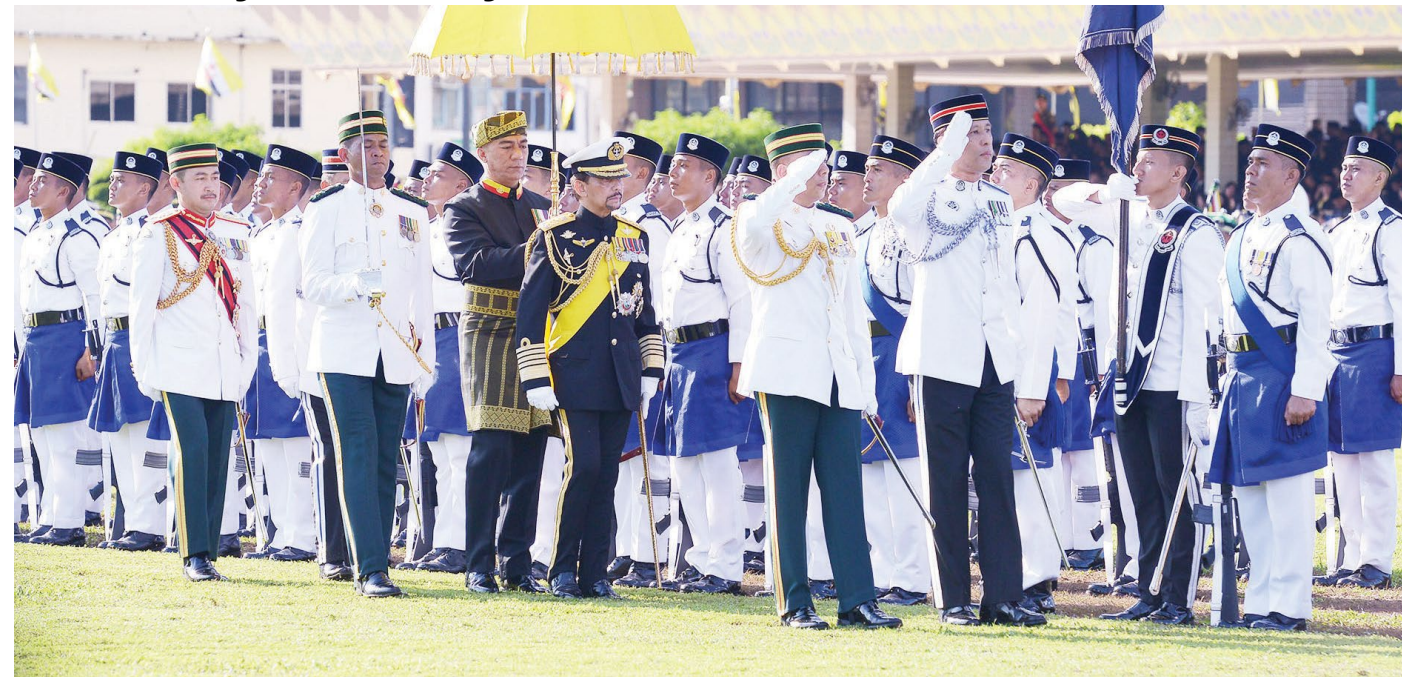
His Majesty Sultan Haji Hassanal Bolkiah Mu'izzaddin Waddaulah ibni Al-Marhum Sultan Haji Omar 'Ali Saifuddien Sa'adul Khairi Waddien, Sultan and Yang Di-Pertuan of Brunei Darussalam inspecting the Guard of Honour mounted by personnel of the Royal Brunei Police Force.

BANDAR SERI BEGAWAN, AUGUST 15 - The Grand Royal Birthday Parade in conjunction with the 69 th Birthday Celebrations of His Majesty Sultan Haji Hassanal Bolkiah Mu'izzaddin Waddaulah ibni Al-Marhum Sultan Haji Omar 'Ali Saifuddien Sa'adul Khairi Waddien, Sultan and Yang Di-Pertuan of Brunei Darussalam took place in a glorious and traditional atmosphere at Taman Haji Sir Muda Omar 'Ali Saifuddien.