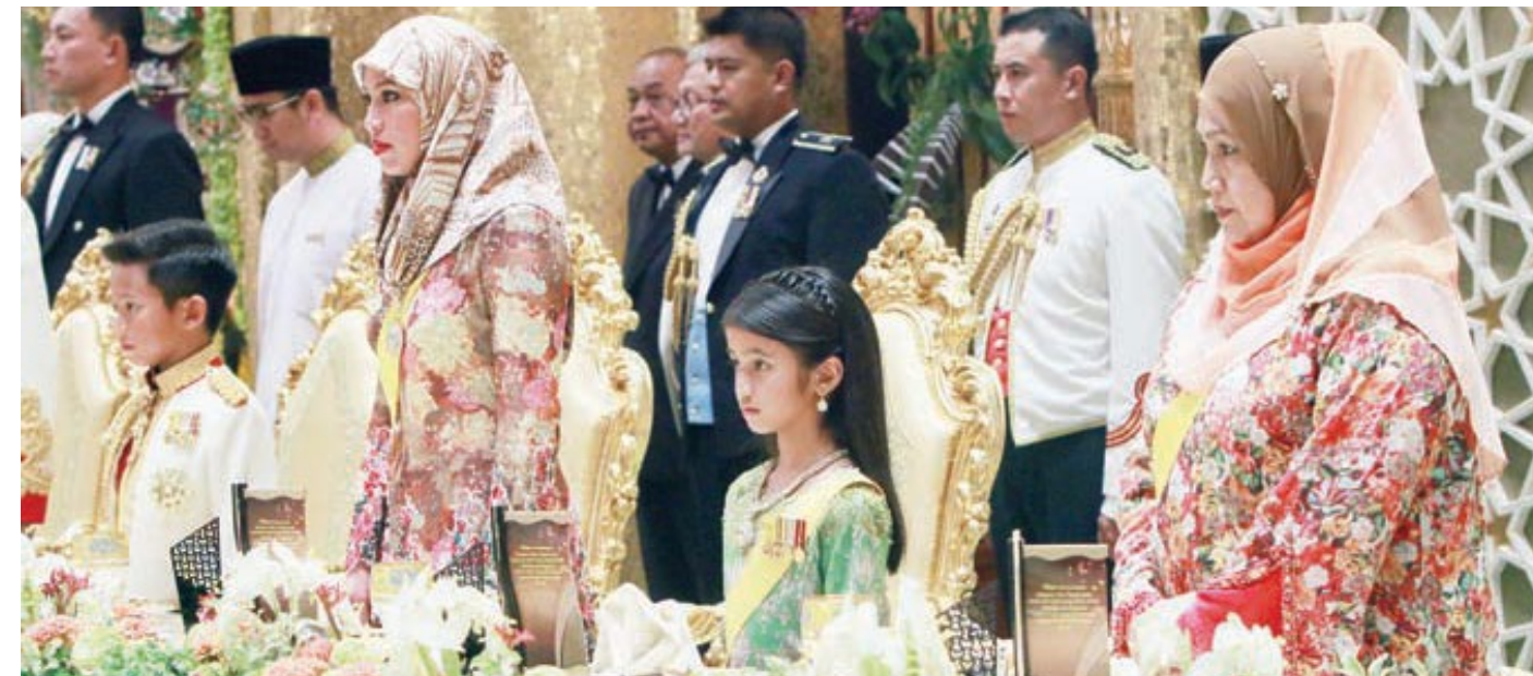
His Royal Highness Prince 'Abdul Wakeel, Her Royal Highness Princess 'Azemah Ni'matul Bolkiah, Her Royal Highness Princess Ameerah Wardatul Bolkiah and Her Royal Highness Princess Hajah Nor'ain.