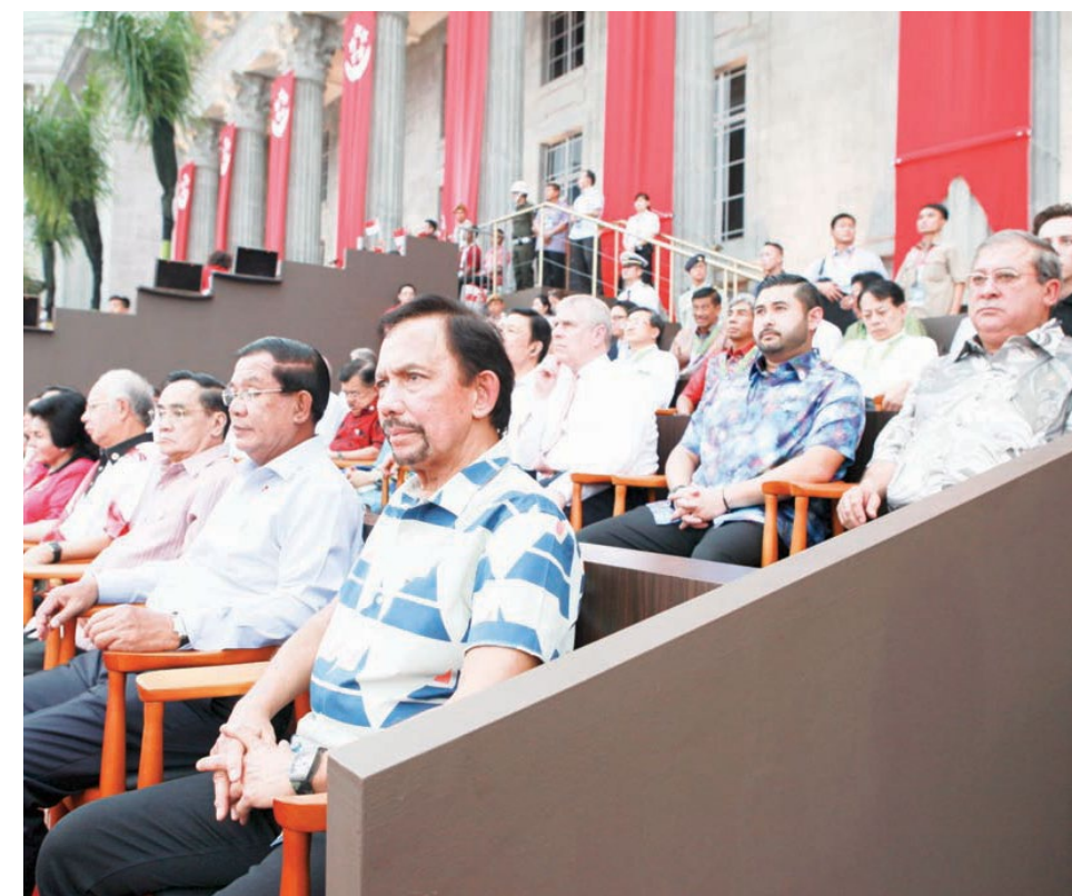
His Majesty Sultan Haji Hassanal Bolkiah Mu'izzaddin Waddaulah ibni Al-Marhum Sultan Haji Omar 'Ali Saifuddien Sa'adul Khairi Waddien, Sultan and Yang Di-Pertuan of Brunei Darussalam together with the Heads of State and Government as well other special guests consent to attend the NDP 2015.

Brunei Darussalam and Republic of Singapore has established diplomatic