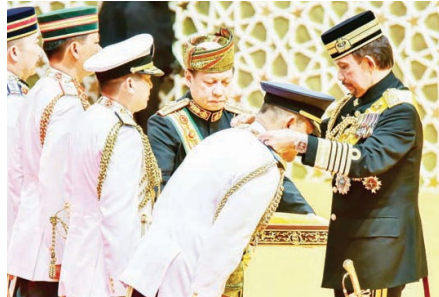
8. Audience and Investiture Ceremony