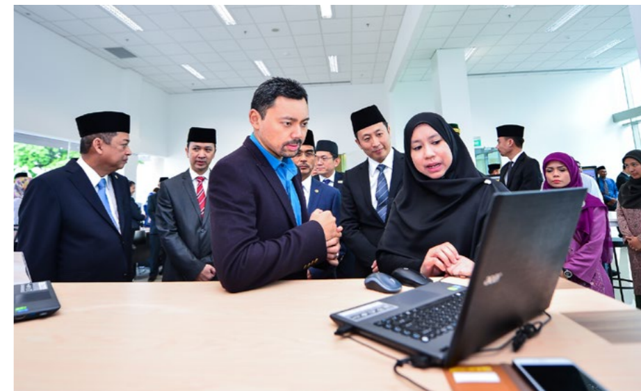
His Royal Highness Prince Haji Al-Muhtadee Billah being briefed on the available services at the Business Support Centre.

Five of the most common issues frequently shared include access to financing, confusion on business licenses and business registration, land applications, late payments and the Labour Control System.