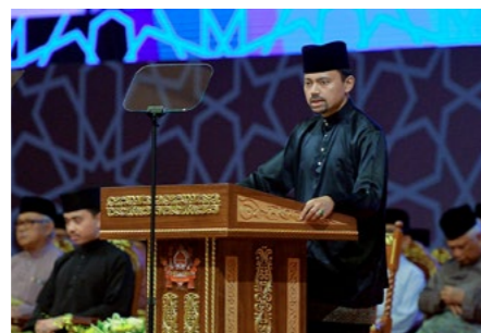
11. Double efforts in Tilawah Al-Quran Youth Scheme