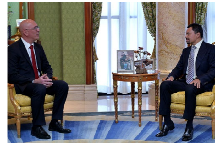
His Excellency Alexey Vedeve, Deputy Minister of Economic Development, Russian Federation on April 19.