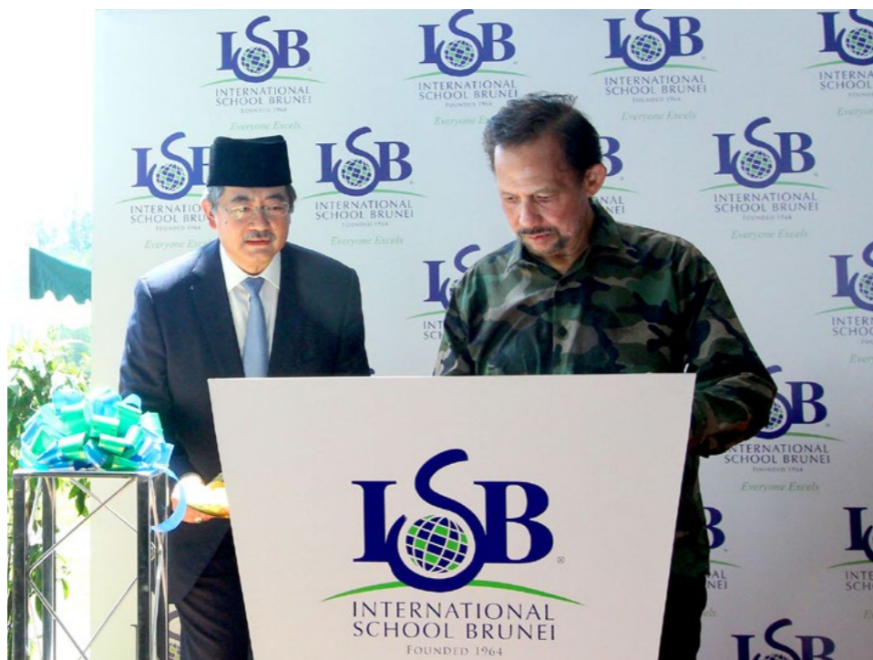
His Majesty Sultan Haji Hassanal Bolkiah Mu'izzaddin Waddaulah ibni Al-Marhum Sultan Haji Omar 'Ali Saifuddien Sa'adul Khairi Waddien, Sultan and Yang Di-Pertuan of Brunei Darussalam officiating the new International School Brunei (ISB) building at Jalan Utama Salambigar, Kampung Sungai Hanching, Mukim Berakas 'B'.

The event commenced with the singing of the national anthem followed by a welcoming speech by