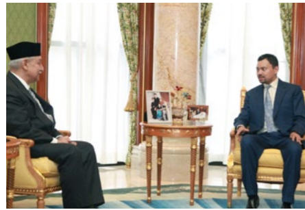
5. His Royal Highness receives audiences