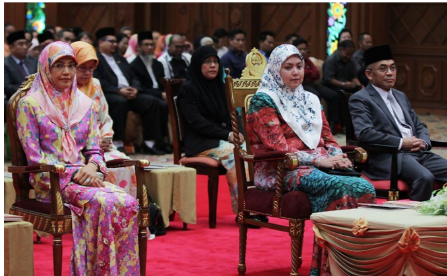
Her Royal Highness Princess Hajah Rashidah Sa'adatol Bolkiah binti His Majesty Sultan Haji Hassanal Bolkiah Mu'izzaddin Waddaulah and Her Royal Highness Princess Hajah Majeedah Nuurul Bolkiah binti His Majesty Sultan Haji Hassanal Bolkiah Mu'izzaddin Waddaulah at the Awarding Ceremony of the 18 th Princess Rashidah Young Nature Scientist Award (PRYNOSA) 2016.

BANDAR SERI BEGAWAN, April 7 - Her Royal Highness Princess Hajah Rashidah Sa'adatol Bolkiah binti His Majesty Sultan Haji Hassanal Bolkiah Mu'izzaddin Waddaulah consented to grace the Awarding Ceremony of the 18 th Princess Rashidah Young Nature Scientist Award (PRYNOSA) 2016.