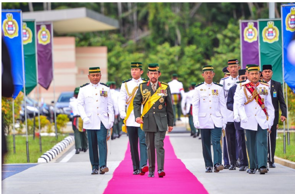
His Majesty Sultan Haji Hassanal Bolkiah Mu'izzaddin Waddaulah ibni Al-Marhum Sultan Haji Omar 'Ali Saifuddien Sa'adul Khairi Waddien, Sultan and Yang Di-Pertuan of Brunei Darussalam, Minister of Defence and Supreme Commander of the Royal Brunei Armed Forces (RBAF) during the Sovereign's Parade of the 14 th Intake of Officer Cadets School (OCS), held at the parade square of the new Defence Academy RBAF in Kampung Tanah Jambu.

Also present was His Royal Highness Lieutenant Prince 'Abdul Mateen ibni His Majesty Sultan Haji Hassanal Bolkiah Mu'izzaddin Waddaulah.