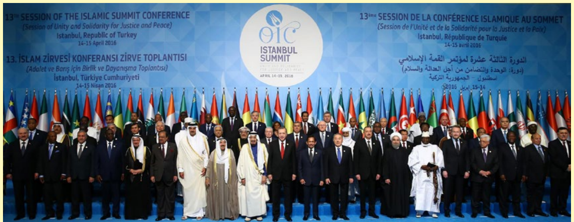
His Majesty Sultan Haji Hassanal Bolkiah Mu'izzaddin Waddaulah ibni Al-Marhum Sultan Haji Omar 'Ali Saifuddien Sa'adul Khairi Waddien, Sultan and Yang Di-Pertuan of Brunei Darussalam in a group photo at the Opening of the 13 th Session of the OIC Summit with fellow monarchs, head of state and government of the OIC members and non-member states.

ISTANBUL, REPUBLIC OF TURKEY, April 14 - His Majesty Sultan Haji Hassanal Bolkiah Mu'izzaddin Waddaulah ibni Al-Marhum Sultan Haji Omar 'Ali Saifuddien Sa'adul Khairi Waddien, Sultan and Yang Di-Pertuan of Brunei Darussalam consented to attend the Opening of the 13 th Session of the Organisation of Islamic Cooperation (OIC) Summit at the Istanbul Congress Centre, Republic of Turkey.