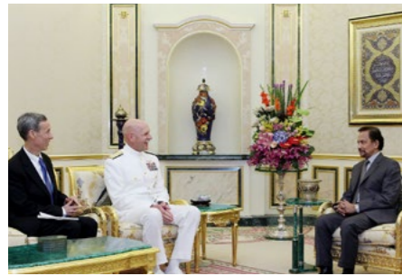
3. His Majesty receives audiences