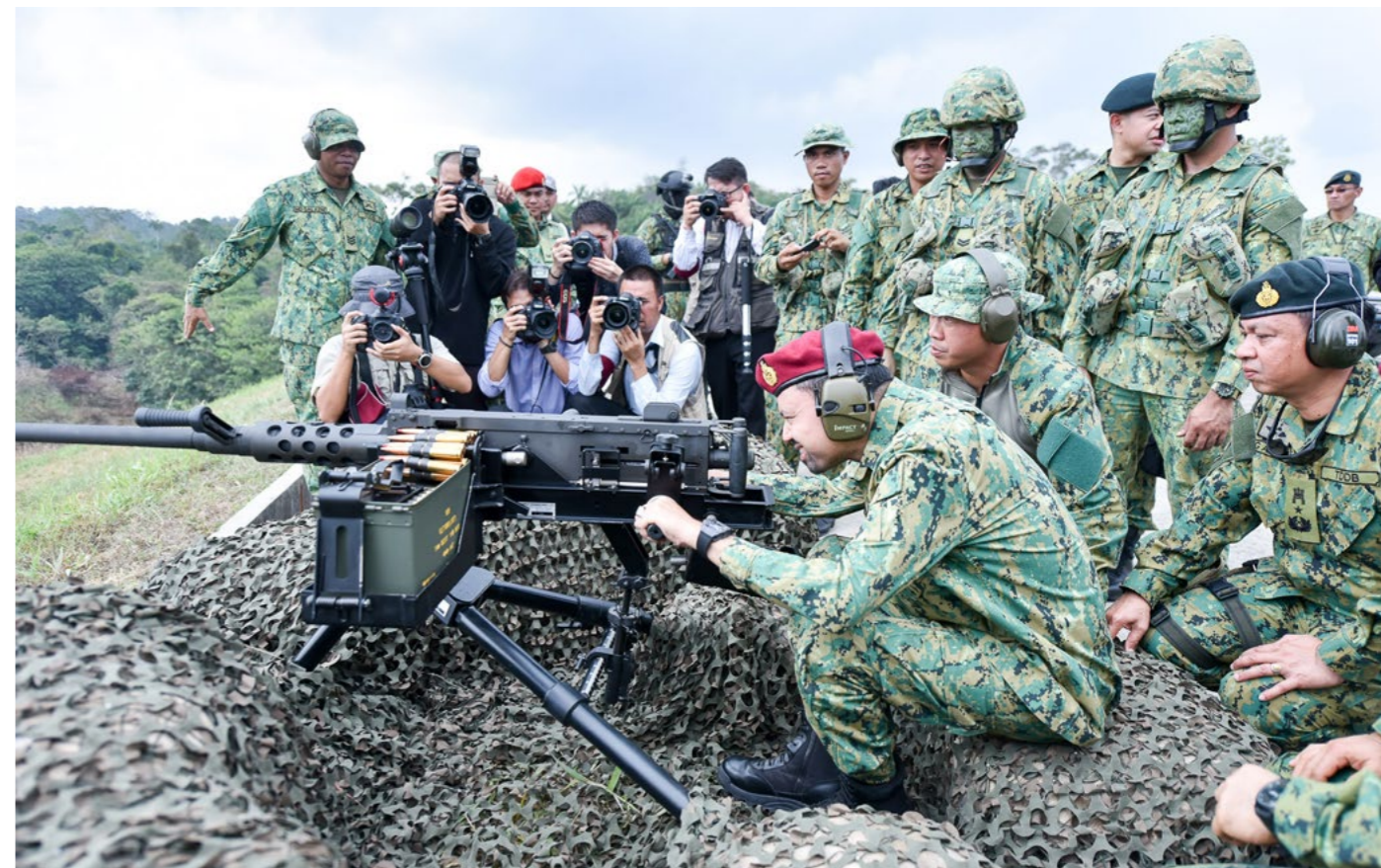
His Royal Highness Prince General Haji Al-Muhtadee Billah trying one of the weapons at the Field Firing Area, Penanjong Garisson, Binturan.

The event was followed with a welcoming speech by the Minister of Religious Affairs. The theme for the Finals of the National Musabaqah Al-Quran for Adults 1437 Hijrah/2016 Masihi was 'Al-Quran as a Cure and Remedy for the Spiritual and Physical'.