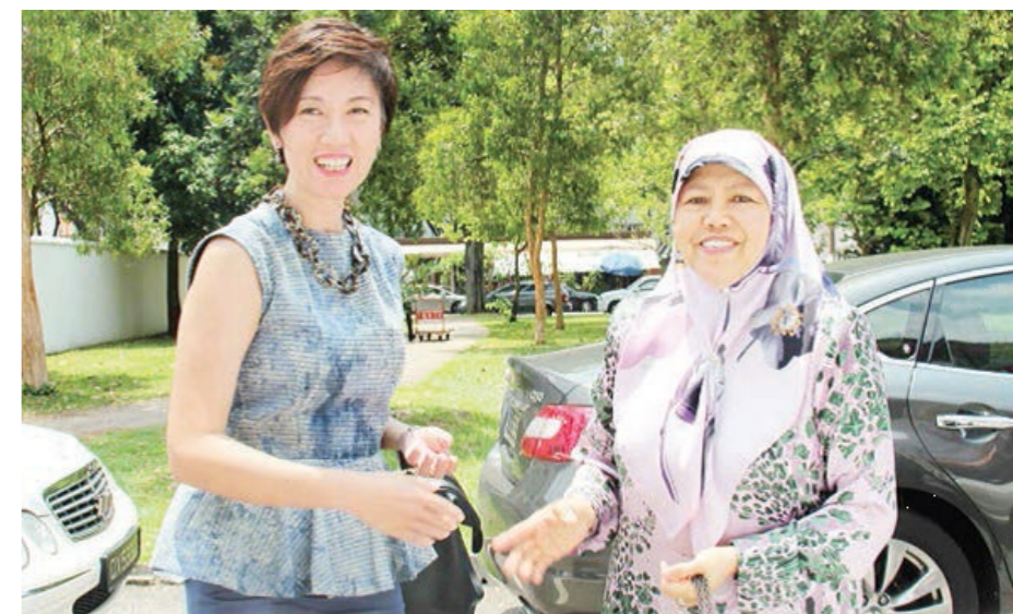
Her Royal Highness Princess Hajah Masna binti Al-Marhum Sultan Haji Omar 'Ali Saifuddien Sa'adul Khairi Waddien, Ambassador-at-Large at the Ministry of Foreign Affairs and Trade with Her Excellency Josephine Teo, Senior Minister of State, Prime Minister's Office, Ministry of Foreign Affairs and Ministry of Transport of Republic of Singapore.

At the gallery, Her Royal Highness was welcomed and invited for an Afternoon Tea hosted by Her Excellency Grace Fu, Minister for Community, Culture and Youth.