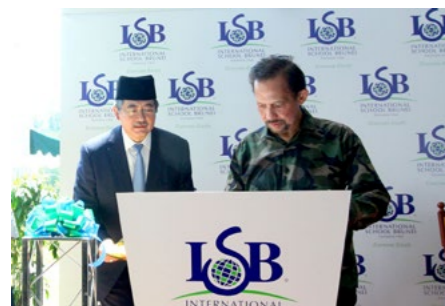
10. Official Opening of new ISB building