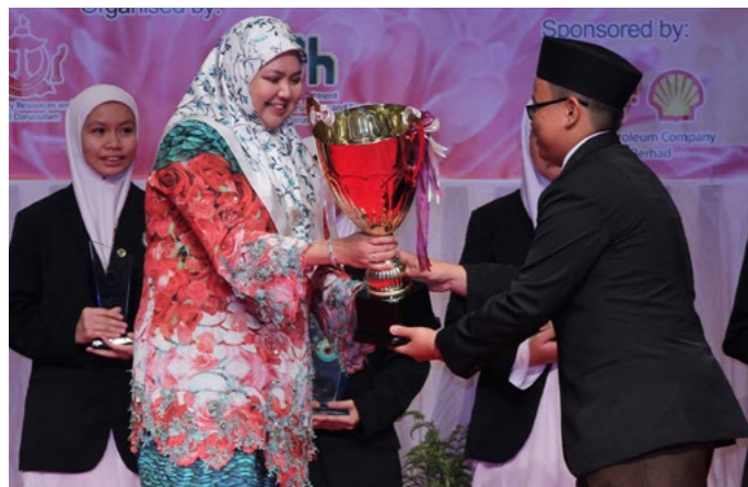
Her Royal Highness Princess Hajah Rashidah Sa'adatol Bolkiah binti His Majesty Sultan Haji Hassanal Bolkiah Mu'izzaddin Waddaulah presenting a trophy to the winner of the 18 th Princess Rashidah Young Nature Scientist Award (PRYNOSA) from Tanjong Maya Secondary School, Tutong.

Prior to leaving the event, Her Royal Highness also toured the mini exhibition of the projects that was presented by the schools involved in the PRYNOSA.