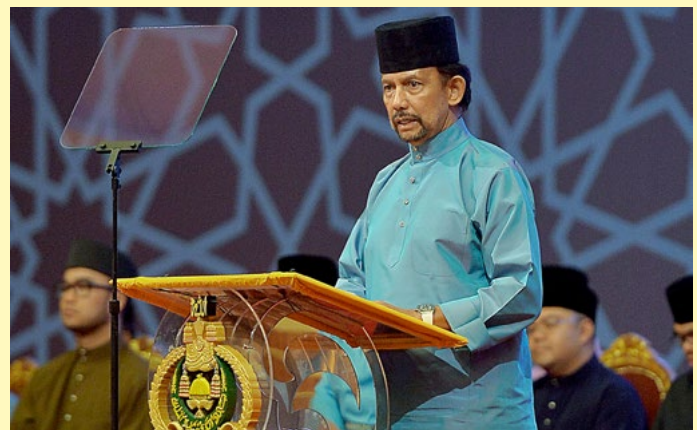
His Majesty Sultan Haji Hassanal Bolkiah Mu'izzaddin Waddaulah ibni Al-Marhum Sultan Haji Omar 'Ali Saifuddien Sa'adul Khairi Waddien, Sultan and Yang Di-Pertuan of Brunei Darussalam delivering a titah (royal speech) at the Finals of the National Musabaqah Al-Quran for Adults 1437 Hijrah/2016 Masihi, held at the International Convention Centre.