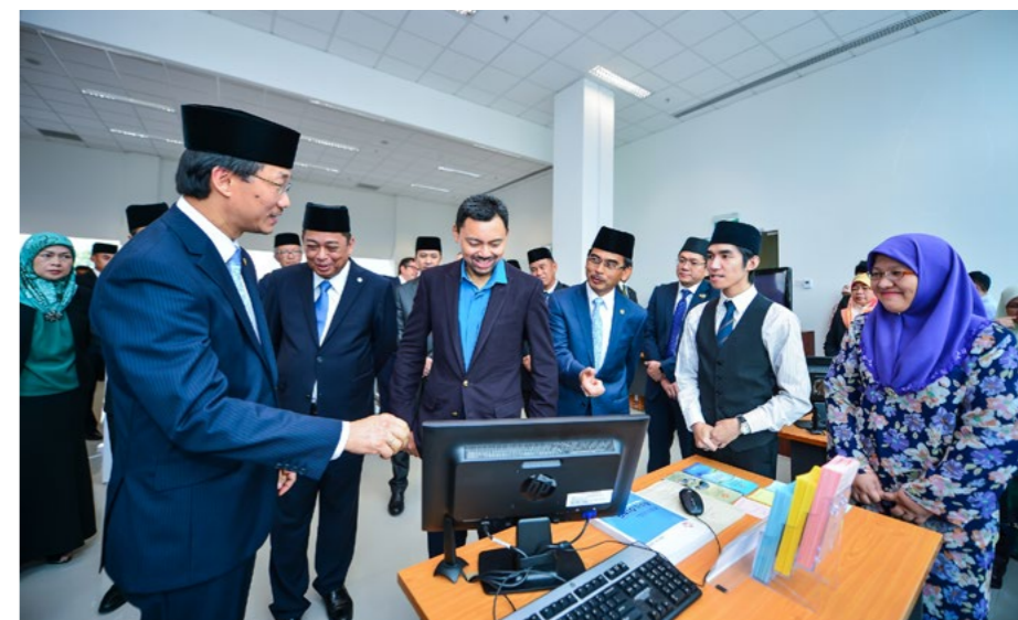
His Royal Highness Prince Haji Al-Muhtadee Billah being briefed on the available services and facilities provided by Darussalam Enterprise (DARe) to help the entrepreneurs.