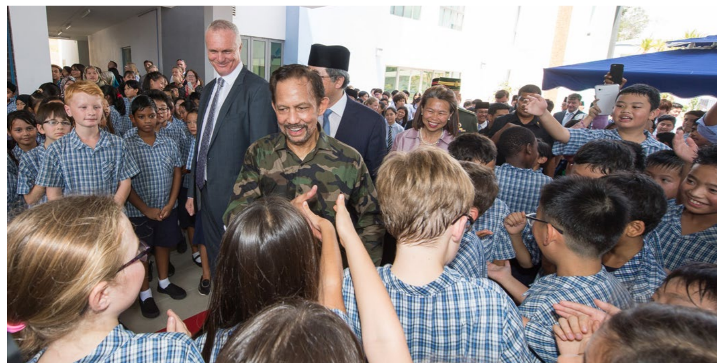
His Majesty receiving a meet-and-greet from the students of International School Brunei (ISB) during the inauguration of the school's new campus.