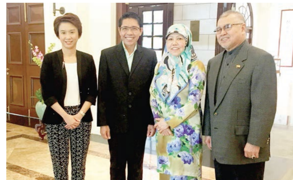
Her Royal Highness Princess Hajah Masna, Ambassador-at-Large at the Ministry of Foreign Affairs and Trade at a Luncheon hosted by His Excellency Dr. Mohammad Maliki Osman, Senior Minister of State, Ministry of Foreign Affairs and Ministry of Defence. Also present was Madam Low Yen Ling, Senior Parliamentary Secretary to Ministry of Education and Ministry of Trade and Industry.