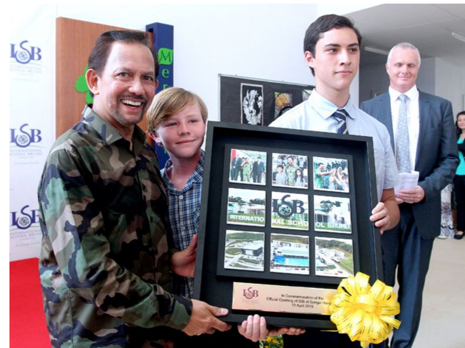
His Majesty receiving a pesambah (souvenir) from ISB students in the form of photo collection of the Monarch's visit to the campus.