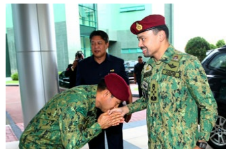
12. Hikmat Bersatu Lima Exercise