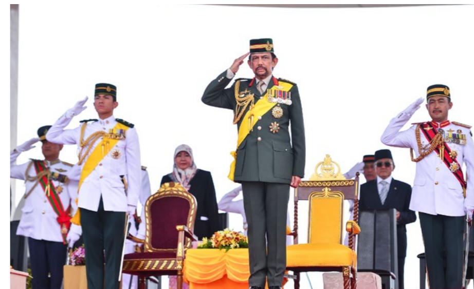
His Majesty Sultan Haji Hassanal Bolkiah Mu'izzaddin Waddaulah ibni Al-Marhum Sultan Haji Omar 'Ali Saifuddien Sa'adul Khairi Waddien, Sultan and Yang Di-Pertuan of Brunei Darussalam, Minister of Defence and Supreme Commander of the Royal Brunei Armed Forces (RBAF) and His Royal Highness Lieutenant Prince 'Abdul Mateen receiving the Royal Salute from the 14 th Intake Officer Cadet during the Sovereign's Parade of the 14 th Intake of Officer Cadets School (OCS), held at the parade square of the new Defence Academy RBAF in Kampung Tanah Jambu.