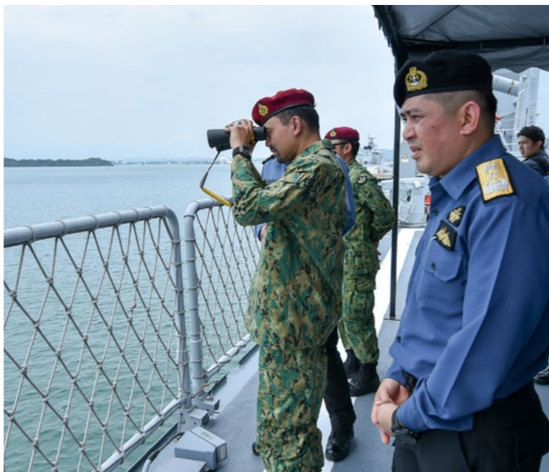
His Royal Highness witnessing the maritime operations on KDB DARULAMAN as part of the exercise at the Muara Naval Base.

Before departing to the Royal Navy Officers' Mess for a luncheon, His Royal Highness received a pesambah (souvenir) and signed a Commemorative Parchment.