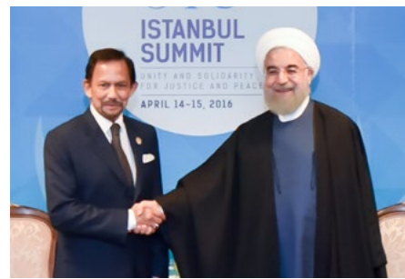
7. Bilateral meeting with the President of the Islamic Republic of Iran