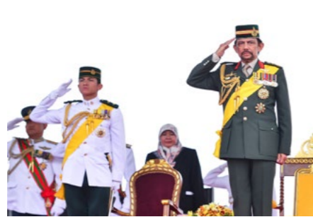
8. Sovereign's Parade of 14 th Intake OCS