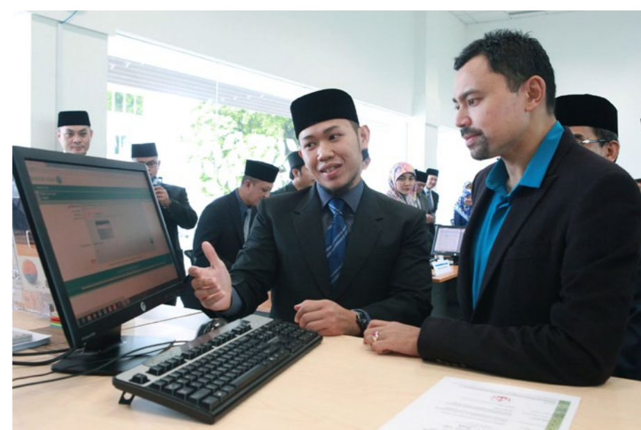
His Royal Highness Prince Haji Al-Muhtadee Billah being briefed by one of the officers at the Business Help Desk of Darussalam Enterprise (DARe).