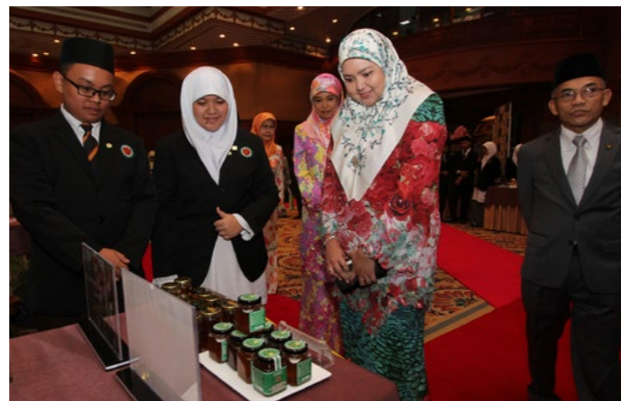
Her Royal Highness Princess Hajah Rashidah Sa'adatol Bolkiah touring the mini exhibition at the event, presented by the school involved in the 18 th PRYNOSA.