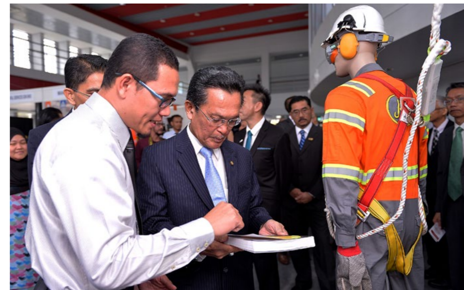
Yang Berhormat Pehin Orang Kaya Seri Kerna Dato Seri Setia (Dr.) Haji Awang Abu Bakar bin Haji Apong, Minister of Home Affairs touring the exhibition at the World Day for Safety and Health at Work 2016 event which took place at Universiti Brunei Darussalam.

Employers and employees should continuously strive to be aware of the risks and hazards when working at height, and proper training should be given to all workers especially those required to work with height.