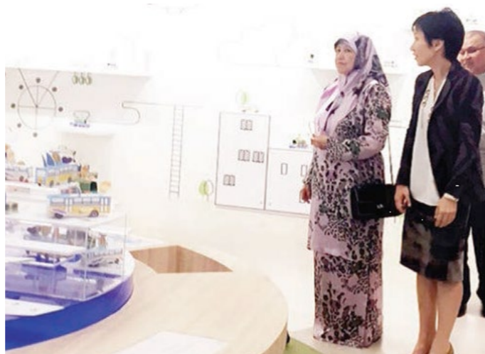
Her Royal Highness viewing the exhibition displayed at the National Gallery Singapore.

In the evening, Her Royal Highness departed from the Republic of Singapore, concluding the two-day visit.