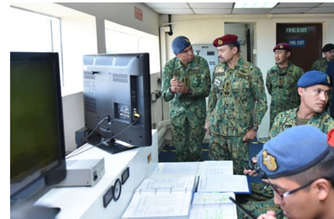
His Royal Highness being briefed by one of the RBAF members about the exercise.