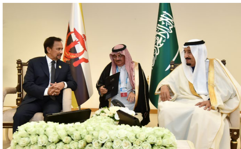
His Majesty Sultan Haji Hassanal Bolkiah Mu'izzaddin Waddaulah ibni Al-Marhum Sultan Haji Omar 'Ali Saifuddin Sa'adul Khairi Waddien, Sultan and Yang Di-Pertuan of Brunei Darussalam during the bilateral meeting with His Majesty King Salman bin Abdulaziz Al-Saud, the King of Saudi Arabia and the Custodian of the Two Holy Mosques.

ISTANBUL, REPUBLIC OF TURKEY, April 14 - His Majesty Sultan Haji Hassanal Bolkiah Mu'izzaddin Waddaulah ibni Al-Marhum Sultan Haji Omar 'Ali Saifuddin Sa'adul Khairi Waddien, Sultan and Yang Di-Pertuan of Brunei Darussalam held a bilateral meeting with His Majesty King Salman bin Abdulaziz Al-Saud, the King of Saudi Arabia and the Custodian of the Two Holy Mosques, at Hamidiye Salon, Istanbul Congress Centre, Republic of Turkey.