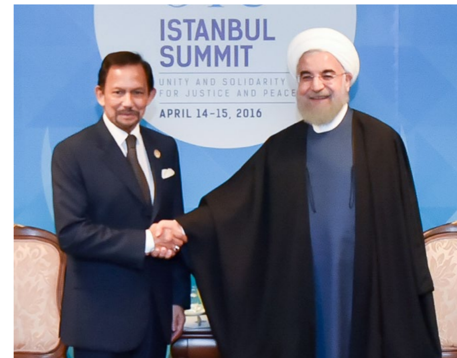
His Majesty Sultan Haji Hassanal Bolkiah Mu'izzaddin Waddaulah ibni Al-Marhum Sultan Haji Omar 'Ali Saifuddin Sa'adul Khairi Waddien, Sultan and Yang Di-Pertuan of Brunei Darussalam and His Excellency Hassan Rouhani, President of the Islamic Republic of Iran during a bilateral meeting, held at the Istanbul Congress Centre.

During the meeting, His Majesty the Sultan and Yang Di-Pertuan of Brunei