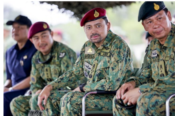
His Royal Highness witnessing the operation of the Royal Brunei Land Forces and the RBAF's Special Force Regiment.