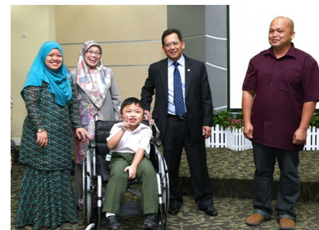
Yang Berhormat Pehin Orang Kaya Indera Pahlawan Dato Seri Setia Awang Haji Suyoi bin Haji Osman, Minister of Education during the handover donation ceremony to one of the special educational needs students.