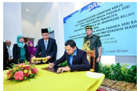
14. Working visit to the Business Support Centre (BSC)