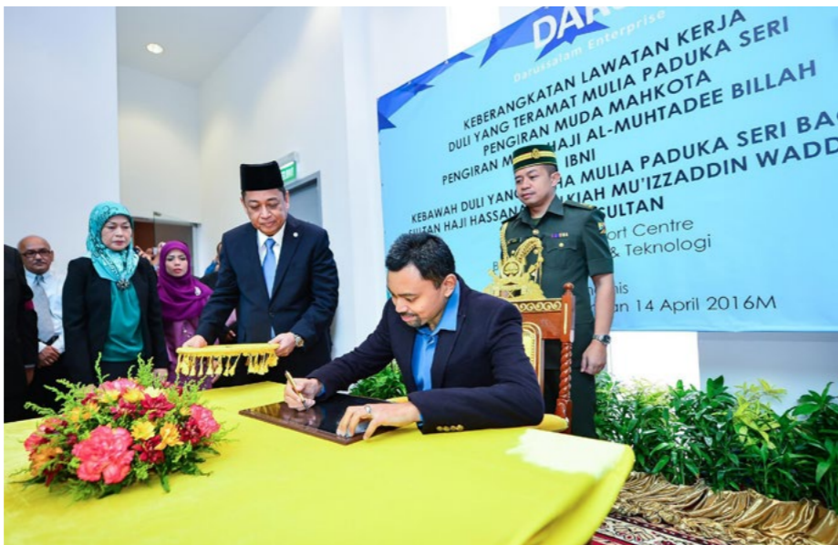
His Royal Highness Prince Haji Al-Muhtadee Billah ibni His Majesty Sultan Haji Hassanal Bolkiah Mu'izzaddin Waddaulah, Deputy Sultan signing a plaque to mark the official operation of Business Support Centre (BSC).

His Royal Highness Prince Haji Al-Muhtadee Billah ibni His Majesty Sultan Haji Hassanal Bolkiah Mu'izzaddin Waddaulah, the Deputy Sultan made a working visit to DARe located at the Design and Technology Building, Anggerek Desa Technology Park.