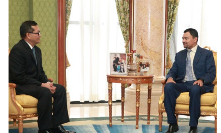
His Excellency Biravij Suwanpradhes, Ambassador Extraordinary and Plenipotentiary of the Kingdom of Thailand on April 11.