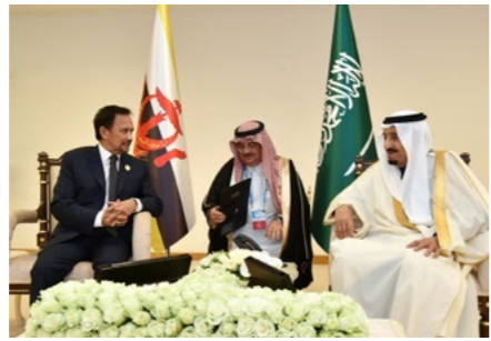
6. Brunei - Saudi Arabia holds bilateral meeting