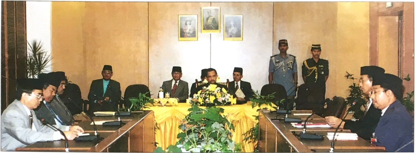
His Majesty The Sultan and Yang Di-Pertuan of Brunei Darussalam being given a detailed briefing at the start of his visit to the Ministry of Development, accompanied by a question and answer session.