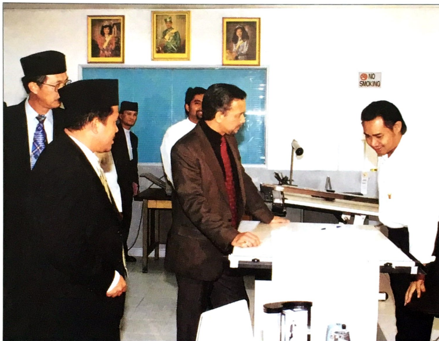
Above and below: The ruler asking more questions while he toured various sections of the Development Ministry and looked at a science and technology exhibition being held at the ministry.