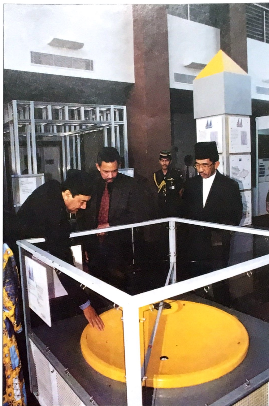
Officials responding to the ruler's enquiries as he took a close look at each section of the Development Ministry, during which he heard, among other things, aspects of constructions of housing and public facilities in the country.

• from page 10 (Sultan takes a close look at the Ministry of Development)