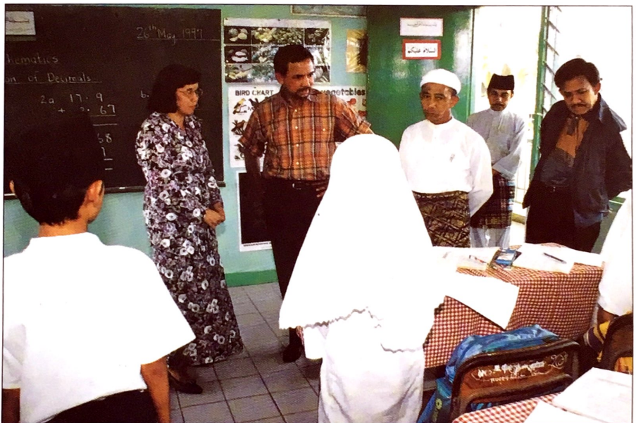
The monarch stopping to talk to some pupils of the Panaga Primary School and looking at some of their work, top, and stopping at a classroom while touring the Pengiran Anak Puteri Rashidah Sa'adatul Bolkiah Secondary School, above.

• from page 5 (Use good strategies to teach reading skills)