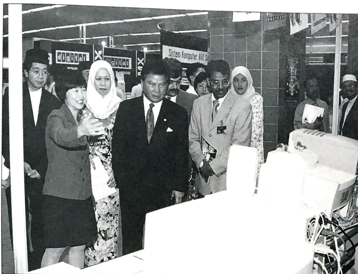
The Minister of Law and Attorney-General, Yang Amat Mulia Pengiran Laila Kanun Diraja Pengiran Haji Bahrin tours the BITEK Exhibition shortly after he announced imminent introduction of laws to protect copyrights and patents.

• from page 15 ( Intellectual Property Rights Laws enforcement to woo foreign investment )