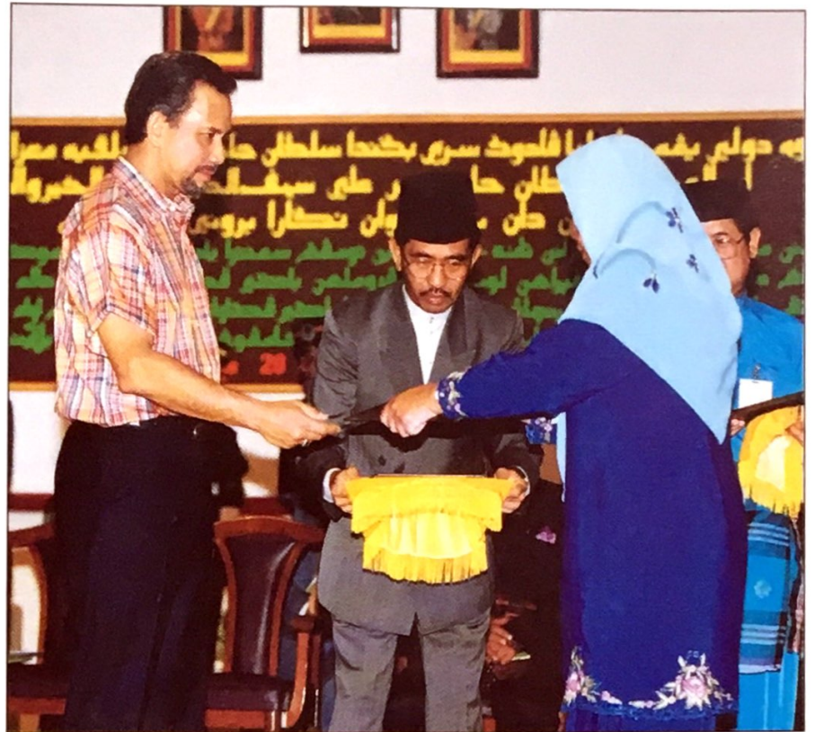
A man and a woman who made up the more than 200 recipients of house keys and land grants in Belait district seen receiving either house keys or land grants from His Majesty The Sultan and Yang Di-Pertuan of Brunei Darussalam during a ceremony held at the Pengiran Anak Puteri Rashidah Sa'adatul Bolkiah Secondary School on 26 May, above.