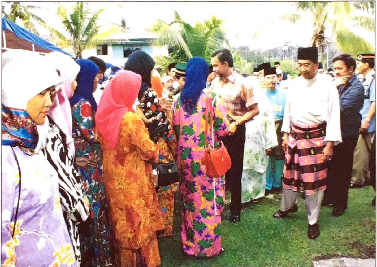
Enthusiastic villagers turned up in force to greet His Majesty during his latest visit to Belait district, during which he and His Royal Highness Prince Haji Sufri Bolkiah witnessed two Iban families embrace the Islamic faith.