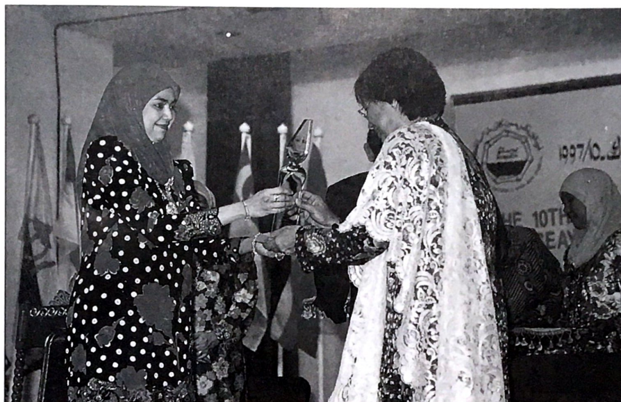
Her Royal Highness Princess Hajjah Rashidah Sa'adatul Bolkiah, seen above presenting SSEAYP International Award, spoke of the benefits of SSEAYP.

Touching on the theme of the assembly "Together We Move Forward", Her Royal Highness said that it was apt and well-chosen because as we move