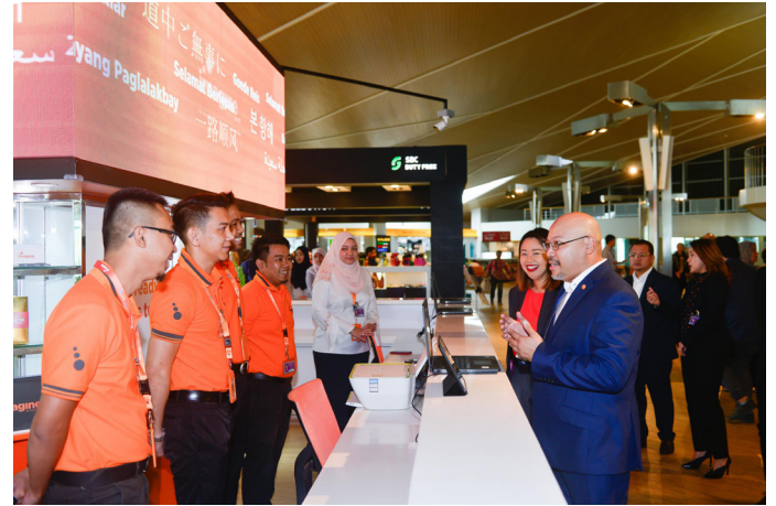
Yang Berhormat Dato Seri Setia Awang Abdul Motalib bin Pehin Orang Kaya Seri Setia Dato Paduka Haji Mohammad Yusof, Minister of Transport and Infocommunications visits a new Imagine branch at the departure halls of Brunei International Airport.

Similar to Imagine's branches, this newly-opened branch offers