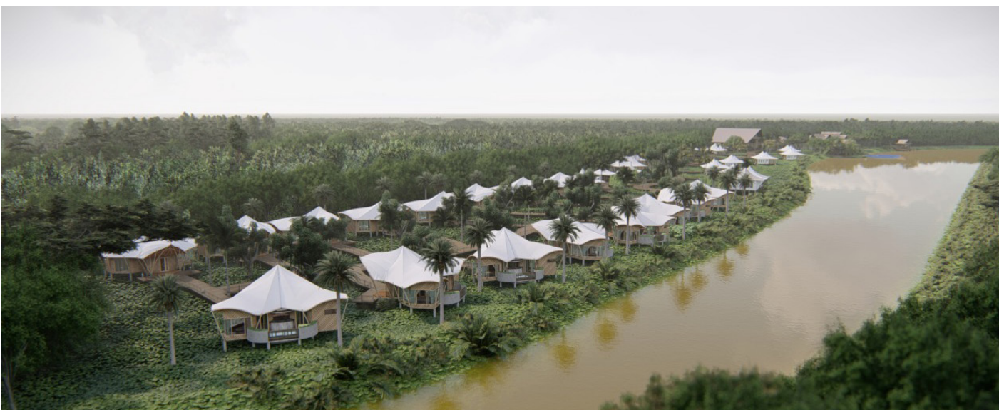
An artist's picturesque impression of the luxury eco-resort in Temburong District.