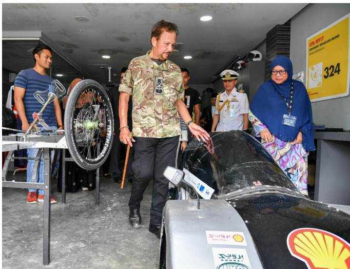
His Majesty takes a closer look at one of the creation of UTB's students.