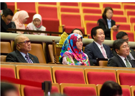
12. Tourism strengthen bilateral relationship