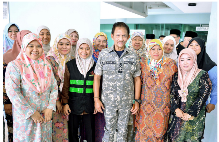
His Majesty the Sultan in a group photo with staff from the Land Department.

Regulations concerning this matter have been clearly stated. Such violations would not occur if relevant agencies or firm with their actions. I want to see it being implemented, instead of just looking good on paper. These are the pressing issues to be dealt with. Lastly, I want the relevant ministries to take