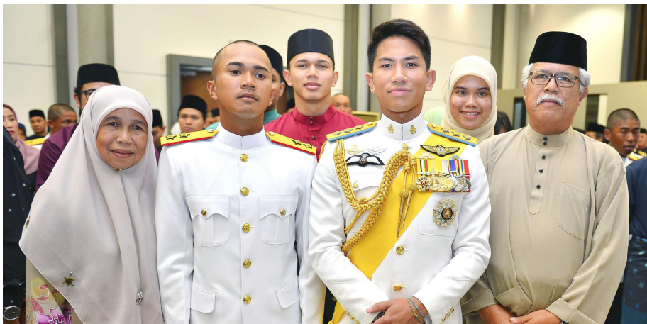
His Royal Highness Captain (U) Prince 'Abdul Mateen in a group photo with an officer cadet and his family.