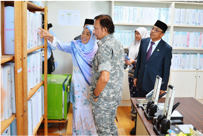
His Majesty the Sultan and Yang Di-Pertuan of Brunei Darussalam visits one of the division under the Ministry of Development.