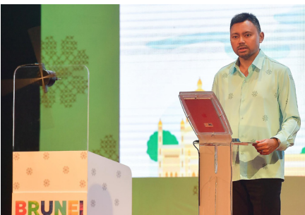
10. ASEAN tourism see growth