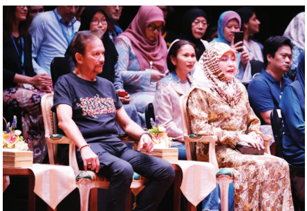
9. Their Majesties grace JIS drama performance