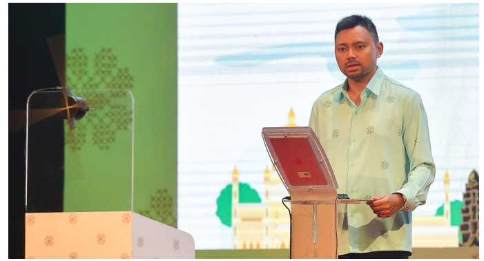
His Royal Highness Prince Haji Al-Muhtadee Billah ibni His Majesty Sultan Haji Hassanal Bolkiah Mu'izzaddin Waddaulah, the Crown Prince and Senior Minister at the Prime Minister's Office officiates the ASEAN Tourism Forum (ATF) 2020 and launches the ASEAN Tourism website.

This year's ATF theme is relevant for what the world is facing, as it reflects the way in which the tourism industry has been rapidly