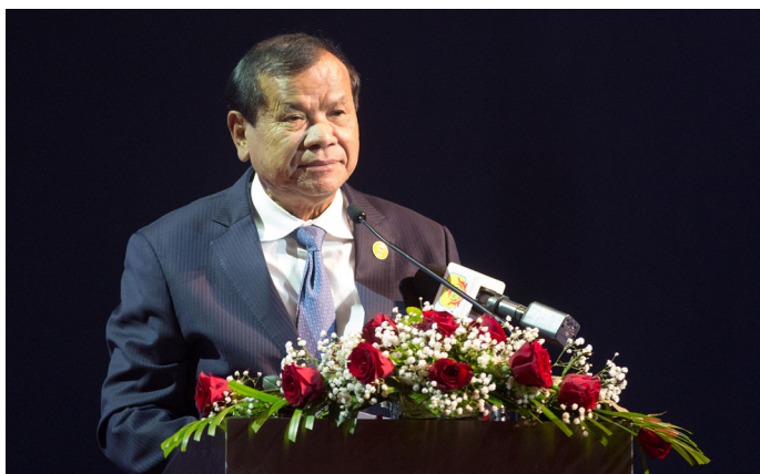
His Excellency Dr. Thong Khon, Minister of Tourism of Cambodia delivers a speech during ASEAN Tourism Chairman handover to The Kingdom of Cambodia, as the Host Country of the 40 th ASEAN Tourism Forum 2021.

For Brunei Darussalam, the 7 th ASEAN Green Hotel Award was presented to Ulu-Ulu Resort and Radisson Hotel for their green initiatives in energy saving, use of green products and community involvement.