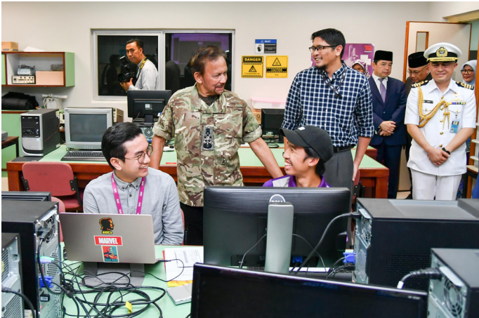
His Majesty the Sultan and Yang Di-Pertuan of Brunei Darussalam mingling with students during the visit.

Towards the end of the visit, His Majesty received a junjung ziarah (get-together) from students, lecturers, senior officers and staffs of UTB.