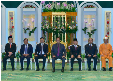
3. His Majesty receives audience