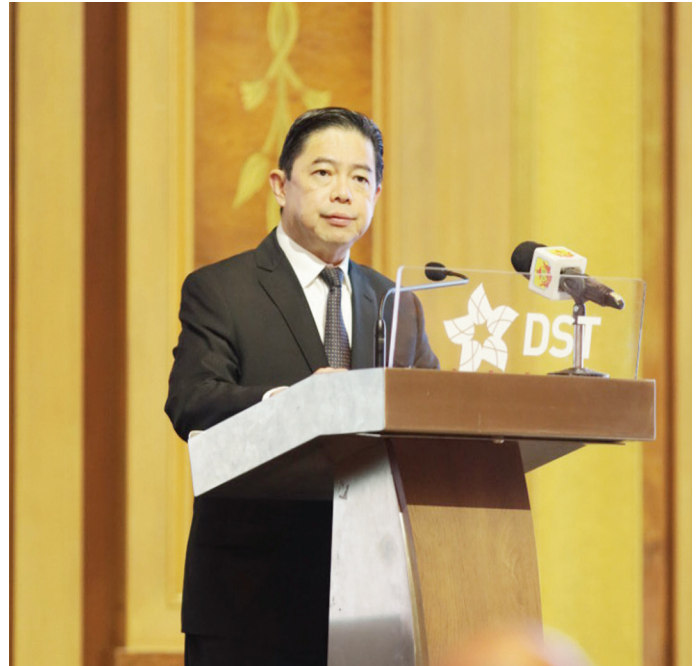
Yang Berhormat Dato Seri Setia Dr. Awang Haji Mohd. Amin Liew bin Abdullah, Minister at the Prime Minister's Office and Second Minister of Finance and Economy who is also Chairman of Datastream Digital Sdn. Bhd. (DST) during launching of the new DST product.

Easi, with the masses voicing out requests for the most popular prepaid service in Brunei Darussalam to follow through to offer better value, Easi Prepaid is now easier than ever to enjoy with customers' favourite options and introductions of new bundles of local SMS and data, the Combo 8 and Combo 22. To add on, DST also revised its data-add on packages with more value