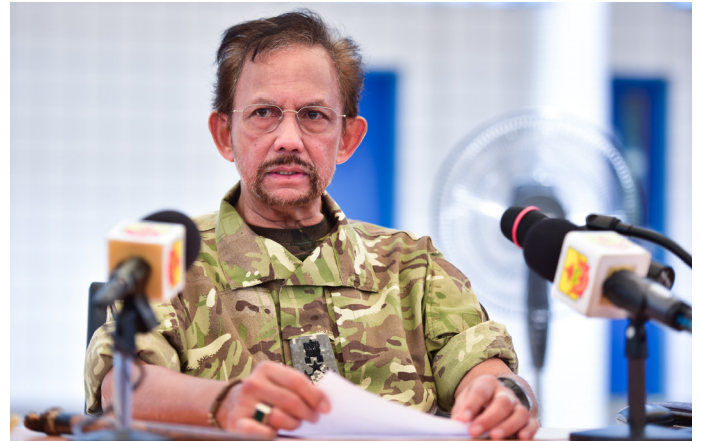
His Majesty Sultan Haji Hassanal Bolkiah Mu'izzaddin Waddaulah ibni Al-Marhum Sultan Haji Omar 'Ali Saifuddien Sa'adul Khairi Waddien, Sultan and Yang Di-Pertuan of Brunei Darussalam delivers a titah (royal speech) during an unscheduled visit to Universiti Teknologi Brunei.

Thus, in His Majesty's view, nothing is lacking, except on the question of ethics, which needs to be indicated. UTB must determine its preferred stance regarding ethics. The stance