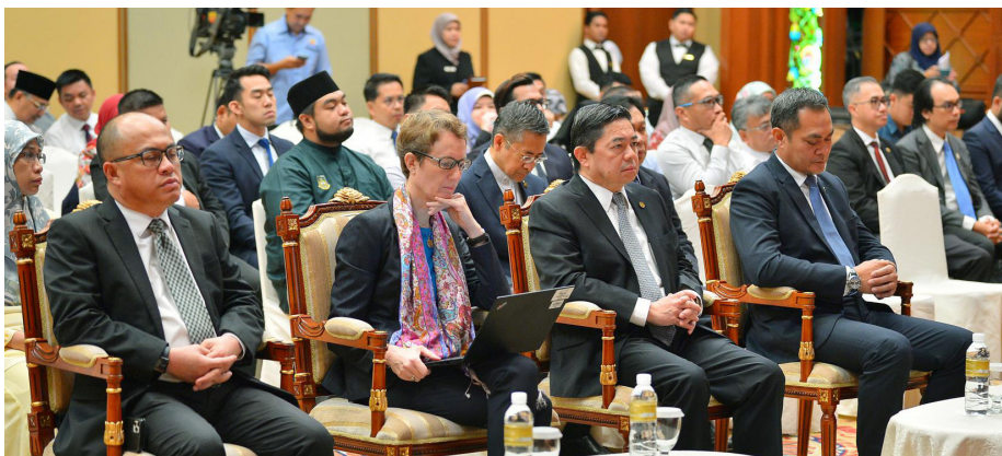
Yang Berhormat Dato Seri Setia Dr. Awang Haji Mohd. Amin Liew bin Abdullah, Minister at the Prime Minister's Office and Second Minister of Finance and Economy at the Opening Ceremony of the Voluntary National Review (VNR) Workshop for Brunei Darussalam held at The Rizqun International Hotel.

The VNR workshop conducted by Minister of Finance and Economy with the support of United Nations Economic and Social Commission for Asia and the Pacific (UN ESCAP) and United Nations Development Programme (UNDP) was