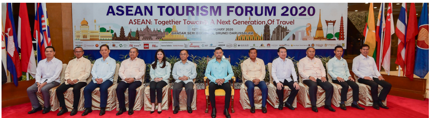
His Royal Highness in a group photo with ASEAN Tourism Ministers attending the forum.

In this regard, ASEAN Tourism recognises that innovation and technology brought benefits to the tourism industry, and shapes the way in which governments, key stakeholders and communities embrace the current trend of digital transformation.