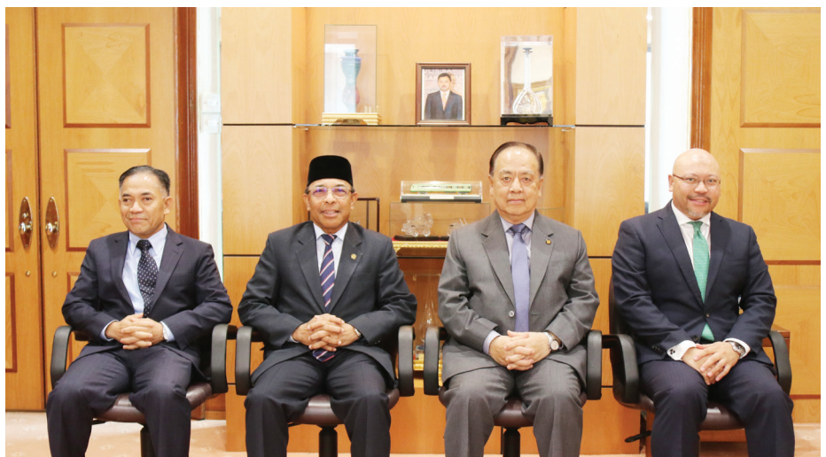
The Brunei Darussalam National Council on Climate Change meeting were co-chaired by Yang Berhormat Dato Seri Setia Engineer Awang Haji Suhaimi bin Haji Gafar, Minister of Development and Yang Berhormat Dato Seri Setia Dr. Awang Haji Mat Suny bin Haji Md. Hussein, Minister of Energy. Meanwhile, the council members were Yang Berhormat Dato Seri Setia Awang Haji Ali bin Haji Apong, Minister of Primary Resources and Tourism and Yang Berhormat Dato Seri Setia Awang Abdul Mutalib bin Pehin Orang Kaya Seri Setia Dato Paduka Haji Mohammad Yusof, Minister of Transport and Infocommunications.

The meeting was co-chaired by Yang Berhormat Dato Seri Setia Engineer Awang Haji Suhaimi bin Haji Gafar, Minister of Development and Yang Berhormat Dato Seri Setia Dr. Awang Haji Mat Suny bin Haji Md. Hussein, Minister of Energy.