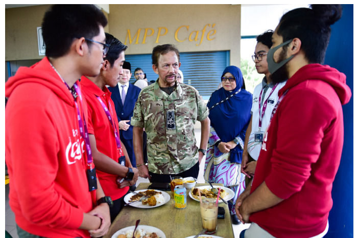
His Majesty listens to a briefing and sharing problems from UTB's students.