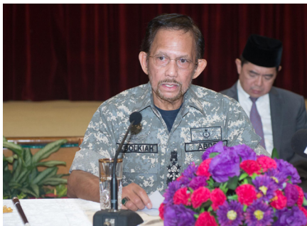
4. Corruption can weaken the administration