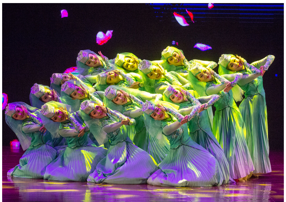
Cultural performance during the event.

The year-long event is also an opportunity to build wider business and trade connections in other areas beyond tourism.