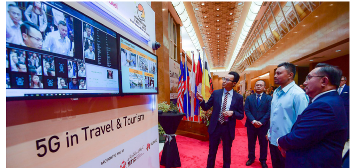
His Royal Highness the Crown Prince views and listens to a briefing on mini showcase by the Ministry of Transport and Infocommunications and Huawei Technologies (Brunei) Sendirian Berhad.