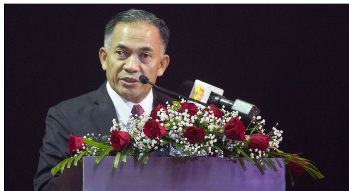
Yang Berhormat Dato Seri Setia Awang Haji Ali bin Haji Apong, Minister of Primary Resources and Tourism delivers a speech during the Closing Ceremony of the ASEAN Tourism Forum (ATF) 2020 held at Indera Samudera Grand Hall, The Empire Brunei.

His Excellency Dr. Thong Khon, Minister of Tourism of Cambodia in his speech said the theme articulates Cambodia's commitment as a key stakeholder in the region's tourism eco-system.