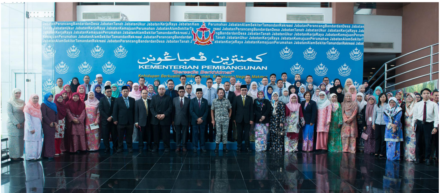
His Majesty the Sultan and Yang Di-Pertuan of Brunei Darussalam in a group photo at the Ministry of Development.