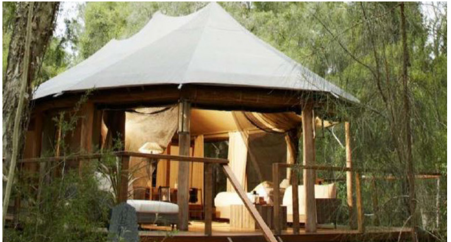
An artist's picturesque impression of the luxury eco-resort in Temburong District.

Sunshine Borneo Tours and Travel Sdn. Bhd. has been appointed to develop a