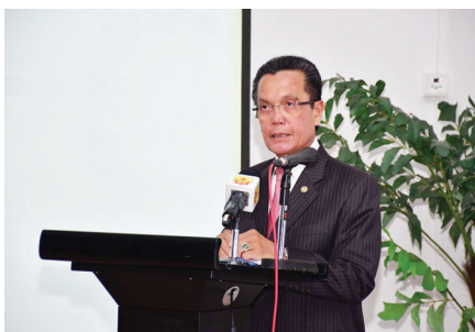
15. Invite youth to be involved in MPMK activities