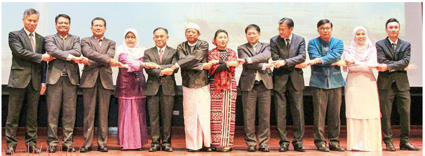
Yang Berhormat Dato Seri Setia Awang Haji Ali bin Haji Apong, Minister of Primary Resources and Tourism and His Excellency U Htin Lynn, Ambassador of Myanmar to Brunei Darussalam with some members of the Diplomatic Corps and guests.

The ceremony continued with a cake-cutting ceremony by the minister and spouse and Mr. U Htin Lynn and spouse. Traditional Myanmar performances also enlivened the night.