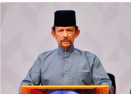
8. National Al-Quran Reading Musabaqah for Adults 1441 Hijrah/2020 Masihi