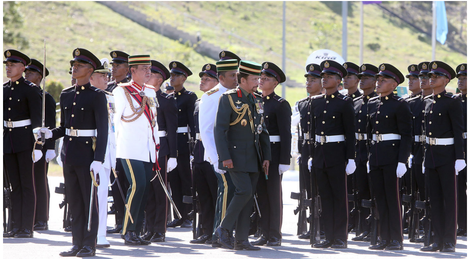
His Majesty inspects the Guard of Honour Parade consisting of officer cadets.