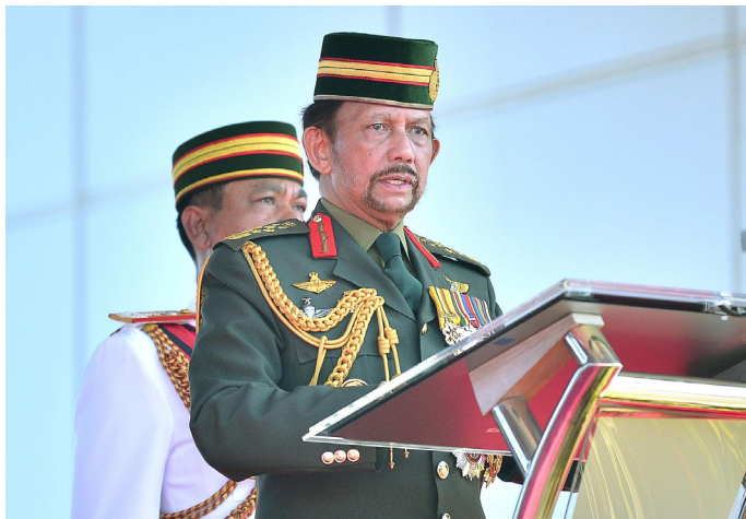
His Majesty Sultan Haji Hassanal Bolkiah Mu'izzaddin Waddaulah ibni Al-Marhum Sultan Haji Omar 'Ali Saifuddien Sa'adul Khairi Waddien, Sultan and Yang Di-Pertuan of Brunei Darussalam delivering a titah (royal speech) during the Sovereign's Parade Ceremony of the 18 th intake of officers cadet of the Royal Brunei Armed Forces (RBAF), the Officer Cadet School held at the at the Parade Square of the Defence Academy, RBAF in Kampung Tanah Jambu.