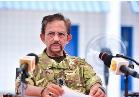
7. UTB to contribute to the development of knowledge