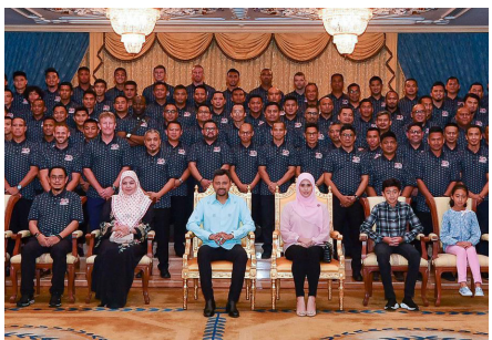
11. Royalty grace 20 th DPMM FC Reunion Dinner