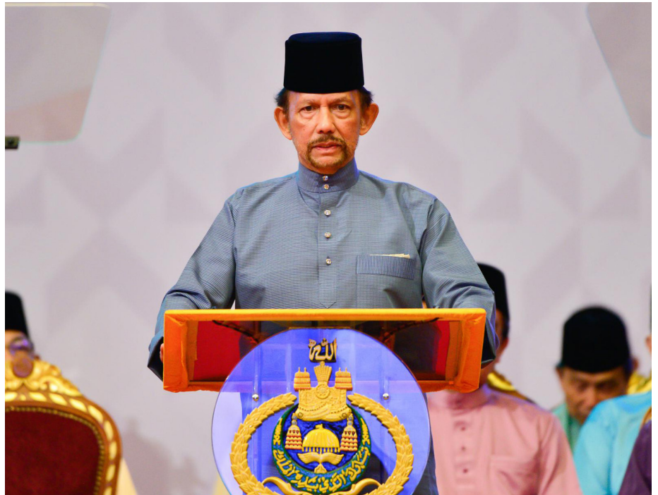
His Majesty Sultan Haji Hassanal Bolkiah Mu'izzaddin Waddaulah ibni Al-Marhum Sultan Haji Omar 'Ali Saifuddien Sa'adul Khairi Waddien, Sultan and Yang Di-Pertuan of Brunei Darussalam delivers the titah (royal speech) at the prize presentation ceremony of the Final of the National Al-Quran Reading Musabaqah for Adults 1441 Hijrah/2020 Masihi at the International Convention Centre.

In concluding the titah , His Majesty extended his appreciation to the participants of the competition, saying, "Winning or losing is not the main