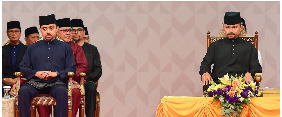
His Royal Highness Prince Haji Al-Muhtadee Billah ibni His Majesty Sultan Haji Hassanal Bolkiah Mu'izzaddin Waddaulah, the Crown Prince and Senior Minister at the Prime Minister's Office and His Royal Highness Prince 'Abdul Malik ibni His Majesty Sultan Haji Hassanal Bolkiah Mu'izzaddin Waddaulah graces the Opening Ceremony of the Final of the National Al-Quran Reading Musabaqah for Adults 1441 Hijrah/2020.

This is very important, particularly in the current era of globalisation that has influenced the way people think, ideology and culture including bringing various negative foreign elements. Only Al-Quran can guide us to always be in the right and safe path, in life and the hereafter.