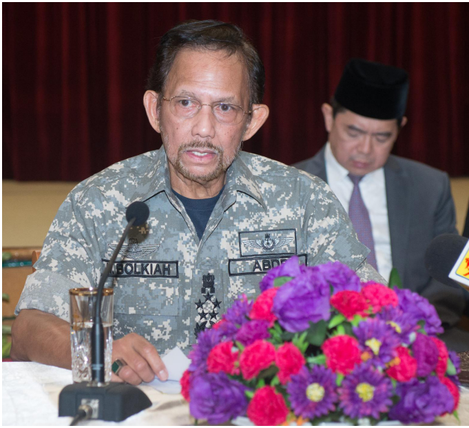
His Majesty Sultan Haji Hassanal Bolkiah Mu'izzaddin Waddaulah ibni Al-Marhum Sultan Haji Omar 'Ali Saifuddien Sa'adul Khairi Waddien, Sultan and Yang Di-Pertuan of Brunei Darussalam delivers a titah during an unscheduled visit to the Ministry of Development and its departments.

BANDAR SERI BEGAWAN, January 13 - Ministry of Development (MoD) was urged not to carry out work that brings losses to the government and the people. For instance, they are urged not to choose contractors randomly for project development, but to choose contractors with good reputation.