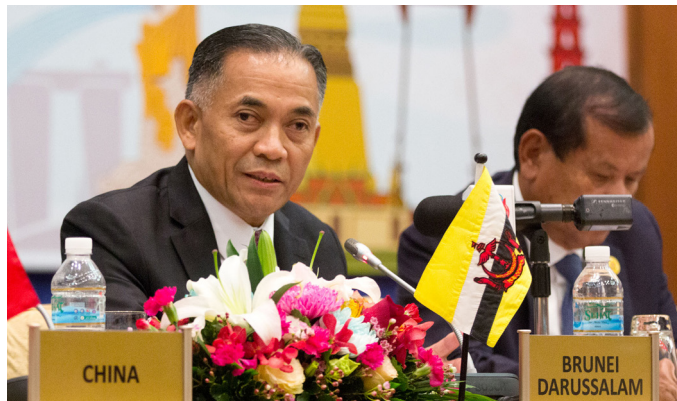
The Minister of Primary Resources and Tourism speaks at the ASEAN Tourism Ministers Press Conference.

Yang Berhormat realised that digital tourism is one of the key activities to be aligned in enhancing the public's experience in accessing information and services, and developed a declaration