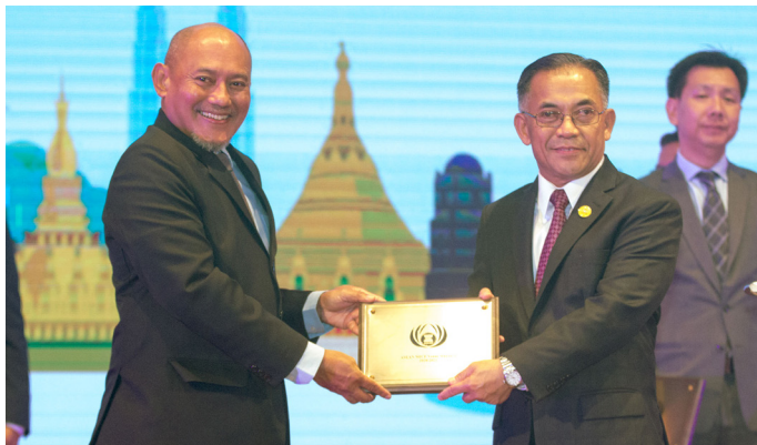
Yang Berhormat Dato Seri Setia Awang Haji Ali bin Haji Apeng, Minister of Primary Resources and Tourism presents the award to one of the recipients at the ASEAN Tourism Awards Presentation Ceremony.