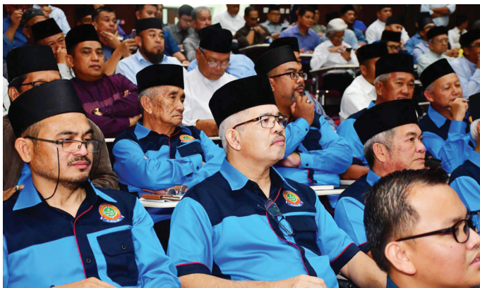
Among the Mukim Penghulus, Acting Mukim Penghulus, Village Head and Acting Village Heads participate the 2-day leadership workshop.

The 2-day workshop is the effort and initiative of Ministry of Home Affairs attended by Mukim Penghulus, Acting Mukim Penghulus, Village Head and Acting Village Heads.