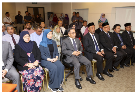
13. Luxury eco-resort to be built in Temburong