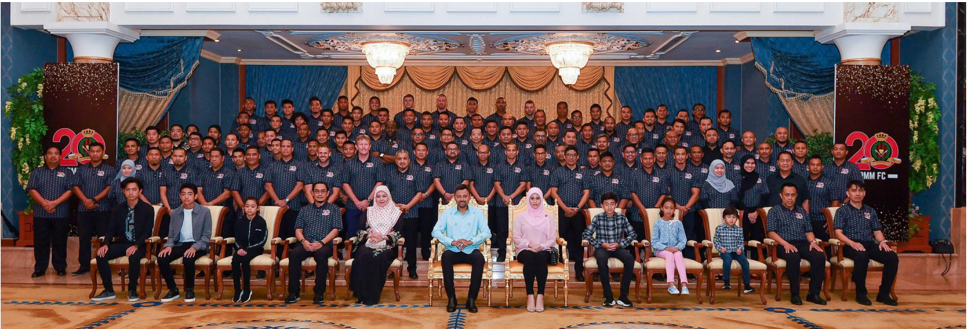
His Royal Highness Prince Haji Al-Muhtadee Billah ibni His Majesty Sultan Haji Hassanal Bolkiah Mu'izzaddin Waddaulah, the Crown Prince and Senior Minister at the Prime Minister's Office and Her Royal Highness Paduka Seri Pengiran Anak Isteri Pengiran Anak Sarah binti Pengiran Haji Salleh Ab. Rahaman in a group photo with members of the DPMM FC.

JERUDONG, January 29 - His Royal Highness the Crown Prince's Football Club, better known as DPMM FC has reached its 20 th year since its establishment in 2000. It first started as a college football team in 1994, before officially becoming a top club to this day.