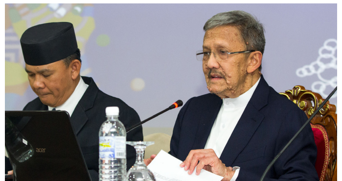
His Royal Highness Prince Haji Sufri Bolkiah ibni Al-Marhum Sultan Haji Omar 'Ali Saifuddien Sa'adul Khairi Waddien, President of the Brunei Darussalam National Olympic Council made the sabda at the Philippines 30 th SEA Games 2019 Post-Mortem Meeting.

His Royal Highness also conveyed his thanks to the Secretariat of the Brunei's contingent, Chef de Mission and assistant Chefs de Mission who worked hard to ensure the entrusted tasks were