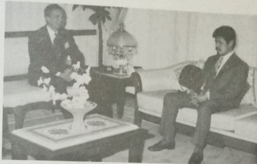
His Excellency Mr. Winston Lord paid a courtesy call on His Royal Highness Paduka Seri Pengiran Perdana Wazir Sahibul Himmah Wal-Waqar Pengiran Muda Haji Mohamed Bolkiah, Foreign Affairs Minister.

Demonstrable benefits such as trade and related job growth that stem from closer economic ties and economic liberalization can and will solidify US public support for US continued engagement in international political and security issues. This is true, he said, on a bilateral, regional and multilateral