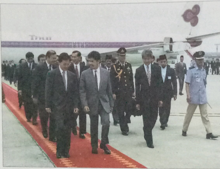
The Minister of Foreign Affairs, His Royal Highness Paduka Seri Pengiran Perdana Wazir Sahibul Himmah Wal-Waqar Pengiran Muda Haji Mohamed Bolkiah, representing His Majesty, headed the welcoming party at the Brunei International Airport for His Excellency Mr. Chuan Leekpai, who shortly after arrival, took the salute and inspected a guard of honour.