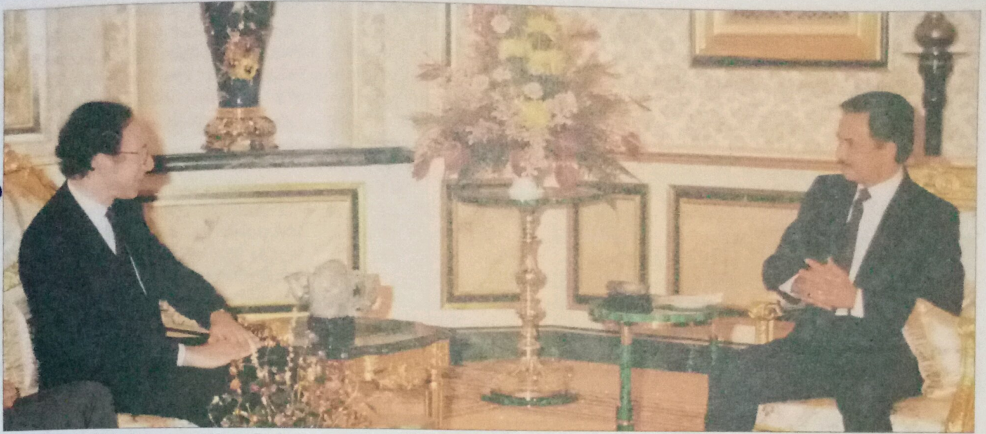
His Majesty The Sultan and Yang Di-Pertuan of Brunei Darussalam granted an audience to Britain's Secretary of State for Defence, The Rt. Hon. Malcolm Rifkind.