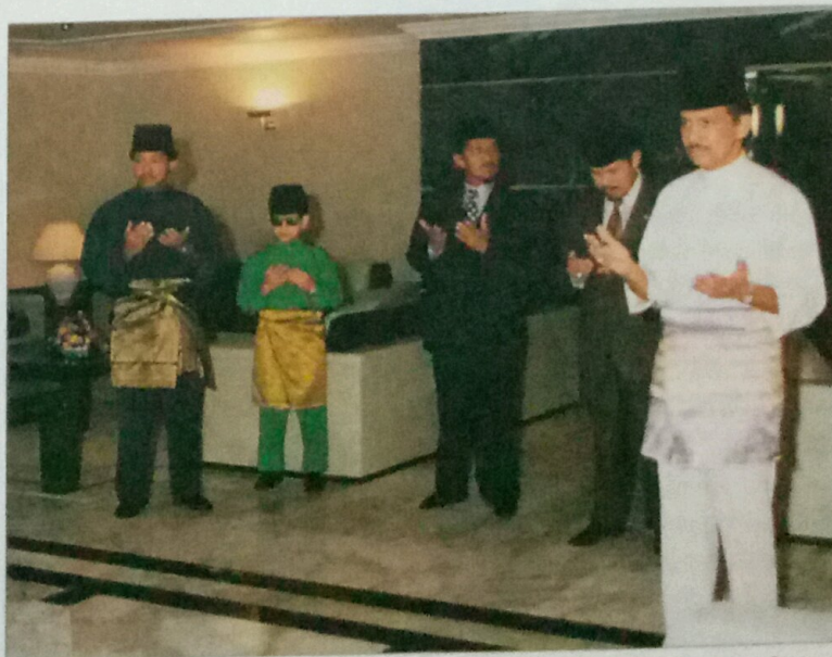
His Majesty The Sultan and Yang Di-Pertuan of Brunei Darussalam, His Royal Highness Paduka Seri Pengiran Digadong Sahibul Mal Pengiran Muda Haji Jefri Bolkiah, 5th from right and His Royal Highness Paduka Seri Duli Pengiran Muda Haji 'Abdul Azim, 4th from right, stand in homage of the do'a selamat shortly before their departure for the holy land. Seeing them off were His Royal Highness Paduka Seri Pengiran Perdana Wazir Sahibul Himmah Wal-Waqar Pengiran Muda Haji Mohamed Bolkiah and His Royal Highness Paduka Seri Pengiran Bendahara Seri Maharaja Permaisura Pengiran Muda Haji Sufri Bolkiah, 2nd and 3rd from right respectively.

The Brunei monarch first went on the pilgrimage in 1987, followed by the second in 1991. Last year, the ruler performed his third Haj, together with his family.