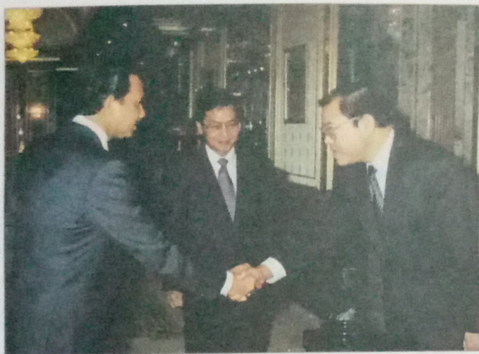
The Thai Prime Minister, centre above, introduces members of his delegation to His Majesty on their arrival at Istana Nurul Iman for an audience with the Brunei monarch. At the audience, right, the two leaders discussed bilateral and regional issues.