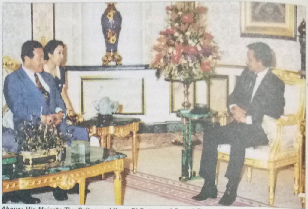
Above: His Majesty The Sultan and Yang Di-Pertuan of Brunei Darussalam granting an audience to Japan's Minister of Trade and Industry, His Excellency Mr. Yoshiro Mori, and below, the Brunei ruler grants an audience to His Excellency Dr. Ali Akbar Velayati, Foreign Affairs Minister of the Islamic Republic of Iran