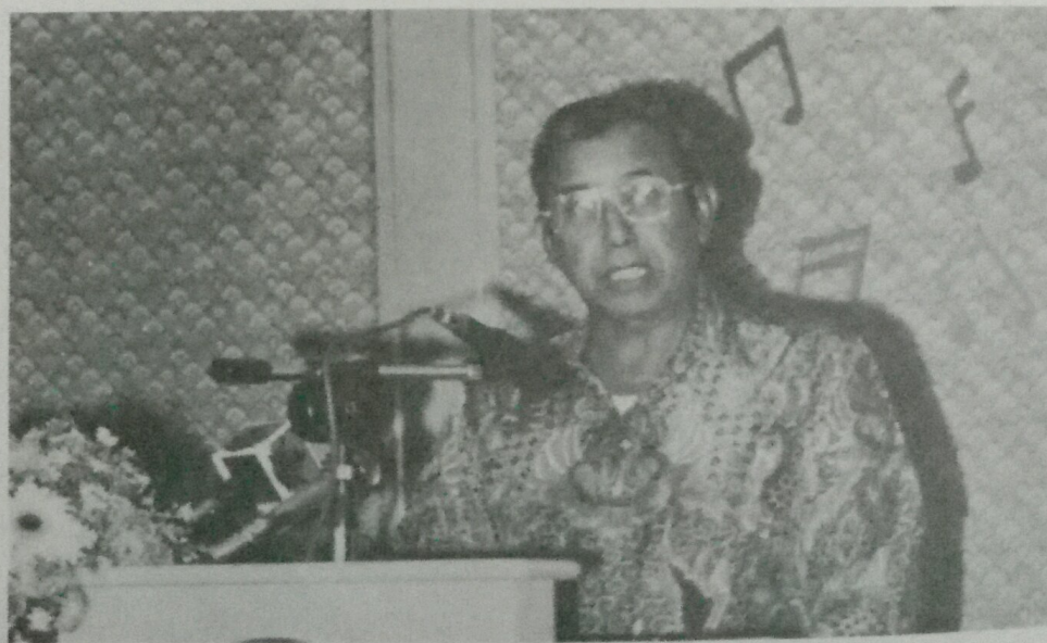
The Minister of Culture, Youth and Sports, Yang Berhormat Pehin Orang Kaya Digadong Seri Lela Dato Seri Paduka Haji Awang Hussein.