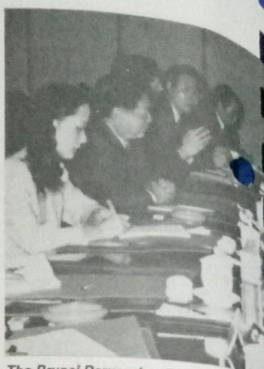
The Brunei Darussalam Foreign Affairs Minister (second from right, right row) and his delegation (second from left, left row) at which

"We had a substantive discussion covering bilateral relations, as well as regional and international issues", said a Brunei Darussalam Foreign