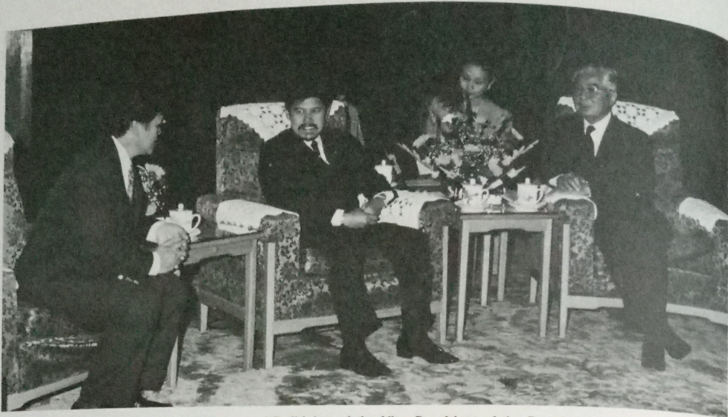
His Royal Highness Prince Haji Mohamed Bolkiah and the Vice President of the People's Republic of China, His Excellency Rong Yiren holding a brief meeting in the Jiangsu Hall - one of the 30 rooms in the Great Hall of the People in Beijing