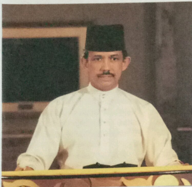
Delivering his titah in conjunction with the new year 1414 of the Muslim calendar, His Majesty Paduka Seri Baginda Sultan Haji Hassanal Bolkiah Mu'izzaddin Waddaulah, Sultan and Yang Di-Pertuan of Brunei Darussalam spoke, among other things, of numerous upheavals currently afflicting the Muslim world