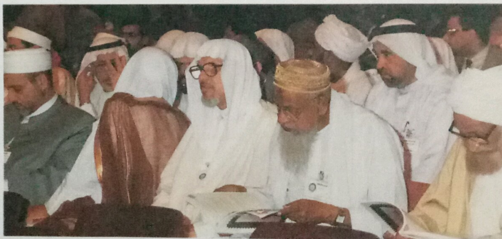
Some of the scholars and intellectuals as well as delegates from the Muslim world who attended and presented working papers at the Eighth Conference of the Islamic Fiqh Academy hosted by Brunei Darussalam from 21 to 27 June.