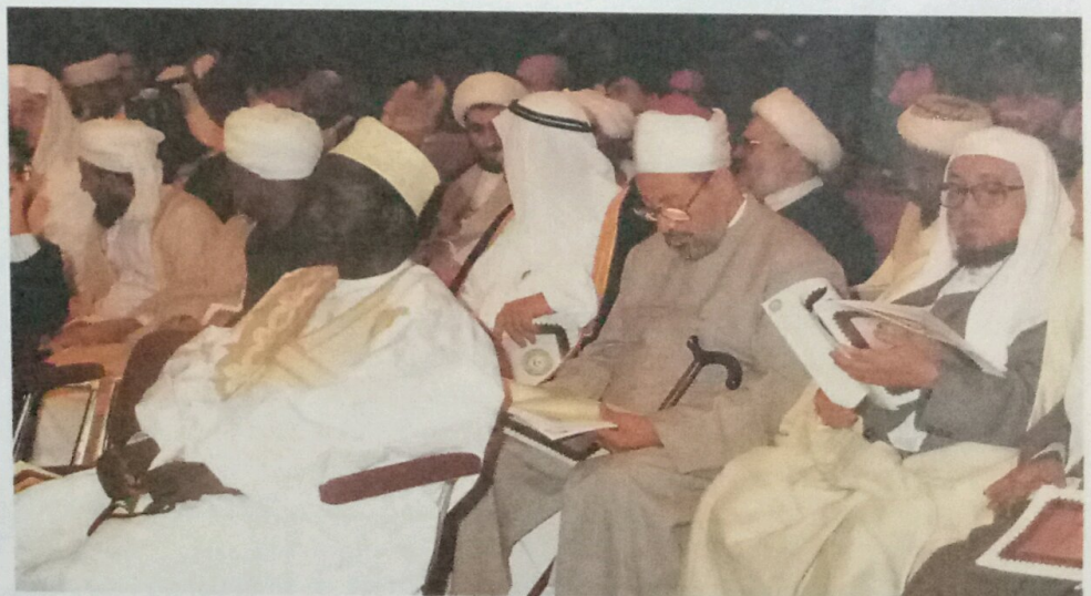
Some of the scholars, intellectuals and delegates from the Muslim world attending the conference.