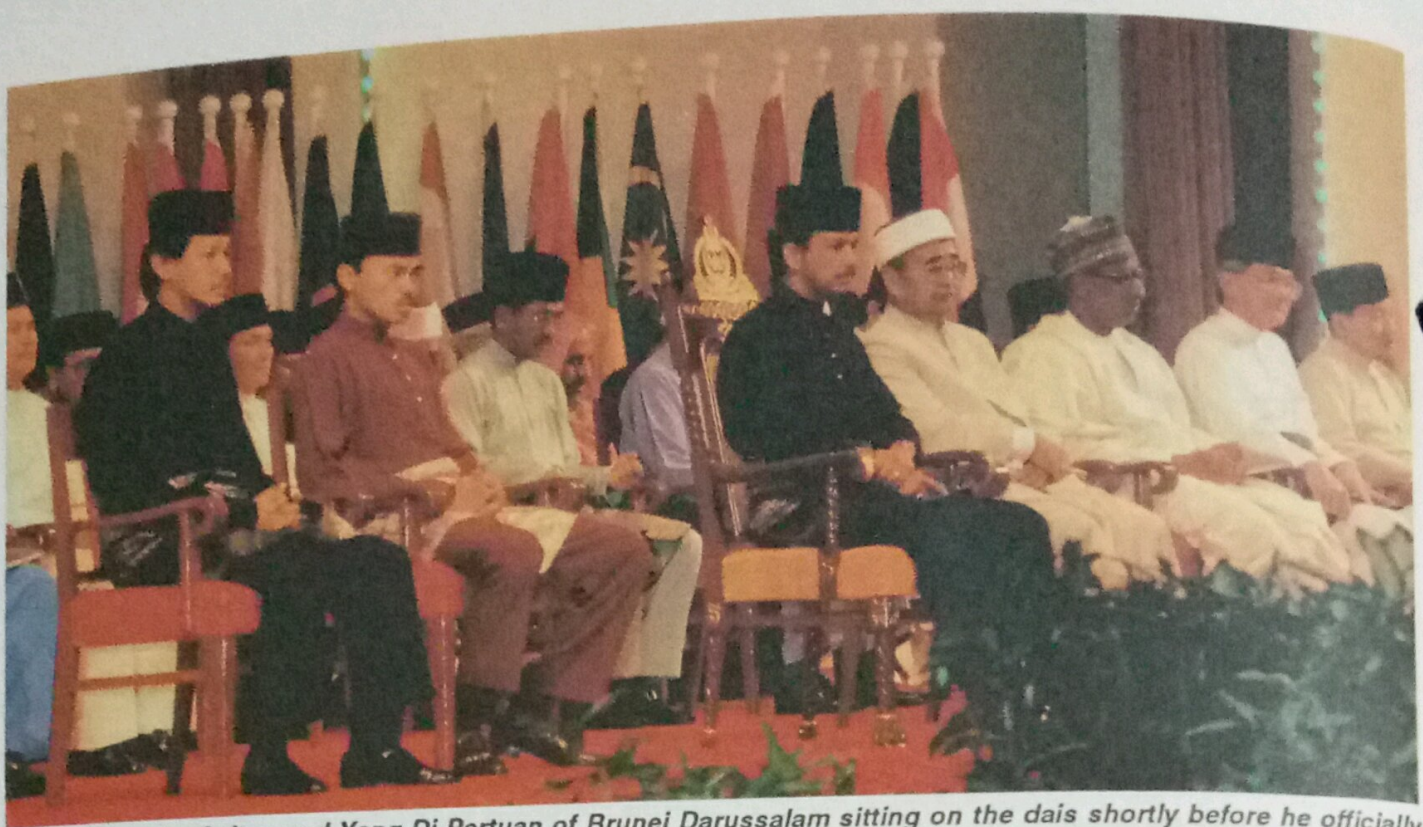
His Majesty the Sultan and Yang Di-Pertuan of Brunei Darussalam sitting on the dais shortly before he officially opened the Eighth Conference of the Islamic Fiqh Academy Council. With him are His Royal Highness Paduka Seri Duli Pengiran Muda Haji Al-Muhtadee Billah, second from left, and His Royal Highness Paduka Seri Pengiran Digadong Sahibul Mal Pengiran Muda Haji Jefri Bolkiah, extreme left, as well as other Brunei and foreign dignitaries.