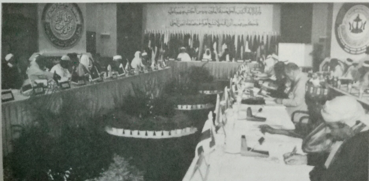
In deep discussion.....delegates during a session of the Eighth Conference of the Fiqh Academy at the Brunei International Convention Centre.