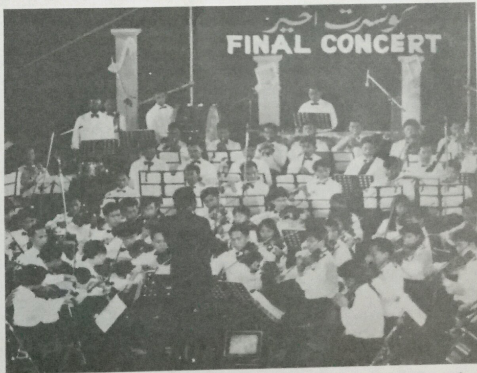
Young musicians from throughout ASEAN showing what they had acquired from the Third ASEAN Youth Music Workshop hosted by Brunei Darussalam through various numbers during a performance.

Among those present were His Majesty's sons, His Royal Highness Paduka Seri Duli Pengiran Muda Haji Al-Muhtadee Billah and His Royal Highness Paduka Seri Duli Pengiran Muda Haji Abdul 'Azim.