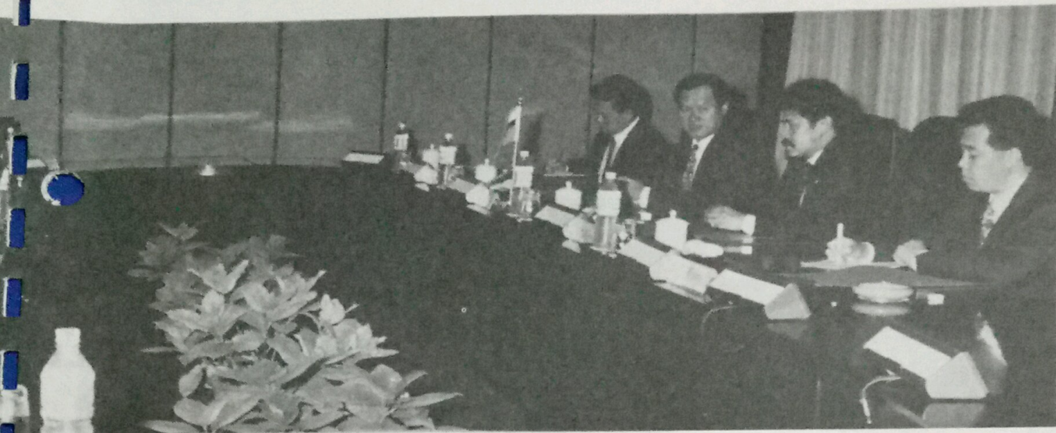
Royal Highness Paduka Seri Pengiran Perdana Wazir Sahibul Himmah Wal-Waqar Pengiran Muda Haji Mohamed Bolkiah the meeting with the Deputy Prime minister who is also Foreign Minister of the People's Republic of China, His Excellency Qian other things, ways to enhance relations between the two countries were discussed.