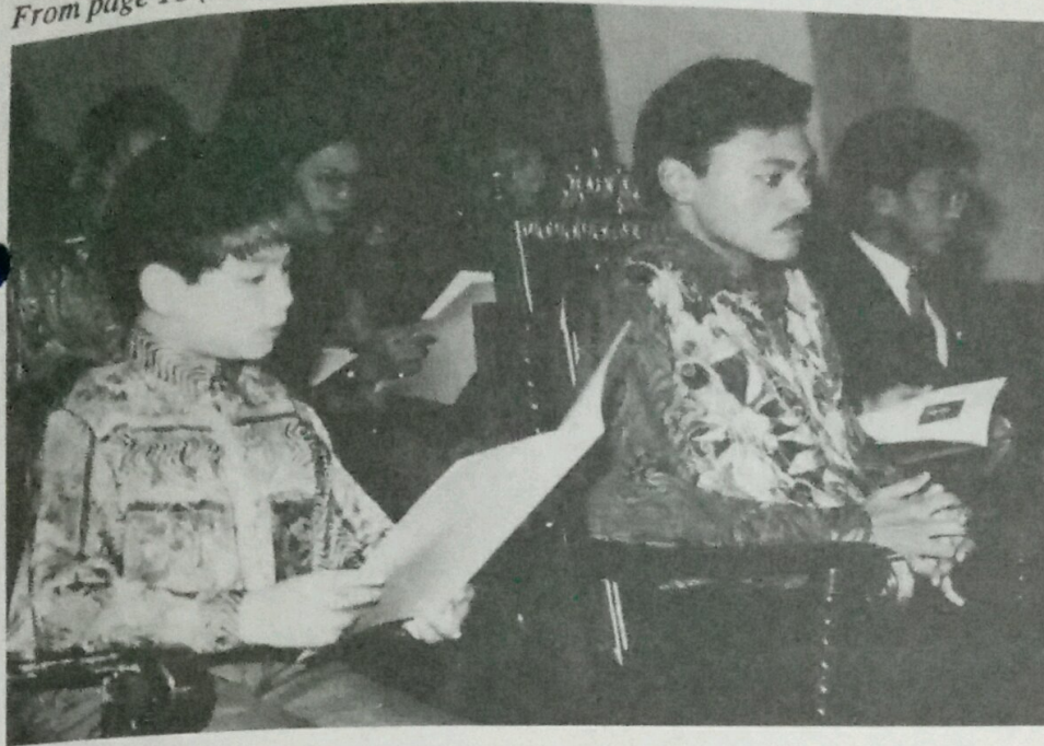
Their Royal Highnesses Paduka Seri Duli Pengiran Muda Haji Al-Muhtadee Billah and Paduka Seri Duli Pengiran Muda Haji Abdul 'Azim (far left) attending the final concert in Bandar Seri Begawan by participants of the Third ASEAN Youth Music Workshop.