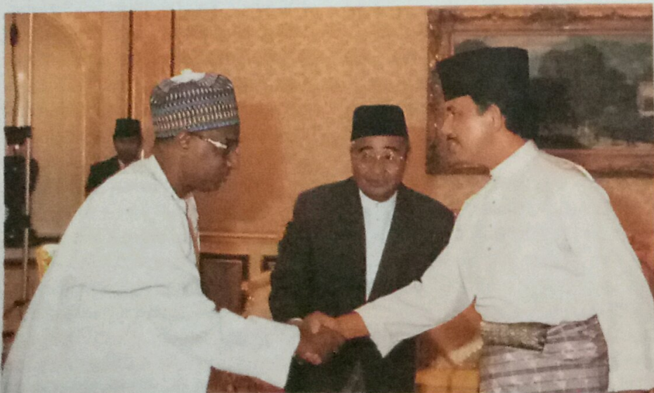
On the eve of the conference, the Brunei monarch granted an audience at Istana Nurul Iman to the Secretary General of the Organisation of Islamic Conference, OIC, His Excellency Dr. Al-Sayyid Abd. Hamid Al-Ghabid.