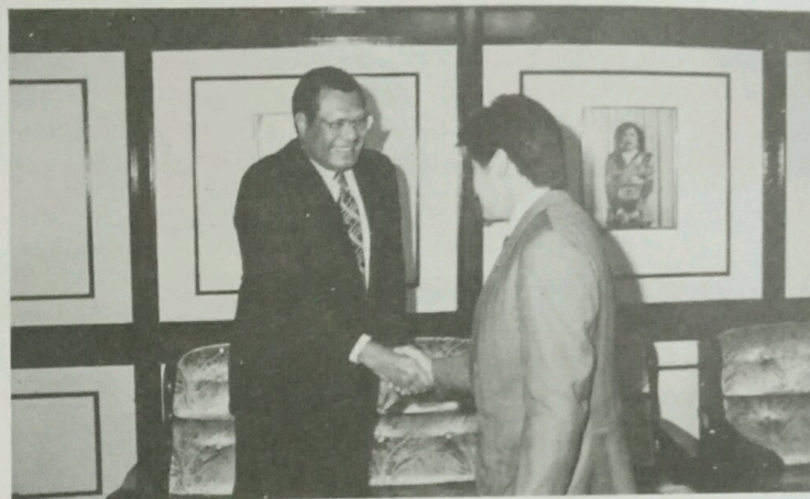
HRH with the High Commissioner of Papua New Guinea, HE Alan Ine's Oaisa, above.

During the courtesy calls, His Royal Highness Paduka Seri Pengiran Perdana Wazir Sahibul Himmah Wal-Waqar Pengiran Muda Haji Mohamed Bolkiah discussed bilateral affairs with the respective country's in-coming representative.