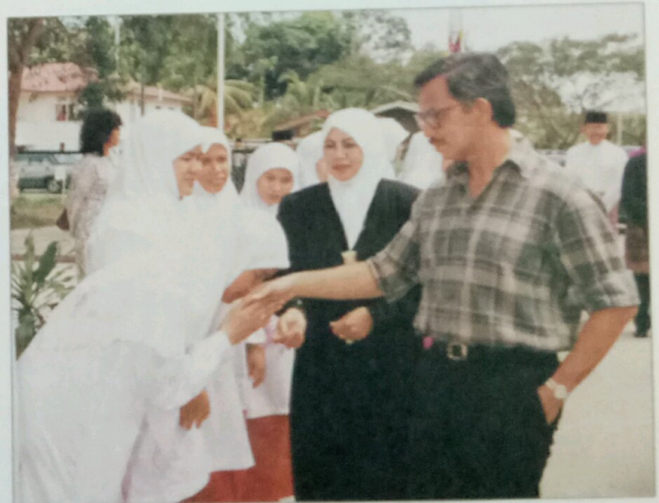
His Majesty The Sultan and Yang Di-Pertuan of Brunei Darussalam receives 'junjung ziarah' from teachers and staff of the Sekolah Tadika Jaya or Jaya Kindergarten during his visit to the school (above), and watches with interest the activities of the pupils (left).