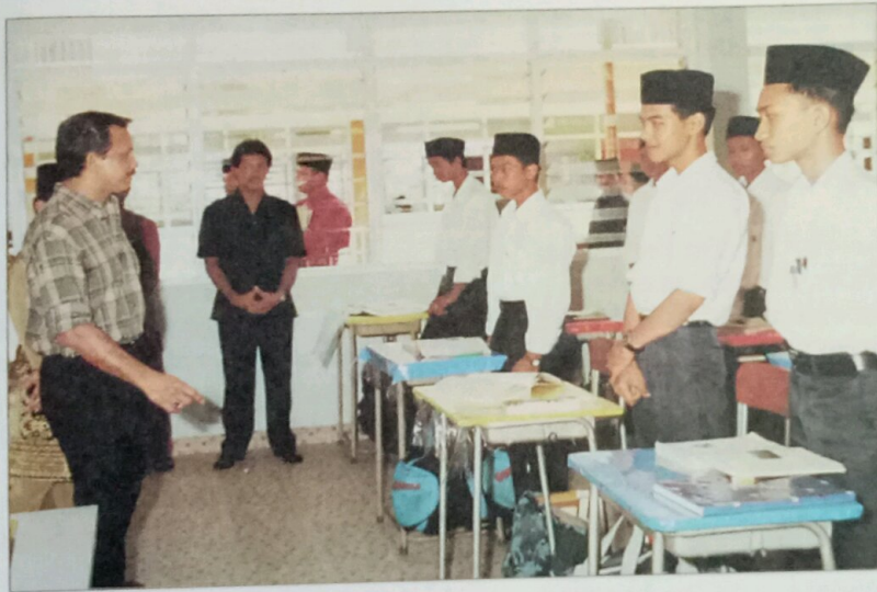
His Majesty The Sultan and Yang Di-Pertuan of Brunei Darussalam during his tour to Berakas Secondary School.