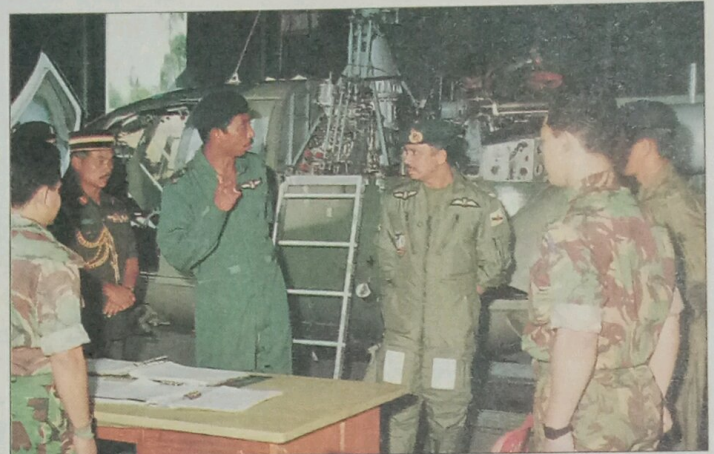
His Majesty Paduka Seri Baginda Sultan Haji Hassanal Bolkiah Mu'izzaddin Waddaulah, Sultan and Yang Di-Pertuan of Brunei Darussalam, receiving a royal salute soon after His Majesty's arrival at the oath reading ceremony (left), while picture on the right shows the Brunei ruler listening to a briefing during his visit to the 1 Squadron of the Royal Brunei Air Force in Berakas.