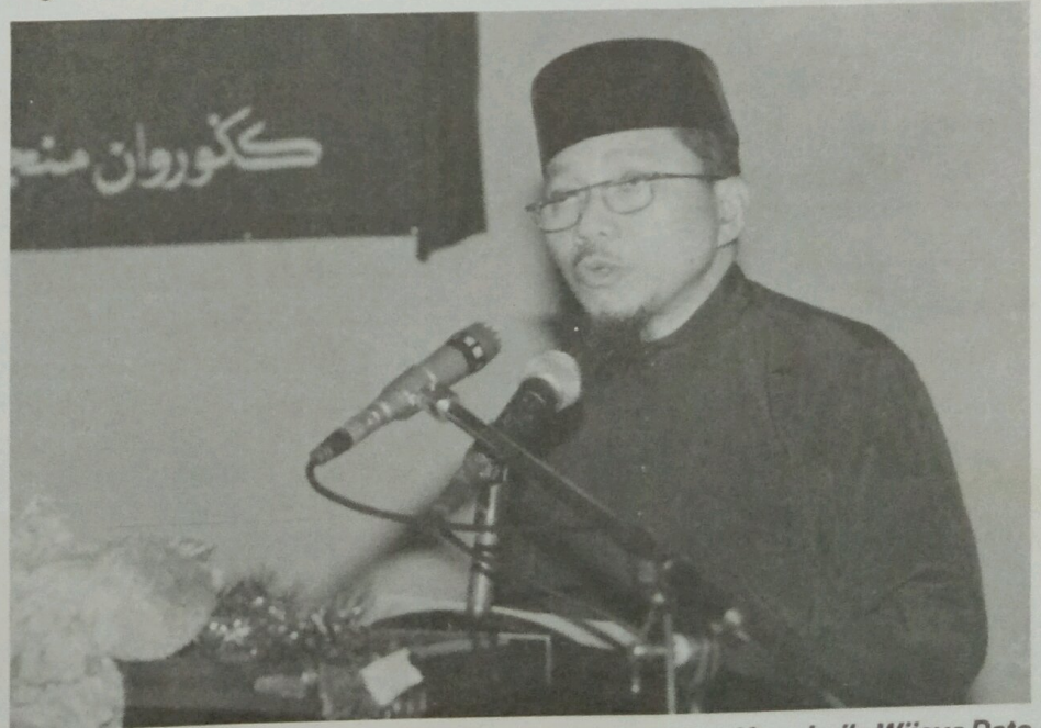
The Education Minister, Yang Berhormat Pehin Orang Kaya Laila Wijaya Dato Seri Setia Haji Abdul Aziz says 'we would like to make advancements in all fields in our own ways even though they are not similar with those of other countries'.

Each day, the role of teachers have increased and have become more challenging. Teachers therefore should sharpen their minds and upgrade their knowledge and skills in order to ensure that the teaching profession is able to adjust to current situation and able to solve problems of the prevailing period, the minister said at the one-day seminar organised by the PGGMB (Malay Teachers Association of Brunei).