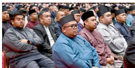
Scenes from the 35 th Teachers' Day Celebration 2025.

Also in attendance at the celebration were His Majesty's sons and brothers: His Royal Highness Prince 'Abdul Malik; His Royal Highness Prince 'Abdul Mateen; His Royal Highness Prince Haji Sufri Bolkiah; and His Royal Highness Prince Haji Jefri Bolkiah.