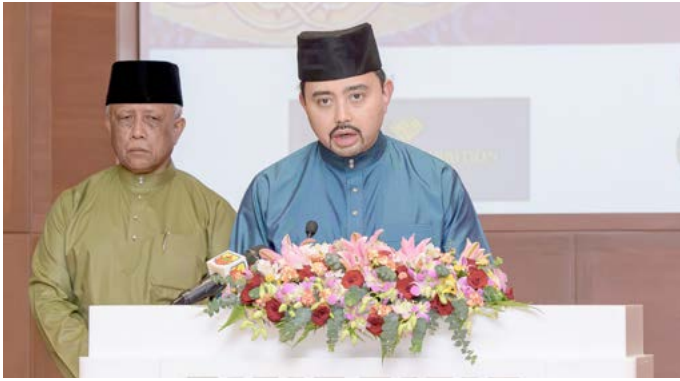
His Royal Highness Prince 'Abdul Malik ibni His Majesty Sultan Haji Hassanal Bolkiah Mu'izzaddin Waddaulah launching the Sirah Rasulullah Sallallahu Alaihi Wasallam Exhibition: Al-Rawdah Al-Sharifah and Al-Hujrah Al-Nabawiyyah (left); and touring the exhibition (right).