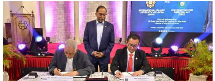
The Vice-Chancellor of Universiti Brunei Darussalam and the Rector of International Islamic University Malaysia signing the Memorandum of Understanding, witnessed by Yang Berhormat Minister of Higher Education of Malaysia.