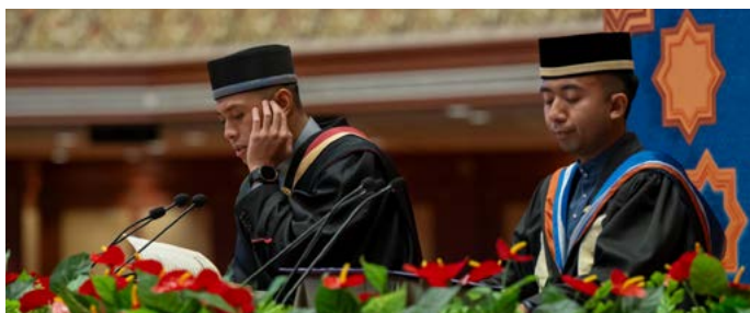
The recitation of verses 30 to 33 of Surah Al-Baqarah by a Bachelor of Engineering (Hons.) in Mechanical Engineering graduate.

Also in attendance at the ceremony was His Majesty's son: His Royal Highness Prince Haji Al-Muhtadee Billah, the Crown Prince and Senior Minister at the Prime Minister's Office as Pro-Chancellor of UTB.