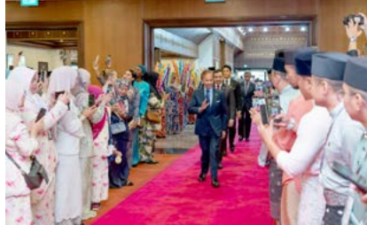
7. Call for ethical use of AI