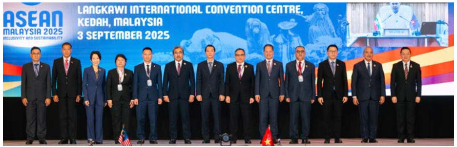
Yang Berhormat Minister of Development representing Brunei Darussalam at the 18 th ASEAN Ministerial Meeting on the Environment and the 20 th Meeting of the Parties to the ASEAN Agreement on Transboundary Haze Pollution.

The Minister of Development underscored Brunei's targets of reducing greenhouse