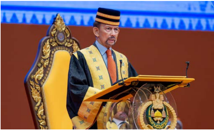
His Majesty the Sultan and Yang Di-Pertuan of Brunei Darussalam delivering a titah (royal speech) at the 13 th UTB Convocation Ceremony.