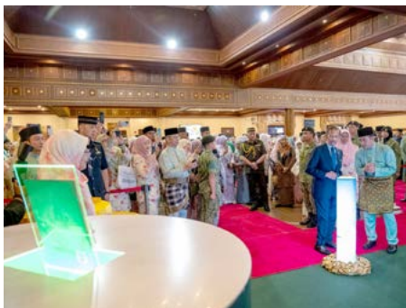
His Majesty launching the 'GenAI Guidance for Education' guidebook.