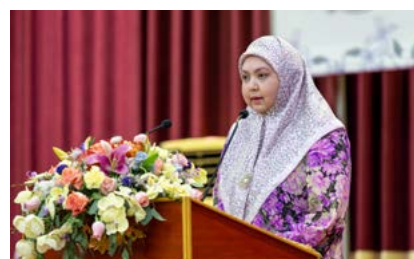
15. Royalty launches Household Affairs Exhibition 2025