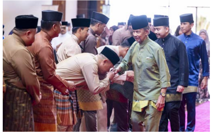
His Majesty the Sultan and Yang Di-Pertuan of Brunei Darussalam upon arrival at the event. Also present were His Royal Highness Prince 'Abdul Malik; His Royal Highness Prince 'Abdul Mateen; His Royal Highness Prince Haji Sufri Bolkiah; and His Royal Highness Prince Haji Jefri Bolkiah.