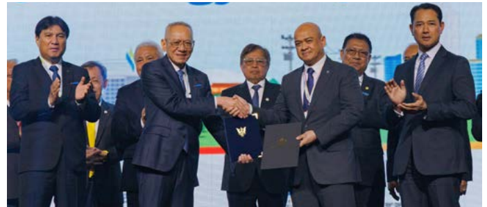
Yang Mulia Deputy Minister (Energy) at the Prime Minister's Office and Yang Berhormat Deputy Minister for Utility (Sarawak Energy Berhad and PETROS) at the Ministry of Utility and Telecommunication Sarawak during the signing.