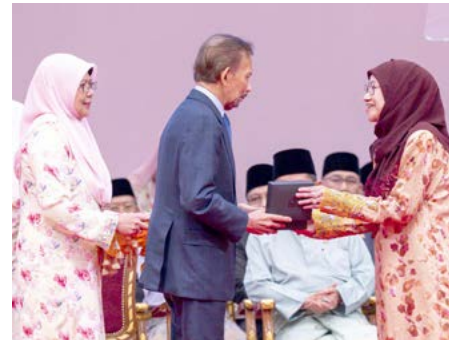
His Majesty the Sultan and Yang Di-Pertuan of Brunei Darussalam presenting the 35 th Teachers' Day 2025 Awards to the recipients (above and below).