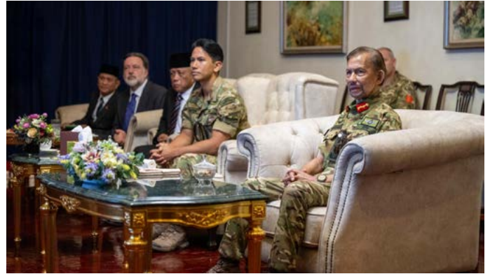
His Majesty the Sultan and Yang Di-Pertuan of Brunei Darussalam signing a commemorative plaque (left); and attending a briefing (right).