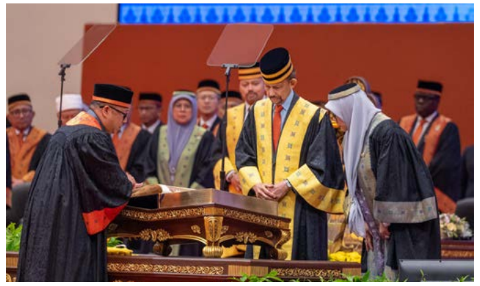
His Majesty officiating the launch of the UTB Mushaf.