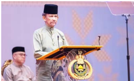
9. Knowledge Convention 2025: Nurturing a caring society