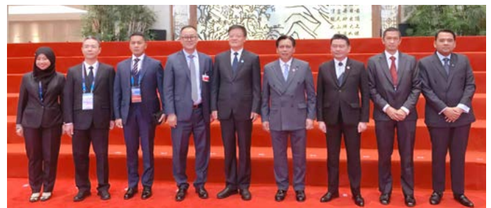
Yang Mulia Deputy Minister (Security and Law) at the Prime Minister's Office and the delegation in a group photo during the bilateral meeting with the Ministry of Public Security of the People's Republic of China.

Prior to the opening, the delegation held a bilateral meeting with His Excellency Jia Lijun, Member of the Party Committee and Director of the Political Department, Ministry of Public Security of China; and visited the Public Security Tech Expo, held in