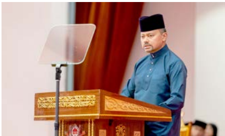
12. Call to strengthen dakwah methodology