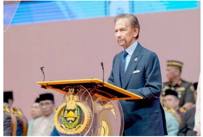
His Majesty Sultan Haji Hassanal Bolkiah Mu'izzaddin Waddaulah ibni Al-Marhum Sultan Haji Omar 'Ali Saifuddien Sa'adul Khairi Waddien, Sultan and Yang Di-Pertuan of Brunei Darussalam delivering a titah (royal speech) at the 35 th Teachers' Day Celebration 2025.

His Majesty also announced amendments to the Brunei Education Act, empowering the Examinations Board to award qualifications for local subjects, and endorsed new guidelines allowing private higher education institutions to offer accredited home-grown programmes. His Majesty further called for a comprehensive national framework for early childhood education to ensure inclusive, high-quality learning.