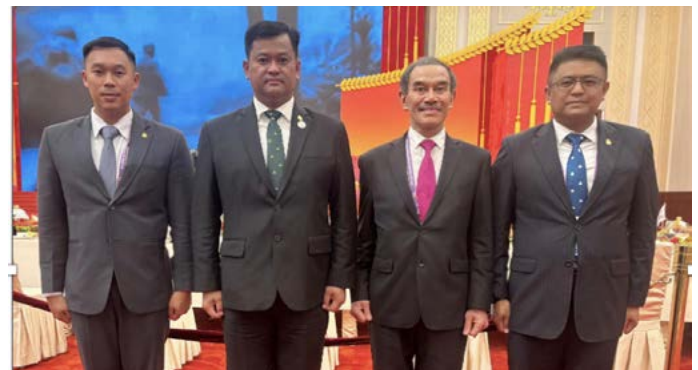
The Commander of the Royal Brunei Armed Forces lead the delegation on behalf of the Ministry of Defence of Brunei Darussalam to the 80 th Anniversary of the Victory in the Chinese People's War of Resistance Against Japanese Aggression and the World Anti-Fascist War.

The commemoration featured a military parade and a speech by His Excellency President Xi Jinping, President of China at Tiananmen Square, followed by a gala reception and performance at the Great Hall of the People. The event was attended by 26