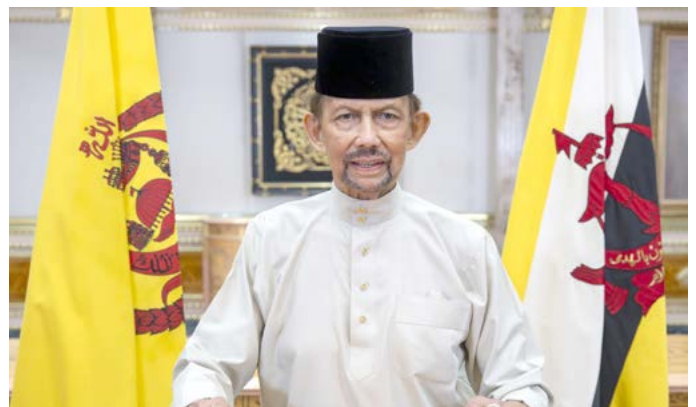
His Majesty Sultan Haji Hassanal Bolkiah Mu'izzaddin Waddaulah ibni Al-Marhum Sultan Haji Omar 'Ali Saifuddien Sa'adul Khairi Waddien, Sultan and Yang Di-Pertuan of Brunei Darussalam delivering a titah (royal speech) in conjunction with the Maulidur Rasul Celebration for 1447 Hijrah/2025 Masihi.