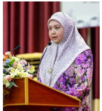
Her Royal Highness Princess Hajah Rashidah Sa'adatulk Bolkiah launching the Household Affairs Exhibition 2025.

Her Royal Highness Princess Hajah Rashidah Sa'adatulk Bolkiah then launched the event and presented tokens of appreciation to its participants, before touring the exhibition.