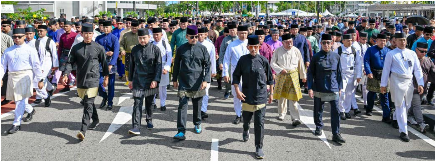
His Majesty the Sultan and Yang Di-Pertuan of Brunei Darussalam leading the procession to mark the national-level Maulidur Rasul Celebration for 1447 Hijrah/2025 Masihi. Also present were His Royal Highness Prince Haji Al-Muhtadee Billah, the Crown Prince and Senior Minister at the Prime Minister's Office; His Royal Highness Prince 'Abdul Malik; His Royal Highness Prince 'Abdul Mateen; His Royal Highness Prince Haji Sufri Bolkiah; and His Royal Highness Prince Haji Jefri Bolkiah.