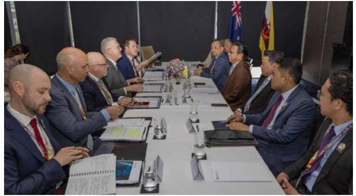
The Brunei Darussalam delegation during the bilateral meeting with His Excellency Minister of Home Affairs and Minister for Cyber Security of Australia.

He also shared Brunei's efforts to combat transnational crime,