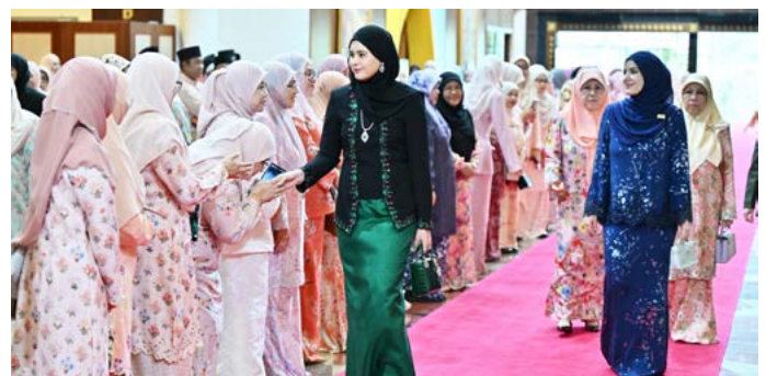
Her Royal Highness Paduka Seri Pengiran Anak Isteri Pengiran Anak Sarah binti Pengiran Haji Salleh Ab Rahaman at the Premier Lecture of the Knowledge Convention 2025. Also present was Yang Amat Mulia Pengiran Anak Isteri Anisha Rosnah binti Adam.