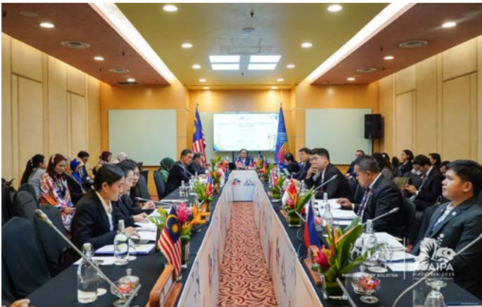
A Dialogue Session with 14 AIPA Observer Parliaments centred on the theme 'ASEAN Centrality: Catalysing an Inclusive Regional Architecture for a Sustainable Future' taking place.