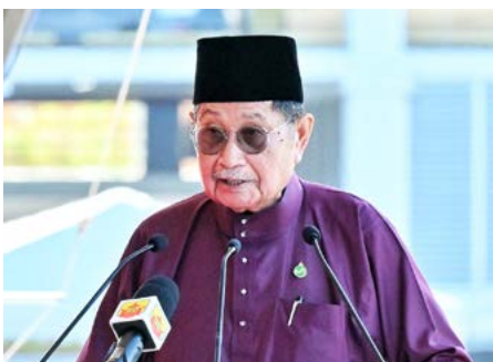
Yang Berhormat Minister of Religious Affairs delivering his welcoming remarks.

Earlier, on 4 th September, His Majesty the Sultan and Yang Di-Pertuan of Brunei Darussalam delivered a titah (royal speech) at Istana Nurul Iman, highlighting