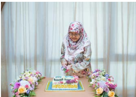
Her Royal Highness Princess Hajah Masna binti Al-Marhum Sultan Haji Omar 'Ali Saifuddien Sa'adul Khairi Waddien, Commandant of the Women Police at the Royal Brunei Police Force (RBPF) cutting a birthday cake (left); and in a group photo at the ceremony held in conjunction with Her Royal Highness Princess Hajah Masna's Birthday Celebration (right).