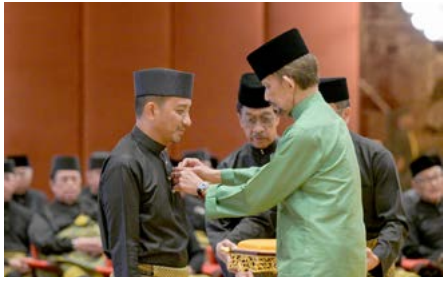
3. 36 receive State Decorations