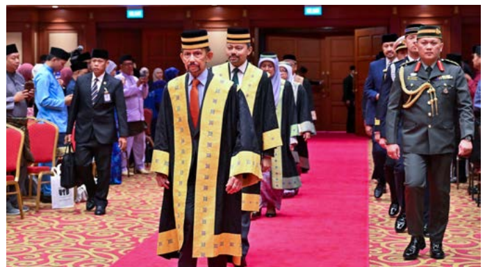
His Majesty Sultan Haji Hassanal Bolkiah Mu'izzaddin Waddaulah ibni Al-Marhum Sultan Haji Omar 'Ali Saifuddien Sa'adul Khairi Waddien, Sultan and Yang Di-Pertuan of Brunei Darussalam and Chancellor of Universiti Teknologi Brunei (UTB) at the 13 th UTB Convocation Ceremony. Accompanying His Majesty the Sultan and Yang Di-Pertuan of Brunei Darussalam was His Royal Highness Prince Haji Al-Muhtadee Billah, the Crown Prince and Senior Minister at the Prime Minister's Office as Pro-Chancellor of UTB.