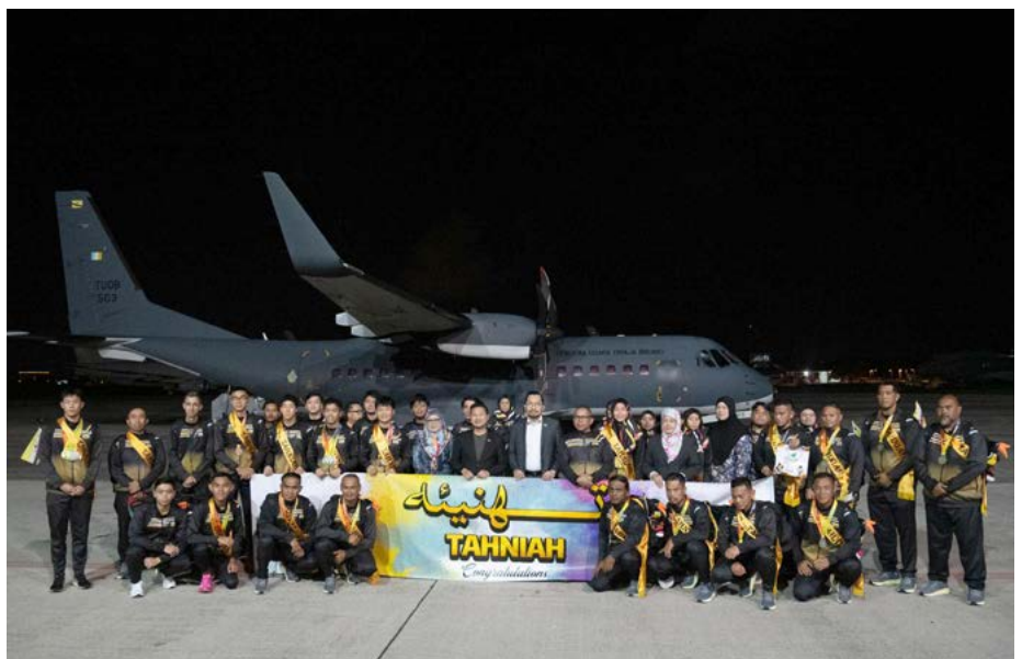
The Permanent Secretary (Culture) at the Ministry of Culture, Youth and Sports welcoming the arrival of the Brunei Darussalam contingent.