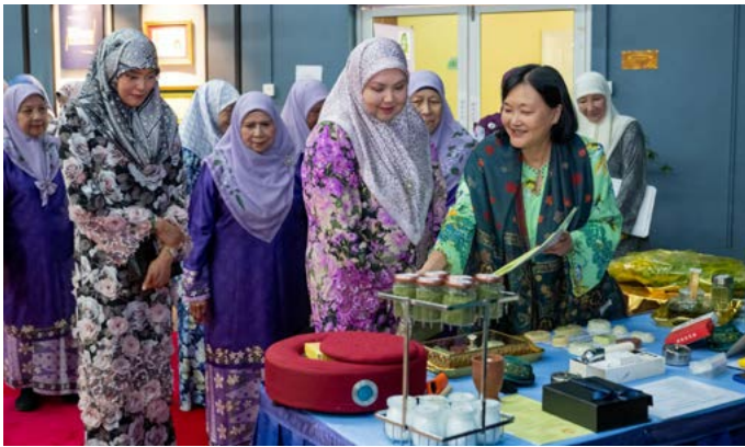
Her Royal Highness and other members of the royal family touring the exhibition.

Also in attendance were Her Royal Highness Princess Hajah Majeedah Nuurul Bolkiah binti His Majesty Sultan Haji Hassanal Bolkiah Mu'izzaddin Waddaulah; Her Royal Highness Paduka Seri Pengiran Anak Puteri Hajah Masna binti Al-Marhum Sultan Haji Omar 'Ali Saifuddien Sa'adul Khairi Waddien, Ambassador-at-Large at the Ministry of Foreign Affairs; and Her Royal Highness Princess Hajah Amal Umi Kalthum Al-Islam binti Al-Marhum Sultan Haji Omar 'Ali Saifuddien Sa'adul Khairi Waddien.