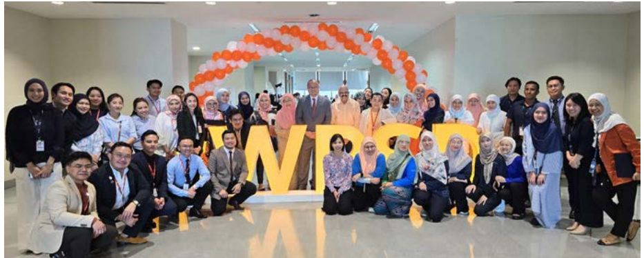
Yang Berhormat Minister of Health as the Executive Director of Jerudong Park Medical Centre in a group photo.

The Minister of Health added that the theme underscores the need for a multidisciplinary approach. The strategic integration of JPMC with the Pantai Jerudong Specialist Centre on 1 st