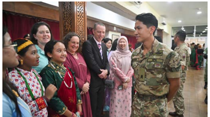
His Majesty and His Royal Highness Prince 'Abdul Mateen having a get-together with families of BFB personnel.