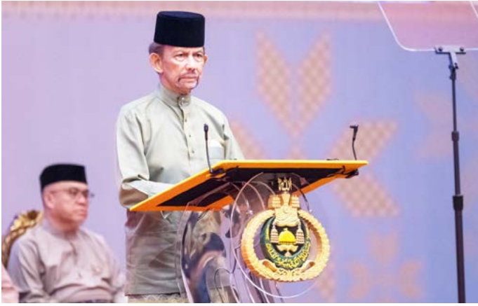
His Majesty Sultan Haji Hassanal Bolkiah Mu'izzaddin Waddaulah ibni Al-Marhum Sultan Haji Omar 'Ali Saifuddien Sa'adul Khairi Waddien, Sultan and Yang Di-Pertuan of Brunei Darussalam delivering a titah (royal speech) at the opening of the Knowledge Convention 2025.