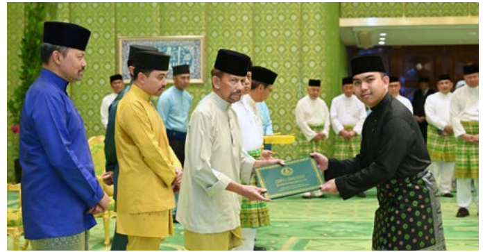
His Majesty Sultan Haji Hassanal Bolkiah Mu'izzaddin Waddaulah ibni Al-Marhum Sultan Haji Omar 'Ali Saifuddien Sa'adul Khairi Waddien, Sultan and Yang Di-Pertuan of Brunei Darussalam presenting scholarships to the recipients (above and below).