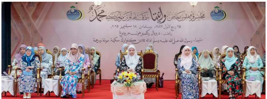
Her Royal Highness Princess Hajah Rashidah Sa'adatul Bolkiah binti His Majesty Sultan Haji Hassanal Bolkiah Mu'izzaddin Waddaulah gracing the Women's Special Assembly in conjunction with the Maulidur Rasul Celebration for 1447 Hijrah/2025 Masihi.