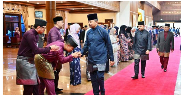
His Royal Highness Prince Haji Al-Muhtadee Billah ibni His Majesty Sultan Haji Hassanal Bolkiah Mu'izzaddin Waddaulah, the Crown Prince and Senior Minister at the Prime Minister's Office; and His Royal Highness Prince 'Abdul Malik at the Premier Forum of the Knowledge Convention 2025.