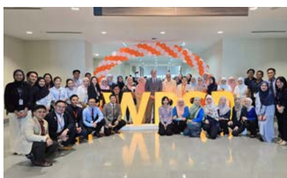
17. Quality healthcare critical for mothers, newborns