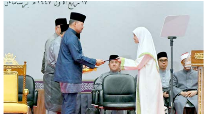
His Royal Highness the Crown Prince presenting Diploma 'Aliyah Qira'at certificates to graduates.