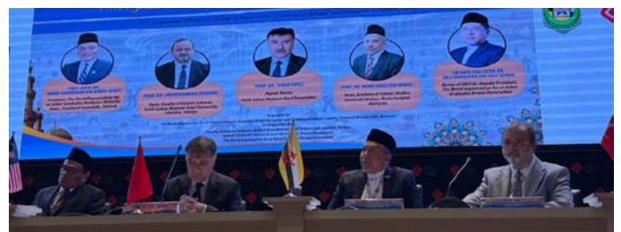
The Rector of Universiti Islam Sultan Sharif Ali at the conference.

The conference was organised by the Academy of Islamic Studies, Universiti Malaya, in collaboration with FSMVU; UNISSA; the International Alumni Association of Al-Azhar (Malaysia); and the International Alumni Association of Al-Azhar (Brunei Darussalam).