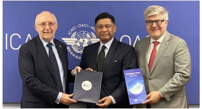
Yang Berhormat Minister of Transport and Infocommunications leading the Brunei Darussalam at the 42 nd Session of the Assembly of the International Civil Aviation Organization.

The Minister also held a series of bilateral meetings with key aviation leaders, including Salvatore Sciacchitano, President of the ICAO Council; Juan Carlos Salazar, Secretary General of ICAO; Yang Berhormat Datuk Haji Hasbi bin Haji Habibollah, Deputy Minister of Transport of Malaysia; His Excellency Mohamed bin Faleh Al-Hajri, Acting President of Qatar Civil Aviation Authority; and His Excellency Jeffrey Siow, Acting Minister of Transport of the Republic of Singapore.