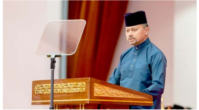
His Royal Highness the Crown Prince accompanied by His Royal Highness Prince 'Abdul Malik upon arrival at the ceremony (left); His Royal Highness the Crown Prince delivering a sabda (royal speech) (right).