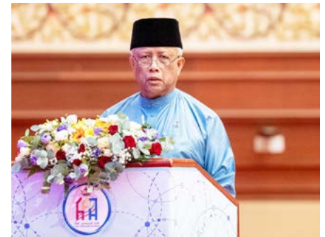
Yang Berhormat Minister at Prime Minister's Office and Second Minister of Defence delivering his welcoming remarks at the event.