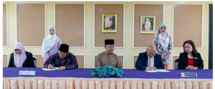
Permanent Secretary (Higher Education) at the Ministry of Education witnessing the signing of Memorandum of Understanding (MoU) between Institute of Brunei Technical Education (IBTE) and Curtin University Malaysia.