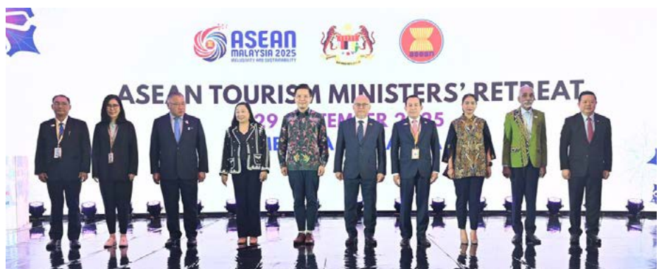
Yang Berhormat Minister of Primary Resources and Tourism in a group photo at the ASEAN Tourism Ministers' Retreat.

The retreat focused on building a sustainable, inclusive and resilient tourism