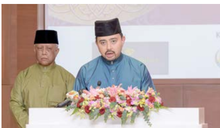
14. Launch of Sirah Rasulullah Exhibition