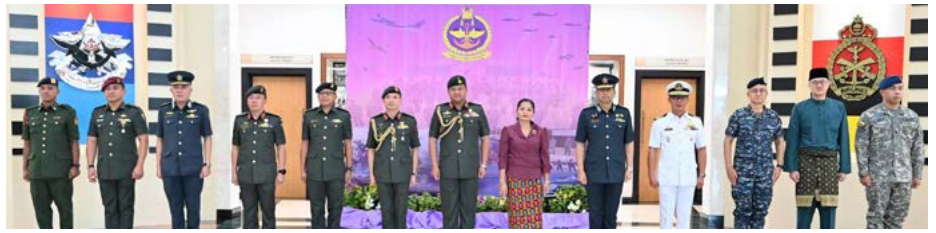
The Joint Force Commander of the Royal Brunei Armed Forces (RBAF) in a group photo at the ceremony. Also in attendance was the Commander of RBAF.