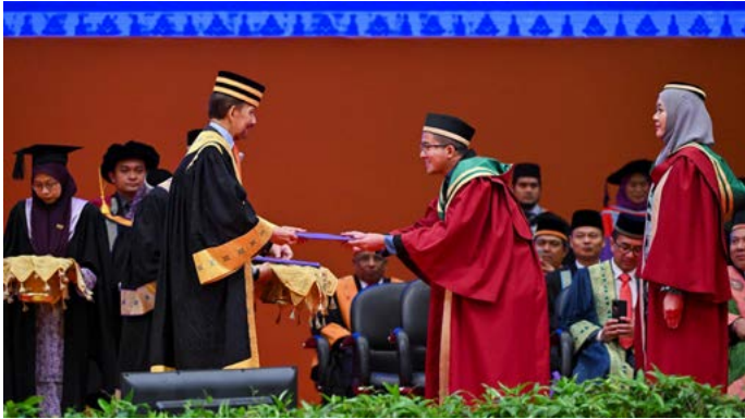
His Majesty presenting certificates to the graduates.