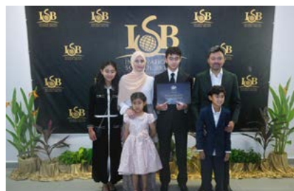
13. Recognition of student excellence at ISB Awards Ceremony