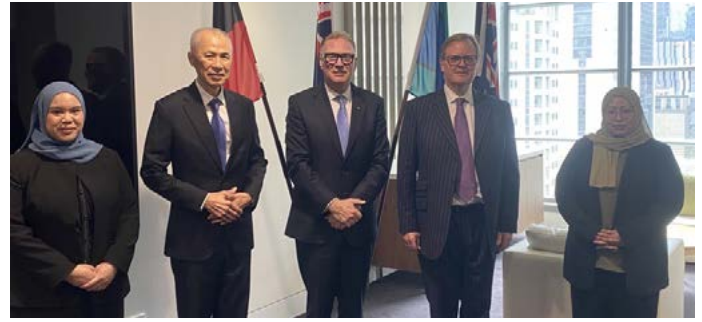
Yang Amat Arif Chief Justice of the Supreme Court and the delegation from the Judiciary of Brunei Darussalam during the visit.

During the visit, the chief justices discussed court and judicial administration, case management processes, court-connected mediation and the role of registrars, as well as initiatives to support self-represented litigants. The meeting also explored the Court's Family Dispute Resolution mechanisms, and the Family