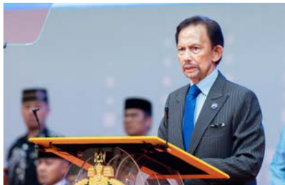
11. Call for unity, dedication in civil service