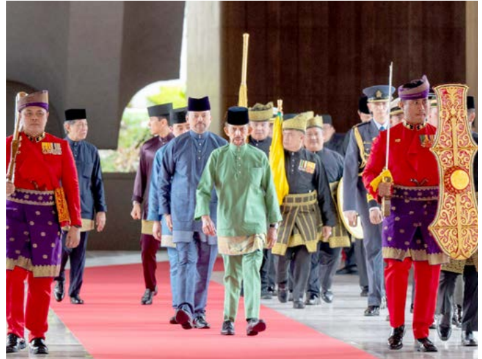
His Majesty Sultan Haji Hassanal Bolkiah Mu'izzaddin Waddaulah ibni Al-Marhum Sultan Haji Omar 'Ali Saifuddien Sa'adul Khairi Waddien, Sultan and Yang Di-Pertuan of Brunei Darussalam gracing the Audience and Investiture Ceremony.

A recipient from PMO and three others from MoRA also received The Most Eminent Order of Islam Brunei Fifth Class (P.U.B.).