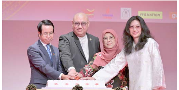
Yang Berhormat Minister of Culture, Youth and Sports representing the Government of His Majesty the Sultan and Yang Di-Pertuan of Brunei Darussalam at the reception.

The event concluded with a cake-cutting session, officiated by