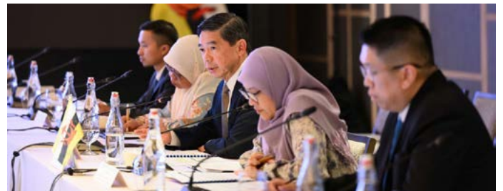
Yang Berhormat Minister at the Prime Minister's Office and Second Minister of Finance and Economy at the Inaugural Joint Committee Ministerial Meeting between Brunei Darussalam and the Republic of Singapore.

In his opening remarks, the Minister at PMO and Second Minister of Finance and Economy highlighted the importance of strengthening collaboration by leveraging advantages, and underscored multinational platforms as avenues for continued discussions. The Minister also noted that the collaboration enables both countries to review progress and set new directions for bilateral and regional cooperation. The Co-Chairs commended the Working Groups' steady progress, and supported expanding