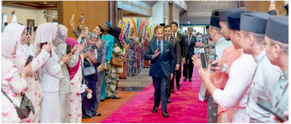
His Majesty Sultan Haji Hassanal Bolkiah Mu'izzaddin Waddaullah ibni Al-Marhum Sultan Haji Omar 'Ali Saifuddien Sa'adul Khairi Waddien, Sultan and Yang Di-Pertuan of Brunei Darussalam at the 35 th Teachers' Day Celebration 2025. Also in attendance at the celebration were His Majesty's sons and brothers.