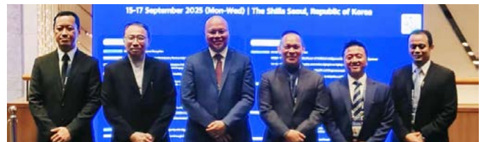
Yang Berhormat Minister of Health at the 15 th Asia-Pacific Economic Cooperation (APEC) High-Level Meeting on Health and the Economy; and the 4 th World Bio Summit.

Two strategic roadmaps were launched at the meeting: the Roadmap to Advance Dengue Prevention & Control in APEC Economies 2026-2030; and the Roadmap to Accelerate Cervical Cancer Elimination in APEC Economies 2026-2030. The meeting