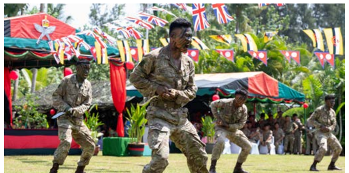
Performances held at the event.