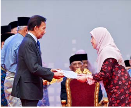
His Majesty Sultan Haji Hassanal Bolkiah Mu'izzaddin Waddaulah ibni Al-Marhum Sultan Haji Omar 'Ali Saifuddien Sa'adul Khairi Waddien, Sultan and Yang Di-Pertuan of Brunei Darussalam presenting awards to the recipients.