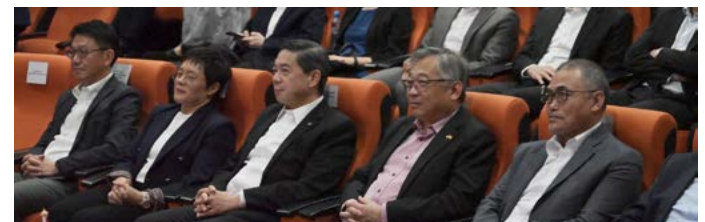
His Excellency Deputy Prime Minister and Minister for Trade and Industry of the Republic of Singapore; and Yang Berhormat Minister at the Prime Minister's Office and Second Minister of Finance and Economy during the visit.

Apart from a walkthrough of the BRE offices, the Deputy Prime Minister and Minister for Trade and Industry was briefed on ongoing and upcoming projects, including collaborations with