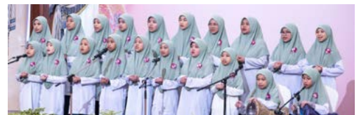
An Al-Quran recitation by the winner of the National Al-Quran Reading Competition for Youth in 2024 and 2025 (left); Dikir Marhaban performance by officers and staff from the Ministry of Finance and Economy; the Ministry of Culture, Youth and Sports; Bank Islam Brunei Darussalam; and the Council of Women Brunei Darussalam (centre); and selawat recitations by Year 5 and 6 students from Sekolah Arab Raja Isteri Pengiran Anak Damit (right).