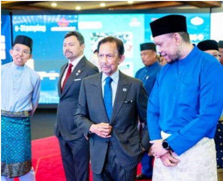
His Majesty the Sultan and Yang Di-Pertuan of Brunei Darussalam and members of the royal family touring the event's exhibition.