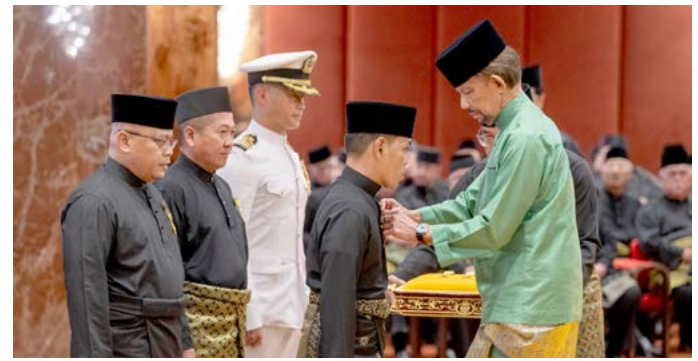
His Majesty the Sultan and Yang Di-Pertuan of Brunei Darussalam conferring Brunei Darussalam State Decorations upon the recipients (above and below).