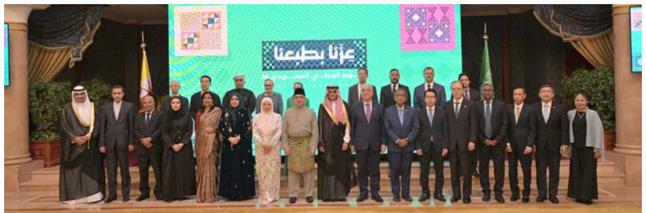
Yang Berhormat Minister of Development and spouse at the reception.

anthems, followed by an Al-Quran recitation and a video presentation. Yang Berhormat Minister of Development also received a gift from His Excellency