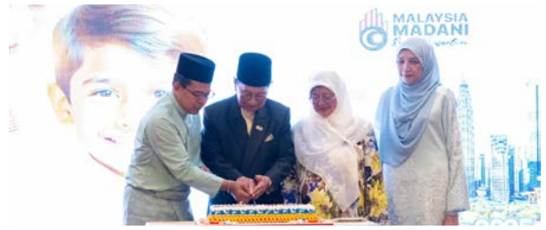
Yang Berhormat Minister of Religious Affairs and spouse during the cake-cutting session.

JERUDONG, 6 th September – Yang Berhormat Pehin Udana Khatib Dato Paduka Seri Setia Ustaz Awang Haji Badaruddin bin Pengarah Dato Paduka Awang Haji Othman, Minister of Religious Affairs, attended a reception hosted by the High Commission of Malaysia in Brunei Darussalam to celebrate Malaysia's 68 th National Day at the Royal Berkshire Hall, Tarindak D'Polo. Accompanied by his spouse, the Minister of Religious Affairs joined over 250 guests at the event, which featured national anthems, welcoming remarks by His Excellency Datuk Mohd. Aini Atan, High Commissioner of Malaysia to Brunei Darussalam, the presentation of mementos, and a cake-cutting ceremony.