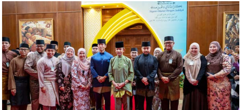
His Majesty the Sultan and Yang Di-Pertuan of Brunei Darussalam and members of the royal family having a get-together with the attendees of the event (above); and touring the exhibition (below).