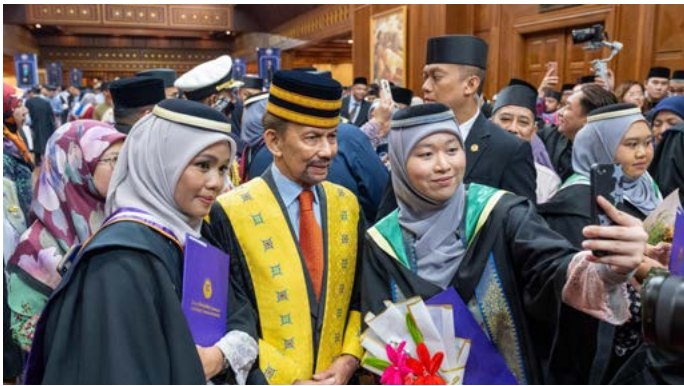
His Majesty and His Royal Highness the Crown Prince mingling with graduates.