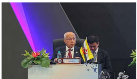
16. AIPA: Shaping ASEAN's future, adoption of 42 resolutions