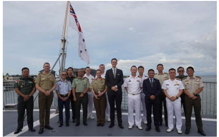
High Commissioner of Australia to Brunei Darussalam in a group photo with the Permanent Secretary at the Muara Naval Base, Brunei Darussalam.

IPE25 also includes engagements with the Democratic Republic of Timor-Leste; the People's Republic of Bangladesh; the Kingdom of Cambodia; the Republic of India; the Republic of Indonesia; the Lao People's Democratic Republic; Malaysia; the Republic of Maldives; the Republic of Singapore; the Republic