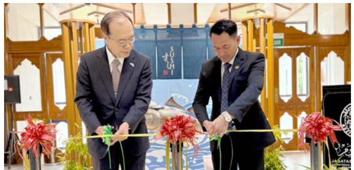
Acting Deputy Permanent Secretary (Policy and Corporate) at the Ministry of Education as the Guest of Honour; and His Excellency Ambassador Extraordinary and Plenipotentiary of Japan to Brunei Darussalam launching the exhibition.

The exhibition features traditional Japanese artworks, seafood