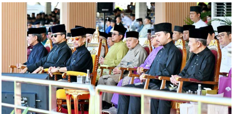
His Majesty and other members of the royal family at the event.