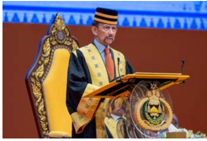
4. His Majesty launches UTB Mushaf