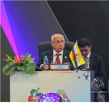
Yang Berhormat Speaker of the Legislative Council at the 46 th General Assembly of the ASEAN Inter-Parliamentary Assembly (AIPA).