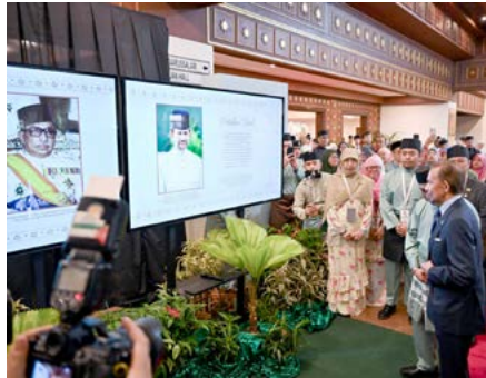
His Majesty touring the exhibition and mingling with the people at the event.