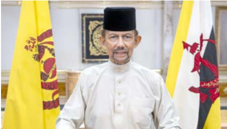
6. Shaping noble individuals, thousands join Maulidur Rasul procession