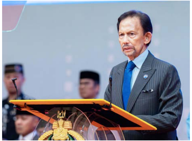
His Majesty Sultan Haji Hassanal Bolkiah Mu'izzaddin Waddaulah ibni Al-Marhum Sultan Haji Omar 'Ali Saifuddien Sa'adul Khairi Waddien, Sultan and Yang Di-Pertuan of Brunei Darussalam delivering a titah (royal speech) at the 32 nd Civil Service Day celebration.