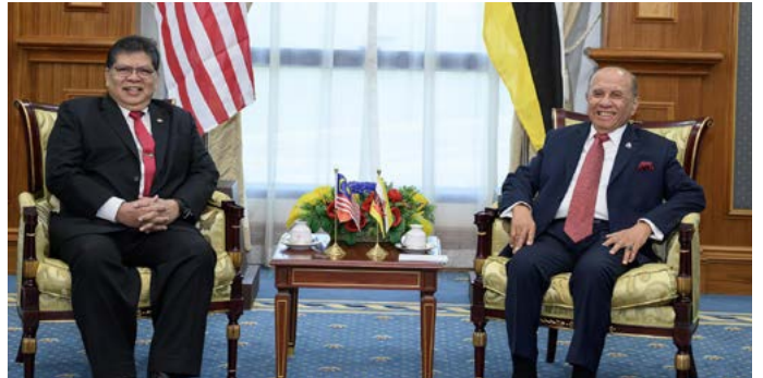
Yang Berhormat Speaker of the Legislative Council (LegCo) with Yang Berhormat Speaker of the House of Representatives of the Malaysian Parliament during the courtesy visit.