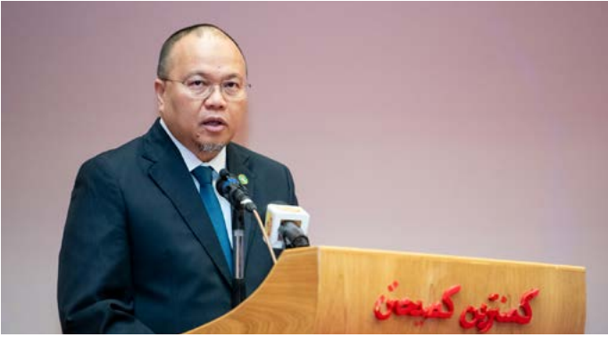
Yang Berhormat Minister of Health delivering his speech at the Launching Ceremony of 2025 National Cervical Cancer Prevention and Control Guidelines.