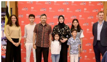
11. HRH attends screening of 'Paddington in Peru'