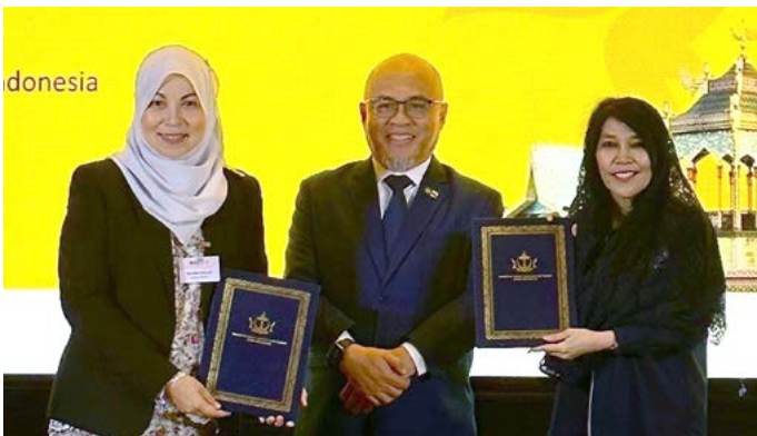
Yang Berhormat Minister of Primary Resources and Tourism leading the Brunei Darussalam delegation at the networking session.