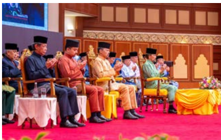
9. Khusyuk : The key to the perfection in prayer