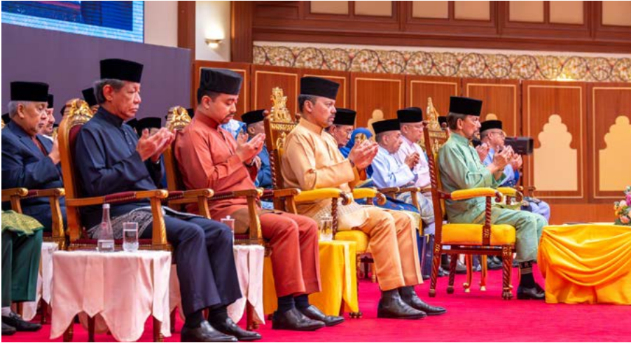
His Majesty Sultan Haji Hassanal Bolkiah Mu'izzaddin Waddaulah ibni Al-Marhum Sultan Haji Omar 'Ali Saifuddien Sa'adul Khairi Waddien, Sultan and Yang Di-Pertuan of Brunei Darussalam at the National Israk and Mikraj Celebration. Also present were His Royal Highness Prince Haji Al-Muhtadee Billah, the Crown Prince and Senior Minister at the Prime Minister's Office; His Royal Highness Prince 'Abdul Malik; and His Royal Highness Prince Haji Jefri Bolkiah.