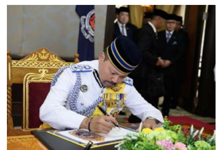
His Majesty and His Royal Highness signing the Commemorative Parchment.