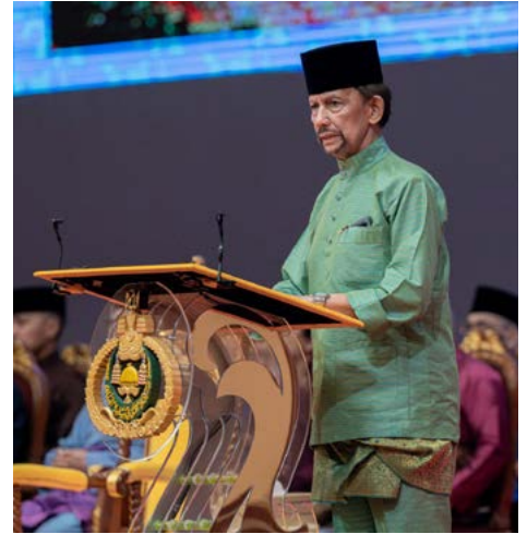
His Majesty the Sultan and Yang Di-Pertuan of Brunei Darussalam delivering a titah (royal speech) at the National Israk and Mikraj Celebration for the year 1446 Hijrah.

BERAKAS, 27 th January – His Majesty Sultan Haji Hassanal Bolkiah Mu'izzaddin Waddaulah ibni Al-Marhum Sultan Haji Omar 'Ali Saifuddien Sa'adul Khairi Waddien, Sultan and Yang Di-Pertuan of Brunei Darussalam, attended the National Israk and Mikraj Celebration for the year 1446 Hijrah, held at the Plenary Hall of the International Convention Centre.