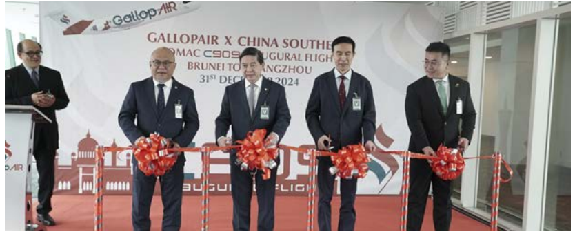
Yang Berhormat Minister at the Prime Minister's Office and Second Minister of Finance and Economy and Yang Berhormat Minister of Primary Resources and Tourism during the ribbon-cutting ceremony at the event.

Guests were also invited to view and tour the C909 aircraft.