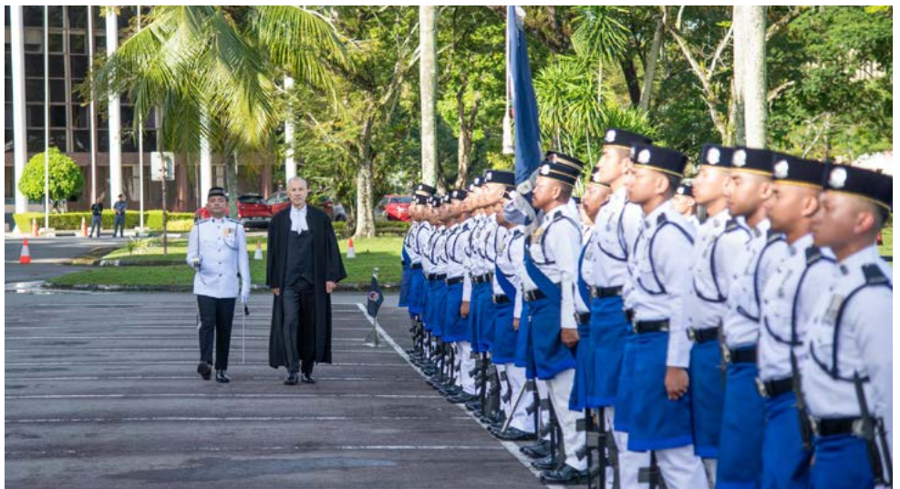
Yang Amat Arif Chief Justice inspecting the Guard of Honour Parade comprised of the Royal Brunei Police Force.

Lastly, in July 2024, a briefing on insolvency and restructuring was held, featuring insights from Judge Kannan Ramesh of the Singapore High Court. The session focused on Singapore's evolving insolvency and restructuring regime.