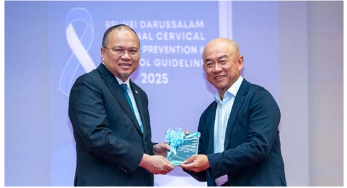
Yang Berhormat Minister of Health presenting the National Cervical Cancer Prevention and Control Guidelines Book 2025.

BERAKAS, 15 th January – Cervical cancer is the fourth most common cancer among women worldwide. In Brunei Darussalam, from 2019 to 2023, a total of 127 women were diagnosed with cervical cancer, with between 23 to 32 cases per year, and a total of 51 deaths during the same period.