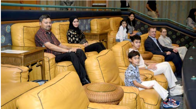
His Royal Highness Prince Haji Al-Muhtadee Billah ibni His Majesty Sultan Haji Hassanal Bolkiah Mu'izzaddin Waddaulah, the Crown Prince and Senior Minister at the Prime Minister's Office and Her Royal Highness Paduka Seri Pengiran Anak Isteri Pengiran Anak Sarah binti Pengiran Haji Salleh Ab. Rahaman along with Their Royal Highnesses' children at the premiere screening.