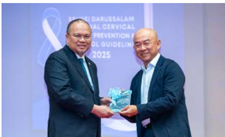
14. Early treatment prevents cervical cancer, improves survival