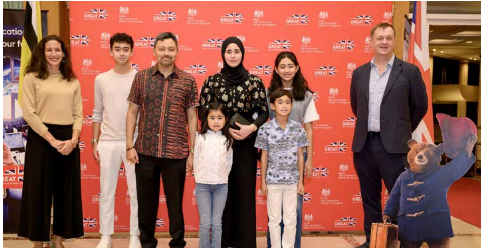
His Royal Highness Prince Haji Al-Muhtadee Billah ibni His Majesty Sultan Haji Hassanal Bolkiah Mu'izzaddin Waddaulah, the Crown Prince and Senior Minister at the Prime Minister's Office, and Her Royal Highness Paduka Seri Pengiran Anak Isteri Pengiran Anak Sarah binti Pengiran Haji Salleh Ab. Rahaman at the premiere screening of the film 'Paddington in Peru'. Also present were Their Royal Highnesses' children.

Present at the premiere screening were His Royal Highness Prince Haji Al-Muhtadee Billah ibni His Majesty Sultan Haji Hassanal Bolkiah Mu'izzaddin Waddaulah, the Crown Prince and Senior Minister at the Prime Minister's Office, and Her Royal Highness Paduka Seri Pengiran Anak Isteri Pengiran Anak Sarah binti Pengiran Haji Salleh Ab. Rahaman.