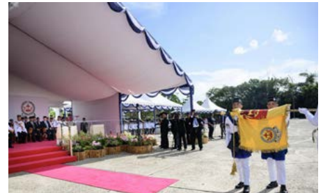
The ceremony taking place (above and below)