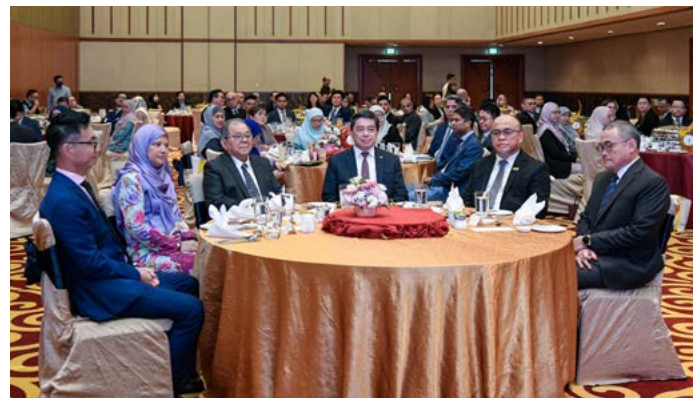
Yang Berhormat Minister of Primary Resources and Tourism, and Yang Berhormat Attorney General at the event.