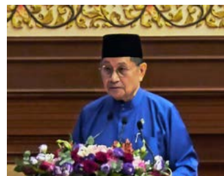
Yang Berhormat Minister of Religious Affairs delivering his welcoming speech.