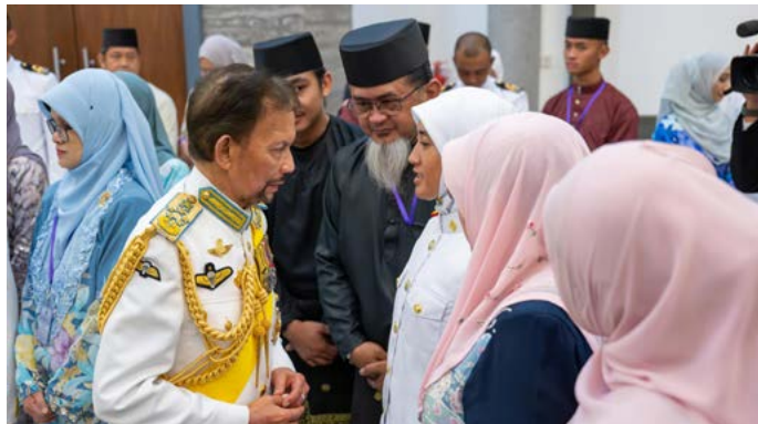
His Majesty with officer cadets and their family members during the junjung ziarah (meet and greet) session.