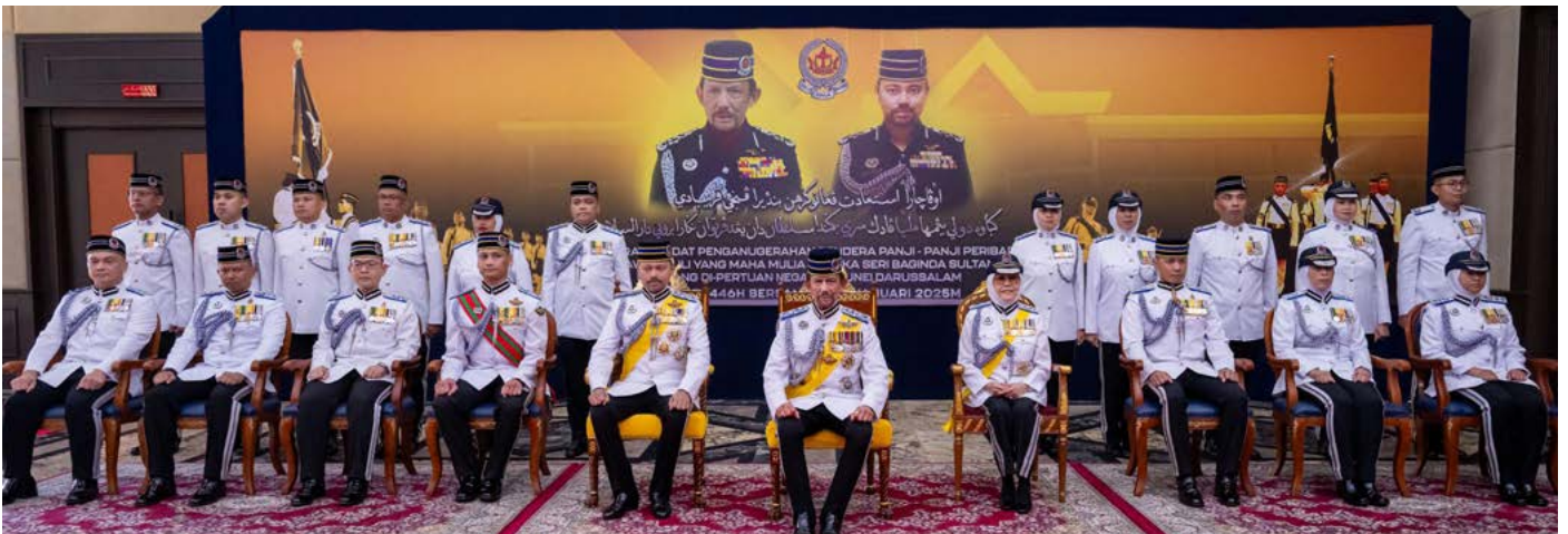
His Majesty the Sultan and Yang Di-Pertuan of Brunei Darussalam with His Royal Highness the Crown Prince and Her Royal Highness Princess Hajah Masna in a group photo.