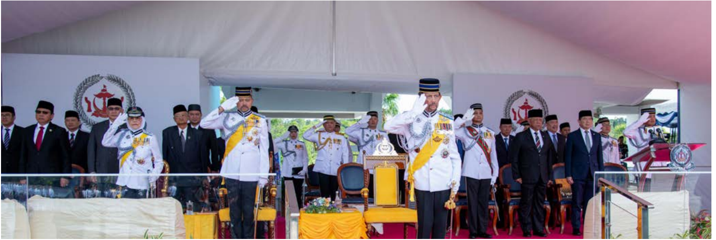
His Majesty Sultan Haji Hassanal Bolkiah Mu'izzaddin Waddaulah ibni Al-Marhum Sultan Haji Omar 'Ali Saifuddien Sa'adul Khairi Waddien, Sultan and Yang Di-Pertuan of Brunei Darussalam at the Bestowment of the Personal Ensign Flag of His Majesty the Sultan and Yang Di-Pertuan of Brunei Darussalam Ceremony. Also in attendance were His Royal Highness Prince Haji Al-Muhtadee Billah, the Crown Prince and Senior Minister at the Prime Minister's Office (PMO) and Her Royal Highness Princess Hajah Masna, Commandant of the Women Police.