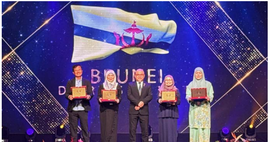
Brunei Darussalam proudly celebrates the achievements of its tourism industry, with several prestigious awards presented to local recipients.

Additionally, the 'Premium Toilet' at the