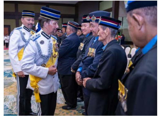
His Majesty and His Royal Highness during the junjung ziarah (meet and greet).