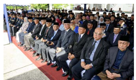
Among those present at the event.