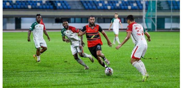
Among the spectators at the match (left), the match taking place (right).