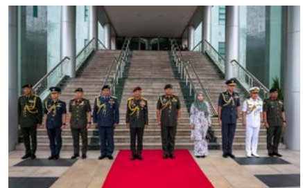
13. Farewell visit from Chief of MAF