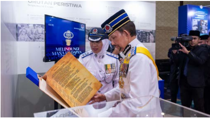
His Majesty Sultan Haji Hassanal Bolkiah Mu'izzaddin Waddaulah ibni Al-Marhum Sultan Haji Omar 'Ali Saifuddien Sa'adul Khairi Waddien, Sultan and Yang Di-Pertuan of Brunei Darussalam attending the Police Exhibition at the Mess Banquet Hall.