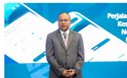
15. BruHealth 5.0: Enhance personal care, optimise resource usage