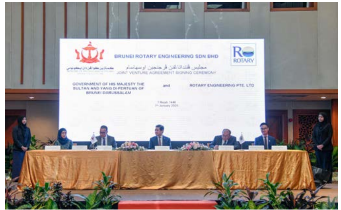
Yang Berhormat Minister witnessing the signing of the Joint Venture Agreement with Rotary Engineering Pte. Ltd. (Rotary).

JERUDONG, 7 th January – The Government of His Majesty the Sultan and Yang Di-Pertuan of Brunei Darussalam, through the Strategic Development Capital Fund (SDC Fund), Investment Division, Ministry of Finance and Economy (MoFE), has signed a Joint Venture Agreement with Rotary Engineering Pte. Ltd. (Rotary), a company headquartered in the Republic of Singapore, to establish a joint venture providing Maintenance, Engineering, Procurement, Construction, and Commissioning (EPCC) services in Brunei Darussalam.