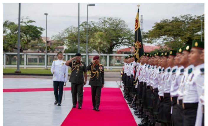
Official ceremony during the farewell visit from Yang Berbahagia Chief of the Malaysian Armed Forces (MAF) (all above and left).

Upon arrival at Bolkiah Garrison, an official ceremony was held, during which the Chief of MAF was welcomed by the Commander of RBAF and received a Salute of Honour from the Honour Guard, comprising members of the Royal Brunei Land Force (RBLF).