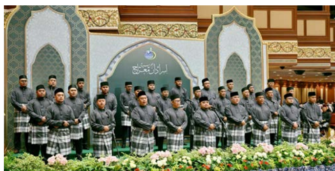
Performance of Selawat Tafrijiyyah and Ibrahimiyah.