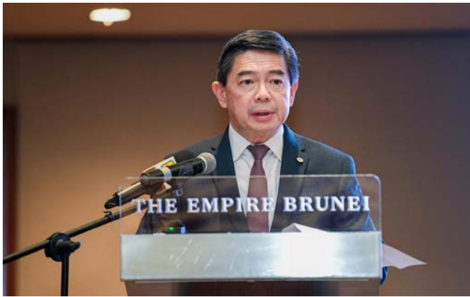
Yang Berhormat Minister at the Prime Minister's Office (PMO) and Second Minister of Finance and Economy delivering a speech.