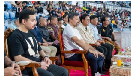
11. Brunei DPMM FC, Kuching City FC draw 1-1