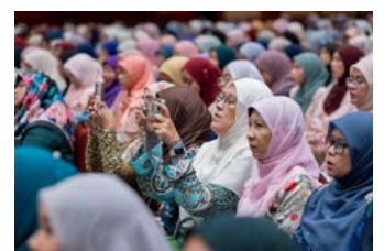
Among those present at the event.