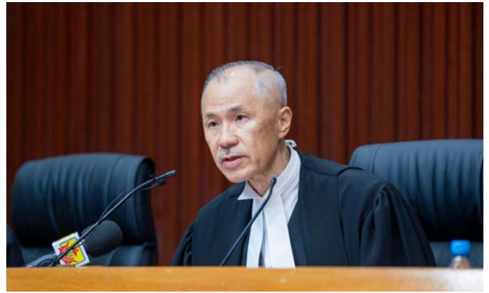
Yang Amat Arif Chief Justice of the Supreme Court delivering a speech during the Opening Ceremony of the 2025 Legal Year.