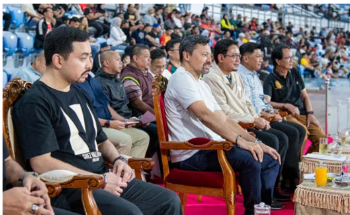
His Royal Highness Prince Haji Al-Muhtadee Billah ibni His Majesty Sultan Haji Hassanal Bolkiah Mu'izzaddin Waddaulah, the Crown Prince and Senior Minister at the Prime Minister's Office during the match between Brunei DPMM FC against Kuching City FC held at the Hassanal Bolkiah National Stadium. Also present was His Royal Highness Prince 'Abdul Malik.

BERAKAS, 4 th January – Brunei DPMM FC drew 1-1 against Kuching City FC in a friendly football match at the Hassanal Bolkiah National Stadium.