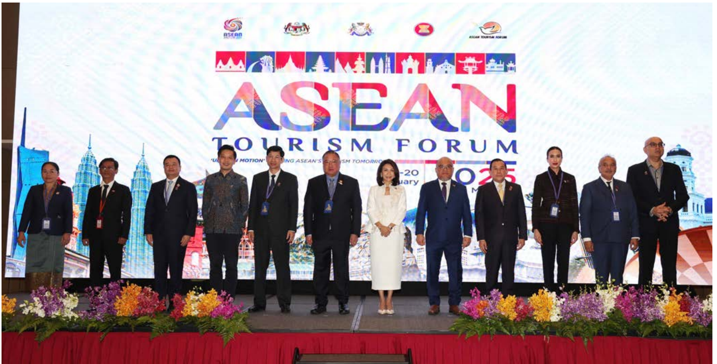
Yang Berhormat Minister of Primary Resources and Tourism in a group photo at the ASEAN Tourism Forum 2025 (ATF 2025).

JOHOR, MALAYSIA, 20 th January – The 28 th Meeting of ASEAN Tourism Ministers (M-ATM) and related meetings, in conjunction with the ASEAN Tourism Forum 2025 (ATF 2025), took place from 16 th to 20 th January. The delegation from Brunei Darussalam was led by Yang Berhormat Dato Seri Setia Dr. Awang Haji Abdul Manaf bin Haji Metussin, Minister of Primary Resources and Tourism.