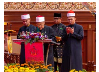
Yang Berhormat State Mufti reciting the doa selamat .