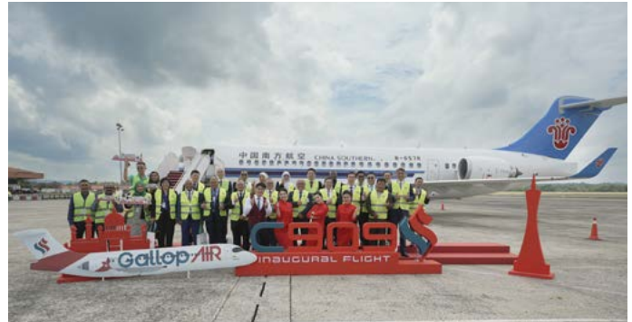
Yang Berhormat Ministers in a group photo.