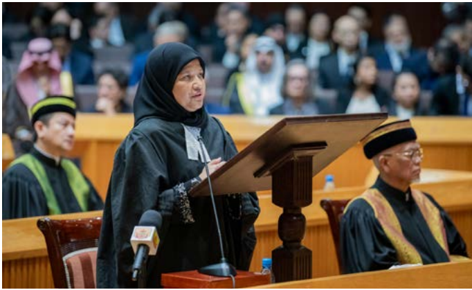
Yang Berhormat Attorney General delivering her speech at the Opening Ceremony of the 2025 Legal Year.