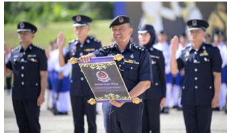
Recitation of the Royal Brunei Police Force (RBPF) oath by all members of the force present.

Also present at the ceremony were Yang Berhormat Minister at PMO and Second Minister of Defence, and Yang Berhormat Minister at PMO and Second Minister of Finance and Economy.