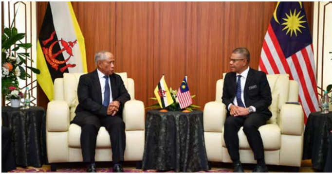
Yang Berhormat Minister at the Prime Minister's Office (PMO) and Second Minister of Defence with Yang Amat Berhormat Minister of Home Affairs of Malaysia (left), and at the Asia International Security Summit and Expo 2025 (AISSE '25) and the Cybercrime Prevention Summit 2025 (right).