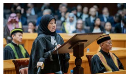
20. Collective effort in upholding the rule of law