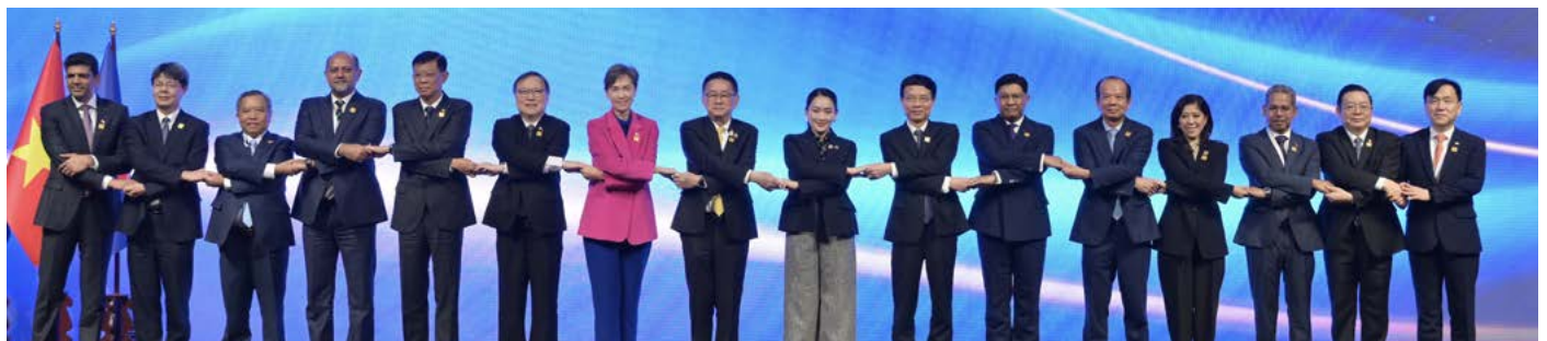
Yang Berhormat Minister of Transport and Infocommunications representing Brunei Darussalam at the 5 th ASEAN Digital Ministers' Meeting (ADGMIN) and related meetings.

BANGKOK, KINGDOM OF THAILAND, 18 th January – Yang Berhormat Pengiran Dato Seri Setia Shamhary bin Pengiran Dato Paduka Haji Mustapha, Minister of Transport and Infocommunications, attended the 5 th ASEAN Digital Ministers' Meeting (ADGMIN) and related meetings from 16 th to 17 th January.