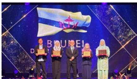
19. Brunei achieves excellence at The ASEAN Tourism Standards