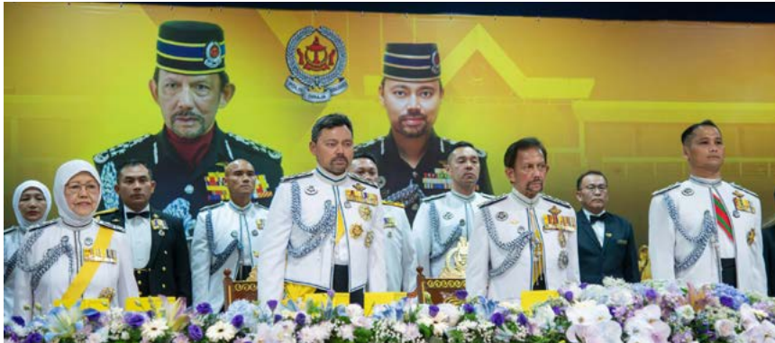
His Majesty and other members of royal family at the Royal Banquet (above and below).