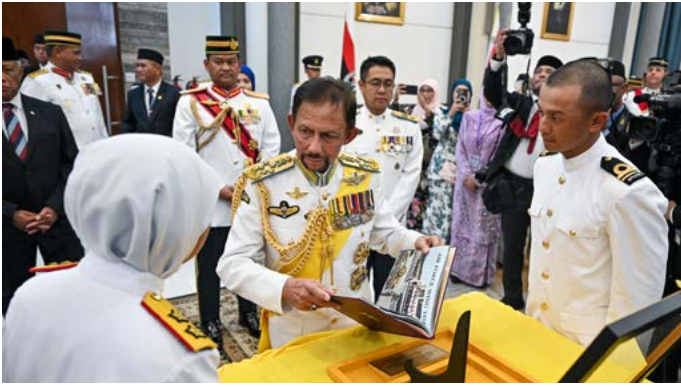
His Majesty Sultan receiving pesambah (souvenir) from officer cadets.