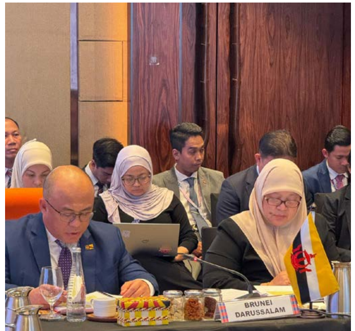
Yang Berhormat Minister during the ASEAN Tourism Forum.

The meeting also emphasised the importance of sustainable tourism for economic growth, cultural preservation, and environmental conservation, and encouraged private sector involvement in social responsibility, job creation, and supporting Small and Medium Enterprises within the tourism industry.