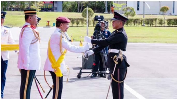
His Majesty presenting awards to the recipients (above and below).