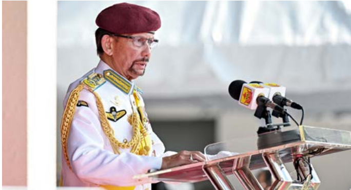
His Majesty the Sultan and Yang Di-Pertuan of Brunei Darussalam delivering a titah (royal speech) at the Sovereign's Parade Ceremony for the 23 rd Intake of the Officer Cadet School (OCS).

However, His Majesty the Sultan and Yang Di-Pertuan of Brunei Darussalam stressed that higher education alone is insufficient. His Majesty highlighted the importance of exposure to complex military operations including Integrated Operations with Brunei's security agencies; Humanitarian Assistance and Disaster Relief (HADR) missions; and Peacekeeping Operations under the United Nations Interim Force in Lebanon (UNIFIL).