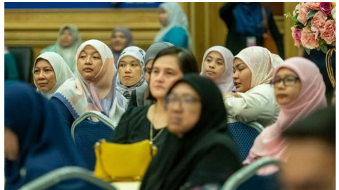
Some of the attendees at the launching event.

The HPV genomic test can also help plan more precise cancer treatments based on the tumour's genetic profile, maximising