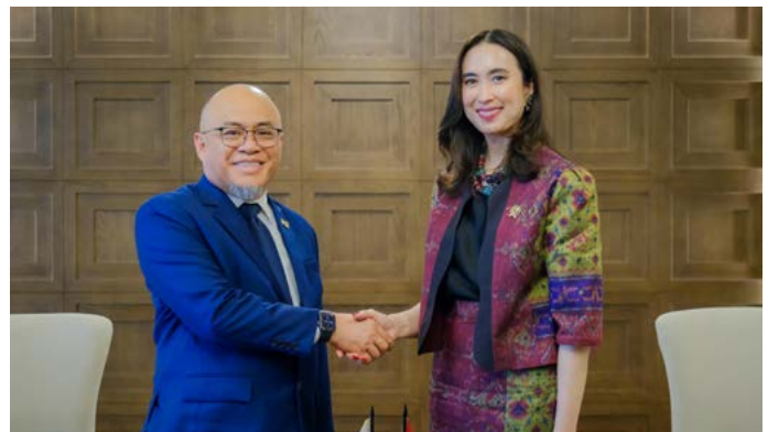
Yang Berhormat Minister with Her Excellency Minister of Tourism of the Republic of Indonesia.

JAKARTA, REPUBLIC OF INDONESIA, 14 th January – The Ministry of Primary Resources and Tourism (MPRT) of Brunei Darussalam, in collaboration with the Embassy of Brunei Darussalam in Jakarta and the Indonesian Travel Agent Association (ASITA), organised a networking session to strengthen ties and explore collaboration opportunities between travel agencies from both countries.