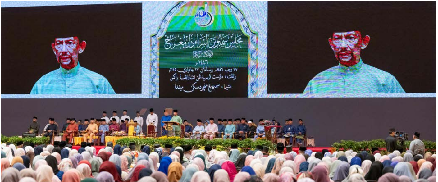
His Majesty Sultan Haji Hassanal Bolkiah Mu'izzaddin Waddaulah ibni Al-Marhum Sultan Haji Omar 'Ali Saifuddien Sa'adul Khairi Waddien, Sultan and Yang Di-Pertuan of Brunei Darussalam delivering a titah (royal speech) at the National Israk and Mikraj Celebration for the year 1446 Hijrah.