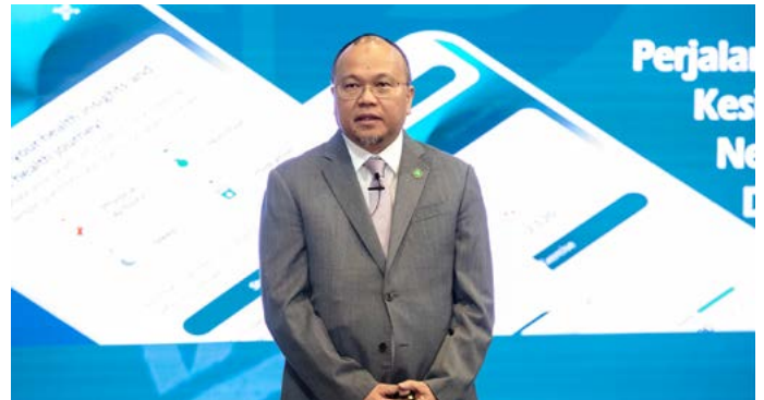
Yang Berhormat Minister of Health delivering a speech during the launch of BruHealth Version 5.0.

The Minister also mentioned that the BN on the Move challenge would be bigger and more exciting this year, and the Ministry of Health encourages the nation to stay active and continue tracking their steps.