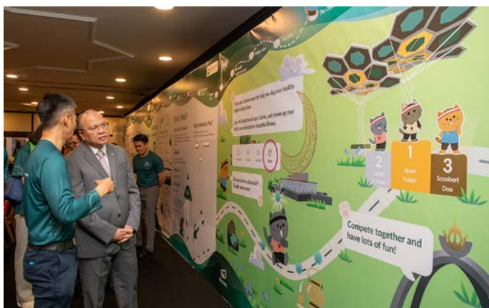
Yang Berhormat Minister touring the exhibition.

Initiatives like the BN on the Move National Challenge have promoted a healthy lifestyle, with the people collectively achieving 80 billion steps.