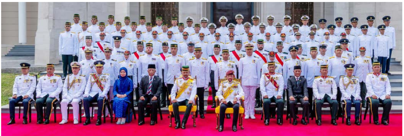
His Majesty and His Royal Highness Prince Haji Al-Muhtadee Billah, the Crown Prince and Senior Minister at the Prime Minister's Office in a group photo.