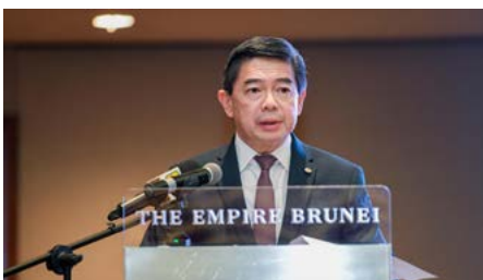
16. Joint venture to support economic diversification