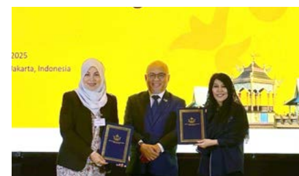
17. Explore collaboration opportunities