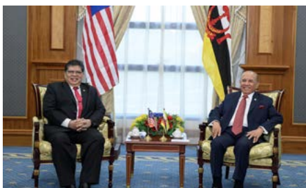
12. Speaker of LegCo receives Malaysian Parliament