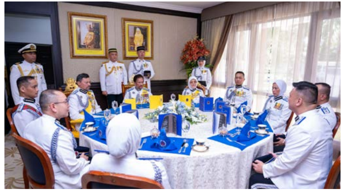
His Majesty the Sultan and Yang Di-Pertuan of Brunei Darussalam and other members of the royal family during the Luncheon.