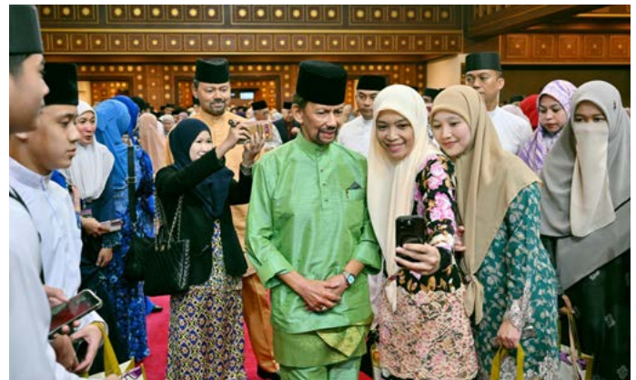
His Majesty during the junjung ziarah (meet and greet) (above and below).