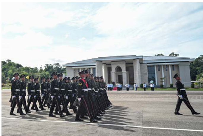
The officer cadets during a march-past.

At the ceremony, His Majesty commissioned 52 officer cadets as military officers.