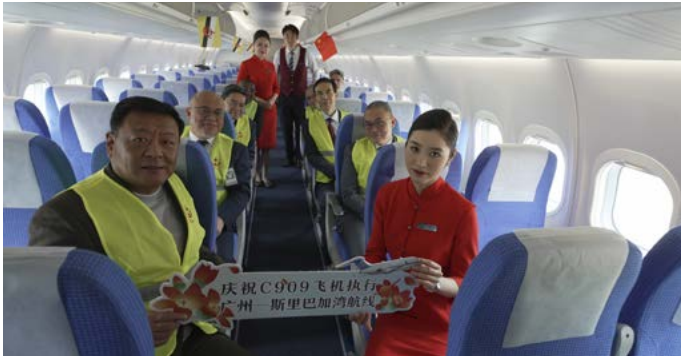
Yang Berhormat Ministers as the Guests of Honour at the event.