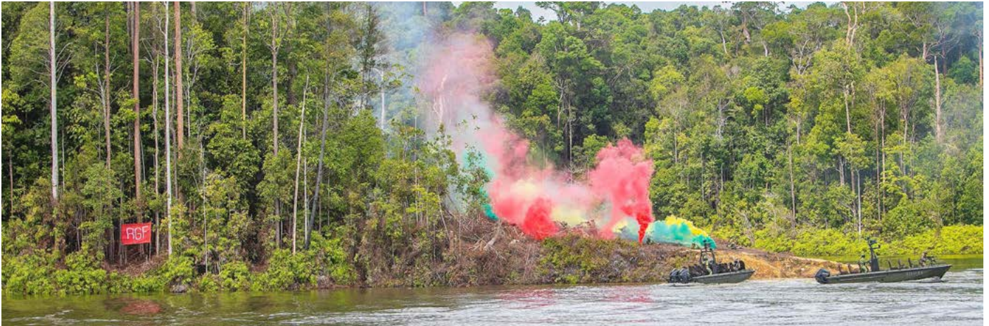
The Jungle Warfare Demonstration taking place (above and below).