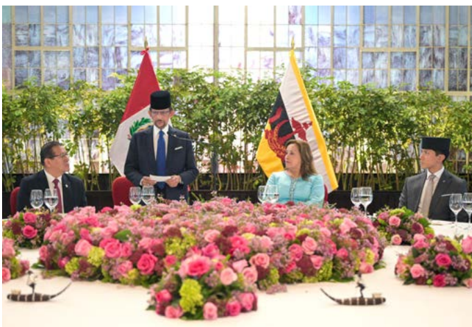
His Majesty delivering a titah (royal speech). Also present was His Royal Highness Prince 'Abdul Mateen.

Accompany His Majesty to the events was His Royal Highness Prince 'Abdul Mateen.