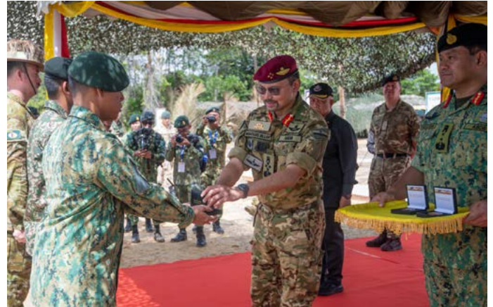
His Royal Highness the Crown Prince touring the exhibition (left); and presenting awards to the participants (right).