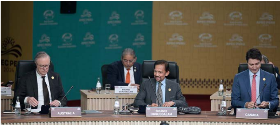
His Majesty Sultan Haji Hassanal Bolkiah Mu'izzaddin Waddaulah ibni Al-Marhum Sultan Haji Omar 'Ali Saifuddien Sa'adul Khairi Waddien, Sultan and Yang Di-Pertuan of Brunei Darussalam during the APEC Leaders' Informal Dialogue with guests.

LIMA, REPUBLIC OF PERU, 15 th November - His Majesty Sultan Haji Hassanal Bolkiah Mu'izzaddin Waddaulah ibni Al-Marhum Sultan Haji Omar 'Ali Saifuddien Sa'adul Khairi Waddien, Sultan and Yang Di-Pertuan of Brunei Darussalam attended the APEC Leaders' Informal Dialogue at the Lima Convention Centre (LCC).