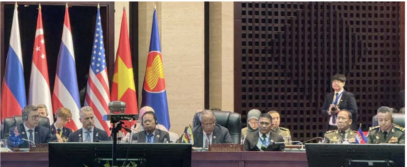
Yang Berhormat Minister at the Prime Minister's Office and Second Minister of Defence at the 11 th ASEAN Defence Ministers' Meeting Plus.

VIENTIANE, LAO PEOPLE'S DEMOCRATIC REPUBLIC, 21 st November - The 11 th ASEAN Defence Ministers' Meeting Plus (11 th ADMM-Plus) was chaired by His Excellency General Chansamone Chanyalath, the Deputy Prime Minister and Minister of National Defence of Lao People's Democratic Republic (Lao PDR).