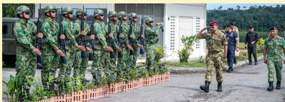
His Royal Highness Prince Haji Al-Muhtadee Billah ibni His Majesty Sultan Haji Hassanal Bolkiah Mu'izzaddin Waddaulah, the Crown Prince and Senior Minister at the Prime Minister's Office at the Jungle Warfare Demonstration as part of the Regional Jungle Warfare Symposium (RJWS) 2024.

BELAIT, 26 th November - His Royal Highness Prince Haji Al-Muhtadee Billah ibni His Majesty Sultan Haji Hassanal Bolkiah Mu'izzaddin Waddaulah, the Crown Prince and Senior Minister at the Prime Minister's Office (PMO), attended the Jungle Warfare Demonstration as part of the Regional Jungle Warfare Symposium (RJWS) 2024 at Kargu Dam, Andulau Forest Reserve.