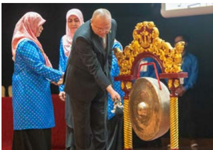
19. Leverage technological advancements in healthcare