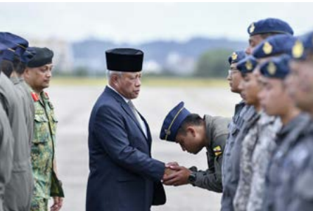
17. BADAI TADUH Operation contingent safely returns