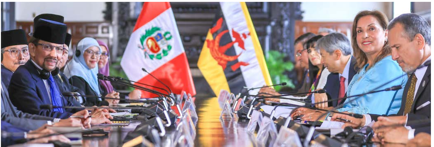
His Majesty and Her Excellency President during the bilateral meeting.