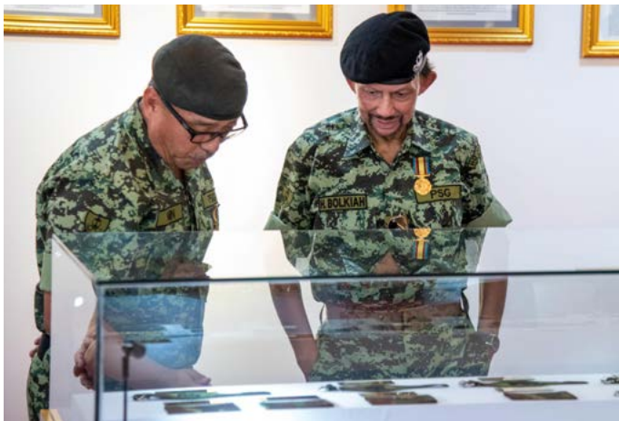
His Majesty being briefed while touring the gallery.