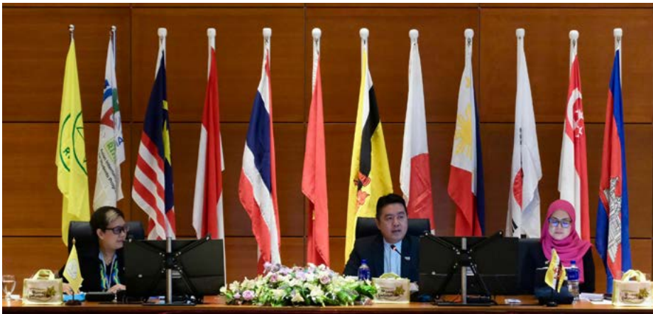
Permanent Secretary (Higher Education) Ministry of Education at the 9 th Steering Committee Meeting for the Asia International Mobility for Students (AIMS) Programme.

BANDAR SERI BEGAWAN, 6 th November - The Ministry of Education of Brunei Darussalam hosted the 9 th Steering Committee Meeting of Asian International Mobility for Students (AIMS)