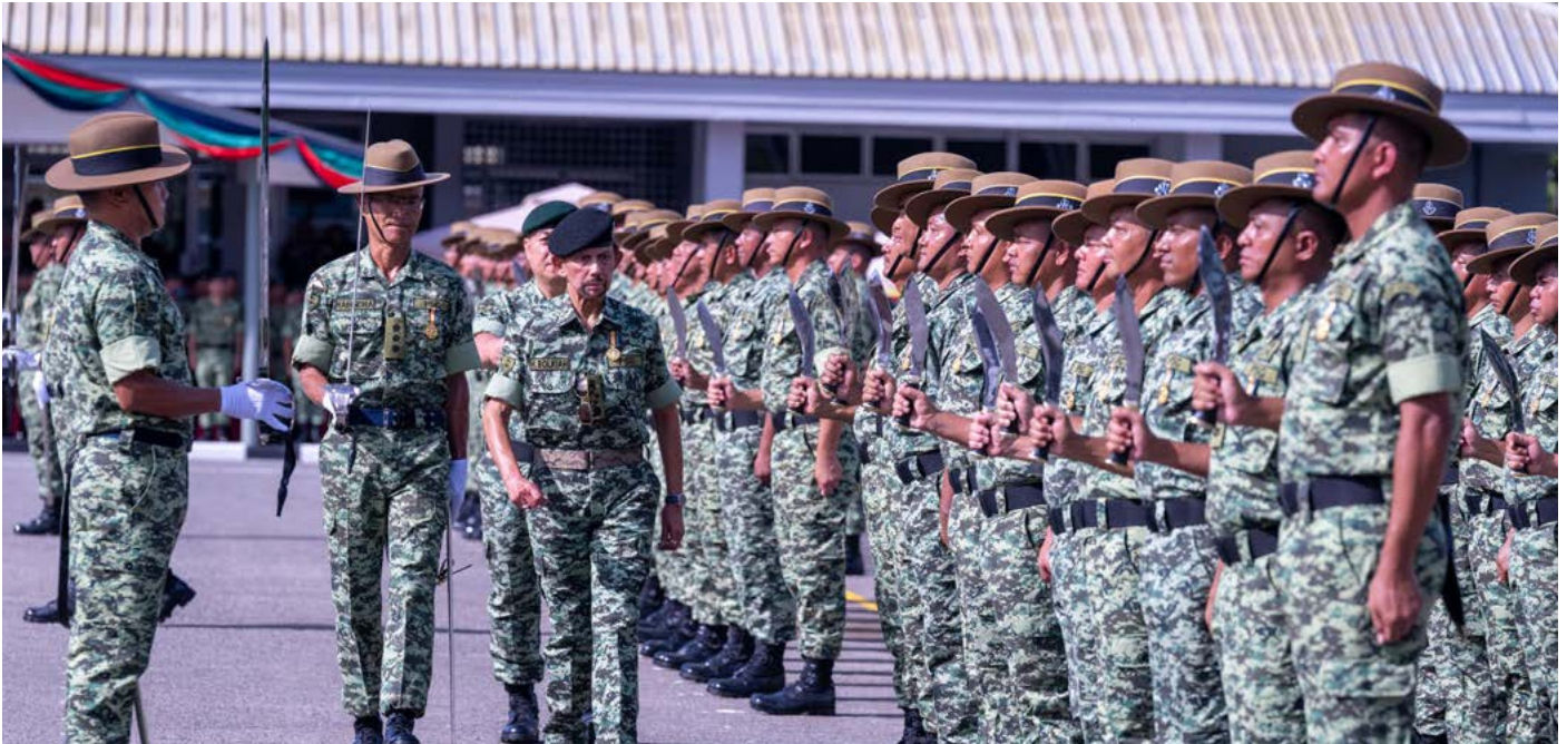
His Majesty Sultan Haji Hassanal Bolkiah Mu'izzaddin Waddaulah ibni Al-Marhum Sultan Haji Omar 'Ali Saifuddien Sa'adul Khairi Waddien, Sultan and Yang Di-Pertuan of Brunei Darussalam inspecting the Guard of Honour.