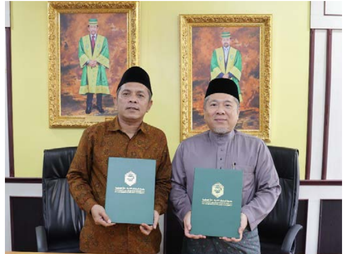
MoU between UNISSA and Universitas Islam Negeri Siber Syekh Nurjati Cirebon.

BANDAR SERI BEGAWAN, 2 nd November – Universiti Islam Sultan Sharif Ali (UNISSA) has welcomed a visit from Hadhramout University, Yemen, resulting in the signing of a Memorandum of Understanding (MoU) to explore collaboration in specific fields.