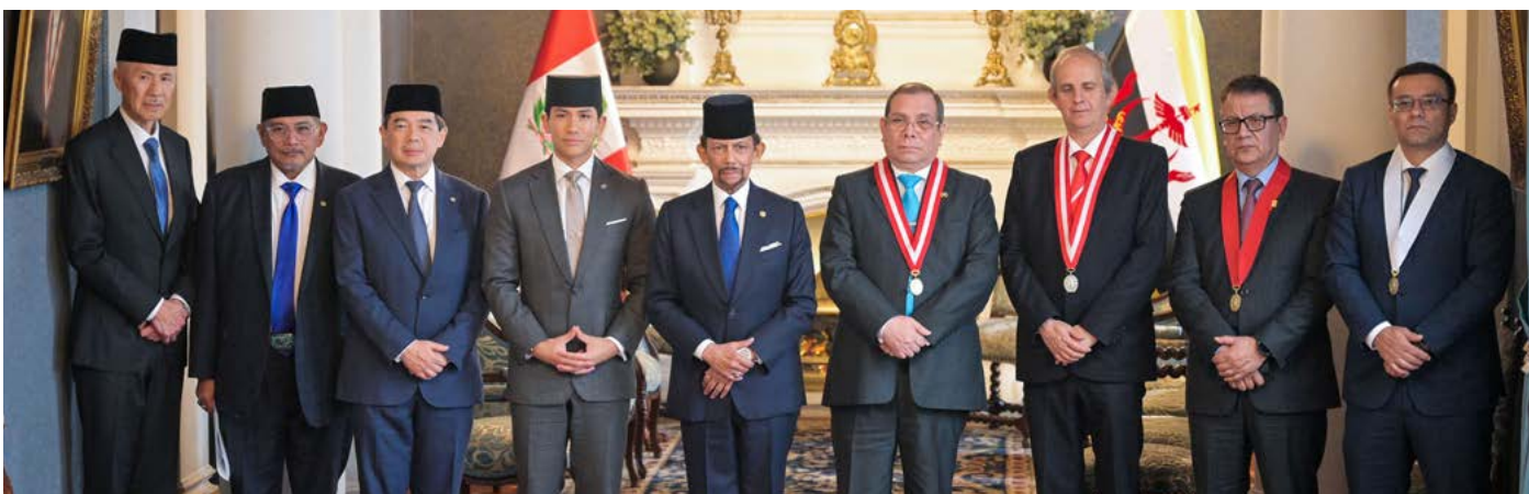
His Majesty and His Royal Highness in a group photo with His Excellency President of the Supreme Court.