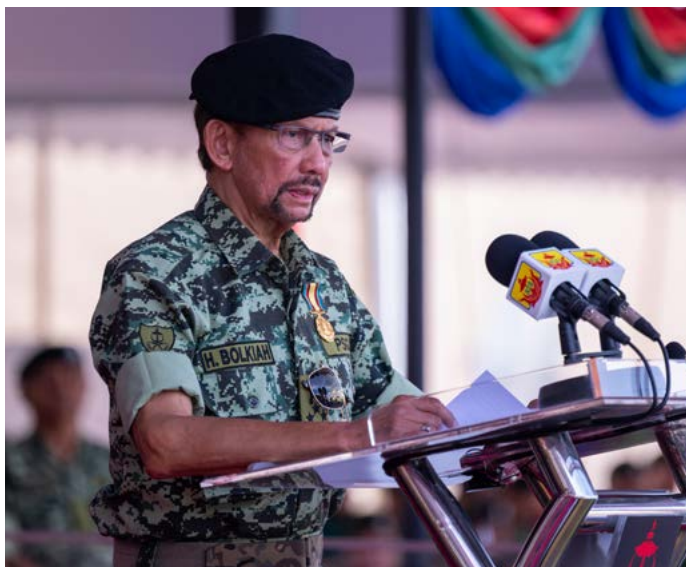
His Majesty Sultan Haji Hassanal Bolkiah Mu'izzaddin Waddaulah ibni Al-Marhum Sultan Haji Omar 'Ali Saifuddien Sa'adul Khairi Waddien, Sultan and Yang Di-Pertuan of Brunei Darussalam delivering a titah (royal speech) at the Gurkha Reserve Unit (GRU) Golden Jubilee Celebration held at the Parade Ground, Sungai Akar Camp.

SUNGAI AKAR, 28 th November – The Gurkha Reserve Unit (GRU) has marked 50 years of contributing to Brunei Darussalam's peace and prosperity. At the GRU Golden Jubilee Celebration, His Majesty Sultan Haji Hassanal Bolkiah Mu'izzaddin Waddaulah ibni Al-Marhum Sultan Haji Omar 'Ali Saifuddien Sa'adul Khairi Waddien, Sultan and Yang Di-Pertuan of Brunei Darussalam expressed satisfaction with the unit's growth into a reputable security organisation capable of addressing evolving challenges. The unit's diverse personnel have enriched it with expertise, experience, and resilience.