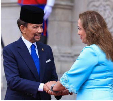
His Majesty Sultan Haji Hassanal Bolkiah Mu'izzaddin Waddaulah ibni Al-Marhum Sultan Haji Omar 'Ali Saifuddien Sa'adul Khairi Waddien, Sultan and Yang Di-Pertuan of Brunei Darussalam being welcomed on arrival by Her Excellency President of the Republic of Peru for the state visit in Lima.