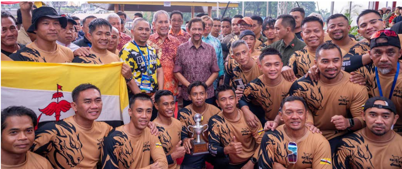
His Majesty during the Adjournment of the Sarawak Regatta – Kuching Waterfront Festival 2024.