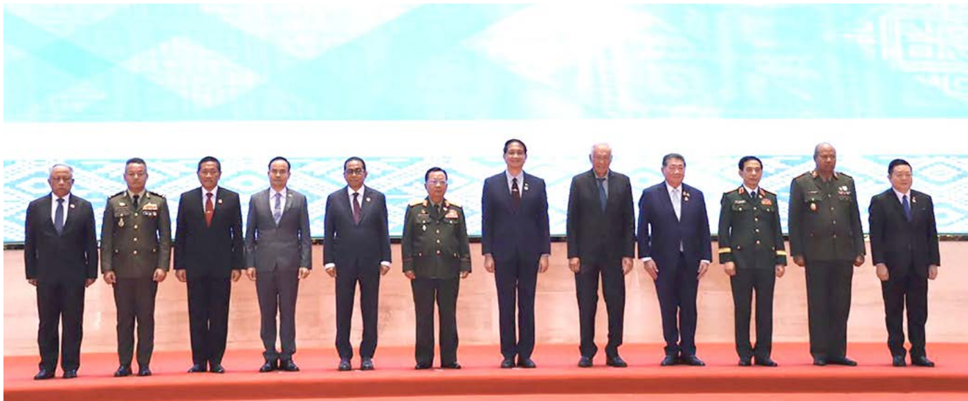
Yang Berhormat Minister at the Prime Minister's Office and Second Minister of Defence in a group photo.