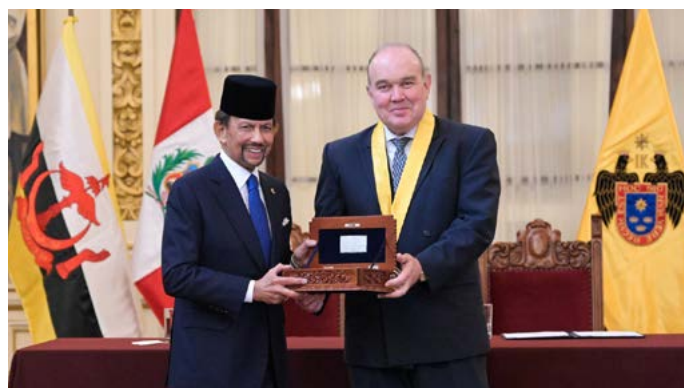
His Majesty during the handing over ceremony of the Key of Lima City by His Excellency Mayor of Lima, at the Municipal Palace.