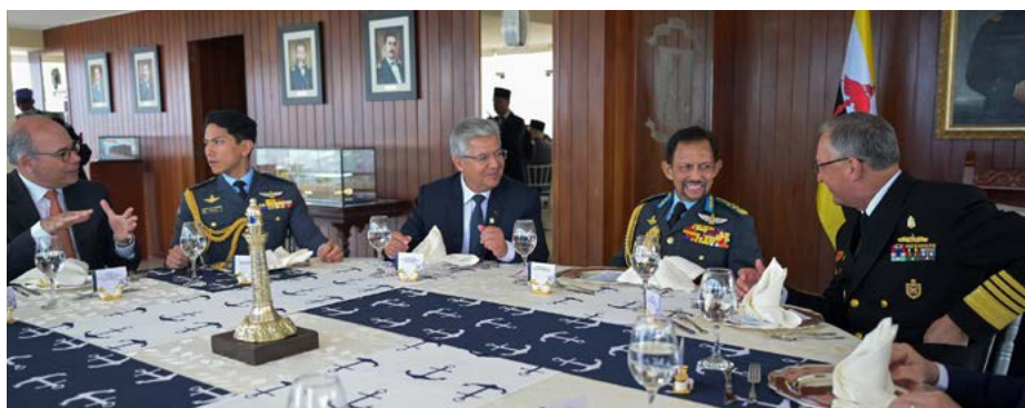
His Majesty the Sultan and Yang Di-Pertuan of Brunei Darussalam, accompanied by His Royal Highness Prince 'Abdul Mateen during the visit to Naval School of Peru (above and left).