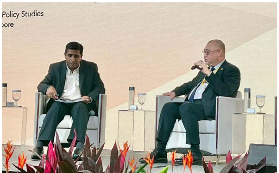
Yang Berhormat Minister of Culture, Youth and Sports, during the Asian Family Conference.

It also focused on evidence-based programmes aimed at improving