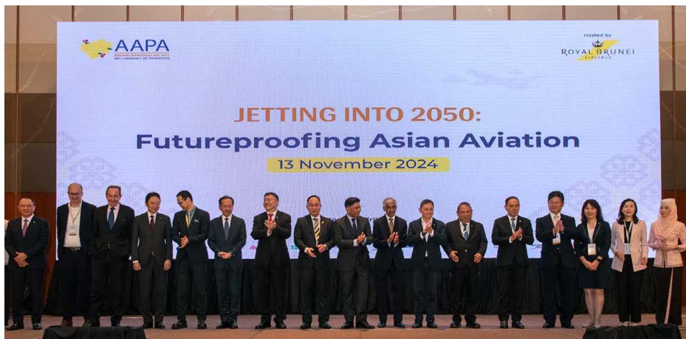
Yang Berhormat Minister of Transport and Infocommunications in a group photo.