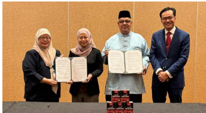
During the signing ceremony.

REPUBLIC OF SINGAPORE, 21 st November - Brunei Darussalam and Republic of Singapore have signed a Memorandum of Understanding (MoU) to boost economic