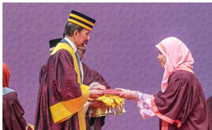
His Majesty the Sultan and Yang Di-Pertuan of Brunei Darussalam presenting certificates to graduates.