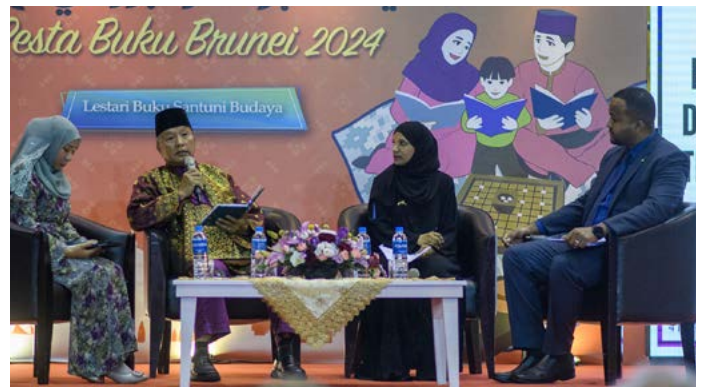
The symposium in progress.

She noted the shared heritage, the caring leadership of both nations, and the importance of Islamic values in shaping their societies. The Ambassador also discussed the strategic geographical positions of both countries, which enhance their role in global trade and open up opportunities for further collaboration. The symposium also facilitated discussions on potential areas for future cooperation.