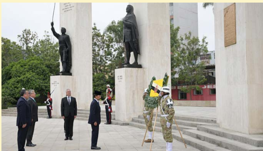
His Majesty Sultan Haji Hassanal Bolkiah Mu'izzaddin Waddaulah ibni Al-Marhum Sultan Haji Omar 'Ali Saifuddien Sa'adul Khairi Waddien, Sultan and Yang Di-Pertuan of Brunei Darussalam during the Floral Offering Ceremony at Paraque del los Proceres de la Independencia (Park of the Heroes of Independence).

LIMA, REPUBLIC OF PERU, 12 th November - His Majesty Sultan Haji Hassanal Bolkiah Mu'izzaddin Waddaulah ibni Al-Marhum Sultan Haji Omar 'Ali Saifuddien Sa'adul Khairi Waddien, Sultan and Yang Di-Pertuan of Brunei Darussalam, is currently on a state visit to the Republic of Peru. His Majesty the Sultan and Yang Di-Pertuan of Brunei Darussalam began the state visit by attending the Floral Offering Ceremony at Paraque del los Proceres de la Independencia (Park of the Heroes of Independence), where His Majesty was welcomed by His Excellency Gustavo Lino Adrianzén, President of the Council of Ministers of the Republic of Peru. The park was inaugurated in 1971 to honour Peru's independence heroes.