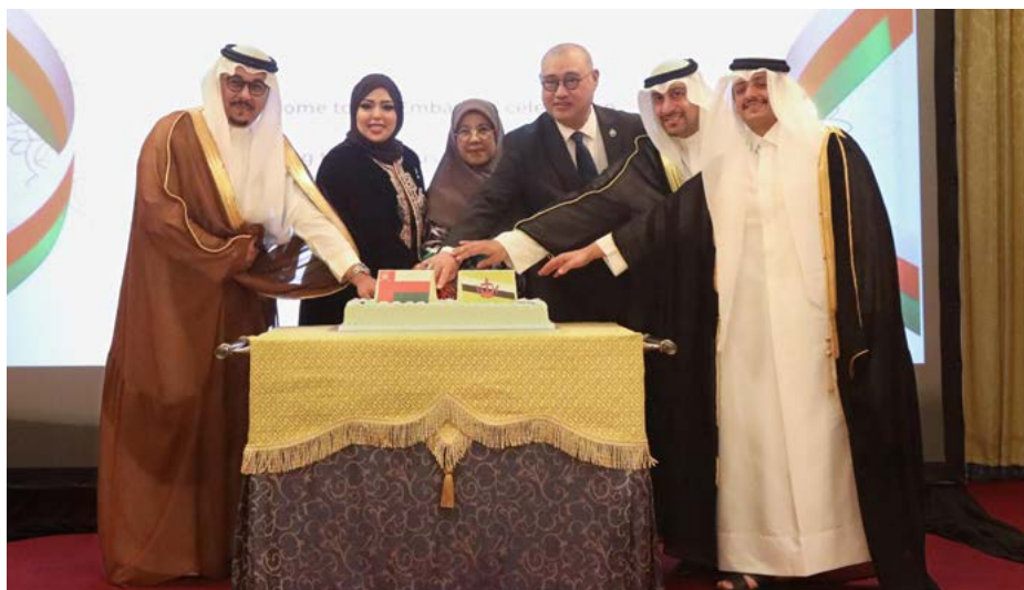
Yang Berhormat Minister of Culture, Youth and Sports and Her Excellency Ambassador Extraordinary and Plenipotentiary of the Sultanate of Oman to Brunei Darussalam during the cake-cutting ceremony.

Economic ties are growing, with successful joint ventures like Comquest and Innovateq.