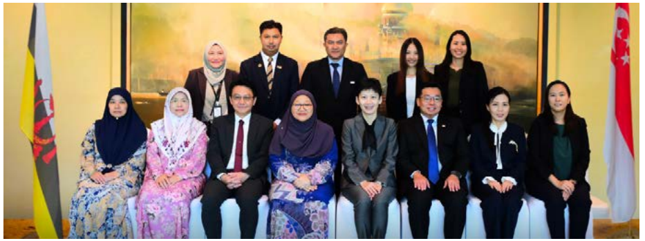
Permanent Secretary (Core Education), Ministry of Education, and Permanent Secretary for Education, Ministry of Education (MoE), Republic of Singapore in a group photo.