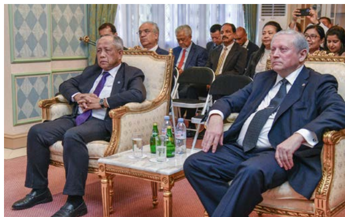
Yang Berhormat Minister at the Prime Minister's Office and Second Minister of Defence and His Excellency Ambassador Extraordinary and Plenipotentiary of Russia to Brunei Darussalam at the classical musical concert.

Present was Yang Berhormat Pehin Datu Lailaraja Major General (Rtd) Dato Paduka Seri Haji Awang Halbi bin Haji Mohd. Yussof, Minister at the Prime Minister's Office and Second Minister of Defence.