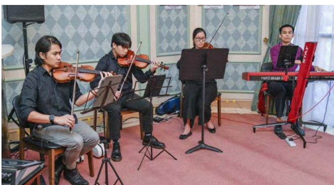
Musicians during the classical music concert.