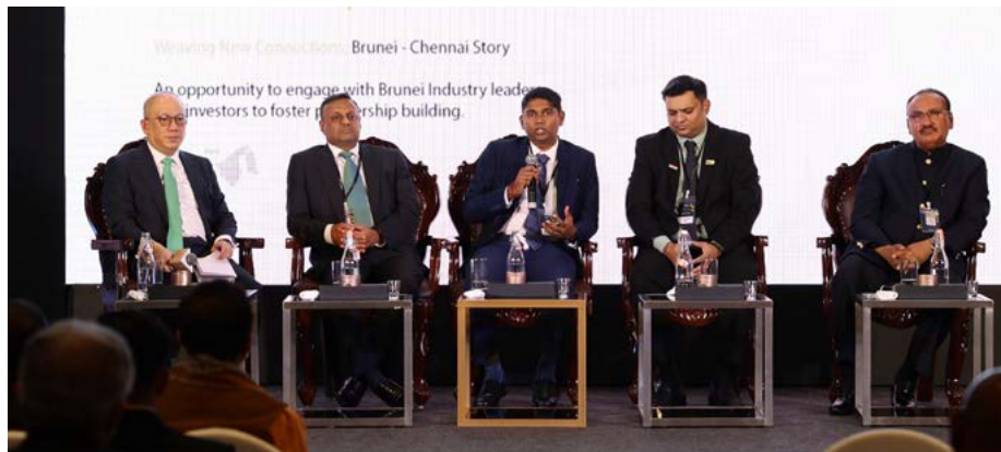
Brunei Economic Development Board Acting Chief Executive Officer at the investment seminar in Chennai, Republic of India.

REPUBLIC OF INDIA, 7 th November - Brunei Darussalam's potential as a gateway to ASEAN and regional markets was showcased at the inaugural investment seminar organised by the Brunei Economic Development Board (BEDB) in Chennai, on 6 th November.