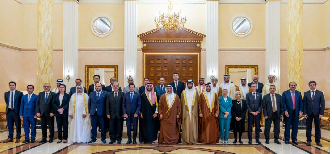
Yang Berhormat Minister of Culture, Youth and Sports of Brunei Darussalam in a group photo at the launching ceremony of The Global Network for Youth Competitiveness 'Hope Network'.