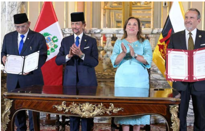
His Majesty and Her Excellency President at the Signing Ceremony of a Memorandum of Understanding on the Establishment of a Mechanism for Bilateral Consultations.

His Majesty then held a meeting with His Excellency Eduardo Salhuana Cavides, President of the Congress, and was presented with the prestigious Congressional Medal of Honour, the highest honour bestowed by the Peruvian Congress. In a titah (royal speech), His Majesty expressed gratitude for the award, highlighting it as a symbol of the rich history and values of Peru, as well as a reflection of the strong friendship between Brunei and Peru. His Majesty expressed hope for continued cooperation and the further strengthening of bilateral relations between the two nations.