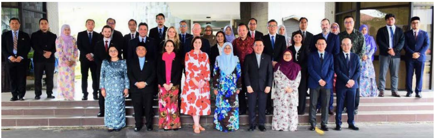
Yang Berhormat Minister of Education in a group photo with Her Excellency Deputy Trade Commissioner for Southeast Asia and delegation of the United Kingdom Trade Mission.