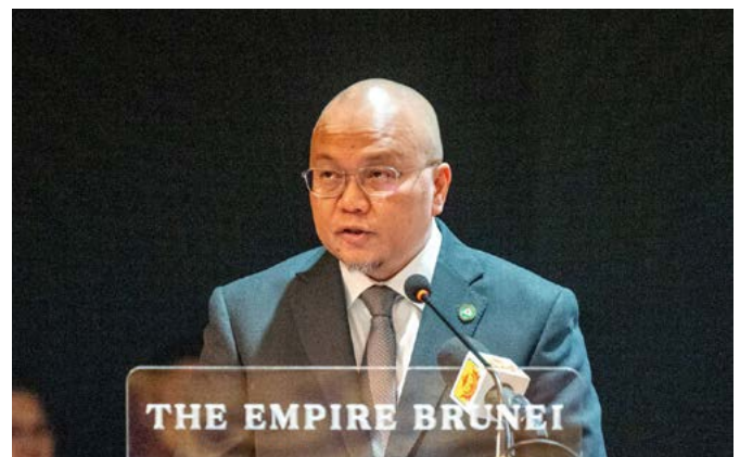
Yang Berhormat Minister of Health delivering his speech at the event.

The Minister also highlighted the potential of point-of-care testing (POCT) to improve healthcare delivery, especially in remote areas,