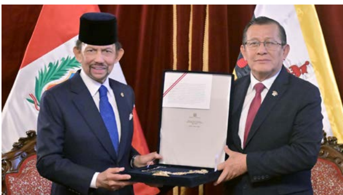
His Majesty receiving the Congressional Medal of Honour from His Excellency President of the Congress.