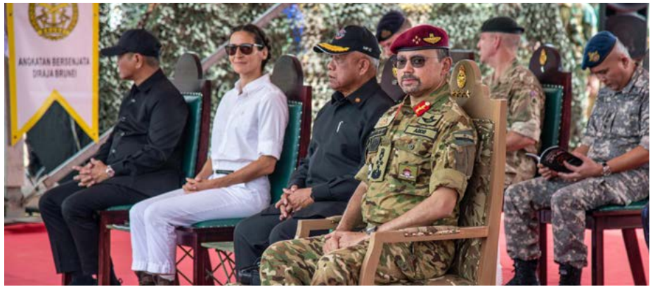
His Royal Highness Prince Haji Al-Muhtadee Billah ibni His Majesty Sultan Haji Hassanal Bolkiah Mu'izzaddin Waddaulah, the Crown Prince and Senior Minister at the Prime Minister's Office witnessing the Jungle Warfare Demonstration held at Kargu Dam, Andulau Forest Reserve in Sungai Liang.

The RJWS 2024, chaired by the RBLF in partnership with British Forces Brunei, marks the fourth symposium and included 289 participants from 17 countries under the theme 'Enhancing Survivability Through Training and Technology'. It aims to promote regional cooperation, information sharing, and advancements in jungle warfare capacity and training.