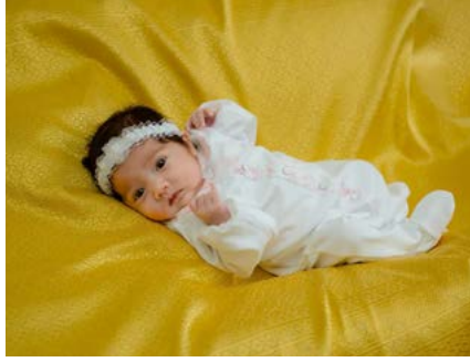
5. His Majesty names granddaughter