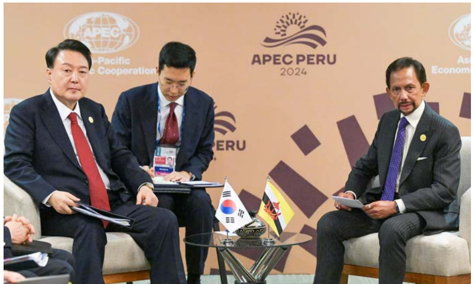
His Majesty Sultan Haji Hassanal Bolkiah Mu'izzaddin Waddaulah ibni Al-Marhum Sultan Haji Omar 'Ali Saifuddien Sa'adul Khairi Waddien, Sultan and Yang Di-Pertuan of Brunei Darussalam with His Excellency President of the Republic of Korea during the bilateral meeting.

His Royal Highness Prince 'Abdul Mateen, accompanied His Majesty at the events.