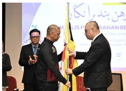
25. Flag handover for the national contingent