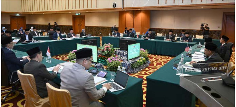
The 48 th Senior Officials Meeting (SOM) for MABIMS in progress.

The meeting proceeded with confirmation of the agenda and the presentation of resolutions from the earlier seminar.