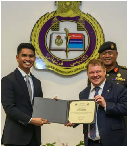
His Excellency High Commissioner of Australia to Brunei Darussalam as Guest of Honour presenting the OBOE Endeavour Academic Excellence Award to a recipient.

TANAH JAMBU, 25 th November – Six officers from the Ministry of Defence (MinDef) received the OBOE Endeavour Academic Excellence Award from the