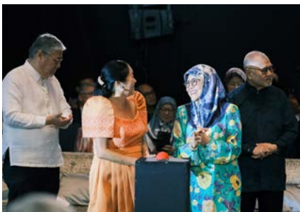
16. Her Royal Highness visits the Republic of the Philippines