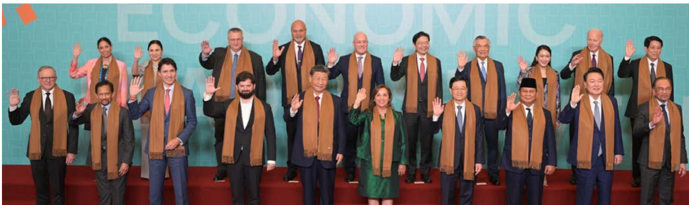
His Majesty in a group photo.