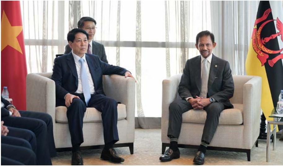
His Majesty Sultan Haji Hassanal Bolkiah Mu'izzaddin Waddaulah ibni Al-Marhum Sultan Haji Omar 'Ali Saifuddien Sa'adul Khairi Waddien, Sultan and Yang Di-Pertuan of Brunei Darussalam during the bilateral meeting with His Excellency President of the Socialist Republic of Viet Nam.

LIMA, REPUBLIC OF PERU, 14 th November - His Majesty Sultan Haji Hassanal Bolkiah Mu'izzaddin Waddaulah ibni Al-Marhum Sultan Haji Omar 'Ali