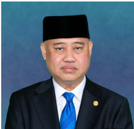
Yang Berhormat Minister of Culture, Youth and Sports.

BANDAR SERI BEGAWAN, 20 th November - World Children's Day (WCD) is celebrated annually on 20 th November, marking the anniversary of the Declaration of the Rights of the Child (1959) and the Convention on the Rights of the Child (1989). This year's WCD theme 'For every child, every right'.