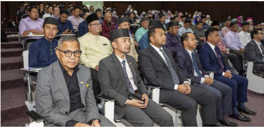
Attendees during the symposium.

It also provided a platform for mental health professionals to share knowledge and experiences, contributing to a national effort to address mental health challenges in Brunei Darussalam.