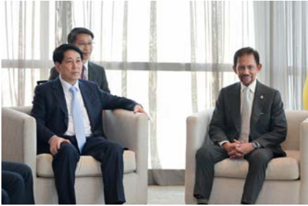
9. Bilateral meeting strengthens cooperation in various fields