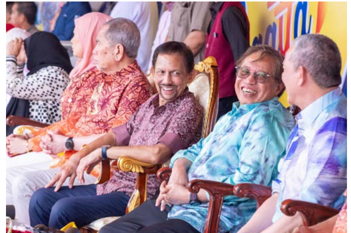
His Majesty the Sultan and Yang Di-Pertuan of Brunei Darussalam upon arrival at Kuching International Airport (left); and during the Sarawak Regatta (right).