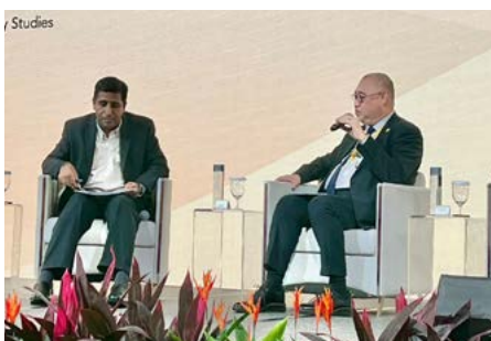
23. Share best practices, strengthen family institutions