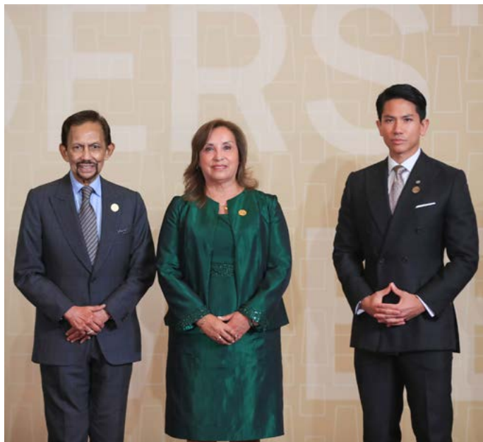
His Majesty Sultan Haji Hassanal Bolkiah Mu'izzaddin Waddaulah ibni Al-Marhum Sultan Haji Omar 'Ali Saifuddien Sa'adul Khairi Waddien, Sultan and Yang Di-Pertuan of Brunei Darussalam and His Royal Highness Prince 'Abdul Mateen with Her Excellency President of the Republic of Peru.

Following the APEC Economic Leaders' Retreat, His Majesty left Lima. Present at Jorge Chávez International Airport to bid farewell was His Excellency Gustavo Lino Adrianzén, the President of the Council of Ministers of the Republic of Peru.