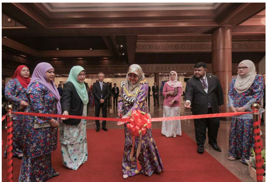
Her Royal Highness Princess Hajah Masna binti Al-Marhum Sultan Haji Omar 'Ali Saifuddien Sa'adul Khairi Waddien, Ambassador-at-Large at the Ministry of Foreign Affairs (MFA) officiating MFA Day.

The day included the commencement of a Model United Nations (MUN) simulation, engaging students from 21 government schools and youths from non-governmental organisations in United Nations procedures. Participants also attended the 'MFA Talk' with Bruneian diplomats. Informational booths showcased the ministry's work and bilateral partnership opportunities, including scholarships.