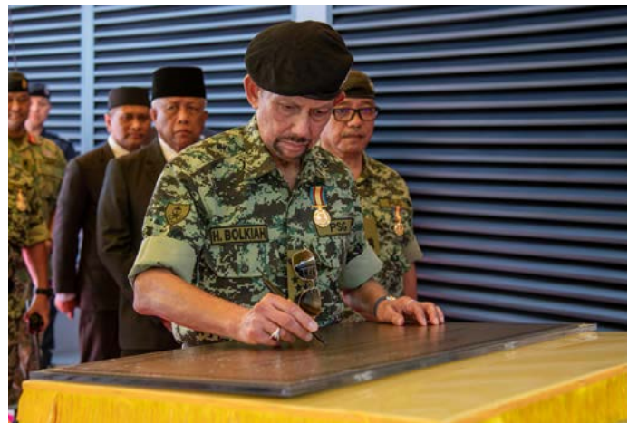
His Majesty the Sultan and Yang Di-Pertuan of Brunei Darussalam signing the Inauguration Plaque of the Gurkha Gallery (right).

His Majesty also officiated the gallery opening, attended a Royal Luncheon, and participated in a cake-cutting ceremony. The event concluded with a group photo, a pesambah (souvenir) presentation of a traditional Khukri sword, and a get-together with GRU personnel and their families.