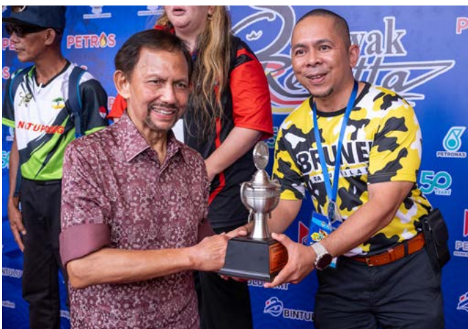
His Majesty presenting a trophy to the Brunei Darussalam Boat Race Team.

His Majesty then attended an Afternoon Tea Reception at the Hilton Hotel before left Kuching.