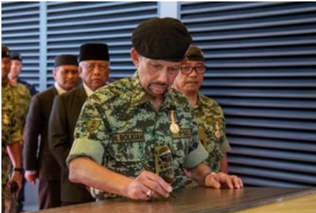
13. Celebrating 50 years of peace, prosperity