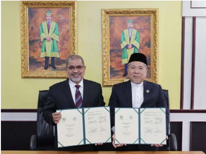
Memorandum of Understanding (MoU) between Universiti Islam Sultan Sharif Ali (UNISSA) and Hadhramout University, Yemen.