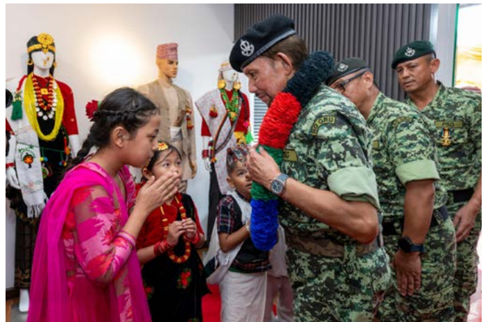
His Majesty during the meet-and-greet at the event.