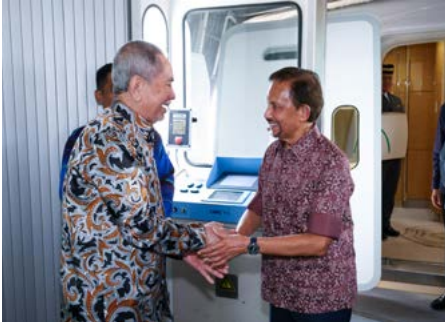
4. His Majesty attends Sarawak Regatta