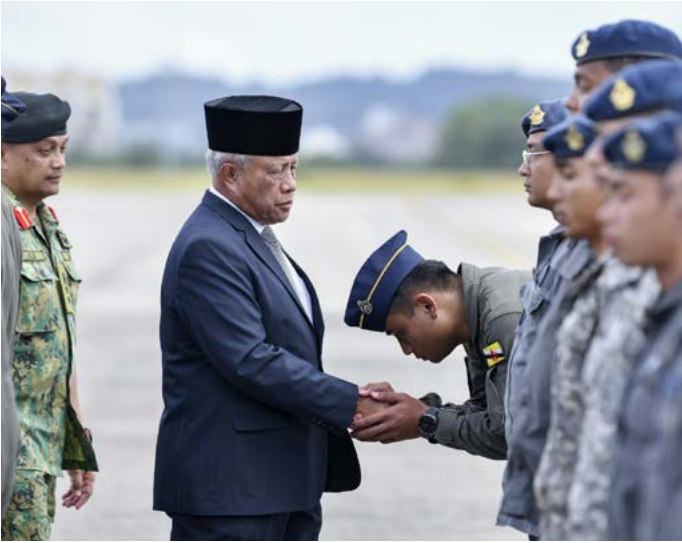
Yang Berhormat Minister at the Prime Minister's Office and Second Minister of Defence greeting the contingent.

RIMBA, 5 th November - A total of 37 personnel from the Royal Brunei Armed Forces (RBAF) returned to Brunei Darussalam after completing their mission for Humanitarian and Disaster Relief (HADR) in the Republic of the Philippines, following Tropical Storm Kristine (Trami) from 27 th October to 5 th November.