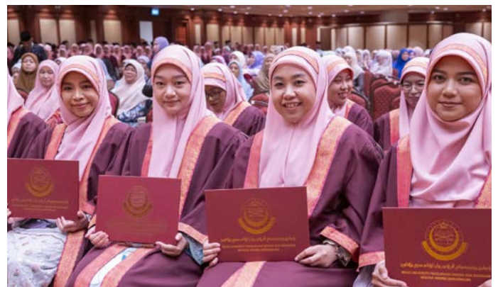
Graduates with their certificates.