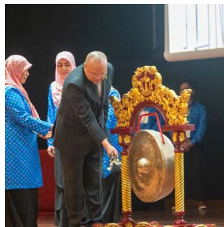
Yang Berhormat Minister launching the 18 th ASEAN Conference of Clinical Laboratory Sciences.

The event included keynote lectures, scientific talks, workshops, and paper presentations, with contributions from international and local experts.