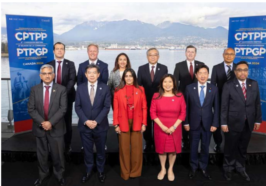
Yang Berhormat Minister at the Prime Minister's Office and Second Minister of Finance and Economy at the Eighth Meeting of the Comprehensive and Progressive Agreement for Trans-Pacific Partnership in Vancouver, Canada.

The CPTPP commission also welcomed the outcomes achieved under Canada's