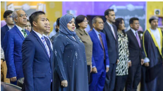
Her Excellency Ambassador Extraordinary and Plenipotentiary of the Sultanate of Oman to Brunei Darussalam and Permanent Secretary (Culture) at the Ministry of Culture, Youth and Sports at the event.

BANDAR SERI BEGAWAN, 4 th November - The Embassy of the Sultanate of Oman, in collaboration with Ministry of Culture, Youth and Sports (MCYS) of Brunei Darussalam and Ministry of Culture, Sports and Youth of Oman organised a symposium titled 'Oman-Brunei Relations: A Thriving Present and Promising Future' to mark the 40 th anniversary of diplomatic relations between the two nations.