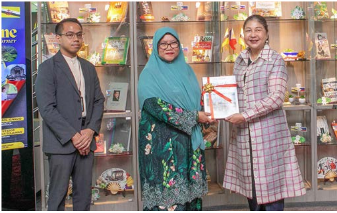
Presentation of books by Her Excellency Ambassador Extraordinary and Plenipotentiary of the Republic of the Philippines to Brunei Darussalam.

TUNGKU LINK, 20 th November - To mark the 40 th anniversary of diplomatic relations between Brunei Darussalam and the Republic of the Philippines, the Embassy of the Republic of the Philippines donated over 50 books to the Universiti Teknologi Brunei (UTB) at a ceremony held at the UTB Library Complex.