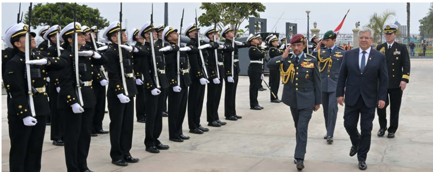
His Majesty Sultan Haji Hassanal Bolkiah Mu'izzaddin Waddaulah ibni Al-Marhum Sultan Haji Omar 'Ali Saifuddien Sa'adul Khairi Waddien, Sultan and Yang Di-Pertuan of Brunei Darussalam walking past the Static Guard of Honour towards the Admiral Grau memorial monument for the Floral Offering Ceremony. Accompanying His Majesty was His Royal Highness Prince 'Abdul Mateen.

LIMA, REPUBLIC OF PERU, 13 th November – His Majesty Sultan Haji Hassanal Bolkiah Mu'izzaddin Waddaulah ibni Al-Marhum Sultan Haji Omar 'Ali Saifuddien Sa'adul Khairi Waddien, Sultan and Yang Di-Pertuan of Brunei Darussalam visited the Naval School of Peru in Callao, accompanied by His Royal Highness Prince 'Abdul Mateen.