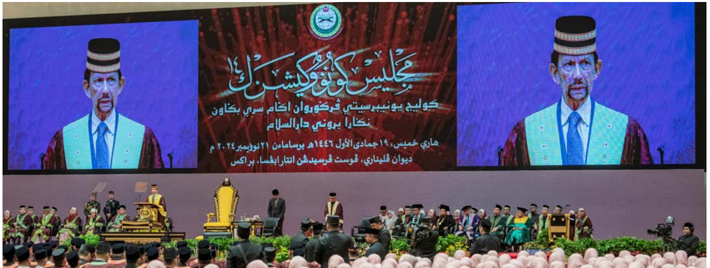
His Majesty Sultan Haji Hassanal Bolkiah Mu'izzaddin Waddaulah ibni Al-Marhum Sultan Haji Omar 'Ali Saifuddien Sa'adul Khairi Waddien, Sultan and Yang Di-Pertuan of Brunei Darussalam delivers a titah (royal speech).

BANDAR SERI BEGAWAN, 21 st November - At the 14 th Seri Begawan Religious Teachers University College (KUPU SB) Convocation, His Majesty Sultan Haji Hassanal Bolkiah Mu'izzaddin Waddaulah ibni Al-Marhum Sultan Haji Omar 'Ali Saifuddien Sa'adul Khairi Waddien, Sultan and Yang Di-Pertuan