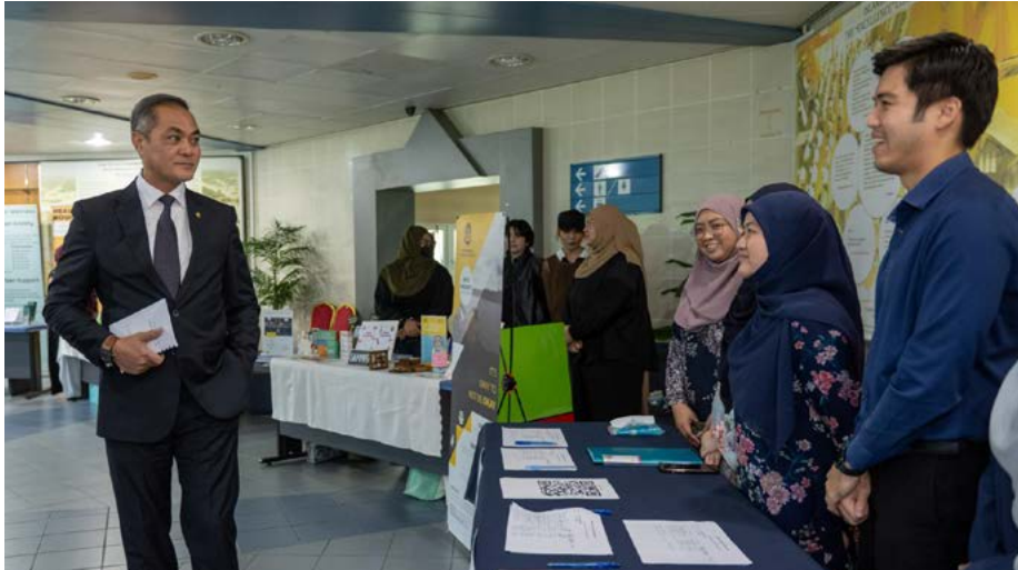
Yang Berhormat Minister of Home Affairs touring the International Symposium 2024 booth, organised by the Brunei Darussalam Counselling Association (PERKAB).

RIMBA, 12 th November - The International Symposium 2024 organised by the Brunei Darussalam Counselling Association (PERKAB) emphasised the importance of mental health as the foundation of community well-being.