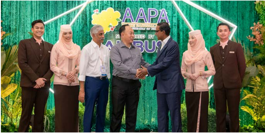
The CEO of Royal Brunei Airlines (RB) at the 68 th Association of Asia Pacific Airlines (AAPA) Leaders' Assembly.