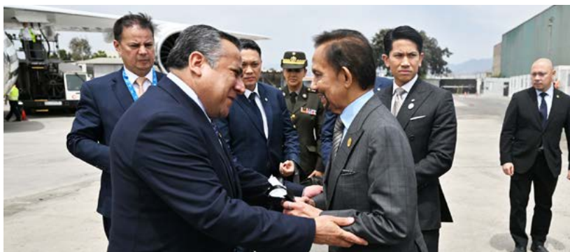
His Majesty prior to departure from Lima.