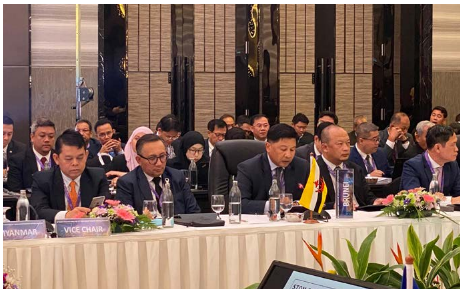
Yang Berhormat Minister of Transport and Infocommunications, representing Brunei Darussalam at the 30 th ASEAN Transport Ministers (ATM) Meeting.

KUALA LUMPUR, MALAYSIA, 22 nd November - Yang Berhormat Pengiran Dato Seri Setia Shamhary bin Pengiran Dato Paduka Haji Mustapha, Minister of Transport and Infocommunications, represented Brunei Darussalam at the 30 th ASEAN Transport Ministers