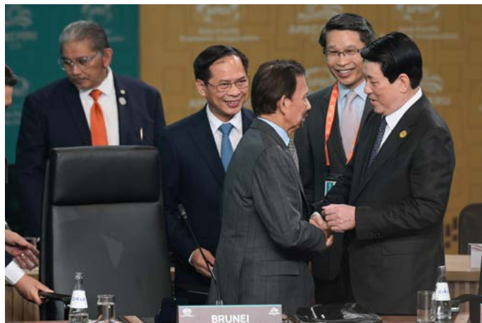
His Majesty the Sultan and Yang Di-Pertuan of Brunei Darussalam at the APEC Economic Leaders' Retreat.