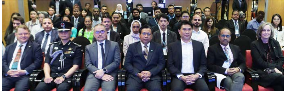
Yang Mulia Deputy Minister (Security and Law) at the Prime Minister's Office at the International Telecommunication Union (ITU) Regional Asia-Pacific CyberDrill 2024.

The event was officiated by the Deputy Minister (Security and Law) at the Prime Minister's Office, Yang Mulia Dato Seri Paduka Awang Haji Sufian bin Haji Sabtu, who is also the Deputy Chairman of the National Cybersecurity Committee.