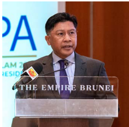
Yang Berhormat Minister of Transport and Infocommunications delivering a speech during the 68th Assembly of Presidents of the Association of Asia Pacific Airlines.

JERUDONG, 13th November - The aviation industry is undergoing significant transformation, driven by technology, sustainability goals, and shifting geopolitical dynamics.