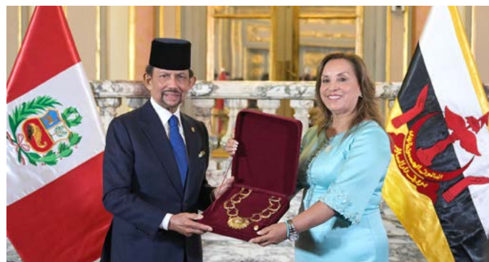
His Majesty receiving the Grand Collar of the Order of the Sun of Peru conferred by Her Excellency President.