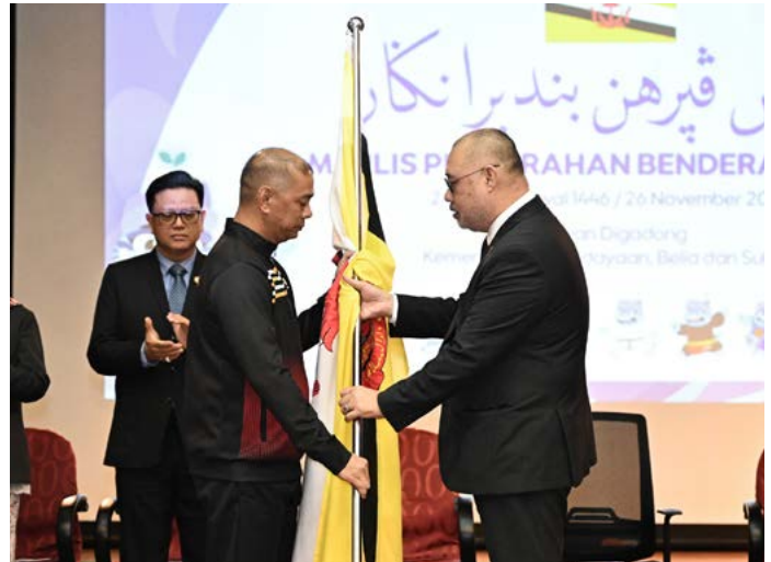
Yang Berhormat Minister of Culture, Youth and Sports handing over the national flag to the Brunei Darussalam Contingent to the 11 th BIMPNT-EAGA Friendship Games 2024 in Puerto Princesa, the Republic of the Philippines.