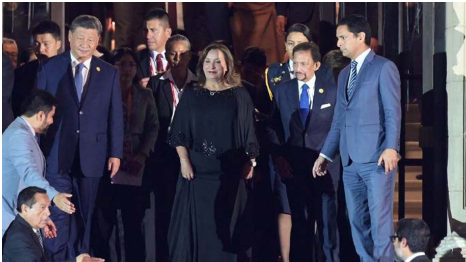
His Majesty the Sultan and Yang Di-Pertuan of Brunei Darussalam during the APEC Economic Leaders Gala Dinner at the Government Palace.