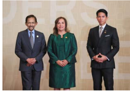
10. Encourage inclusive growth through trade, investment