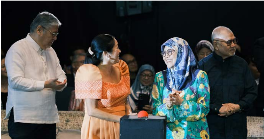
Her Royal Highness Princess Hajah Masna binti Al-Marhum Sultan Haji Omar 'Ali Saifuddien Sa'adul Khairi Waddien, Ambassador-at-Large at the Ministry of Foreign Affairs with First Lady Louise Araneta-Marcos during a fashion show.

REPUBLIC OF THE PHILIPPINES, 7 th November - Her Royal Highness Princess Hajah Masna binti Al-Marhum Sultan Haji Omar 'Ali Saifuddien Sa'adul Khairi Waddien, Ambassador-at-Large at the Ministry of Foreign Affairs, visited the Republic of the Philippines on 5 th to 7 th November to celebrate the 40 th anniversary of diplomatic relations between Brunei Darussalam and the Republic of the Philippines.