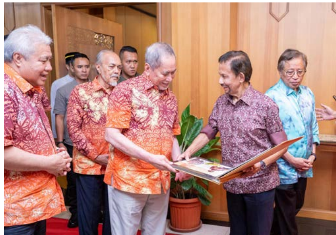
His Majesty receiving a pesambah (souvenir) prior to leaving Kuching.