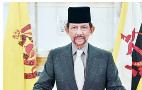
22. Performing prayers: A 'fortress' against contempt