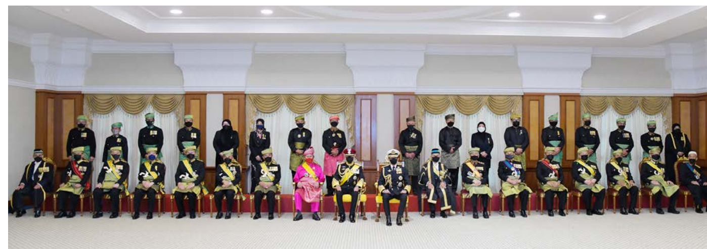
His Majesty the Sultan and Yang Di-Pertuan of Brunei Darussalam and members of the royal family in a group photo session with the members of LegCo at the ceremony.