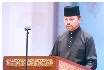
23. Producing the country's generation of huffaz