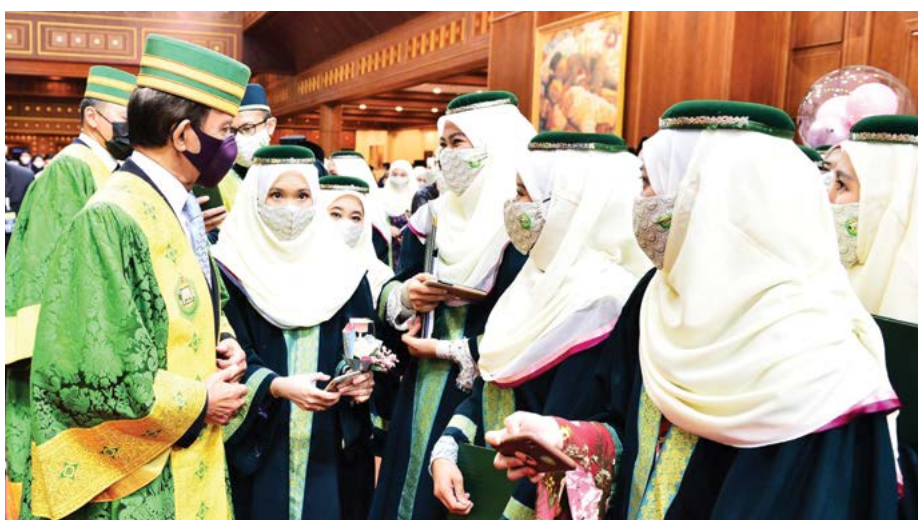
His Majesty the Sultan and Yang Di-Pertuan of Brunei Darussalam and His Royal Highness the Crown Prince interacting with the graduates at the ceremony (above and below).