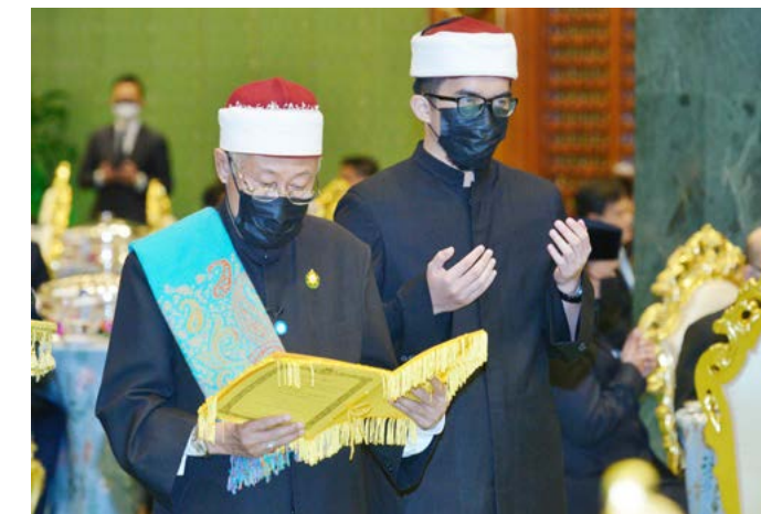
The Official Luncheon was preceded by a doa selamat recited by Yang Berhormat State Mufti.