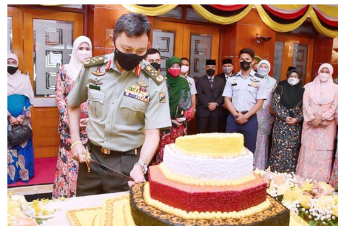
His Royal Highness the Crown Prince officiating the cake cutting session during the High Tea Reception hosted by MinDef (left); and Their Royal Highnesses and other members of the royal family during the recitation of doa kesyukuran at the High Tea Reception (right).