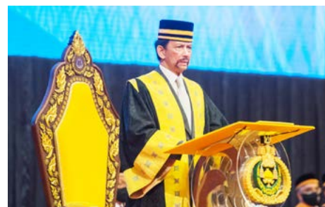
17. 9 th Convocation Ceremony: UTB urged to enhance research programmes