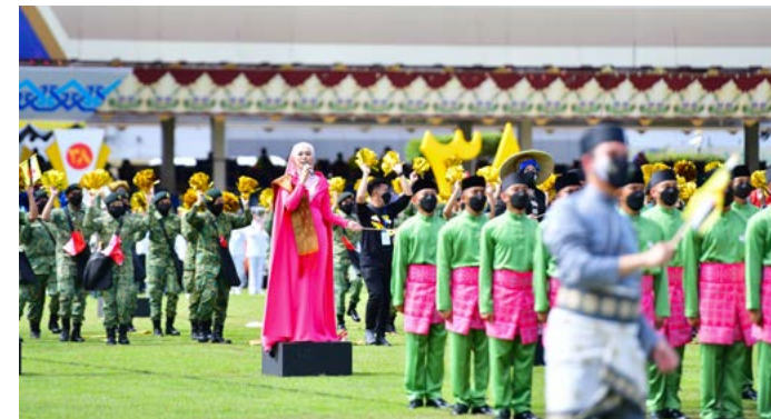
Among those involved in the performances at the celebration (above & below).