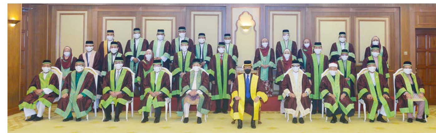
His Majesty in a group photo during the 11 th KUPU SB Convocation Ceremony.