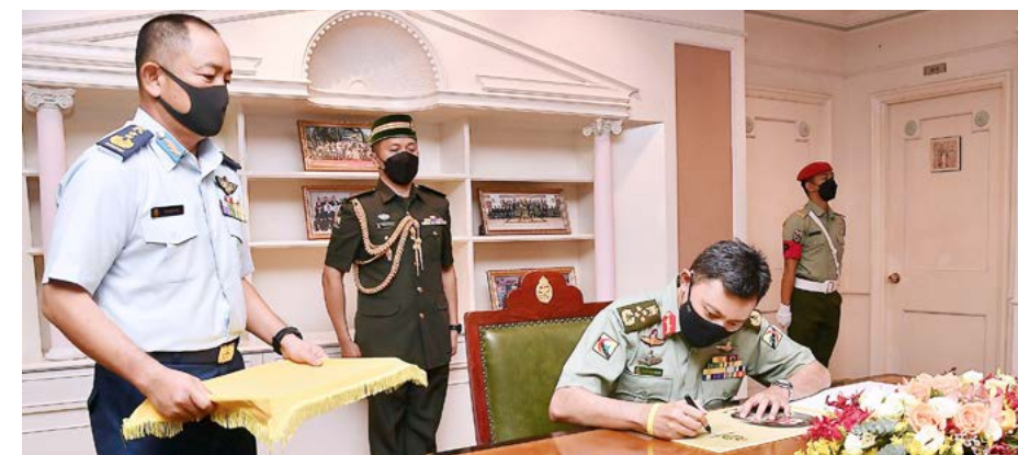
His Royal Highness the Crown Prince signing a commemorative parchment during the High Tea Reception hosted by MinDef.

A Doa Selamat Ceremony was also hosted the next day by the Yayasan Sultan Haji Hassanal Bolkiah (YSHHB), as the Secretariat of the Pengiran Muda Mahkota Al-Muhtadee Billah Fund for Orphans (DANA) to commemorate the birthday celebration. Present to grace the ceremony was His Royal Highness Prince 'Abdul Malik, as the Chairman of YSHHB Committee of Governors.