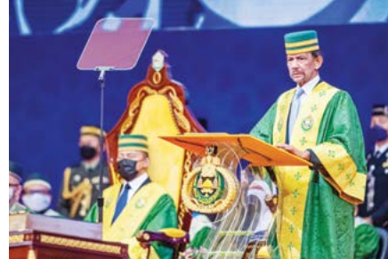
14. 354 UNISSA graduates receive degrees, diplomas