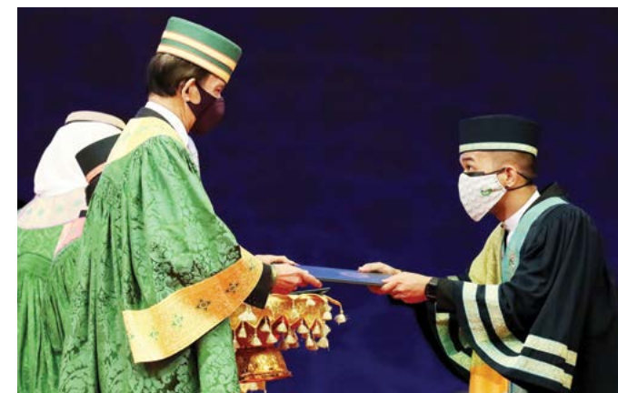
His Majesty conferring a Degree certificate to one of the graduates at the ceremony.

and Arabic languages – is not an easy task," the Monarch emphasised, "but is a result of brainstorming efforts through studies and research."