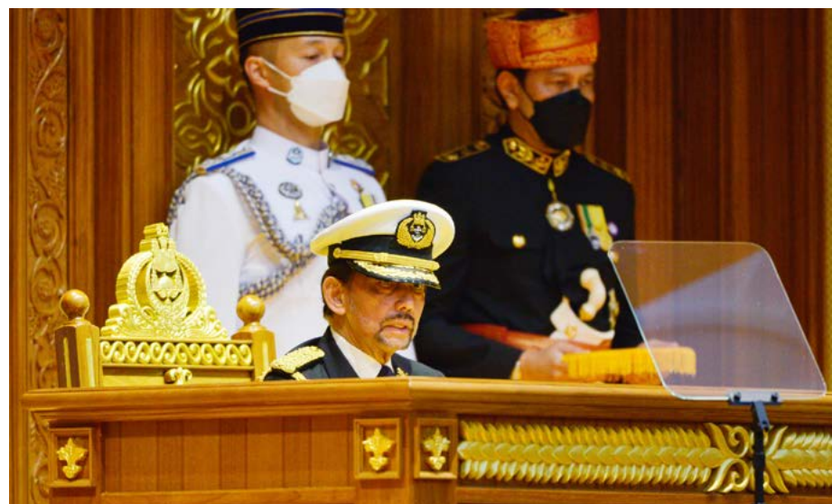
His Majesty Sultan Haji Hassanal Bolkiah Mu'izzaddin Waddaulah ibni Al-Marhum Sultan Haji Omar 'Ali Saifuddin Sa'adul Khairi Waddien, Sultan and Yang Di-Pertuan of Brunei Darussalam delivering a titah (royal speech) at the Opening Ceremony of the First Meeting of the 18 th State Legislative Council (LegCo) session held at the LegCo Chamber Hall, Dewan Majlis Building.