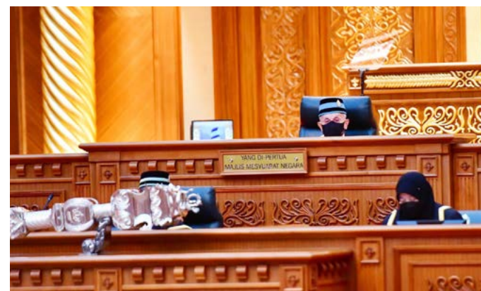
Yang Berhormat Yang Di-Pertua of LegCo at the Opening Ceremony of the First Meeting of the 18 th LegCo session.