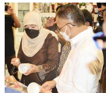
Yang Berhormat Minister of Primary Resources and Tourism during the Launching Ceremony for the Tutong Product Packages at the Official Residence of the Tutong District Officer.

According to the Minister, the department is working with Radio Television Brunei (RTB) to promote tourism attractions and activities.