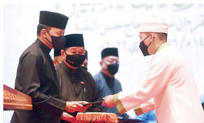
His Royal Highness the Crown Prince presenting 'Aliyah Qira'at Diploma Certificates to the graduates at the ceremony.