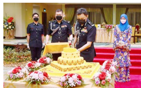
25. Royal birthday ceremonies held for the Crown Prince