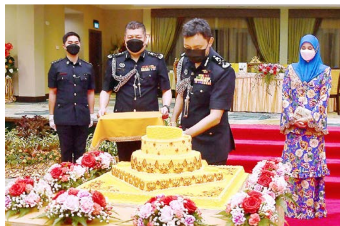
His Royal Highness Prince Haji Al-Muhtadee Billah ibni His Majesty Sultan Haji Hassanal Bolkiah Mu'izzaddin Waddaulah, the Crown Prince and Senior Minister at the Prime Minister's Office (PMO) officiating the cake cutting session.

His Royal Highness the Crown Prince then watched a video clip and was presented with a photobook album titled 'Sejambak Ristaan XV' – which contains a collection of images documenting the Crown Prince's involvement in MinDef and RBAF from 2019