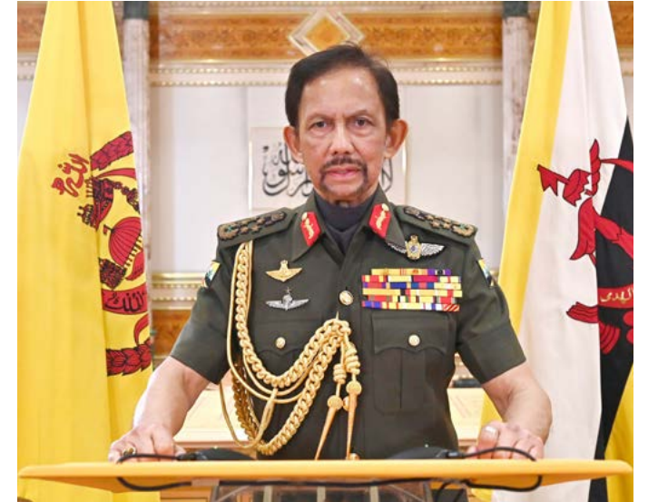
His Majesty Sultan Haji Hassanal Bolkiah Mu'izzaddin Waddaulah ibni Al-Marhum Sultan Haji Omar 'Ali Saifuddien Sa'adul Khairi Waddien, Sultan and Yang Di-Pertuan of Brunei Darussalam delivering a titah (royal speech) in conjunction with Brunei Darussalam's 38 th National Day for the year 1443 Hijrah/2022 Masihi at the Istana Nurul Iman.

Thus, this independence should be preserved by all citizens and residents with great patriotic spirit, as it is a valuable heritage that should be enjoyed across generations.