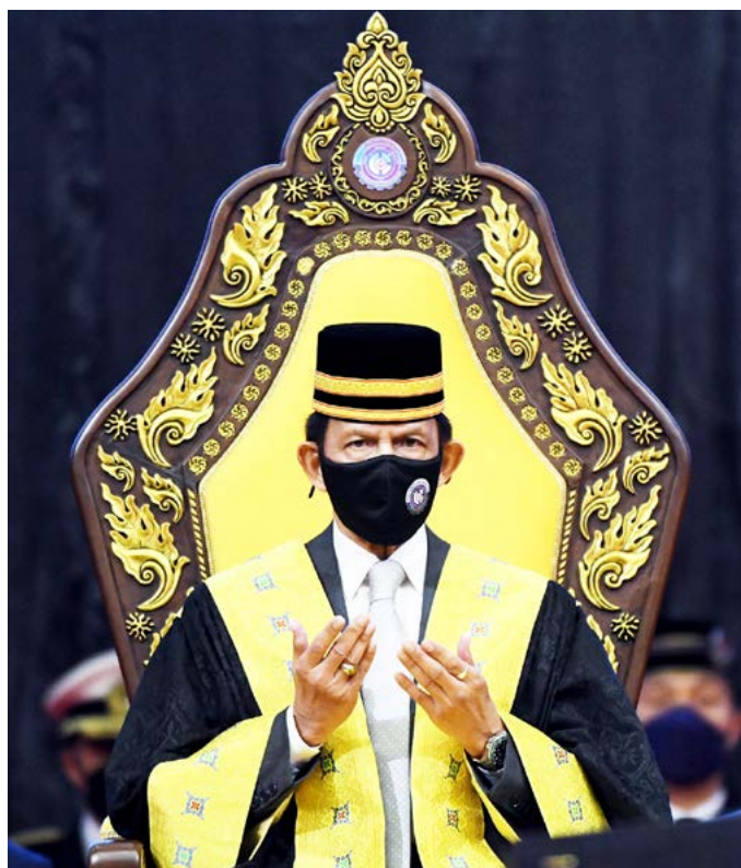
His Majesty Sultan Haji Hassanal Bolkiah Mu'izzaddin Waddaulah ibni Al-Marhum Sultan Haji Omar 'Ali Saifuddien Sa'adul Khairi Waddien, Sultan and Yang Di-Pertuan of Brunei Darussalam during the recitation of doa selamat by the State Mufti.

The Monarch also mentioned that Bachelor's Degree programmes in Science and Technology (except for Engineering) has been shortened to three years. In relation to the matter, His