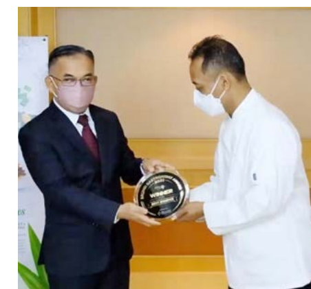
Yang Berhormat Minister of Primary Resources and Tourism presenting the "Best Starter" award which went to The Rizqun International Hotel for its 'Satay Lilit with Sambal Mentah'.

The event is supported by the Brunei Tourism Board; IBTE; Cloudstreet Restaurant, Singapore; The Radisson Hotel Brunei; GoMamam; Mc Maju Cold Storage Sdn. Bhd.; PDS Abbatoir Sdn. Bhd.; Farmgate Trading; TGT Sdn. Bhd.; Brunei Association of Hotels; Association