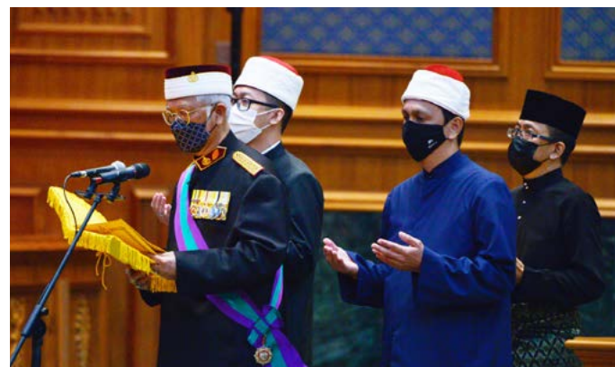
Yang Berhormat Pehin Orang Kaya Paduka Seri Utama Dato Paduka Seri Setia Haji Awang Salim bin Haji Besar reciting a doa selamat to bless the ceremony.

This year's session will deliberate on and approve issues of importance, including the Supply Bill 2022/2023 – which will be done through three stages prior to its approval, and will come into effect April 1. The meeting will continue tomorrow, on February 25.