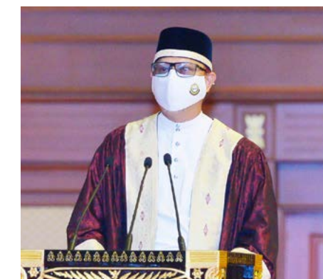
The Ra'ees of KUPU SB presenting his welcoming address at the ceremony.