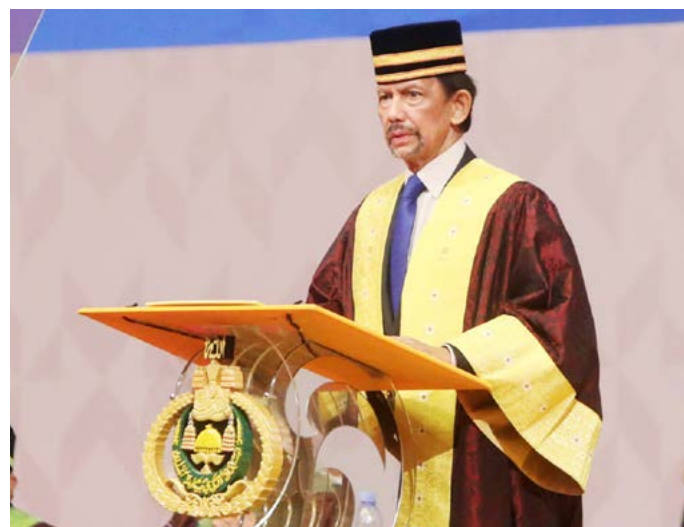
His Majesty Sultan Haji Hassanal Bolkiah Mu'izzaddin Waddaulah ibni Al-Marhum Sultan Haji Omar 'Ali Saifuddien Sa'adul Khairi Waddien, Sultan and Yang Di-Pertuan of Brunei Darussalam, the Chancellor of the Seri Begawan Religious Teachers University College (KUPU SB) delivering a titah (royal speech) at the 11 th KUPU SB Convocation Ceremony held at the Plenary Hall, International Convention Centre (ICC), Berakas.

The Monarch applauded the institution's efforts in incorporating 'Islamic History' as a core subject under its Higher Diploma and Bachelor's Degree programmes. This measure was taken as a spontaneous response to His Majesty's titah in 2018 – which