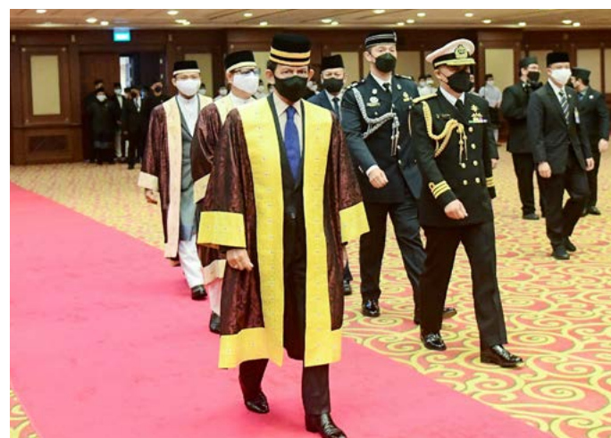
His Majesty the Sultan and Yang Di-Pertuan of Brunei Darussalam at the 11 th KUPU SB Convocation Ceremony.

called for the subject to be made compulsory at all academic institutions.