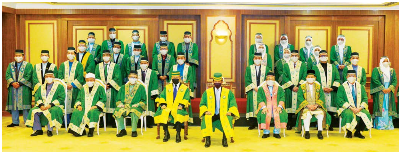
His Majesty Sultan Haji Hassanal Bolkiah Mu'izzaddin Waddaulah ibni Al-Marhum Sultan Haji Omar 'Ali Saifuddien Sa'adul Khairi Waddien, Sultan and Yang Di-Pertuan of Brunei Darussalam and His Royal Highness Prince (Dr.) Haji Al-Muhtadee Billah, the Crown Prince and Senior Minister at the Prime Minister's Office (PMO) in a group photo with the council and senate members, the rector, core officers and academic teaching workforce of UNISSA at the university's 11 th Hafl Al-Takharuj.