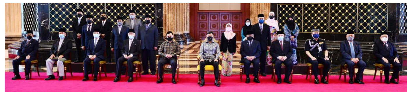
His Royal Highness the Crown Prince in a group photo during the Royal Birthday Celebration hosted by the Prime Minister's Office (PMO). Also present at the ceremony was His Royal Highness Prince 'Abdul Malik.