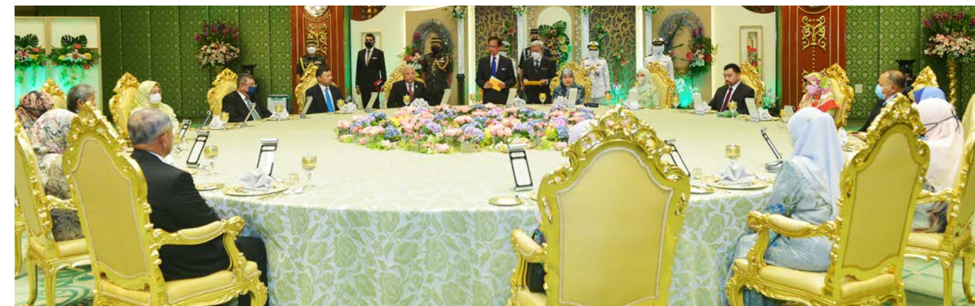
His Majesty Sultan Haji Hassanal Bolkiah Mu'izzaddin Waddaulah ibni Al-Marhum Sultan Haji Omar 'Ali Saifuddin Sa'adul Khairi Waddien, Sultan and Yang Di-Pertuan of Brunei Darussalam and Her Majesty Duli Raja Isteri Pengiran Anak Hajah Saleha binti Al-Marhum Pengiran Pemancha Pengiran Anak Haji Mohamed Alam during the Official Luncheon held at the Baitur Rahmah Hall, Istana Nurul Iman.