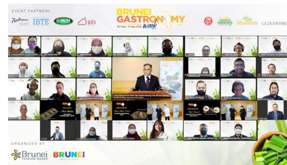
Yang Berhormat Minister of Primary Resources and Tourism virtually attending the Launching Ceremony of Brunei Gastronomy Week 2022.

Meanwhile, the Brunei Gastronomy Workshop is a new initiative organised by the Tourism Development Department in collaboration with IBTE and Cloudstreet