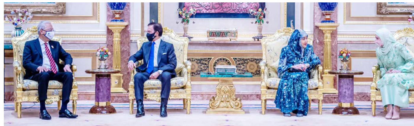
His Majesty Sultan Haji Hassanal Bolkiah Mu'izzaddin Waddaulah ibni Al-Marhum Sultan Haji Omar 'Ali Saifuddien Sa'adul Khairi Waddien, Sultan and Yang Di-Pertuan of Brunei Darussalam and Her Majesty Duli Raja Isteri Pengiran Anak Hajah Saleha binti Al-Marhum Pengiran Pemancha Pengiran Anak Haji Mohamed Alam during the Audience Ceremony with Yang Amat Berhormat Prime Minister of Malaysia and Yang Amat Berbahagia Datin Sri.