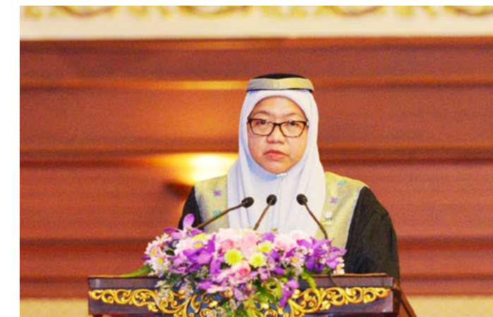
The Vice-Chancellor of UTB delivering her welcoming speech at the event.

To date, UTB has produced over 5,141 graduates under Brunei Darussalam Vocational and Technical Education Council (BDTEC) Higher National Diploma (HND); 295 under HND Level Five; 2,265 undergraduates; 365 Master's Degree graduates; and eight PhD graduates in Engineering; Business; Computing and Informatics; Applied Sciences and Mathematics; as well as Design.