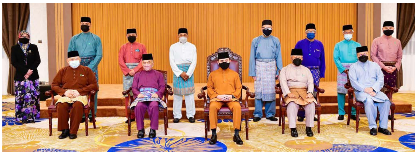
His Royal Highness Prince 'Abdul Malik, as the Chairman of the Yayasan Sultan Haji Hassanal Bolkiah (YSHHB) Committee of Governors in a group photo.