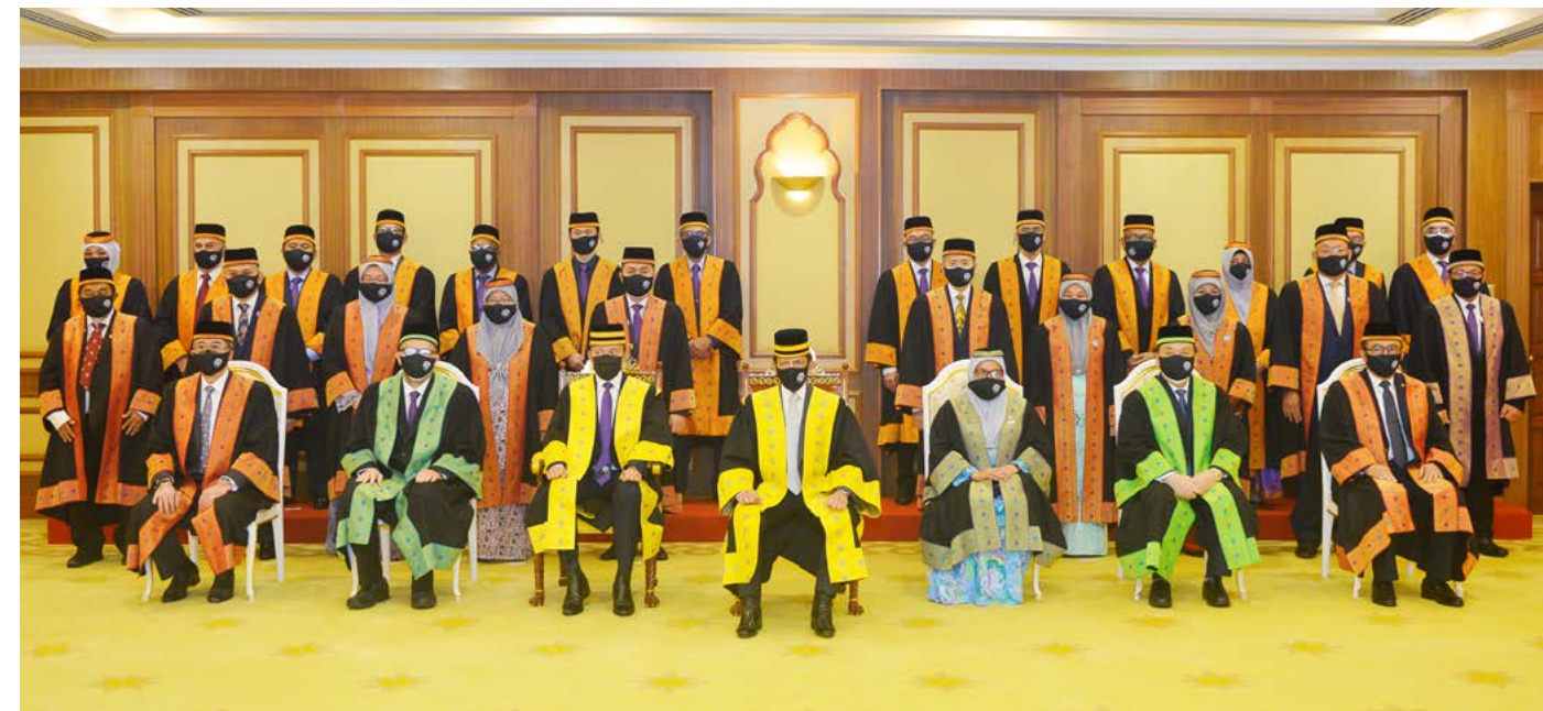
His Majesty the Sultan and Yang Di-Pertuan of Brunei Darussalam and His Royal Highness Prince (Dr.) Haji Al-Muhtadee Billah, the Crown Prince and Senior Minister at the Prime Minister's Office in a group photo with the council and senate members; vice-chancellor; core officers; academic workforce; as well as officers and staff members at the 9 th UTB Convocation Ceremony.