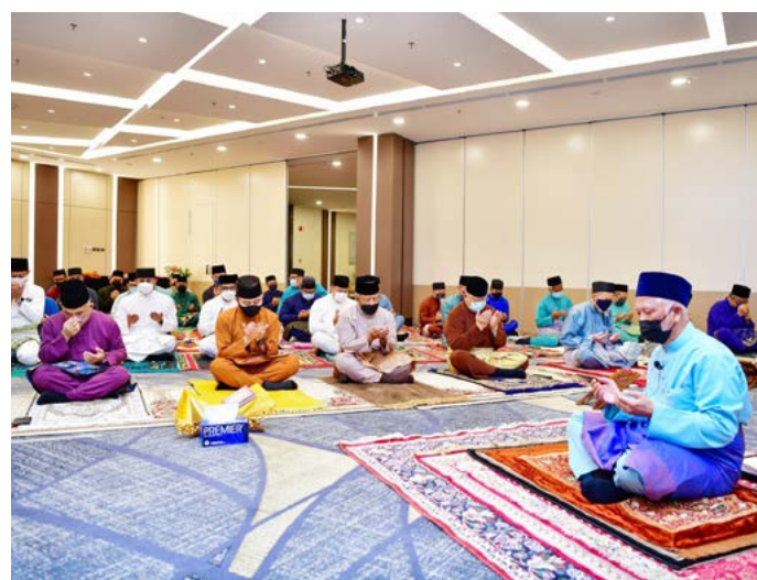
His Royal Highness Prince 'Abdul Malik attending the Doa Selamat Ceremony hosted by YSHHB, as the Secretariat of the Pengiran Muda Mahkota Al-Muhtadee Billah Fund for Orphans (DANA) to commemorate the birthday celebration of His Royal Highness the Crown Prince.

Also in attendance were members of the YSHHB Committee of Governors and Board of Directors, as well as the DANA Board of Trustees; along with special guests comprising contributors of DANA, officers, and staff members of YSHHB, as well as teachers from the YSHHB School.