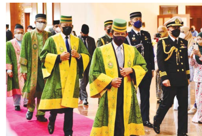
His Majesty the Sultan and Yang Di-Pertuan of Brunei Darussalam at UNISSA's 11 th Hafl Al-Takharuj. Accompanying His Majesty was His Royal Highness Prince (Dr.) Haji Al-Muhtadee Billah, the Crown Prince and Senior Minister at the Prime Minister's Office (PMO), the Pro-Chancellor of UNISSA.