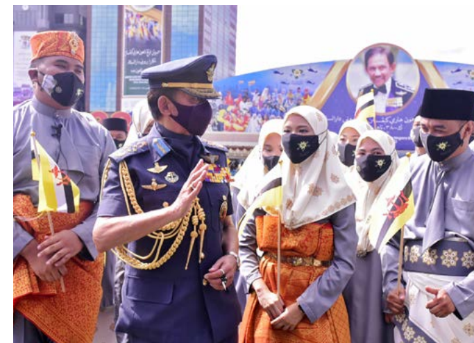
His Majesty during the get-together session with some of the participants at the event.

Also in attendance at the ceremony were His Majesty's sons: His Royal Highness Prince Haji Al-Muhtadee Billah; His Royal