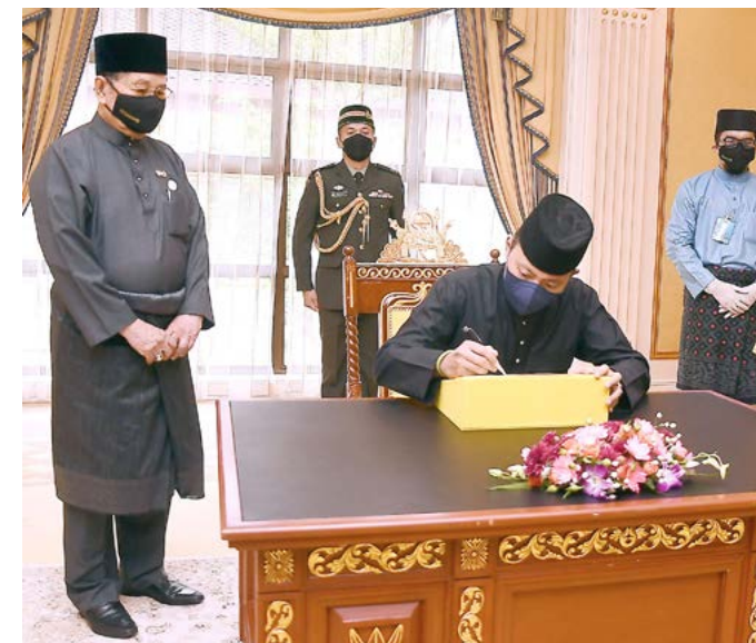
His Royal Highness signing a commemorative parchment.