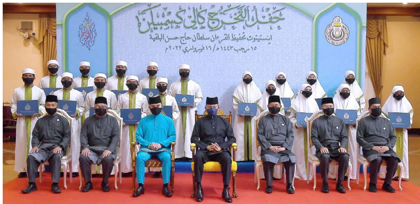
His Royal Highness Prince Haji Al-Muhtadee Billah ibni His Majesty Sultan Haji Hassanal Bolkiah Mu'izzaddin Waddaulah, the Crown Prince and Senior Minister at the Prime Minister's Office and His Royal Highness Prince 'Abdul Malik in a group photo with the graduates.