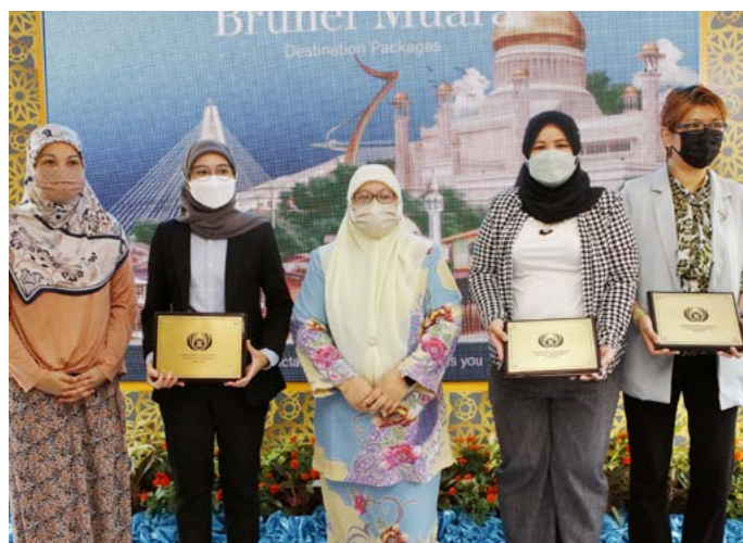
The Permanent Secretary at the Ministry of Primary Resources and Tourism (MPRT) in a group photo with the winners of the ASEAN MICE Venue Award at the Launching Ceremony for the Brunei-Muara Product Packages (left); and during the Launching Ceremony for the Belait Product Packages (right).

Also present were Members of the Legislative Council, senior officials government agencies as well as important tourism stakeholders.