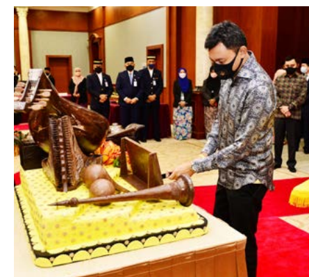
His Royal Highness the Crown Prince during the cake cutting session and receiving a pesambah (souvenir) at the the Royal Birthday Celebration hosted by the Prime Minister's Office (PMO).