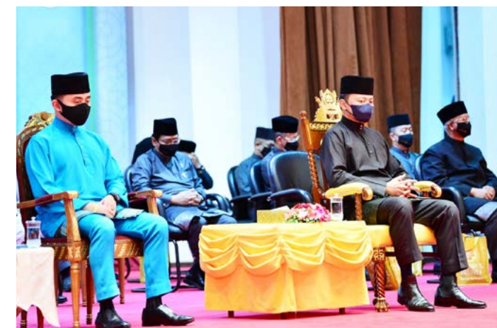
His Royal Highness the Crown Prince at the 9 th ITQSHHB Haflut Takharuj. Accompanying His Royal Highness was His Royal Highness Prince ‘Abdul Malik.