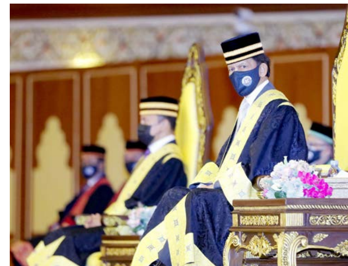
His Majesty the Sultan and Yang Di-Pertuan of Brunei Darussalam and His Royal Highness Prince (Dr.) Haji Al-Muhtadee Billah, the Crown Prince and Senior Minister at the Prime Minister's Office (PMO), the Pro-Chancellor of UTB at the 9 th UTB Convocation Ceremony (above and below).