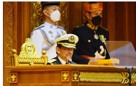
11. First Meeting of 18 th LegCo session commences