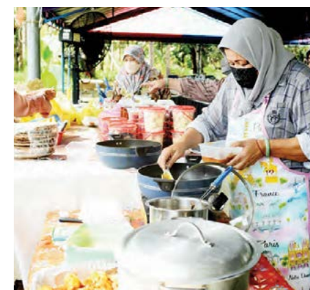
Among the Tutong Product Packages available at the Tutong District hoped to boost domestic tourism in the country.