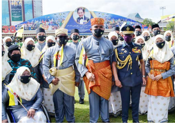
His Majesty during the get-together session with some of the participants at the event.