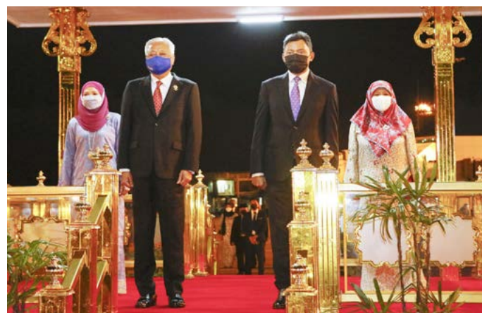
His Royal Highness the Crown Prince and Her Royal Highness Princess Hajah Masna welcoming the arrival of the Prime Minister of Malaysia and spouse, along with their delegation.

The two-day official visit was aimed at strengthening the existing bilateral relations; while bolstering the 'Malaysian Family' network on an ASEAN level. During the visit, the Prime Minister also invited His Majesty to attend the 24 th Annual Leaders' Consultation, which will take place in Malaysia this year.