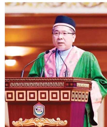
The Rector of UNISSA delivering his welcoming speech at the event.