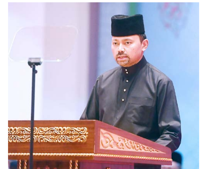
His Royal Highness Prince Haji Al-Muhtadee Billah ibni His Majesty Sultan Haji Hassanal Bolkiah Mu’izzaddin Waddaulah, the Crown Prince and Senior Minister at the Prime Minister’s Office delivering a sabda (royal speech) at the 9 th Institut Tahfiz Al-Quran Sultan Haji Hassanal Bolkiah (ITQSHHB) Haflut Takharuj (Convocation Ceremony).