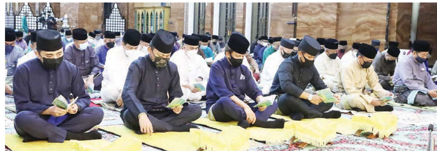
His Majesty the Sultan and Yang Di-Pertuan of Brunei Darussalam, His Royal Highness Prince Haji Al-Muhtadee Billah; His Royal Highness Prince 'Abdul Malik; and His Royal Highness Prince 'Abdul Mateen at the Kesyukuran Ceremony in conjunction with the 38 th National Day Celebration.