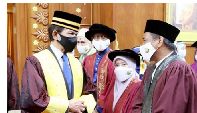
His Majesty interacting with some of the graduates at the ceremony (above and below).

On the international aspect, His Majesty stated that KUPU SB