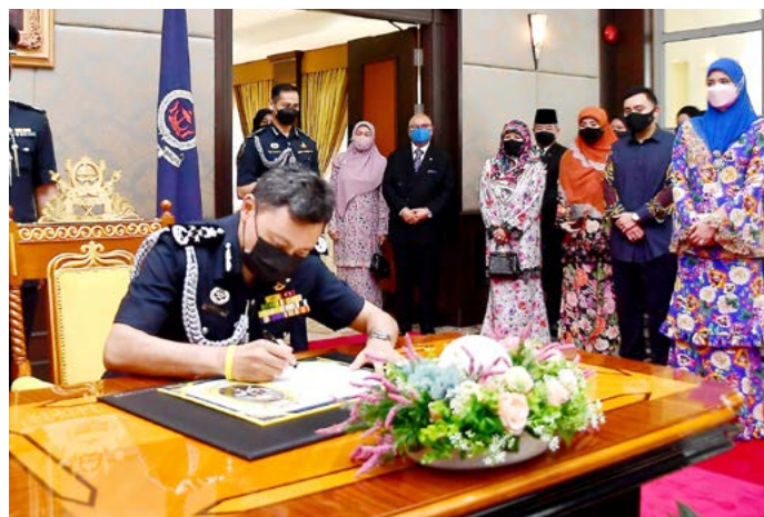
His Royal Highness the Crown Prince signing a commemorative parchment (left); and receiving a pesambah (souvenir) from the Commissioner of Police.