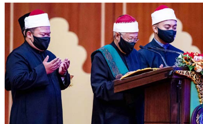
Yang Berhormat the State Mufti leading the recitation of doa selamat .

His Majesty welcomed collaborations between UTB and industry players – including UTB's cooperation with Brunei Shell Petroleum and Shell Deepwater Borneo to set up the Artificial Intelligence Lab at the university (which is a 'Gift to the Nation'); its collaboration with Huawei ICT Academy Laboratory through value-added certification in information communications technology (ICT) for the global job market; setting up a 5G laboratory with the Authority for Info-communications Technology Industry of Brunei Darussalam (AITI); and an articulation programme with Micronet International College in computer science, which will produce