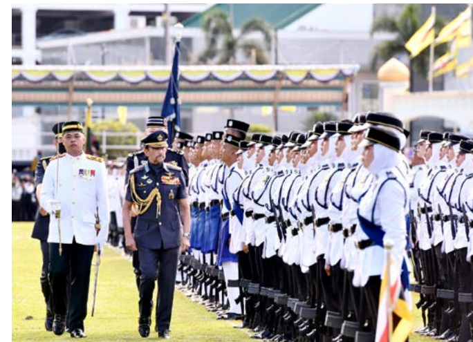
His Majesty the Sultan and Yang Di-Pertuan of Brunei Darussalam inspecting the Guard of Honour at the 38 th National Day Celebration.

Previously, on February 22, His Majesty also attended a Kesyukuran Ceremony in conjunction with the 38 th National Day Celebration.