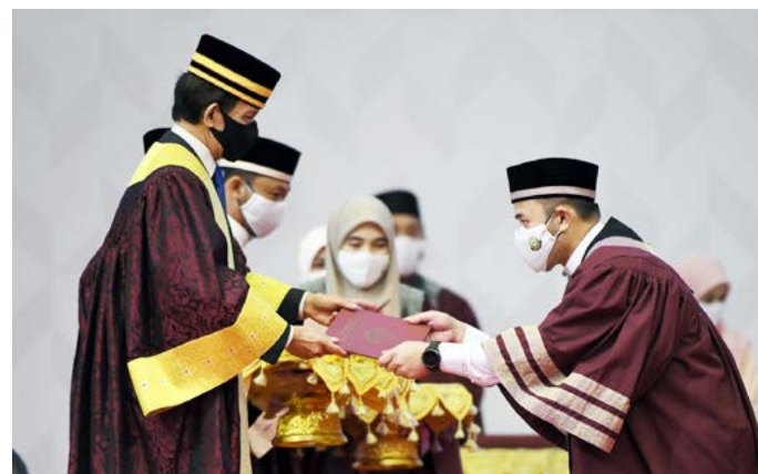
His Majesty conferring Degree and Diploma certificates to some of the graduates at the ceremony.