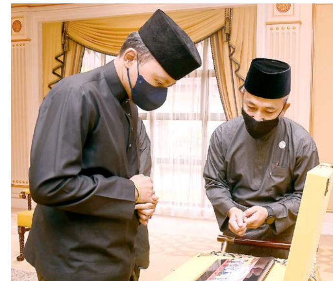
His Royal Highness receiving a pesambah (souvenir).