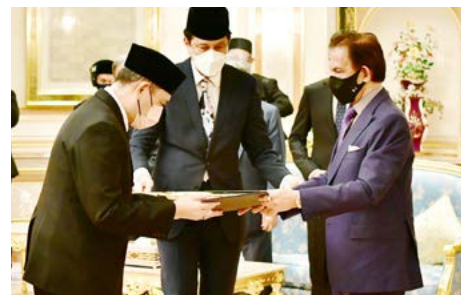
3. Newly appointed Judicial Commissioner recites oath