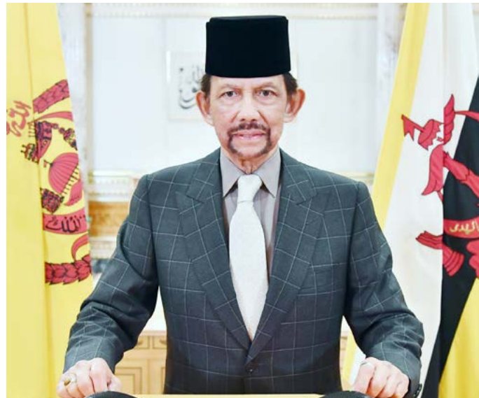
His Majesty Sultan Haji Hassanal Bolkiah Mu’izzaddin Waddaulah ibni Al-Marhum Sultan Haji Omar ‘Ali Saifuddien Sa’adul Khairi Waddien, Sultan and Yang Di-Pertuan of Brunei Darussalam delivering a titah (royal speech) in conjunction with the national level Israk Mikraj Celebration for the year 1443 Hijrah/2022 Masihi.

To bless the ceremony, a doa selamat was recited by Yang Berhormat State Mufti.