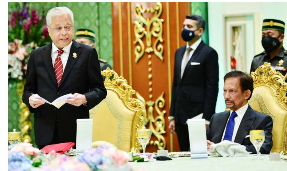
Yang Amat Berhormat Prime Minister of Malaysia delivering a speech at the Official Luncheon.