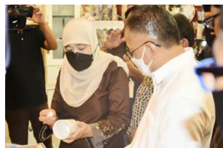
29. MPRT sees launching of tourism product packages