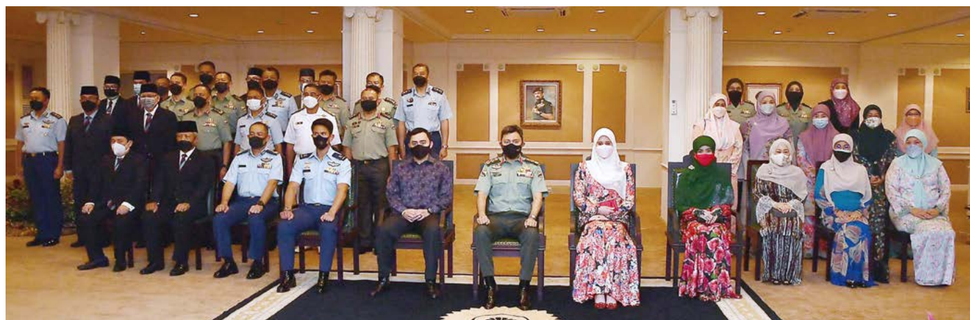
His Royal Highness the Crown Prince and Her Royal Highness Paduka Seri Pengiran Anak Isteri Pengiran Anak Sarah binti Pengiran Haji Salleh Ab. Rahaman attending the High Tea Reception hosted by the Ministry of Defence (MinDef) and the Royal Brunei Armed Forces (RBAF) in conjunction the birthday celebration. Accompanying Their Royal Highnesses at the Bolkiah Garrison Officers' Mess were His Royal Highness Prince 'Abdul Malik and Yang Amat Mulia Pengiran Anak Isteri Pengiran Raabi'atul 'Adawiyah; and His Royal Highness 920 Major (U) Prince 'Abdul Mateen.