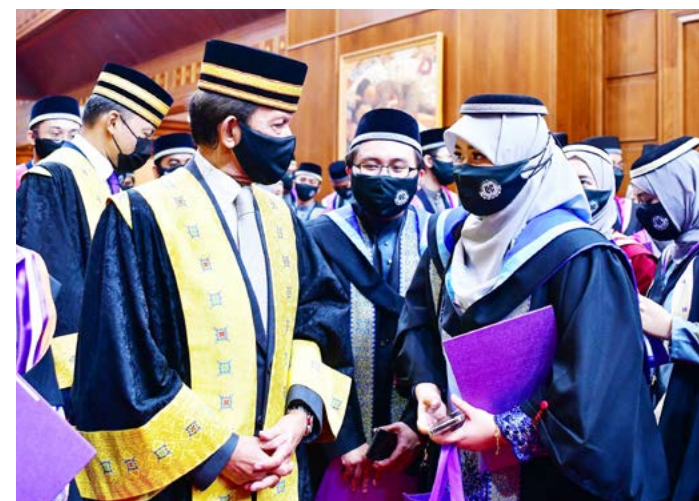
His Majesty and His Royal Highness the Crown Prince interacting with the graduates at the ceremony (left); His Majesty in a group photo with some of the graduates at the ceremony (right).