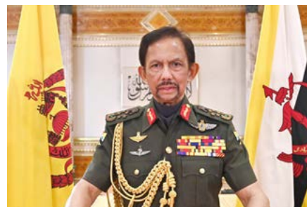
10. Coherence, agreement required in nation building