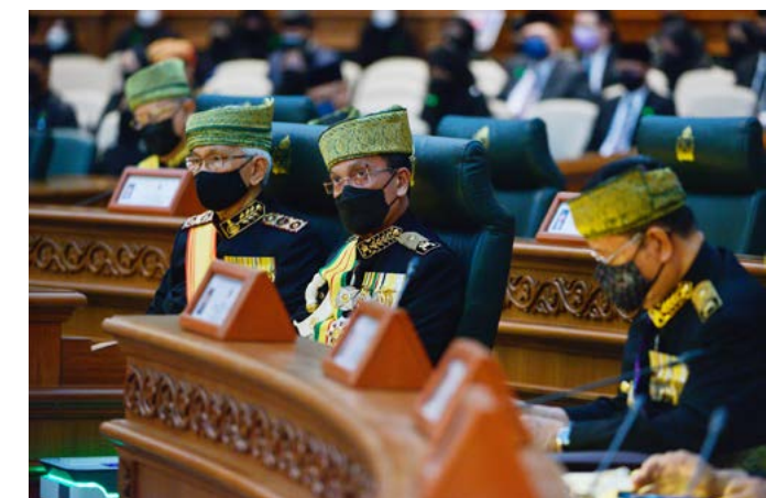
Among the members of LegCo at the Opening Ceremony (above and right).