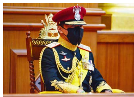
Also present at the opening ceremony were His Majesty's son and brother: His Royal Highness Prince Haji Al-Muhtadee Billah, the Crown Prince and Senior Minister at the Prime Minister's Office; and His Royal Highness Prince Mohamed Bolkiah.