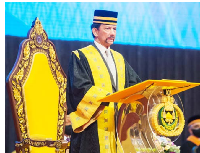
His Majesty Sultan Haji Hassanal Bolkiah Mu'izzaddin Waddaulah ibni Al-Marhum Sultan Haji Omar 'Ali Saifuddien Sa'adul Khairi Waddien, Sultan and Yang Di-Pertuan of Brunei Darussalam, the Chancellor of Universiti Teknologi Brunei (UTB) delivering a titah (royal speech) at the 9 th UTB Convocation Ceremony.

BERAKAS, February 12 – His Majesty Sultan Haji Hassanal Bolkiah Mu'izzaddin Waddaulah ibni Al-Marhum Sultan Haji Omar 'Ali Saifuddien Sa'adul Khairi Waddien, Sultan and Yang Di-Pertuan of Brunei Darussalam, the Chancellor of Universiti Teknologi Brunei (UTB) consented to attend and officiate the 9 th UTB Convocation Ceremony.