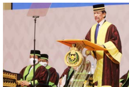
20. KUPU SB gains popularity in educational field