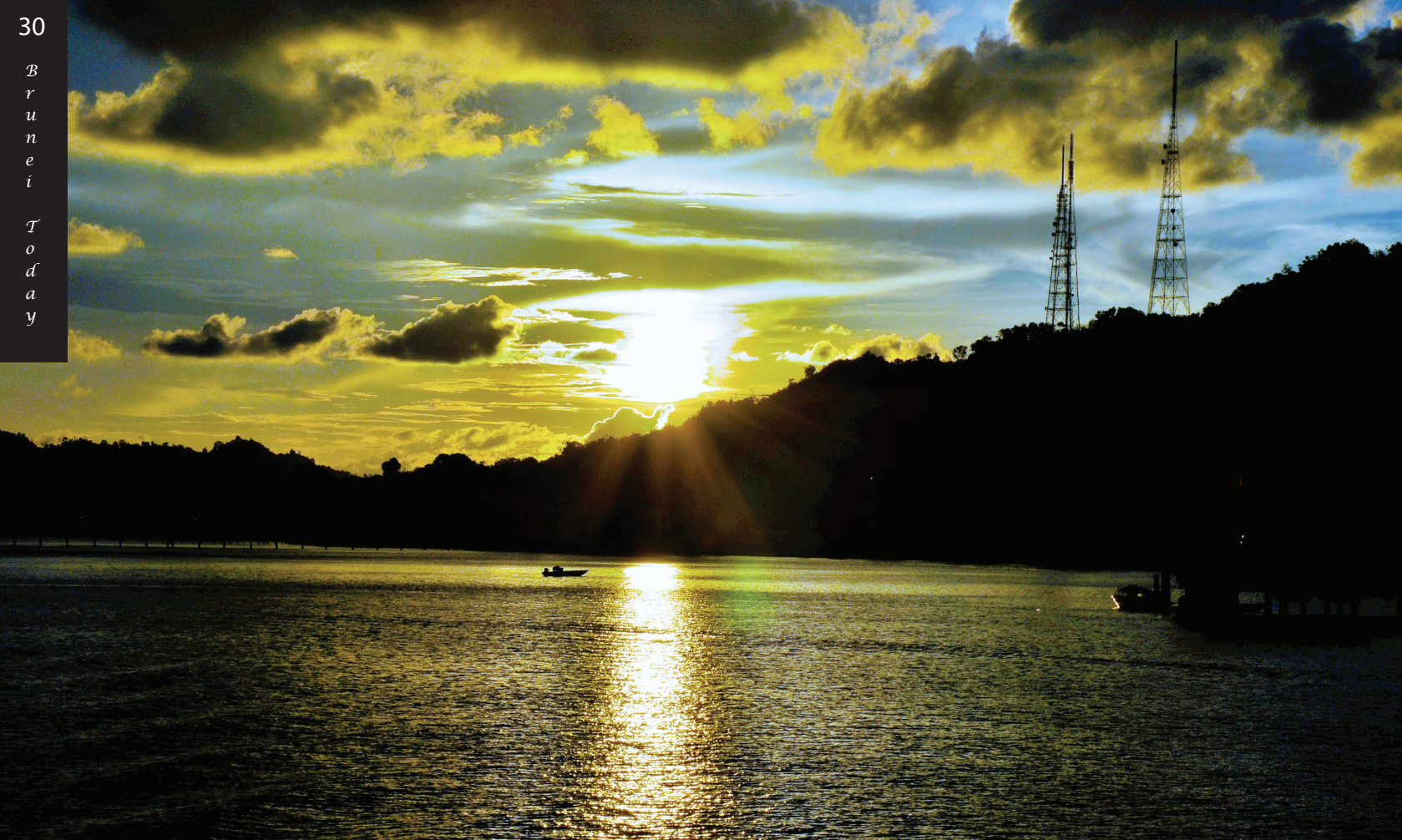
RELAXING ... Enjoying the beautiful sunset.

in terms of food that is by introducing traditional Brunei food.