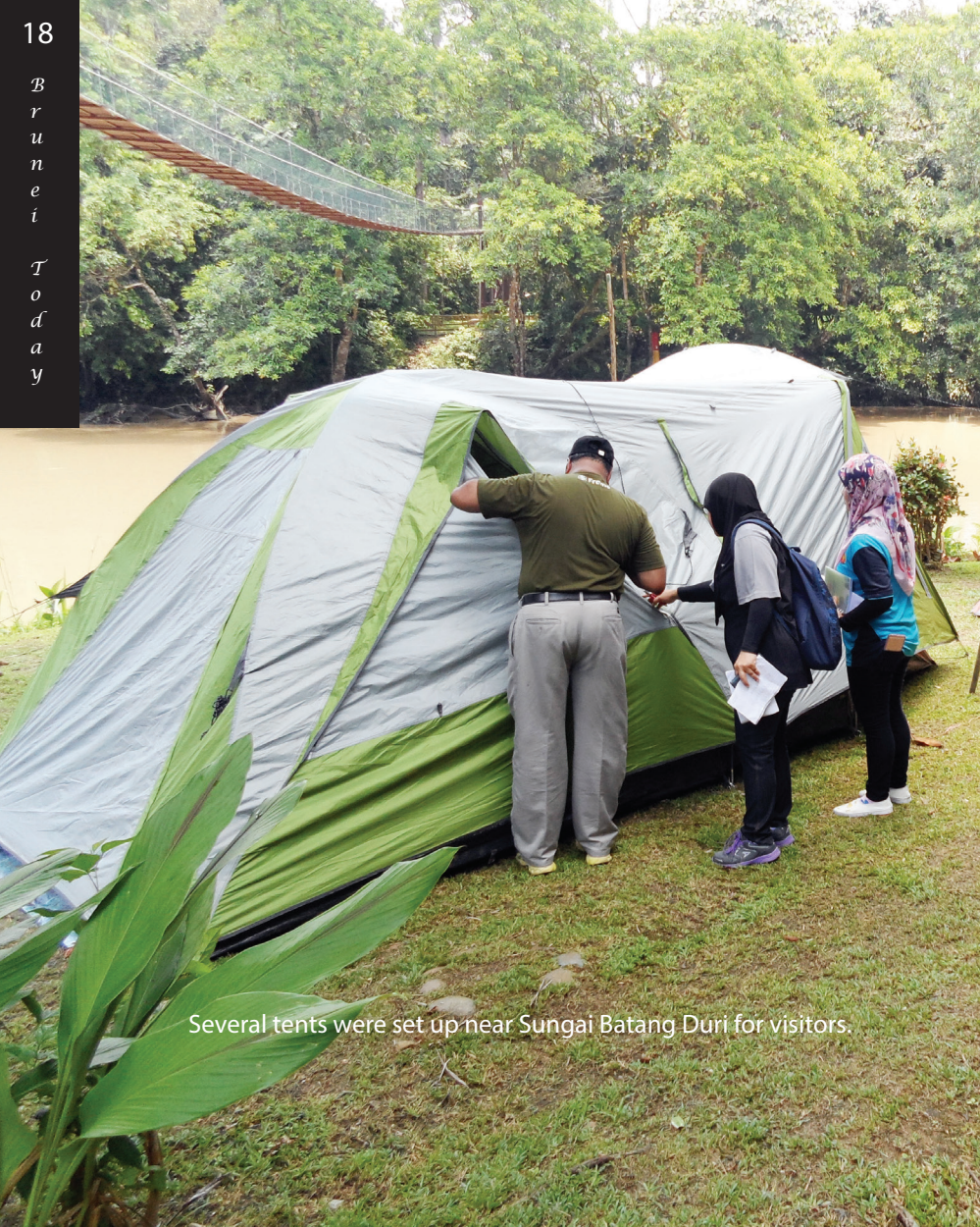
Several tents were set up near Sungai Batang Duri for visitors.