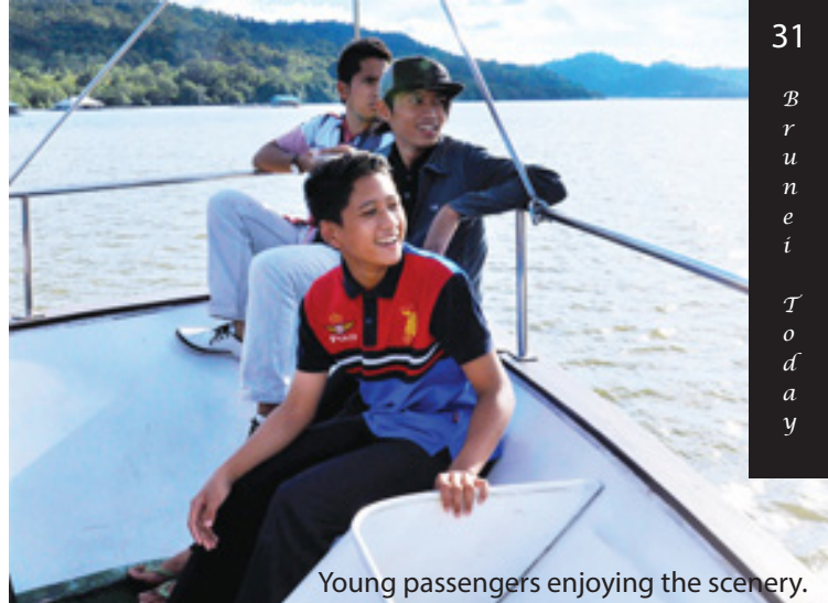
Young passengers enjoying the scenery.

Clearly now, with the Ministry Of Primary Resources and Tourism's cooperation, it will boost the country economy through tourism to be more prominent because it is not possible for us to implement this kind of efforts if we do not try and there is no failure in the early endeavor undertaken because failure is the beginning of success before something is done.