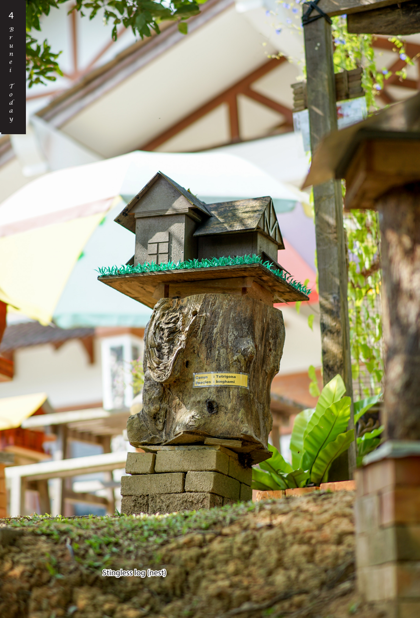
Stingless log (nest)