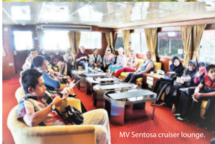
MV Sentosa cruiser lounge.