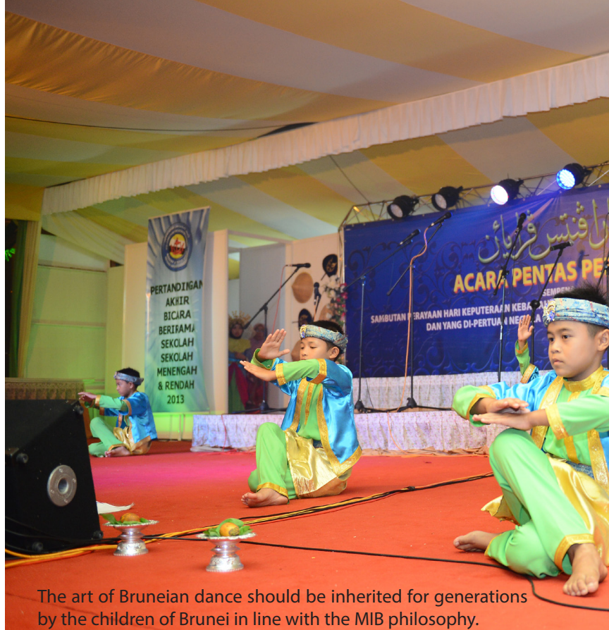
The art of Bruneian dance should be inherited for generations by the children of Brunei in line with the MIB philosophy.

Additionally, it will also be able to create a society that is disciplined, courteous, obedient and confident, whether for trainings or competitions or matches.