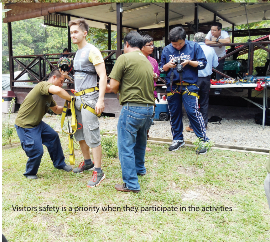
Visitors safety is a priority when they participate in the activities

Initiatives by Freme Travel Services like this will hopefully help develop the tourism sector in the country thus will diversify the economy and create employment opportunities for the locals, in line with the National Vision 2035 towards making Brunei Darussalam known around the world, with a dynamic and resilient economy.