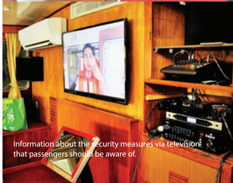
Information about the security measures via television that passengers should be aware of.