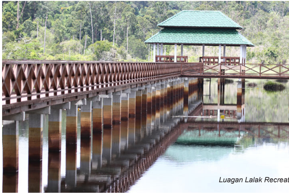
Luagan Lalak Recreational Park

Among the tourist attractions in Mukim Labi are Luagan Lalak Recreational Park and Wasai Wong Kadir.