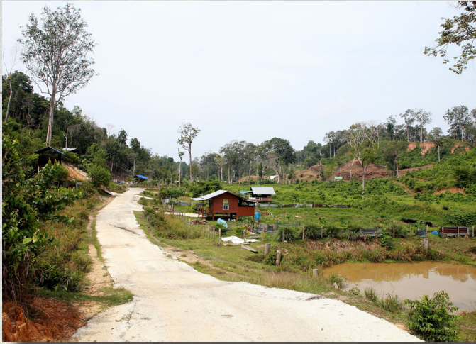
The two-kilometer road built at the MPK Katimahar Agri Park.