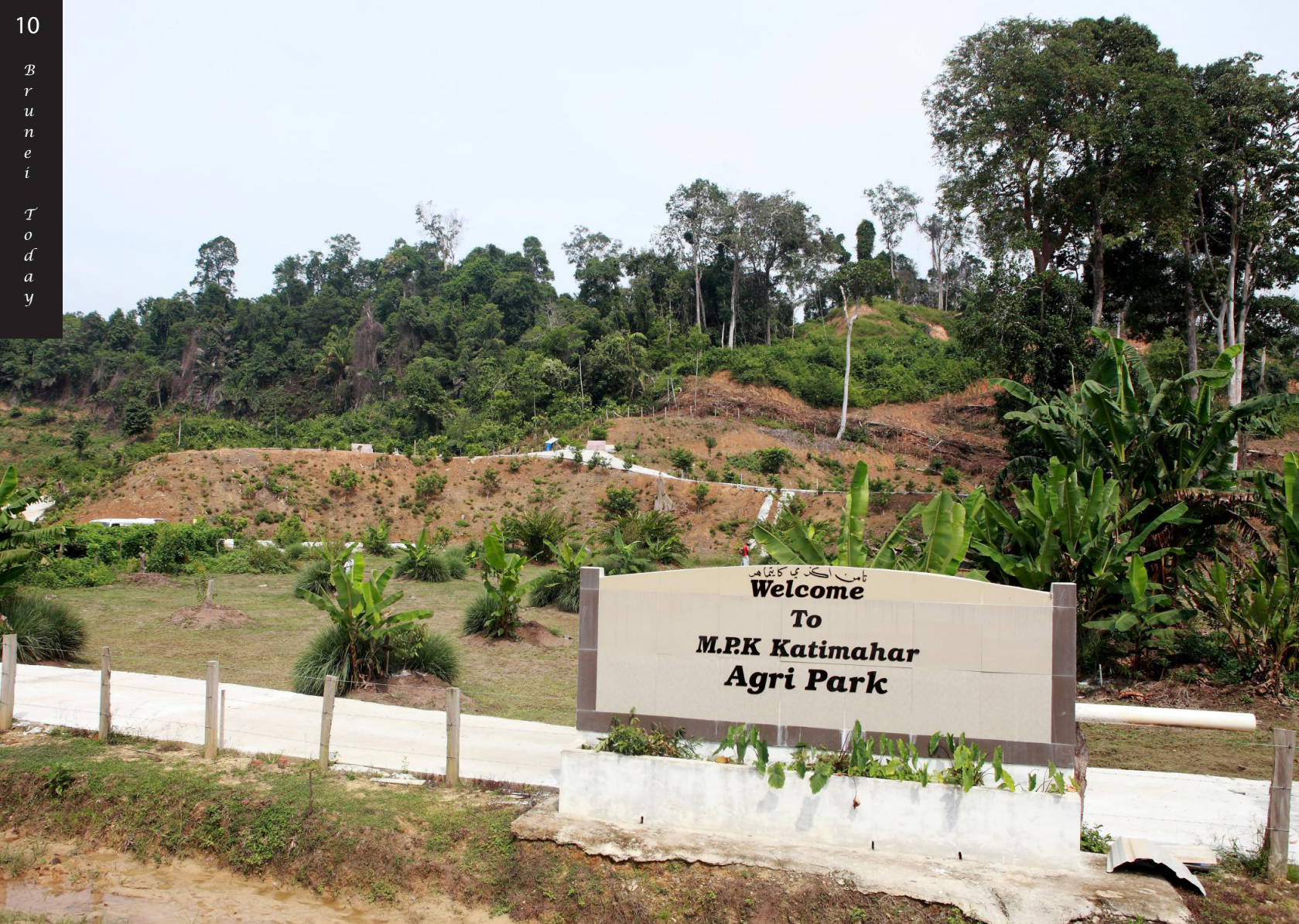
Welcome to The Park sign board showing at the entrance of the park.