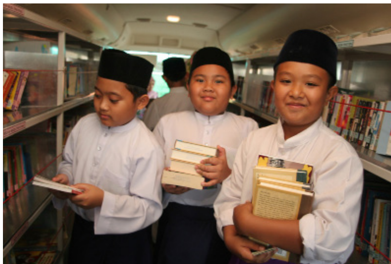
Every student being allowed to borrow up to five books.

The type of books borrowed was all kinds of books including books that were requested by demand.