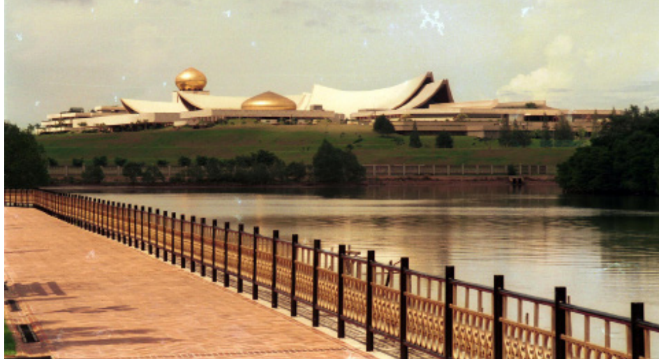
View of Istana Nurul Iman from Damuan Recreation Park