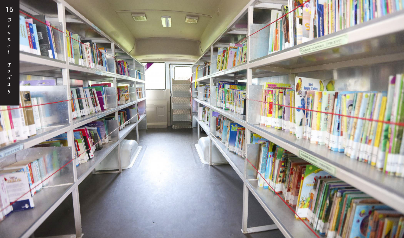
Some of the books stored neatly in the bus Mobile Library Service.