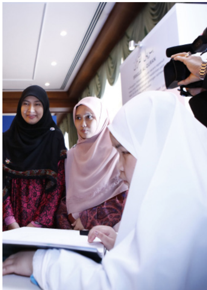
Demonstration by special needs student during Teacher’s Day exhibition.

Poetry of the late Sultan Haji Omar ‘Ali Saifuddin Sa’adul Khairi Waddien are also displayed, in addition to related photographs. The public also has the opportunity to see the rationale behind the date September 23 being chosen as Teacher’s Day and the aim of the Teacher’s Day celebration for the past 25 years with their related photographs.