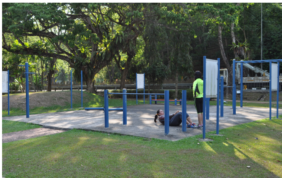
Visitors to Damuan Recreation Park can also do exercises and physical activities for a healthy lifestyle.