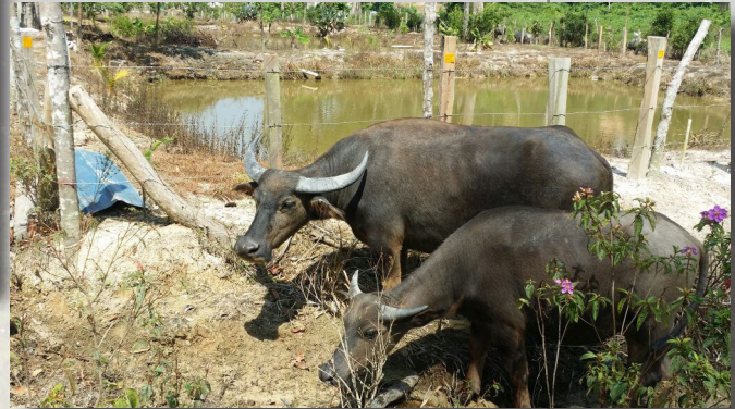
Some of the buffaloes reared in the Katimahar Agri Park.