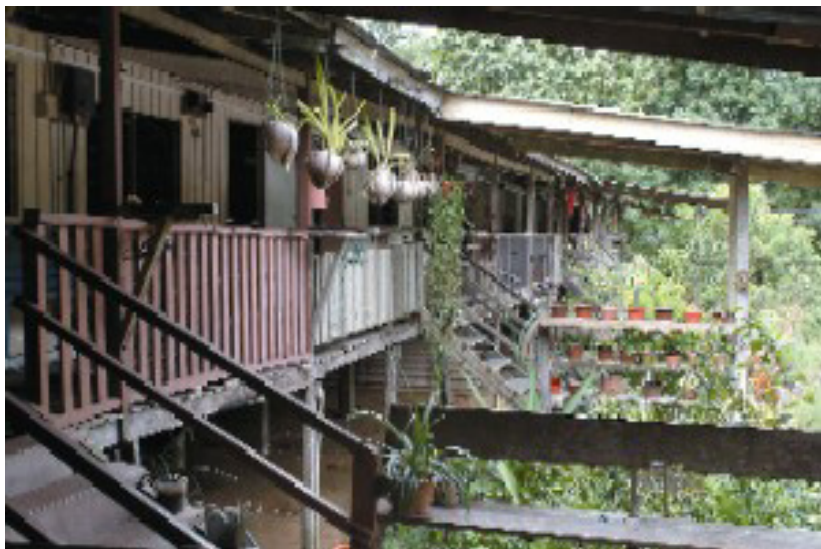
Rumah Panjang or long houses