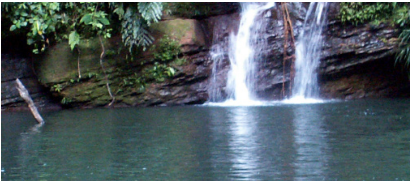
Wasai Wong Kadir a popular spot for picnics is the waterfall.

In Mukim Labi, for the purpose of residents leisure and recreation a multi-purpose hall have been built which includes Sepak Takraw court, badminton court, meeting room, bath room, lounge and so on. Visitors who visit and want to stay in Mukim Labi also have the option of staying in 'home stay' residence.