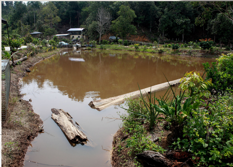
Some of the freshwater fish cultivated in the pond