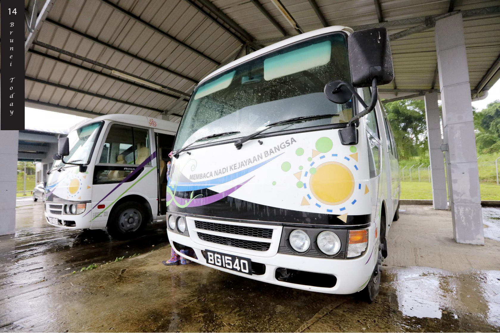
Two of the buses that are used for the mobile library service.