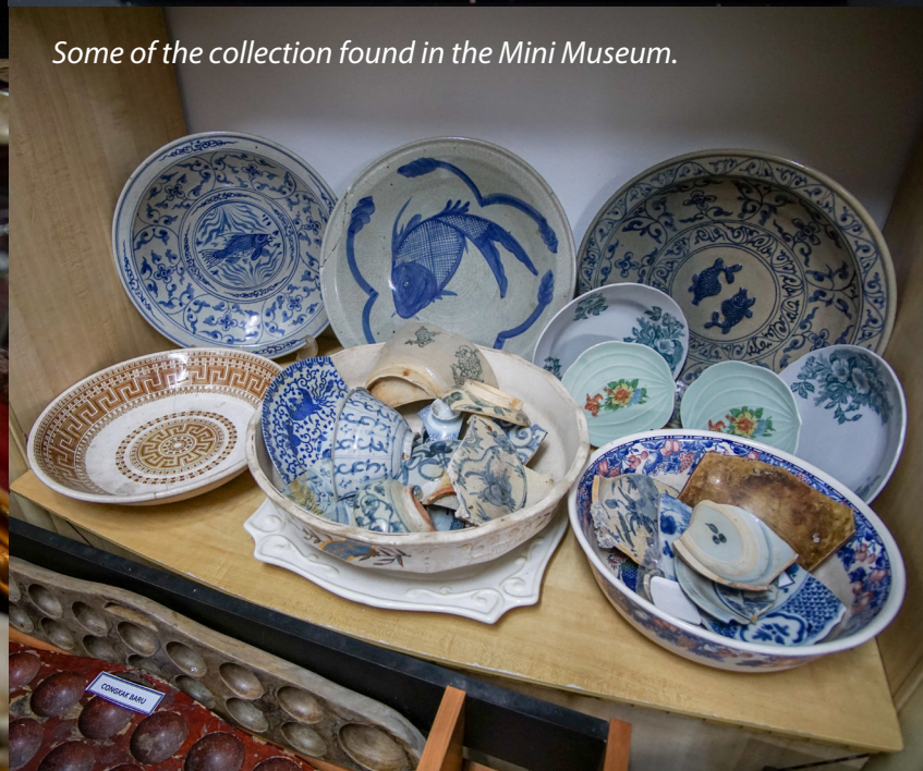
Some of the collection found in the Mini Museum.