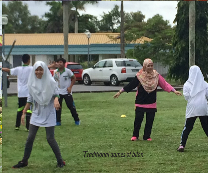
Traditional games of bilon