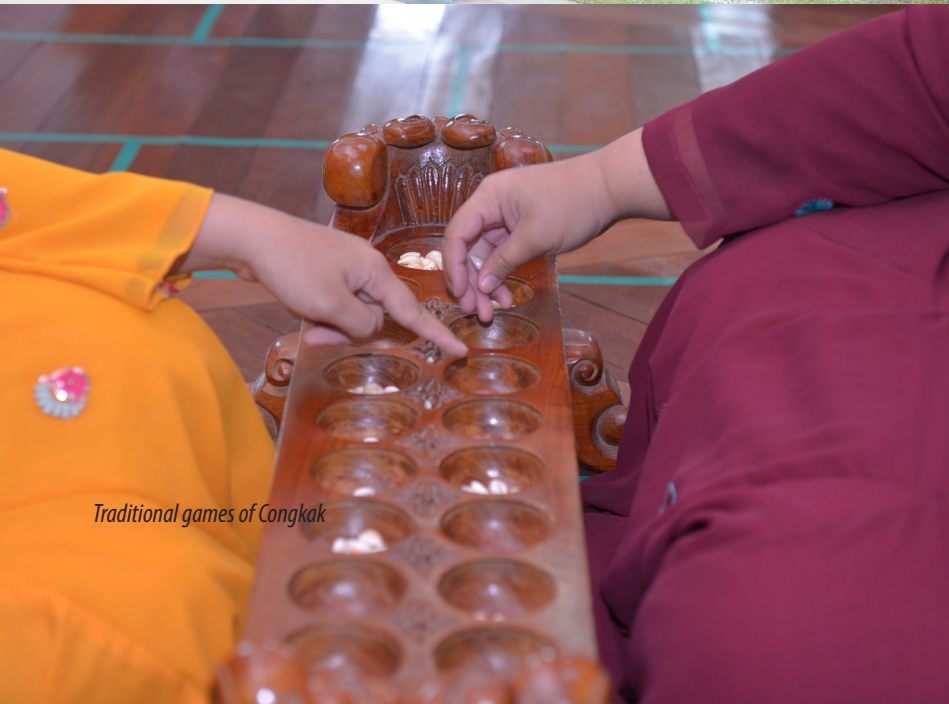
Traditional games of Congkak