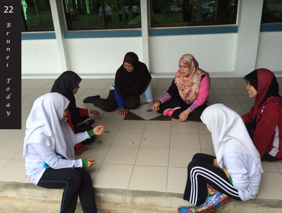
Traditional games of simban