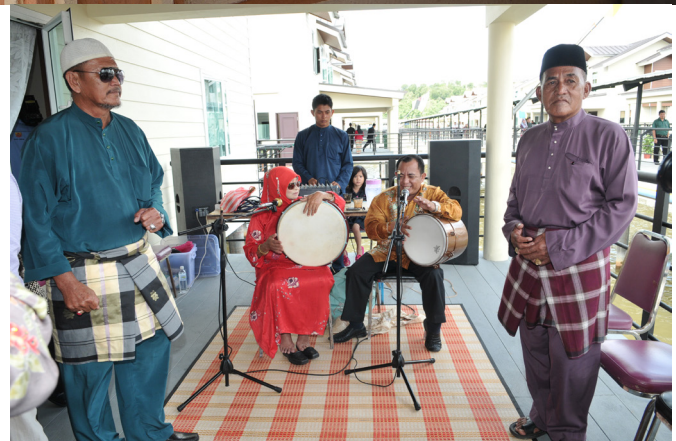
Tourists visiting the houses in Lurong Sikuna Village.

The pioneer upgrading project for Kampong Ayer is meant to provide infrastructure and facilities for the residents in the interest of future generations living with a high quality of life. The project would undoubtedly increase the pulling power of Kampong Ayer in a unique way, consistent with the demands of the day and the present climate of change.