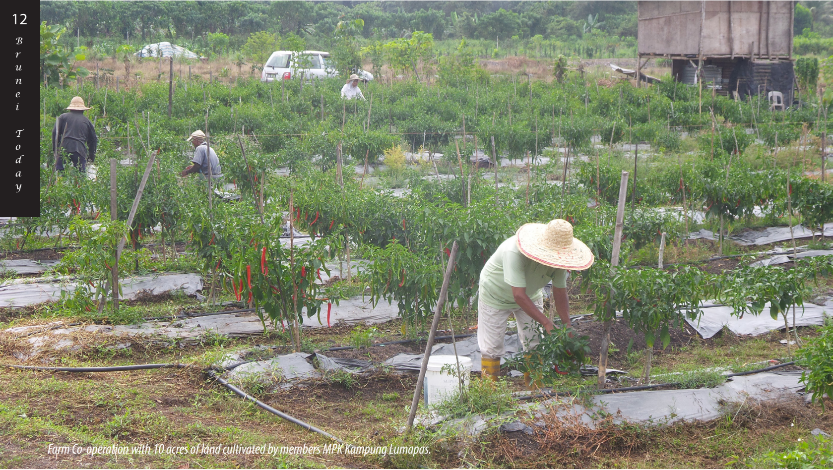
Farm Co-operation with 10 acres of land cultivated by members MPK Kampung Lumapas.