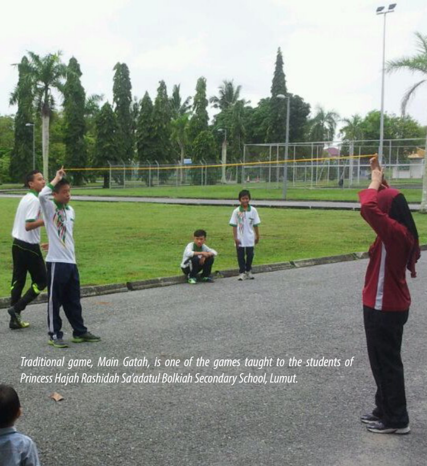
Traditional game, Main Gatah , is one of the games taught to the students of Princess Hajah Rashidah Sa'adatul Bolkiah Secondary School, Lumut.

Some examples of Brunei's traditional indoor games are congkak , pasang , catur , simban and others. In the past, the games are played during the wedding ceremony on Malam Berjaga-Jaga ,