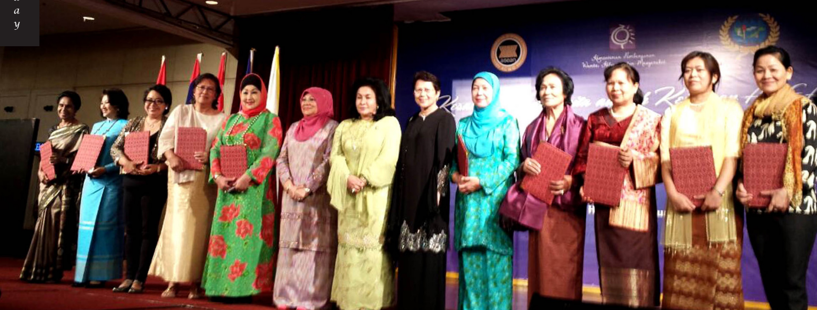
Delegation of Brunei Darussalam with the delegates from other countries discussing on issues concerning women.