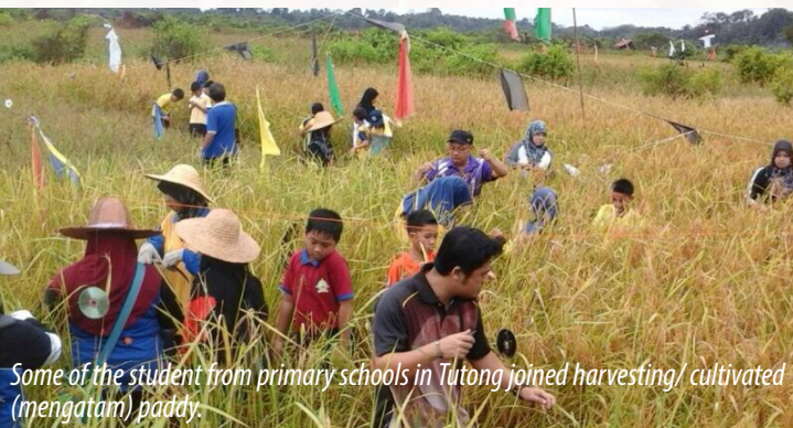
Some of the student from primary schools in Tutong joined harvesting/ cultivated (mengatam) paddy.