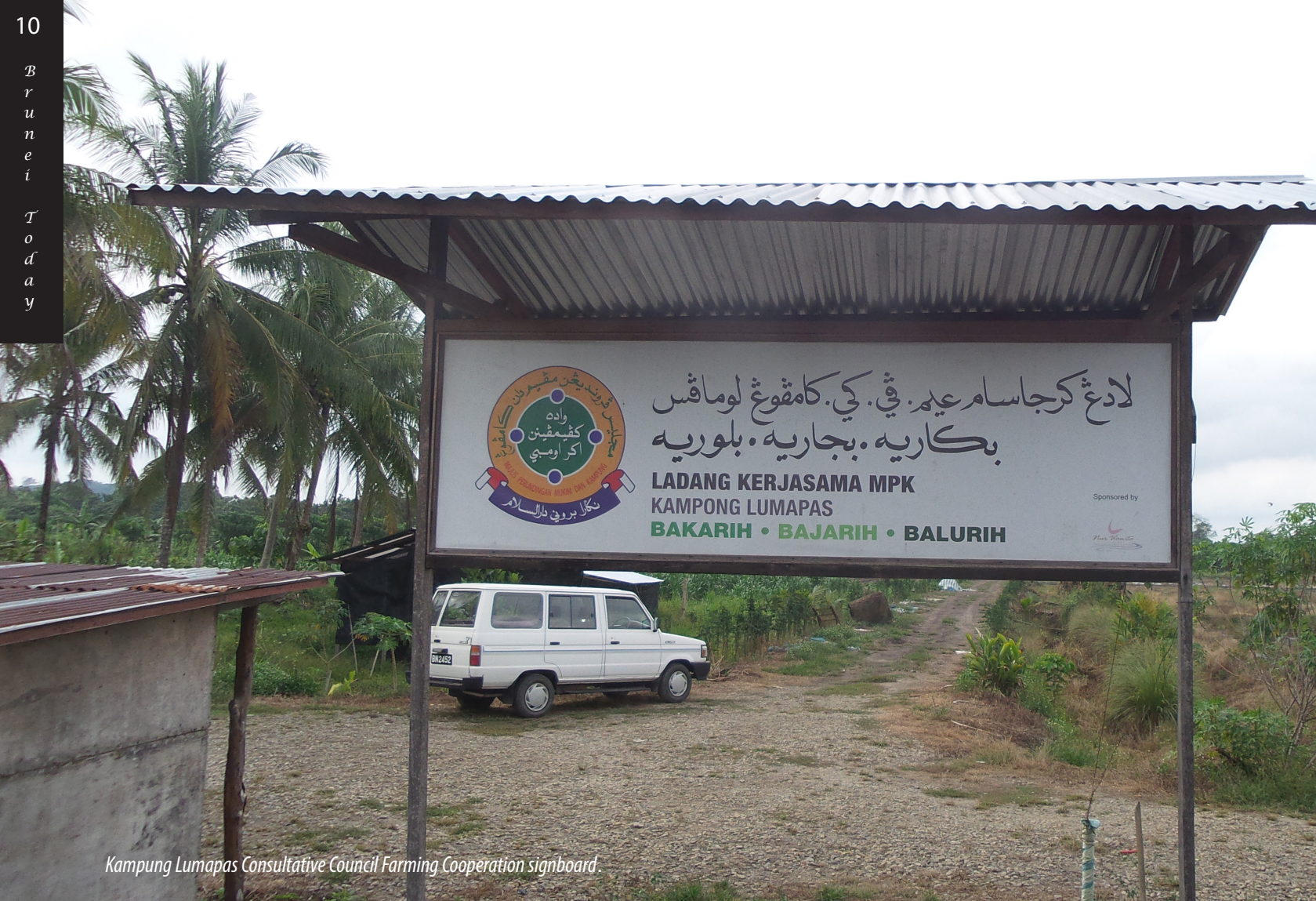
Kampung Lumapas Consultative Council Farming Cooperation signboard.