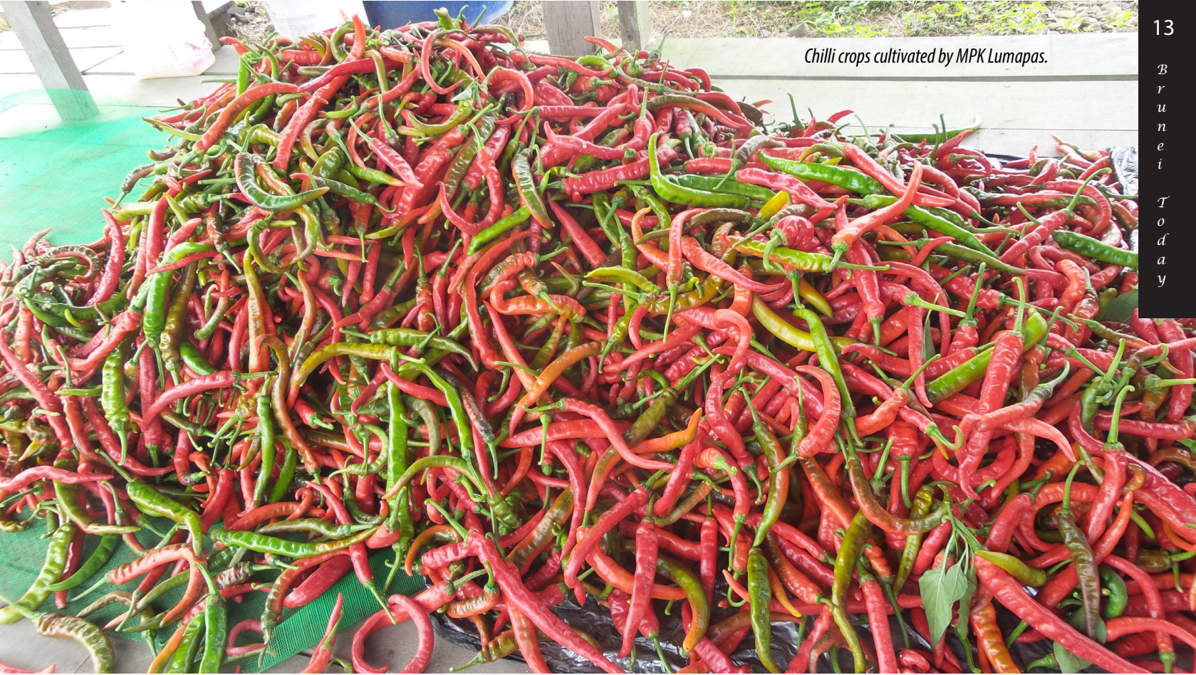
Chilli crops cultivated by MPK Lumapas.