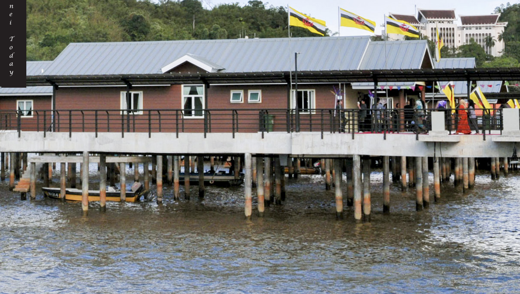
The type 'A' House (one-storey)

This project was implemented on the 2 nd of April 2, 2011 and completed on 10 th July, 2012.