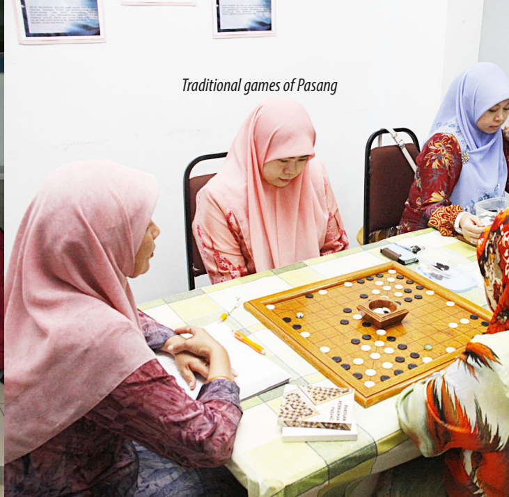
Traditional games of Pasang