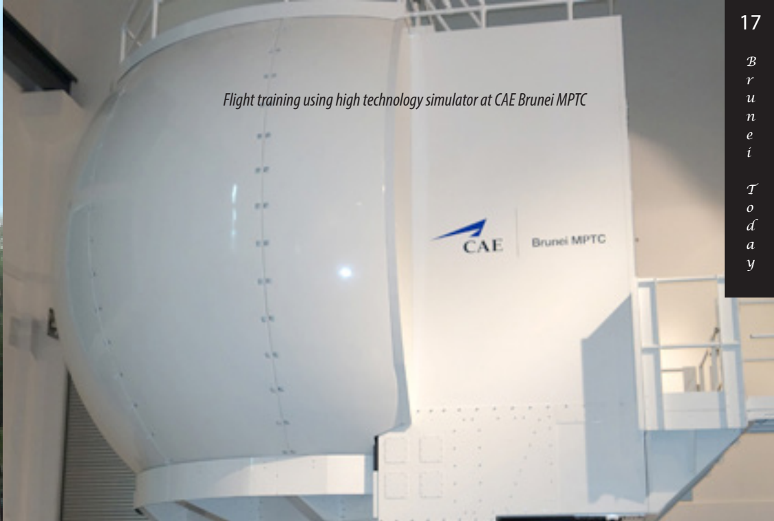
Flight training using high technology simulator at CAE Brunei MPTC