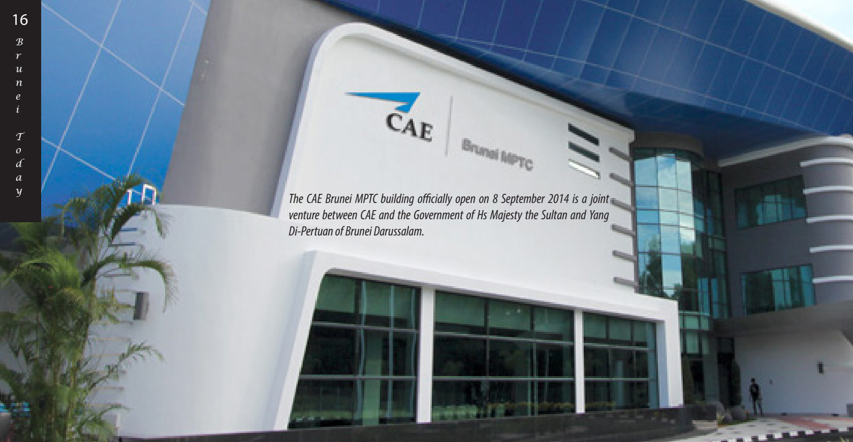
The CAE Brunei MPTC building officially open on 8 September 2014 is a joint venture between CAE and the Government of His Majesty the Sultan and Yang Di-Pertuan of Brunei Darussalam.