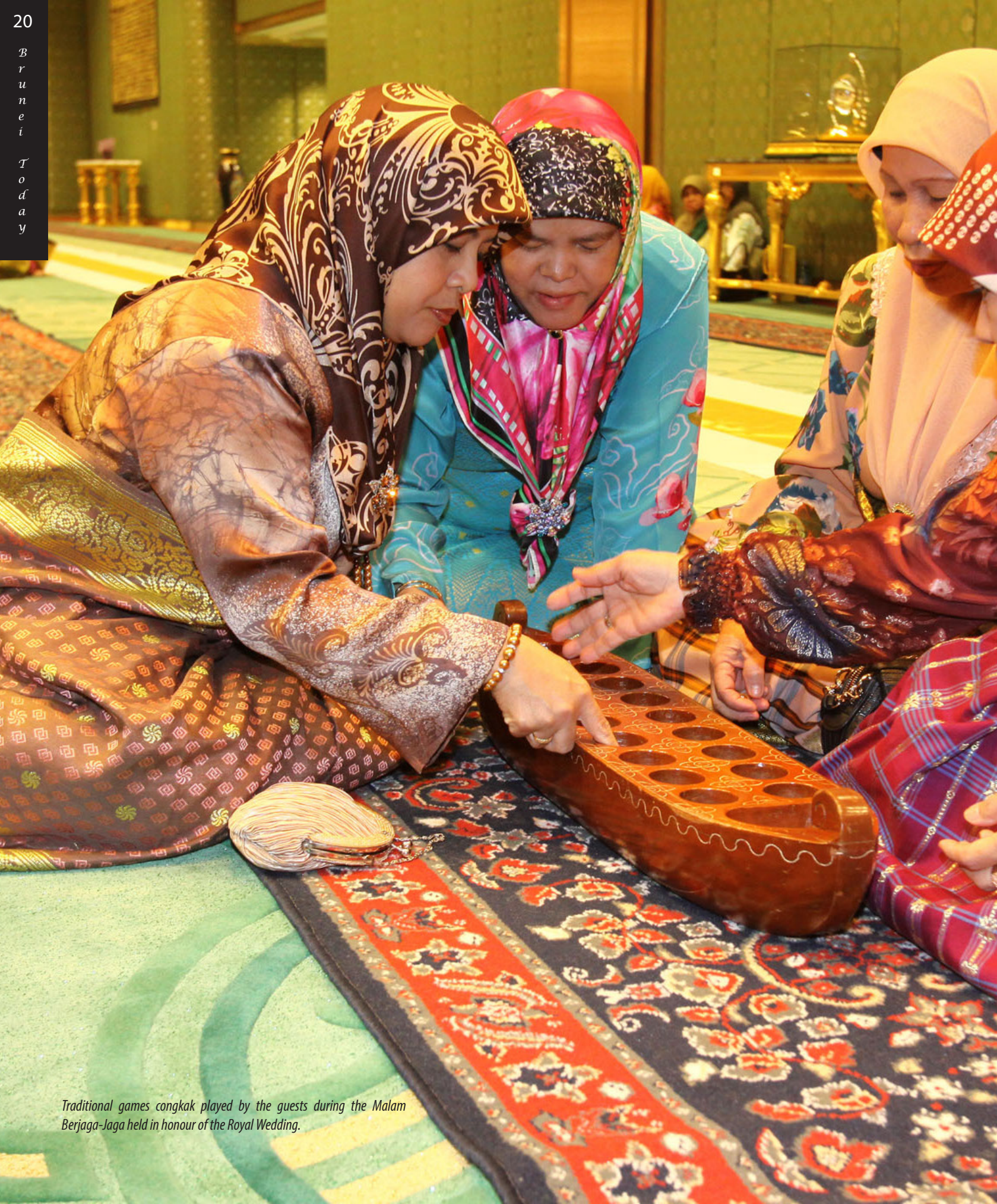
Traditional games congkak played by the guests during the Malam Berjaga-Jaga held in honour of the Royal Wedding.