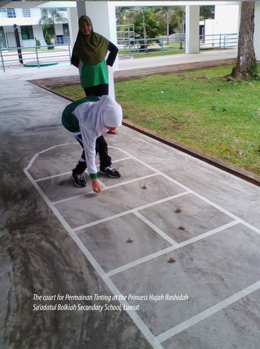
The court for Permainan Tinting at the Princess Hajah Rashidah Sa'adatul Bolkiah Secondary School, Lumut