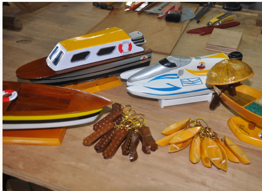
Products that are neatly displayed.