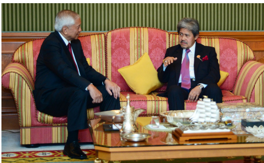
His Royal Highness Prince Mohamed Bolkiah the Minister of Foreign Affairs and Trade, held a meeting with the Secretary of Foreign Affairs of the Philippines, His Excellency Albert F. Del Rosario

His Royal Highness Paduka Seri Pengiran Muda Haji 'Azim, Her Royal Highness Princess 'Azemah Ni'matul Bolkiah and Her Royal Highness Princess Fadzilah Lubabul Bolkiah were also present at the ceremony.