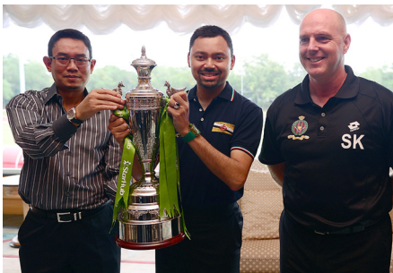
8 DPMM FC the Champions of Singapore League Cup 2014