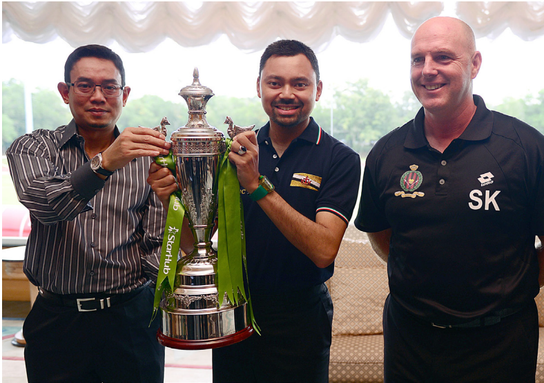
Chairman of the football club DPMM FC consented to receive Starhub Singapore League Cup hosted by the Vice-Chairman of the DPMM FC Football Club.

It has become a tradition to commemorate the Revelation of Al-Quran Karim to Prophet Muhammad Sallallahu Alaihi Wassallam on every 17 th of Ramadan of the Hijrah Year.