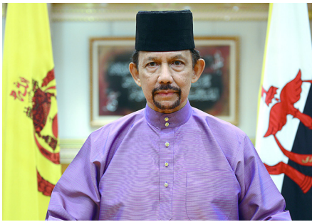
1 Religion as torch and guide