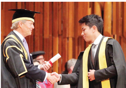
12 His Royal Highness Pengiran Muda Abdul Mateen granted Bachelor of Arts