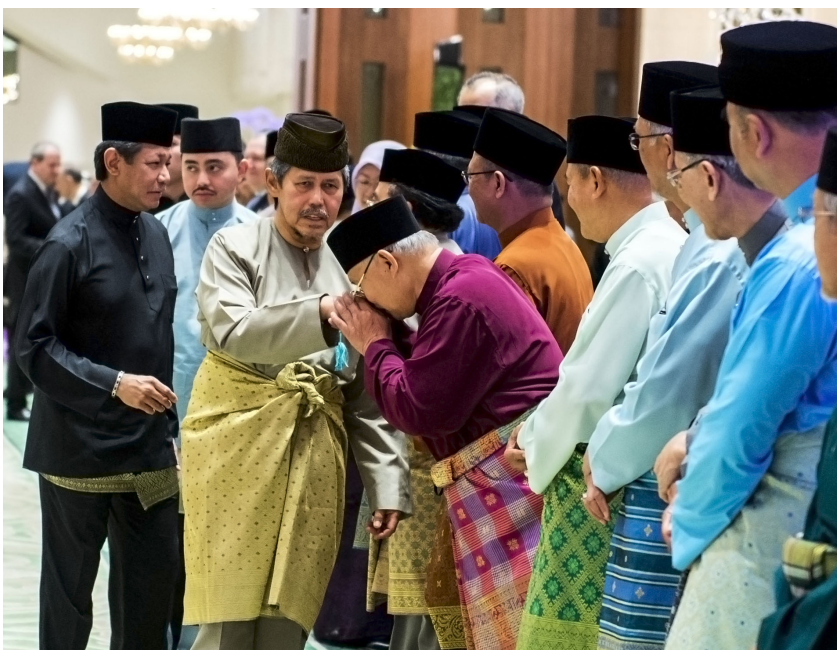
His Royal Highness Prince Mohamed Bolkiah, His Royal Highness Prince Haji Jefri Bolkiah, His Royal Highness Prince 'Abdul Malik meeting with the national dignitaries.