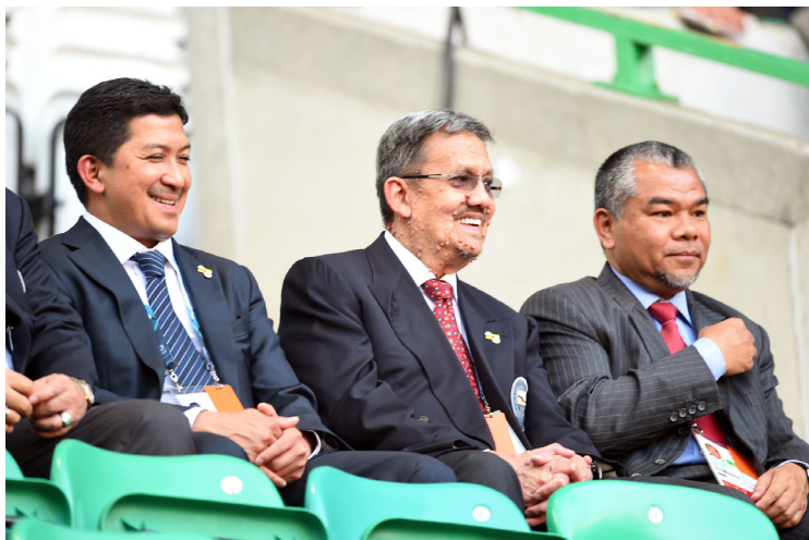
His Royal Highness Prince Haji Sufri Bolkiah, President of Brunei Darussalam National Olympic Council attends the opening ceremony of the commonwealth games Glasgow 2014 at the Celtic Park Stadium.