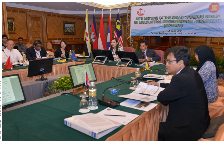
The atmosphere during the 18th Meeting Of The ASEAN Working Group On Multilateral Environmental Agreements (AWGMEA).

Officials from ASEAN member states and representatives from the ASEAN Secretariat and United Nations Environment Program International Environmental Technology Centre (UNEP-IETC) attend the meeting.