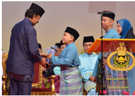
7 His Majesty launched Mushaf Brunei Darussalam