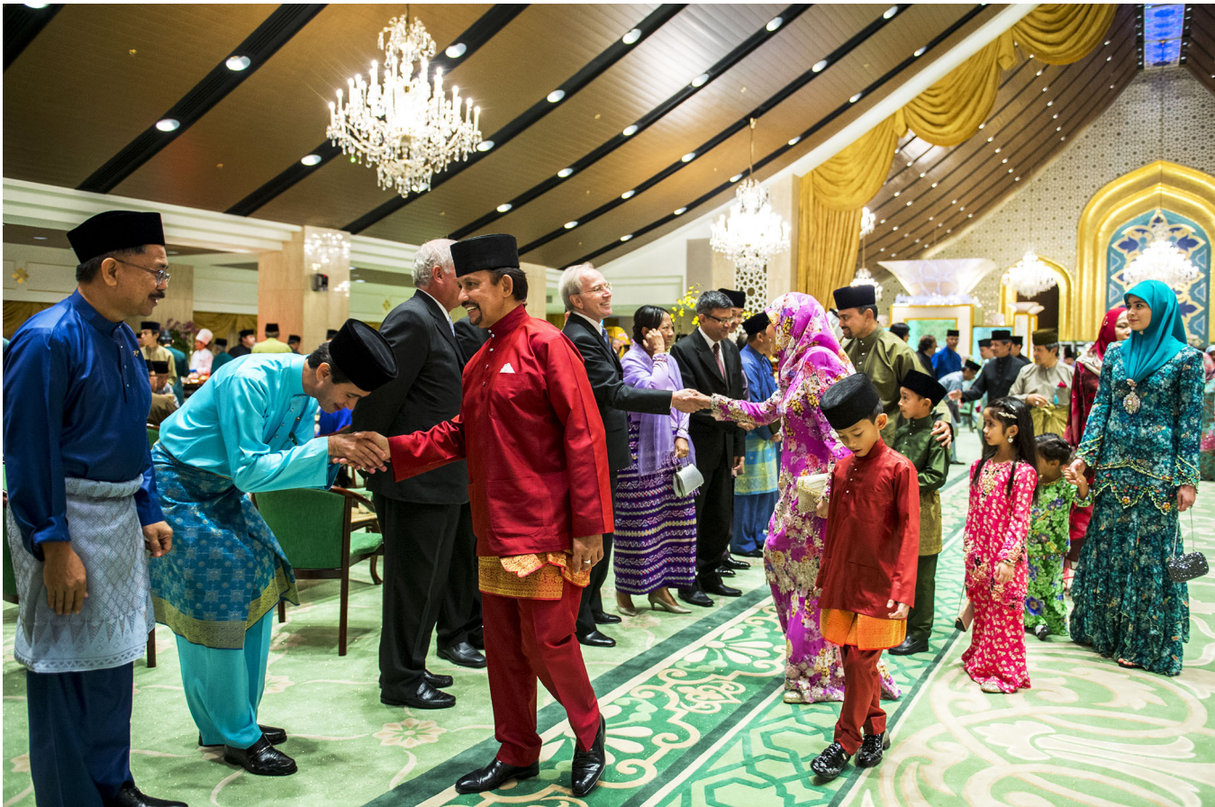
His Majesty the Sultan and Yang Di-pertuan of Brunei Darussalam and Her Majesty Pengiran Anak Isteri Pengiran Anak Hajah Saleha and member of royal family receive greeting from local dignitaries, senior government officials and foreign diplomats.

* From frontpage (Religion - as torch and guide)