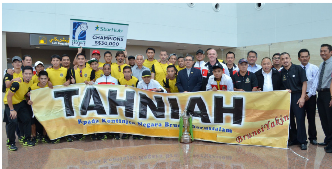
DPMMFC celebrates at the Brunei International Airport.