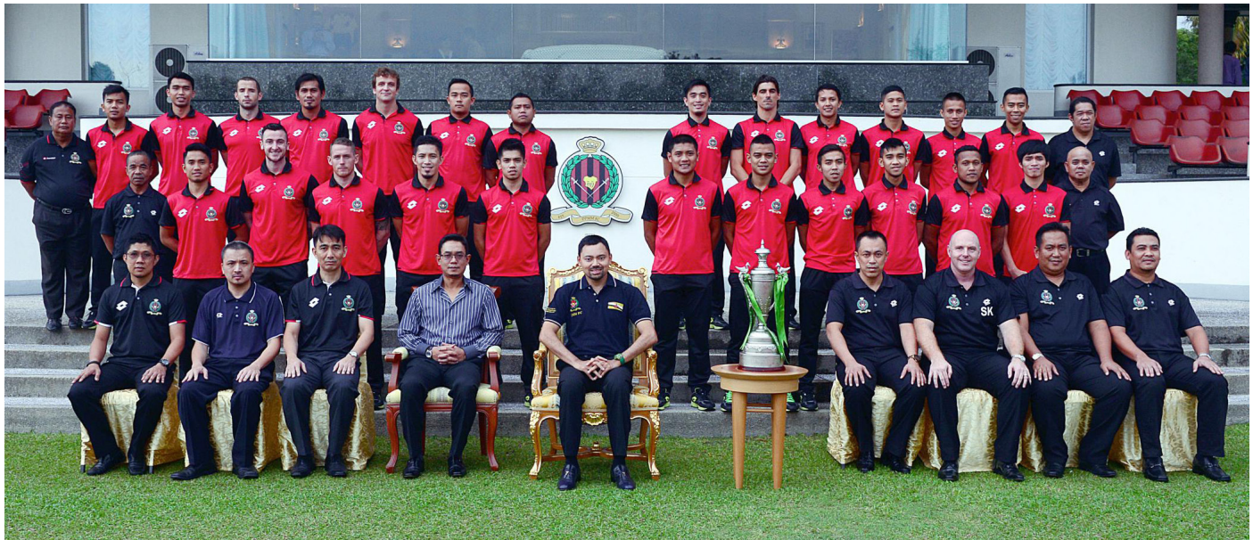
His Royal Highness consented to the photo session with the Brunei team DPMM FC.