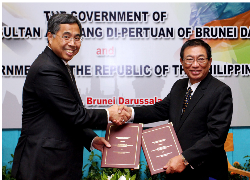
Minister of Health, Pehin Dato Awang Haji Adnan and the Philippine Health Secretary, the Honourable Dr Enrique T. Ona are exchanging signed documents.

Philippines health secretary then toured the facilities available at the Dialysis Centre.