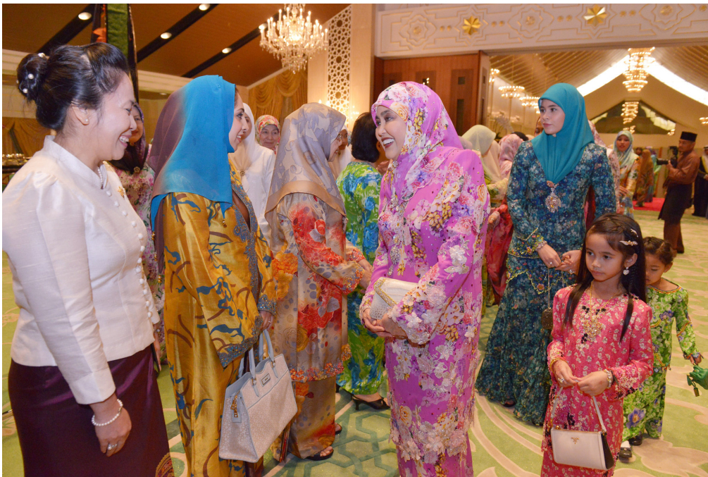
Her Majesty and Her Royal Highness receive Hari Raya Aidilfitri greetings from state dignitaries, senior government officials, foreign diplomats and their spouses.