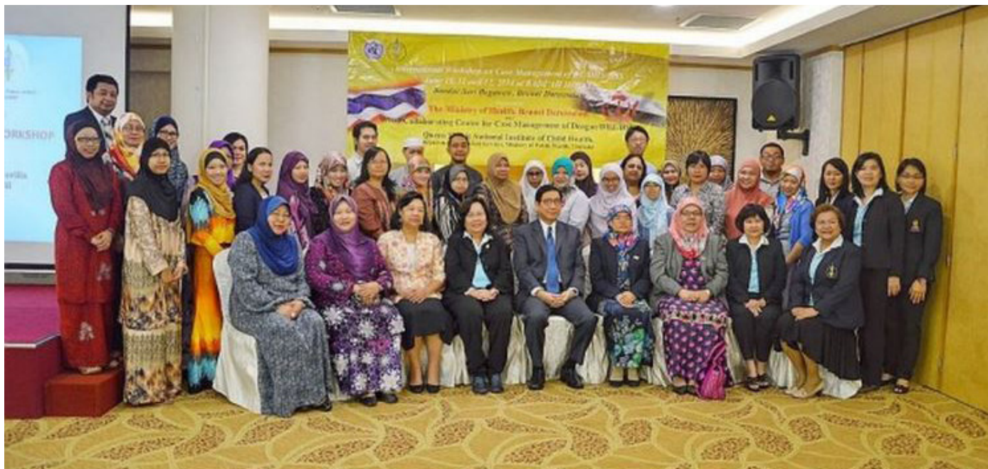
Secretary of the Ministry of Health during the photo session with workshop participants of Dengue Case Management.