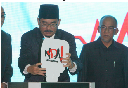
18 Combating drug abuse and illicit trafficking