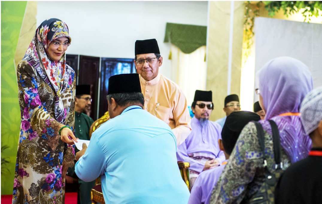
Her Royal Highness Princess Hajah Majeedah Nuurul Bolkiah consented to give His Majesty gift to the needy.

While presentation ceremony of gifts for other districts were held on August 24, which saw 2325 recipients receiving the gifts at Belait District, 2326 recipients from Tutong District, and 710 recipients for Temburong District.