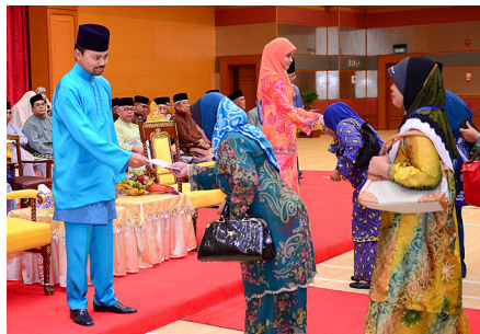
10 People with special needs receive gifts on Aidilfitri