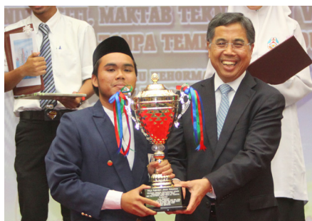
17 Government holds competition to spread awareness on danger of tobacco