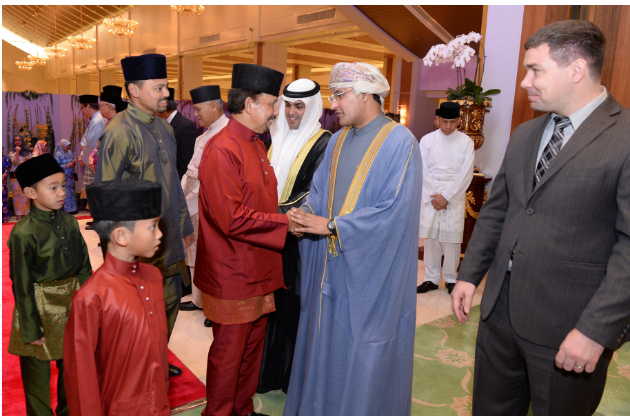
Brunei-based foreign diplomats greeting His Majesty.

Taking advantage of this glorious moment, my family and I with honest joy wish Aidilfitri to the citizens and residents wherever they are, so that together we may be able to celebrate this happy day in an atmosphere of good cheer.