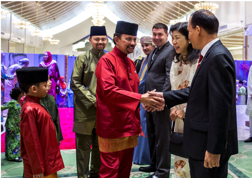
His Majesty and His Royal Highness receive greetings from state dignitaries, senior government officials and foreign diplomats.