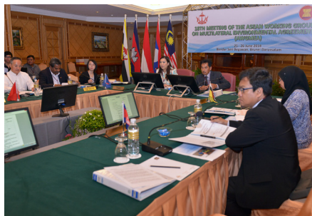
19 Brunei Darussalam addressing environmental issues