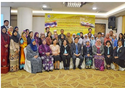
16 Communities, the private sector and government agencies urge to work together in fighting the threat of dengue