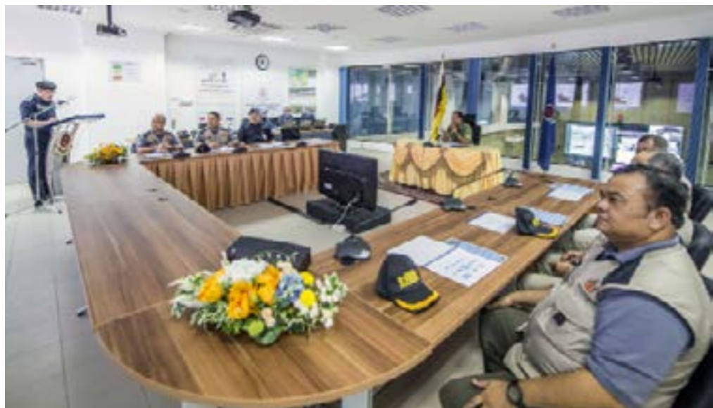
His Majesty The Sultan and Yang Di-Pertuan of Brunei Darussalam at the State Control Centre at the Royal Brunei Police Force Headquarters in Gadong.

BANDAR SERI BEGAWAN, October 6 – His Majesty Sultan Haji Hassanal Bolkiah Mu'izzaddin Waddaulah ibni Al-Marhum Sultan Haji Omar 'Ali Saifuddin Sa'adul Khairi Waddien, The Sultan and Yang Di-Pertuan of Brunei Darussalam, the Minister of Defence and Supreme Commander of the Royal Brunei Armed Forces (RBAF), consented to visit the agencies and areas involved in the National Security Exercise 04/2015.