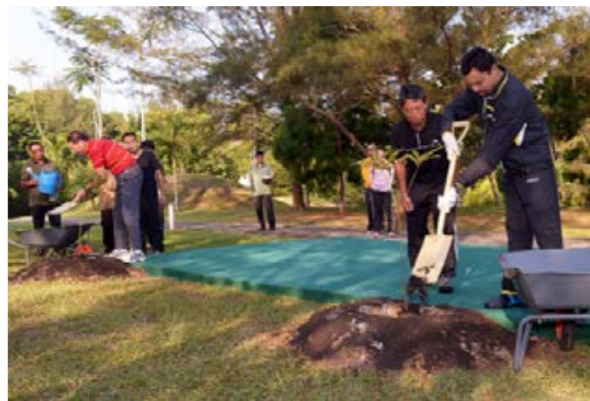
His Royal Highness The Crown Prince and His Excellency planting the 'Selungsur' Trees.