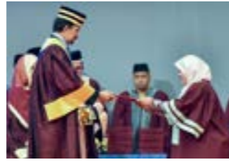
10 His Majesty graces KUPU SB's fifth convocation ceremony