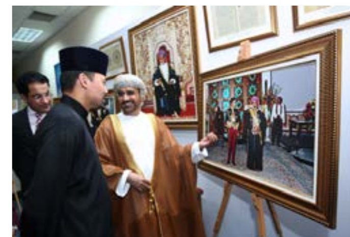
His Royal Highness The Crown Prince observing the exhibition.