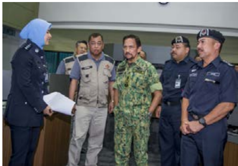
His Majesty receives a briefing from one of the officers.