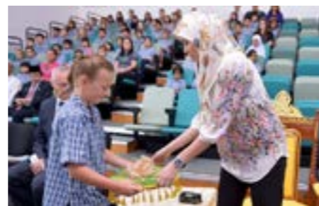
Her Royal Highness receives 'Orchids of Brunei' from one of the students.

In his speech, he announced that ISB would receive the Greenmark Award, a prestigious Singaporean eco award for school design and operations. ISB is the