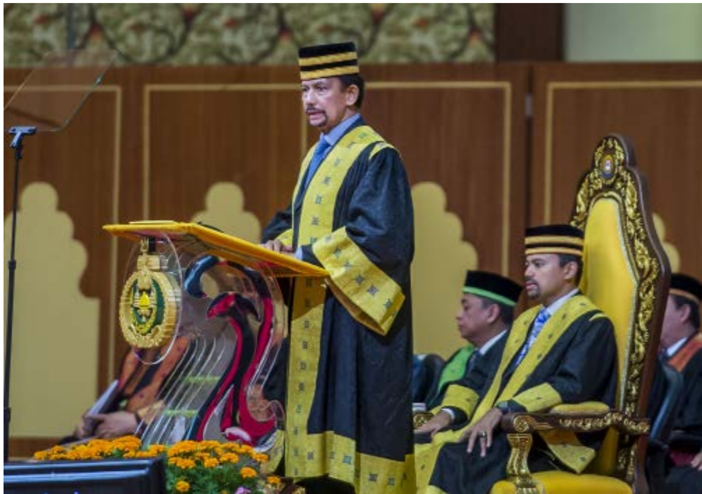
His Majesty delivering a titah (royal speech) as His Royal Highness The Crown Prince looks on at ITB's convocation ceremony held at the International Convention Centre in Berakas.