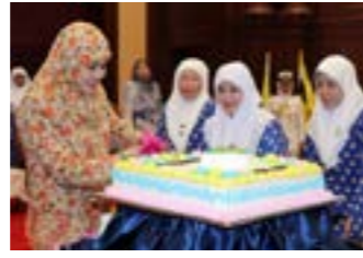
14 Her Majesty attends Girl Guides Day 2015 celebration