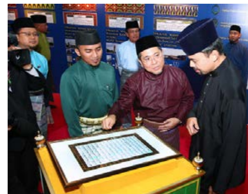
His Royal Highness The Crown Prince launching the convocation festival (left) and being briefed by UNISSA Rector during a tour at the exhibition (above).