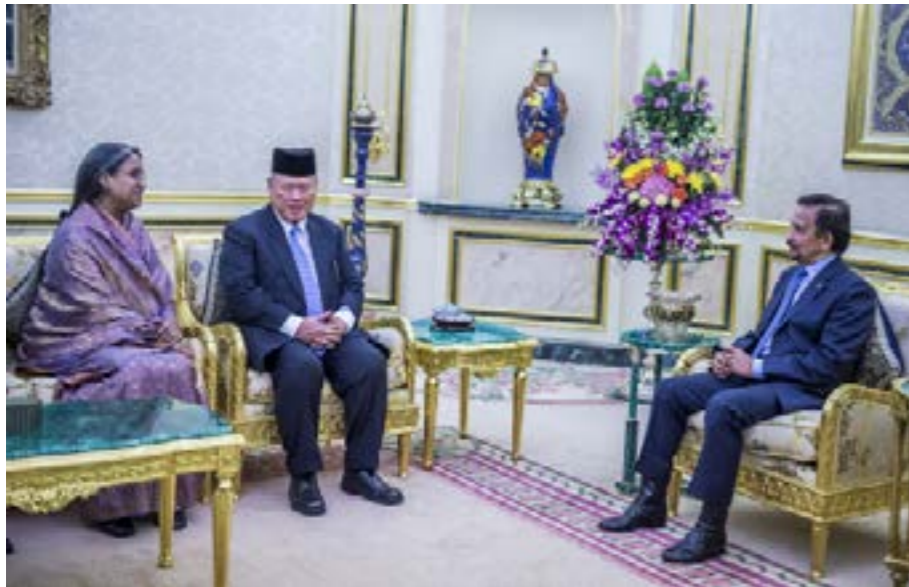
Her Excellency Dr. Dipu Moni MP, Chairman, Parliamentary Standing Committee on Foreign Affairs of the People's Republic of Bangladesh, on October 26.