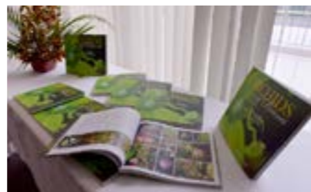
'Orchids of Brunei' features wild orchid species found in Brunei Darussalam.

only school that would be presented with the award in Borneo.