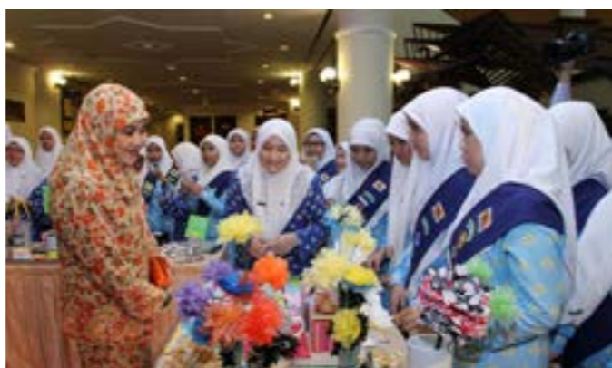
Her Majesty greeted by the girl guides.