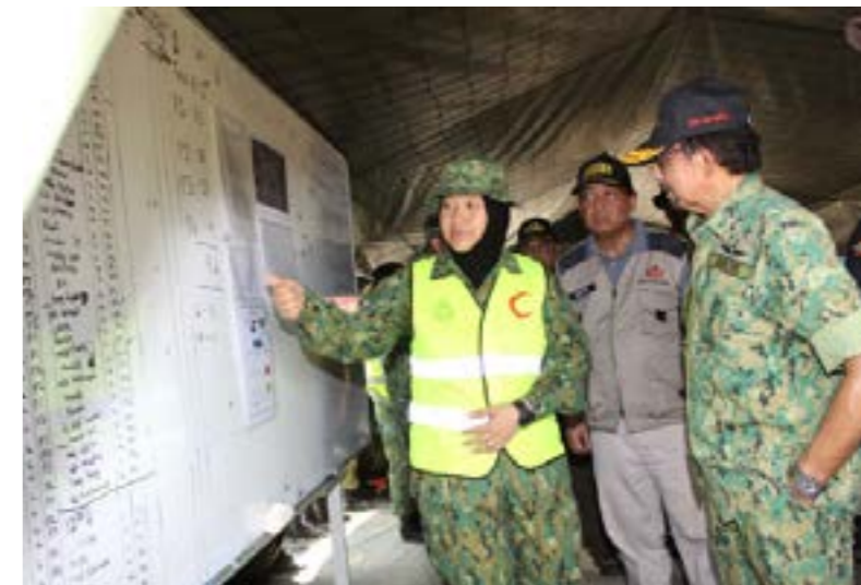
His Majesty being briefed on various operations conducted by the agencies during the National Security Exercise (above and below).

He also emphasised that any information disseminated by the media must be legitimate and cited by the National Security Committee, and not to quote from unofficial media especially social media as it is usually misused by the public.