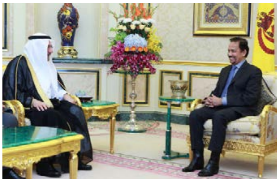
His Excellency Iyad Ameen Madani, the Secretary General of the Organisation of Islamic Cooperation on, October 26.