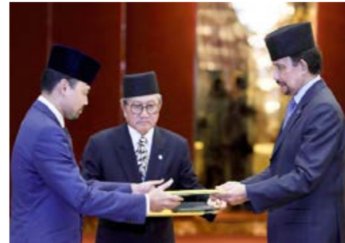
His Majesty presents letter of appointment to His Royal Highness The Crown Prince.

Doa selamat was read by the State Mufti to bless the ceremony.