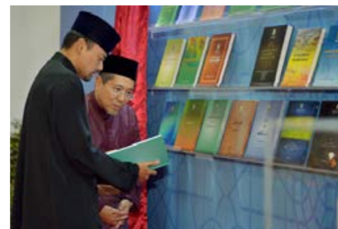
His Royal Highness The Crown Prince looking at the new books published by UNISSA after the launching ceremony.