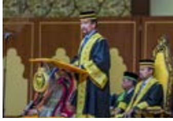
12 ITB should be more ambitious, says His Majesty