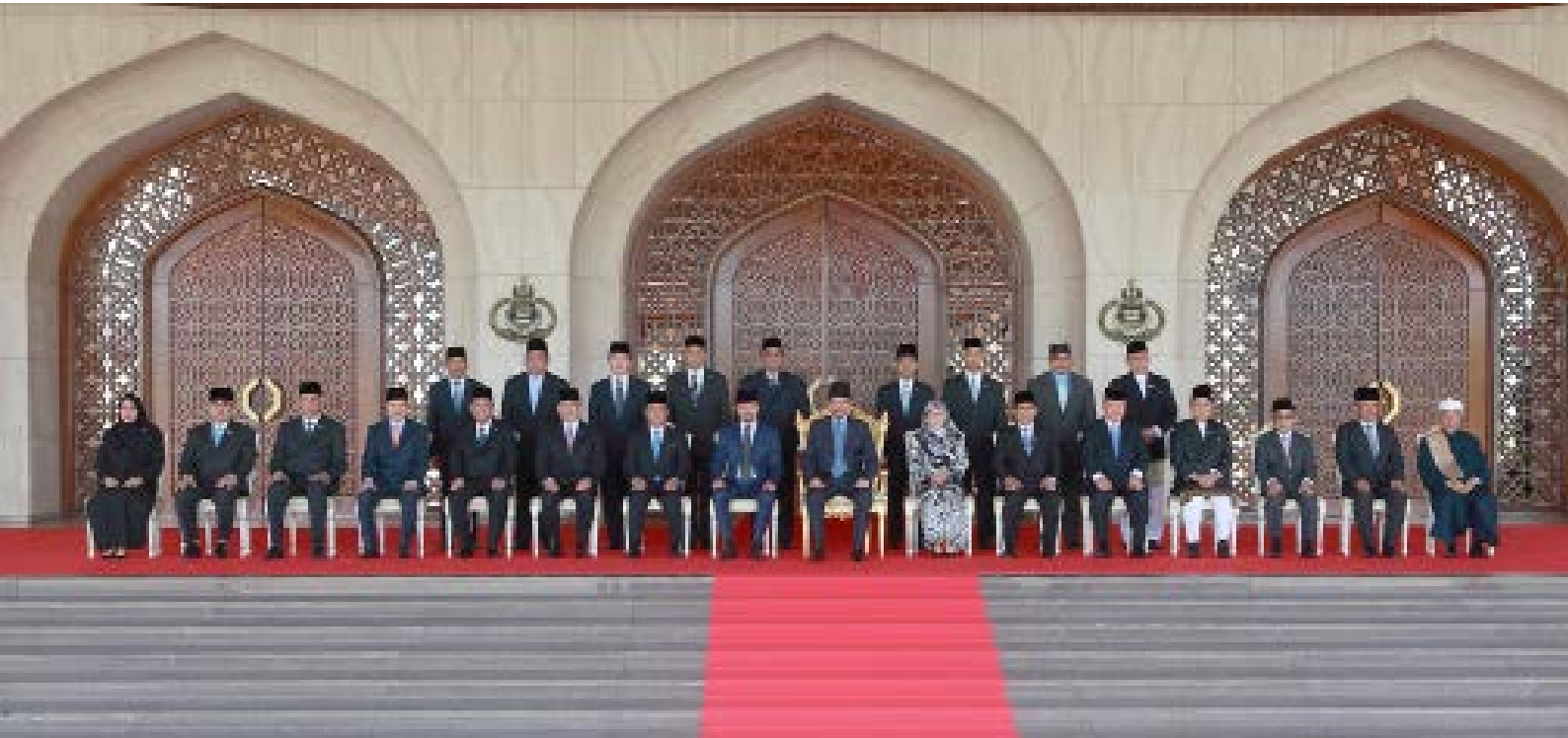
His Majesty Sultan Haji Hassanal Bolkiah Mu'izzaddin Waddaulah, The Sultan and Yang Di-Pertuan of Brunei Darussalam, His Royal Highness Prince Haji Al-Muhtadee Billah The Crown Prince and Senior Minister at the Prime Minister's Office, and Her Royal Highness Princess Hajah Masna, the Ambassador-at-Large at the Ministry of Foreign Affairs and Trade, with the new ministers and deputy ministers after the swearing-in ceremony at Istana Nurul Iman.