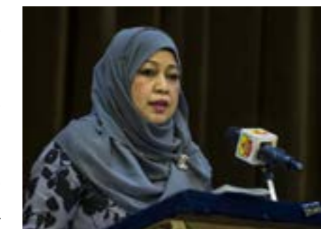
The Attorney General delivering a speech.

Touching upon the seminar, she said that it is the proof that the Attorney General's Chambers and the Royal Brunei Police Force would always strive to effectively implement tasks in the criminal justice system with integrity and professionalism.