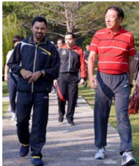
Their Royal Highnesses and His Excellency taking a morning walk at the Berakas Forest Reserve Recreational Park.