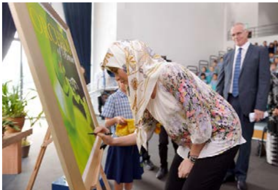
Her Royal Highness signing the front cover image of the newly launched book at International School Berakas.

SALAMBIGAR, October 9 – Her Royal Highness Paduka Seri Pengiran Anak Isteri Pengiran Anak Sarah binti Pengiran Haji Salleh Ab Rahaman graced the launching ceremony of 'Orchids of Brunei' at International School Berakas (ISB).