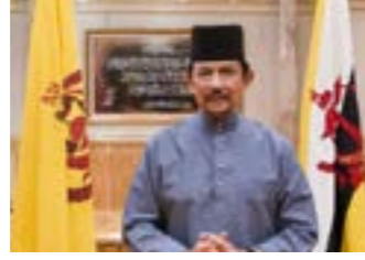
13 Doa crucial for country's prosperity