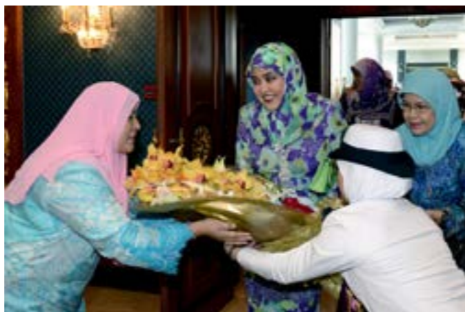
Her Majesty receives a pesambah (gift)