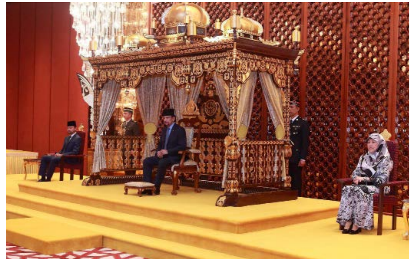
His Majesty Sultan Haji Hassanal Bolkiah Mu'izzaddin Waddaulah, The Sultan and Yang Di-Pertuan of Brunei Darussalam, His Royal Highness Prince Haji Al-Muhtadee Billah, the Crown Prince and Senior Minister at the Prime Minister's Office, and Her Royal Highness Princess Hajah Masna, the Ambassador-at-Large at the Ministry of Foreign Affairs and Trade at the swearing-in ceremony.