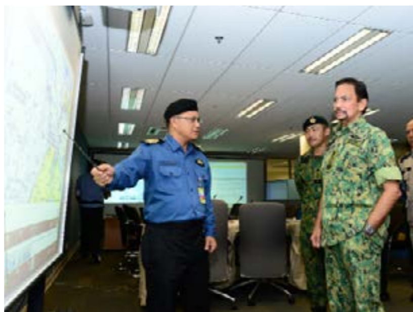
His Majesty being briefed at the Prime Minister's Office.