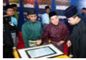
15 His Royal Highness The Crown Prince launches convocation festival, 32 books