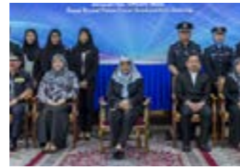
19 Uphold professionalism and integrity of criminal justice system