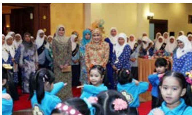
Her Majesty observing a performance at the celebration.