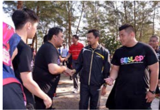
His Royal Highness The Crown Prince being introduced to some of the members of the Youth Leadership Exchange Programme.