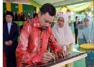
17 Crown Prince officiates ITB Convocation Festival and ISLE Garden