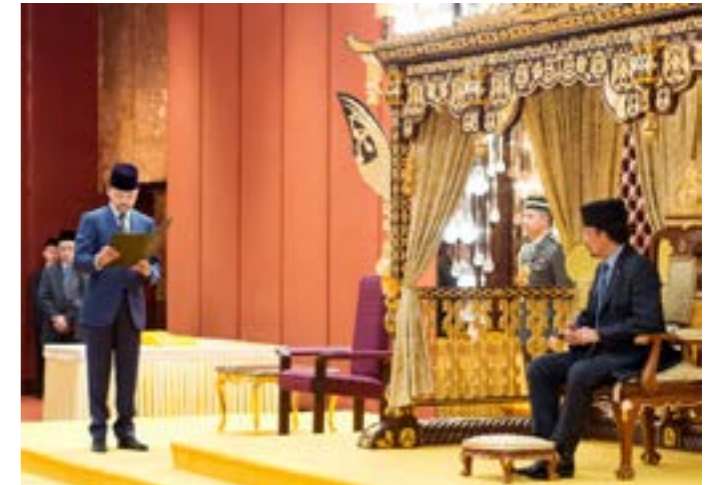
His Royal Highness The Crown Prince takes his oath.