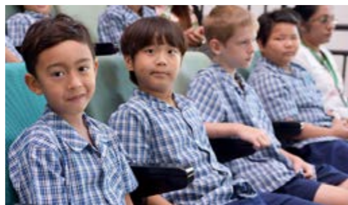
Yang Teramat Mulia Pengiran Muda 'Abdul Muntaqim (far left) at the ceremony.