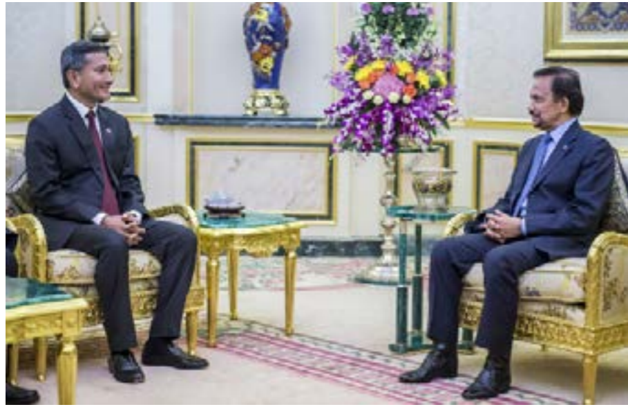
His Excellency Dr. Vivian Balakrishnan, the Minister of Foreign Affairs of the Republic of Singapore, on October 26.

His Majesty Sultan Haji Hassanal Bolkiah Mu'izzaddin Waddaulah ibni Al-Marhum Sultan Haji Omar 'Ali Saifuddien Sa'adul Khairi Waddien, The Sultan and Yang Di-Pertuan of Brunei Darussalam consented to receive in audience at the Istana Nurul Iman: