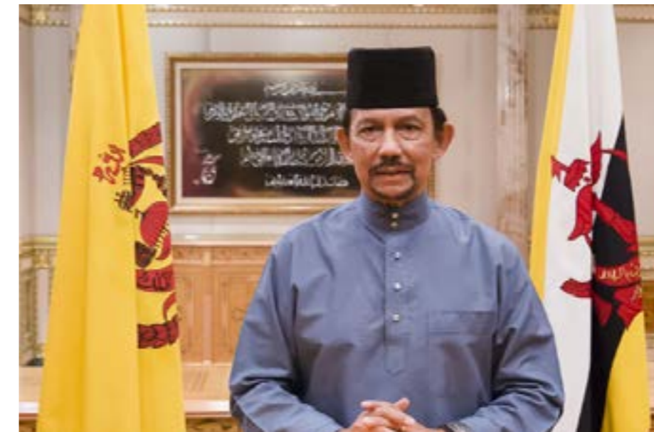
His Majesty delivering a titah (royal speech) in conjunction with the new Islamic year 1437 Hijrah at Istana Nurul Iman.

Each military exercise and sporting event provides officers and soldiers with essential learning opportunities. In addition, sharing experiences creates better soldiers and closer friendships.