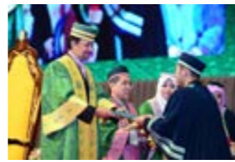
11 His Majesty urges UNISSA to prioritise marketability factors