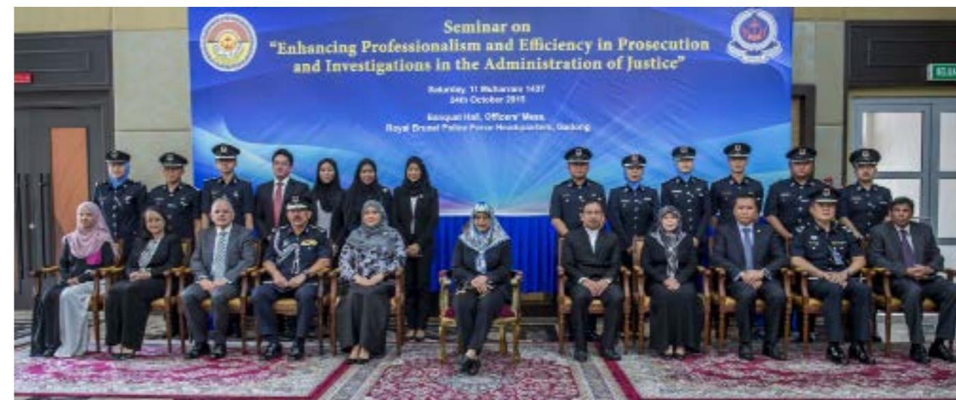
Her Royal Highness with the staff of the Attorney General's Chambers and police personnel.