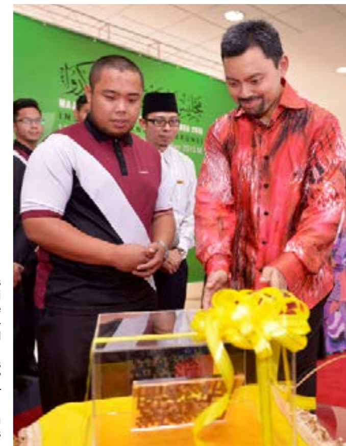
His Royal Highness receives a pesambah (gift).

between ITB and Tropica Solar Photovoltaic Company and RAB Global Green Sdn Bhd on solar panels technology. The panels can be shaped according to the requirements of the client.