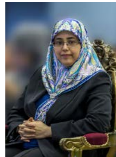
Her Royal Highness at the seminar.

BANDAR SERI BEGAWAN, October 24 – Her Royal Highness Princess Hajah Muta-Wakkilah Hayatul Bolkiah binti His Majesty Sultan Haji Hassanal Bolkiah Mu'izzaddin Waddaulah attended a one-day seminar on 'Enhancing Professionalism in Prosecution and Investigations in the Administration of Justice' at the banquet hall of the Officers Mess of the Royal Brunei Police Force headquarters in Gadong.