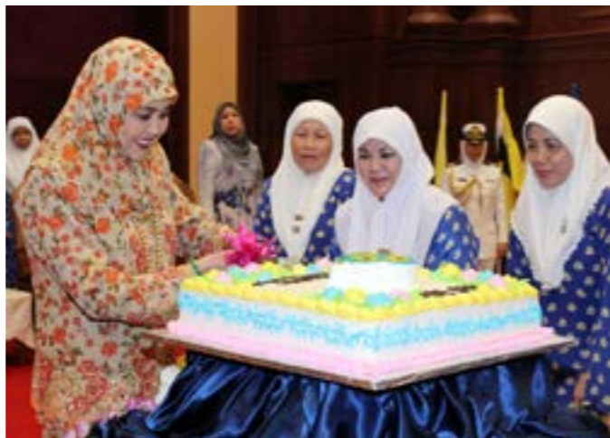
Her Majesty cutting a cake to commemorate Her Majesty's birthday anniversary at the Girl Guides Day 2015 celebration.

She also touched on the two main activities that are carried out at the association's headquarters, such as a sharing session on the experiences obtained during participation in activities inside and outside of the country and a day with Brownie guides, which is handled by the headquarters Starlight group that comprised of youth leaders.