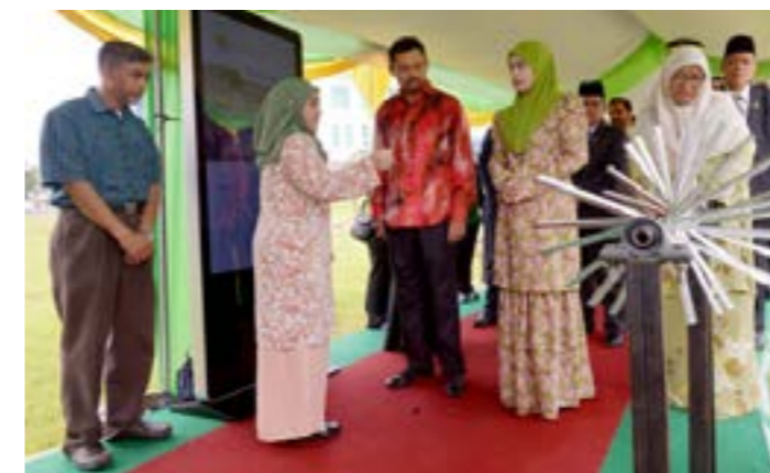
His Royal Highness being briefed on the Horizontal Axis Wind Turbine.

The Solar Panel & Solar Table Project is a collaborative project