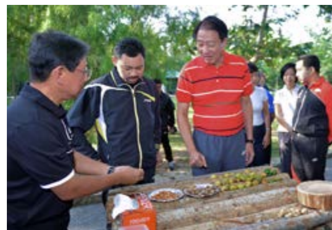
His Royal Highness The Crown Prince and His Excellency observing the fruits during the morning walk.

Afterward, His Royal Highness and His Excellency ended the morning walk with a breakfast against the backdrop of the Berakas Beach.