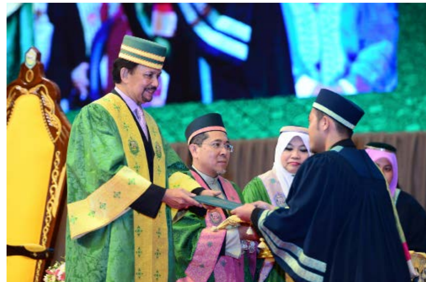
His Majesty presenting an award to one of the UNISSA graduates at the International Convention Centre in Berakas,

To conclude the event, doa selamat was read by the State Mufti to bless the ceremony.