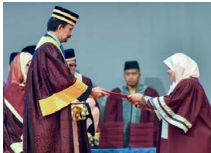
His Majesty presenting certificates to the KUPU SB graduates at the International Convention Centre in Berakas (left and right).