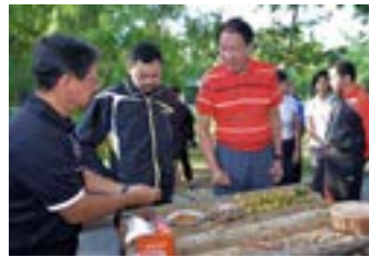
16 Crown Prince and Singapore Deputy Prime Minister visit Berakas Forest Reserve Recreational Park