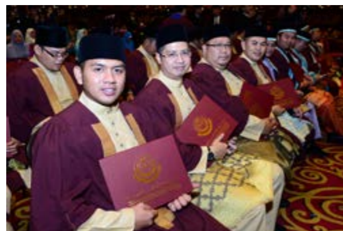
The graduates with their certificates at the fifth convocation ceremony (left and right).

*From page 10 (His Majesty graces KUPU SB's fifth convocation ceremony)