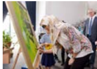
18 Her Royal Highness graces launching of 'Orchid of Brunei'