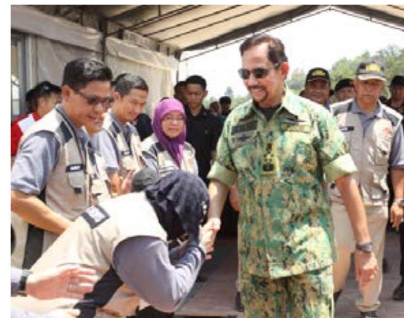
His Majesty greeted by the representatives of the agencies involved in the exercise.