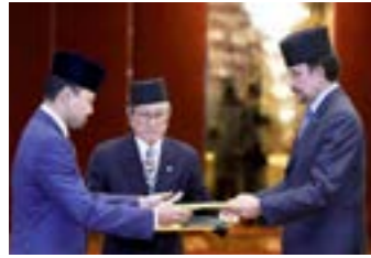
1 New ministers and deputy ministers sworn in