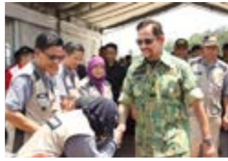
8 His Majesty visits National Security Exercise sites