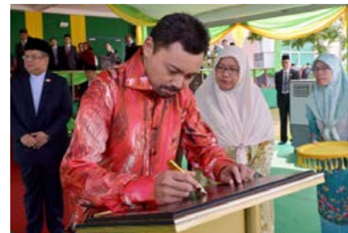
His Royal Highness signing a plaque at the event.

BANDAR SERI BEGAWAN, October 24 - His Royal Highness Prince Haji Al-Muhtadee Billah ibni His Majesty Sultan Haji Hassanal Bolkiah Mu'izzaddin Waddaulah, The Crown Prince and Senior Minister at the Prime Minister's Office as the Pro-Chancellor of Institut Teknologi Brunei (ITB) officiated the second ITB Convocation Festival.