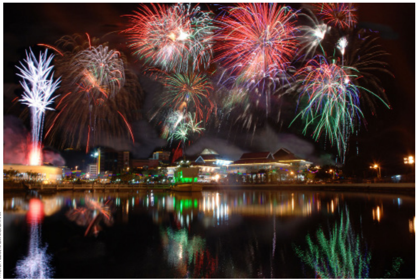
Colourful fireworks display lightened up the night during His Majesty's birthday celebration.