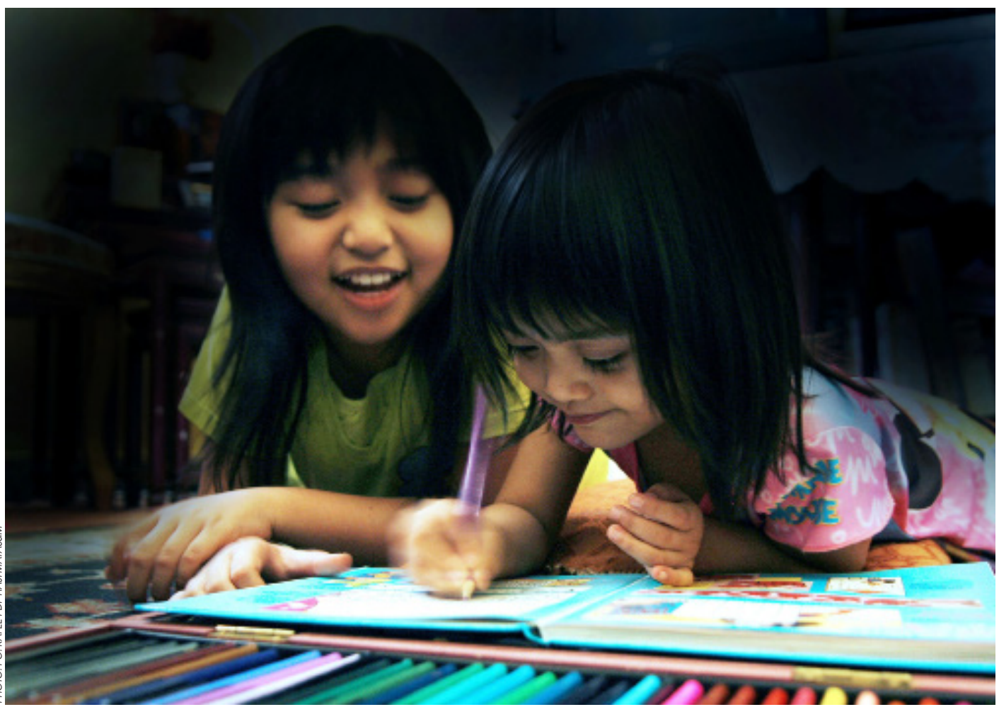
Brunei Darussalam has about 260 schools (government and private) all over the nation with 110,182 students. The highest numbers of students goes to primary school that is 45,125 students. (Statistics taken from Brunei Darussalam Key Indicators 2008)