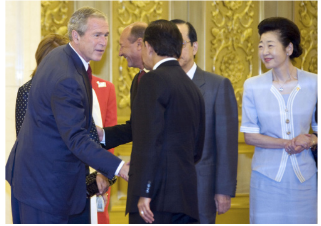
Among the foreign dignitaries attending the opening of Olympic Games 2008.

His Majesty attends opening of Olympic Games 2008