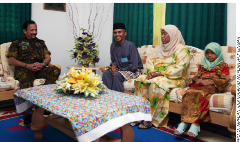
One of the recipients received a visit from His Majesty.