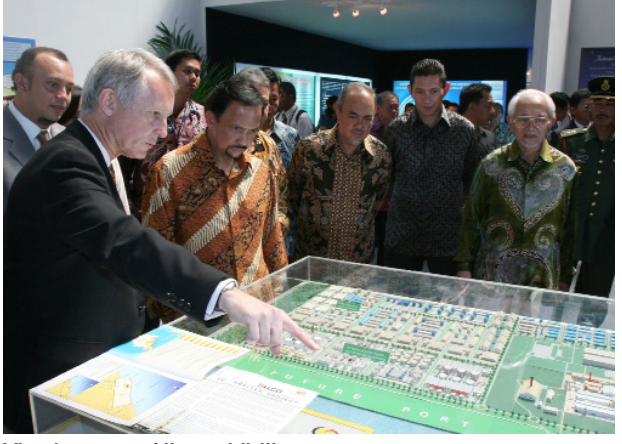
Viewing one of the exhibitions.