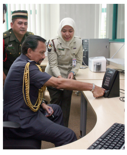
His Majesty trying one of the systems installed at the Ministry.

The training will be conducted for 10 months and divided into three phases; focus on general training; specialist training and training with armed forces.