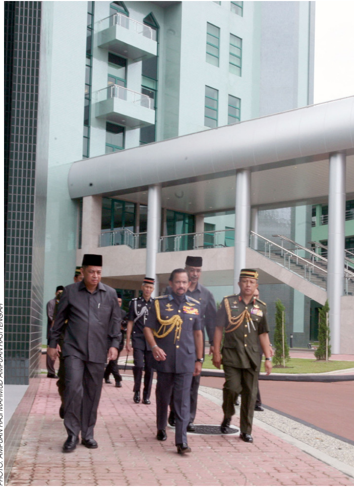
His Majesty Touring the new Ministry of Defence building.

BERAKAS, August 13 - His Majesty The Sultan and Yang Di-Pertuan of Brunei Darussalam, Minister of Defence and Supreme Commander of the Royal Brunei Armed Forces (RBAF) officiated the new Ministry of Defence's building at Bolkiah Garrison.