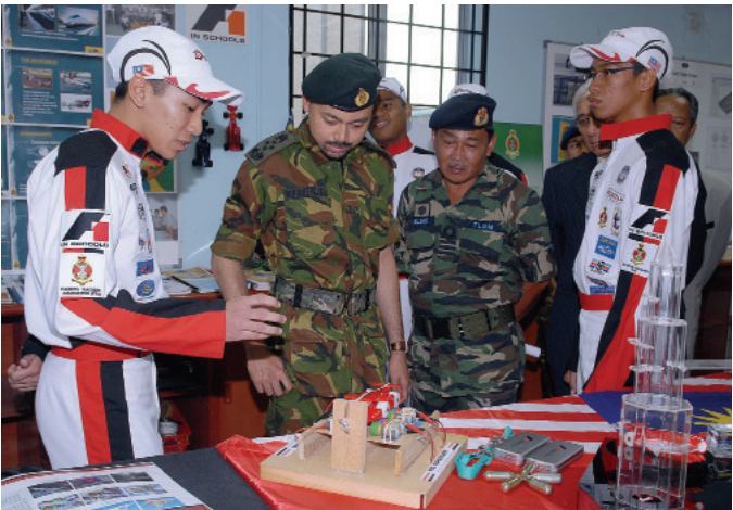
Visit to one of the classes at Royal Military College, Sungai Besi.