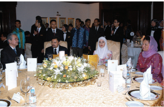
Their Royal Highnesses at a banquet hosted by the Malaysian Prime Minister.