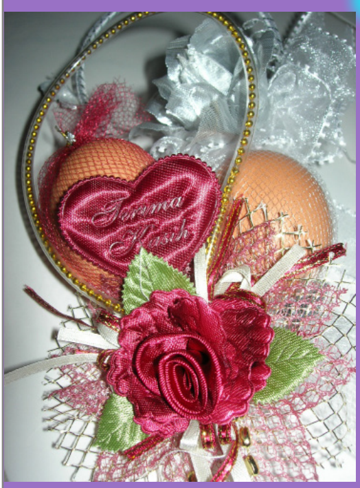
Bunga Telor, one of famous campur in Brunei wedding.