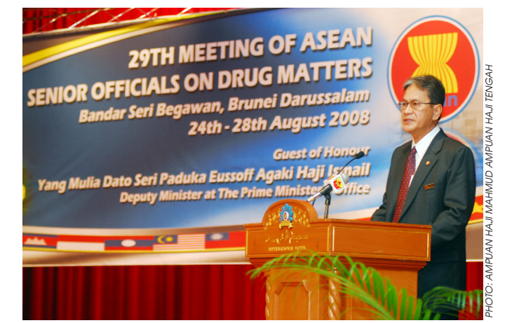
Deputy Minister at Prime Minister's Office, Dato Seri Paduka Eusoff Agaki opens the 29<sup>th</sup> Meeting of ASOD.

ASOD was officially established in 1984 and initiatives on drugs are based on the ASEAN Plan of Action on Drug Abuse Control adopted at the 17<sup>th</sup> ASOD Meeting in October 1994. The Action Plan covers four priority areas namely preventive drug education, treatment and rehabilitation, enforcement and research.