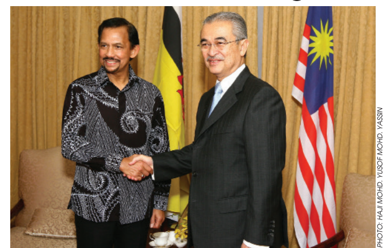
His Majesty and the Prime Minister of Malaysia at the Brunei-Malaysia 12<sup>th</sup> Annual Meeting.

on regional and international matters of mutual concern. The leaders agreed to hold the 13<sup>th</sup> Annual Leaders' Consultation in Brunei Darussalam in 2009.