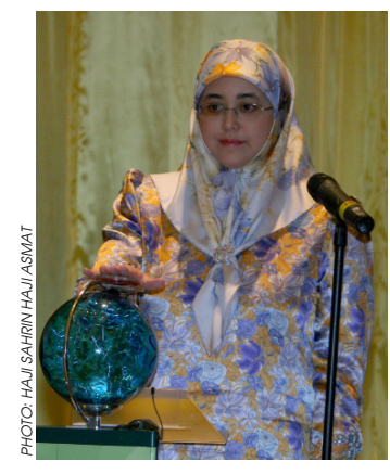
Her Royal Highness Princess Hajah Muta-Wakkilah graced the opening of the IACB and the 2<sup>nd</sup> RAIF Conference 2008.

JERUDONG, August 16 - Her Royal Highness Princess Hajah Muta-Wakkilah Hayatul Bolkiah graced the opening of the International Arbitration Conference Brunei (IACB) and 2<sup>nd</sup> Regional Arbitration Institution Forum (RAIF) Conference 2008 at The Empire Hotel & Country Club.