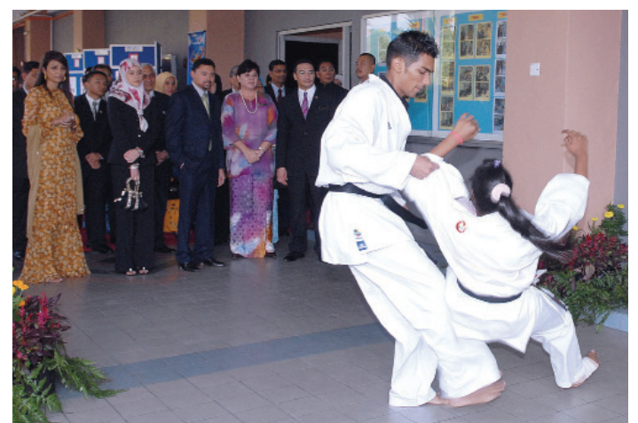
One of the activities performed by the college trainee of Bukit Jalil Sports School.