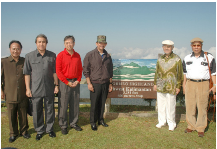
His Majesty with Sarawak top officials during the visit to the Borneo Highland Resort.