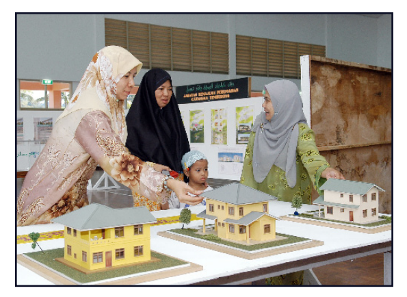
The sample of three types of two storey houses to be built under the National Housing Development Scheme of Kampong Rataie.

TEMBURONG, April 14 – Fifty houses will be built under the National Housing Development Scheme of Kampong Rataie.