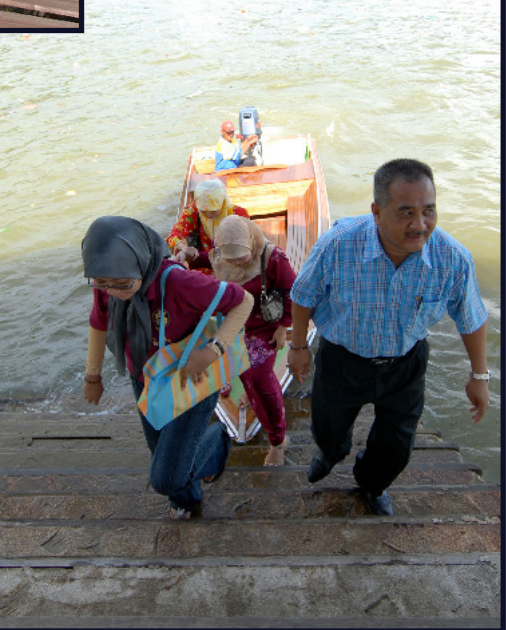
'Perahu' is still the main mode of transportation from the water village to dryland.