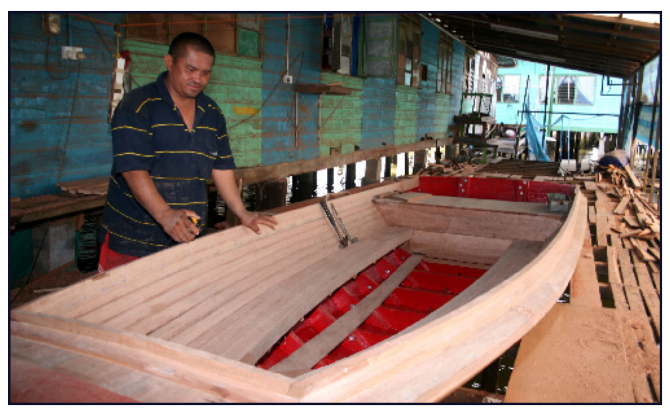
The process of making one boat will take about two weeks.