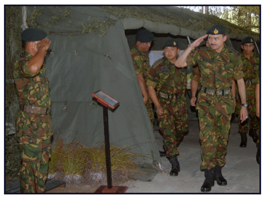
His Royal Highness during the working visit to the Support Battalion of the Royal Brunei Land Force in Penanjong, Tutong.