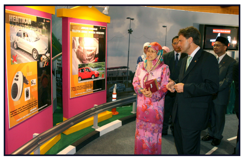
Her Royal Highness takes a closer look at an exhibition in conjunction with the 1<sup>st</sup> UN Global Road Safety Week.

There are more road traffic laws that emphasise on road safety. More information are available at the Road Safety Council's official website at www.bruneiroadsafety.org.bn