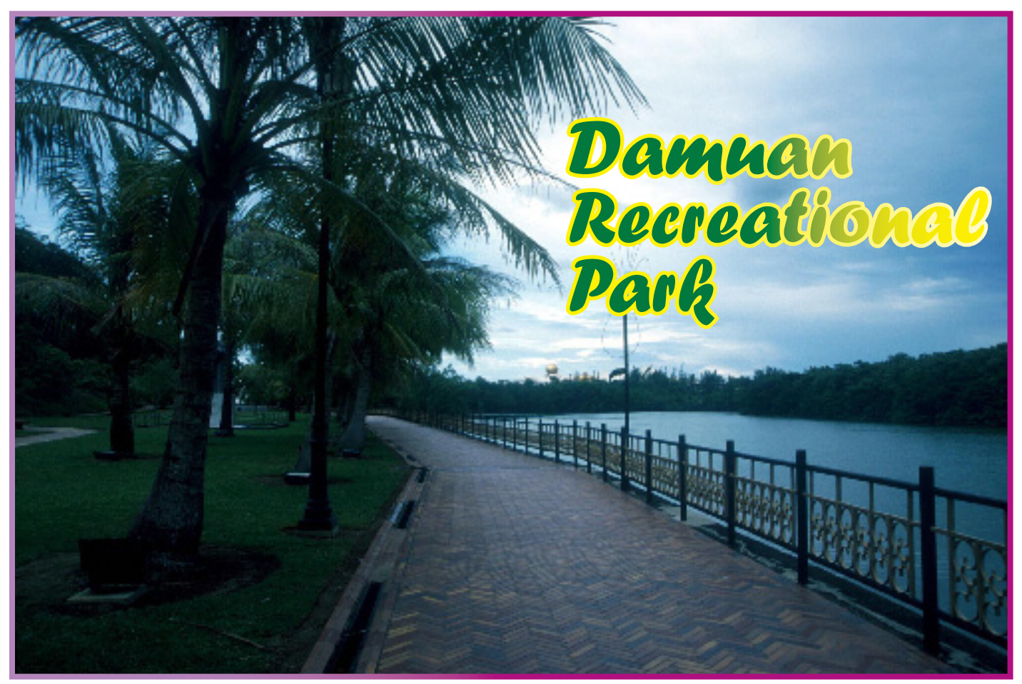
Clean and convenient, a popular venue for joggers.

Awalking distance from the world's largest residential palace, the Istana Nurul Iman, is the popular Damuan Recreational Park, a one-kilometer long stretch of land sandwiched between the Bandar Seri Begawan – Tutong road and the Damuan River. It is based about 4 ½ km from the heart of the capital.