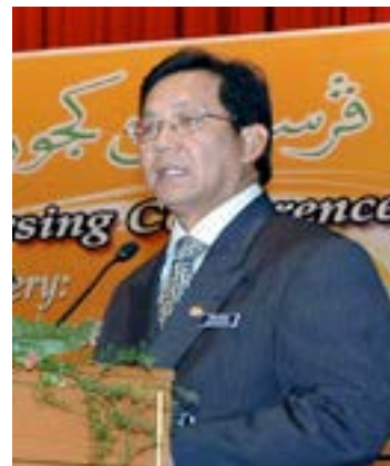
The Minister of Health delivers a speech at the closing ceremony of the 7 th Biennial International Nursing Conference

According to the minister, the dataset is a critical element to the successful implementation of workforce planning. However, the system must be supported by accessible dynamic information systems providing timely and accurate data.