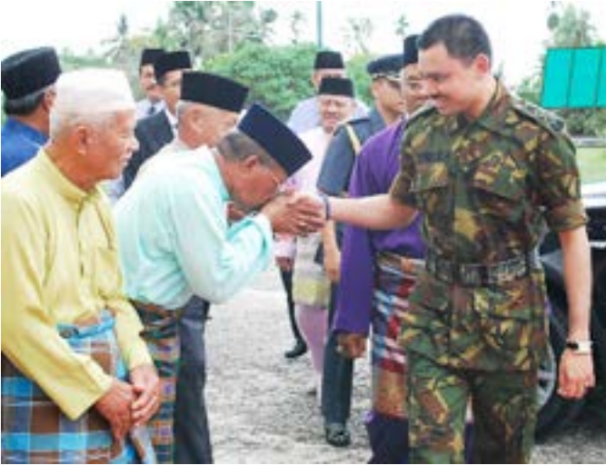
His Royal Highness greeted by the citizens of Kampung Telisai.