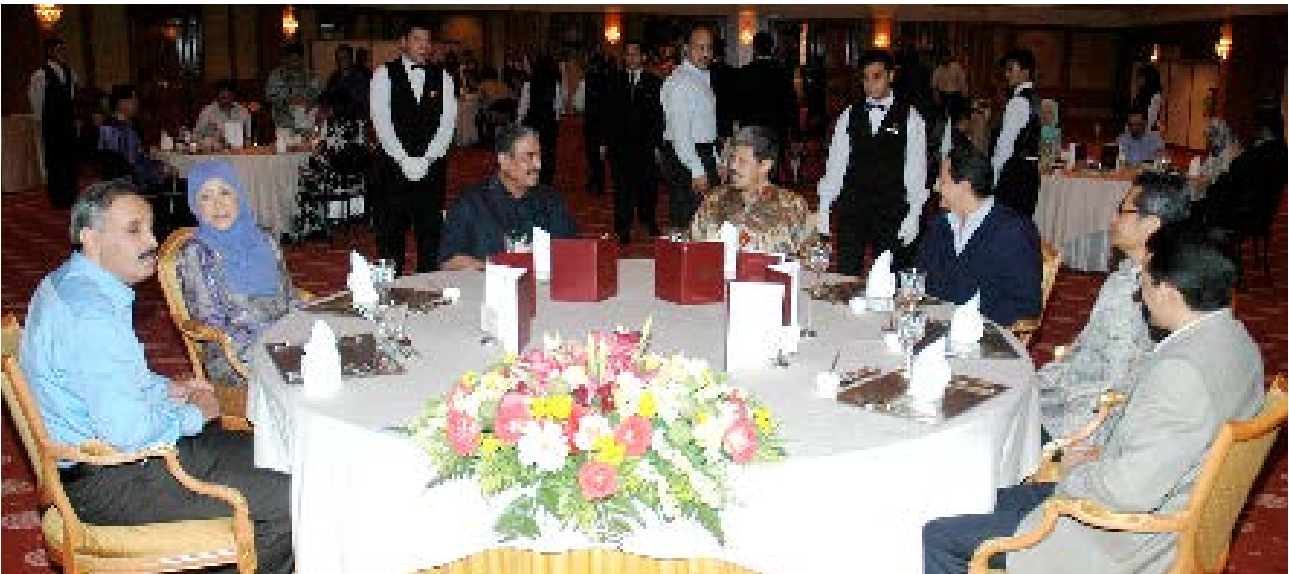
His Royal Highness Prince Mohamed Bolkiah, Minister of Foreign Affairs and Trade at a dinner in honour of His Royal Highness Prince Muqrin's visit to Brunei Darussalam.