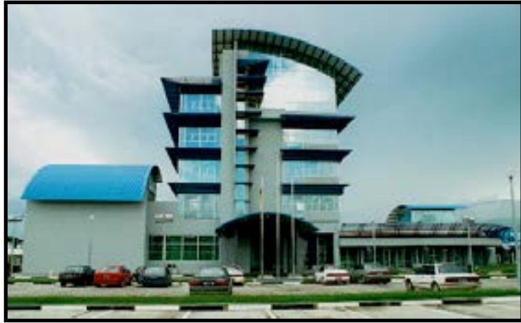
The new Land Transport Department's building.

reached by boat so water taxis are the main mode of transportation. The fares starts from $1.00 depending on the distance. For journey to Temburong, boat services are available from 7.45 am to 4.00 pm daily.