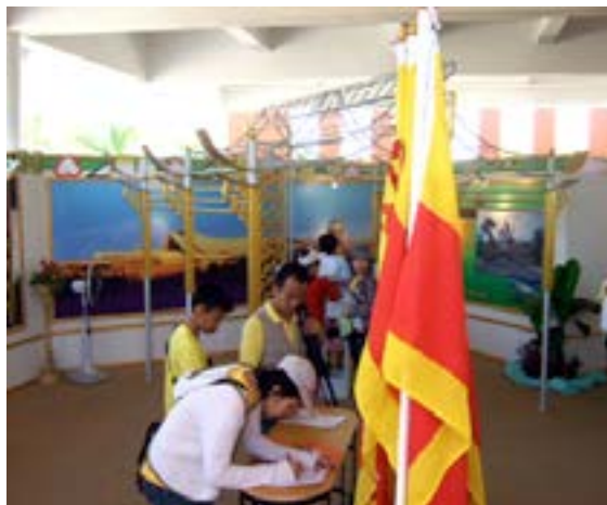
Some of the visitors to the Brunei-Thailand Photo Exchange Exhibition (left and right).