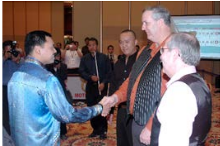
His Royal Highness greets the two participants in the competition.

The competition was the second staged in the Sultanate.