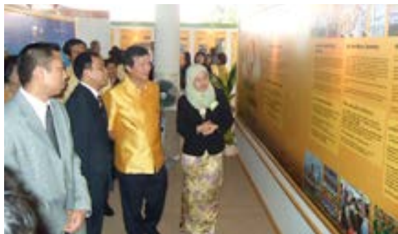
The Acting Permanent Secretary of the Prime Minister's Office Brunei and Deputy Permanent Secretary of the Prime Minister's Office of Thailand views the exhibition.

The visitors to the exhibition were provided with knowledge and understanding about Brunei Darussalam, in addition to the institution of monarchy in both countries, and Thailand-Brunei bilateral relations. The photo exchange exhibition was a project launched under the Memorandum of Understanding (MoU) between the Government of the Kingdom of Thailand and the Government of His Majesty The Sultan and Yang Di-Pertuan of Brunei Darussalam on Cooperation in the Field of Information and Broadcasting.