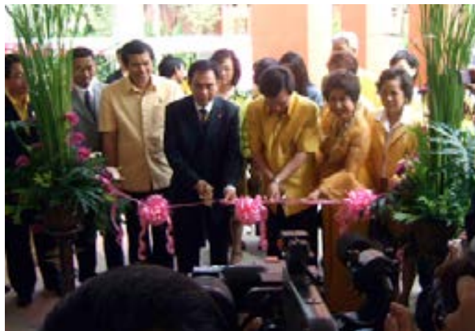
The opening of the exhibition by Acting Permanent Secretary of the Prime Minister's Office of Brunei and Deputy Permanent Secretary of Prime Minister's Office of Thailand.