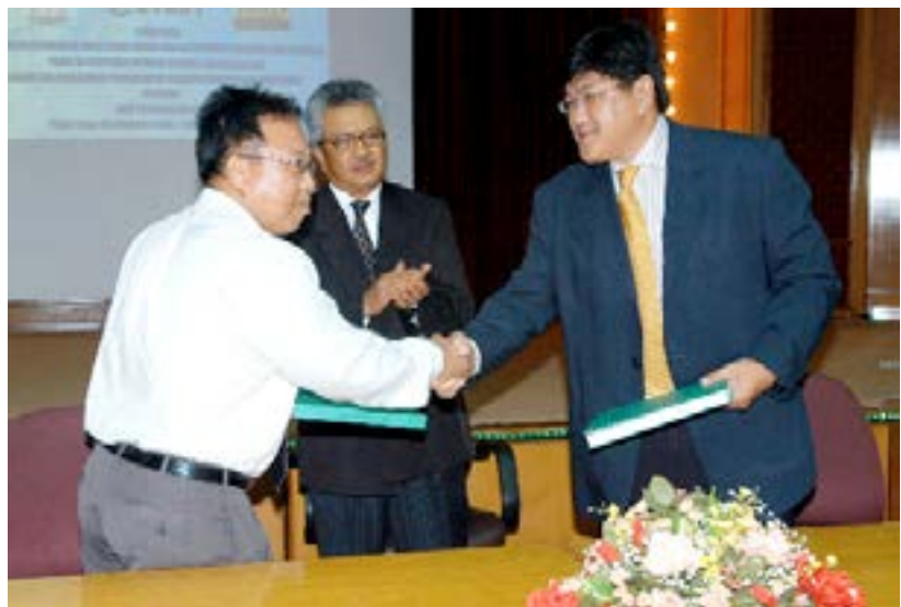
The signing contract between His Majesty's Government and HAD Technologies witness by the Permanent Secretary at the Ministry of Development.

by the third quarter of 2007. It aimed to update application data, an application process until the time of paying back the