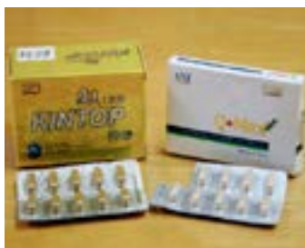
The types of recalled traditional medicines.

The objectives of the 17 th IFNGO Asean NGOs Workshop is not only to share knowledge and experiences and best practices but also to highlight to our decision makers the relationship between unemployed ex-drug addicts/ poverty/crime and economic growth of the region.