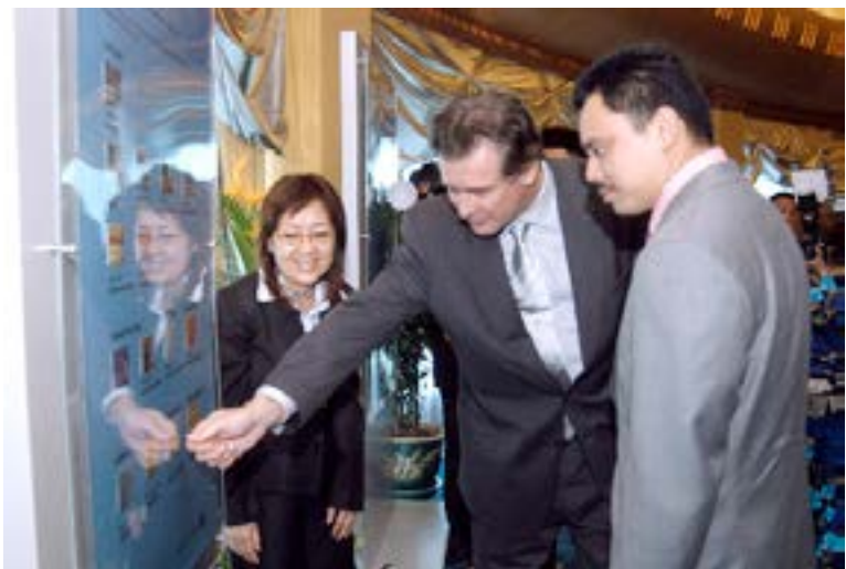
His Royal Highness tours an exhibition soon after the launching of Baiduri Bank's platinum card.

The card is the first Visa platinum credit card in the country based on the cutting edge EMV (Europay, Mastercard and Visa) technology that offers the highest level of security, giving card members added peace of mind as well as limitless flexibility and global prestige.