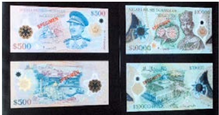
The new polymer currency notes issued by the Brunei Currency and Monetary Board.

The introduction of the new polymer currency notes was in conjunction with His Majesty's 60 th birthday celebration. The new $10,000 currency note portrays the picture of His Majesty The Sultan and Yang Di-Pertuan of Brunei Darussalam while the $500 notes shows the portrait of the late Sultan Haji Omar 'Ali Saifuddien Sa'adul Khairi Waddien.