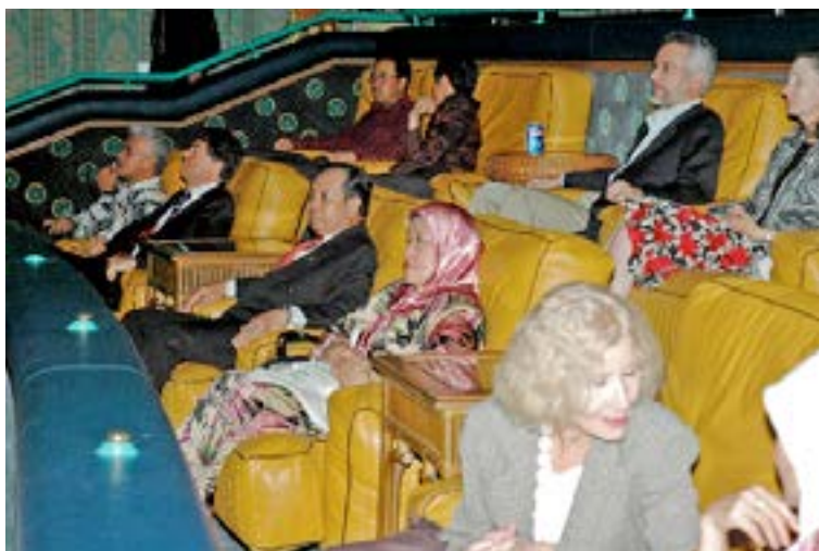
The Minister of Culture, Youth and Sports at the launching of French film festival.

The films chosen were Princes et Princesses, Mon Idole, L'Homme du train, Le Role de Sa Vie and Jene Suis Pas La pour Etre Aime.