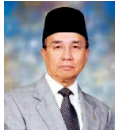
The Minister of Education attends the second dialogue session with the leaders of secondary and primary schools throughout the country.

The minister added channelisation under this system gives opportunities to students to improve based on their varied capabilities, interest and ability. The system also has a flexibility to allow students to pursue other directions. The dialogue was a follow-up to the first session held on April 25, this year.