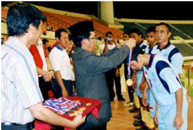
The Deputy Minister of Education presents the prizes to the winner.

Special Olympics is an international organisation dedicated to empower individuals with intellectual disabilities to be