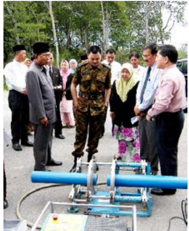
His Royal Highness is briefed on the equipment in prawn breeding.