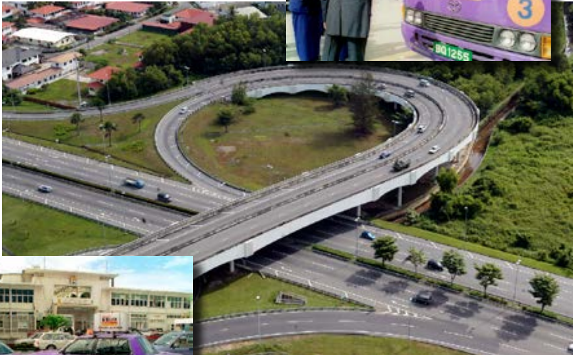
Excellent planning on the roads makes commuting convenient and comfortable.