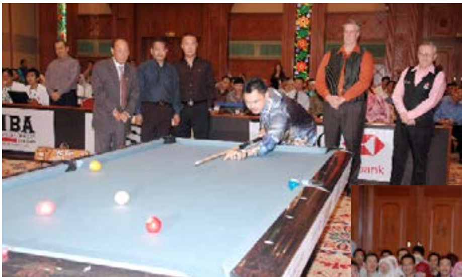
The Crown Prince launches the Brunei Trick Shot Masters 2006.