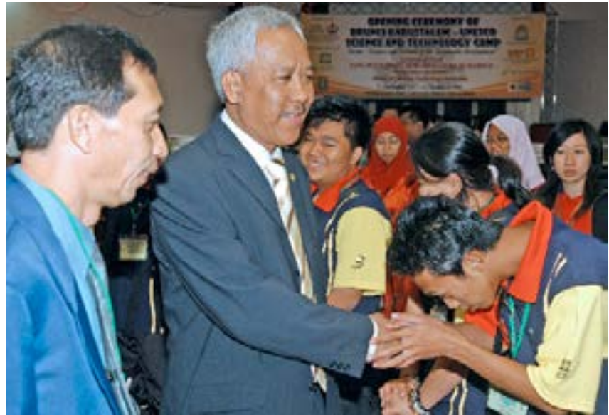
The Deputy Permanent Secretary at the Ministry of Education welcomes the participants of UNESCO Science and Technology Camp.

Carrying the theme 'Science and Technology for Sustainable Development,' the camp was participated by 19 students from the hosting nation, two students from Malaysia and eight students from Japan. All of them were aged between 13 to 16