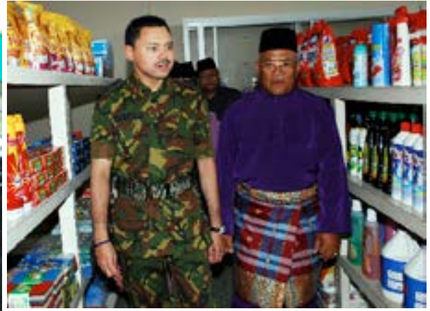
Touring the cooperative shop.