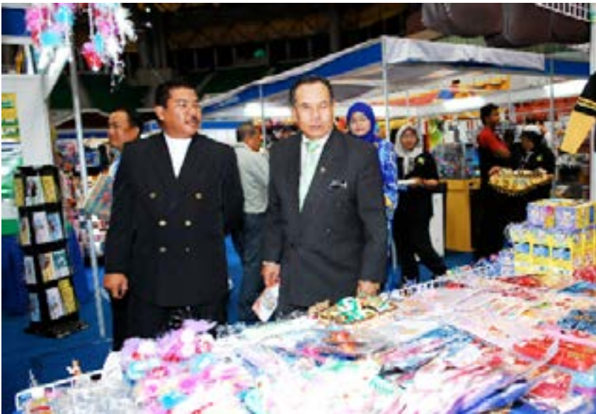
The Minister of Culture, Youth and Sports takes a closer look at the exhibition.

More than 25 exhibitors from other parts of the world also took part to present their high quality products to potential clients and distributors in Oman.