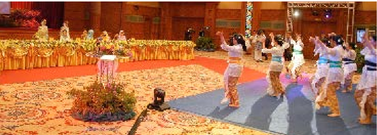
One of the performances during the event.

Also present were Her Royal Highness Princess Hajah Masna and Her Royal Highness Princess Hajah Amal Umi Kalthum Al-Islam. The function was highlighted with colourful performances from local and foreign artistes.