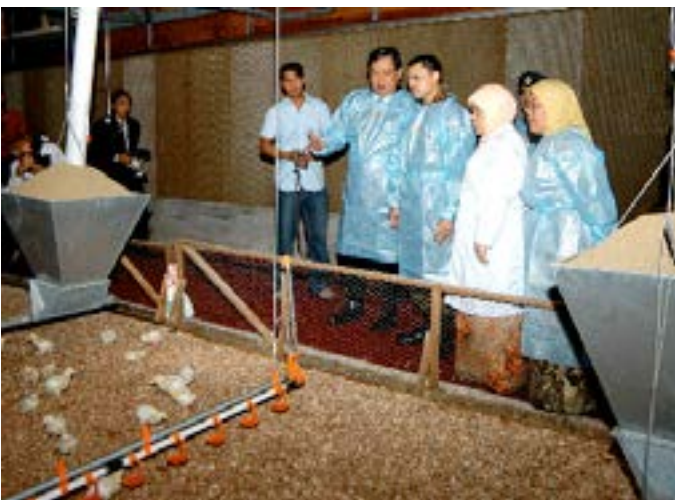
Visit to chicken breeding farm.