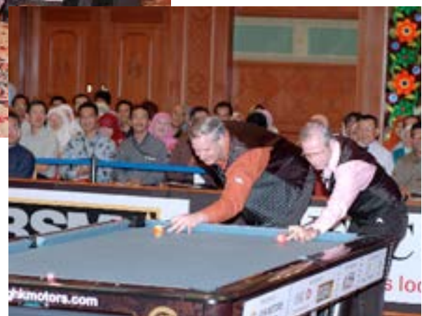
Both participants at the Brunei Trick Shot Masters 2006.