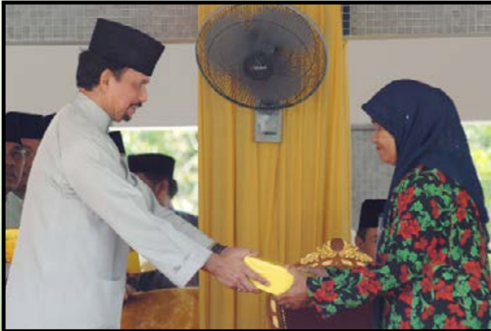
His Majesty The Sultan and Yang Di-Pertuan of Brunei Darussalam consents to present the donated meat to one of the recipients.