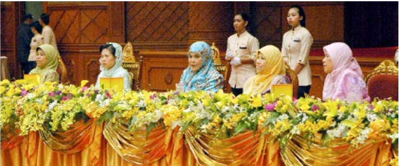
Her Majesty The Raja Isteri and Her Royal Highness at the BSLA get-together.