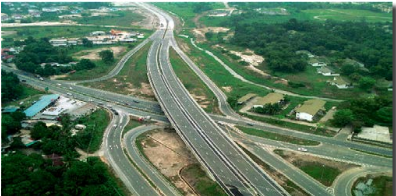
Well structured highways ensure good transportation

There are 12 class of driving license available in Brunei, namely; Autocycle and Motorcycle (Class 1), Articulated Vehicle (Class 2), Private and Commercial Vehicles not exceeding 4480 pounds (Class 3), Commercial Vehicles net weight