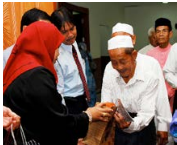
One of the elder people receives a souvenir.

The International Day for the Elderly is marked on every October 1, as declared by the United Nations.