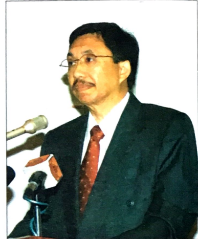
Yang Berhormat Pehin Dato Paduka Awang Haji Hazair at the launching of UBD Information Week 2005

UBD Information Week 2005 was held in conjunction with the World Intellectual Property Day. A four-day seminar was held which focused on the importance of protecting intellectual creativity.