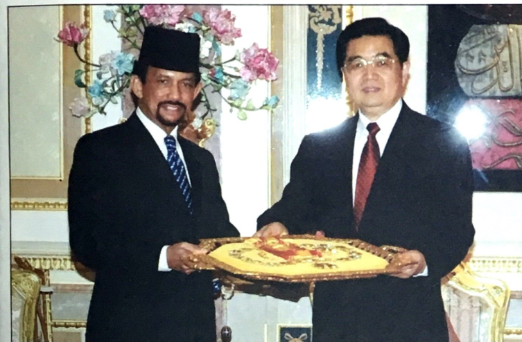
His Majesty The Sultan and Yang Di-Pertuan of Brunei Darussalam awards His Excellency Hu Jintao, the President of the People's Republic of China with The Most Esteemed Family Order Laila Utama which carries the title 'Dato Laila Utama'

B runei Darussalam and the People's Republic of China share a valuable body of formal cooperation. Areas of cooperation namely; education, health, culture, energy, tourism, communications, defence and legal affairs are serving both nation-states well.