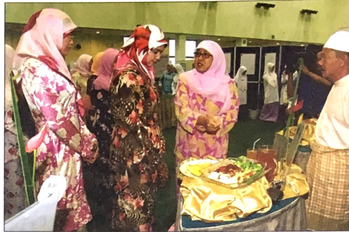
Her Royal Highness takes a closer look at the exhibition celebrating World Health Day

In 2003, only two maternal deaths were reported due to complications during pregnancy. This represented 0.3 maternal mortality rate for every 1,000 live birth. In the same year, a total of 67 infant deaths were reported. This infant mortality rate represented 9.5 for every 1,000 live birth.