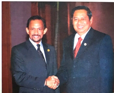
His Majesty with the President of the Republic of Indonesia

The declaration also encourage greater interaction among experts from Asia and Africa in finding practical ways and means, as well as sharing best practices and experiences, on preparing Asian-African countries for the direct impact of disasters and possible secondary effects such as on public health and environmental crises.