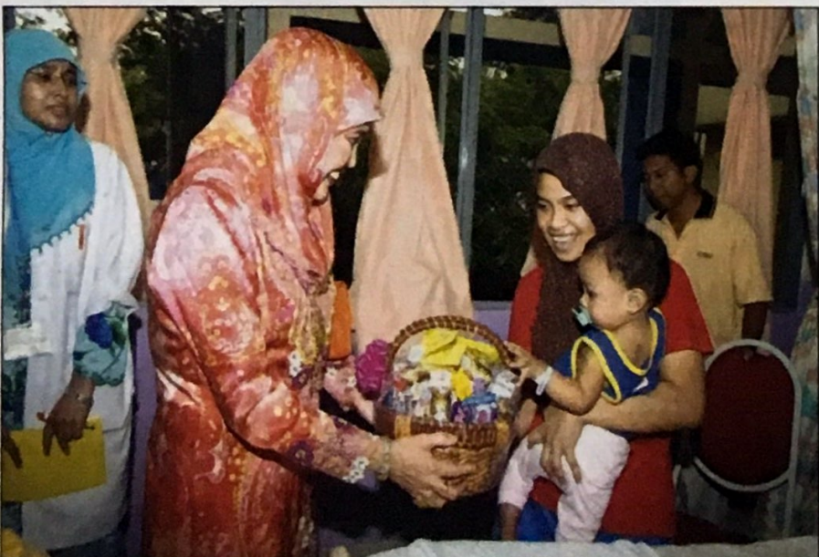
Her Majesty gives away gifts to children hospitalised at the Paediatric Ward of Kuala Lumpur Hospital