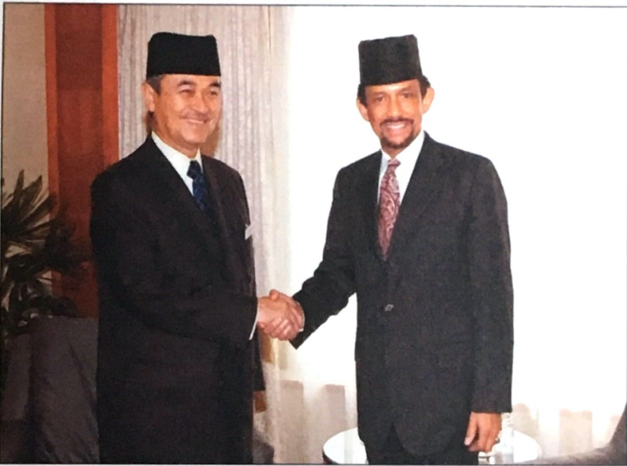
His Majesty with the Prime Minister of Malaysia, The Honourable Dato' Seri Abdullah Haji Ahmad Badawi