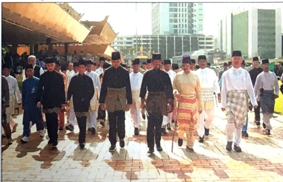
His Majesty and royal entourage joined scores of Muslims celebrating the birthday anniversary of Prophet Mohammad

If this is one of the causes of unemployment, it is the individuals who should improve. Besides this, the individuals should have strong will and determination to release their selves from