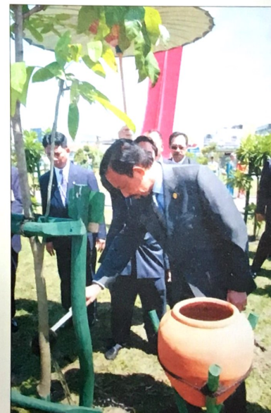
His Majesty waters the plant at Tegalega Park to commemorate the Golden Jubilee of the Asian-African Summit 1955-2005