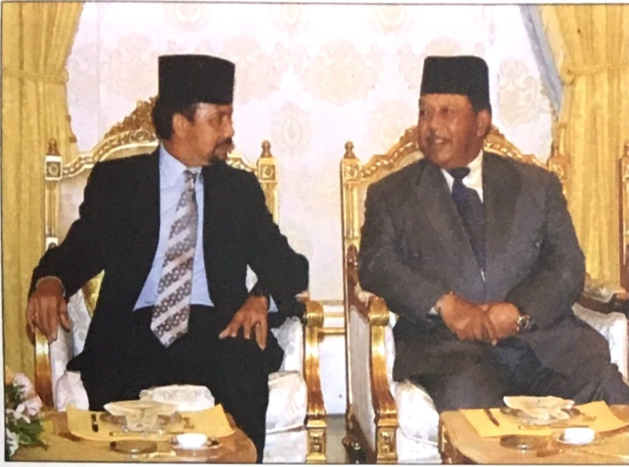
His Majesty with His Majesty The Yang Di-Pertuan Agong of Malaysia