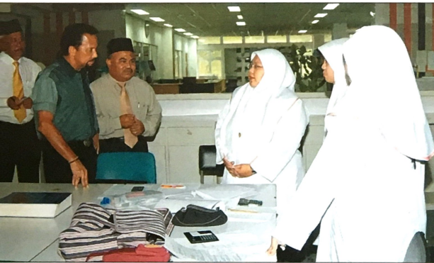
His Majesty talks to a student at the college's library

Pengiran Anak Puteri Rashidah Sa'adatul Bolkiah (PAPRSB) College of Nursing and various agencies in the Tutong district received a visit by His Majesty The Sultan and Yang Di-Pertuan of Brunei Darussalam. The visit was made on April 6 and 13 respectively.