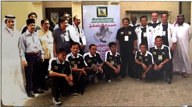
His Royal Highness with Brunei's contingent at the 1st Islamic Solidarity Games

Brunei celebrates World Health Day on April 27. The theme for this year is "Healthy Mothers and Healthy Children" with the slogan of "Make Every Mother and Child Count".