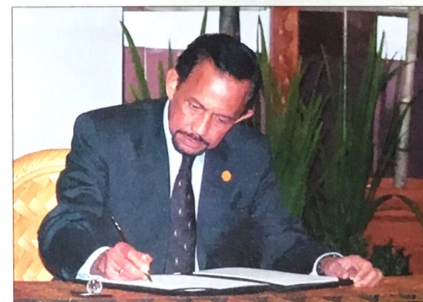
Left: His Majesty signs the Declaration of New Asian-African Strategic Partnership