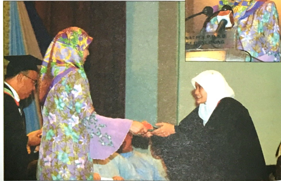
A graduate receives her certificate from Her Royal Highness