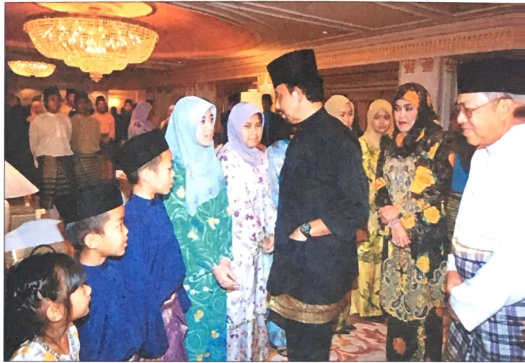
His Majesty mingles with Malaysian-based Brunei officials and their families