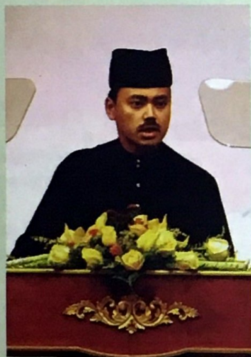
His Royal Highness The Crown Prince urges to install the spirit of tolerance and camaraderie

M ore avenues should be created to enable youths in the South East Asian region to interact. It is also as a medium to equip themselves as important contributors in the international arena. This is also to install the spirit of tolerance and camaraderie to further strengthen the existing cooperation and understanding.