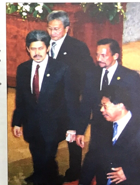
His Majesty and His Royal Highness Prince Mohamed Bolkiah at the Summit