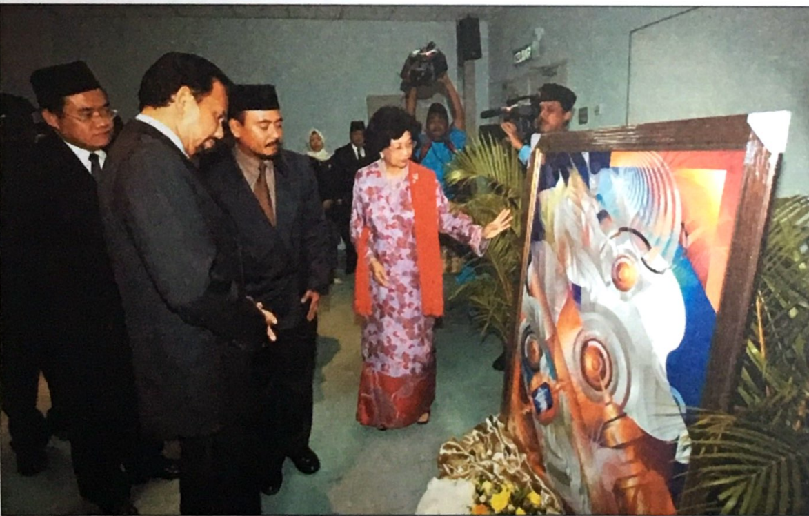
His Majesty looks at an art creation displayed at Multimedia University, Cyberjaya