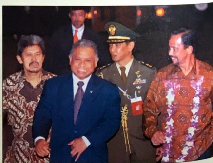
His Excellency Purnomo Yusgiantoro, the Minister for Energy and Mineral Resources welcomes His Majesty upon arrival in Jakarta