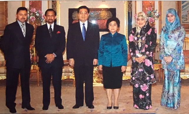
Their Majesties, Their Royal Highnesses and His Excellency Hu Jintao and consort in a group photo prior to the dinner banquet

S everal agreements were reached between Brunei and China during the two-day state visit of His Excellency President Hu Jintao to Brunei.