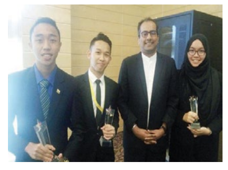
15. RBN hosts IPC on Maritime Security 16. Brunei wins Thomas Phillips Moot