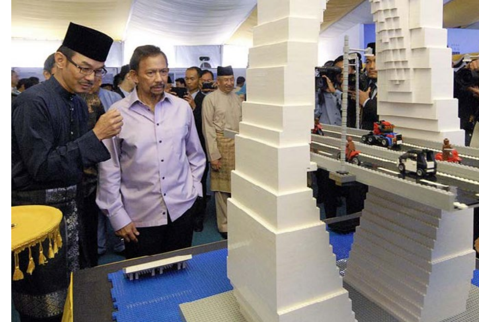
His Majesty witnessing the scale models and listening to a briefing on the construction of the Temburong

His Majesty then proceeded to the Exhibition Hall, where scale models were The CC3 package (Navigation Bridges).