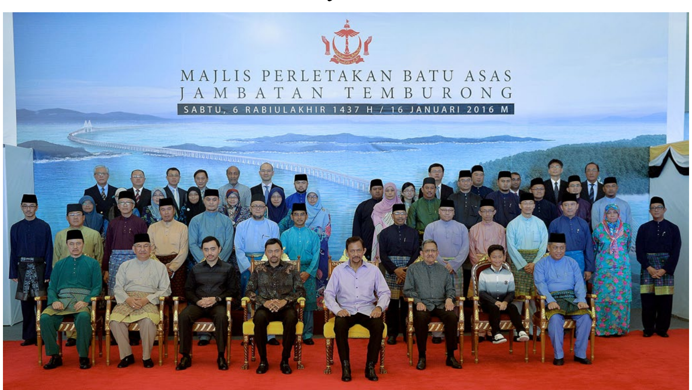
His Majesty together with the other members of royal family in a group picture with the National Committee for the Temburong Bridge.