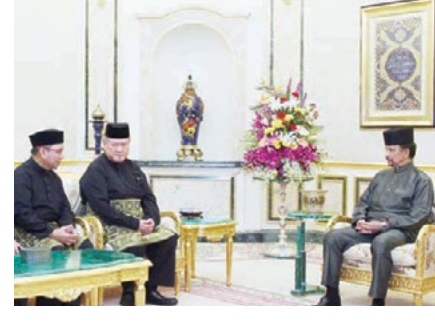
3. His Majesty receives audiences