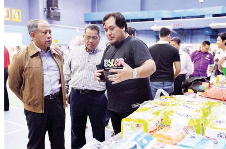
The Minister of Culture, Youth and Sports viewing the activities conducted by volunteers in conjunction with the International Volunteer Day 2016.

Present as the Guest of Honour was Yang Berhormat Pehin Datu Lailaraja Major General (Rtd) Dato Paduka Seri Haji Awang Halbi bin Haji Mohd. Yussof,