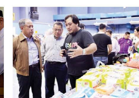
International Volunteer Day 2016