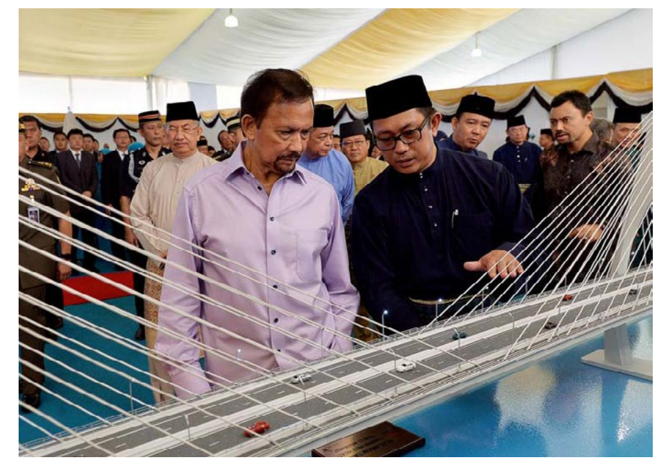
His Majesty viewing the full scale model of the Temburong Bridge.

While viewing the exhibition, His Majesty also listened to briefings from the managements of the Daelim Industrial Company Limited-Swee Sendirian