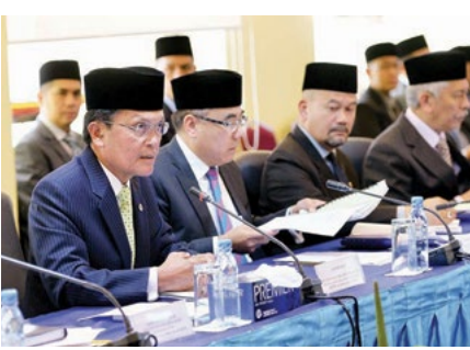
8 MoHA to continuously improve public services