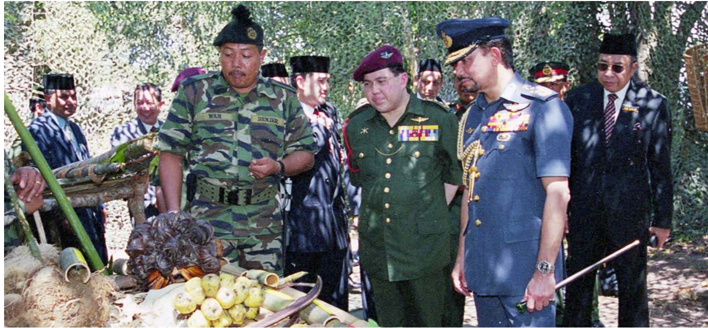
His Majesty Sultan Haji Hassanal Bolkih Mu'izzaddin Waddaulah ibni Al-Marhum Sultan Haji Omar 'Ali Saifuddin Sa'adul Khairi Waddien, Sultan and Yang Di-Pertuan of Brunei Darussalam listening to a briefing on edible foods found in the forest during the visit to the Desa Pahlawan Camp.