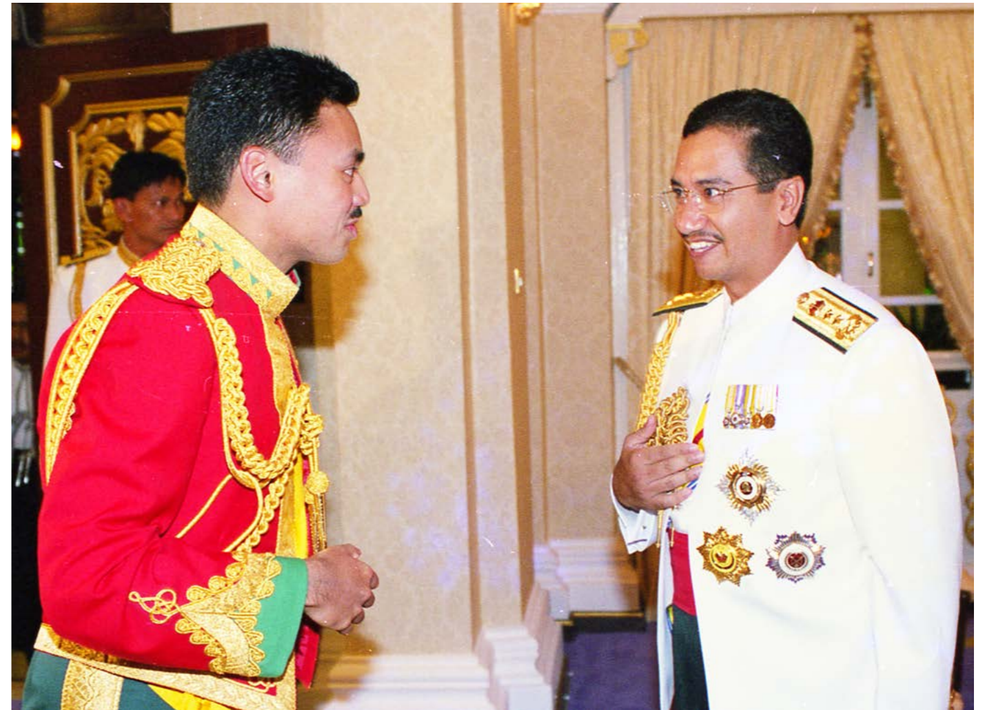
His Royal Highness Prince Haji Al-Muhtadee Billah ibni His Majesty Sultan Haji Hassanal Bolkiah Mu'izzaddin Waddaulah, the Crown Prince having a conversation with His Majesty Al-Wathiqu Billah Al-Sultan Mizan Zainal Abidin ibni Al-Marhum Sultan Mahmud Al-Muktafi Billah Shah, Sultan and Yang Di-Pertuan of Terengganu Darul Iman prior to the Majlis Jamuan Berserak (Berserak Banquet Ceremony).