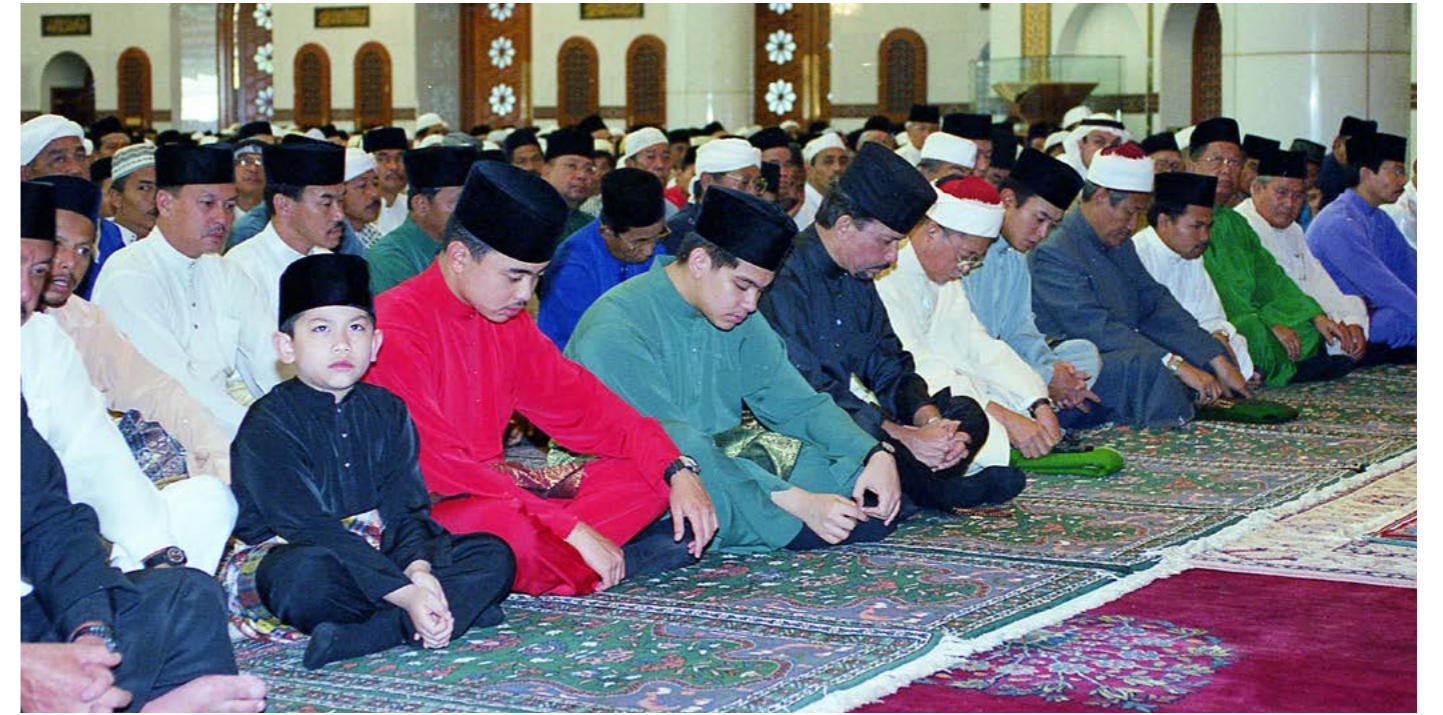
His Majesty the Sultan and Yang Di-Pertuan of Brunei Darussalam together with Their Royal Highnesses joining in a mass Sunat Aidiladha prayer held prior to the Korban Ceremony at the Jame' 'Asr Hassanil Bolkiah.

Bandar Seri Begawan, March 29 – A Korban Ceremony was conducted for His Majesty Sultan Haji Hassanal Bolkiah Mu'izzaddin Waddaulah ibni Al-Marhum Sultan Haji Omar 'Ali Saifuddien Sa'adul Khairi Waddien, Sultan and Yang Di-Pertuan of Brunei Darussalam and His Majesty's family at the compound of the Jame' 'Asr Hassanil Bolkiah.