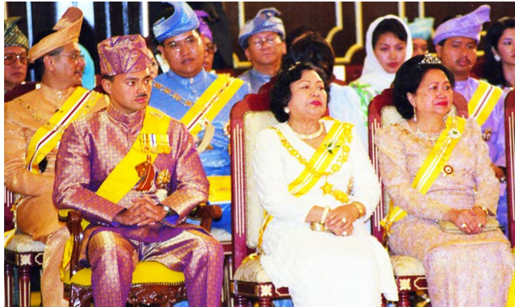
His Royal Highness Prince Haji Al-Muhtadee Billah ibni His Majesty Sultan Haji Hassanal Bolkiah Mu'izzaddin Waddaulah, the Crown Prince during the Royal Coronation Ceremony at the Istana Maziah.