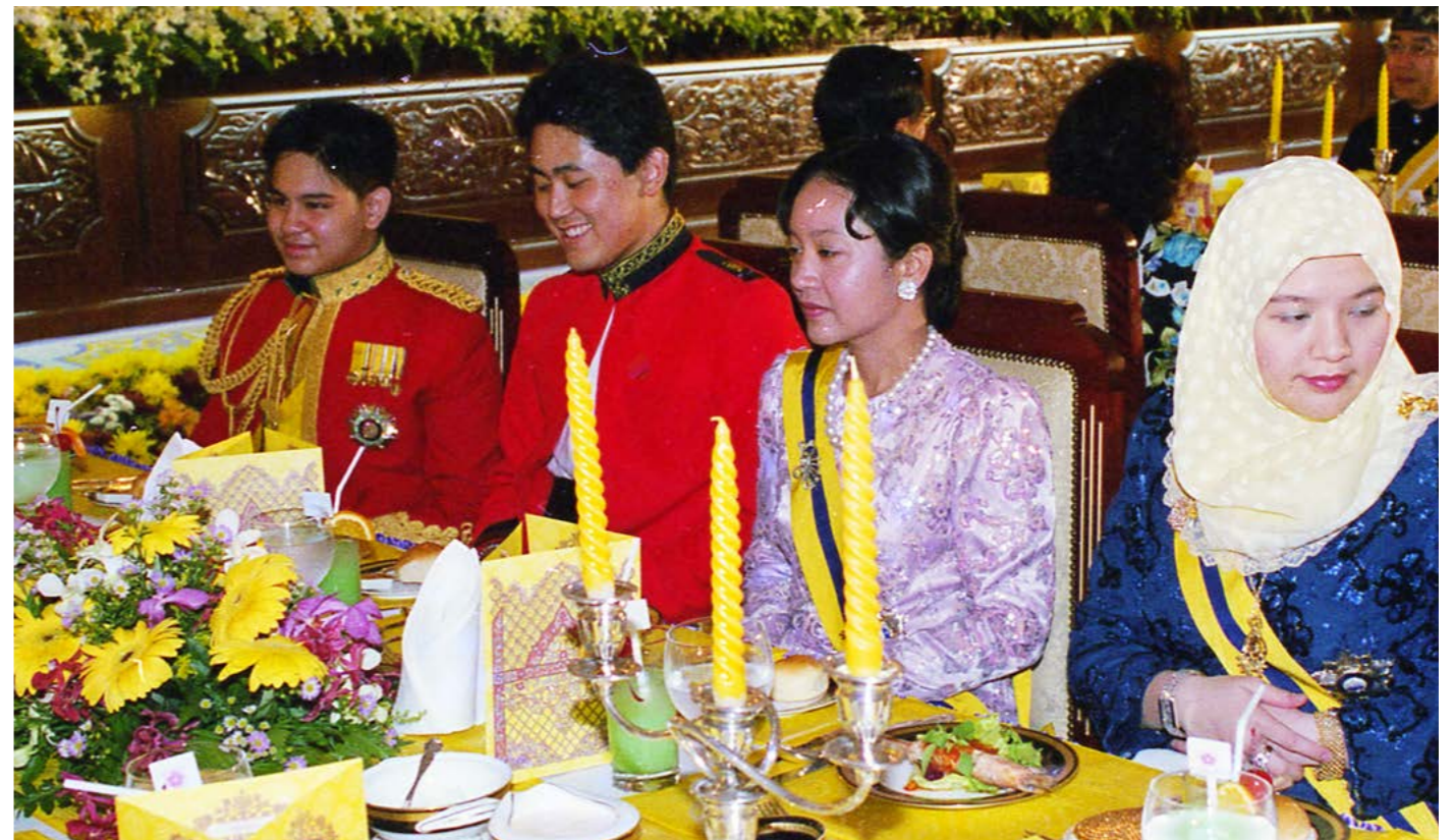
His Royal Highness Prince Haji 'Abdul 'Azim (left) and Yang Amat Mulia Pengiran Muda Abdul Qawi at the banquet ceremony held at the Istana Badariah.