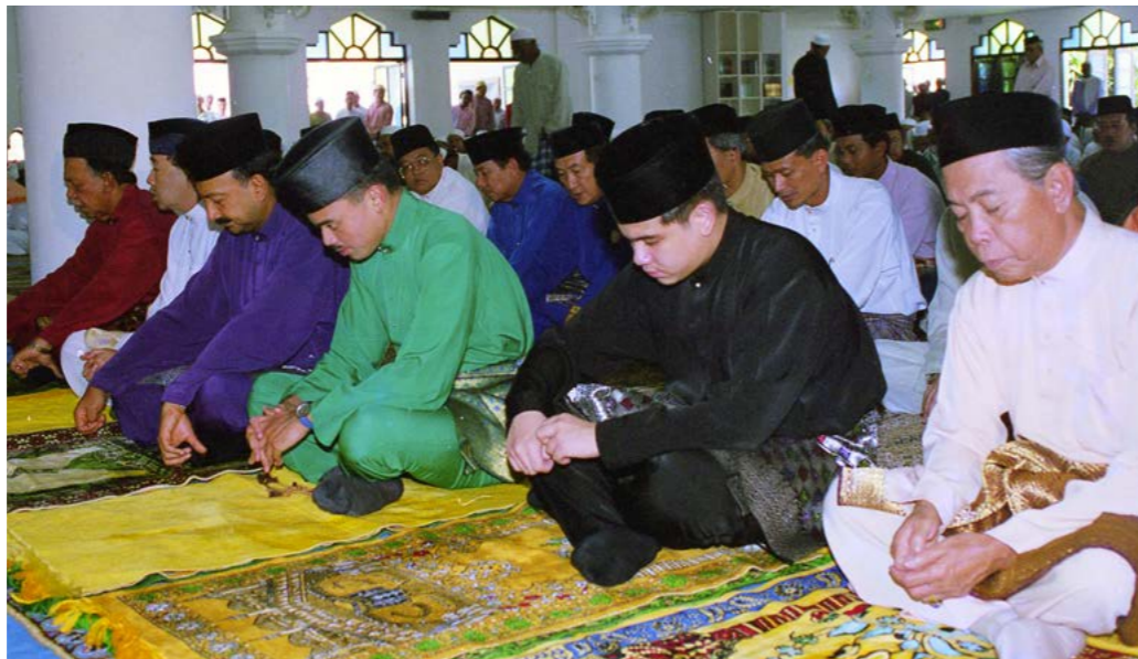
His Royal Highness Prince Haji Al-Muhtadee Billah and His Royal Highness Prince Haji 'Abdul 'Azim during the mass Friday prayer at the Tengku Tengah Zaharah Mosque, Teluk Ibai, Kuala Terengganu Darul Iman.