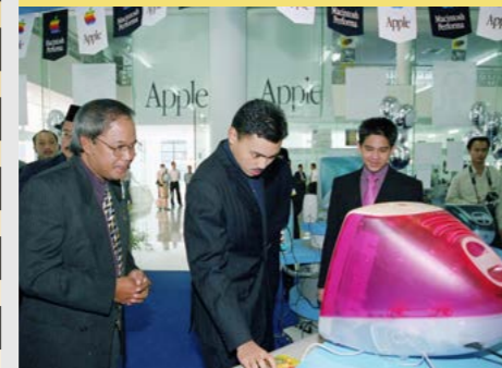
23. PMM Fund continues to receive contributions