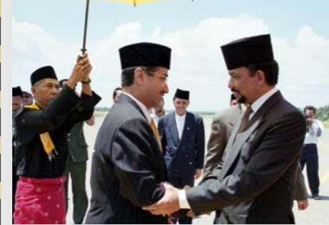
13. His Majesty visits Terengganu Darul Iman