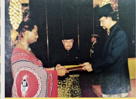
4. His Majesty receives diplomatic credentials