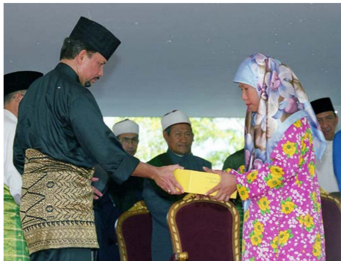
His Majesty the Sultan and Yang Di-Pertuan of Brunei Darussalam handing over Korban meat to the underprivileged (above and below).