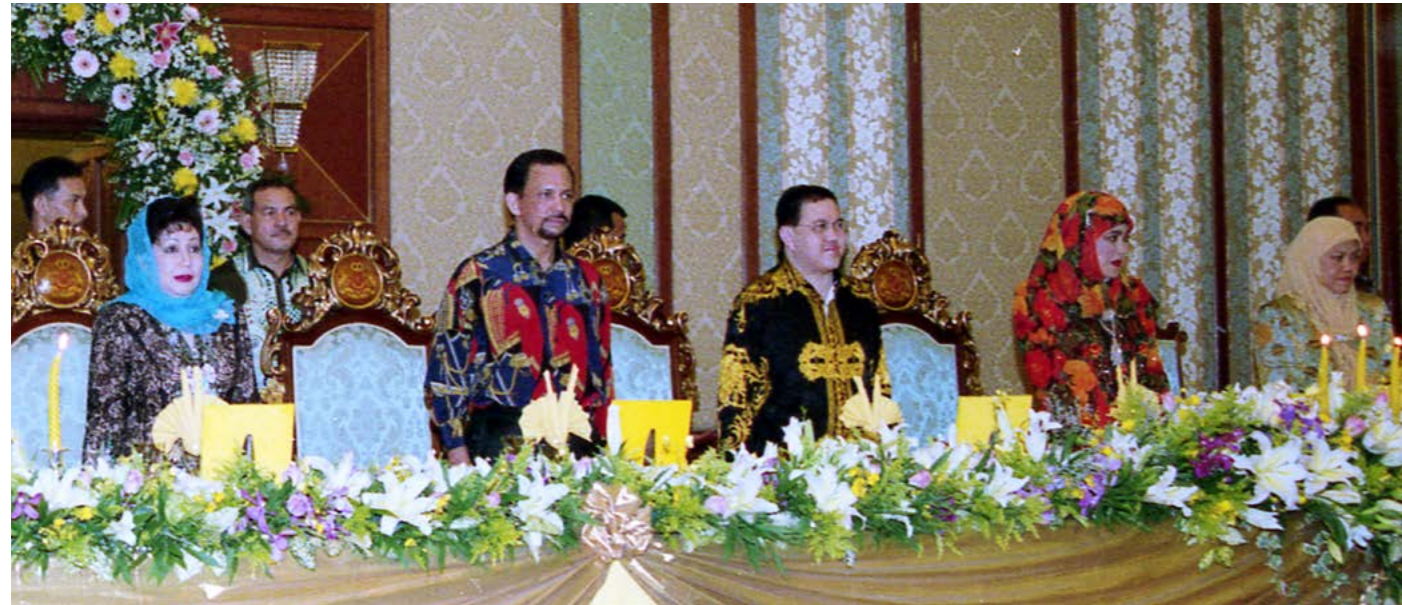
His Majesty Sultan Haji Hassanal Bolkiah Mu'izzaddin Waddaulah ibni Al-Marhum Sultan Haji Omar 'Ali Saifuddin Sa'adul Khairi Waddien, Sultan and Yang Di-Pertuan of Brunei Darussalam and Her Majesty Duli Raja Isteri Pengiran Anak Hajjah Saleha binti Al-Marhum Pengiran Pemancha Pengiran Anak Mohamed Alam; His Majesty Tuanku Ismail Petra ibni Al-Marhum Sultan Yahya Petra, Sultan and Yang Di-Pertuan of Kelantan Darul Naim and Duli Yang Maha Mulia Tengku Anis binti Al-Marhum Tengku Abdul Hamid, Raja Perempuan of Kelantan Darul Naim; and Her Royal Highness Princess Hajjah Masna during the Royal Banquet.