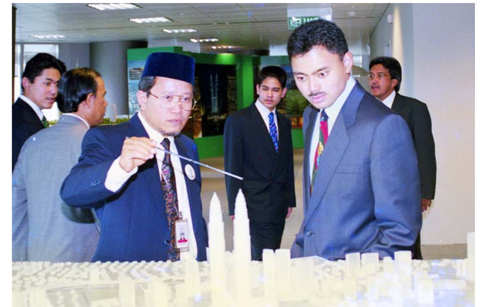
His Royal Highness Prince Haji Al-Muhtadee Billah and His Royal Highness Prince Haji 'Abdul 'Azim during their visit to PETRONAS Twin Towers, KLCC, Kuala Lumpur.

His Royal Highness then proceeded to the PETRONAS Twin Towers, KLCC, Kuala Lumpur, which is the tallest building in the world.