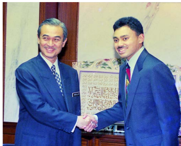
His Royal Highness Prince Haji Al-Muhtadee Billah during a courtesy visit to Yang Amat Berhormat Dato Seri Abdullah bin Haji Ahmad Badawi, Deputy Prime Minister of Malaysia.