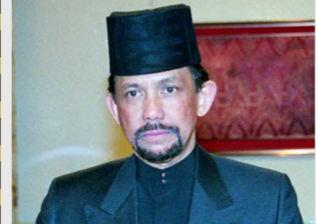
1. Takbir, tahmid and patriotism - the strength of ummah and national development