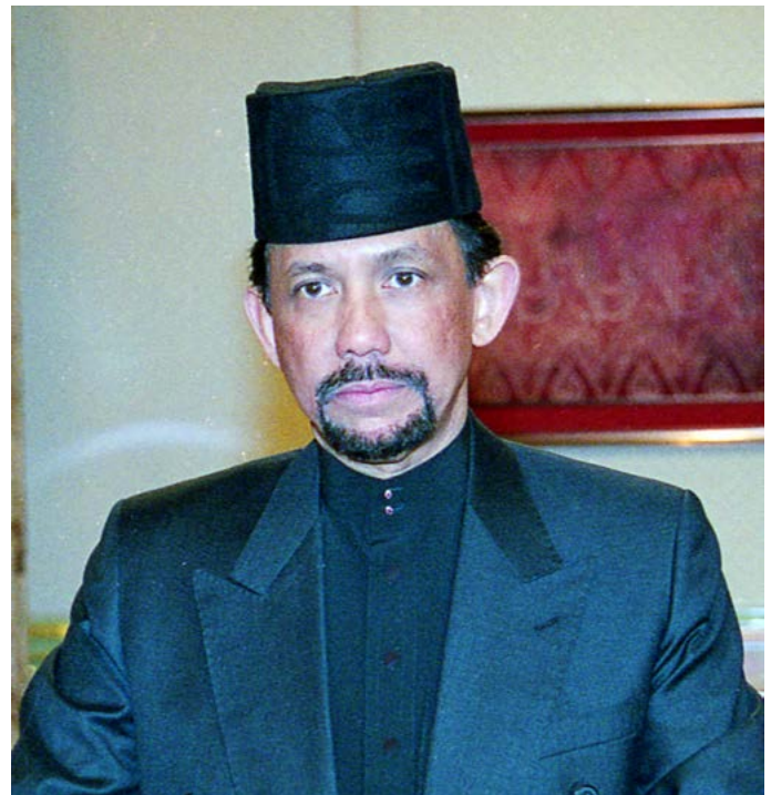
His Majesty Sultan Haji Hassanal Bolkiah Mu'izzaddin Waddaulah ibni Al-Marhum Sultan Haji Omar 'Ali Saifuddien Sa'adul Khairi Waddien, Sultan and Yang Di-Pertuan of Brunei Darussalam delivering his titah (royal speech) in conjunction with the celebration of Hari Raya Aidiladha.

"This is one of the teachings of Islam. We are told to take charge of ourselves and the country by uniting and reaching a consensus. We are also bounded by our