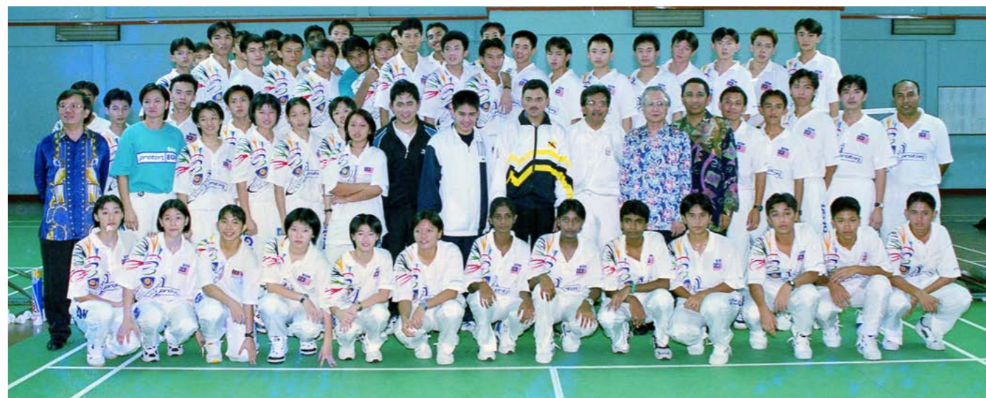
Their Royal Highnesses in a group photo during their visit to the Malaysia Badminton Academy in Cheras.