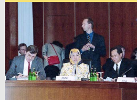
24. 2nd ASEM Foreign Ministers' Meeting Reception Ceremony