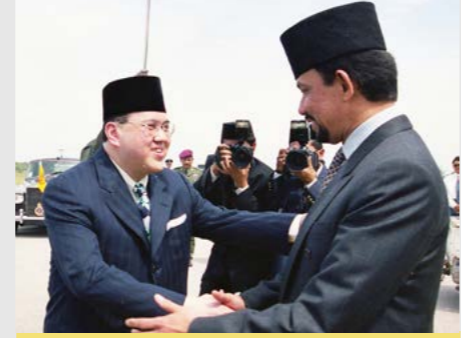
7. Friendly relations continue to strengthen