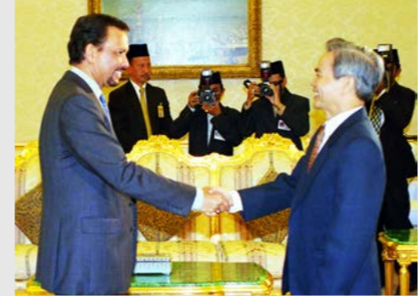
3. His Majesty receives audiences