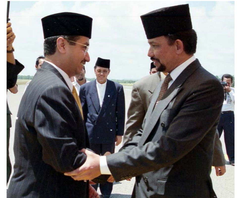
His Majesty Sultan Haji Hassanal Bolkih Mu'izzaddin Waddaulah ibni Al-Marhum Sultan Haji Omar 'Ali Saifuddin Sa'adul Khairi Waddien, Sultan and Yang Di-Pertuan of Brunei Darussalam being welcomed by His Majesty Al-Wathiqu Billah Al-Sultan Mizan Zainal Abidin ibni Al-Marhum Sultan Mahmud Al-Muktafi Billah Shah, Sultan and Yang Di-Pertuan of Terengganu Darul Iman.

Upon arrival, at the Sultan Mahmud Airport, His Majesty and the delegation were welcomed by His Majesty the Sultan and Yang Di-Pertuan of Terengganu Darul Iman and Her Majesty Sultanah of Terengganu.