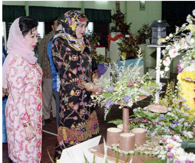
Her Majesty Duli Raja Isteri Pengiran Anak Hajjah Saleha binti Al-Marhum Pengiran Pemancha Pengiran Anak Mohamed Alam during the visit to the Taman Orkid Tengku Anis, Pengkalan Chepa (left) and the Darul Aitam Puteri Orphanage (right).