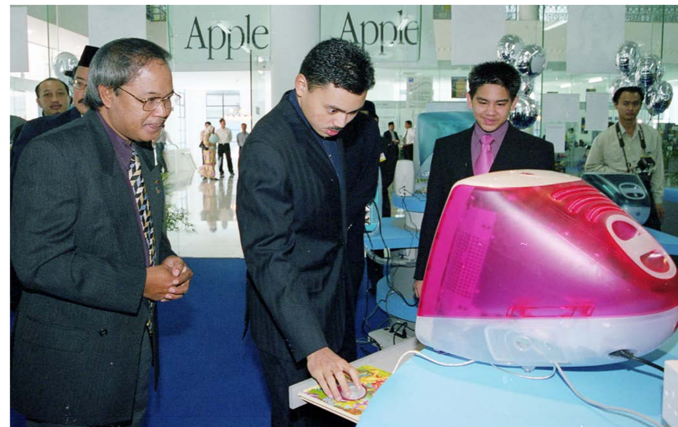
His Royal Highness Prince Haji Al-Muhtadee Billah ibni His Majesty Sultan Haji Hassanal Bolkiah Mu'izzaddin Waddaulah, the Crown Prince and His Royal Highness Prince Haji 'Abdul 'Azim during the Brunei Information Technology Exhibition (BITEK) 1999 at the Seri Kenangan Shopping Mall, Kiulap.

BANDAR SERI BEGAWAN, March 3 – The Pengiran Muda Mahkota Al-Muhtadee Billah (PMM) Fund for Orphans, which was established last year in 1998, continues to receive attention and contributions from various parties in the country.