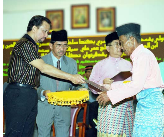
His Majesty Sultan Haji Hassanal Bolkiah Mu'izzaddin Waddaulah ibni Al-Marhum Sultan Haji Omar 'Ali Saifuddien Sa'adul Khairi Waddien, Sultan and Yang Di-Pertuan of Brunei Darussalam presenting a land grant (left) and a house key (right) to the recipients.