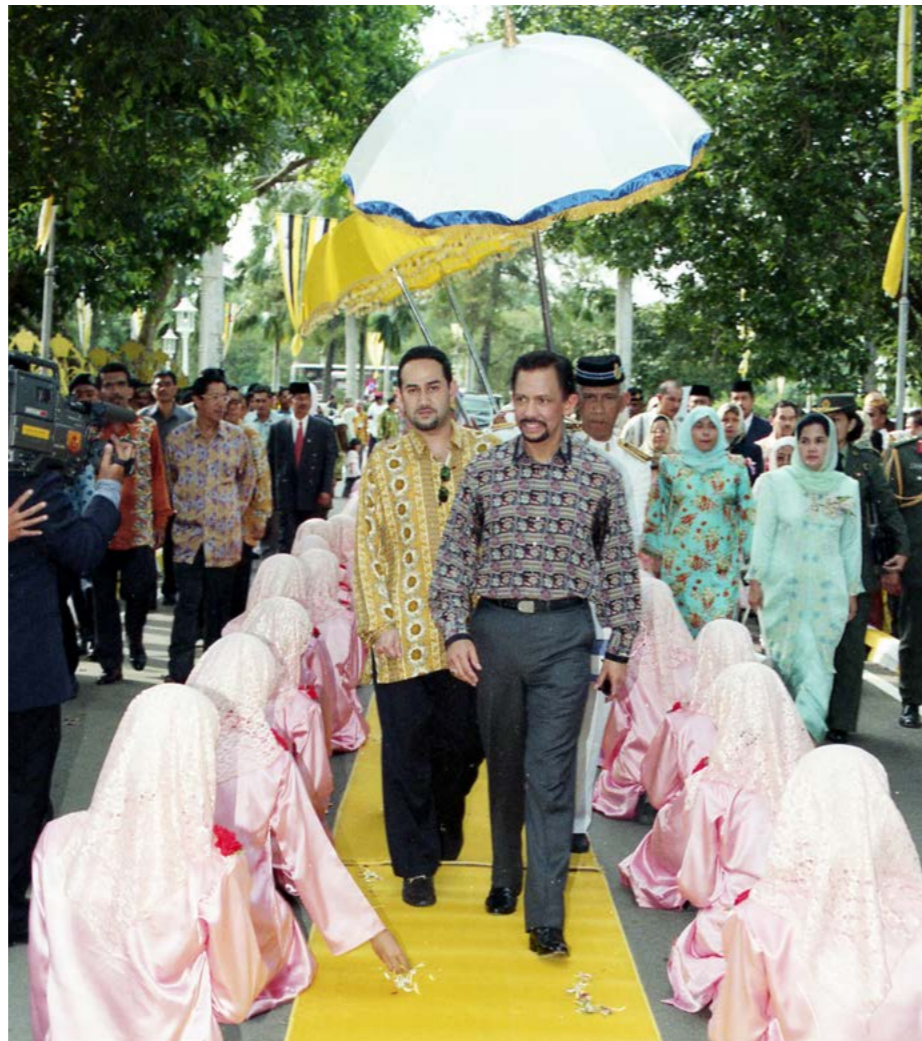
His Majesty the Sultan and Yang Di-Pertuan of Brunei Darussalam at the ' Majlis Taman '.

In the evening, a Royal Banquet hosted by His Majesty the Sultan and Yang Di-Pertuan of Kelantan Darul Naim and Duli Yang Maha Mulia Raja Perempuan of Kelantan Darul Naim was held at the Main Hall of Diamond Puteri Hotel,