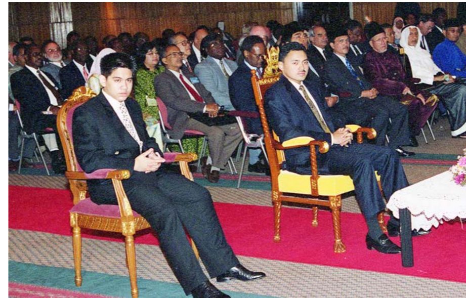
His Royal Highness Prince Haji Al-Muhtadee Billah ibni His Majesty Sultan Haji Hassanal Bolkiah Mu'izzaddin Waddaulah, the Crown Prince and His Royal Highness Prince Haji 'Abdul 'Azim during the 10 th Pan Commonwealth Forum on Open Learning.

BERAKAS, March 2 - His Royal Highness Prince Haji Al-Muhtadee Billah ibni His Majesty Sultan Haji Hassanal Bolkiah Mu'izzaddin Waddaulah, the Crown Prince highlighted that developments in the spread of information technology and knowledge have given many opportunities and possibilities for the benefit of human beings as the world approaches a new millennium.