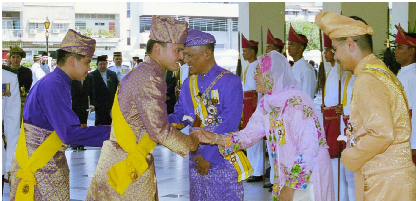
His Royal Highness Prince Haji Al-Muhtadee Billah and His Royal Highness Prince Haji 'Abdul 'Azim being greeted upon their arrival at the Istana Maziah.