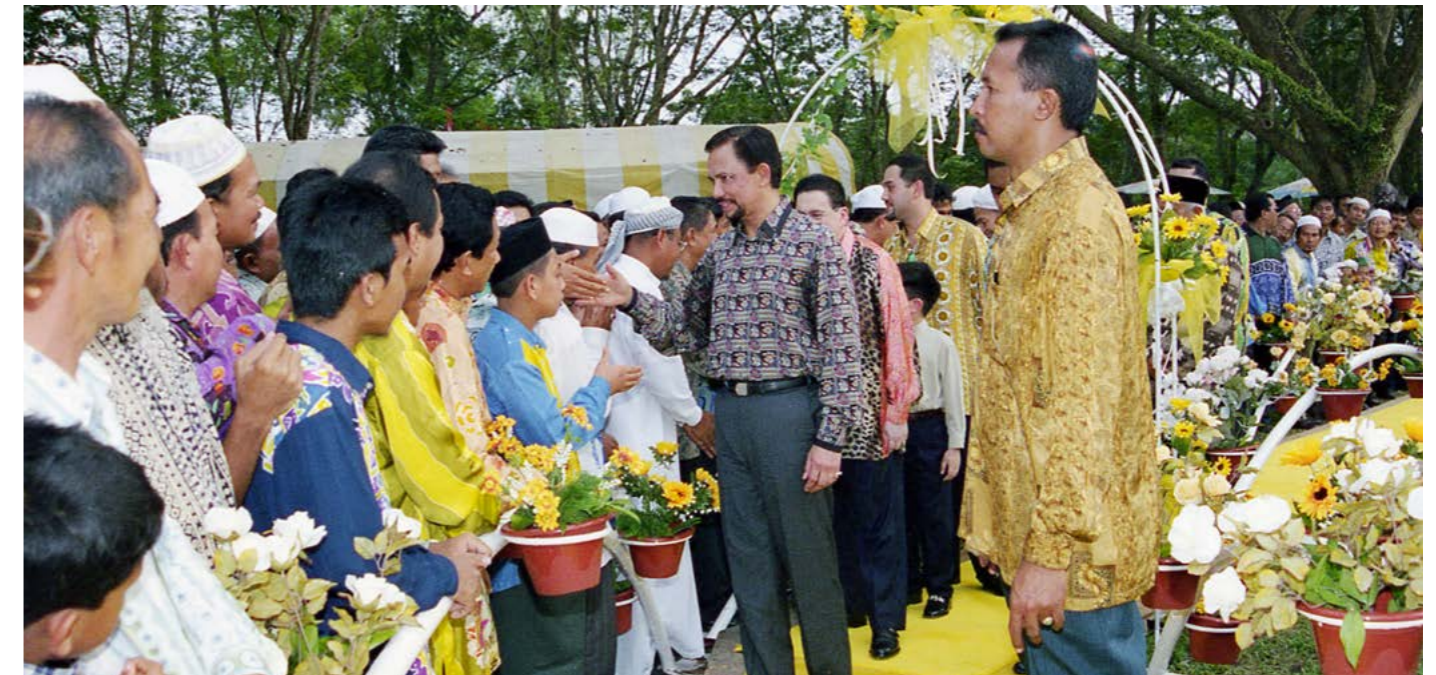
His Majesty the Sultan and Yang Di-Pertuan of Brunei Darussalam at the 'Majlis Taman', which was held to celebrate the arrival of His Majesty and the delegation at the State of Kelantan Darul Naim.