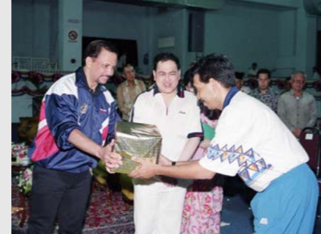
11. Courtesy visit continues