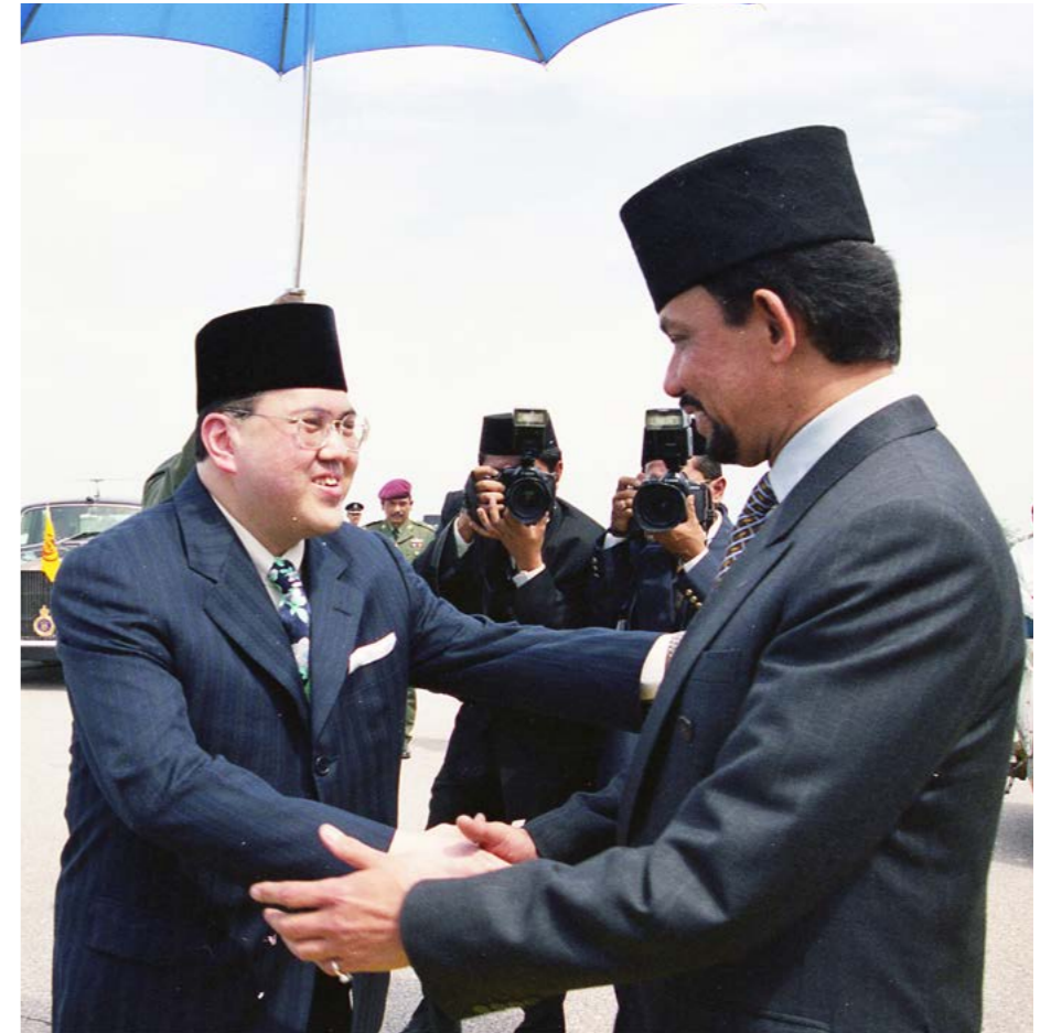
His Majesty Sultan Haji Hassanal Bolkiah Mu'izzaddin Waddaulah ibni Al-Marhum Sultan Haji Omar 'Ali Saifuddien Sa'adul Khairi Waddien, Sultan and Yang Di-Pertuan of Brunei Darussalam being welcomed by His Majesty Tuanku Ismail Petra ibni Al-Marhum Sultan Yahya Petra, Sultan and Yang Di-Pertuan of Kelantan Darul Naim upon arrival.

The night before His Majesty's departure, Their Majesties, along with Duli Yang Teramat Mulia Pengiran Isteri attended a Royal Banquet held at the Istana Balai Besar, Kota Bharu, where