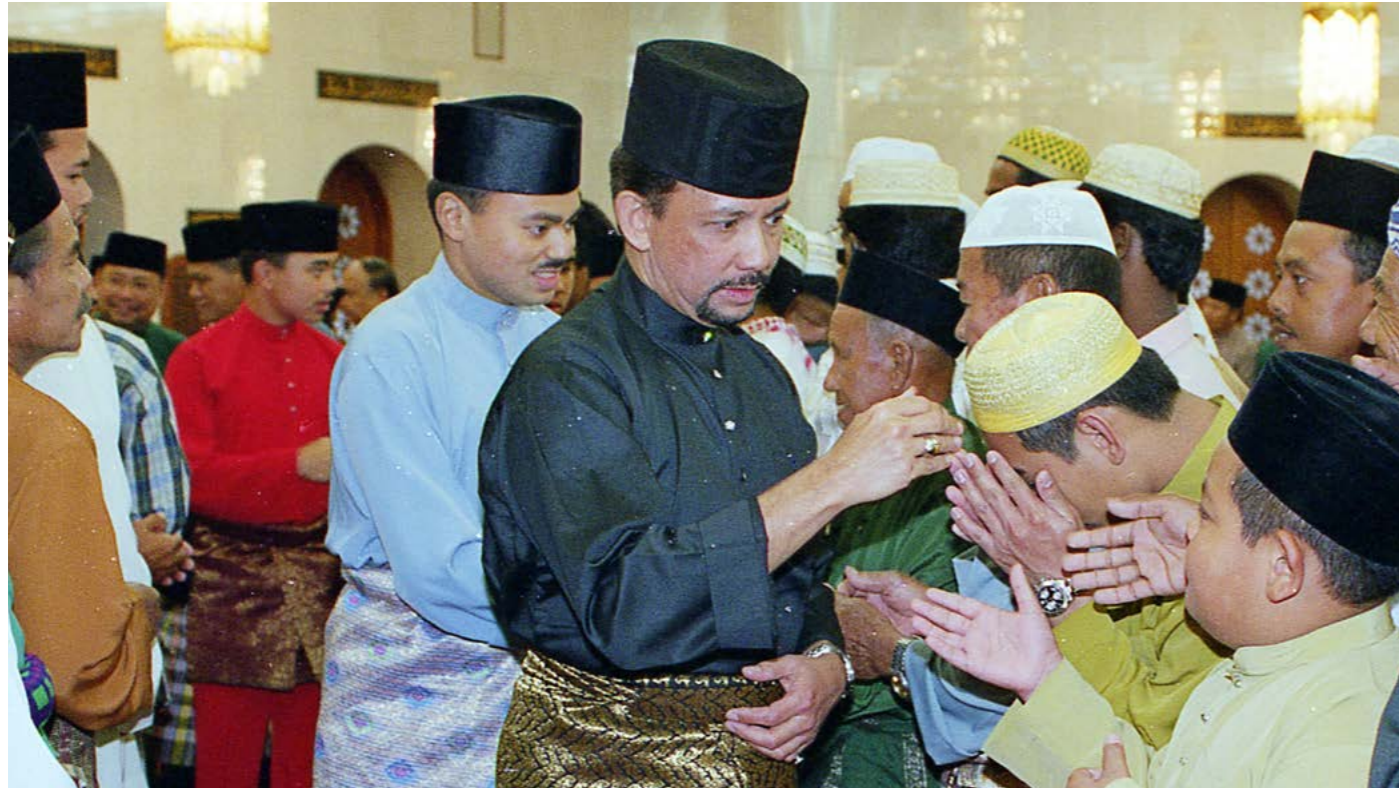
His Majesty Sultan Haji Hassanal Bolkiah Mu'izzaddin Waddaulah ibni Al-Marhum Sultan Haji Omar 'Ali Saifuddin Sa'adul Khairi Waddien, Sultan and Yang Di-Pertuan of Brunei Darussalam and His Royal Highness Prince Haji Al-Muhtadee Billah, the Crown Prince receiving junjung ziarah greetings after a mass Sunat Aidiladha prayer.