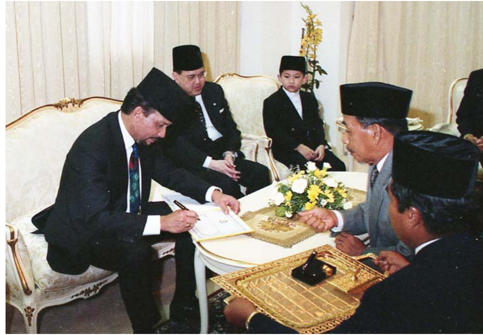
His Majesty Sultan Haji Hassanal Bolkiah Mu'izzaddin Waddaulah ibni Al-Marhum Sultan Haji Omar 'Ali Saifuddien Sa'adul Khairi Waddien, Sultan and Yang Di-Pertuan of Brunei Darussalam signing a commemorative parchment during the briefing on the development of Kelantan Darul Naim and the Council of the Religion of Islam and Malay Custom Kelantan (MAIK).