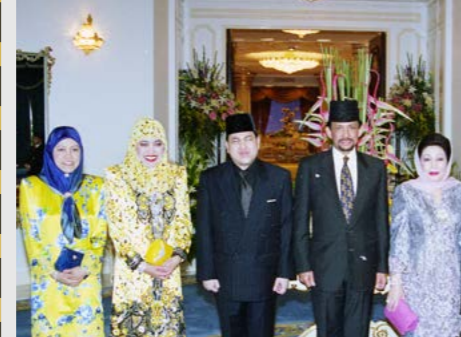
9. Royalties attend Investiture Ceremony and Courtesy Visit to Kelantan