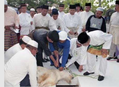
15. Underprivileged receive Korban meat