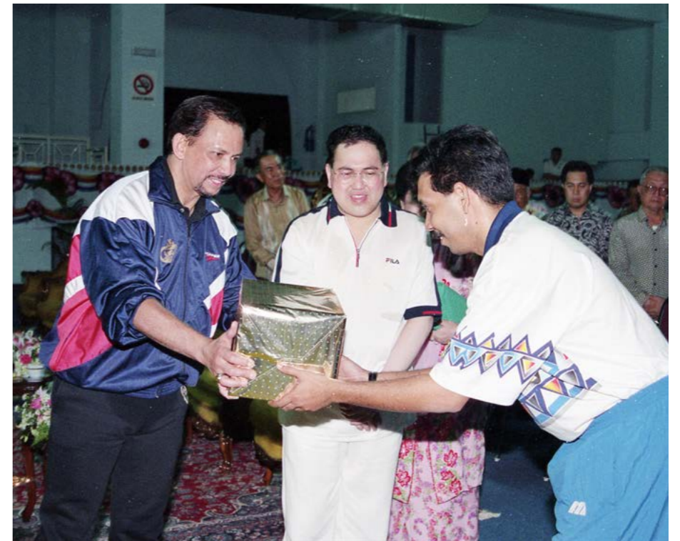
His Majesty Sultan Haji Hassanal Bolkiah Mu'izzaddin Waddaulah ibni Al-Marhum Sultan Haji Omar 'Ali Saifuddien Sa'adul Khairi Waddien, Sultan and Yang Di-Pertuan of Brunei Darussalam presenting a souvenir to one of the players of the Kelantan Darul Naim team during the badminton tournament.

In the doubles match, His Majesty the Sultan and Yang Di-Pertuan of Brunei Darussalam was partnered with Yang Dimuliakan Pehin Orang Kaya Lela