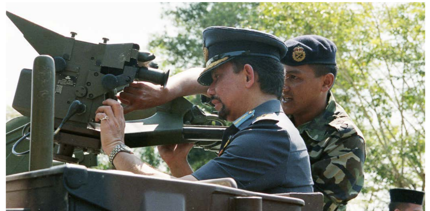
His Majesty the Sultan and Yang Di-Pertuan of Brunei Darussalam taking a closer look at the modern equipment owned by the Royal Malay Regiment during his visit to the Desa Pahlawan Camp.