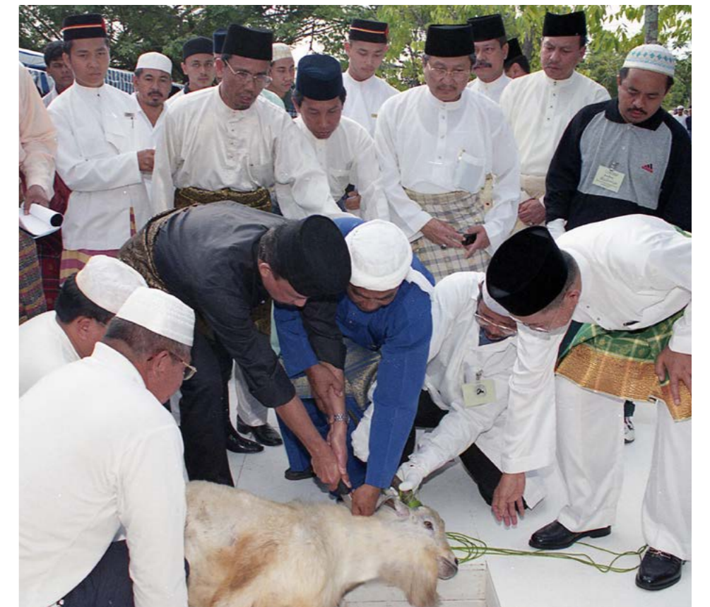
His Majesty Sultan Haji Hassanal Bolkiah Mu'izzaddin Waddaulah ibni Al-Marhum Sultan Haji Omar 'Ali Saifuddien Sa'adul Khairi Waddien, Sultan and Yang Di-Pertuan of Brunei Darussalam during the Korban Ceremony at the Jame' 'Asr Hassanil Bolkiah.