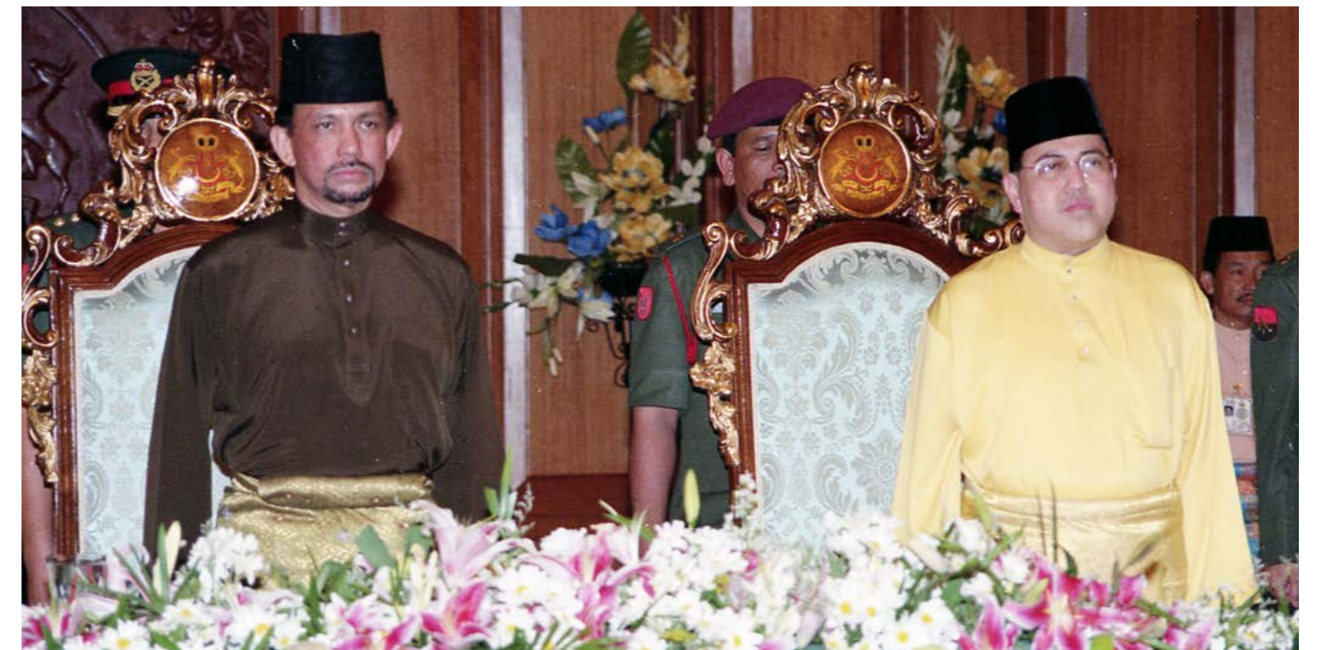
His Majesty the Sultan and Yang Di-Pertuan of Brunei Darussalam with His Majesty the Sultan and Yang Di-Pertuan of Kelantan Darul Naim during a Luncheon Ceremony, which took place at the Main Banquet Hall, Kelantan Darul Naim.