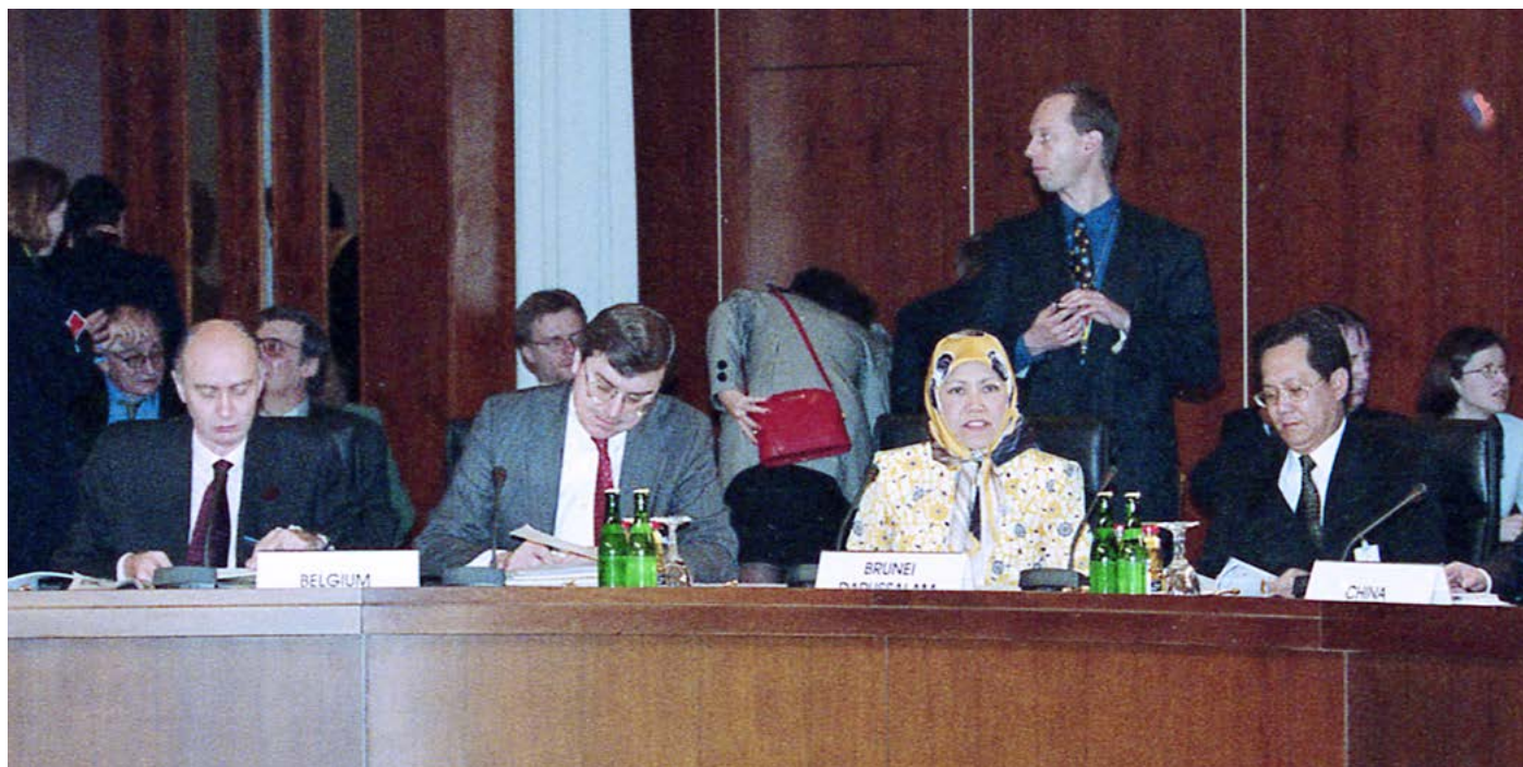
Her Royal Highness Princess Hajjah Masna binti Al-Marhum Sultan Haji Omar 'Ali Saifuddien Sa'adul Khairi Waddien, Acting Minister of Foreign Affairs of Brunei Darussalam during the 2 nd ASEM Foreign Ministers' Meeting in Berlin.

BERLIN, March 28 - Her Royal Highness Princess Hajjah Masna binti Al-Marhum Sultan Haji Omar 'Ali Saifuddien Sa'adul Khairi Waddien, Acting Minister of Foreign Affairs of Brunei Darussalam attended a Reception Ceremony alongside other Ministers of Foreign Affairs of the Asia-Europe Meeting (ASEM).