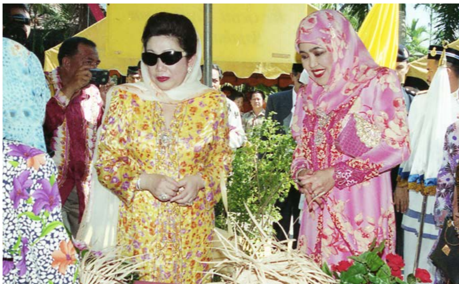
Her Majesty Duli Raja Isteri Pengiran Anak Hajjah Saleha binti Al-Marhum Pengiran Pemancha Pengiran Anak Mohamed Alam and Duli Yang Maha Mulia Tengku Anis binti Al-Marhum Tengku Abdul Hamid, Raja Perempuan of Kelantan taking a closer look at a batik painting during the Handicrafts Exhibition in Kampung Kraftangan, Kota Bharu

In the evening, Their Majesties and Duli Yang Teramat Mulia Pengiran Isteri attended a dinner hosted by Kelantan Association of State Administrative Officers.