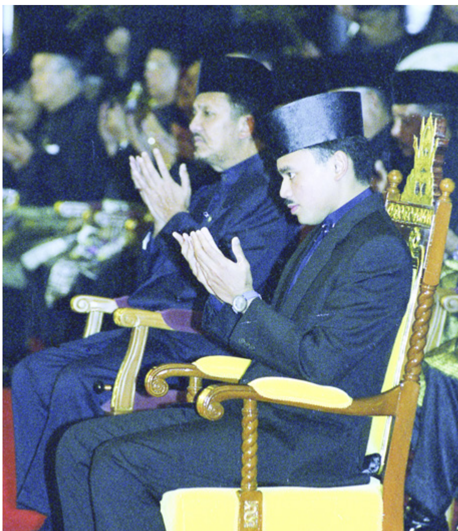
His Royal Highness Prince Haji Al-Muhtadee Billah ibni His Majesty Sultan Haji Hassanal Bolkiah Mu'izzaddin Waddaulah, the Crown Prince attending the event on behalf of His Majesty the Sultan and Yang Di-Pertuan of Brunei Darussalam. Also present was His Royal Highness Prince Haji Sufri Bolkiah ibni Al-Marhum Sultan Haji Omar 'Ali Saifuddien Sa'adul Khairi Waddien.

The Meritorious Service Medal ( Pingat Jasa Kebaktian - PJK) was received by 41 people, among them