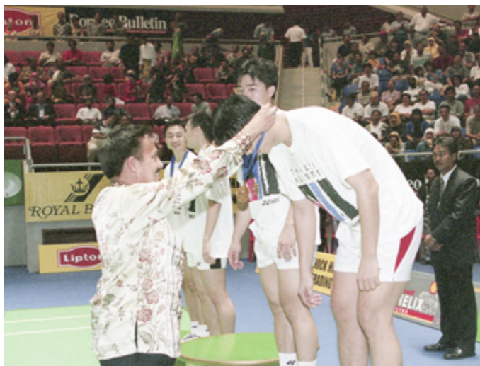
His Royal Highness Prince Haji Sufri Bolkiah ibni Al-Marhum Sultan Haji Omar 'Ali Saifuddin Sa'adul Khairi Waddien presenting the medals to the champions of the Men's Doubles Category.