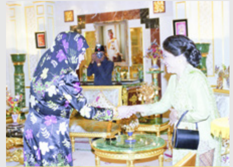
5 Her Majesty receives audiences