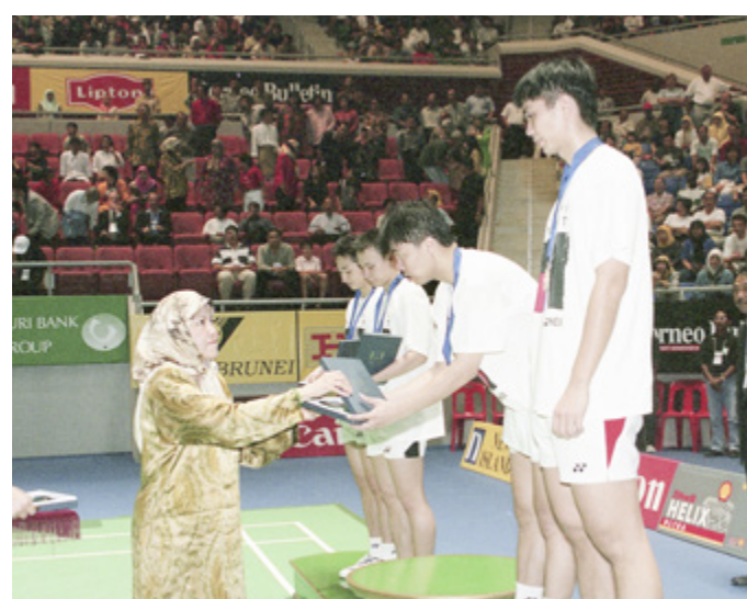
Her Royal Highness Princess Hajah Masna presenting the souvenirs to the winners of the Men's Doubles Category.