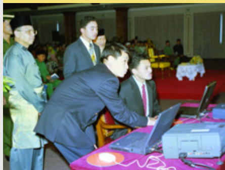
17 Brunei International Medical Journal launched