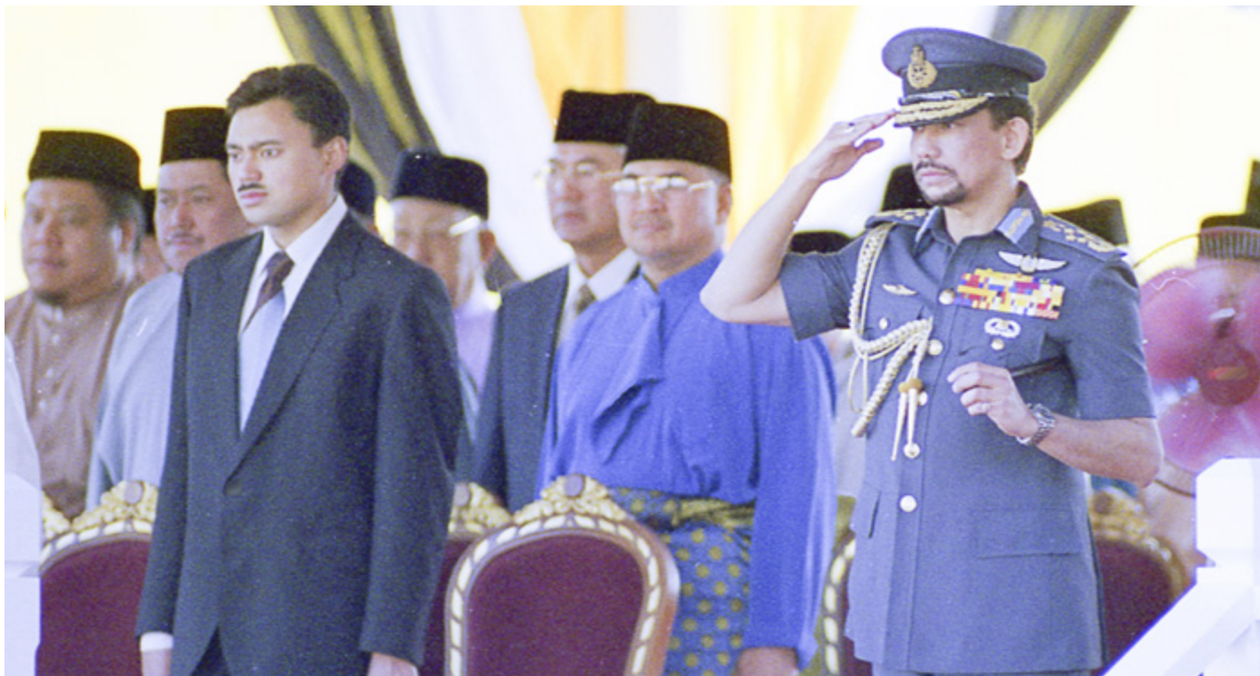
His Majesty Sultan Haji Hassanal Bolkiah Mu'izzaddin Waddaulah ibni Al-Marhum Sultan Haji Omar 'Ali Saifuddien Sa'adul Khairi Waddien, Sultan and Yang Di-Pertuan of Brunei Darussalam receiving a Royal Salute at the 15 th National Day Celebration held in Bandar Seri Begawan.