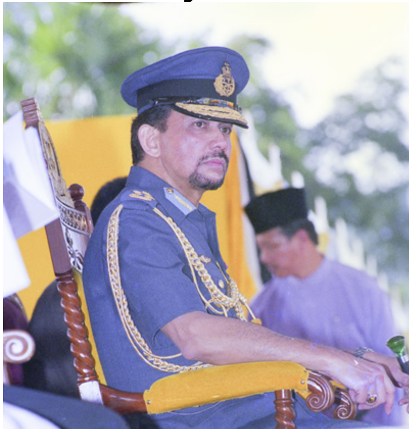
His Majesty Sultan Haji Hassanal Bolkiah Mu'izzaddin Waddaulah ibni Al-Marhum Sultan Haji Omar 'Ali Saifuddien Sa'adul Khairi Waddien, Sultan and Yang Di-Pertuan of Brunei Darussalam at the 15 th National Day Celebration.

BANDAR SERI BEGAWAN, February 23 - His Majesty Sultan Haji Hassanal Bolkiah Mu'izzaddin Waddaulah ibni Al-Marhum Sultan Haji Omar 'Ali Saifuddien Sa'adul Khairi Waddien, Sultan and Yang Di-Pertuan of Brunei Darussalam attended the 15 th National Day Celebration at the capital.