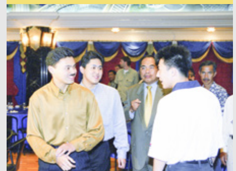
18 The Crown Prince attends luncheon