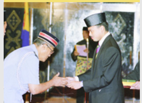
15 The Crown Prince presents Honorary Medals