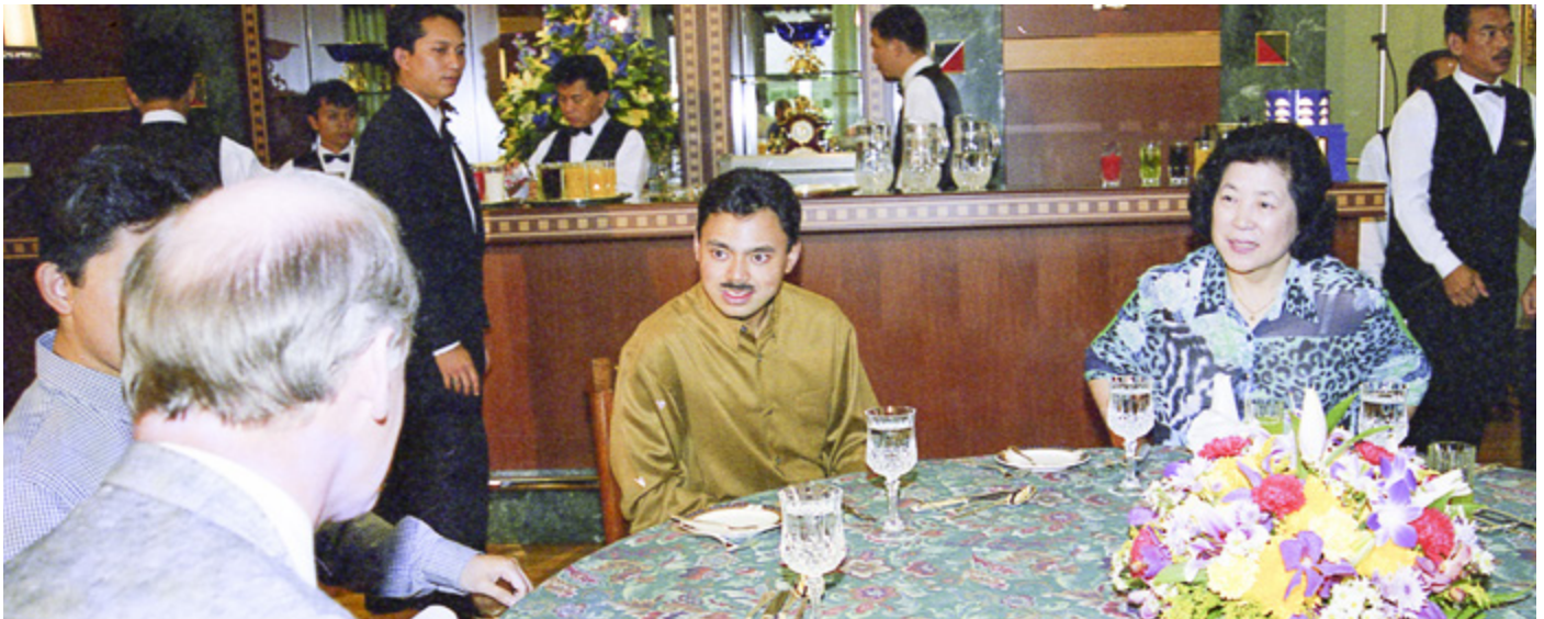
His Royal Highness Prince Haji Al-Muhtadee Billah ibni His Majesty Sultan Haji Hassanal Bolkiah Mu'izzaddin Waddaulah, the Crown Prince at the luncheon ceremony for the players, the organising committee as well as the media who will be part of the Baiduri World Badminton Grand Prix.

BANDAR SERI BEGAWAN, February 22 - About 50 of the world's best badminton players are expected to join the Baiduri World Badminton Grand Prix, an international tournament which will be held in the country for the first time.