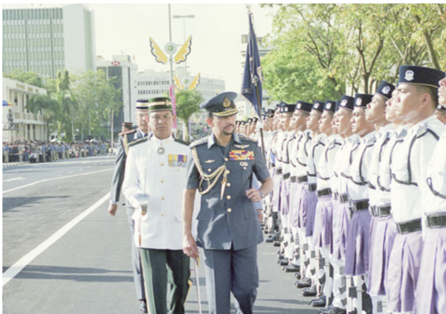
His Majesty Sultan and Yang Di-Pertuan of Brunei Darussalam inspecting the guard of honour upon arrival at the National Day Celebration.