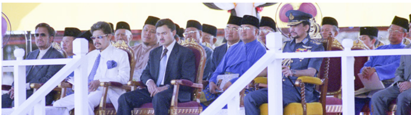
His Majesty Sultan Haji Hassanal Bolkiah Mu'izzaddin Waddaulah ibni Al-Marhum Sultan Haji Omar 'Ali Saifuddien Sa'adul Khairi Waddien, Sultan and Yang Di-Pertuan of Brunei Darussalam and other members of the royal family witnessing the marching parade as well as other performances held at the celebration.