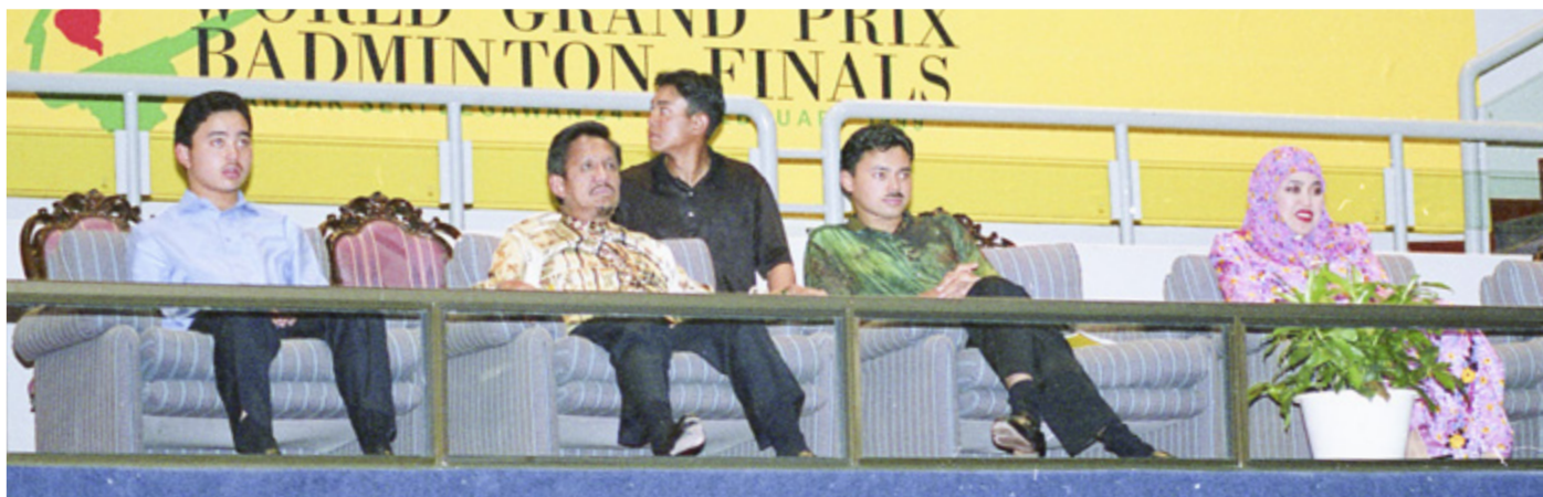
Her Majesty Duli Raja Isteri Pengiran Anak Hajah Saleha binti Al-Marhum Pengiran Pemancha Pengiran Anak Haji Mohamed Alam; His Royal Highness Prince Haji Al-Muhtadee Billah ibni His Majesty Sultan Haji Hassanal Bolkiah Mu'izzaddin Waddaulah, the Crown Prince; His Royal Highness Prince Haji Sufri Bolkiah ibni Al-Marhum Sultan Haji Omar 'Ali Saifuddien Sa'adul Khairi Waddien and His Royal Highness Prince 'Abdul Malik during the final matches of the Baiduri World Badminton Grand Prix Finale.

BERAKAS, February 28 – Her Majesty Duli Raja Isteri Pengiran Anak Hajah Saleha binti Al-Marhum Pengiran Pemancha Pengiran Anak Haji Mohamed Alam and Her Royal Highness Pengiran Isteri Hajah Mariam binti Haji Abdul Aziz attended the final matches of the Baiduri World Badminton Grand Prix Finale at the Hassanal Bolkiah National Indoor Stadium.