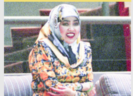
11 Baiduri World Badminton Grand Prix Finale