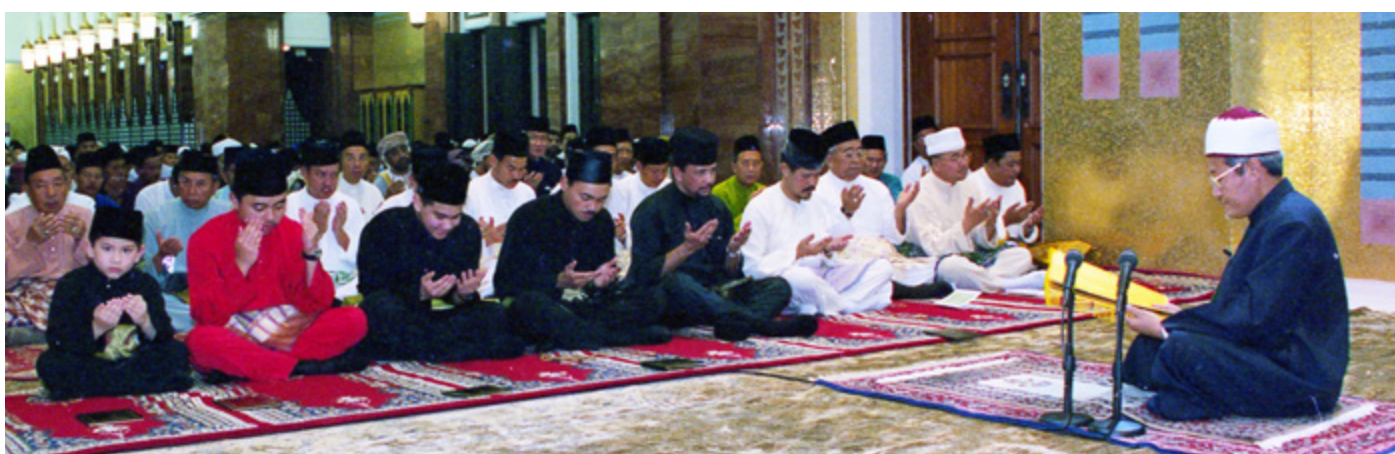
His Majesty and other members of the royal family during the Thanksgiving Ceremony in conjunction with the 15 th National Day Celebration.