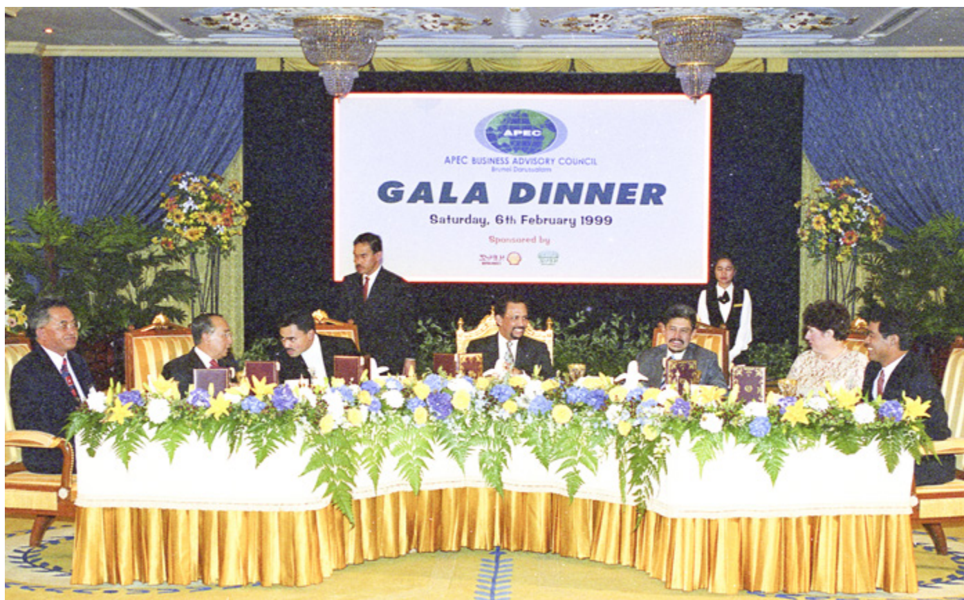
His Majesty Sultan Haji Hassanal Bolkiah Mu'izzaddin Waddaulah ibni Al-Marhum Sultan Haji Omar 'Ali Saifuddien Sa'adul Khairi Waddien, Sultan and Yang Di-Pertuan of Brunei Darussalam; His Royal Highness Prince Haji Al-Muhtadee Billah, the Crown Prince; and His Royal Highness Prince Mohamed Bolkiah at the ABAC Gala Dinner held at the Polo Club in Jerudong.