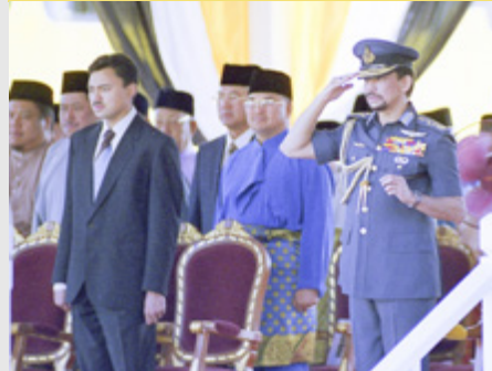
6 National Day celebrated in full glory