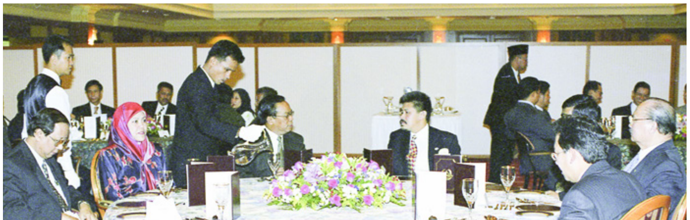
His Royal Highness Prince Mohamed Bolkiah ibni Al-Marhum Sultan Haji Omar 'Ali Saifuddien Sa'adul Khairi Waddien, Minister of Foreign Affairs during the luncheon for His Excellency Mr. U Win Aung, Foreign Minister of Myanmar at the Balai Penghadapan, Bukit Kayangan.

BANDAR SERI BEGAWAN, February 17 - His Royal Highness Prince Mohamed Bolkiah ibni Al-Marhum Sultan Haji Omar 'Ali Saifuddien Sa'adul Khairi Waddien, Minister of Foreign Affairs, held a luncheon at the Balai Penghadapan, Bukit Kayangan for His Excellency Mr. U Win Aung, Foreign Minister of Myanmar who is in the country for a two-day working visit.