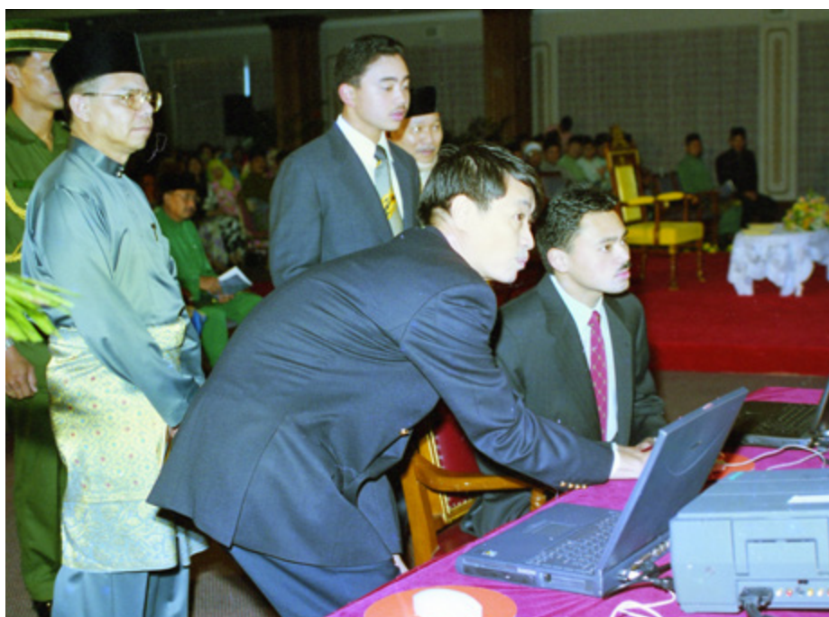
His Royal Highness Prince Haji Al-Muhtadee Billah ibni His Majesty Sultan Haji Hassanal Bolkiah Mu'izzaddin Waddaulah, the Crown Prince being briefed on the Brunei International Medical Journal Website.

GADONG, February 14 - His Royal Highness Prince Haji Al-Muhtadee Billah ibni His Majesty Sultan Haji Hassanal Bolkiah Mu'izzaddin Waddaulah, the Crown Prince consented to launch the Brunei International Medical Journal.