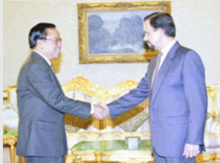
3 His Majesty grants audiences