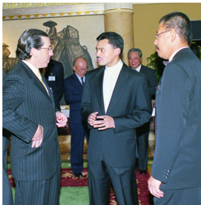
His Royal Highness Prince Haji Al-Muhtadee Billah with the delegates of ABAC.

This is Brunei Darussalam's first time hosting the high-level ABAC Meeting, which will run from February 5 to 7; before hosting the 8 th APEC Meeting for the year 2000.