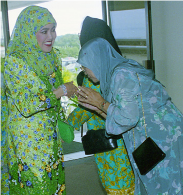
Her Majesty Duli Raja Isteri Pengiran Anak Hajah Saleha binti Al-Marhum Pengiran Pemancha Pengiran Anak Haji Mohamed Alam receiving junjung ziarah greetings from members of the Women's Council.