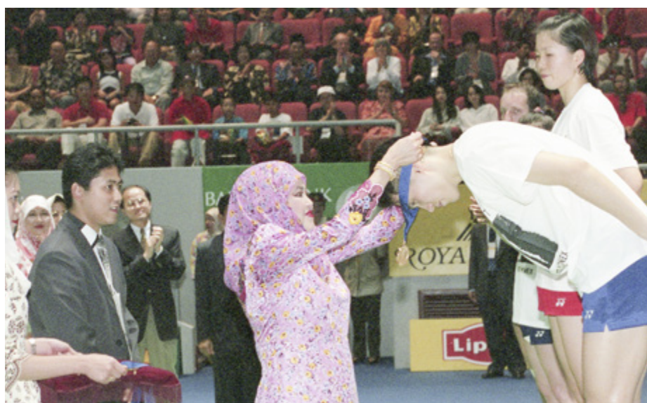
Her Majesty Duli Raja Isteri Pengiran Anak Hajah Saleha presenting the medals to the champions in the Mixed Doubles Category.