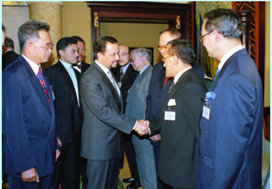
His Majesty Sultan Haji Hassanal Bolkiah Mu'izzaddin Waddaulah ibni Al-Marhum Sultan Haji Omar 'Ali Saifuddien Sa'adul Khairi Waddien, Sultan and Yang Di-Pertuan of Brunei Darussalam meeting the delegates attending the Asia-Pacific Economic Cooperation (APEC) Business Advisory Council (ABAC) Meeting.

JERUDONG, February 6 - His Majesty Sultan Haji Hassanal Bolkiah Mu'izzaddin Waddaulah ibni Al-Marhum Sultan Haji Omar 'Ali Saifuddien Sa'adul Khairi Waddien, Sultan and Yang Di-Pertuan of Brunei Darussalam delivered a titah (royal speech) stating his assurance that the Asia-Pacific Economic Cooperation (APEC) will be able to look positively forward in their efforts to focus on ways to regain confidence and revive economic development which is needed in the region.