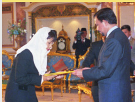
10 Two Commissioners appointed