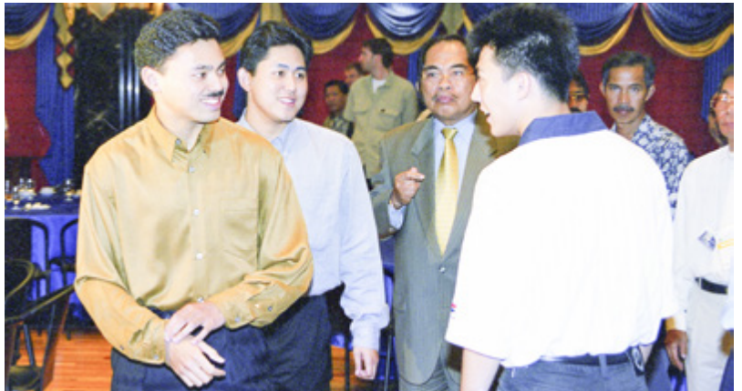
His Royal Highness Prince Haji Al-Muhtadee Billah with one of the world's best badminton players from Malaysia participating in the Baiduri World Badminton Grand Prix.

After the luncheon, His Royal Highness the Crown Prince also had a friendly meet-and-greet with some of the world's most famous players.