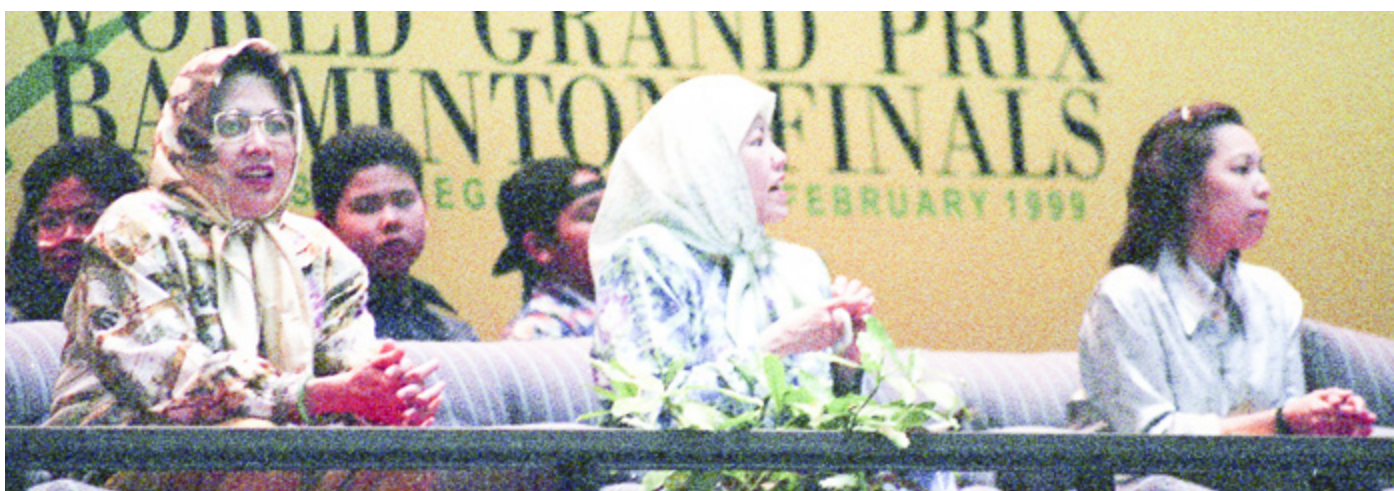
Other members of the royal family who were also present during the matches: Her Royal Highness Pengiran Anak Isteri Pengiran Anak Hajah Zariah; Her Royal Highness Princess Hajah Masna; and Her Royal Highness Princess Hajah Amal Umi Kalthum Al-Islam.