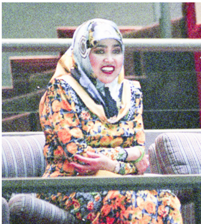
Her Majesty Duli Raja Isteri Pengiran Anak Hajah Saleha binti Al-Marhum Pengiran Pemancha Pengiran Anak Haji Mohamed Alam attending the Baiduri World Badminton Grand Prix finale at the Hassanal Bolkiah National Indoor Stadium.

BERAKAS, February 24 – Her Majesty Duli Raja Isteri Pengiran Anak Hajah Saleha binti Al-Marhum Pengiran Pemancha Pengiran Anak Haji Mohamed Alam and Her Royal Highness Pengiran Isteri Hajah Mariam binti Haji Abdul Aziz attended the Baiduri World Badminton Grand Prix Finale at the Hassanal Bolkiah National Indoor Stadium.