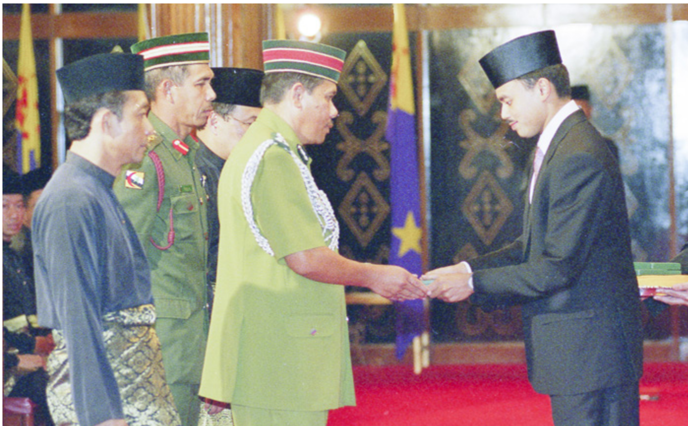
His Royal Highness Prince Haji Al-Muhtadee Billah ibni His Majesty Sultan Haji Hassanal Bolkiah Mu'izzaddin Waddaulah, the Crown Prince presenting Brunei Darussalam Honorary Medals to government officers (above and below).