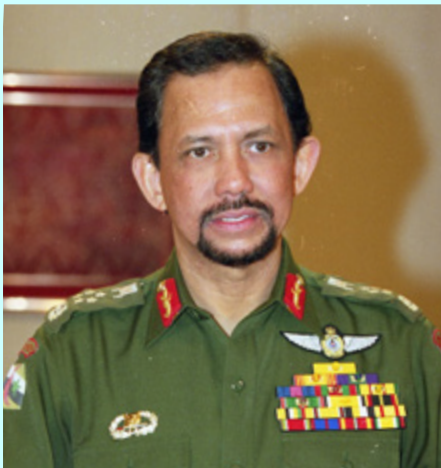
His Majesty Sultan Haji Hassanal Bolkiah Mu'izzaddin Waddaulah ibni Al-Marhum Sultan Haji Omar 'Ali Saifuddien Sa'adul Khairi Waddien, Sultan and Yang Di-Pertuan of Brunei Darussalam delivering a titah (royal speech) in conjunction with the 15 th National Day celebration.

BANDAR SERI BEGAWAN, February 23 – The government will ensure that all development and infrastructure projects are properly managed to meet the demands of modernisation and professionalism, in terms of quantity as well as quality.