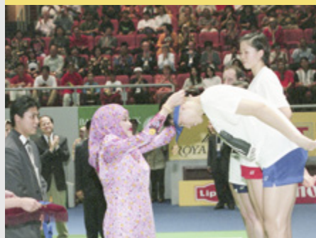
12 Badminton Finale prize presentation