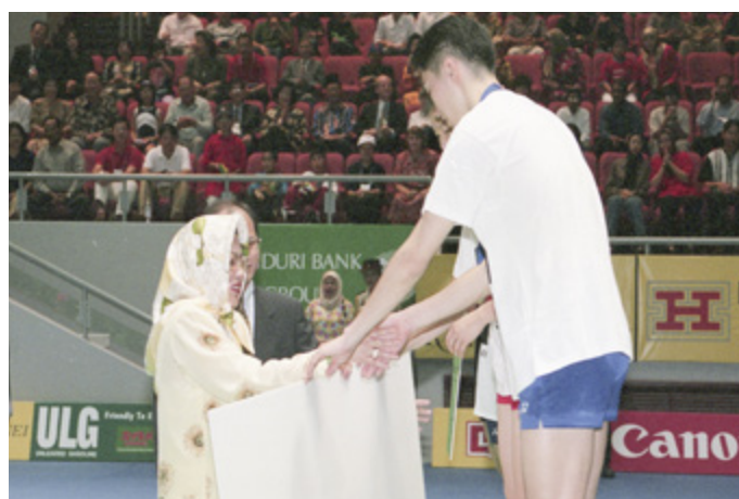
Her Royal Highness Pengiran Anak Hajah Zariah presenting the the winning cheque replica to the champions in the Mixed Doubles Category.