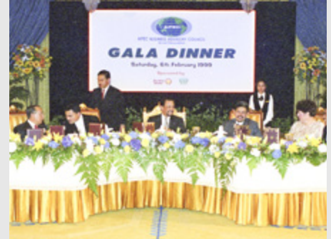
9 Regain confidence, revive economic development