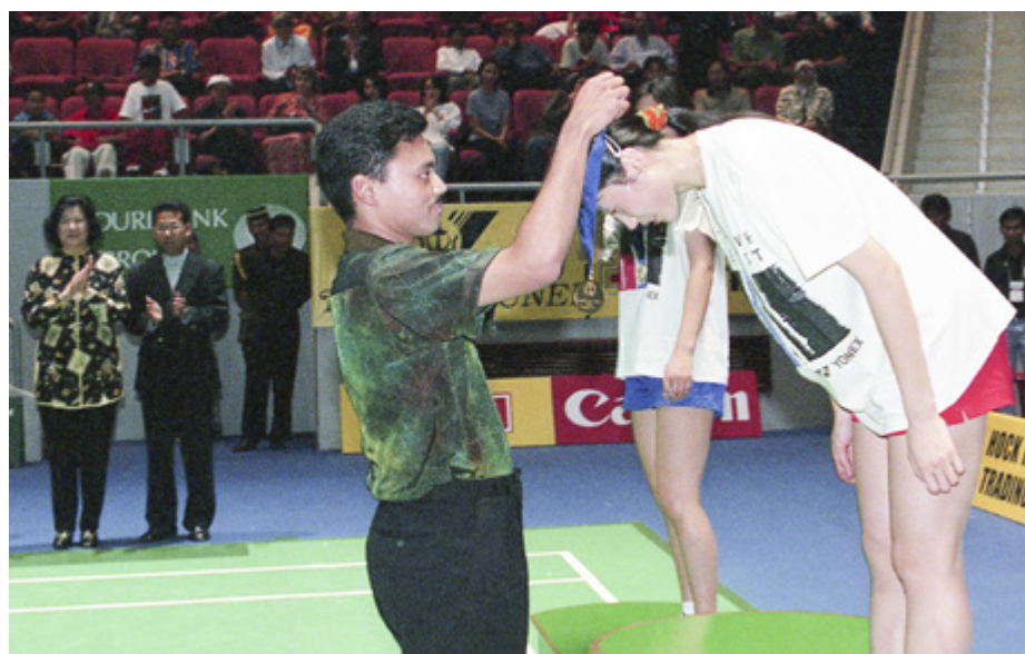
His Royal Highness Prince Haji Al-Muhtadee Billah ibni His Majesty Sultan Haji Hassanal Bolkiah Mu'izzaddin Waddaulah, the Crown Prince presenting medals to the winners of the Women's Singles Category.