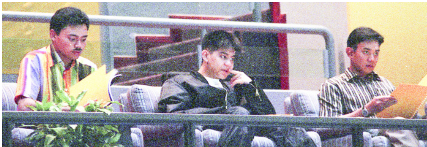
His Royal Highness Prince Haji Al-Muhtadee Billah ibni His Majesty Sultan Haji Hassanal Bolkiah Mu'izzaddin Waddaulah, the Crown Prince with His Royal Highness Prince Haji 'Azim along with other royal family members (bottom) at the badminton tournament.

This is Brunei Darussalam's first time hosting the international badminton tournament, which offers prizes worth more than US$300,000. Over 50 of the world's best players participated in the event, namely those from the Republic of Indonesia, South Korea, Malaysia and other countries.