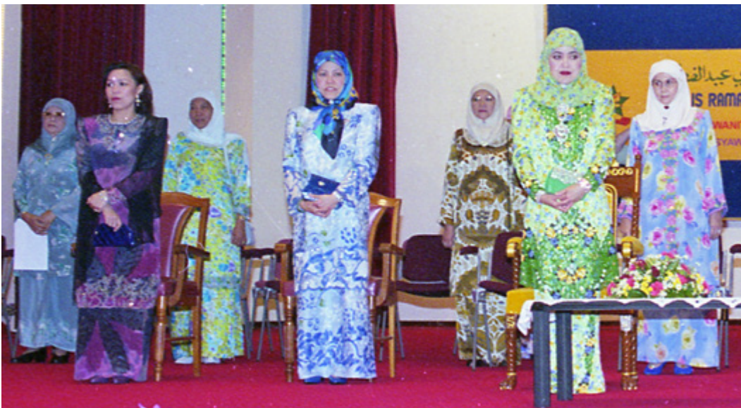
Her Majesty Duli Raja Isteri Pengiran Anak Hajah Saleha binti Al-Marhum Pengiran Pemancha Pengiran Anak Haji Mohamed Alam and other members of the royal family during the national anthem upon arrival at Women's Council Hari Raya Celebration.

BERAKAS, February 7 - Her Majesty Duli Raja Isteri Pengiran Anak Hajah Saleha binti Al-Marhum Pengiran Pemancha Pengiran Anak Haji Mohamed Alam and Her Royal Highness Penigran Isteri Hajjah Mariam binti Haji Abdul Aziz attended the Hari Raya Aidilfitri Celebration organised by the Women's Council of Brunei Darussalam.