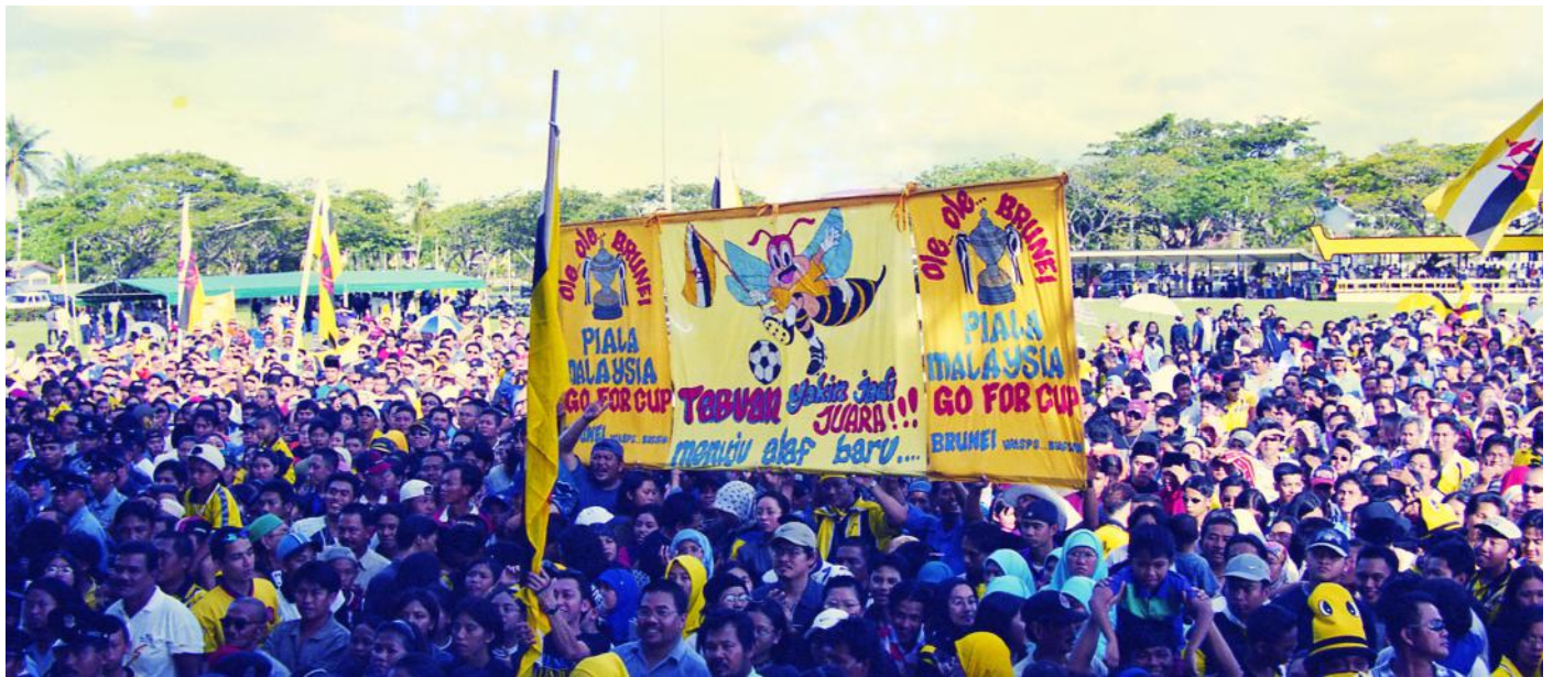
Thousands of fans and supporters gathering at the Municipal Field to celebrate the return of the national heroes who were bringing home the Malaysia Cup which had been longed for since Brunei Darussalam first participated in the Malaysia Premier League 20 years ago.