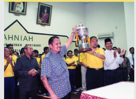
10. Celebrating the success of the Brunei Darussalam National Football Team