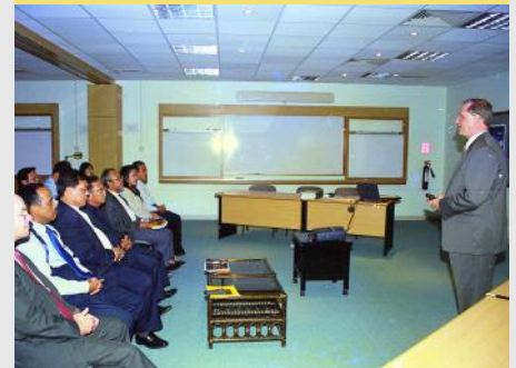
14. RBA continues to operate amidst new millennium exchange