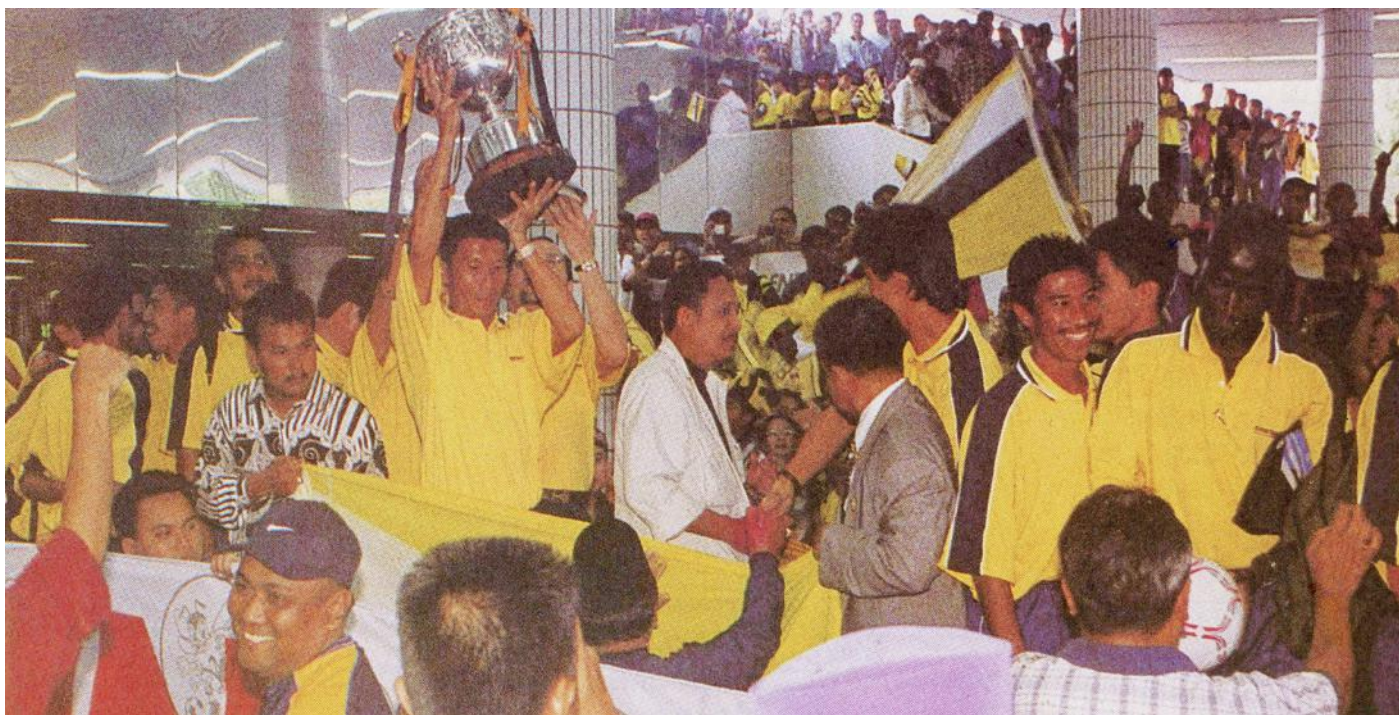
His Royal Highness Prince Haji Sufri Bolkiah ibni Al-Marhum Sultan Haji Omar 'Ali Saifuddien Sa'adul Khairi Waddien and the national team receiving support and encouragement from the people and residents of the country (above and below).