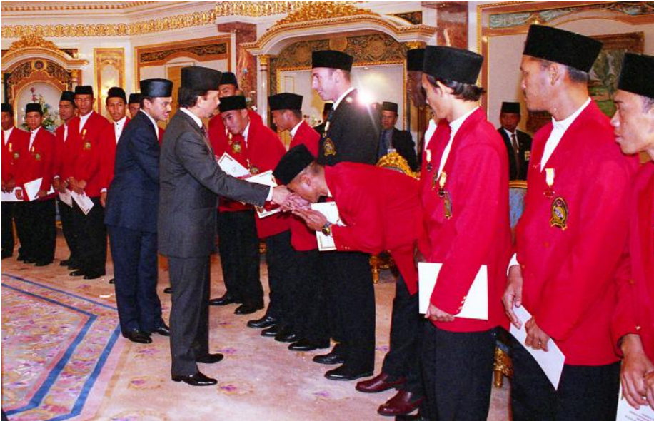
His Majesty Sultan Haji Hassanal Bolkiah Mu'izzaddin Waddaulah ibni Al-Marhum Sultan Haji Omar 'Ali Saifuddien Sa'adul Khairi Waddien, Sultan and Yang Di-Pertuan of Brunei Darussalam and His Royal Highness Prince Haji Al-Muhtadee Billah receiving junjung ziarah (meet-and-greet) greetings from the players of the national football team.