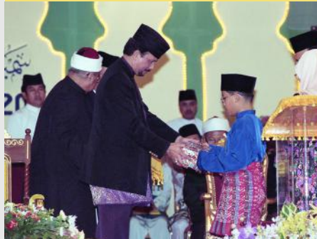
6. Continuous efforts towards Al-Quran education