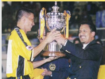
7. Brunei wins Malaysia Cup