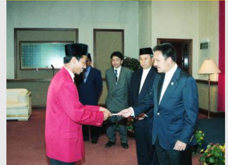
7. Rewards for national football team players