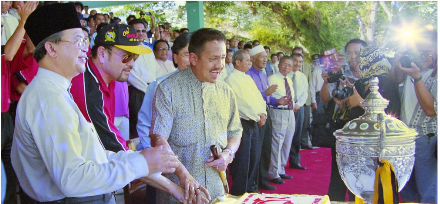
His Royal Highness cutting a cake presented by the supporters and fans of the national team in the Belait District. Also present were the Minister of Culture, Youth and Sports, the Belait District Officer as well as thousands of loyal supporters and fans who were gathered at the Municipal Field in Kuala Belait.

BANDAR SERI BEGAWAN, December 31 - success of the national team in winning the Malaysia Cup is still echoing throughout the corners of the country, with people across the Brunei-Muara, Tutong, Belait and Temburong Districts having the opportunity to see up-close and embrace the prestigious trophy.