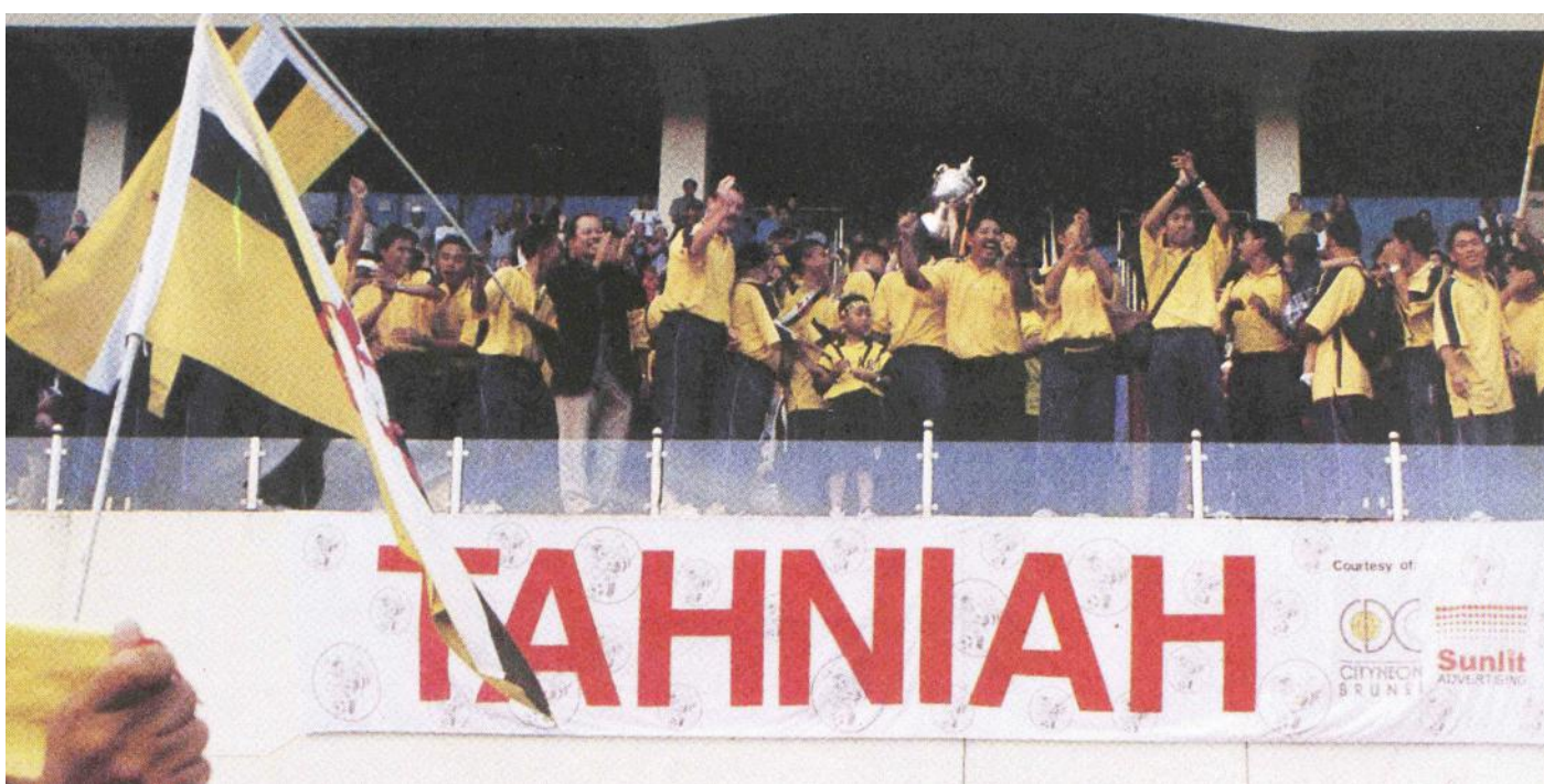
The national team receiving support and encouragement from the people and residents of the country upon their arrival at the Brunei International Airport.