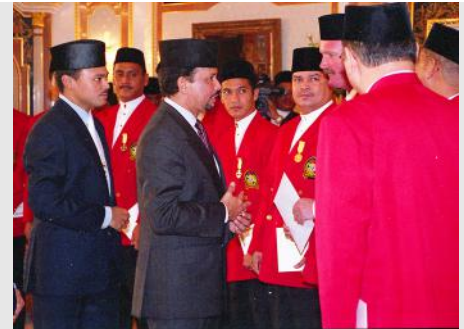
3. National Heroes receive Meritorious Service Medals