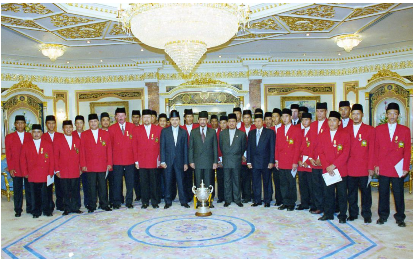
His Majesty Sultan Haji Hassanal Bolkiah Mu'izzaddin Waddaulah ibni Al-Marhum Sultan Haji Omar 'Ali Saifuddien Sa'adul Khairi Waddien, Sultan and Yang Di-Pertuan of Brunei Darussalam; His Royal Highness Prince Haji Al-Muhtadee Billah, the Crown Prince and His Royal Highness Prince Haji Sufri Bolkiah in a group photo with the Brunei Darussalam's National Football Team, winners of the 1999 Malaysia Cup.

BANDAR SERI BEGAWAN, December 13 – His Majesty Sultan Haji Hassanal Bolkiah Mu'izzaddin Waddaulah ibni Al-Marhum Sultan Haji Omar 'Ali Saifuddien Sa'adul Khairi Waddien, Sultan and Yang Di-Pertuan of Brunei Darussalam expressed his highest congratulations to the Brunei Darussalam National Football Team, especially to all players, managers and coaches for winning the 1999 Dunhill Malaysia Cup.