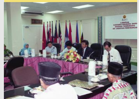
16. Providing information and solutions