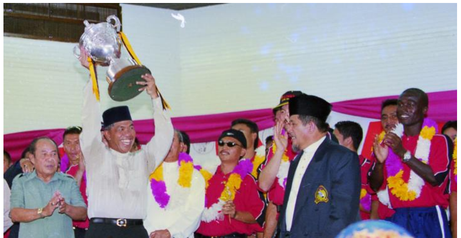
The Malaysia Cup trophy was also brought to the Temburong District and celebrated by the Tutong District Officer during a celebration held at the Community Hall, Tutong.

His Royal Highness Prince Haji Sufri Bolkiah ibni Al-Marhum Sultan Haji Omar 'Ali Saifuddin Sa'adul Khairi Waddien, Deputy Sultan consented to join the fans and loyal supporters from the Tutong, Kuala Belait and Temburong Districts to welcome the returning national heroes who have won the Malaysia Cup.