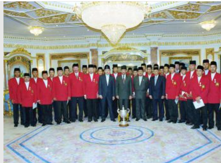
1. Intensive training, discipline and teamwork vital to success