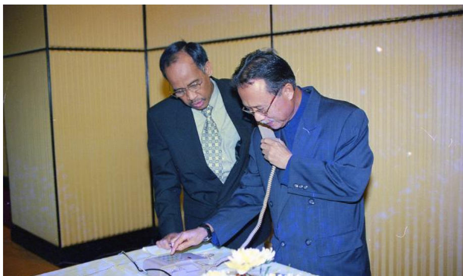
Yang Berhormat Pehin Orang Kaya Amar Pahlawan Dato Seri Setia Haji Awang Zakaria bin Haji Sulaiman, Minister of Communications during the launching ceremony of the Department of Telekom Brunei (JTB) Economic Call Service.

"The 'e-ASEAN' is a new initiative that will bring benefits,