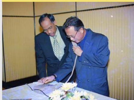
15. 'Info Communication Technology' services bring benefits to SME