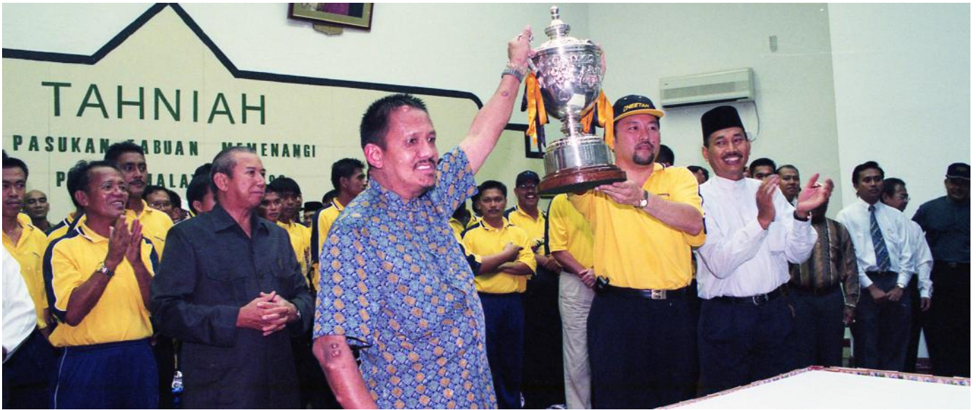
His Royal Highness Prince Haji Sufri Bolkiah ibni Al-Marhum Sultan Haji Omar 'Ali Saifuddin Sa'adul Khairi Waddien, Deputy Sultan with the winning trophy during a Thanksgiving Ceremony held at the Temburong District.