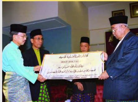
13. Kosovo Humanitarian Fund raised over $1.7 million