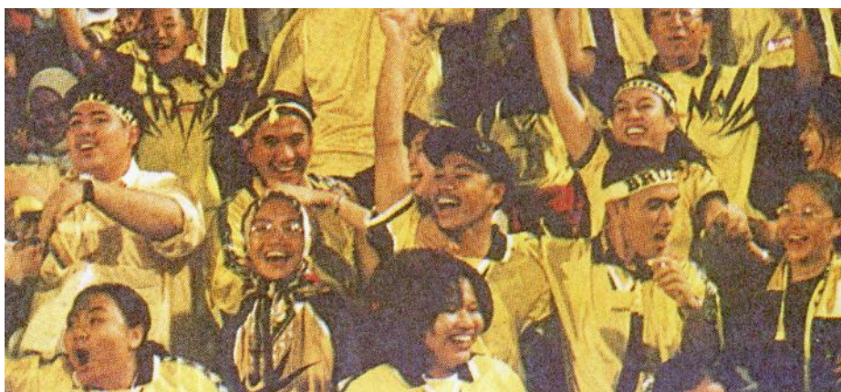
Supporters of Brunei Darussalam's National Football Team during the Malaysia Cup finale at the Stadium Merdeka Kuala Lumpur.