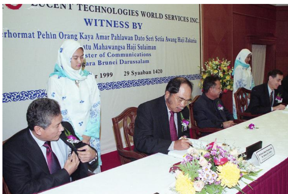
Yang Berhormat Pehin Orang Kaya Amar Pahlawan Dato Seri Setia Haji Awang Zakaria bin Haji Sulaiman, Minister of Communications witnessing the Signing Ceremony between Data Stream Technology (DST) and Lucent Technology.

BERAKAS, December 7 – With the aspiration to provide better service to its customers, Data Stream Technology (DST) has signed a contract with another company, Lucent Technology to widen DST's existing Global System for Mobile Communication (GSM) networks.