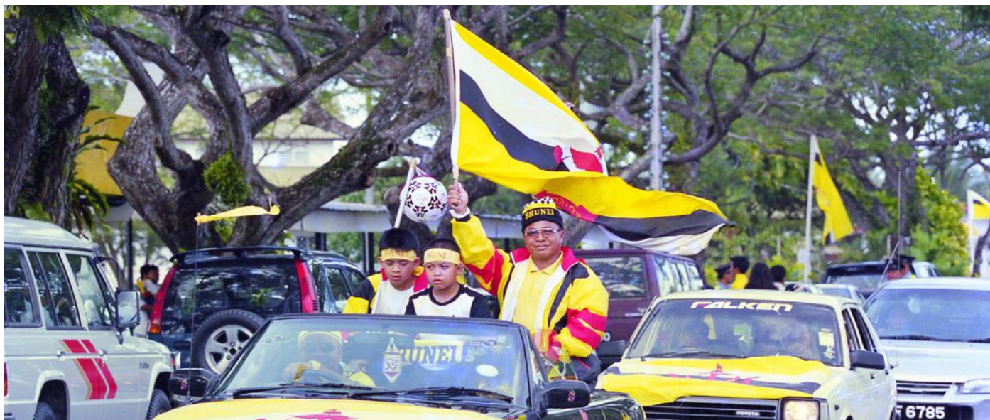
A car parade presented by the fans and supporters in celebration of the 1999 Dunhill Malaysia Cup won by the national team.