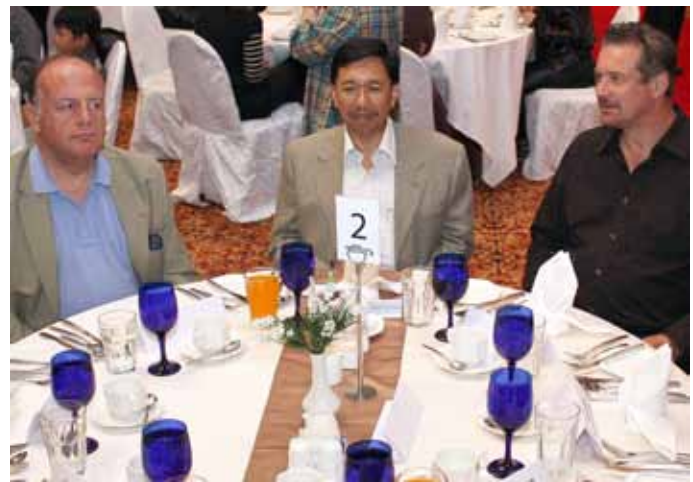
The Minister of Culture, Youth and Sports, Pehin Dato Awang Haji Hazair at the Annual Get-together Dinner of the FBBA.