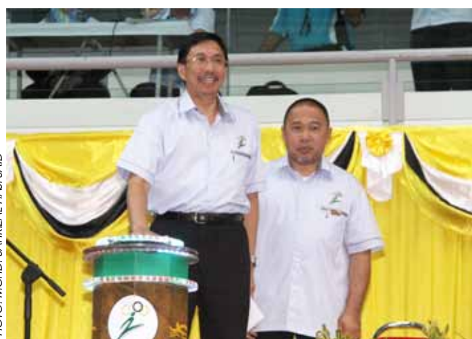
The Minister of Culture, Youth and Sports launched 5 th Youth Sport Fiesta 2011.

BERAKAS, June 11 - Sports play an important role in contributing to the development of the nation and can build a positive attitude or personality within the individual such as discipline, teamwork and competitive spirit.