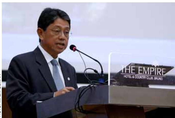
The Minister of Industry and Primary Resources officiates a seminar held in conjunction with World Oceania Day.

ensure the development of sustainable fish resources.