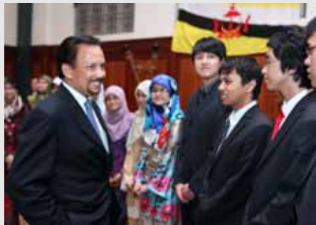
4 His Majesty on official visit to Federal Republic of Germany