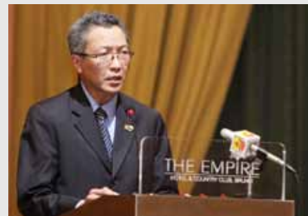
11 Microsoft Academy launch