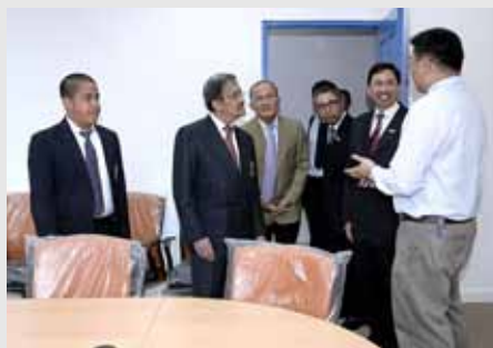
7 NFABD has its own headquarters