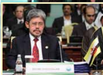
His Royal Highness Prince Mohamed Bolkiah at opening ceremony of the 38 th Session of the Organisations of Islamic Conference (OIC) Foreign Ministers' Meeting in Astana, Republic of Kazakhstan.

ASTANA, REPUBLIK KAZAKHSTAN, June 28 – His Royal Highness Prince Mohamed Bolkiah, Minister of Foreign Affairs and Trade attended the opening ceremony of the 38 th Session of the Organisation of Islamic Conference (OIC) Foreign Ministers' Meeting in Astana, Republic of Kazakhstan.