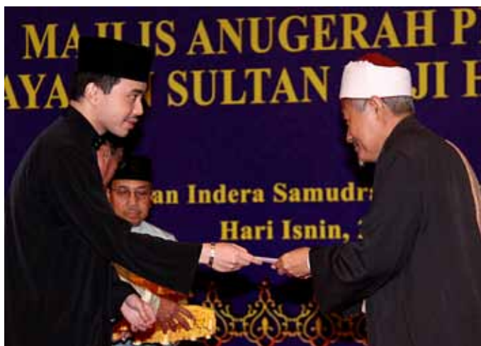
The State Mufti receives the Special Islamic Writing Award in the field of syariah.