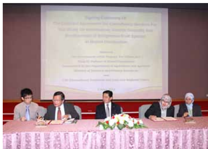
The Permanent Secretary and the Deputy Permanent Secretary at the Ministry of Industry and Resources witness the signing ceremony.

The main objective is for the publication of a scientific book on Brunei Darussalam's Indigenous Fruits. It can also increase knowledge in identifying the types of fruits besides raising awareness and appreciating the existence of local fruits as valuable heritage. This will be a five-phase project to be carried out over a period of 30 months.