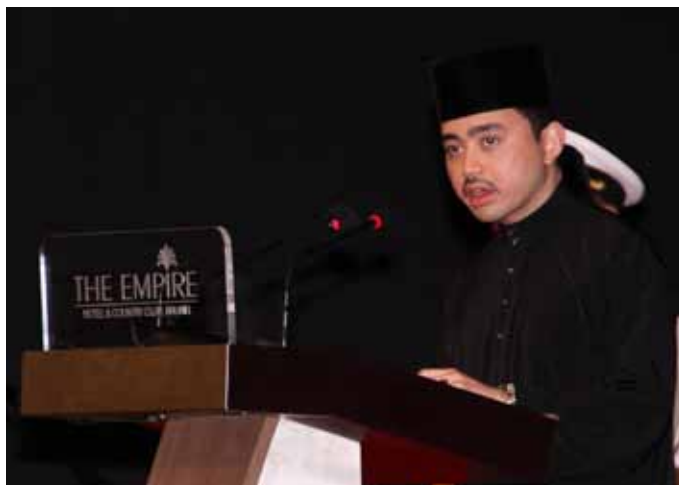
His Royal Highness in his sabda (royal speech) says the Sultan Haji Hassanal Bolkiah Foundation Islamic Writing Award is a highest recognition and honour for writers who have shown excellence in their efforts towards strengthening and expanding Islamic teachings in this country.