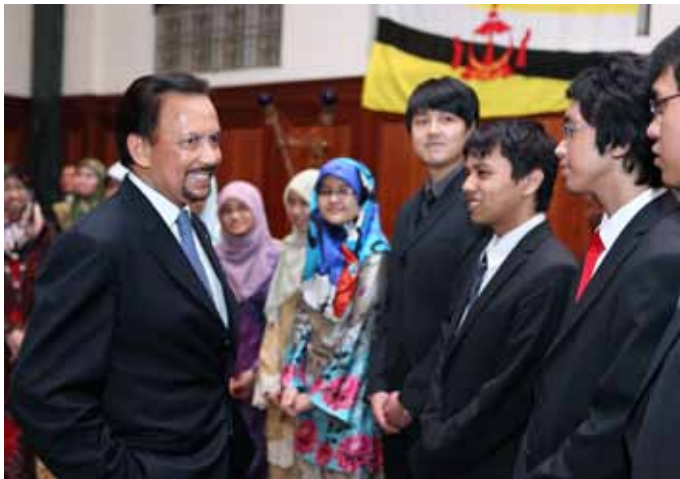
His Majesty at a get-together ceremony with Brunei citizens based in Germany comprising of students, army personnel who are attending courses and officers who are working in Germany along with their families.

His Majesty ended his official visit on June 9.