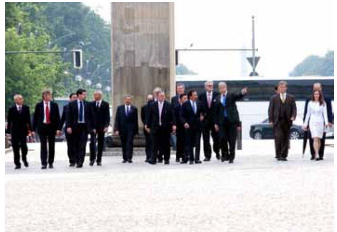
His Majesty and the Mayor of Berlin visit Brandenburg Gate, one of the historical buildings built by an architect named Carl Gotthard in 1791.