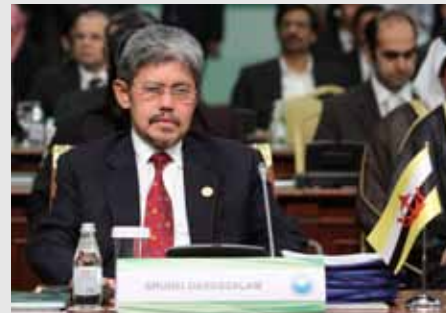
7 HRH attends the 38th Session of OIC