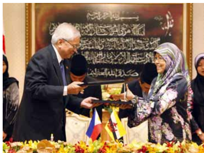
Her Royal Highness Princess Hajah Masna and her counterpart, Foreign Affairs Secretary of the Republic of Philippines sign a Memorandum of Agreement (MoA) and Memorandum of Understanding (MoU) in various fields.

The meetings were held at Istana Edinburg.