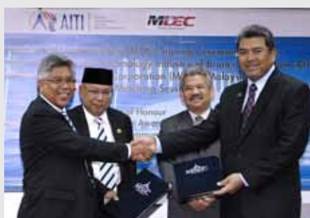
12 Signing of MoU on multimedia and animation