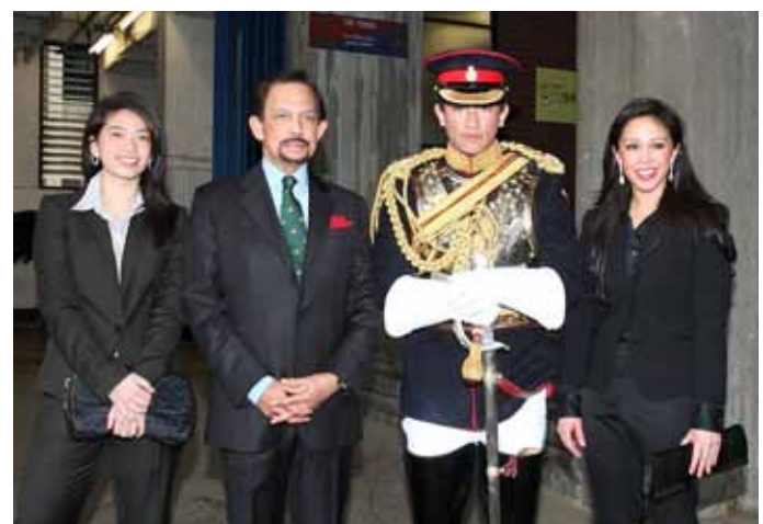
His Majesty The Sultan and Yang Di-Pertuan of Brunei Darussalam at The Household Cavalry Mounted Regiment (HCMR) based at Hyde Park Barracks in Knightsbridge.

His Majesty also presented the Sword of the Blues and Royals to His Royal Highness symbolising His Royal Highness' successful completion of the Ceremonial Horse Riding Course. The sword signifies the officer as part of the Blues and Royals of the Household Cavalry.