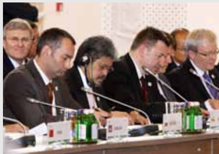
6 ASEM FFM Meeting