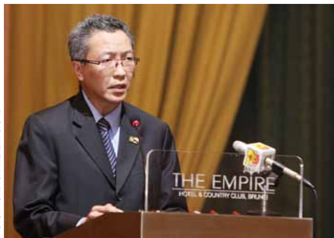
The Deputy Permanent Secretary (IT and e-Government) at Prime Minister's Office at the Microsoft Academy Programme Launching ceremony.

JERUDONG, June 2 – Information technology (IT) literate manpower are the key to the e-government vision and overall development to local Info-Communication Technology (ICT) Industry. Beside it is also a progressive steps which significant to e-Government planning.