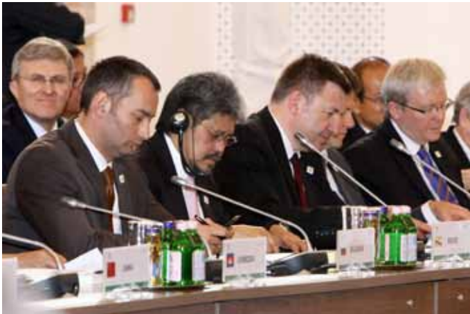
His Royal Highness at the 10 th Asia-Europe Foreign Ministers' Meeting (ASEM FFM).

BUDAPEST, HUNGARY, June 6 – His Royal Highness Prince Mohamed Bolkiah, Minister of Foreign Affairs and Trade was in Budapest, Hungary to attend the 10 th Asia-Europe Foreign Ministers' Meeting (ASEM FFM).