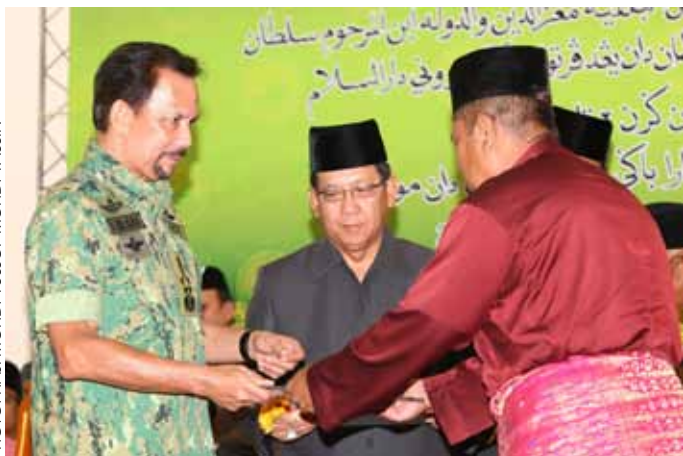
His Majesty The Sultan and Yang Di-Pertuan of Brunei Darussalam presents the land grants to one of the recipients.

BERAKAS, June 27 – The Government of His Majesty The Sultan and Yang Di-Pertuan of Brunei Darussalam continues to ensure that its people are provided with good social welfare and benefits. Thus the government for many years have awarded land titles and keys to new homes for deserving citizens as part of its effort to deliver good social welfare.