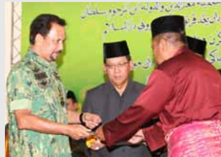
5 More land grants awarded