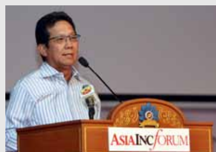
13 4th National Environment Conference focus on environment