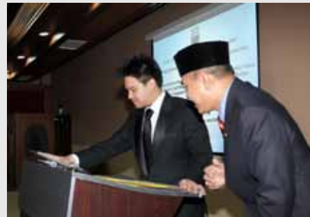
9 e-Government Innovation Centre opened