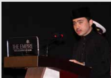
8 Sultan Haji Hassanal Bolkiah Foundation Islamic Writing Award