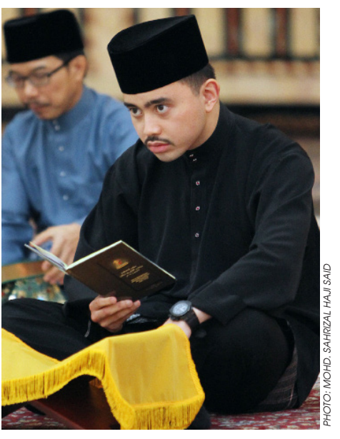
His Royal Highness at the nationwide Tadarus Al-Quran for male youths.

youths on the importance of reading and understanding Al-Qur'an as guidance of life. It was also hoped to further increase youth's involvement in religious activities in facing future challenges. The Nationwide Tadarus Al-Qur'an Youth Assembly involved youths from higher education institutions; colleges; secondary schools; youth and sports associations; uniformed organisations and youths in general.