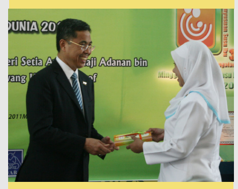
12 Encouraging progress for exclusive breast feeding