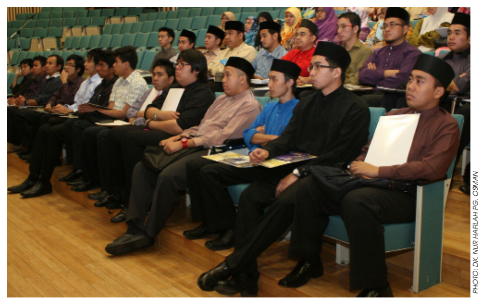
Among the recipients of the government academic scholarship attending the session (pictures above and below).

The ceremony took place the BRIDEX Conference Hall.