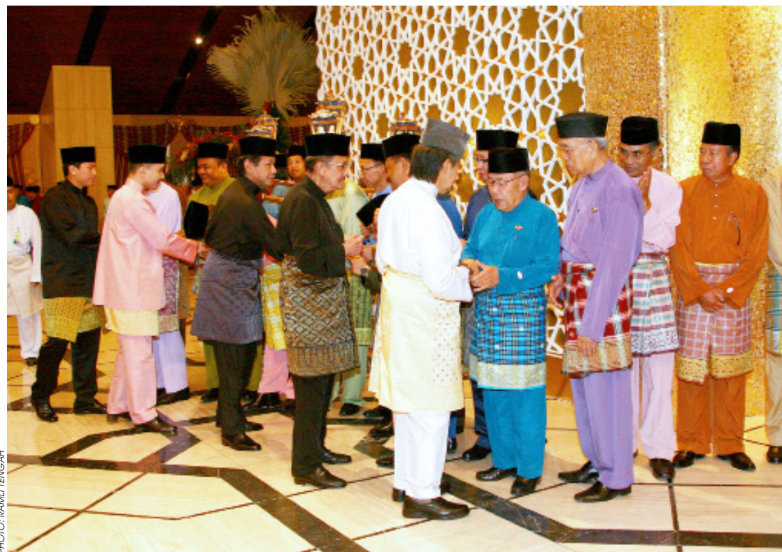
Male members of the royal family receive greetings from senior government officials.