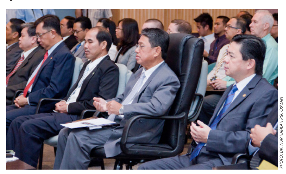
Minister of Industry and Primary Resources among the attendees during the talk.

The talk was organised by Brunei Heart of Borneo attended by the Minister of Industry and Primary Resources, Pehin Dato Awang Haji Yahya.