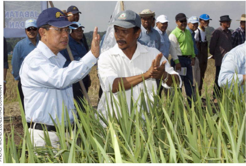
Minister of Industry and Primary Resources visiting the paddy field.

WASAN, July 30 - Hybrid paddy can be produced up to four to 14 metric tonnes per hectare compared to the inbred type paddy. According to a study by the Agriculture and Agrifood Department, several types of hybrid paddy have been identified as having potential for higher production and are suitable for planting in this country.