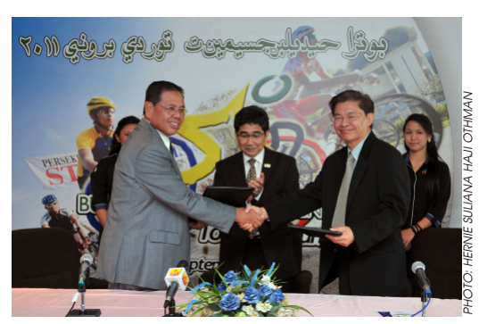
The signing of sponsorship for the BHC Tour de Brunei 2011.

This world class level tournament is organised by Brunei Darussalam Bicycle Federation in cooperation with Youth and Sports Department, Ministry of Culture, Youth and Sports.