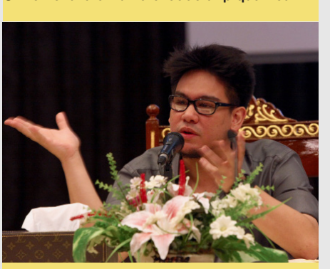
10 Youth Dialogue Session