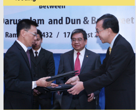
15 AMBD - D&B: Inked pact on consultancy