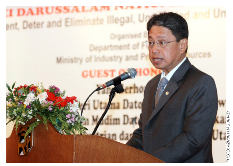
Minister of Industry and Primary Resources delivers his speech at the

The four-day seminar was attended by 90 participants from various government agencies. The seminar was conducted by an expert, Professor of Law and Director, Australian National Centre for Ocean Resource and Security (ANCORS) from University of Wollongong, Australia, Professor Dr.