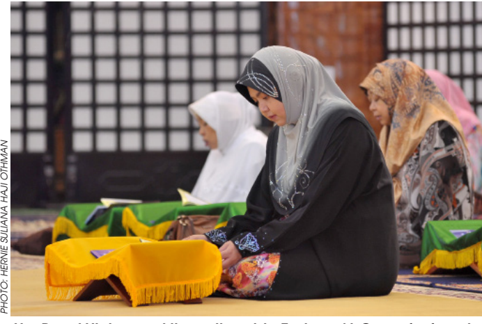
Her Royal Highness at the nationwide Tadarus Al-Quran for female