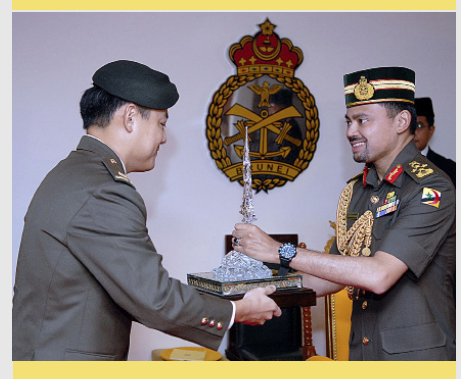
8 Demonstrate first-rate leadership qualities