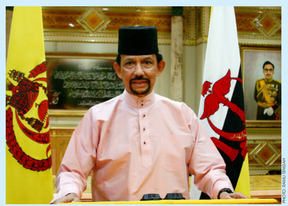
His Majesty urges Muslims to continue to achieve victories, not only during Ramadan.

In conjunction with the celebration, His Majesty The Sultan and Yang Di-Pertuan of Brunei Darussalam consented to deliver a titah (royal speech) on the eve of Hari Raya Aidilfitri on August 30, where His Majesty amongst others gave the emphasis on the importance of filling the month of