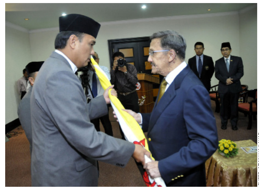
Brunei Darussalam's Chef de Mission receives the national flag from the President of Brunei Darussalam National Olympic Council (BDNOC).

Brunei Darussalam will be participating the 4th Commonwealth Youth Games in the Isle of Man in the