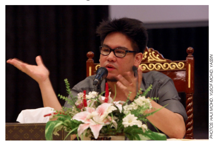
His Royal Highness delivers a sabda in respond to one of the ideas presented by a youth representative.