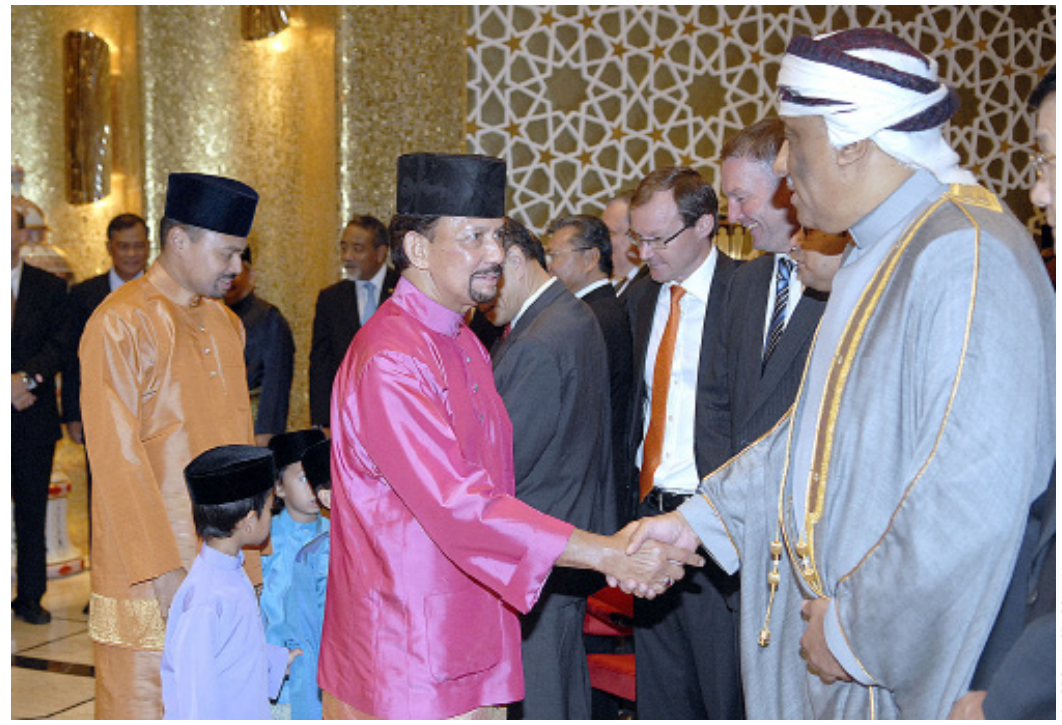
Brunei-based foreign diplomats greeting His Majesty.