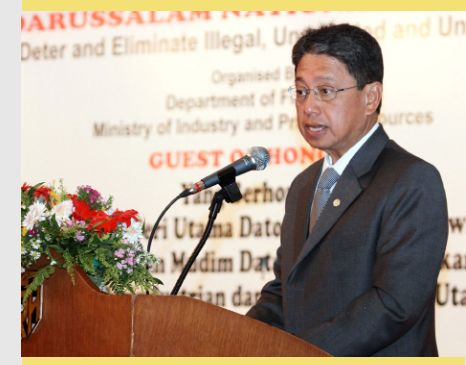
7 Seminar on IUU Fishing