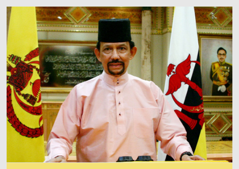
7 HM: Fullfill Syawal with virtue