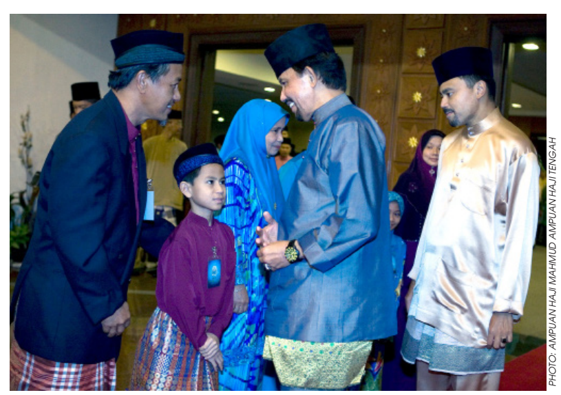
His Majesty mingles with one of the contestants.