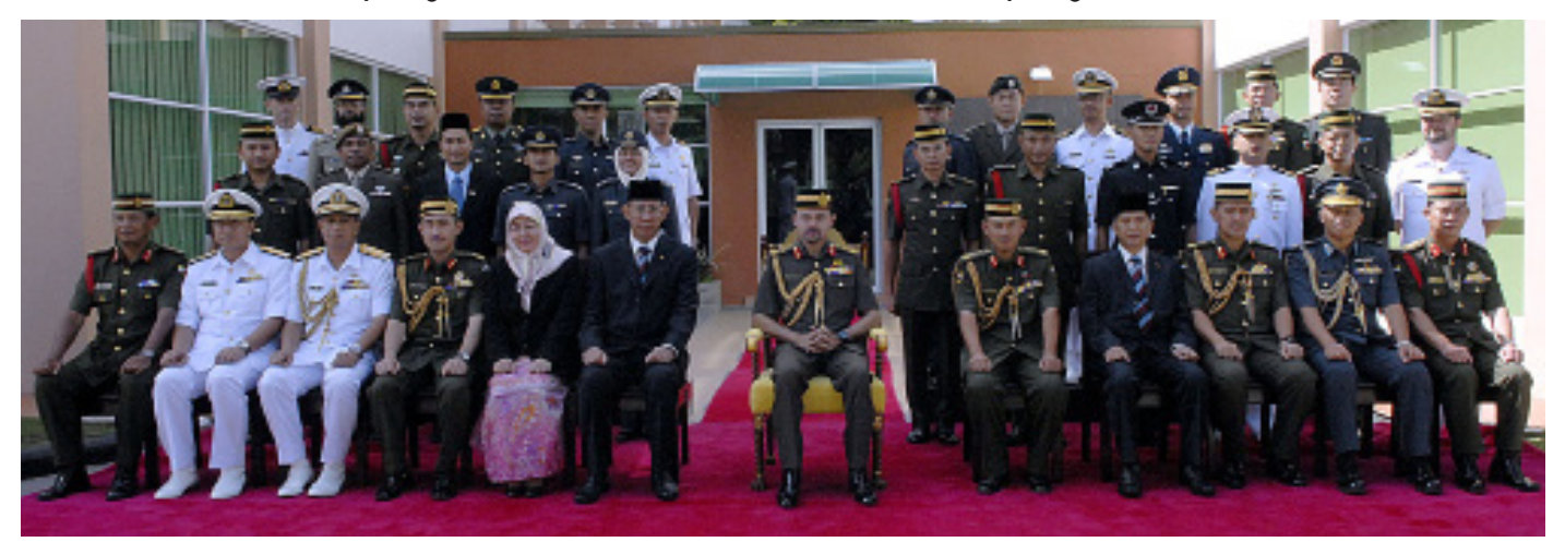
His Royal Highness Crown Prince General in a group photo with senior officers of Ministry of Defence, RBAF and participants of the course.