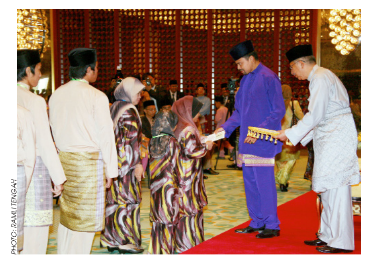
His Royal Highness during the presentation of the personnel gifts from His Majesty at Baitur Rahmah in Istana Nurul Iman.