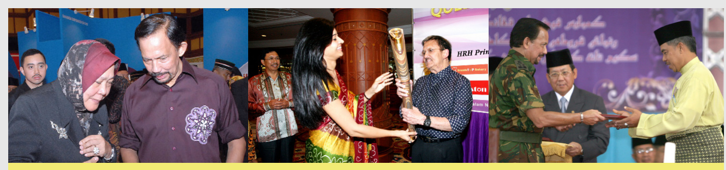
7 5th International Halal Products Expo launched