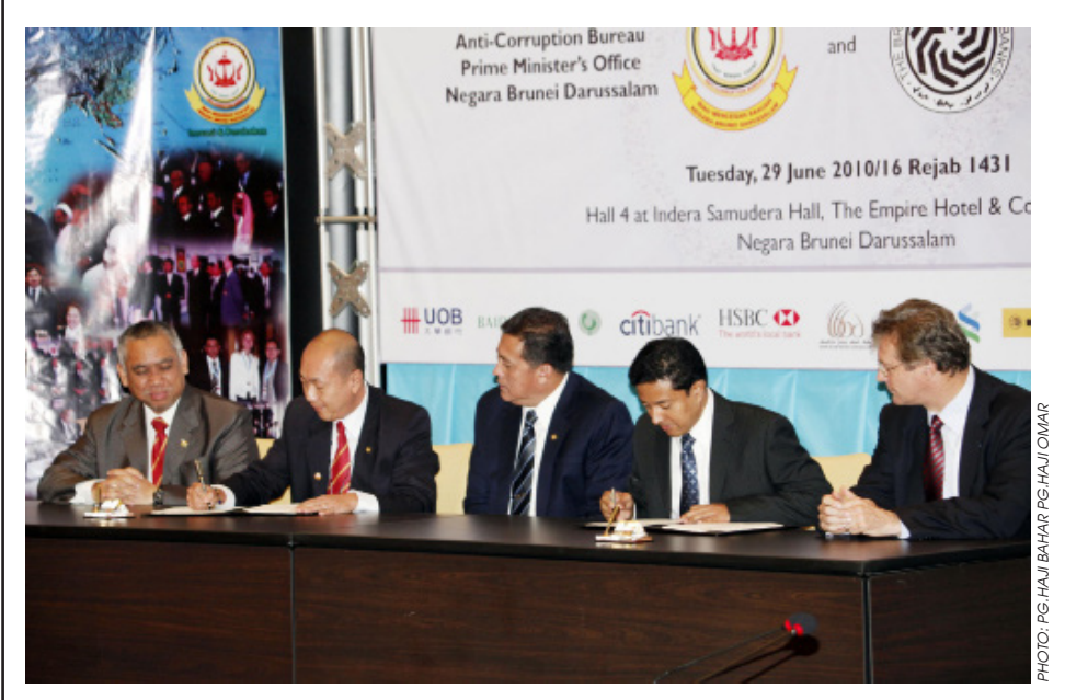
The Anti-Corruption Bureau and Brunei Banks Association sign MoU to combat corruption.

JERUDONG, June 29 - In its continuous effort to combat corruption, Anti-Corruption Bureau (ACB) together with Brunei Banks Association (BAB) have signed a Memorandum of Understanding (MoU). The signing ceremony was held at the Empire Hotel & Country Club in Jerudong.