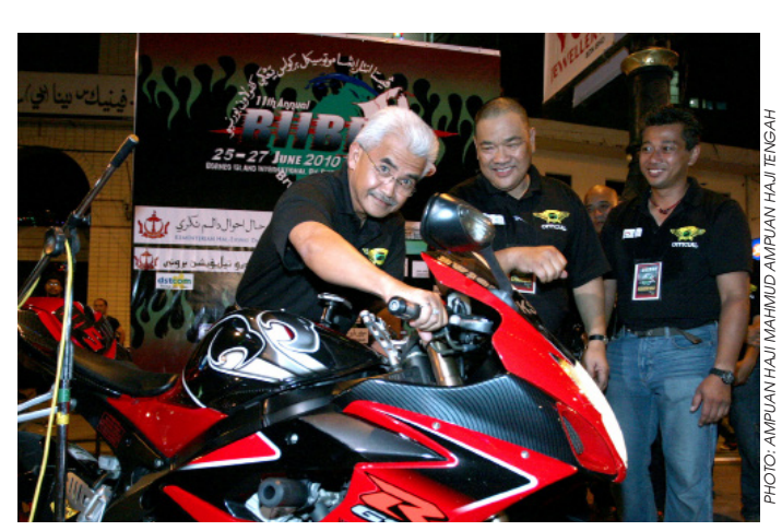
Permanent Secretary at Ministry of Culture, Youth and Sports launched the festival.

Sabah will be hosting the same festival next year.