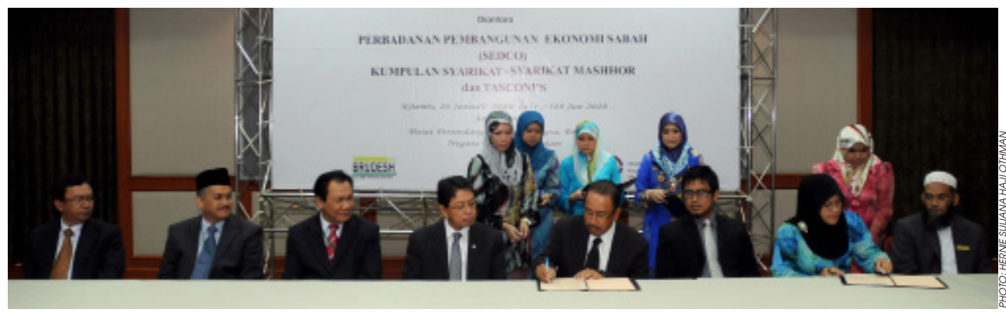
The signing of the three MoUs is witness by the Minister of Industry and Primary Resources, Pehin Dato Haji Awang Yahya.