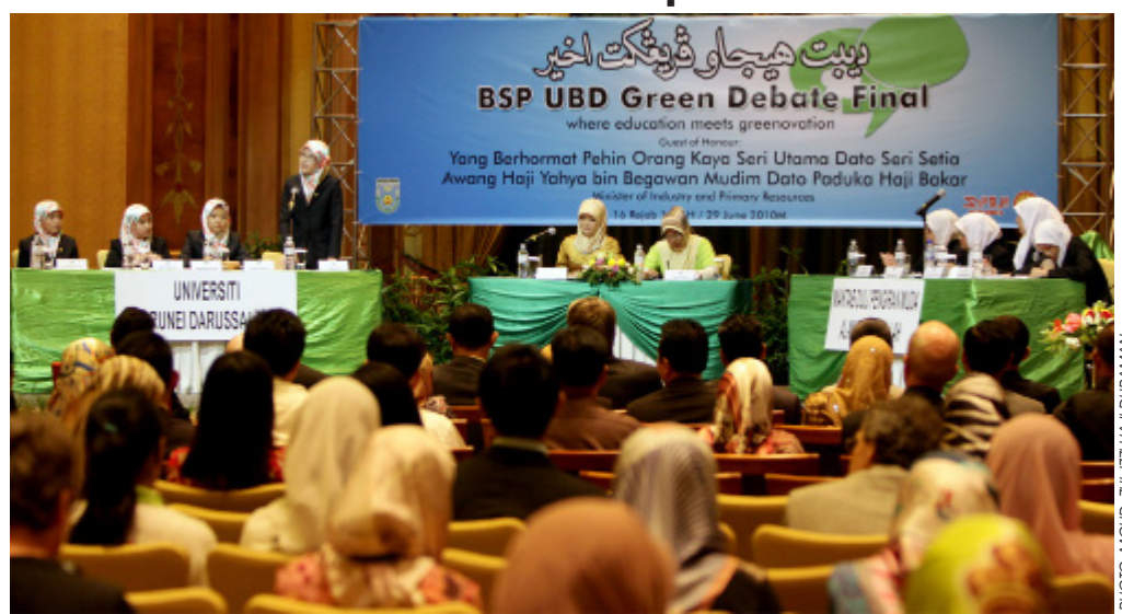
The BSP UBD Green debate final featuring UBD and MDPMAMB.

aims to nurture student's skills in critical thinking, to develop logic argument, and to express it in an attractive manner. It also aims to create student's awareness on the current dilemma faced by the environment.