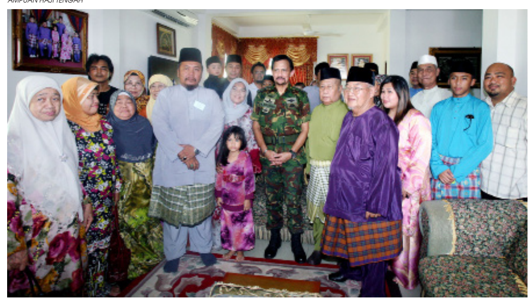
A recipient with his family in a group photo with His Majesty.

At the ceremony, 295 recipients received house under the National Housing Scheme in Kampung Rimba, Gadong consisted of 83 houses of deluxe type, 74 houses of standard type and 138 houses of terrace type.