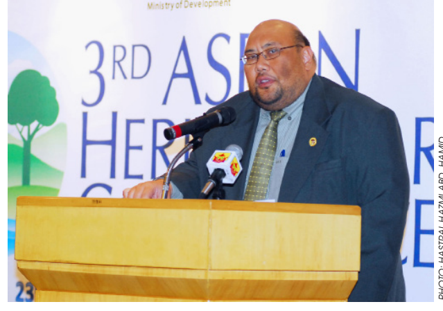
Permanent Secretary at Ministry of Development said heritage park needs to be balanced with tourist's demand towards environment and local community.