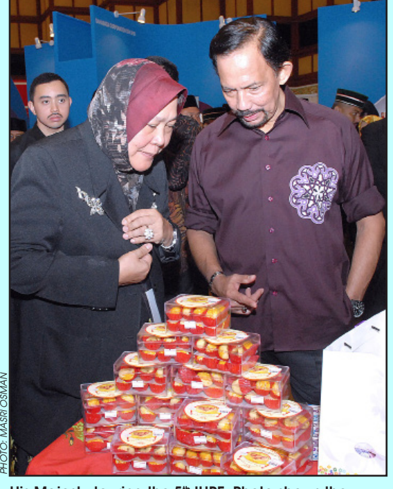
His Majesty touring the 5th IHPE. Photo shows the sovereign at one of the booths own by local entrepreneur.