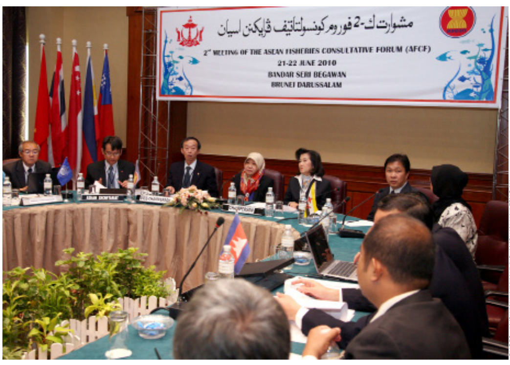
The delegations from ASEAN countries in discussion.

With the decreasing trend of fish stocks, needs for sustaining live hood of fishermen, pressure and requirements from fisheries market and trade, all ASEAN member countries need to find innovative ways of working towards