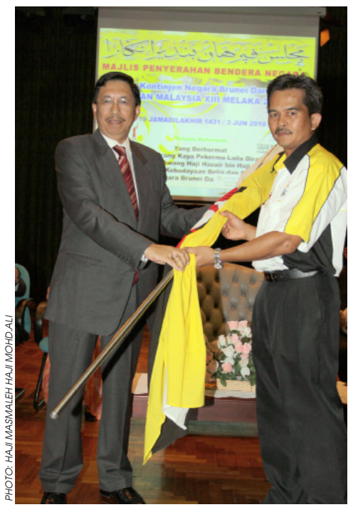
Minister of Culture, Youth and Sports presenting the national flag.

SUNGAI AKAR, June 3 - Brunei's national athletes competing at the 13th Malaysia Games (SUKMA) were reminded to demonstrate their best performance and give competition to other athletes.