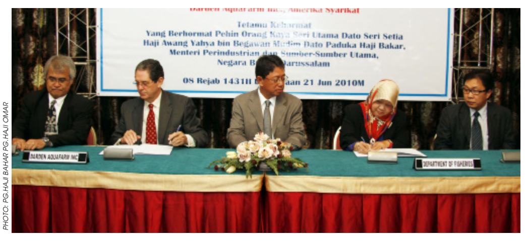
The MoU is for the joint exploration on opportunities to produce lobster commercially, witnessed by Minister of Industry and Primary Resources.

BANDAR SERI BEGAWAN, June 21 – Fisheries Department, Ministry of Industry and Primary Resources and Darden Aquafarm Incorporation (DAI) from the United States of America (USA) signed a Memorandum of Understanding (MoU) on Research and Development (R&D) Projects for Lobster in Brunei Darussalam. The signing ceremony was held at The Centrepoint Hotel in Gadong.