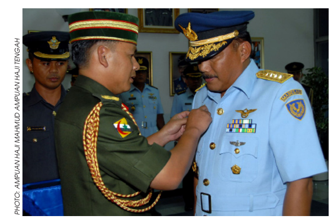
The Commander of RBAF presents the TUDB Honorary Pilot Wing to the Chief of Staff of the Indonesian Air Force.

International Halal Products Expo (IHPE) has become one of the most awaited international events by entrepreneurs in halal industry.