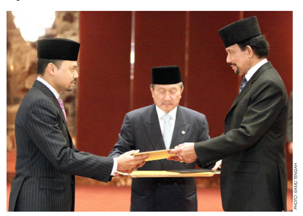
His Royal Highness Crown Prince Pengiran Muda Haji Al-Muhtadee Billah, Senior Minister at Prime Minister's Office receives his appointment letter from His Majesty.

Also present was Her Royal Highness Princess Hajah Masna, Ambassadorat-Large at Minister of Foreign Affairs and Trade.