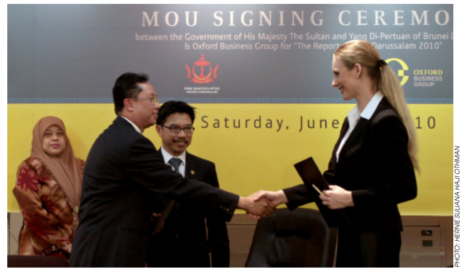
Representatives from Brunei Darussalam's Prime Minister's Office and Oxford Business at the signing of the Moll

The book was further developed and supported by publication and