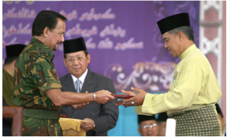
One of the recipients receives his key to new house from His Majesty.