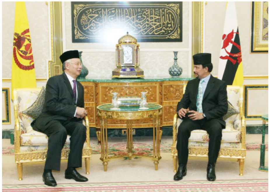
Bilateral relation is among the matters discussed during the meeting between His Majesty The Sultan and Yang Di-Pertuan of Brunei Darussalam and the Prime Minister of Malaysia.