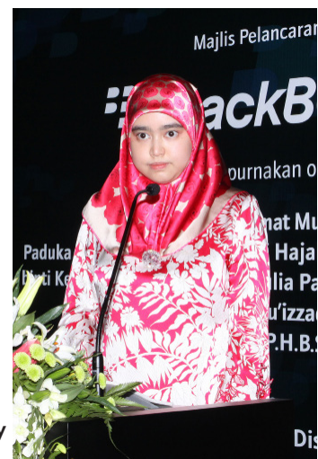
Her Royal Highness officiates Blackberry Solution.