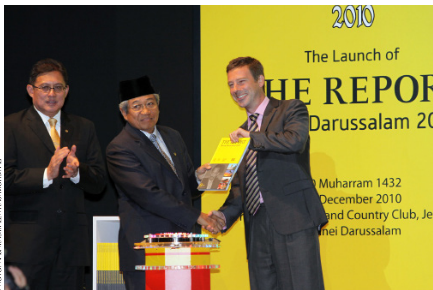
Deputy Minister of Prime Minister's Office, Dato Paduka Haji Abdul Wahab (centre) launches 'The Report: Brunei Darussalam 2010'.

the deputy minister also said that there are still issues that still need analysing such as protection, family, poverty, leadership, women in criminal activities and many more. Thus, the ministry with cooperation from the Women's Council are currently drafting 'Women Plan of Action' and 'Plan of Action Against Domestic Violence'.