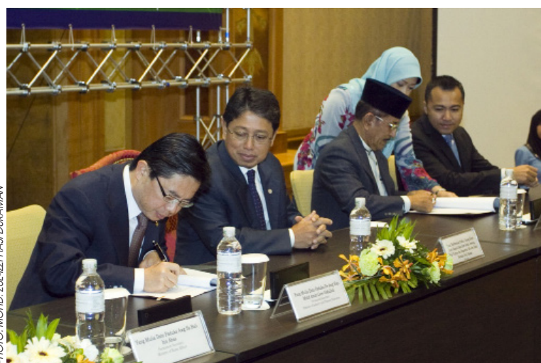
The signing of BLS is hoped to assist in saving cost and increase productivity and efficiency.

The process of implementing BLS will involve at least thirteen government agencies that grant business licenses and/or permits.