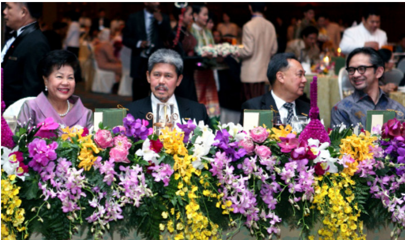
Heads of delegations to AMED III including His Royal Highness attending an official dinner hosted by Minister of Foreign Affairs of Thailand.

BANGKOK, THAILAND, December 16 – Minister of Foreign Affairs and Trade, His Royal Highness Prince Mohamed Bolkiah attended an official dinner hosted by Minister of Foreign Affairs and Trade of Thailand, His Excellency Kasit Piromya, on the occasion of the 3 rd Asia-Middle East Dialogue (AMED III) Ministerial Meeting. The dinner was held at the Royal Thai Navy Convention Hall in Bangkok.