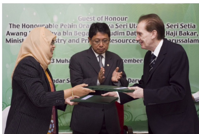
Minister of Industry and Primary Resources witnesses the signing of collaboration agreement.

It will also include research on Islam majority and minority market, opportunities and challenges, branding of food and also global market and the impact of different cultures in relations to halal market.