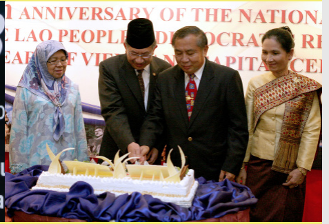
10 Ministers attend receptions