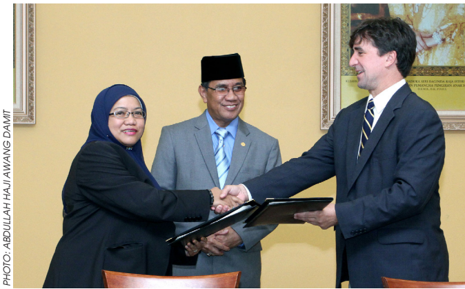
Acting Minister of Education witnessing the Signing of MoU between UBD-University of Harvard.