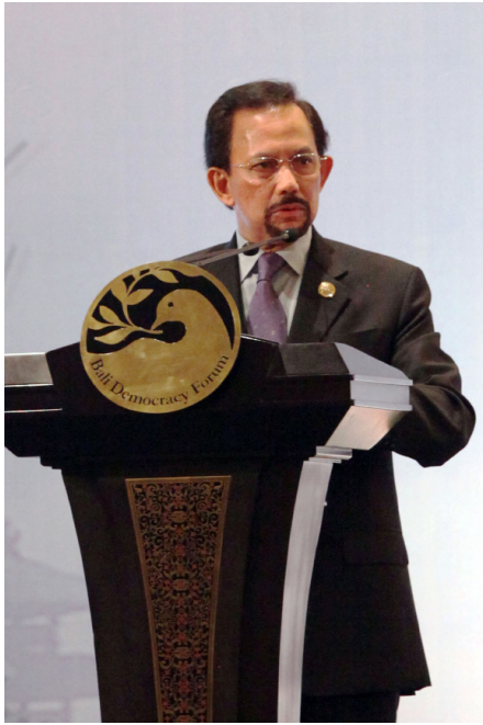
Peace and stability are a cherished value in Brunei Darussalam, said His Majesty at the 3 rd Bali Democracy Forum.

* From frontpage (3 rd Bali Democracy Forum)