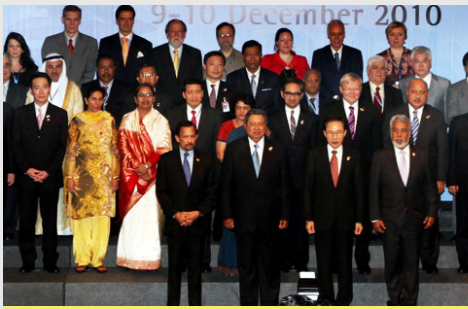
7 3 rd Bali Democracy Forum