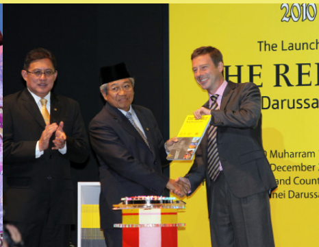
14 Detail report in 'The Report: Brunei Darussalam 2010'