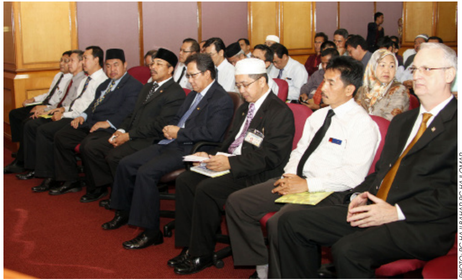
Minister of Development (4 th from right) receives a briefing on LiDaR.

This project has also carried out aerial survey of highly precision digital colour aerial photos depicting numerous details from the forested and urban area with trees and trails