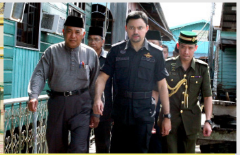
6 Deputy Sultan visits areas affected due to strong wind