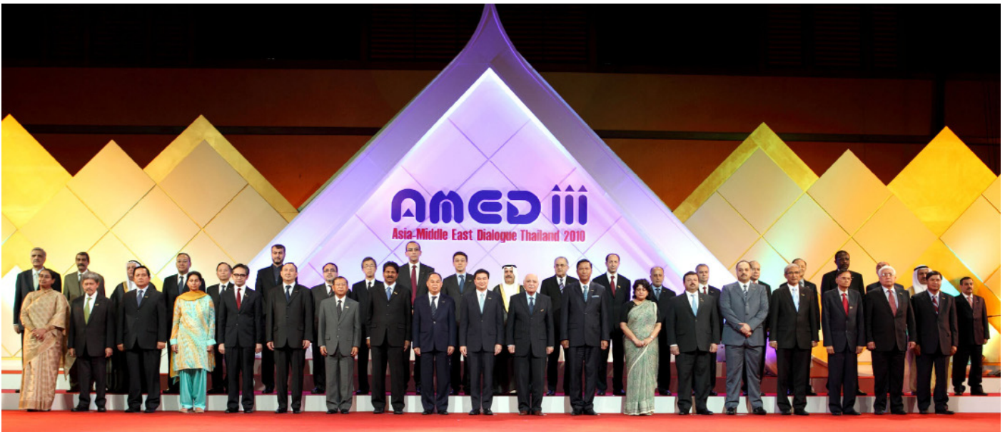
His Royal Highness in a group photo with heads of delegations attending AMED III during the official opening ceremony.

AMED III Asia-Middle East Dialogue Thailand 2010