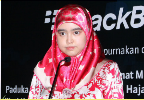
9 HRH launches Blackberry Solution