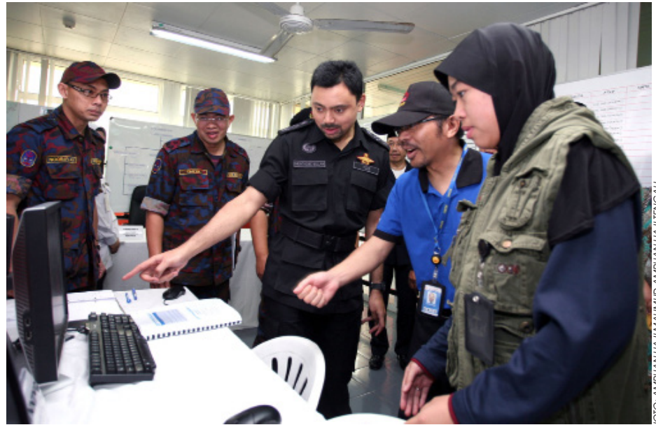
His Royal Highness is briefed on surveillance tasks carried out at the Incident Command Post (ICP).

Strong wind occurred on December 18 which resulted damages to 67 houses involving 10 mukim and 22 villages in the Brunei-Muara District.