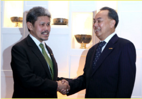
8 HRH attends 3 rd AMED Ministerial Meeting