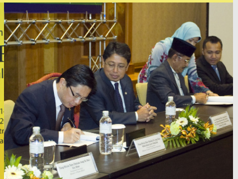
17 BLS save cost, increase productivity and efficiency