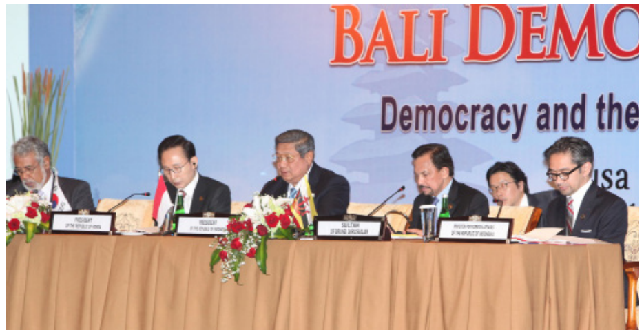
His Majesty at one of the sessions.

The forum was co-chaired by the President of Indonesia; and the President of the Republic of Korea, His Excellency Lee Myung-Bak. The forum was attended by 71 countries.