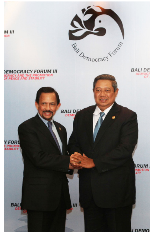
The President of Indonesia greets His Majesty upon arrival at Westin Resort Nusa Dua.

Both leaders were in Bali to attend the 3 rd Bali Democracy Forum held from December 9 to 10.