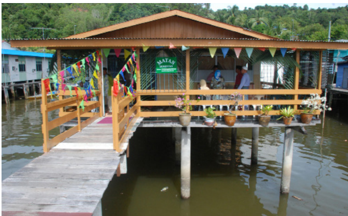
Matan Homestay offers fishermen style village and great traditional delicacies.

Since 2006, Kampung Sungai Matan had held several tourism projects such as the annual Matan Carnival and Fishing Challenge.