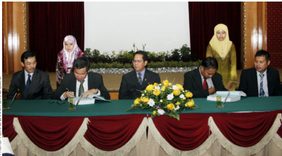
The signing ceremony witnessed by Minister of Development (centre).

BERAKAS, December 22 – Better road infrastructures are in the pipeline with the commissioning of the Seria Bypass Second Lane that will connect all three districts – Brunei-Muara, Tutong and Belait Districts.