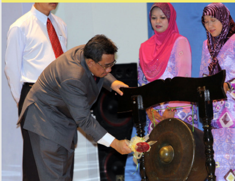
11 2 nd Brunei Darussalam - Singapore Adventure Camp