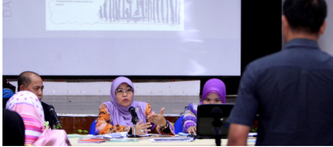
Acting Director of Language and Literature Bureau gives a briefing on Brunei Book Festival 2011.

The book fair will take place at the International Convention Centre in Berakas.