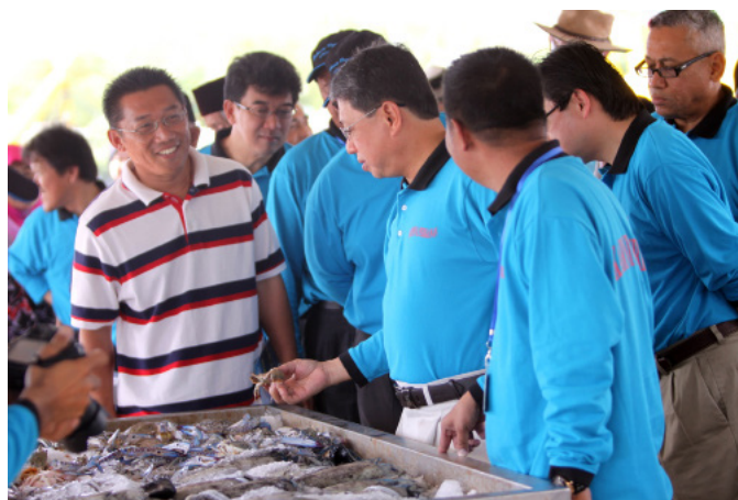
The minister visiting the participating stalls.