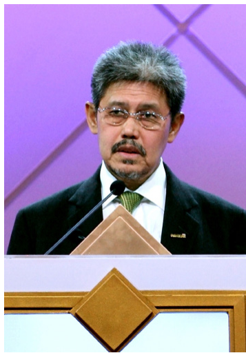
His Royal Highness highlights the importance of AMED in his speech.

His Royal Highness, in his statement, highlighted the relevance of AMED as a dialogue that plays an important role in helping all members to understand better each other's ways of dealing with current challenges.