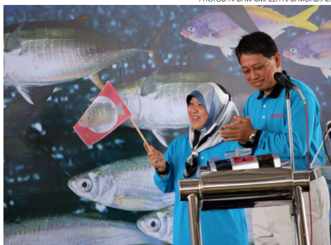
Minister of Industry and Primary Resources launches Fish Carnival 2010.