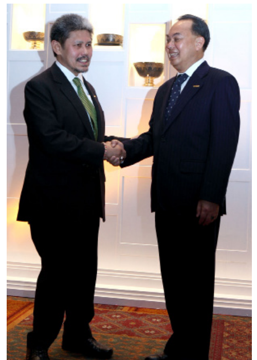
On arrival at the opening ceremony of AMED III, His Royal Highness is welcomed by Minister of Foreign Affairs of Thailand, His Excellency Kasit Piromya.

His Royal Highness also signed a well-wishing book on the occasion of the 83 rd birthday anniversary of His Majesty King Bhumibol Adulyadej on December 5, 2010. The signing was held at the Queen Sirikit National Convention Centre.