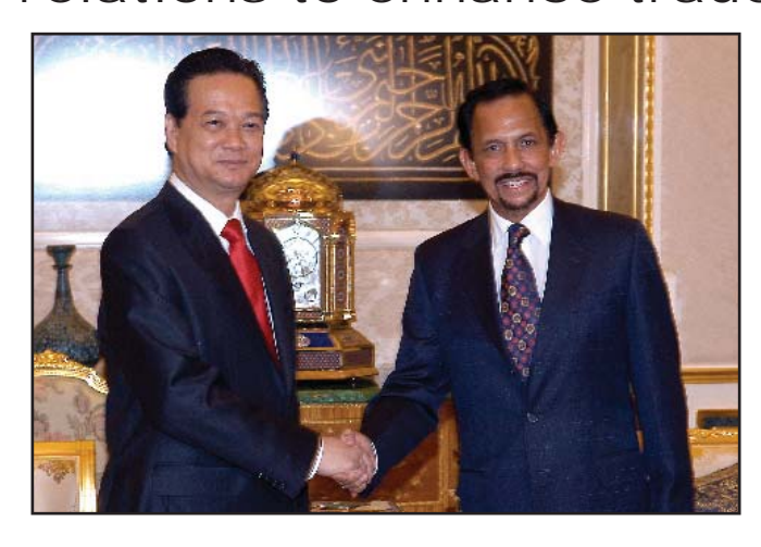
Brunei Darussalam and Vietnam share a warm bilateral relation.

"This year, we celebrate with great joy the 15th anniversary of our diplomatic relations establishment. During the last 15 years of cooperation, with a strong determination of the two countries' top