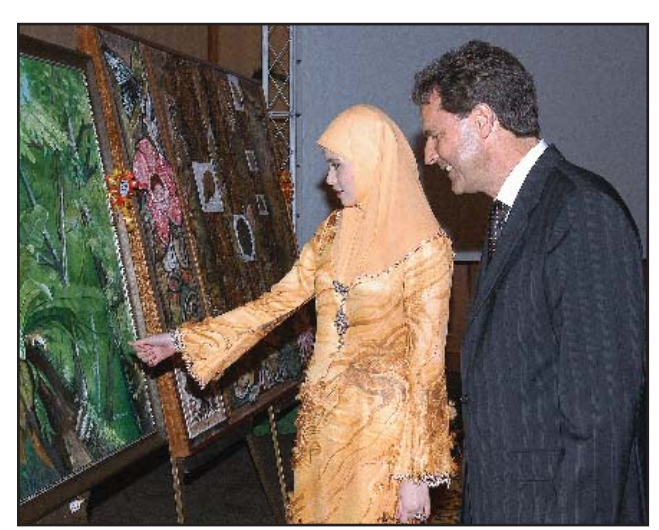
Her Royal Highness looking at the painting exhibited.

JERUDONG, September 10 – The winners of the painting and photography competition were announced with each receiving their respective prizes.