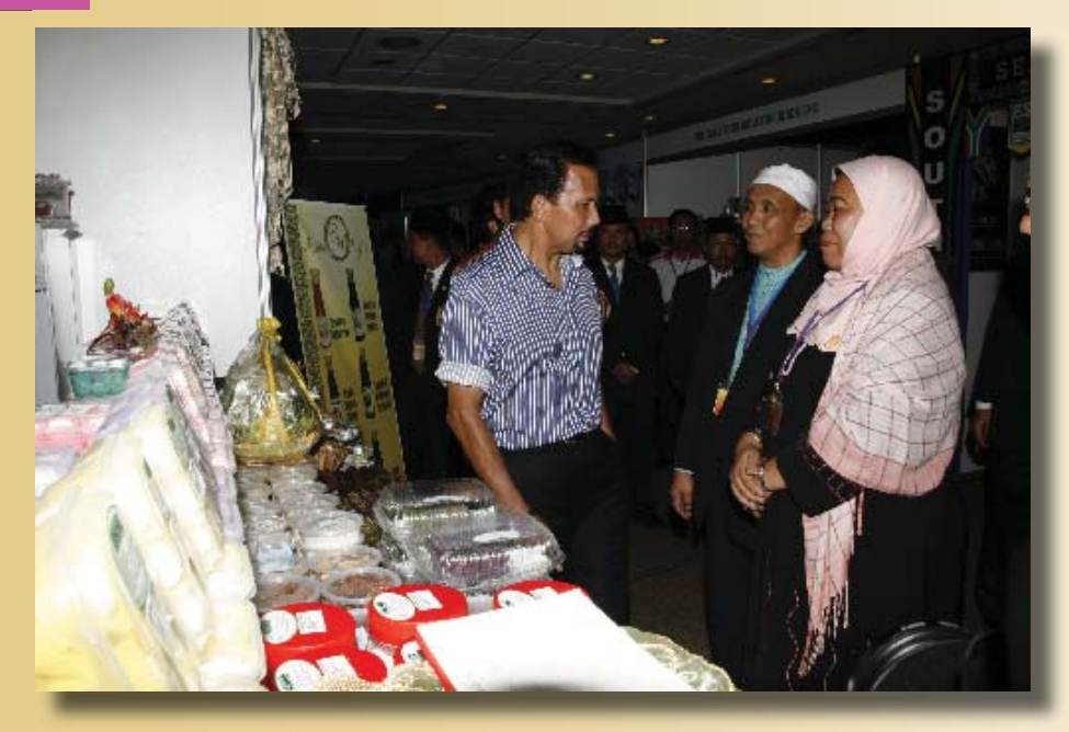
The halal food sector is estimated to be worth US$150 billion annually and Brunei Darussalam is determine to become a key player of this industry with the launching of the 'Brunei Halal Brand'.