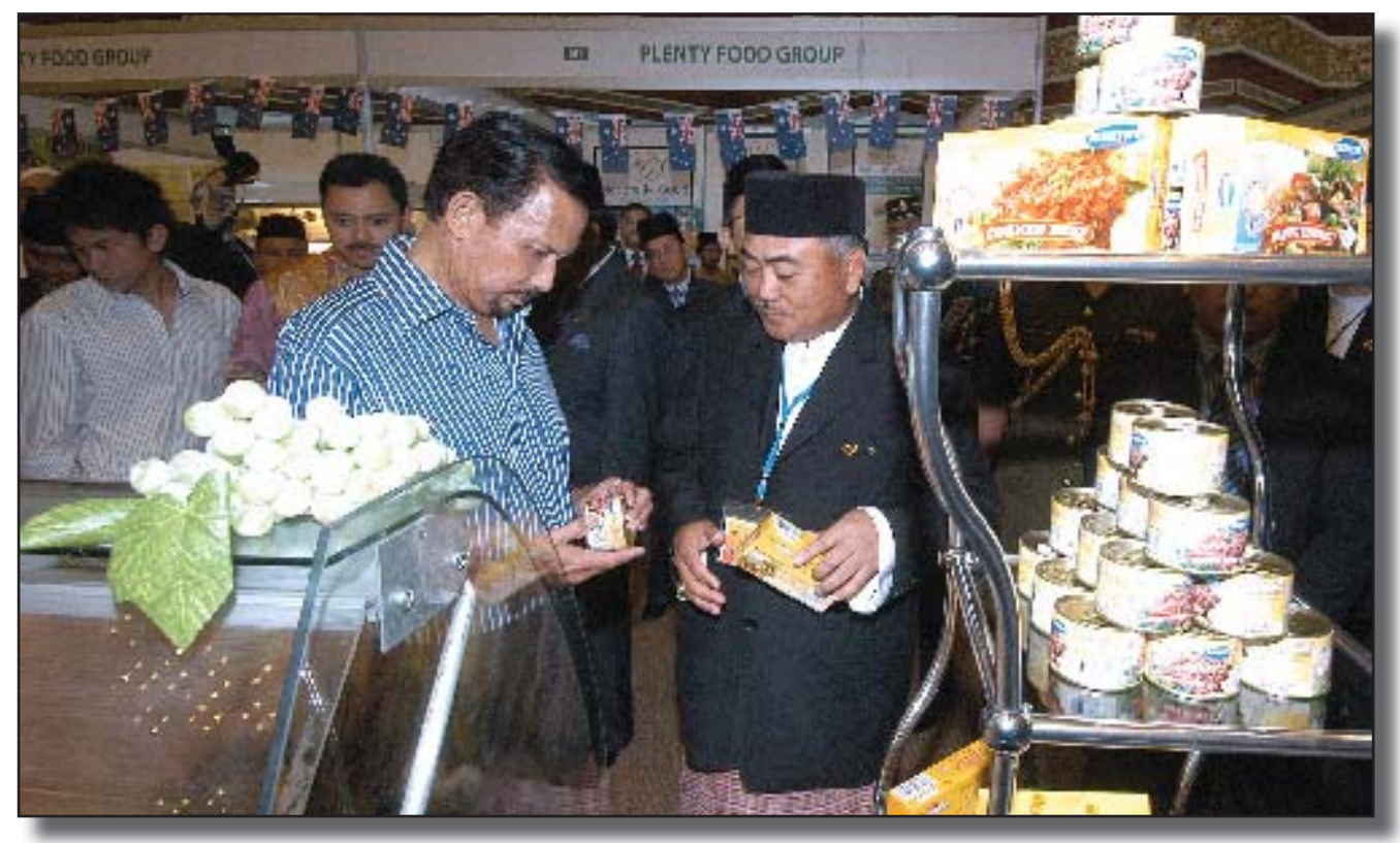
His Majesty looks on products displayed at the 2^{\rm nd} International Halal Product Expo 2007 (above and below).