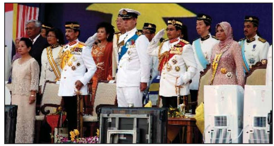
His Majesty and other state dignitaries at Malaysia's 50th anniversary independence day celebration in Kuala Lumpur.

His Majesty also joined the Friday Prayer at the Jamek Alam Shah Mosque at Kampong Pandan.