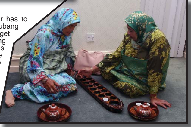
Ladies playing congkak at one of the berjaga-jaga

If the last seed falls into player's own store, the player immediately earn another turn, which can begin at any of the seven holes under her/his control.