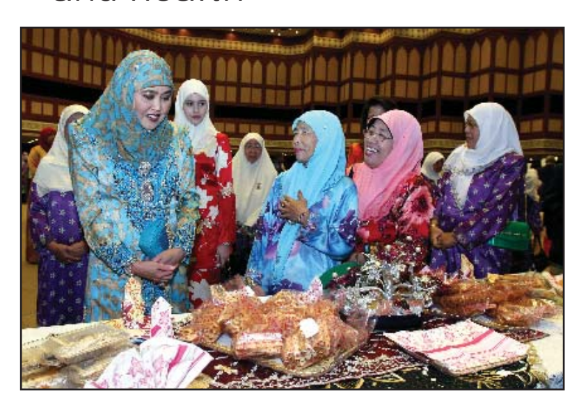
Her Majesty at one of the exhibitions which displays local products.