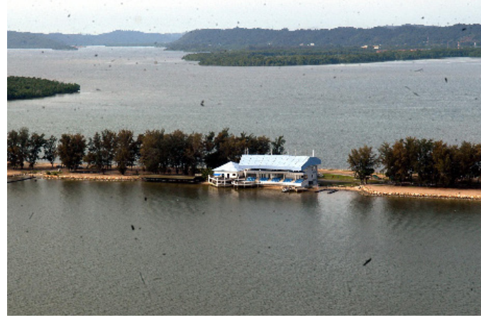
Sports complex built to accomodate water sports