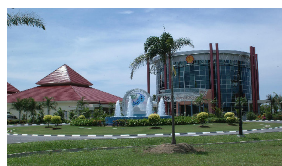
Oil & Gas Discovery Centre in Seria.