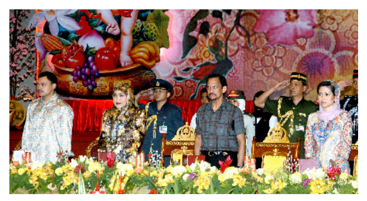
Their Majesties and Her Royal Highness upon arrival at the International Convention Centre at the get-together ceremony celebrationg Chinese New Year.

The ceremony was highlighted by the thrilling lion dance from Chung Hwa Middle School and PDS International School students. The Tiong Hua community also showcased traditional Chinese and Malay dances.