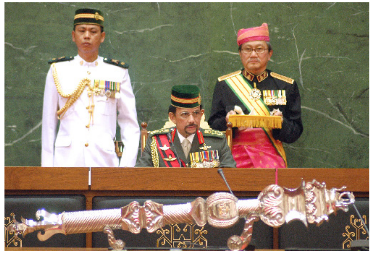
His majesty delivers a titah during the official opening of the First Meeting for the Third Session of the State Legislative Council.

The first session of the State Legislative Council; was held on September 25, 2004 while on September 2, 1005; His Majesty announced the appointment of the new members of the council which included five representatives from four districts. Then on March 15, 2006; First Meeting for the Second Session was opened with the main agenda of state budget allocation.