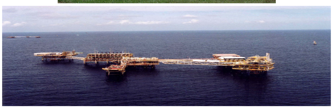
Offshore oil platform in Seria.