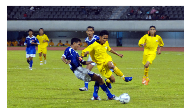
High spirit shown by the teams.