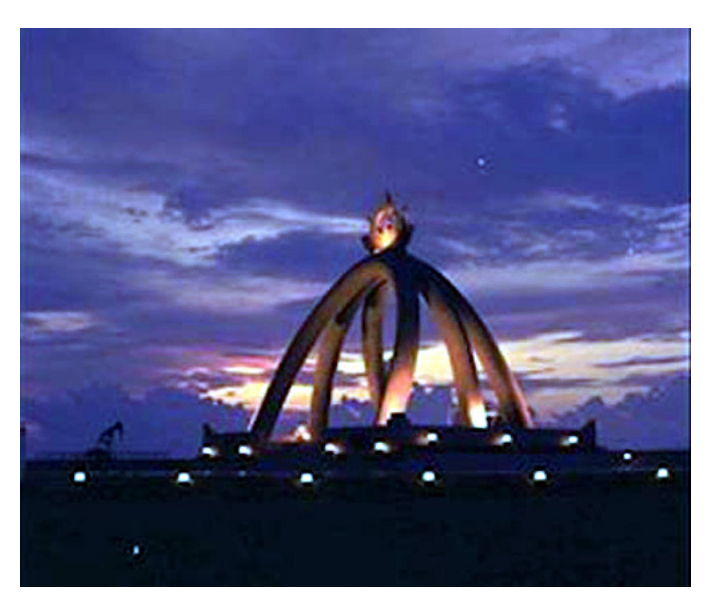
Billionth Barrel Monument