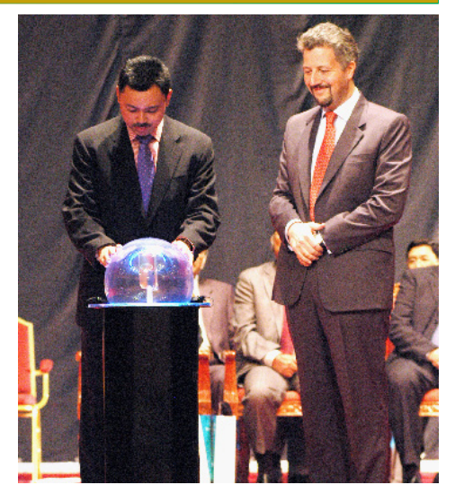
His Royal Highness officiates the Brunei Microsoft Office and the launching of Windows Vista and Microsoft Office 2007.

The company develops, manufactures and licences a wide range of software, including operating systems for personal computers, mobile phones, and intelligent devices. Also included are server applications for distributed environments and productivity applications for information workers.