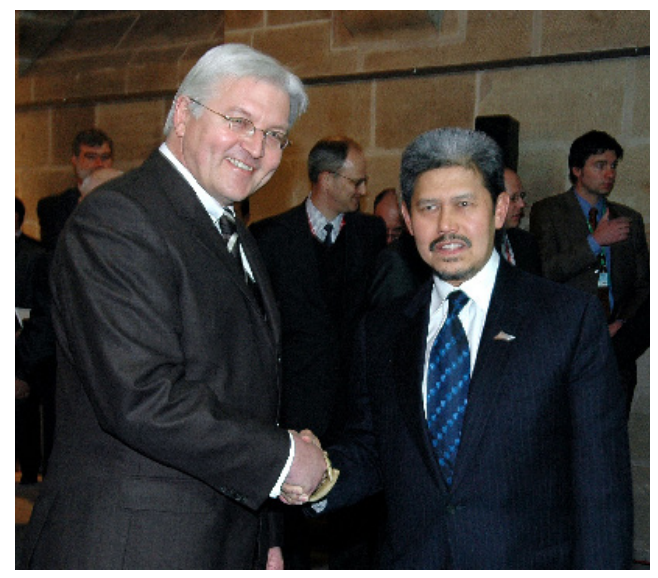
His Royal Highness Prince Mohammed Bolkiah with the Minister of Foreign Affairs of the Republic of German Federation at the reception in conjunction with the 16<sup>th</sup> AEMM Meeting.

The Ministers received briefings on recent developments, assessed current cooperation and exchanged views about the future which His Royal Highness highlighted the 'Heart of Borneo' programme as an excellent example of modern multilateral cooperation in complex environmental matters.