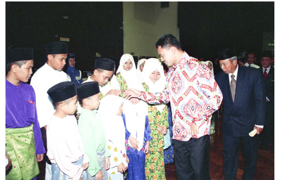
His Royal Highness Prince Haji Al-Muhtadee Billah ibni His Majesty Sultan Haji Hassanal Bolkiah Mu'izzaddin Waddaulah, the Crown Prince during the meet and greet with donation recipients