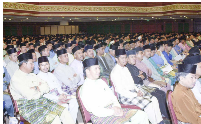
Among the attendees at the event.