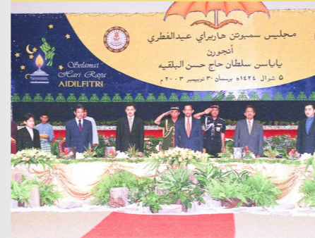
7 YSHHB's Hari Raya Aidilfitri Celebration: Don't be complacent facing global challenges