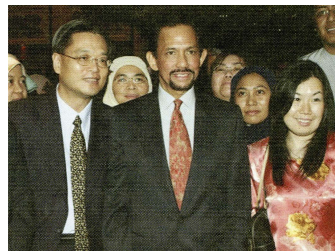
His Majesty in a group photo with the senior professionals.

This is the first time YSHHB initiated an idea to celebrate Hari Raya Aidilfitri with young professionals.