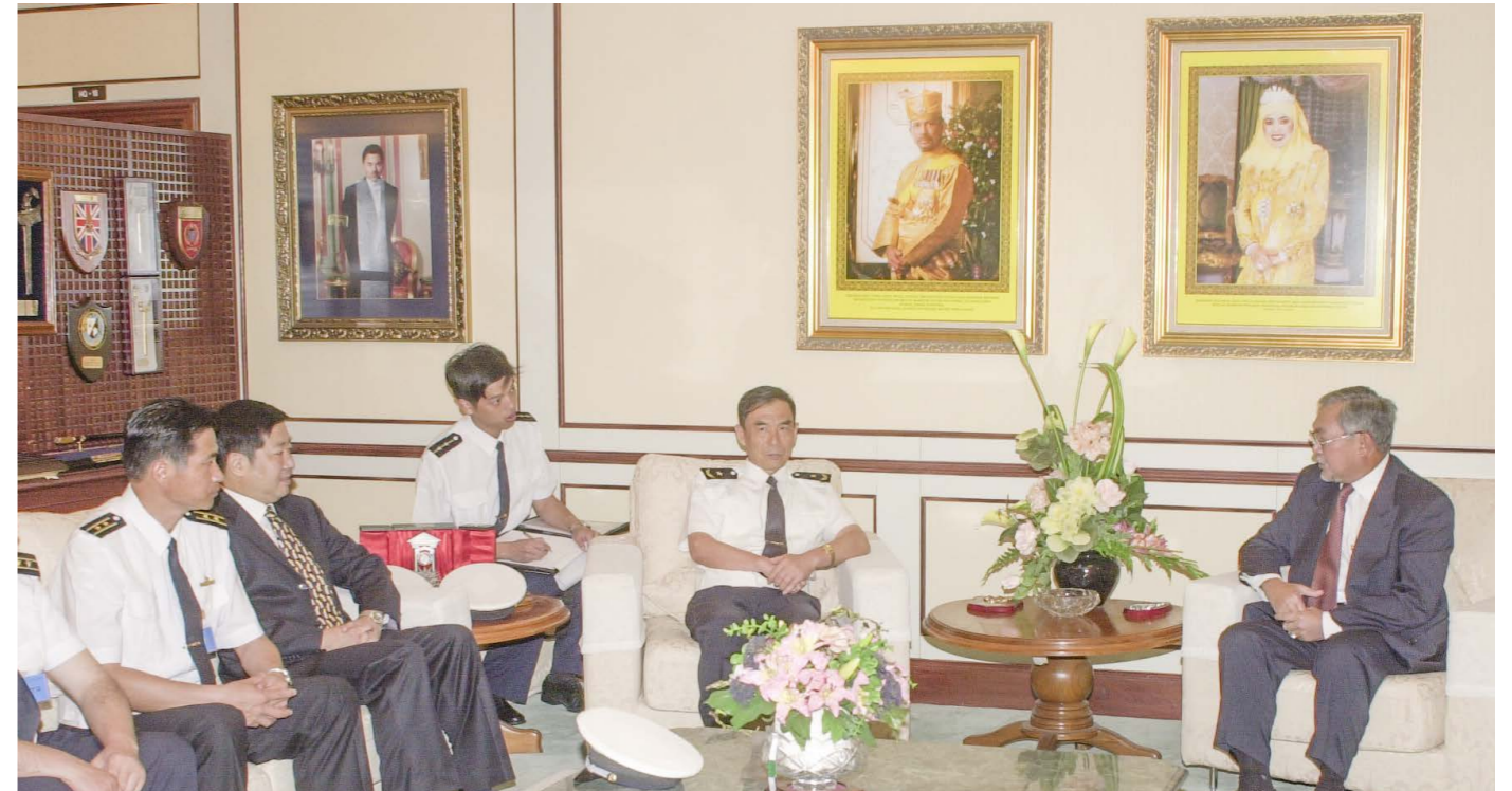
Yang Amat Mulia Pengiran Sanggamara Diraja Major General (Rtd) Pengiran Haji Ibnu Ba'asith bin Pengiran Dato Penghulu Pengiran Haji Apong, Deputy Minister of Defence receiving a courtesy call from Rear Admiral Xue Tianpei, Deputy Commander of the People's Republic of China's South Sea Fleet.

BERAKAS, November 5 - Yang Amat Mulia Pengiran Sanggamara Diraja Major General (Rtd) Pengiran Haji Ibnu Ba'asith bin Pengiran Dato Penghulu Pengiran Haji Apong, Deputy Minister of Defence received a courtesy call from Rear Admiral Xue Tianpei, Deputy Commander of the People's Republic of China's South