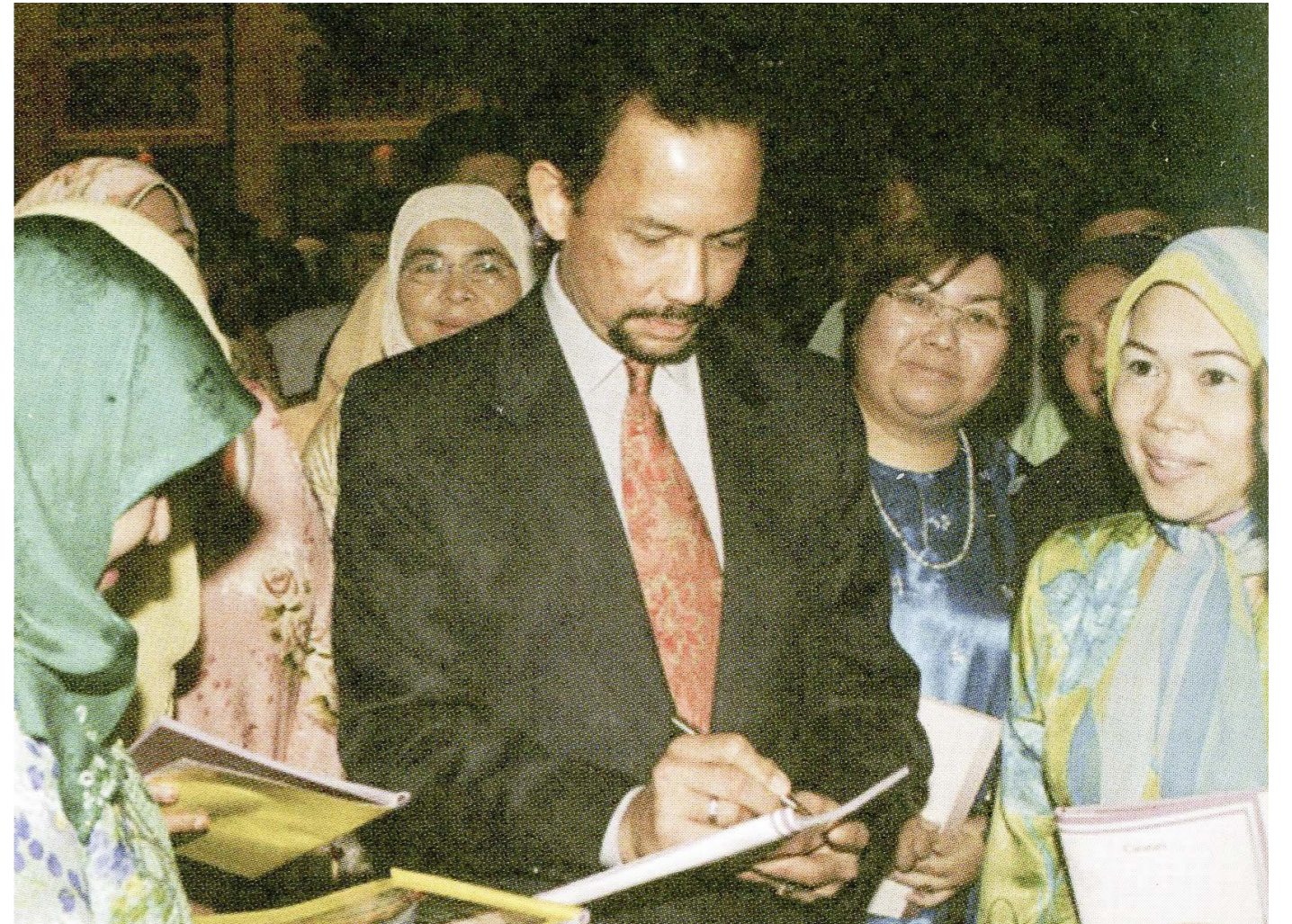
His Majesty Sultan Haji Hassanal Bolkiah Mu'izzaddin Waddaulah ibni Al-Marhum Sultan Haji Omar 'Ali Saifuddien Sa'adul Khairi Waddien, Sultan and Yang Di-Pertuan of Brunei Darussalam signing a commemorative booklet.