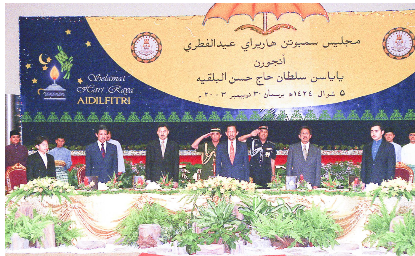
His Majesty Sultan Haji Hassanal Bolkiah Mu'izzaddin Waddaulah ibni Al-Marhum Sultan Haji Omar 'Ali Saifuddien Sa'adul Khairi Waddien, Sultan and Yang Di-Pertuan of Brunei Darussalam; His Royal Highness Prince Haji Al-Muhtadee Billah, the Crown Prince; His Royal Highness Prince Haji Sufri Bolkiah; His Royal Highness Prince Haji Jefri Bolkiah, His Royal Highness Prince 'Abdul Malik and His Royal Highness Prince 'Abdul Mateen at the Hari Raya Aidilfitri Celebration hosted by the Yayasan Sultan Haji Hassanal Bolkiah (YSHHB).