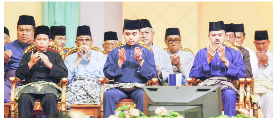
His Royal Highness Prince Haji Al-Muhtadee Billah, the Crown Prince; His Royal Highness Prince 'Abdul Malik; and His Royal Highness Prince 'Abdul Mateen at the ceremony.