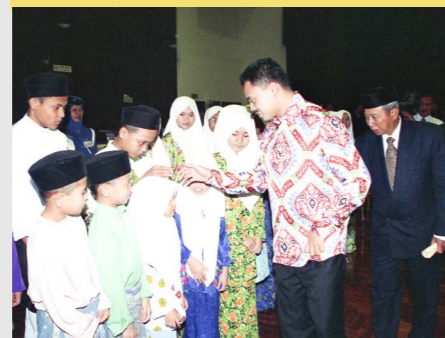
9 Crown Prince shows concern on youth welfare