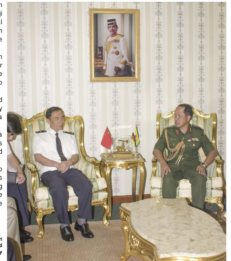
Yang Dimuliakan Pehin Dato Lailaraja Major General (Rtd) Dato Paduka Seri Haji Awang Halbi bin Haji Mohd. Yussof, Commander of Royal Brunei Armed Forces (RBAF) receiving a courtesy call from Rear Admiral Xue Tianpei, Deputy Commander of the People's Republic of China's South Sea Fleet.

The courtesy call is regarded as a step forward to strengthen defence relation between the two countries since the signing of the Memorandum of Understanding on Military Exchange between the Ministry of Defence of Brunei Darussalam and National Defence of the People's Republic of China on September 12.