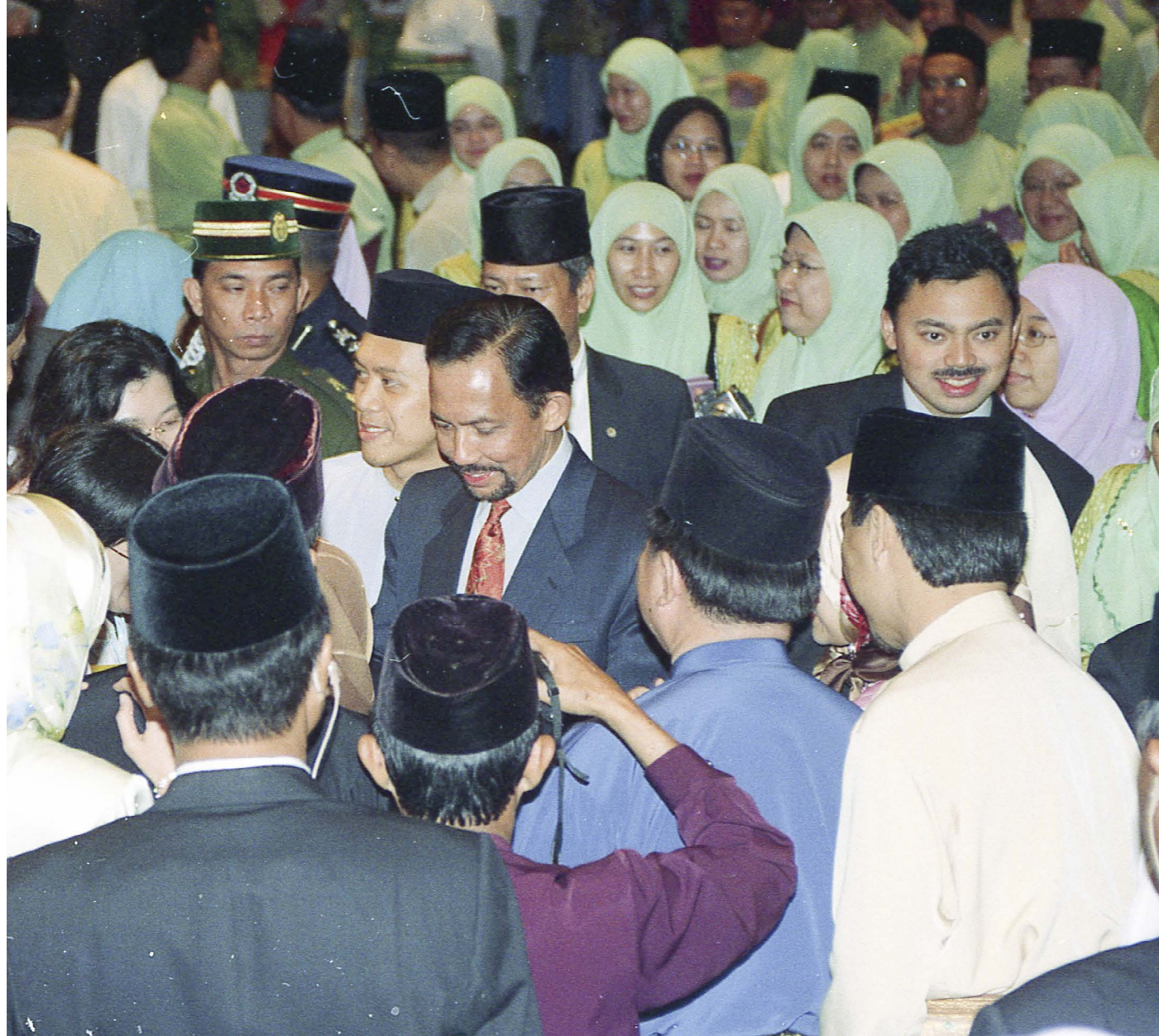
His Majesty Sultan Haji Hassanal Bolkiah Mu'izzaddin Waddaulah ibni Al-Marhum Sultan Haji Omar 'Ali Saifuddien Sa'adul Khairi Waddien, Sultan and Yang Di-Pertuan of Brunei Darussalam and His Royal Highness Prince Haji Al-Muhtadee Billah, the Crown Prince during the get-together with the young professionals who attended the event.