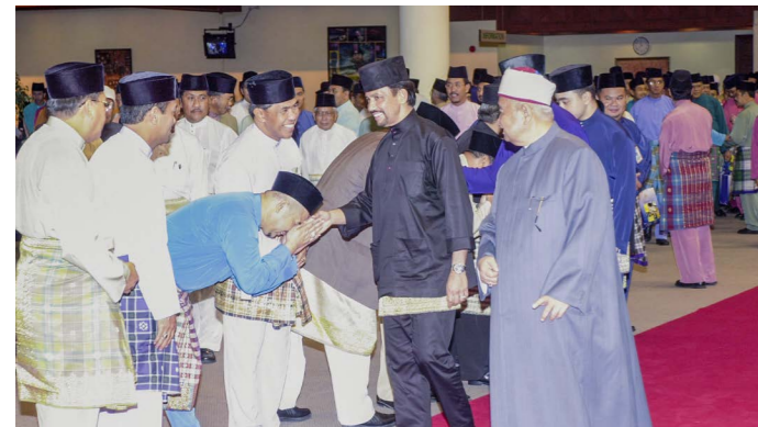
His Majesty the Sultan and Yang Di-Pertuan of Brunei Darussalam being greeted at the National Level of Nuzul Al-Quran celebration for 1424 Hijrah event.