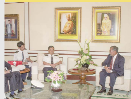
11 Deputy Minister of Defence receives courtesy call