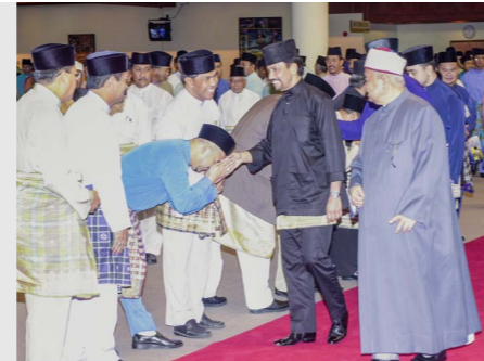
4 Nuzul Al-Quran Celebration: Uphold, follow the teaching of Al-Quran