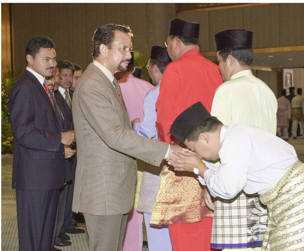
His Majesty Sultan Haji Hassanal Bolkiah Mu'izzaddin Waddaulah ibni Al-Marhum Sultan Haji Omar 'Ali Saifuddien Sa'adul Khairi Waddien, Sultan and Yang Di-Pertuan of Brunei Darussalam and other members of the royal family receiving male visitors.

Her Majesty Duli Raja Isteri Pengiran Anak Hajah Saleha binti Al-Marhum Pengiran Pemancha Pengiran Anak Haji Mohamed Alam receiving female visitors.