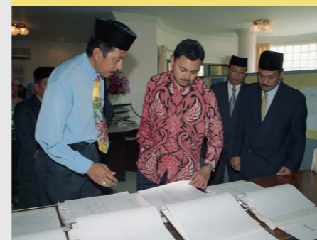
10 Crown Prince visits Department of Economic Planning and Development