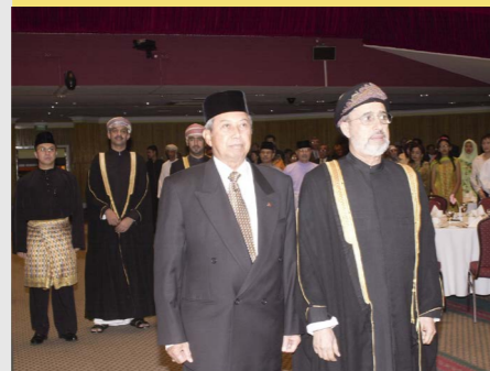
10 Brunei - Sultanate of Oman cooperate in various fields