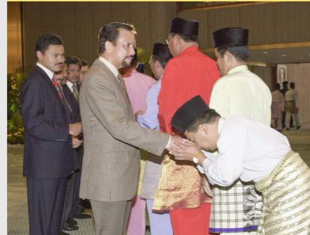
6 Over 28 thousand attend open palace