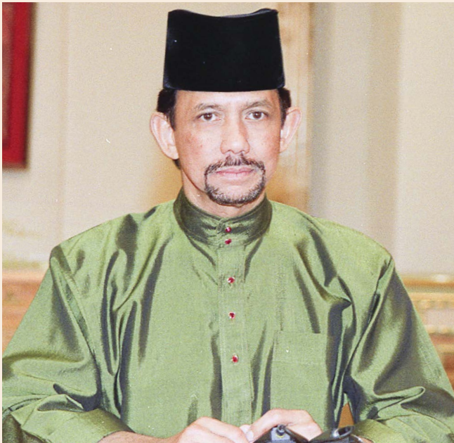
His Majesty Sultan Haji Hassanal Bolkiah Mu'izzaddin Waddaulah ibni Al-Marhum Sultan Haji Omar 'Ali Saifuddien Sa'adul Khairi Waddien, Sultan and Yang Di-Pertuan of Brunei Darussalam delivering a titah in conjunction with Hari Raya Aidilfitri 1424 Hijrah/2003 Masihi celebration.

BANDAR SERI BEGAWAN, November 26 - His Majesty Sultan Haji Hassanal Bolkiah Mu'izzaddin Waddaulah ibni Al-Marhum Sultan Haji Omar 'Ali Saifuddien Sa'adul Khairi Waddien, Sultan and Yang Di-Pertuan of Brunei Darussalam in a titah (royal speech) said that Hari Raya brings a message of happiness and peace.