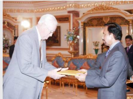
3 Appointment of Judicial Commissioner of the Supreme Court