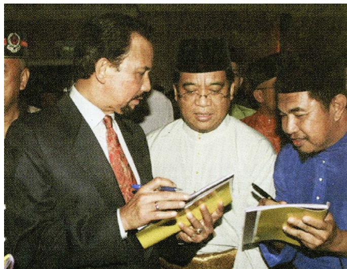
His Majesty the Sultan and Yang Di-Pertuan of Brunei Darussalam interacting with the attendees of the event.