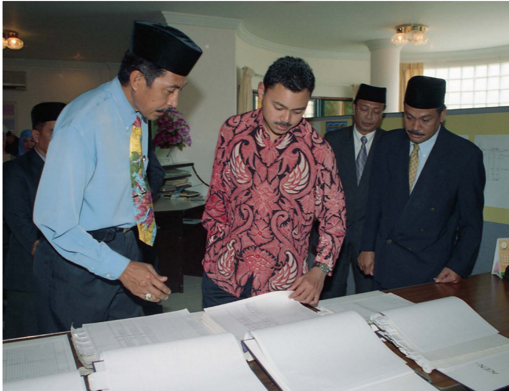
His Royal Highness Prince Haji Al-Muhtadee Billah ibni His Majesty Sultan Haji Hassanal Bolkiah Mu'izzaddin Waddaulah, the Crown Prince listens to a briefing on the functions of the Department of Economic Planning and Development.

His Royal Highness then toured various departments, sections and units under the department and took a closer look at the facilities available.