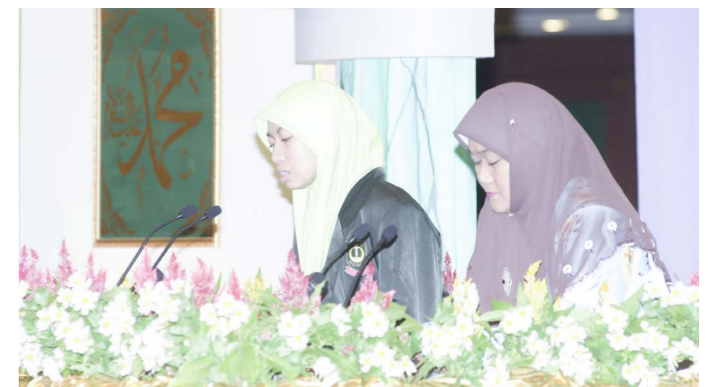
Recitation of Al-Quran verses from one of the participants.