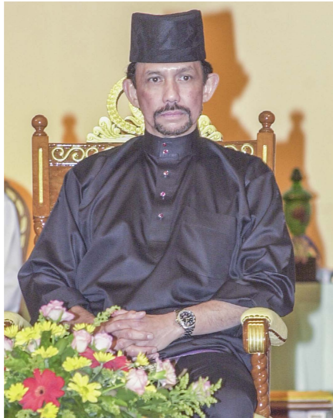
His Majesty Sultan Haji Hassanal Bolkiah Mu'izzaddin Waddaulah ibni Al-Marhum Sultan Haji Omar 'Ali Saifuddien Sa'adul Khairi Waddien, Sultan and Yang Di-Pertuan of Brunei Darussalam at the National Level of Nuzul Al-Quran celebration for 1424 Hijrah.