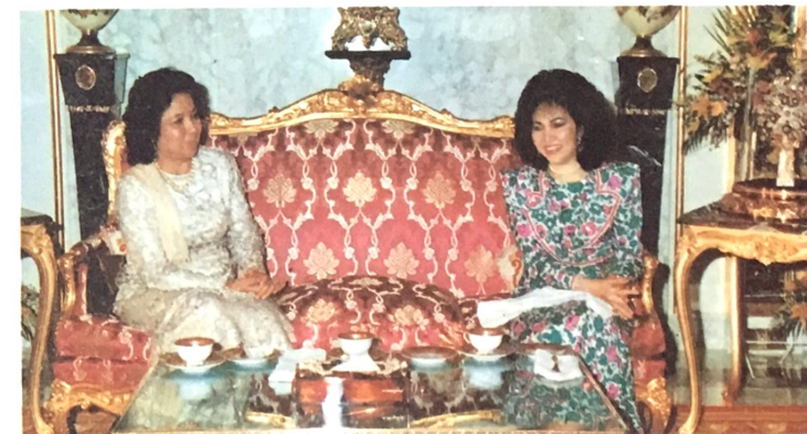
Her Royal Highness Pengiran Isteri Hajjah Mariam receives the Raja Permaisuri Tuanku Bainun at the Istana Nurul Izzah.