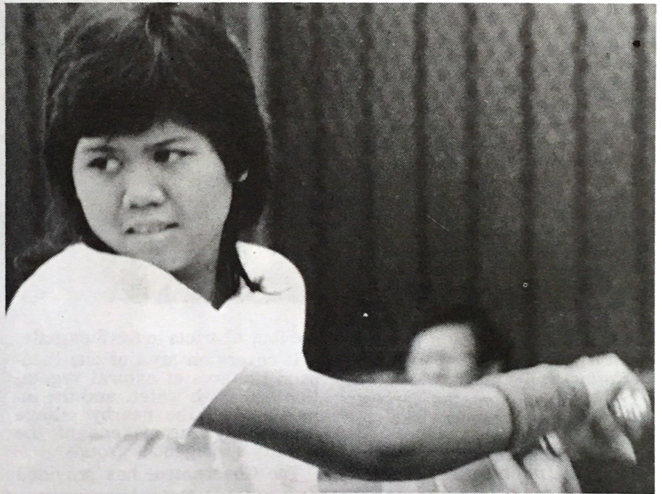
Indonesia's Yayuk Basuki