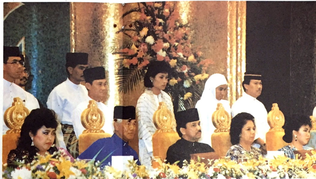
His Majesty hosted a banquet in honour of the royal visitors and their delegation at the Istana Nurul Iman.

On the second day of their stay, Raja Permaisuri Tuanku Bainun visited the Brunei Museum, the Malay Technology Museum, and the Arts and Handicrafts Centre; Sultan Azlan Muhibbuddin Shah visited the Pusat Dakwah Islamiah (Islamic Missionary Centre) and had a friendly golf match against a home team.