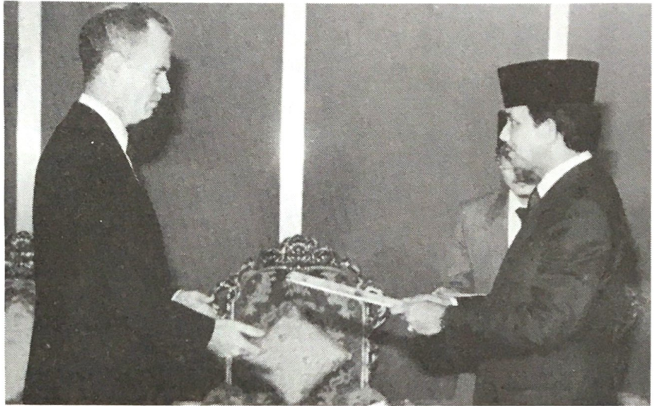
The Canadian envoy presents his credentials to His Majesty Paduka Seri Baginda Sultan and Yang Di-Pertuan of Brunei Darussalam.