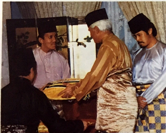
Sultan Azlan Muhibbuddin Shah also conferred honours to His Majesty's three brothers. His Royal Highness Paduka Seri Pengiran Bendahara Seri Maharaja Permaisura Pengiran Muda Haji Sufri Bolkiah is seen here receiving the award. Looking on (right) is HRH Paduka Seri Pengiran Perdana Wazir Sahibul Himmah Wal-Waqar Pengiran Muda Haji Mohamed Bolkiah.