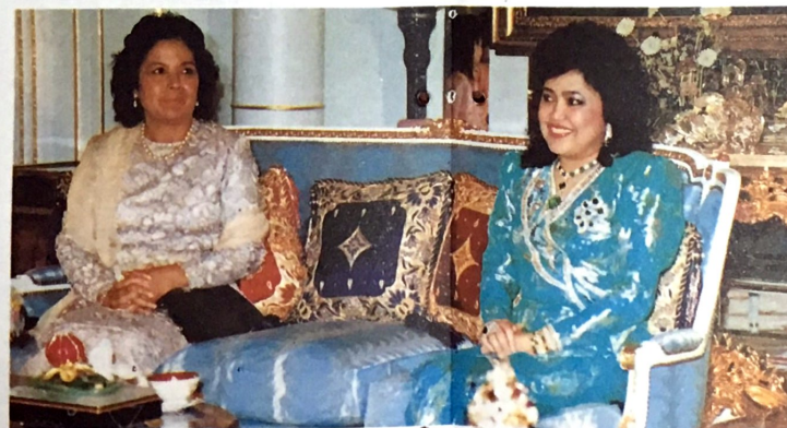
Her Majesty Raja Isteri Pengiran Anak Saleha grants the Raja Permaisuri Tuanku Bainun an audience at the Istana Nurul Iman.