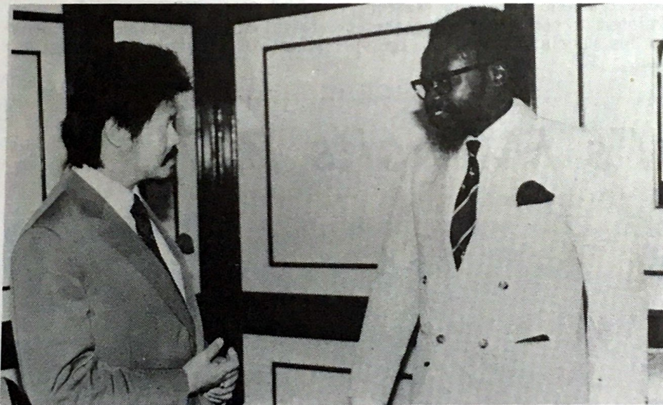
The Brunei Darussalam Foreign Affairs Minister (left) and the Ugandan Foreign Affairs Minister (right).

T he Honourable Mr T.B.Kabwegyere, the Ugandan Minister of State for Foreign Affairs, arrived on July 31 for a four-day visit to the Sultanate.