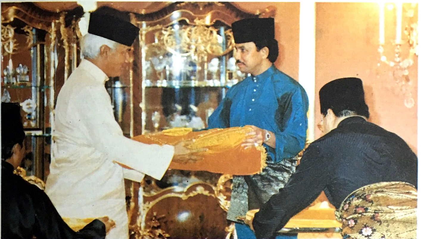
His Majesty Paduka Seri Baginda Sultan Haji Hassanal Bolkiah Mu'izzaddin Waddaulah, Sultan and Yang Di-Pertuan of Brunei Darussalam confers the "Darjah Kerabat Mahkota Brunei" on Sultan Azlan Muhibuddin Shah, at a ceremony held at the Istana Nurul Iman last month.

• see story and pictures on pages 6 and 7