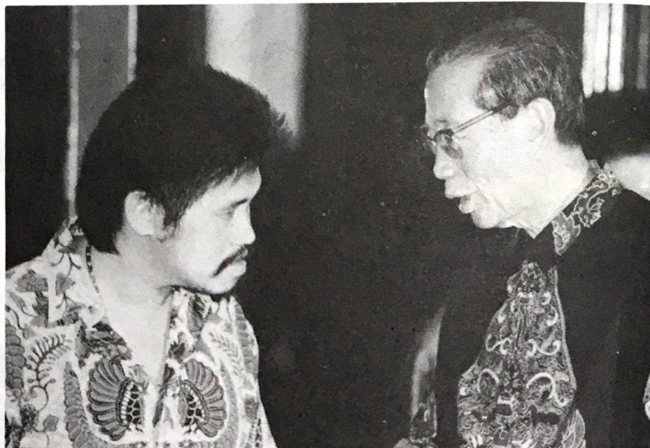
HRH Paduka Seri Pengiran Perdana Wazir Sahibul Himmah Wal-Waqar Pengiran Muda Haji Mohamed Bolkiah (left) at a dinner with His Excellency Mr Son Sann (right).

His Royal Highness Paduka Seri Pengiran Perdana Wazir Sahibul Himmah Wal-Waqar Pengiran Muda Haji Mohamed Bolkiah, the Brunei Darussalam Foreign Affairs Minister, reaffirmed the Sultanate stance on the Kampuchean conflict at a dinner in honour of the visiting Prime Minister of the Coalition Government of Democratic Kampuchea (CGDK) and delegation.