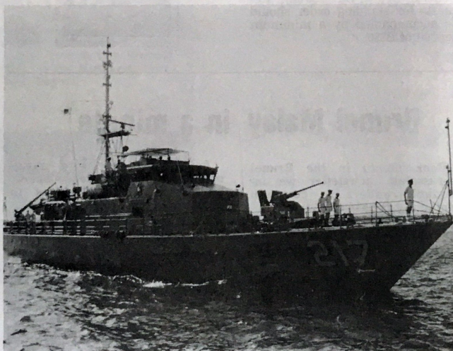
The Royal Australian Navy vessel arrives at Muara Port.

HMAS Bunbury and HMAS Geelong, which were part of a 15-boat construction programme, were built between 1980 and 1984 to enhance RAN's experience in oil-rig surveillance and fishery patrol around Australia's 37000 km coastline.