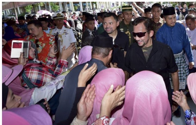
His Majesty Sultan Haji Hassanal Bolkiah Mu'izzaddin Waddaulah during the Get-Together with the people and residents of the country.

at the Prime Minister's Office; His Royal Highness Prince 'Abdul Malik; His Royal Highness Prince Mohamed Bolkiah; His Royal Highness Prince Haji Sufri Bolkiah; His Royal Highness Prince Haji Jefri Bolkiah and other members of the Royal Family.