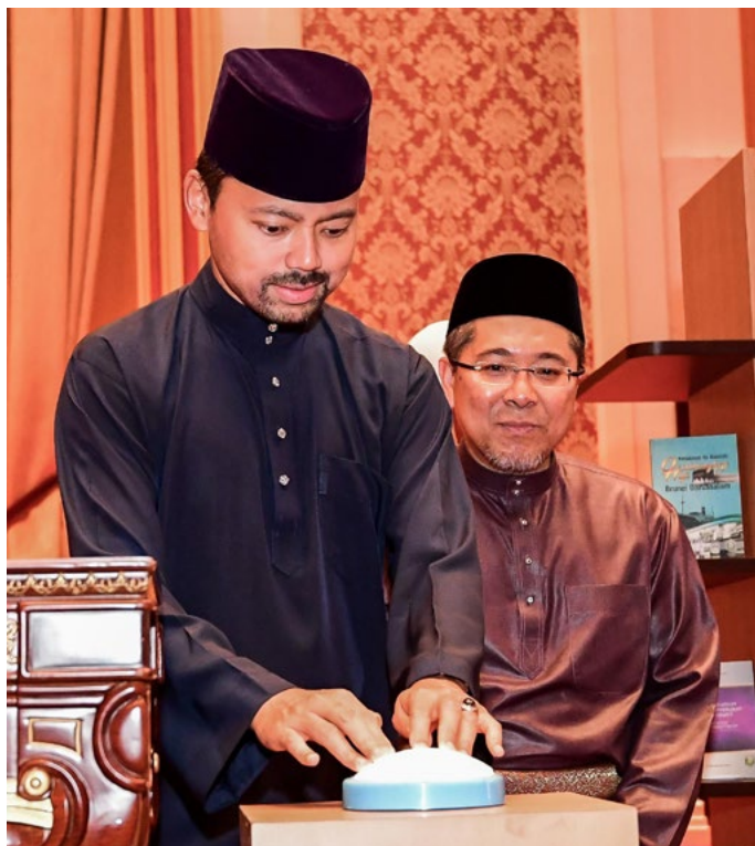
His Royal Highness Prince Doctor Haji Al-Muhtadee Billah ibni His Majesty Sultan Haji Hassanal Bolkiah Mu'izzaddin Waddaulah, the Crown Prince and Senior Minister at the Prime Minister's Office, and Pro-Chancellor of Universiti Islam Sultan Sharif Ali (UNISSA) during the launching of 30 new books published by UNISSA.

The Moot Court performance is among the highlights of this year's Mahrajan. 'Mooting' is a practical training activity for students in the Faculty of Shariah and Law, and is mandatory for Bachelor of Law and Bachelor of Shariah Law students.