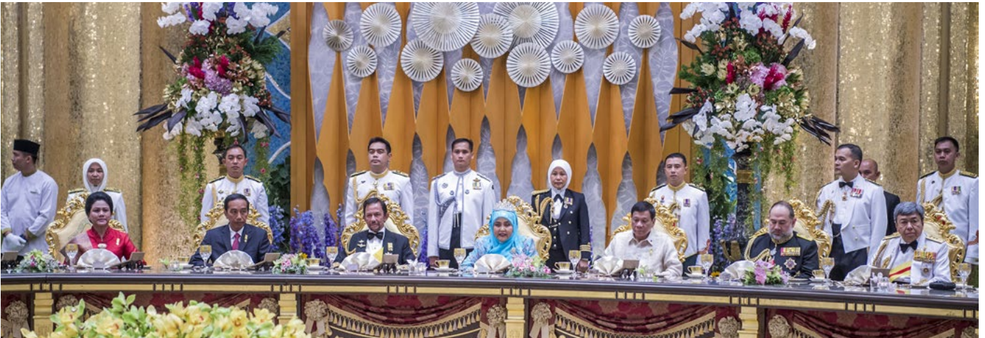
His Majesty Sultan Haji Hassanal Bolkiah Mu'izzaddin Waddaulah ibni Al-Marhum Sultan Haji Omar 'Ali Saifuddien Sa'adul Khairi Waddien, Sultan and Yang Di-Pertuan of Brunei Darussalam and Her Majesty Duli Raja Isteri Pengiran Anak Hajah Saleha binti Al-Marhum Pengiran Pemancha Pengiran Anak Haji Mohamed Alam and other heads of state during the Royal Banquet.

BANDAR SERI BEGAWAN , October 6 - His Majesty Sultan Haji Hassanal Bolkiah Mu'izzaddin Waddaulah ibni Al-Marhum Sultan Haji Omar 'Ali Saifuddien Sa'adul Khairi Waddien, Sultan and Yang Di-Pertuan of Brunei Darussalam and Her Majesty Duli Raja Isteri Pengiran Anak Hajah Saleha binti Al-Marhum Pengiran Pemancha Pengiran Anak Haji Mohamed Alam, yesterday night attended the Royal Banquet in conjunction with the Golden Jubilee Celebration of His Majesty the Sultan and Yang Di-Pertuan of Brunei Darussalam's Accession to the Throne.