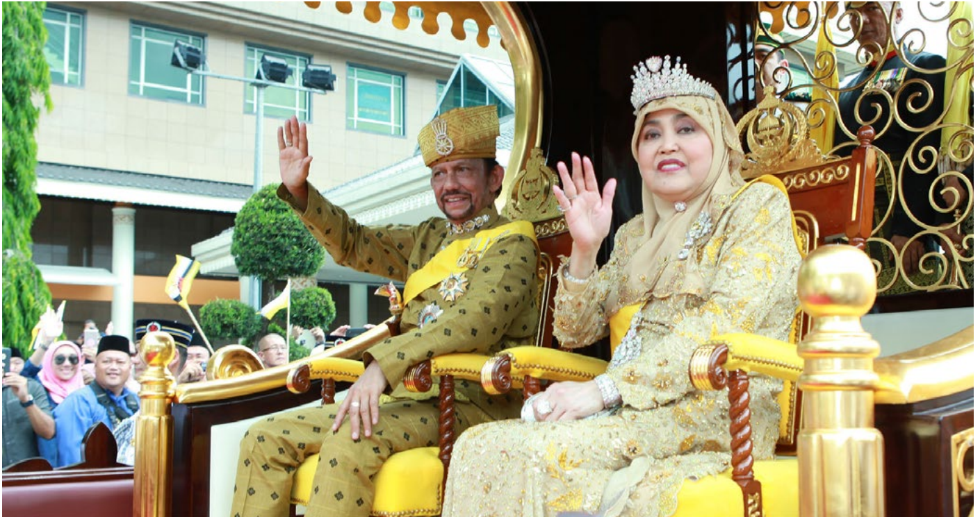
His Majesty Sultan Haji Hassanal Bolkiah Mu'izzaddin Waddaulah ibni Al-Marhum Sultan Haji Omar 'Ali Saifuddien Sa'adul Khairi Waddien, Sultan and Yang Di-Pertuan of Brunei Darussalam and Her Majesty Duli Raja Isteri Pengiran Anak Hajah Saleha binti Al-Marhum Pengiran Pemancha Pengiran Anak Haji Mohamed Alam onboard the Royal Chariot during the Golden Jubilee Royal Procession in conjunction with the Golden Jubilee Celebration of His Majesty's Accession to the Throne.