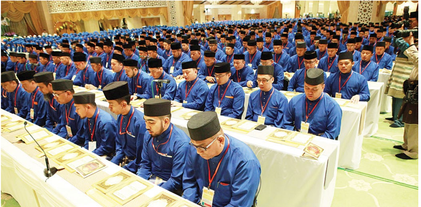
Some of the participants of the Khatam Al-Quran ceremony in conjunction with the Golden Jubilee Celebration of His Majesty the Sultan and Yang Di-Pertuan of Brunei Darussalam's Accession to the Throne.

The Khatam Al-Quran ceremony was organised by the committee of the Sektoral Rancangan-Rancangan Keugamaan dan Majlis Kesyukuran Sambutan Jubli Emas , to ask for that Brunei Darussalam will always be protected by Allah, in response to His Majesty's titah (royal speech) to make Brunei Darussalam a country of zikir that never stops glorifying Allah the Almighty.