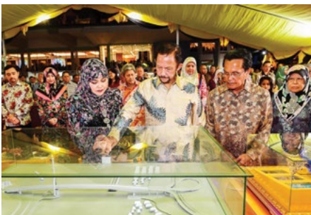
12. Official Opening of the Raja Isteri Pengiran Anak Hajah Saleha Bridge