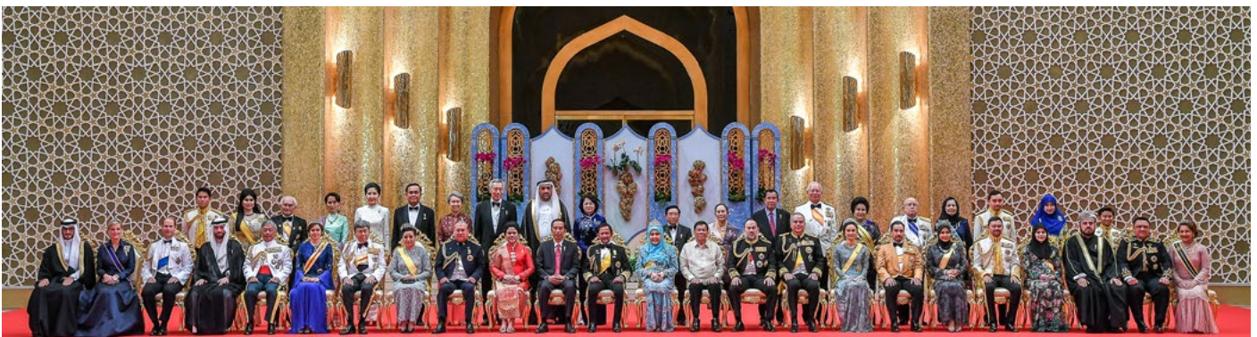
His Majesty Sultan Haji Hassanal Bolkiah Mu'izzaddin Waddaulah ibni Al-Marhum Sultan Haji Omar 'Ali Saifuddien Sa'adul Khairi Waddien, Sultan and Yang Di-Pertuan of Brunei Darussalam and Her Majesty Duli Raja Isteri Pengiran Anak Hajah Saleha binti Al-Marhum Pengiran Pemancha Pengiran Anak Haji Mohamed Alam and members of the Royal Family in a group photo with royal dignitaries and heads of state / government of their representatives.

The Golden Jubilee Celebration of His Majesty the Sultan and Yang Di-Pertuan of Brunei Darussalam's Accession to the Throne presents a new milestone in the history of the nation, as the celebration marks 50 years of His Majesty's reign since October 5, 1967.