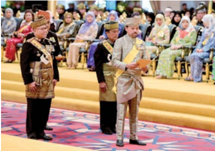
7. Wise leadership establishes the spirit of unity