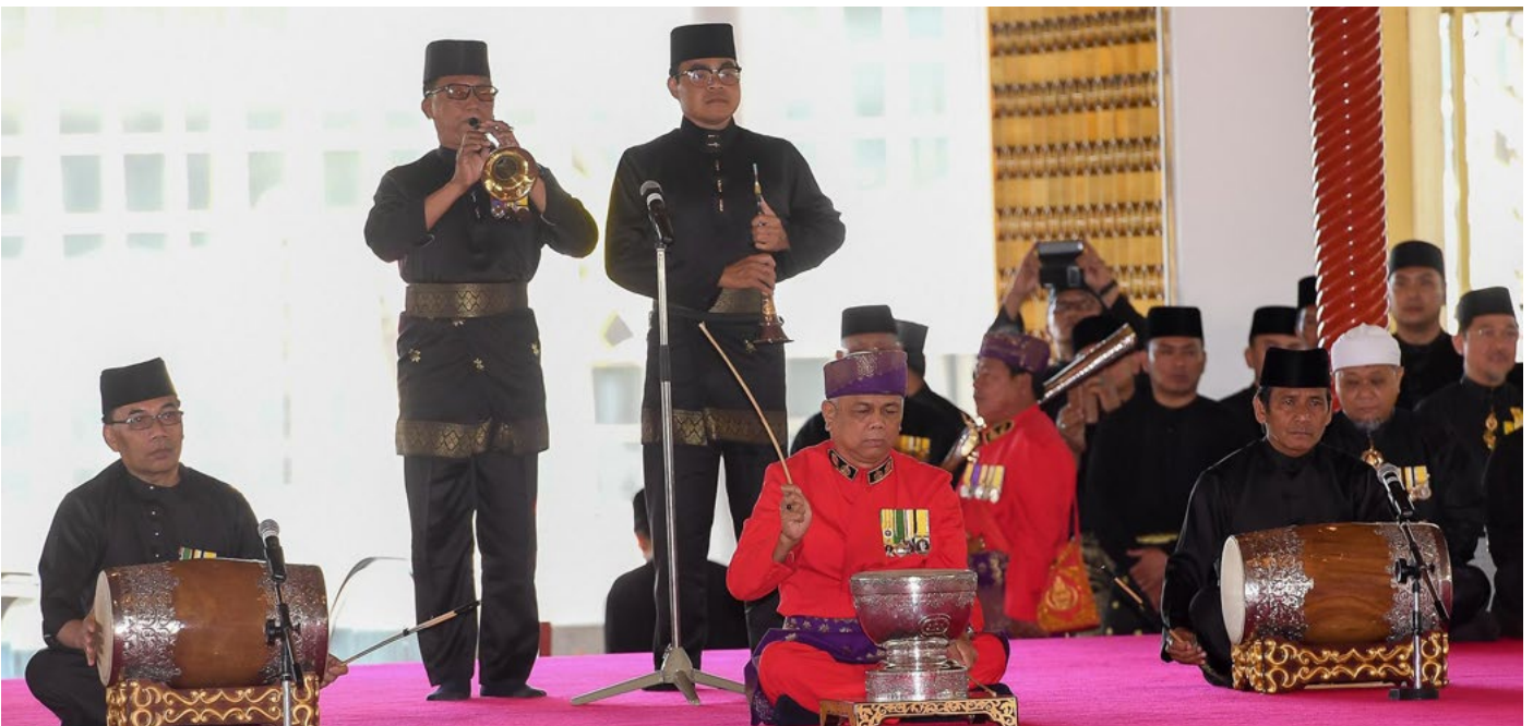
The playing of traditional musical instruments by royal court musicians.

A Doa Selamat was read by Yang Berhormat Pehin Datu Seri Maharaja Dato Paduka Seri Setia Doktor Ustaz Haji Awang Abdul Aziz bin Juned, the State Mufti.