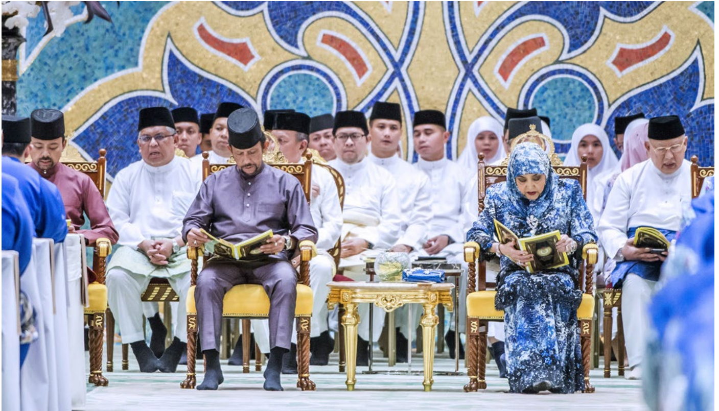
His Majesty Sultan Haji Hassanal Bolkiah Mu'izzaddin Waddaulah ibni Al-Marhum Sultan Haji Omar 'Ali Saifuddien Sa'adul Khairi Waddien, Sultan and Yang Di-Pertuan of Brunei Darussalam and Her Majesty Duli Raja Isteri Pengiran Anak Hajah Saleha binti Al-Marhum Pengiran Pemancha Pengiran Anak Haji Mohamed Alam during the Khatam Al-Quran ceremony to mark the Golden Jubilee of the Monarch's Accession to the Throne.

BANDAR SERI BEGAWAN , October 11 - His Majesty Sultan Haji Hassanal Bolkiah Mu'izzaddin Waddaulah ibni Al-Marhum Sultan Haji Omar 'Ali Saifuddien Sa'adul Khairi Waddien, the Sultan and Yang Di-Pertuan of Brunei Darussalam and Her Majesty Duli Raja Isteri Pengiran Anak Hajah Saleha binti Al-Marhum Pengiran Pemancha Pengiran Anak Haji Mohamed Alam consented to attend the Khatam Al-Quran Recitation Ceremony in conjunction with the Golden Jubilee Celebration of His Majesty the Sultan and Yang Di-Pertuan of Brunei Darussalam's Accession to the Throne. The blessed event took place at the Istana Nurul Iman.