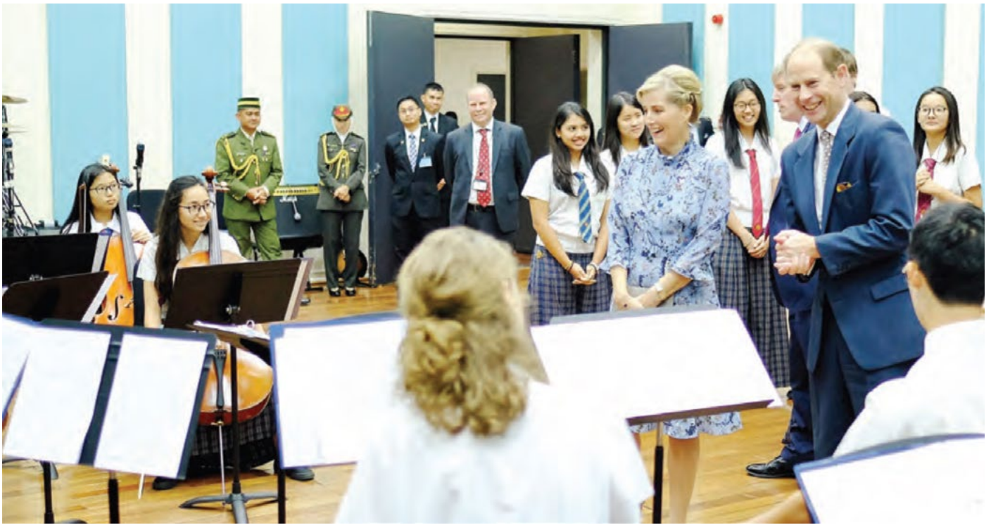
His Royal Highness Prince Edward, the Earl of Wessex and Her Royal Highness Sophie, The Countess of Wessex visiting the JIS Orchestra Group.