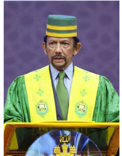
His Majesty Sultan Haji Hassanal Bolkiah Mu'izzaddin Waddaulah ibni Al-Marhum Sultan Haji Omar 'Ali Saifuddien Sa'adul Khairi Waddien, Sultan and Yang Di-Pertuan of Brunei Darussalam, and the Chancellor of UNISSA, delivering a titah (royal speech) at the 7th Hafl Al-Takharrij (Convocation Ceremony) at the International Convention Centre in Berakas.

BANDAR SERI BEGAWAN , October 16 - His Majesty Sultan Haji Hassanal Bolkiah Mu'izzaddin Waddaulah ibni Al-Marhum Sultan Haji Omar 'Ali Saifuddien Sa'adul Khairi Waddien, Sultan and Yang Di-Pertuan of Brunei Darussalam, the Chancellor of UNISSA, delivered a titah (royal speech) expressing his hope that Universiti Islam Sultan Sharif Ali (UNISSA) will continue to emerge as a landmark of Islamic glory in the country, in line with its growing maturity.