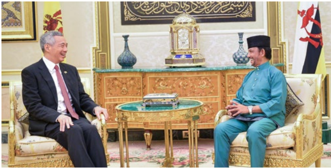
His Excellency Lee Hsien Loong, the Prime Minister of the Republic of Singapore on October 6.

His Majesty Sultan Haji Hassanal Bolkiah Mu'izzaddin Waddaulah ibni Al-Marhum Sultan Haji Omar 'Ali Saifuddien Sa'adul Khairi Waddien, Sultan and Yang Di-Pertuan of Brunei Darussalam and Her Majesty Duli Raja Isteri Pengiran Anak Hajah Saleha binti Al-Marhum Pengiran Pemancha Pengiran Anak Haji Mohamed Alam received in audience at the Istana Nurul Iman from: