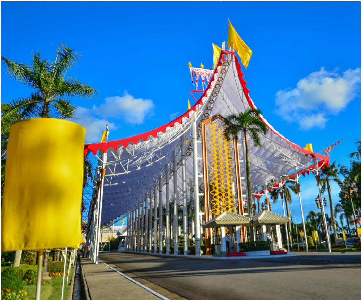
The setting of the Pemajangan – a royal decoration at Istana Nurul Iman in conjunction with the Golden Jubilee Celebration of His Majesty's Accession to the Throne.

The significance of the installation of the Pemajangan is to indicate and to raise awareness to the public, the imminent start of a royal festivity.