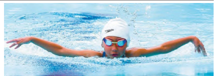
Yang Teramat Mulia Pengiran Anak Muneerah Madhul Bolkiah participating in the 25 Metre Butterfly Stroke category.

YTM came in fifth place for the 25 Metre Butterfly category with a time of 33.40 and came in second place for the 100 Metre swimming in turns category with a record of 1.47.16.