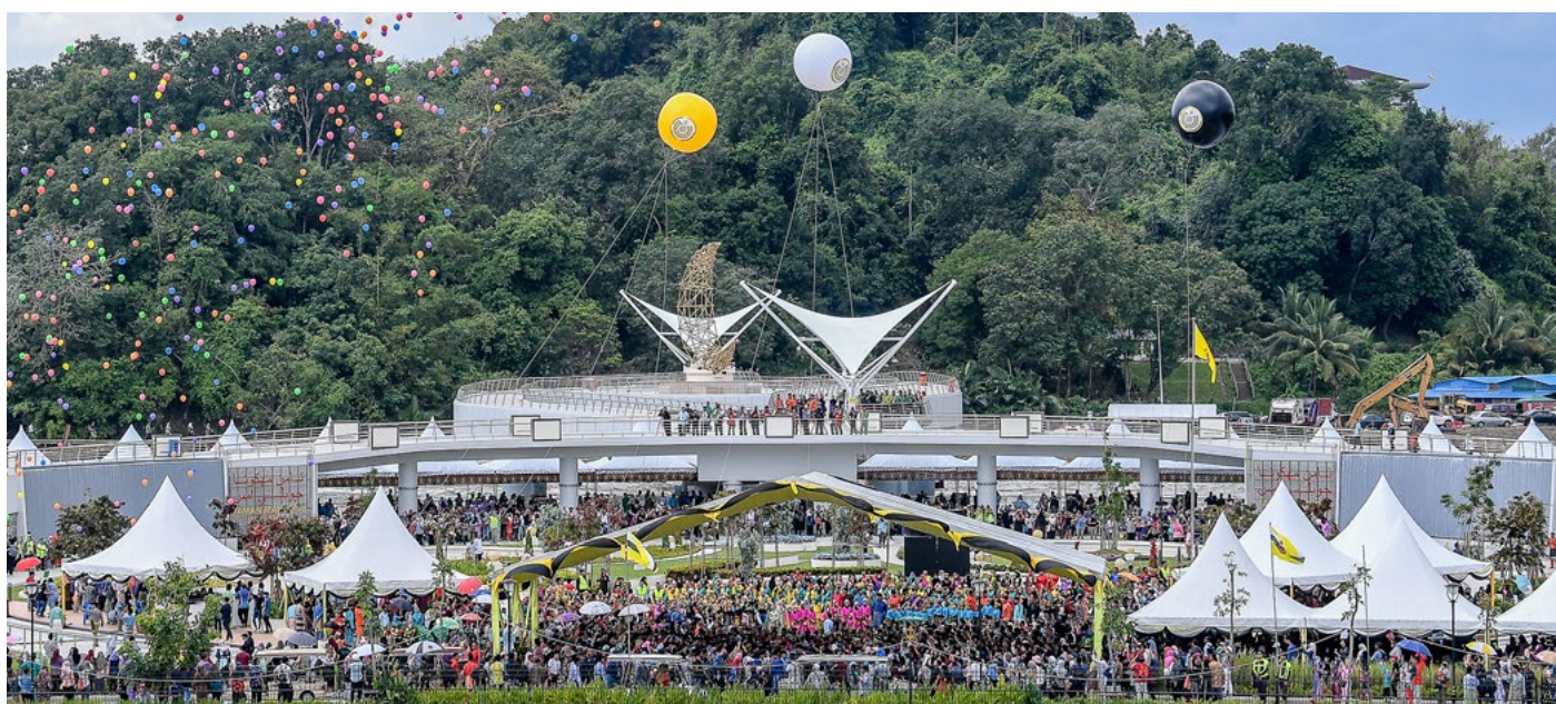
The launching of the opening of the Taman Mahkota Jubli Emas (Golden Jubilee Park).

The ceremony continued with the Procession of Decorated