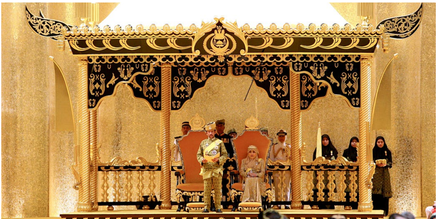
His Majesty Sultan Haji Hassanal Bolkiah Mu'izzaddin Waddaulah ibni Al-Marhum Sultan Haji Omar 'Ali Saifuddien Sa'adul Khairi Waddien, Sultan and Yang Di-Pertuan of Brunei Darussalam and Her Majesty Duli Raja Isteri Pengiran Anak Hajah Saleha binti Al-Marhum Pengiran Pemancha Pengiran Anak Haji Mohamed Alam during the Royal Audience Ceremony at the Balai Singgahsana, Istana Nurul Iman.

"Equal appreciation also goes to the members of the Royal Family, state dignitaries, community leaders and all the people, either inside or outside the country, on the continuous support and devotion to the leader and the government. May Allah the Almighty bless us and give guidance to all of us, Amin Ya Rabbal 'Alamin ," His Majesty concluded.