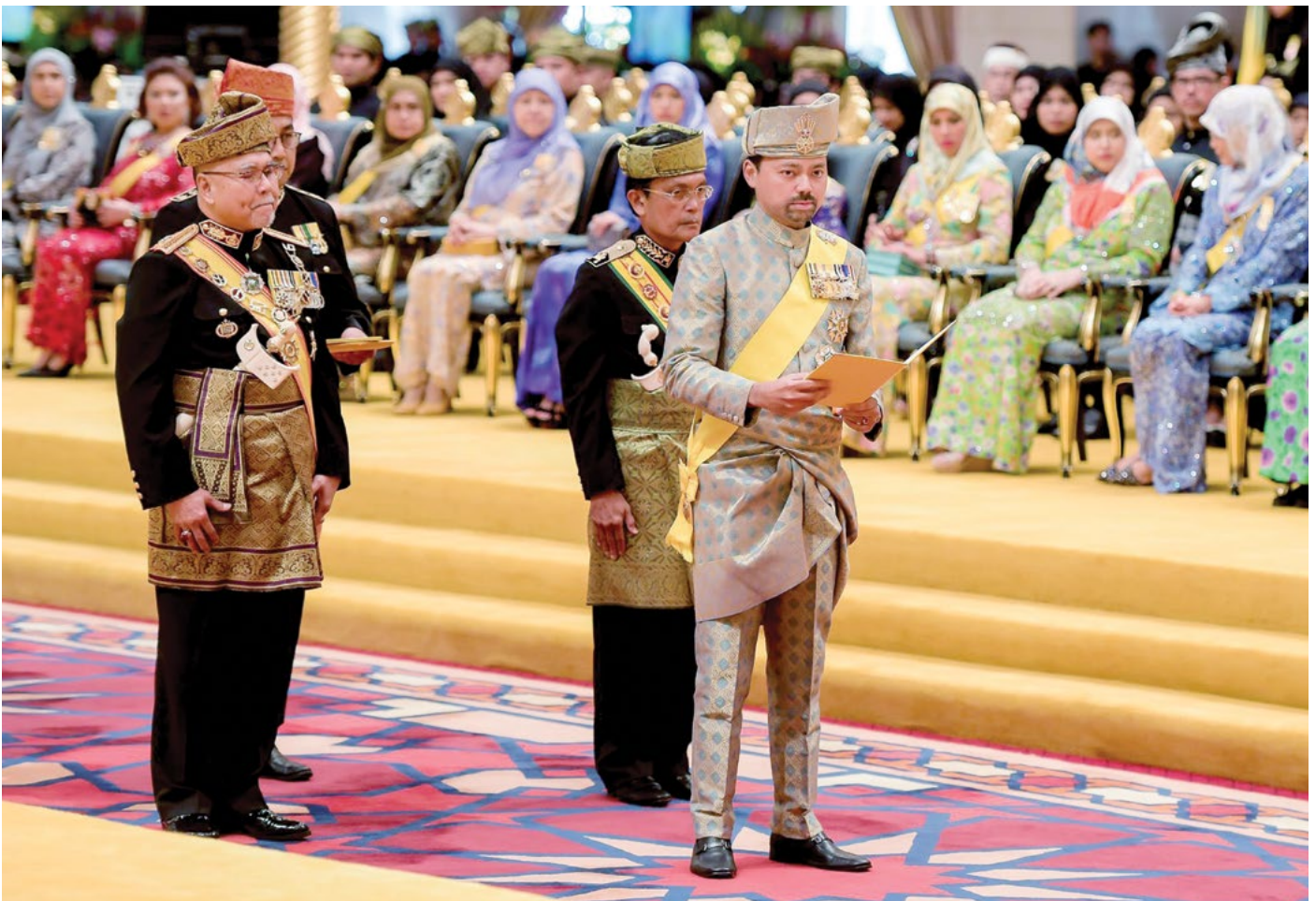
His Royal Highness Prince Haji Al-Muhtadee Billah, the Crown Prince and Senior Minister at the Prime Minister's Office delivering a sabda (royal speech) during the Royal Audience Ceremony at the Balai Singgahsana, Istana Nurul Iman.

Let us pray together, may Allah the Almighty continue to grant his blessings upon my father and mother, and bestow on them health and happiness, and the continuous reign of my father over the government with grace and guidance from Allah the Almighty. Ameen Ya Rabbal 'Alamin ," said His Royal Highness heart-warmingly as he concluded his sabda .