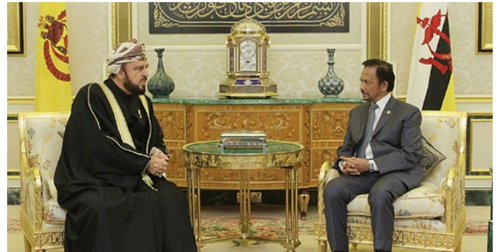
His Highness Sayyid Asa'ad bin Tariq Al Said, Deputy Prime Minister for International Relations and Cooperation Affairs of the Sultanate of Oman on October 7.