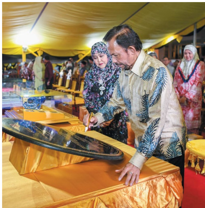
His Majesty Sultan Haji Hassanal Bolkiah Mu'izzaddin Waddaulah ibni Al-Marhum Sultan Haji Omar 'Ali Saifuddien Sa'adul Khairi Waddien, Sultan and Yang Di-Pertuan of Brunei Darussalam signing the plaque after the official opening of the Raja Isteri Pengiran Anak Hajah Saleha Bridge, accompanied by Her Majesty Duli Raja Isteri Pengiran Anak Hajah Saleha binti Al-Marhum Pengiran Pemancha Pengiran Anak Haji Mohamed Alam as well as other members of the Royal Family.

The bridge was designed with a Bruneian identity by applying Islamic characteristics and a symbol of national sovereignty in the