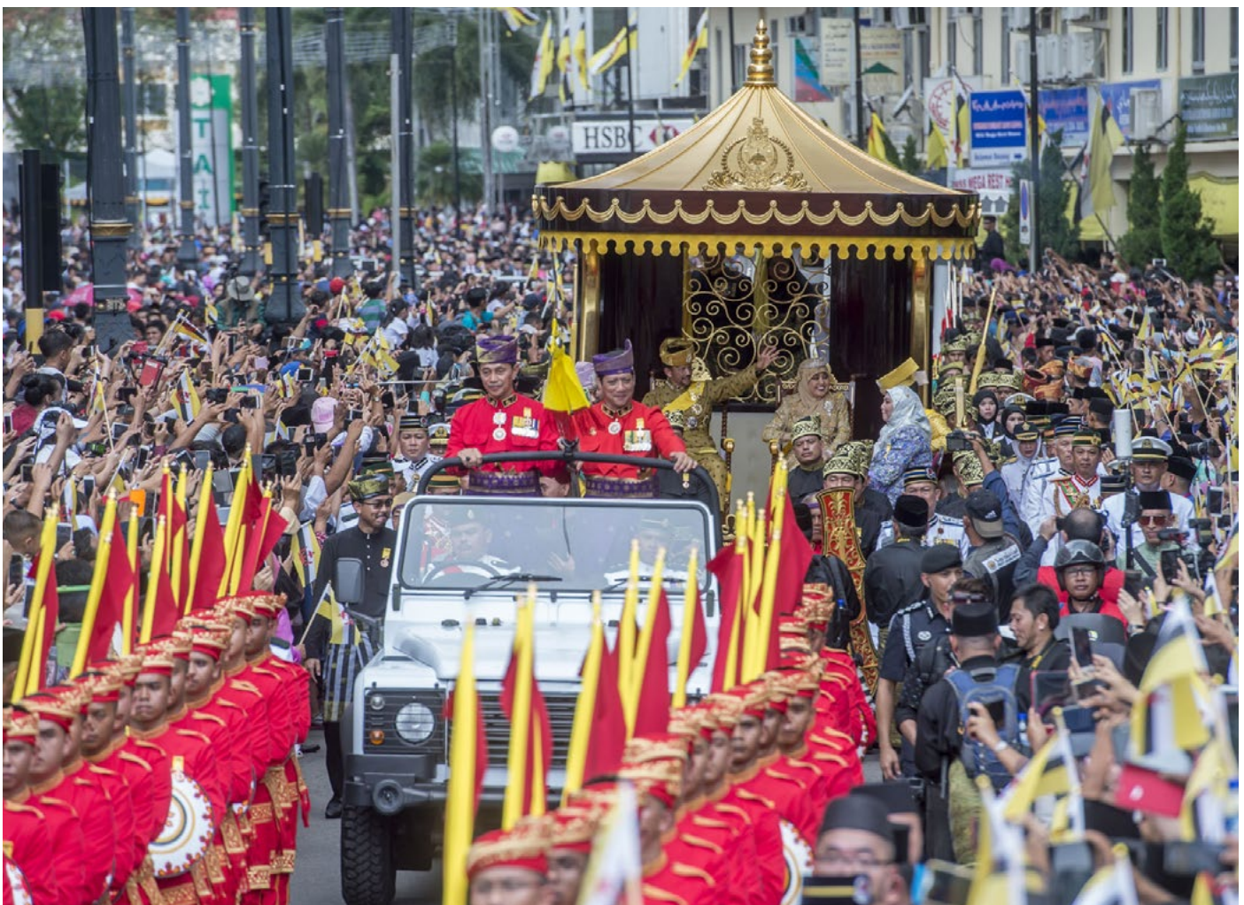
A front view of the Usongan Diraja (Royal Chariot) showing Their Majesties, the two Panglimas , and the bearers of the Sinipit and Taming .

The celebration of the procession was celebrated with splendour and not only the citizens and the residents of the country were the only ones able to witness this spectacular ceremonial event, but the rest of the world too were able to observe this ceremonial event of the country befitting Malay Islamic Monarchy customs.