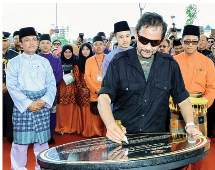
His Majesty Sultan Haji Hassanal Bolkiah Mu'izzaddin Waddaulah signing the plaque to mark the launch of Taman Mahkota Jubli Emas.

Also welcoming His Majesty and members of the Royal Family were the Joint Chairman of the Sectoral Committee of Entertainment and Events at District and Mukim, the Minister of Primary Resources and Tourism, Yang Berhormat Dato Seri Setia Awang Haji Ali bin Haji Apong; the Minister of Culture,