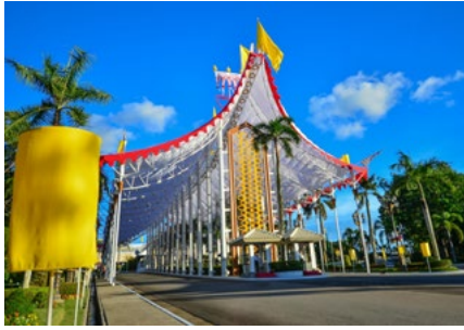
5. Setting up of Royal Regalia and 'Pemajangan' Decoration