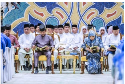
17. Attending the Golden Jubilee Khatam Ceremony