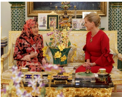
Her Royal Highness Sophie, Countess of Wessex, the spouse of His Royal Highness the Earl of Wessex on October 6.