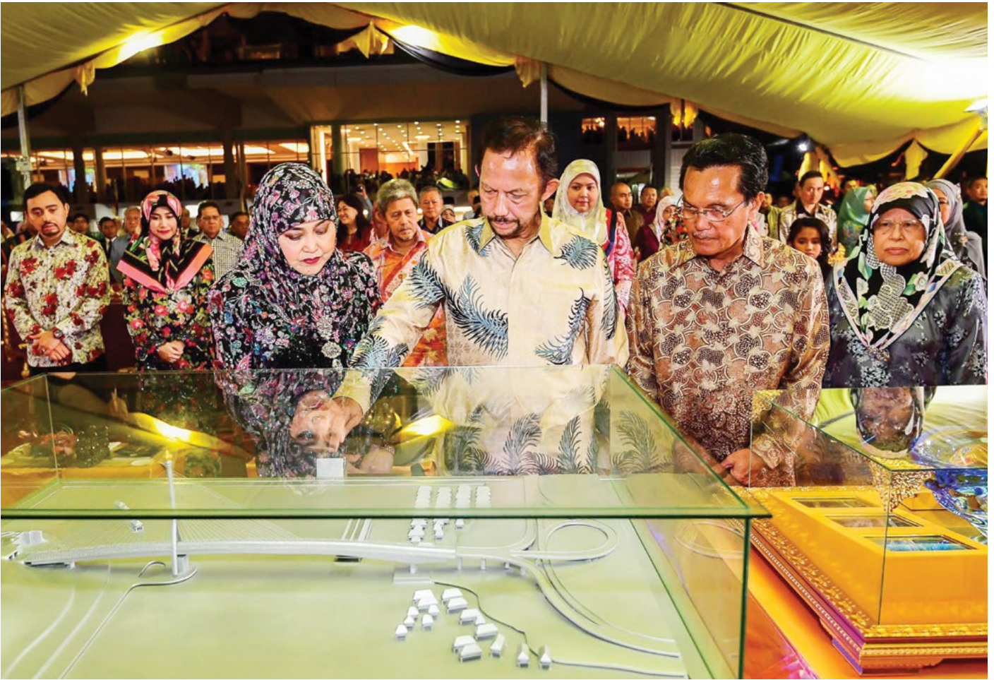
His Majesty Sultan Haji Hassanal Bolkiah Mu'izzaddin Waddaulah ibni Al-Marhum Sultan Haji Omar 'Ali Saifuddien Sa'adul Khairi Waddien, the Sultan and Yang Di-Pertuan of Brunei Darussalam and Her Majesty Duli Raja Isteri Pengiran Anak Hajah Saleha binti Al-Marhum Pengiran Pemancha Pengiran Anak Haji Mohamed Alam officiating the opening of the Raja Isteri Pengiran Anak Hajah Saleha Bridge.

BANDAR SERI BEGAWAN , October 14 - His Majesty Sultan Haji Hassanal Bolkiah Mu'izzaddin Waddaulah ibni Al-Marhum Sultan Haji Omar 'Ali Saifuddien Sa'adul Khairi Waddien and Her Majesty Duli Raja Isteri Pengiran Anak Hajah Saleha binti Al-Marhum Pengiran Pemancha Pengiran Anak Haji Mohamed Alam attended the Official Opening of the Sungai Kebun Bridge, Procession of Decorated Floats and Boats and Fireworks Display held in front of Tarindak D'Seni, Jalan Residency, in the capital.