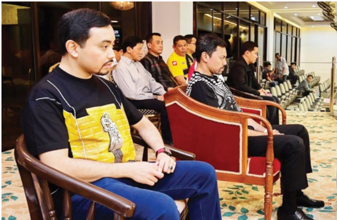
His Royal Highness Prince Haji Al-Muhtadee Billah ibni His Majesty Sultan Haji Hassanal Bolkiah Mu'izzaddin Waddaulah, the Crown Prince and Senior Minister at the Prime Minister's Office and His Royal Highness Prince 'Abdul Malik witnessing the match between DPMM FC and Balestier Khalsa FC.

BANDAR SERI BEGAWAN , October 16 - The Brunei DPMM FC failed to take advantage of playing at home after losing to Balestier Khalsa FC, 4-1 in the Singapore League (S-League), which took place at the Hassanal Bolkiah National Stadium, Berakas.