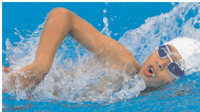
Yang Teramat Mulia Pengiran Muda 'Abdul Muntaqim participating in the championship.