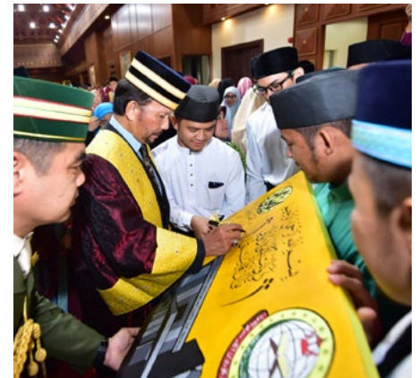
His Majesty signing an artwork done by one of the graduates.

With a deep sense of pride, His Majesty was pleased to express his sincere congratulations and well done to all the graduates on the successful completion of their studies in KUPU SB.