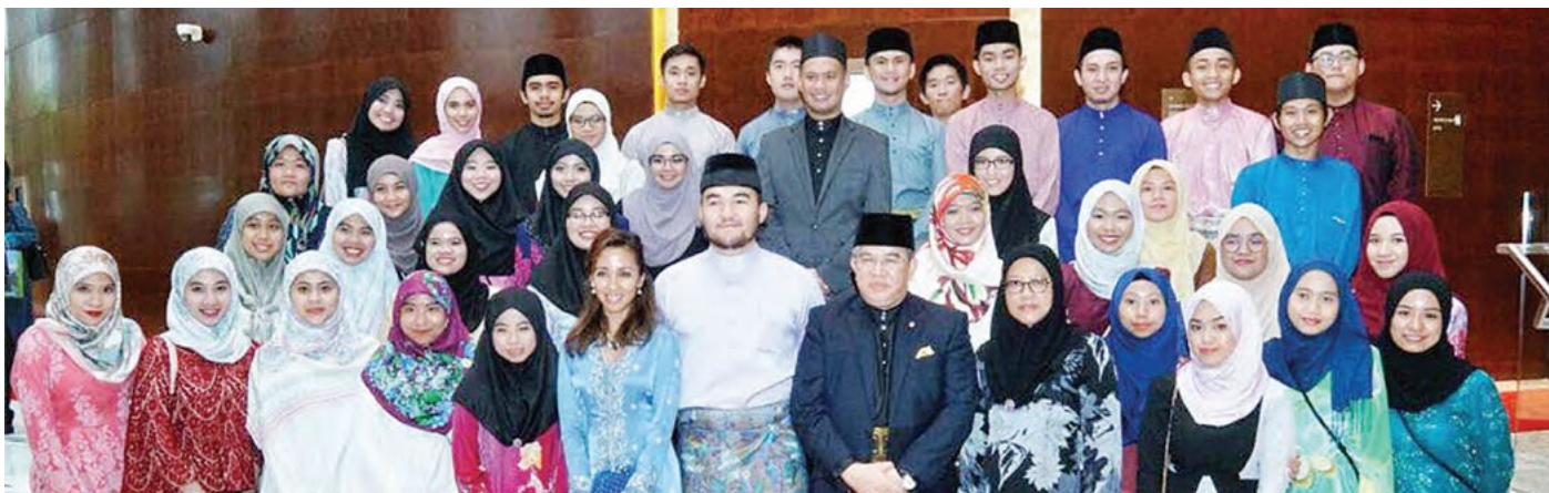
Raja Muda Selangor, Duli Yang Teramat Mulia Tengku Amir Shah ibni Sultan Sharafuddin Idris Shah and Yang Amat Mulia Tengku Datin Paduka Setia Zatashah binti Sultan Sharafuddin Idris Shah in a group photo with the High Commissioner, officers and staff of the High Commission of Brunei Darussalam, RBAF members and Brunei students in Malaysia.

KUALA LUMPUR, MALAYSIA , October 9 – The reception ceremony in conjunction with the Golden Jubilee Celebration of His Majesty the Sultan and Yang Di-Pertuan of Brunei Darussalam's Accession to the Throne was held at the Grand Hyatt Hotel, Kuala Lumpur on October 6, 2017.