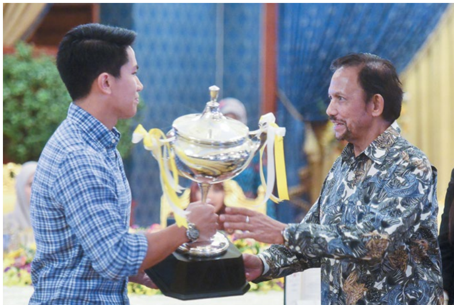
His Majesty presenting the Golden Jubilee Polo Cup to His Royal Highness Prince 'Abdul Mateen, a representative from the winning team, Brunei 1, who won the Golden Jubilee Polo Tournament.

Upon arrival at the Royal Berkshire, Royal Brunei Polo and