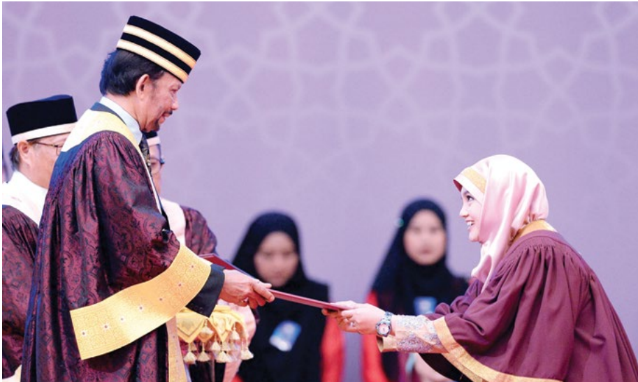
His Majesty Sultan Haji Hassanal Bolkiah Mu'izzaddin Waddaulah ibni Al-Marhum Sultan Haji Omar 'Ali Saifuddien Sa'adul Khairi Waddien, Sultan and Yang Di-Pertuan of Brunei Darussalam presenting a certificate to one of the graduates during the convocation ceremony.

BANDAR SERI BEGAWAN, 25 October - His Majesty Sultan Haji Hassanal Bolkiah Mu'izzaddin Waddaulah ibni Al-Marhum Sultan Haji Omar 'Ali Saifuddien Sa'adul Khairi Waddien, Sultan and Yang Di-Pertuan of Brunei Darussalam emphasised in a titah (royal speech) the need for higher institutions to re-assess the programmes and co-curriculum respectively, in order to produce holistic graduates who are able to balance spiritual, intellectual, physical, entrepreneurial and social aspects.