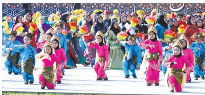
Special singing and dancing performance by the youth from all districts.

Also present at the event were, His Royal Highness Prince Haji Al-Muhtadee Billah, the Crown Prince and Senior Minister