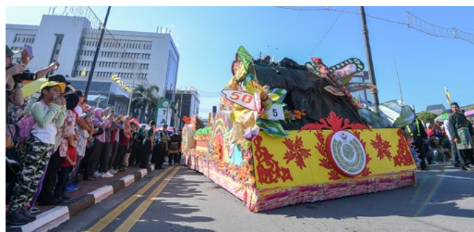
One of the vehicles during the Procession of Decorated Vehicles and Bicycles.