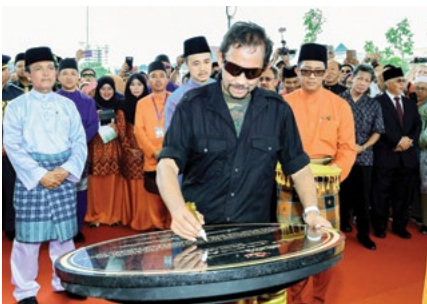
14. Procession of Decorated Vehicles and Bicycles, Eco Corridor Opening Ceremony and Get-Together