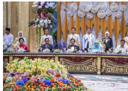
11. Royal Banquet in conjunction with the Golden Jubilee Celebration