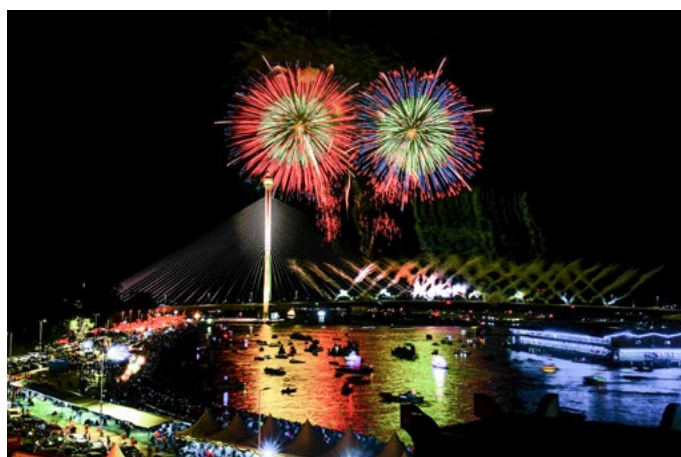
Laser lights display, Procession of Decorated Floats and Boats and Fireworks Display during the official opening of the new bridge.