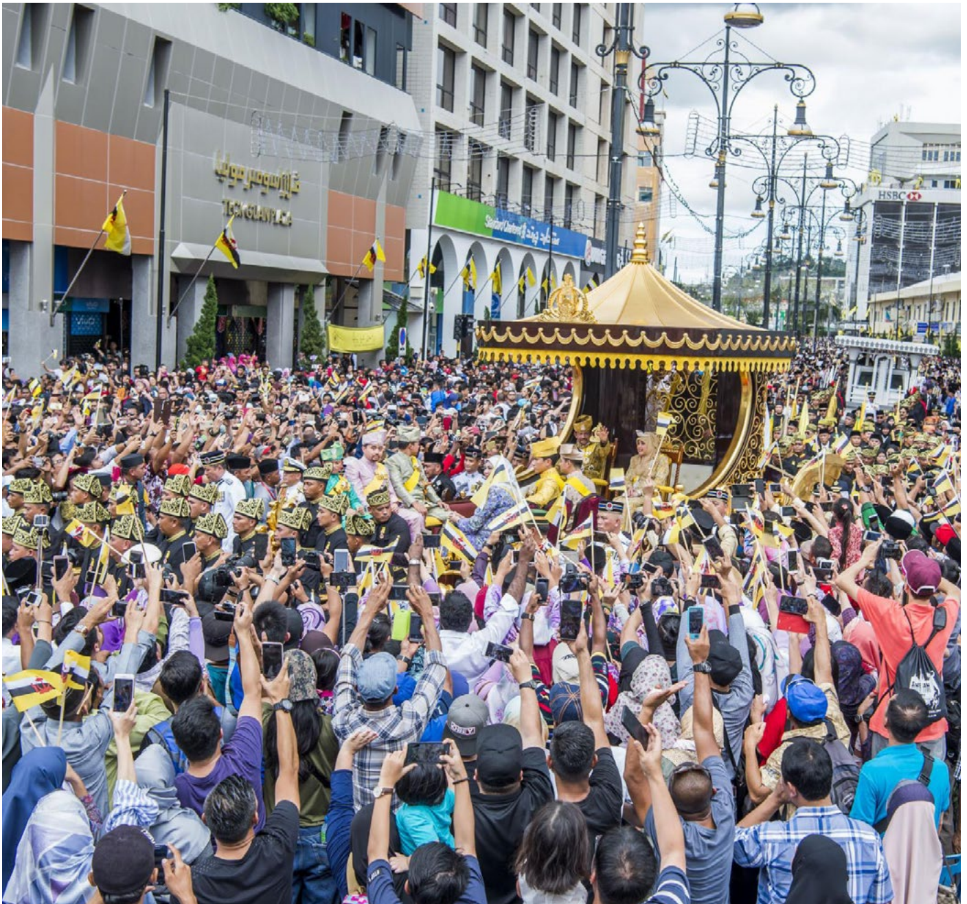
The glorious atmosphere in the city capital during the Royal Procession surrounding Bandar Seri Begawan in conjunction with the Golden Jubilee Celebration of His Majesty the Sultan and Yang Di-Pertuan of Brunei Darussalam's Accession to the Throne.

The cries of ' Daulat Tuanku ' (Long Live the King) during the procession was a sign of celebration of the sovereignty of the nation and the rule of the country, while serving loyalty to the beloved king, His Majesty Sultan Haji Hassanah Bolkiah Mu'izzaddin Waddaulah, Sultan and Yang Di-Pertuan of Brunei Darussalam.