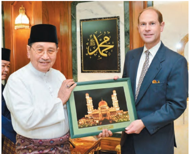
His Royal Highness Prince Edward, the Earl of Wessex receiving a gift from the Minister of Religious Affairs, Yang Berhormat Pehin Udana Khatib Dato Paduka Seri Setia Ustaz Haji Awang Badaruddin bin Pengarah Dato Paduka Haji Othman.

Mohammad Yusof, the Permanent Secretary at the Ministry of Home Affairs at the Bandar Seri Begawan Waterfront Promenade before starting their tour of the water village at the Kampong Ayer Cultural and Tourism Gallery, which was facilitated by Brunei Tourism. The Earl and Countess were shown a short video about the history, culture and way of life of Kampong Ayer before being brought around the gallery where they saw displays showcasing Kampong Ayer since the 10th century, and watched traditional games being played. Their Royal Highnesses enjoyed the panoramic view of Kampong Ayer and Bandar Seri Begawan including Brunei's new iconic landmark, the Sungai Kebun Bridge, from the observation tower.