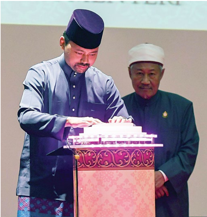
His Royal Highness Prince Haji Al-Muhtadee Billah ibni His Majesty Sultan Haji Hassanal Bolkiah Mu'izzaddin Waddaulah, the Crown Prince and Senior Minister at the Prime Minister's Office, as Chairman of the Autoriti Monetari Brunei Darussalam (AMBD) Board of Directors officiating the Launching Ceremony of the BND50 Commemorative Polymer Note, Commemorative Coins, the 5th Series of Coins in Circulation, and the State Mufti's Office publications.

BANDAR SERI BEGAWAN , October 4 – His Royal Highness Prince Haji Al-Muhtadee Billah ibni His Majesty Sultan Haji Hassanal Bolkiah Mu'izzaddin Waddaulah, the Crown Prince and Senior Minister at Prime Minister's Office, the Chairman of the Brunei Darussalam Monetary Authority (AMBD) Board of Directors consented to the Launching of the Special BND50 Commemorative Polymer Currency, Commemorative Coins and the 5th Series of Coins in Circulation and Books of the State Mufti Department (SMD) Publications 'Raja Melakar Sejarah' and 'The King Who Shapes History' in conjunction with the Golden Jubilee of His Majesty Sultan Haji Hassanal Bolkiah Mu'izzaddin Waddaulah, Sultan and Yang Di-Pertuan of Brunei Darussalam's Accession to the Throne.