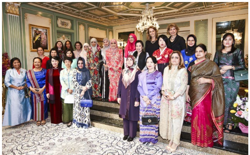
Female ambassadors and spouses of heads of diplomatic missions in Brunei Darussalam, who conveyed their greetings on the occasion of Her Majesty's birthday on October 7.