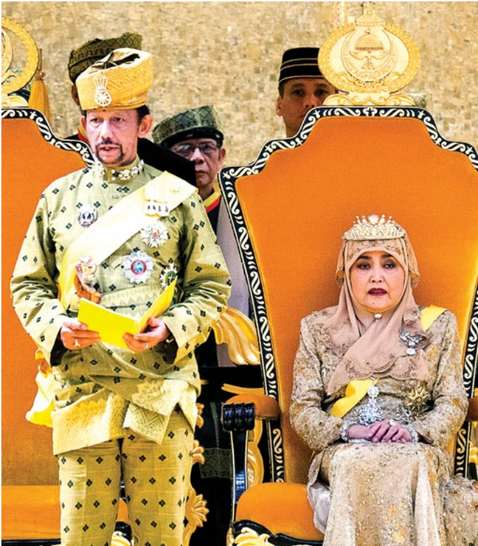
His Majesty Sultan Haji Hassanal Bolkiah Mu'izzaddin Waddaulah ibni Al-Marhum Sultan Haji Omar 'Ali Saifuddien Sa'adul Khairi Waddien, Sultan and Yang Di-Pertuan of Brunei Darussalam delivering a titah (royal Speech) during the Royal Audience Ceremony at the Balai Singgahsana, Istana Nurul Iman.

BANDAR SERI BEGAWAN , October 5 - His Majesty Sultan Haji Hassanal Bolkiah Mu'izzaddin Waddaulah ibni Al-Marhum Sultan Haji Omar 'Ali Saifuddien Sa'adul Khairi Waddien, Sultan and Yang Di-Pertuan of Brunei Darussalam emphasised in a titah (royal speech) that there are no barriers between the relationship of the sovereign and the people.