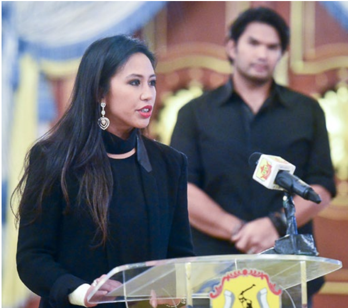
Her Royal Highness Princess' Azemah Ni'matul Bolkiah delivering a sabda (royal speech).