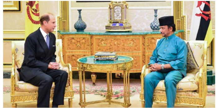
His Royal Highness Prince Edward, the Earl of Wessex on October 6.