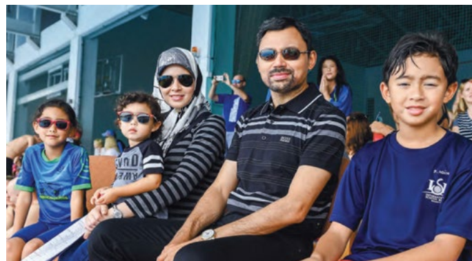
His Royal Highness Prince Doctor Haji Al-Muhtadee Billah, the Crown Prince and Senior Minister at the Prime Minister's Office, Her Royal Highness Paduka Seri Pengiran Anak Isteri Pengiran Anak Sarah, Yang Teramat Mulia Pengiran Muda 'Abdul Muntaqim, Yang Teramat Mulia Pengiran Anak Muneerah Madhul Bolkiah and Yang Teramat Mulia Pengiran Muda Muhammad Aiman during the ISB Sprints & Masters Swimming Championship.

As for the 50 Metre Freestyle and 50 Metre Breaststroke category, YTM managed to clock 36.91 seconds and 55.46 seconds