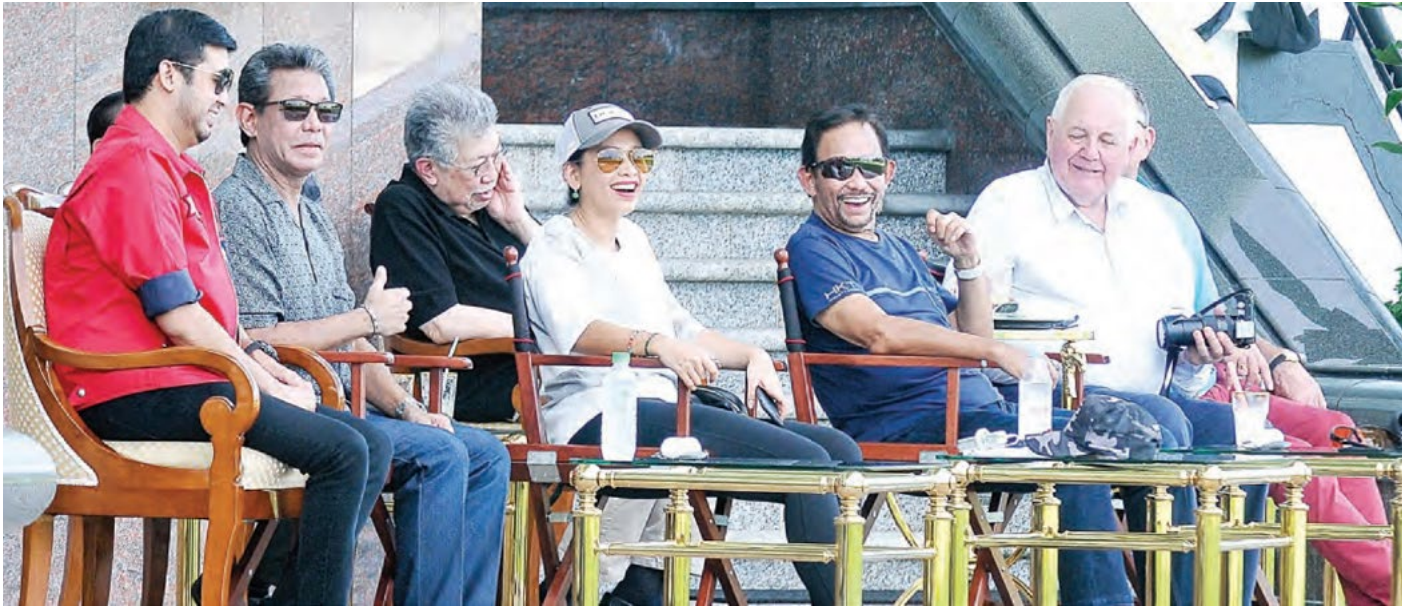
His Majesty Sultan Haji Hassanal Bolkiah Mu'izzaddin Waddaulah ibni Al-Marhum Sultan Haji Omar 'Ali Saifuddien Sa'adul Khairi Waddien, Sultan and Yang Di-Pertuan of Brunei Darussalam witnessing the polo match during the Opening of the Golden Jubilee Polo Tournament, accompanied by His Royal Highness Prince Haji Jefri Bolkiah, Her Royal Highness Princess Fadzilah Lubabul Bolkiah and Yang Amat Mulia Tunku Idris Iskandar Ismail ibni Duli Yang Maha Mulia Sultan Ibrahim.

JERUDONG , October 7 - 12 - In conjunction with the Golden Jubilee Celebration of His Majesty the Sultan and Yang Di-Pertuan of Brunei Darussalam's Accession to the Throne, the Golden Jubilee Polo Tournament was held at the Royal Brunei Polo and Riding Club, organised by the Royal Brunei Polo Association (RBPA) from October 7 - 12. It was also in conjunction with the 40th Anniversary of the Brunei Royal Polo Association (RBPA).