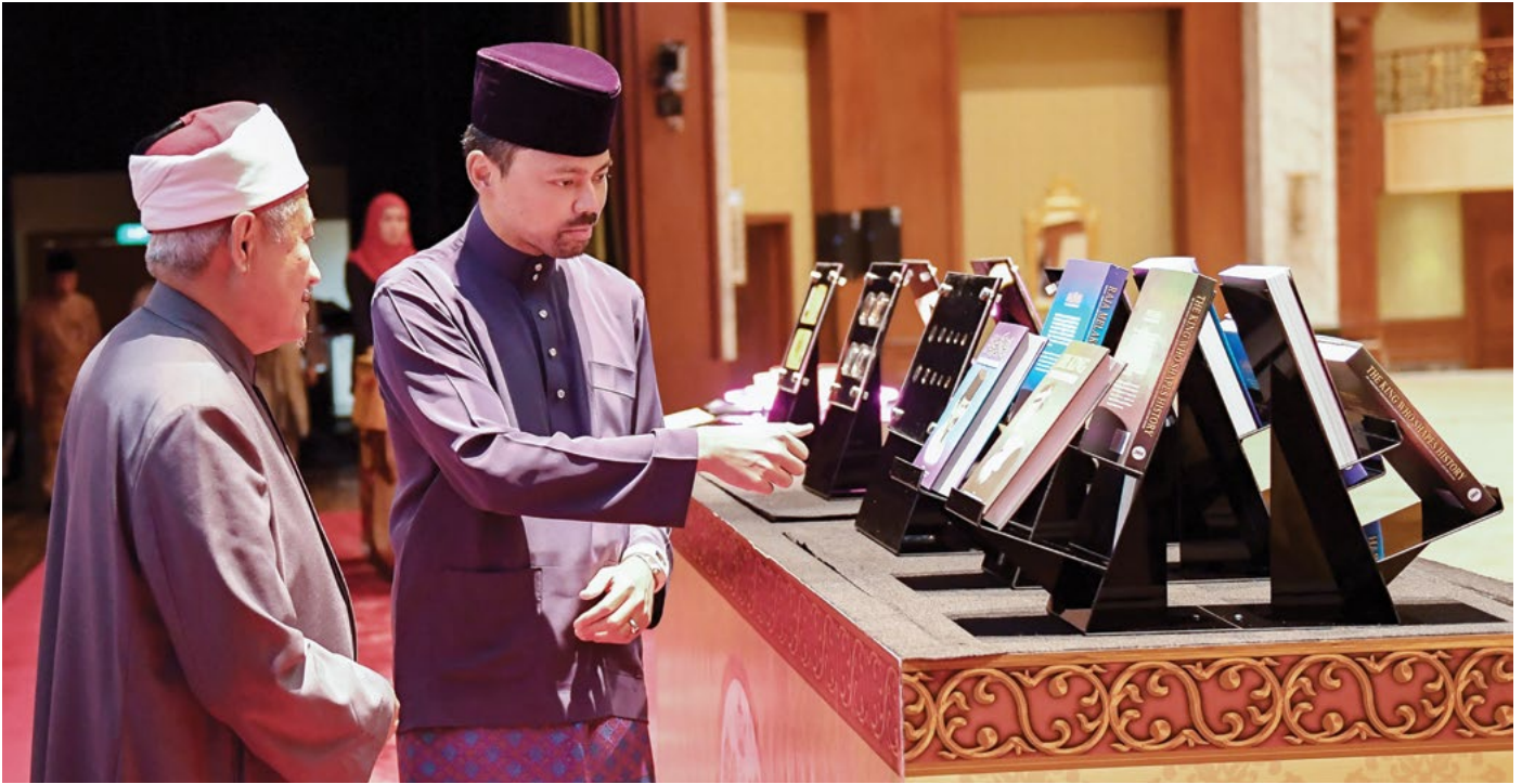
His Royal Highness the Crown Prince taking a closer look at the State Mufti's Office publications entitled ' Raja Melakar Sejarah ' and ' The King Who Shapes History '.

on the Malay Islamic Monarchy, progressing in various fields.