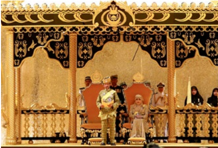
6. The close relationship between the sovereign and the people, with no barriers in between