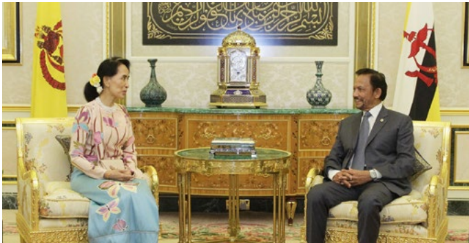
Her Excellency Daw Aung San Suu Kyi, the State Counsellor of the Republic of the Union of Myanmar on October 7.