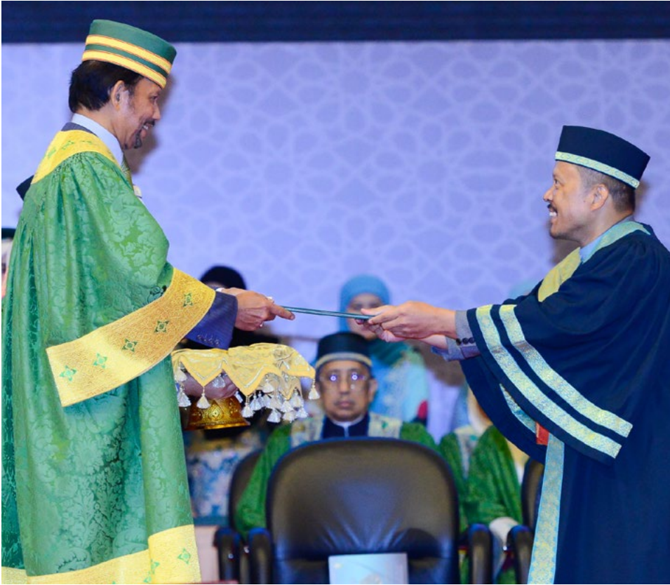
His Majesty Sultan Haji Hassanal Bolkiah Mu'izzaddin Waddaulah ibni Al-Marhum Sultan Haji Omar 'Ali Saifuddien Sa'adul Khairi Waddien, Sultan and Yang Di-Pertuan of Brunei Darussalam presenting a certificate to one of the graduates during the convocation ceremony.