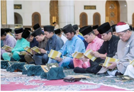
4. Prayer and gratitude for His Majesty