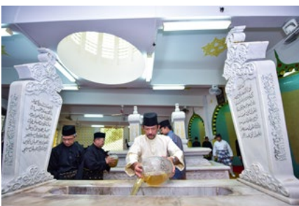
19. His Majesty attends Tahlil Ceremony at the Royal Mausoleum