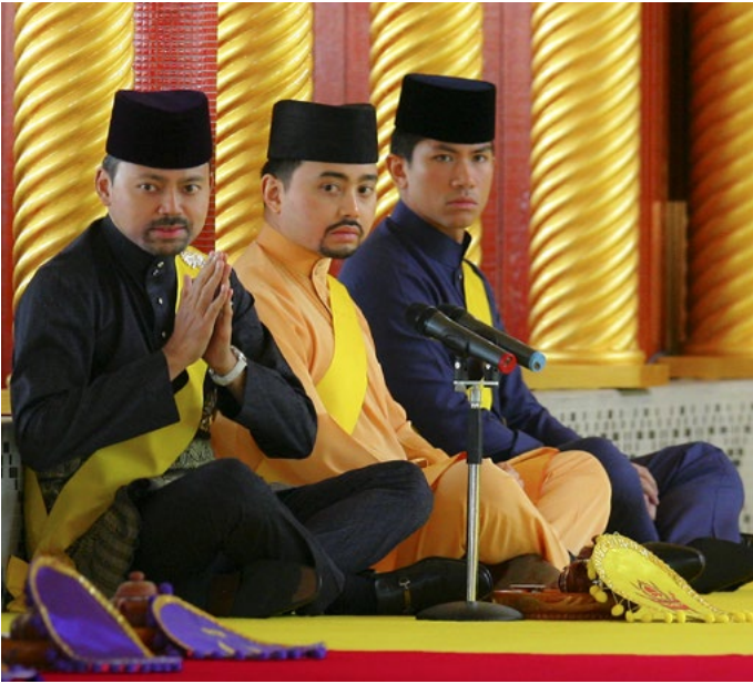
His Royal Highness Prince Haji Al-Muhtadee Billah, the Crown Prince and Senior Minister at the Prime Minister's Office, His Royal Highness Prince 'Abdul Malik and His Royal Highness Prince 'Abdul Mateen during the opening of the Majlis Istiadat Gendang Jaga-Jaga .

BANDAR SERI BEGAWAN , October 3 - 8 - The Golden Jubilee Celebration of His Majesty the Sultan and Yang Di-Pertuan of Brunei Darussalam's Accession to the Throne began with the Majlis Istiadat Membuka Gendang Jaga-Jaga or the Opening of the Playing of Traditional Musical Instruments at the Lapau (Royal Ceremonial Hall) in Bandar Seri Begawan.