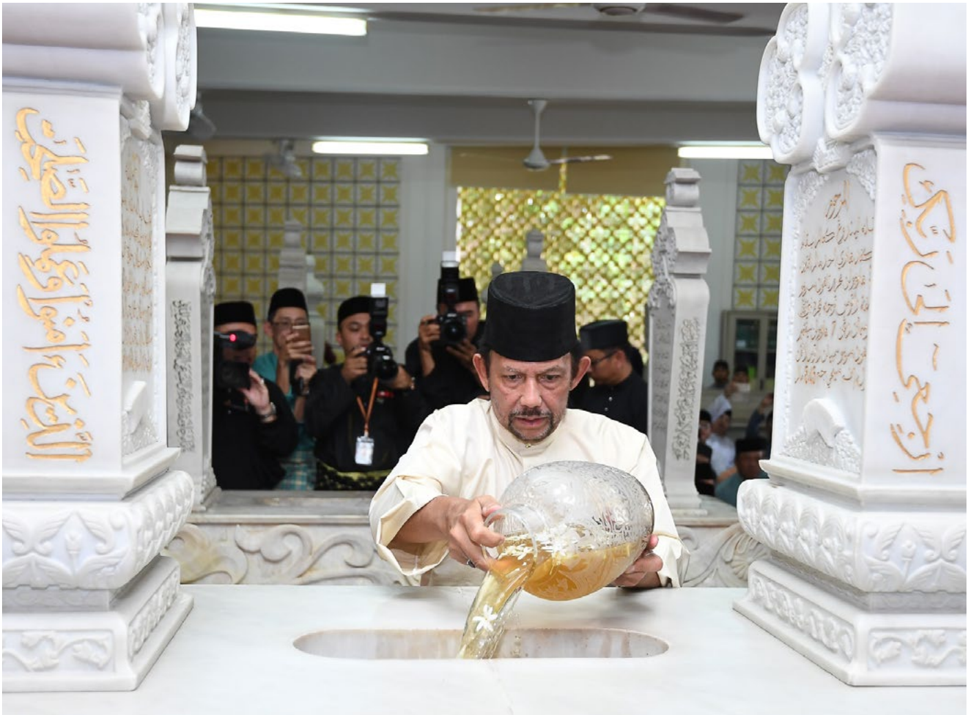
His Majesty Sultan Haji Hassanal Bolkiah Mu'izzaddin Waddaulah ibni Al-Marhum Sultan Haji Omar 'Ali Saifuddien Sa'adul Khairi Waddien, Sultan and Yang Di-Pertuan of Brunei Darussalam pouring the 'Ayeng Asah-Asahan' (scented water) on the tomb of Al-Marhum Sultan Haji Omar 'Ali Saifuddien Sa'adul Khairi Waddien ibni Al-Marhum Sultan Muhammad Jamalul Alam.

BANDAR SERI BEGAWAN , October 18 - His Majesty Sultan Haji Hassanal Bolkiah Mu'izzaddin Waddaulah ibni Al-Marhum Sultan Haji Omar 'Ali Saifuddien Sa'adul Khairi Waddien, Sultan and Yang Di-Pertuan of Brunei Darussalam consented to attend the Tahliil Ceremony at the Royal Mausoleum, Jalan Tutong.