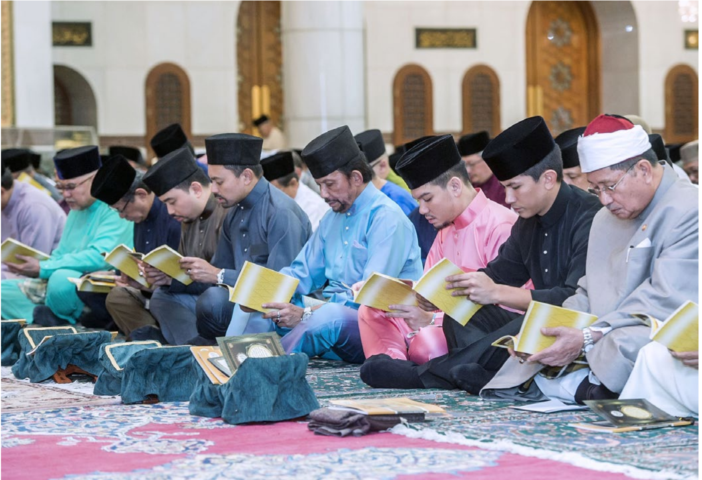
His Majesty Sultan Haji Hassanal Bolkiah Mu'izzaddin Waddaulah ibni Al-Marhum Sultan Haji Omar 'Ali Saifuddien Sa'adul Khairi Waddien, Sultan and Yang Di-Pertuan of Brunei Darussalam and members of the Royal Family during the recitation of Surah Al-Waqi'ah , Surah Al-Mulk , Tahlil and Doa Kesyukuran .

BANDAR SERI BEGAWAN , October 4 - 50 years in ruling and governing a country is an extensive period of time, whereby Brunei Darussalam has become competitive in terms of development and development of infrastructure, technology, socio-economic and so on.