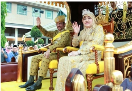
8. The Procession Ceremony surrounding BSB creates historical moment