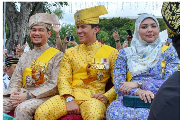
Also seated on board the Royal Chariot were His Royal Highness Prince Haji Al-Muhtadee Billah, the Crown Prince and Senior Minister at the Prime Minister's Office; His Royal Highness Prince Haji 'Abdul 'Azim; His Royal Highness Prince 'Abdul Malik; His Royal Highness Prince 'Abdul Mateen; His Royal Highness Prince Abdul Wakeel; and Her Royal Highness Princess Hajah Rashidah Sa'adatul Bolkiah.