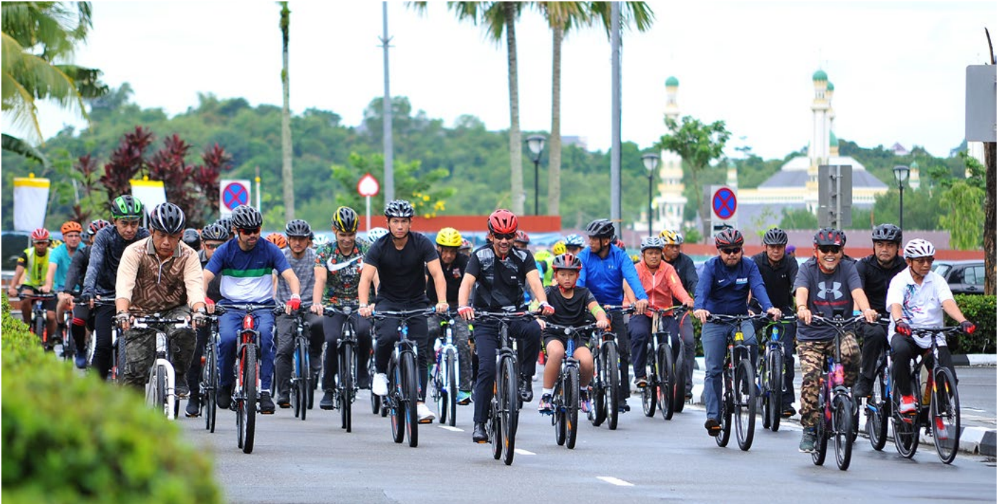
His Majesty Sultan Haji Hassanal Bolkiah Mu'izzaddin Waddaulah ibni Al-Marhum Sultan Haji Omar 'Ali Saifuddien Sa'adul Khairi Waddien, Sultan and Yang Di-Pertuan of Brunei Darussalam, His Royal Highness Prince Haji Al-Muhtadee Billah, the Crown Prince and Senior Minister at the Prime Minister's Office and members of the Royal Family joining the public in the Golden Jubilee Recreational Cycling event.

BANDAR SERI BEGAWAN , October 8 - His Majesty Sultan Haji Hassanal Bolkiah Mu'izzaddin Waddaulah ibni Al-Marhum Sultan Haji Omar 'Ali Saifuddien Sa'adul Khairi Waddien, Sultan and Yang Di-Pertuan of Brunei Darussalam was pleased to attend the Golden Jubilee Recreation Cycling event in conjunction with the Golden Jubilee Celebration of His Majesty the Sultan and Yang Di-Pertuan of Brunei Darussalam's Accession to the Throne.