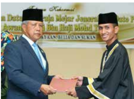
15 MCYS sets holistic youth development program strategies