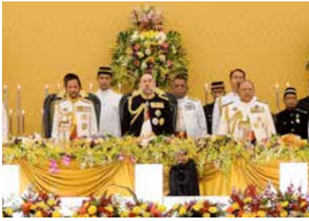
1 Consents to attend Royal Banquet