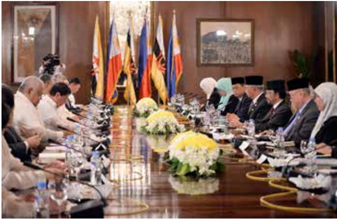
His Majesty The Sultan and Yang Di-Pertuan of Brunei Darussalam and President of the Philippines during the bilateral meeting.