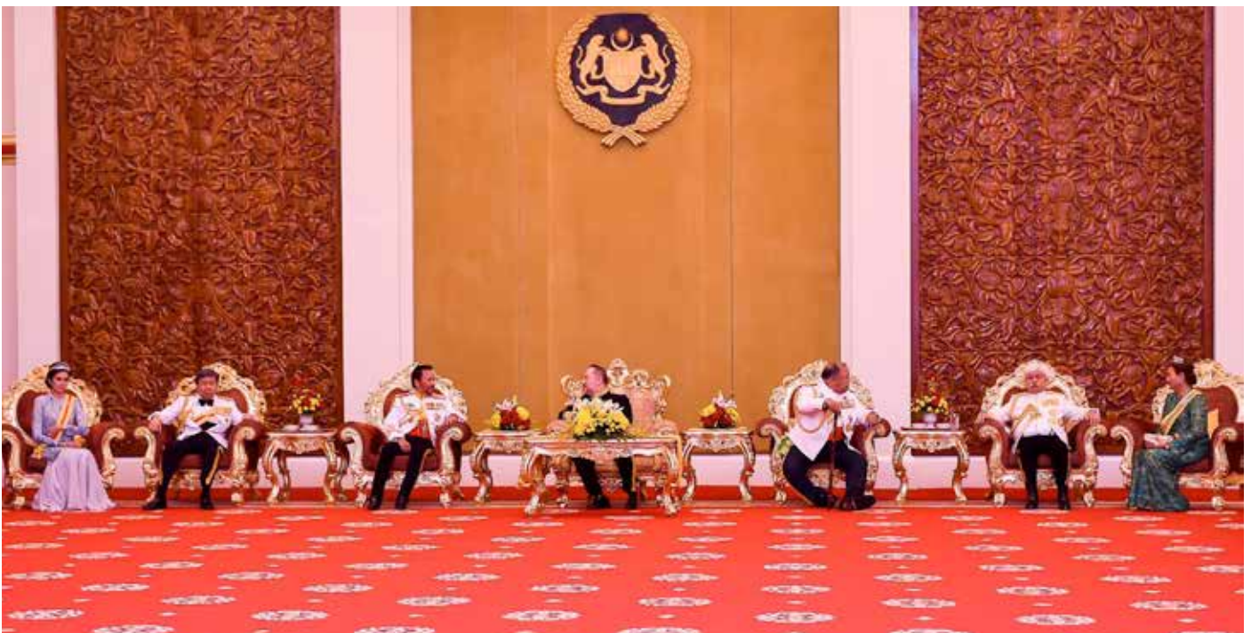
His Majesty The Sultan and Yang Di-Pertuan of Brunei Darussalam in a conversation with His Majesty the 15 th Yang Di-Pertuan Agong of Malaysia, Sultan Muhammad V and other Royal guests.