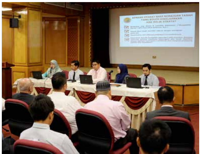
The Strata Title Act briefing was attended by officers from the Land Department and the Survey Department held at the Bertabur Hall, 1st Floor, Ministry of Development.

The Land Code Act (Strata) Chapter 189 was