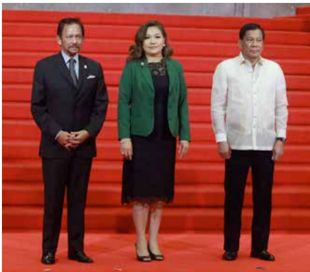
His Majesty The Sultan and Yang Di-Pertuan of Brunei Darussalam welcomed by His Excellency Rodrigo Roa Duterte, President of the Republic of the Philippines and Chairman of ASEAN and Madame Cielito Avanceña at the Official Opening Ceremony of the 30 th ASEAN Summit held at the Philippine International Conference Center (PICC), Manila.