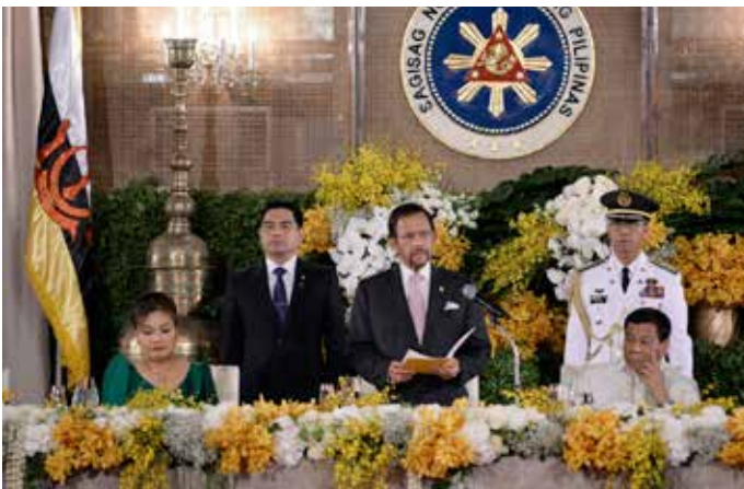
His Majesty The Sultan and Yang Di-Pertuan of Brunei Darussalam delivering a titah (royal speech) at a banquet hosted by His Excellency Rodrigo Roa Duterte, President of the Republic of the Philippines held at the Malacañan Palace.