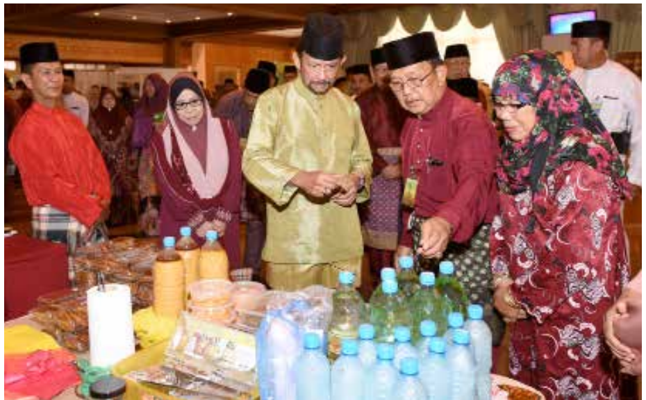
His Majesty The Sultan and Yang Di-Pertuan of Brunei Darussalam listens to a briefing from one of the local entrepreneurs at the halal products exhibition in conjunction with the Isra' and Mi'raj celebration.

The Minister of Religious Affairs, in his speech said that the Israk and Mikraj celebration, highlights the importance of faith and piety with a series of words 'Strong Faith, Solid Practice' ( 'Iman Teguh Akidah Kukuh' ) which among other illustrates