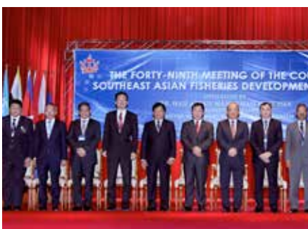
18 Brunei host 49 th SEAFDEC meeting