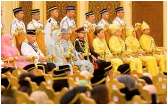
His Royal Highness The Crown Prince and Malaysia's State Rulers as well as other royal family members at the Installation Ceremony of His Majesty the 15 th Yang Di-Pertuan Agong of Malaysia, Sultan Muhammad V.