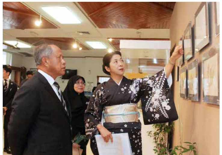
The Minister of Culture, Youth and Sports officiating the exhibition.