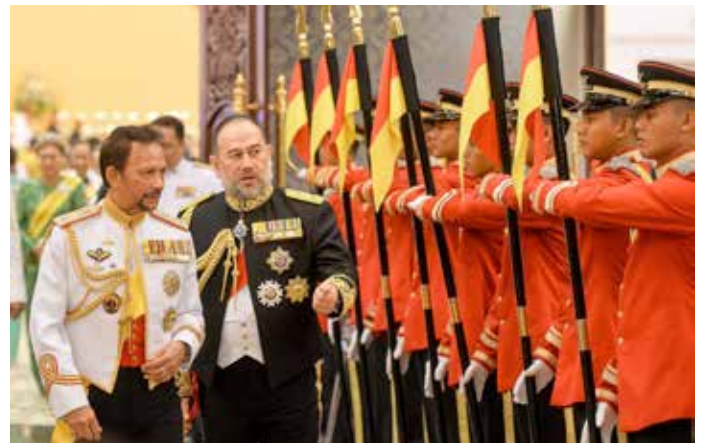
His Majesty The Sultan and Yang Di-Pertuan of Brunei Darussalam proceeded to Seri Negara Hall with His Majesty the Yang Di-Pertuan Agong and Their Royal Highnesses the State Rulers and their Consorts.