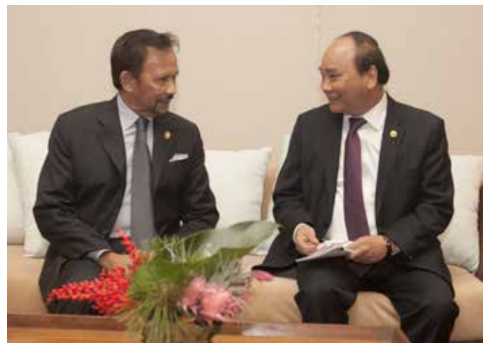
His Majesty The Sultan and Yang Di-Pertuan of Brunei Darussalam receiving a courtesy visit and held separate bilateral talks with His Excellency Daw Aung San Suu Kyi, State Counselor of the Republic of Myanmar; and His Excellency Nguyen Xan Phuc, Prime Minister of the Socialist Republic of Viet Nam at the Leaders Holding Room, Philippine International Convention Center (PICC).