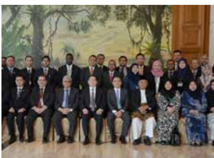
16 The use of Sukuk as a method of financing