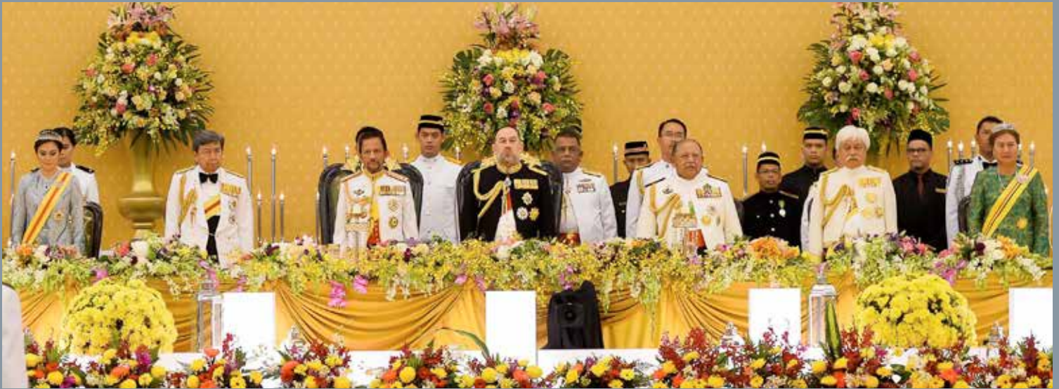
His Majesty Sultan Haji Hassanal Bolkhiah Mu'izzaddin Waddaulah ibni Al-Marhum Sultan Haji Omar 'Ali Saifuddien Sa'adul Khairi Waddien, The Sultan and Yang Di-Pertuan of Brunei Darussalam consented to attend the Royal Banquet in conjunction with the Installation of His Majesty the 15th Yang Di-Pertuan Agong of Malaysia, Sultan Muhammad V held at the Dewan Santapan, Istana Negara, Kuala Lumpur.