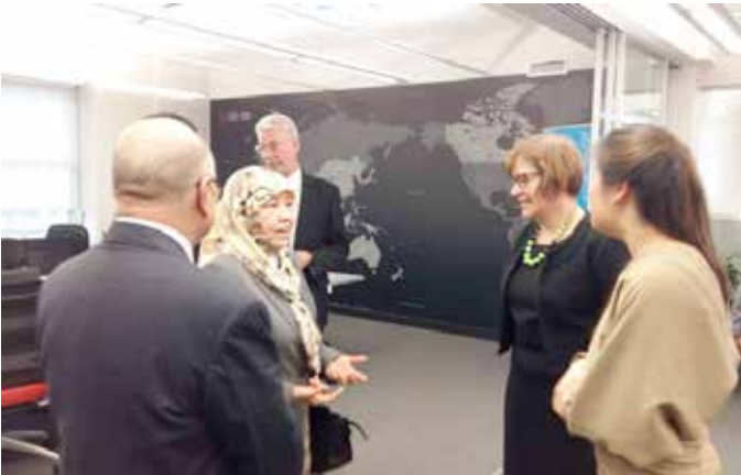
Her Royal Highness was presented with a briefing on the role of the institution.

Her Royal Highness' visit coincided with Canada's 150 th anniversary of Confederation and the 40 th anniversary of Asean – Canada Dialogue Relations this year.