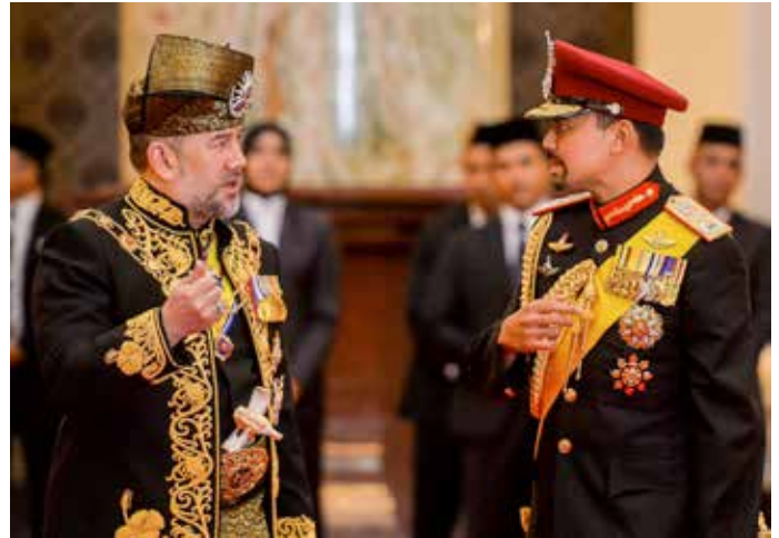
His Royal Highness Prince Haji Al-Muhtadee Billah ibni His Majesty Sultan Haji Hassanal Bolkiah Mu'izzaddin Waddaulah, the Crown Prince and Senior Minister at the Prime Minister's Office as a personal representative of His Majesty The Sultan and Yang Di-Pertuan of Brunei Darussalam with His Majesty the 15 th Yang Di-Pertuan Agong of Malaysia, Sultan Muhammad V.

The Installation Ceremony was attended by Malaysia's State Rulers and royal family members; as well as Their Excellences the Yang-Di-Pertua-Yang-Di-Pertua Negeri; Yang Amat Berhormat Prime Minister; Yang Amat Berhormat Deputy Prime Minister; Cabinet Ministers; Chief