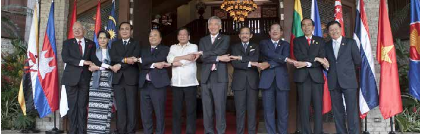
His Majesty The Sultan and Yang Di-Pertuan of Brunei Darussalam together with other ASEAN Heads of State and Government in a group photo session.