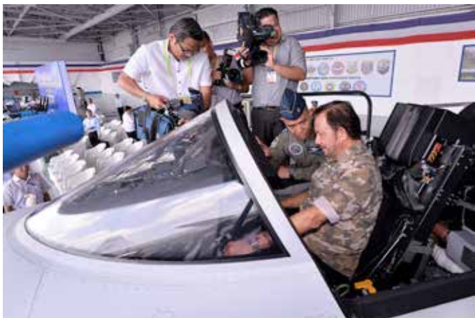
His Majesty The Sultan and Yang Di-Pertuan of Brunei Darussalam, Minister of Defence and Supreme Commander of the Royal Brunei Armed Forces, on board the Philippines Air Force FA-50 jet aircraft at the Air Force City Clark, Pampanga, Philippines.