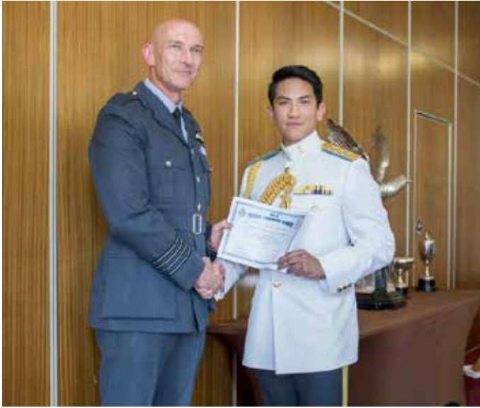
His Royal Highness Prince Captain 'Abdul Mateen receiving his certificate after successfully completing the Instrument Flying Test.

UNITED KINGDOM, April 28 - His Royal Highness Prince Captain 'Abdul Mateen ibni His Majesty Sultan Haji Hassanal Bolkiah Mu'izzaddin Waddaulah has consented to receive a Certificate of Completion after successfully concluding his Elementary Flying Training (EFT) Course No. Two Hundred (200) at a graduation ceremony held at the Daedalus Officers Mess, Royal Air Force (RAF) Cranwell, United Kingdom.