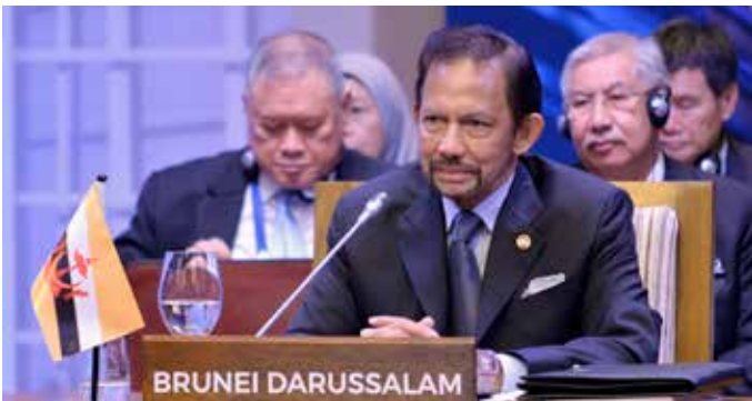
His Majesty The Sultan and Yang Di-Pertuan of Brunei Darussalam during a meeting at a Plenary Session of the 30 th ASEAN Summit at the Philippine International Convention Center (PICC).

His Majesty was of the view that ASEAN and its partners should further strengthen its cooperation to conclude the Regional Comprehensive Economic Partnership (RCEP). This would convey a strong message of ASEAN's commitment towards regional integration and to a rules-based trading system.