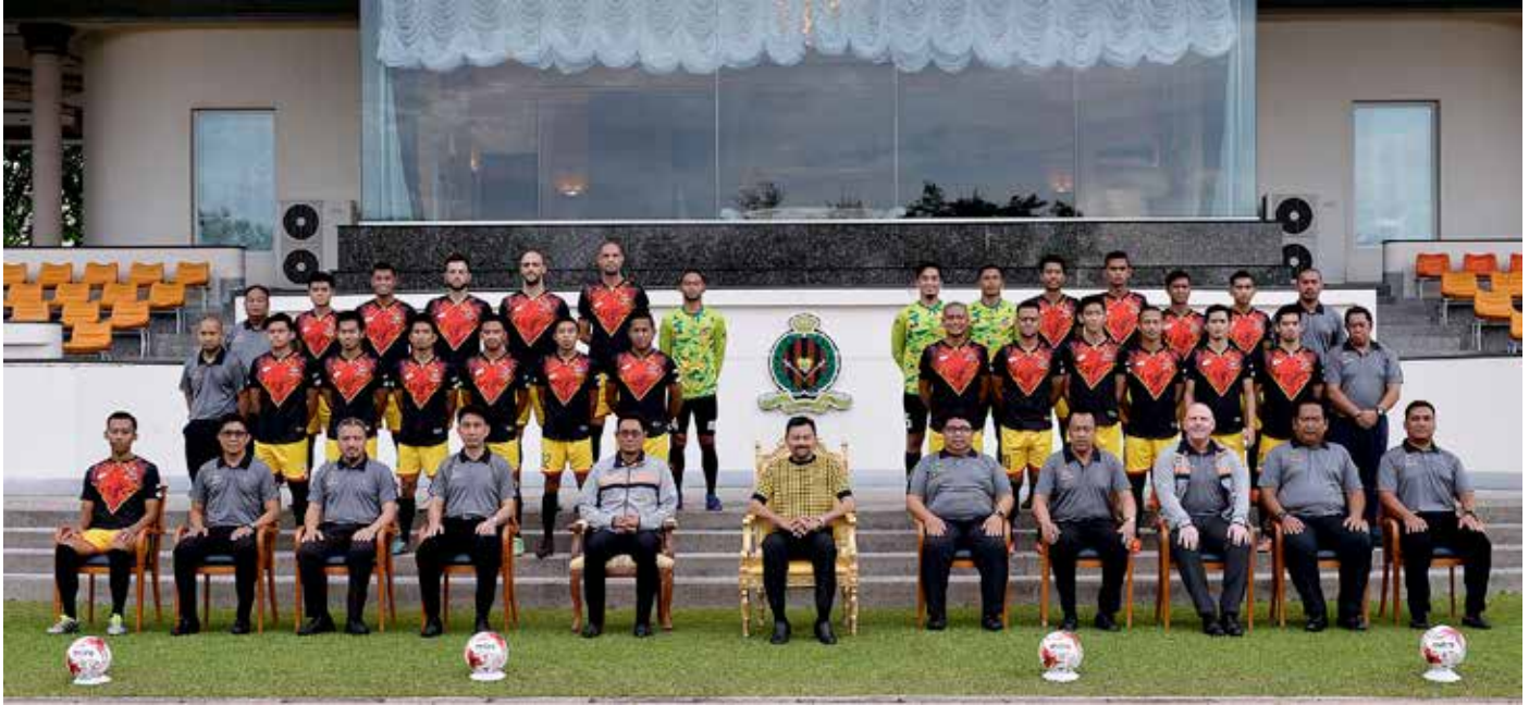
His Royal Highness Prince Haji Al-Muhtadee Billah attended a team photo session with Brunei DPMM FC for the 2017 season at the Mini Stadium, Jerudong.

JERUDONG, April 5 - His Royal Highness Prince Haji Al-Muhtadee Billah ibni His Majesty Sultan Haji Hassanal Bolkiah Mu'izzaddin Waddaulah, The Crown Prince and Senior Minister at the Prime Minister's Office, Chairman of Brunei DPMM FC Football Club consented to attend a team photo session with Brunei DPMM FC for the 2017 season at the Mini Stadium, Jerudong.