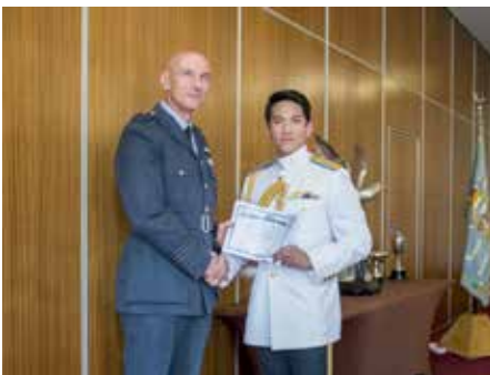
12 His Royal Highness receives certificate of Completion of Elementary Flying Training Course