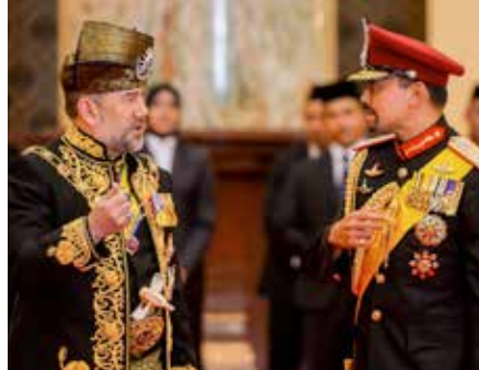
10 Crown Prince attends Installation Ceremony of His Majesty the 15 th Yang Di-Pertuan Agong of Malaysia