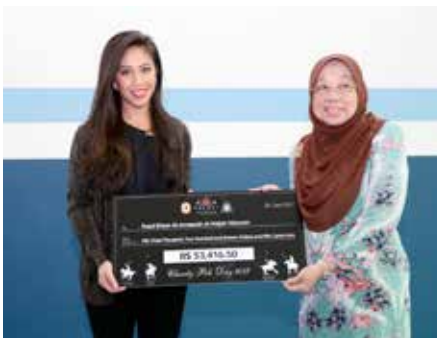
12 Pusat Ehsan receives donation