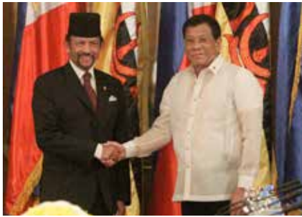
1 State visit to Manila