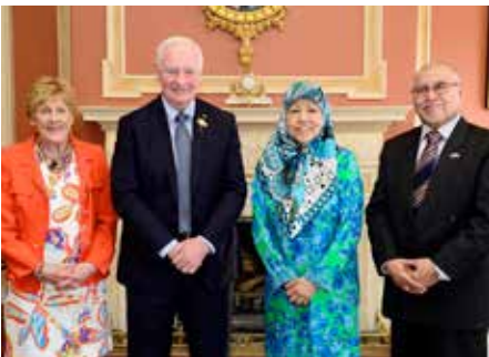
13 Brunei – Canada relationship cooperation remains solid