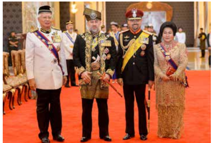
His Royal Highness The Crown Prince as a personal representative of His Majesty The Sultan and Yang Di-Pertuan of Brunei Darussalam with His Majesty the 15 th Yang Di-Pertuan Agong of Malaysia, Sultan Muhammad V and Yang Amat Berhormat Dato Laila Utama Dato' Sri Mohd. Najib bin Tun Haji Abdul Razak, The Prime Minister of Malaysia and spouse Yang Amat Berbahagia Datin Seri Rosmah Mansor.

Ministers; representatives of foreign nations, and local and foreign dignitaries, along with their spouses.