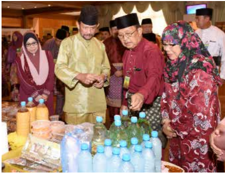
8 His Majesty attends Isra' and Mi'raj celebration