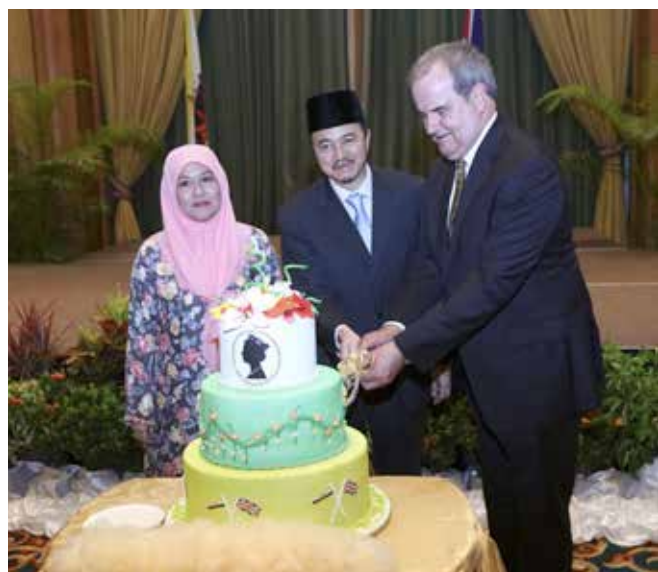
The Minister of Development and the British High Commissioner to Brunei Darussalam cutting a cake in celebration of the 91 st Birthday of Her Majesty Queen Elizabeth II.