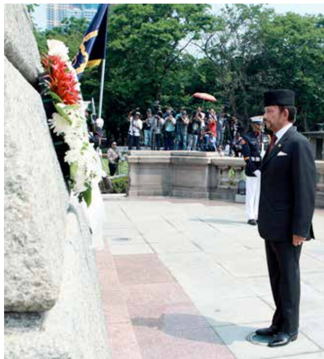
His Majesty The Sultan and Yang Di-Pertuan of Brunei Darussalam after laying a wreath at a monument at the Rizal Memorial Park.

His Majesty next visited Air Force City Clark, Pampanga on April 28. Upon arrival, His Majesty walked past a Static Guard of Honor, and proceeded to the Haribon Hangar for a close inspection of the Philippine Air Force's FA-50 jet aircraft. The monarch was then invited to go onboard a jet aircraft.