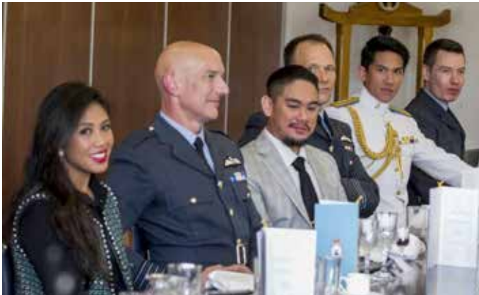
Present at the graduation ceremony were His Royal Highness Prince Haji 'Abdul Azim and Her Royal Highness Princess 'Azemah Ni'matul Bolkiah.