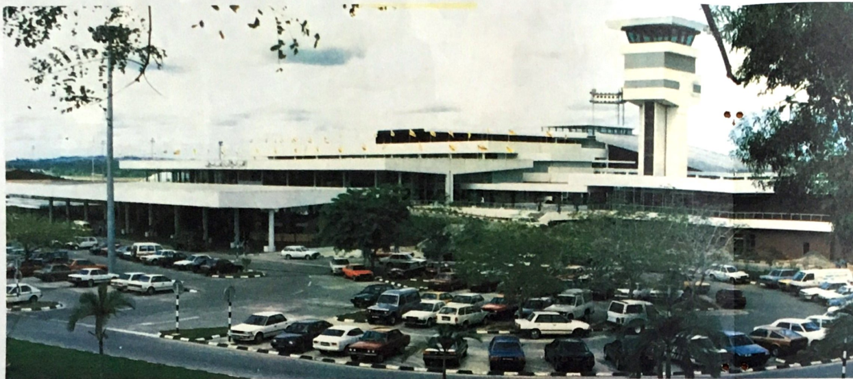
General view of the Brunei International Airport.