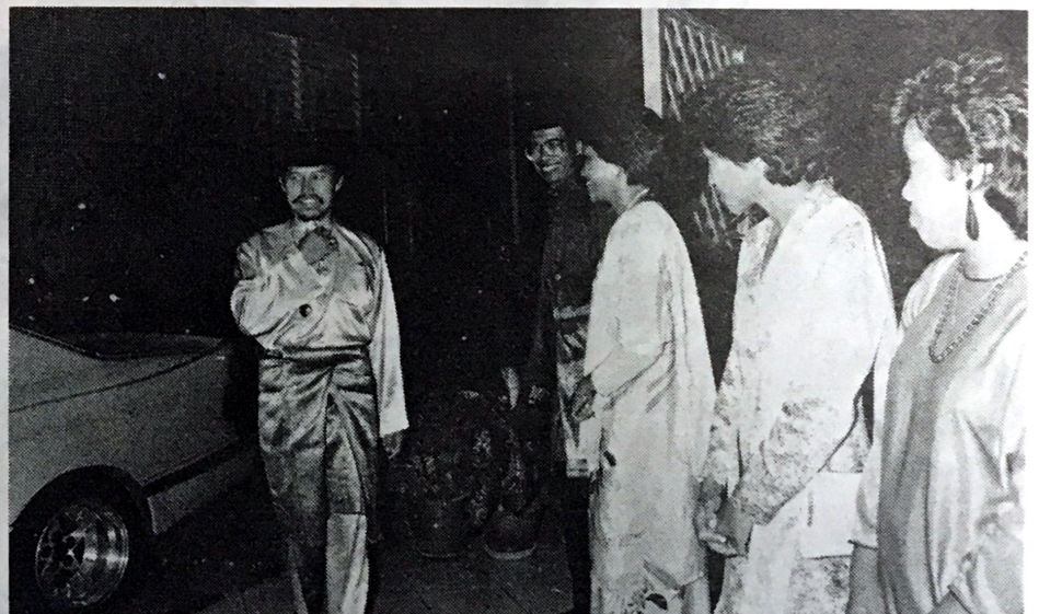
HRH Paduka Seri Pengiran Perdana Wazir Sahibul Himmah Wal-Waqar Pengiran Muda Haji Mohamed Bolkiah (left) is received by the Acting Malaysian High Commissioner (2nd left) and his staff on arrival to the celebrations.