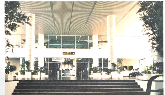
The public area where outgoing travellers may be seen off