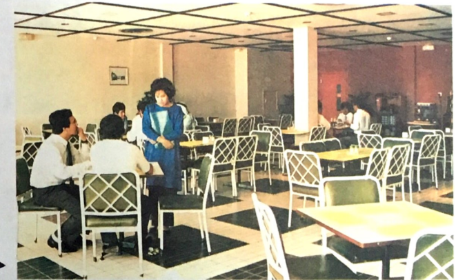
The airport restaurant affords an excellent view of aircraft taking off and landing.

C ivil aviation in Brunei Darussalam has definitely taken altitudes of improvement with the completion of the extension works to the Brunei International Airport near Bandar Seri Begawan.