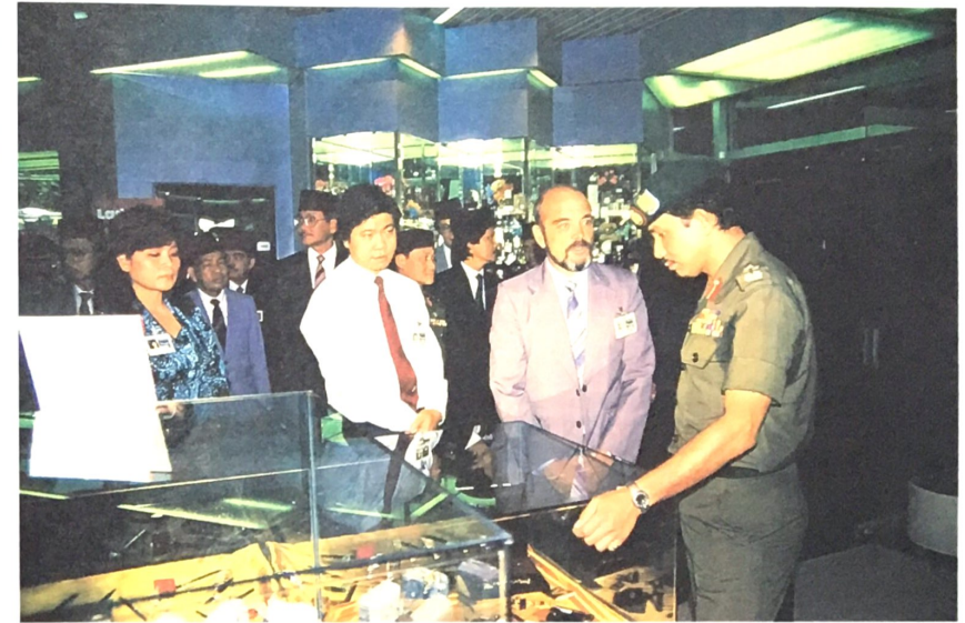
His Majesty the Sultan and Yang Di-Pertuan Negara Brunei Darussalam browses at the airport shopping arcade during an official visit.