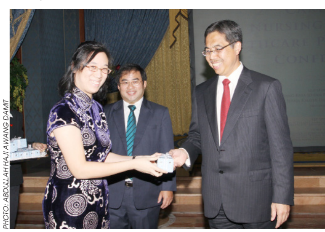
Minister of Health presents a token of appreciation to one of the speakers at the conference.

About 50 participants comprising of directors, deputy directors, assistant directors, senior officers and departments from the ministry attended the three-day workshop.