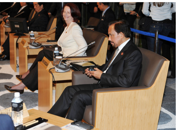
His Majesty welcomes the admission of Malaysia and Vietnam to Trans-Pacific Partnership.

His Majesty with His Excellency the Prime Minister of Canada.