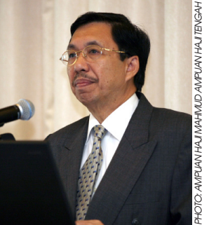
Minister of Culture, Youth & Sports said data base atheletes would be on able to assist in improving performance of athletes.

The meeting was aimed to find out the developments and the planning of the national sports associations in the sport development especially on preparations for regional and international participation.