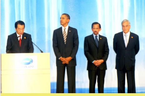
His Majesty attends 18th APEC Meeting