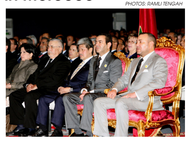
His Royal Highness attends the Opening Ceremony of the 10^{th} Tourism Forum in Menara Square (above).

Their Royal Highnesses attend a dinner held at El-Badii Palace (left).