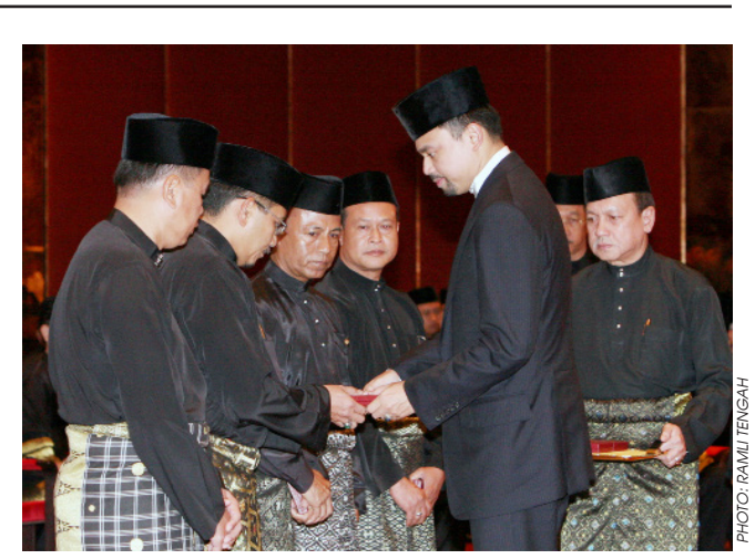
His Royal Highness presents the honorary medals.

The ceremony took place at the Istana Nurul Iman.