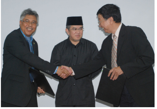
One of the recipients of Aiti Grant Scheme (right).

BANDAR SERI BEGAWAN, November 26 - The Authority for Info-communication Technology Industry for Brunei Darussalam (AiTi) marked another milestone in promoting the local infocommunications technology (ICT) industry by awarding the AiTi Grant