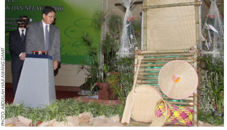
Minister of Industry and Primary Resources expressed his hope for farmers and fishermen to fully utilise resources made available by the aovernment.