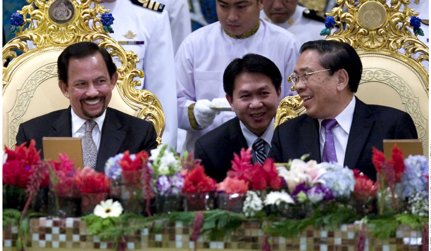
His Majesty and His Excellency share a light moment at the state banquet.