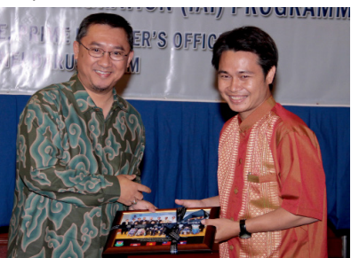
A participant receives his certificate from the Deputy Permanent Secretary (left).

The ceremony was held at Rizqun International Hotel.