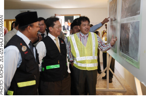
The Minister of Development looks on a display of several projects carried out by the Public Works Department.

BANDAR SERI BEGAWAN, November 20 - An amount of $167.45 million have been allocated for the implementation of 31 drainage projects. These projects are categorised to five sectors namely; 20 flood prevention projects amounting to $123.5 million; three coastal protection projects - $35.95 million; three hydrology data projects $3.5 million; four possible research projects - $1.5 million; and one asset management project - $3 million.