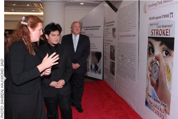
His Royal Highness takes a closer look at an exhibition organised for the anaugural International Neurology Scientific Conference.

BANDAR SERI BEGAWAN. November 12 - In order to realise our objective to provide all those in need with the best possible medical care, we must strive to ensure that our medical institutions are recognised as being on par with their best international counterparts. In this regard, we should never be apprehensive of learning from and collaborating with other centres of excellence in order to achieve our objectives.