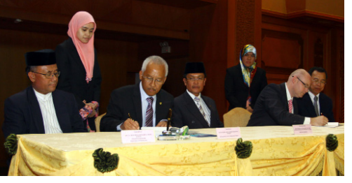
Signing ceremony between Ministry of Education and Edexcel Pearson Company.

GADONG, November 4 – With the qualification such as Programme Edexcel Business and Technical Education Council (BTEC), students will be able to enter the job market equipped with skills and knowledge.