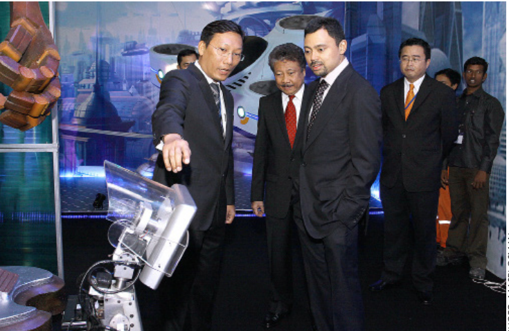
His Royal Highness looks on one of the technologies showcased at TechXpo 2010.