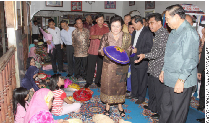
His Excellency and wife at one of the homes of Kampung Tamoi at Kampung Ayer showcasing traditional arts and handicrafts.

Speaking on the theme of the `Farmers and Fishermen's Day 2010' which is 'Food Generated, Nation Secured', it is suitable as it appreciates the deeds of farmers and fishermen as the nation's food generator.