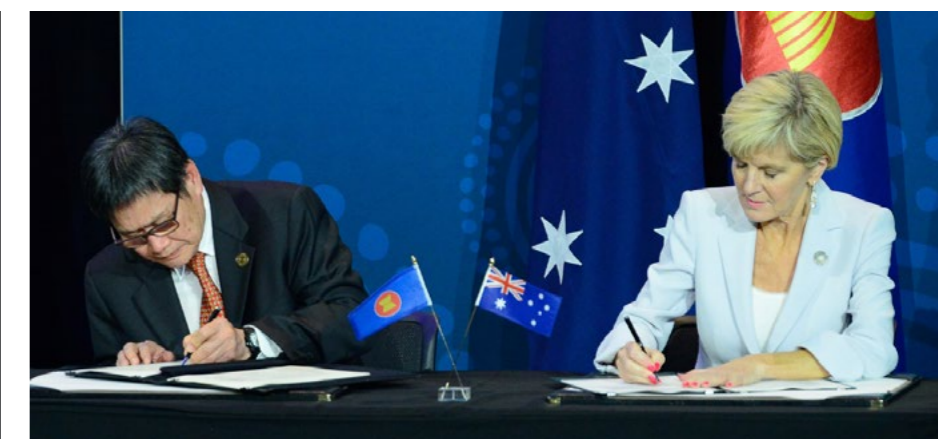
The signing of the Memorandum of Understanding on Counter-Terrorism between ASEAN and Australia, on behalf of ASEAN was His Excellency Dato Paduka Lim Jock Hoi, Secretary-General of ASEAN, and on behalf of Australia was The Honourable Julie Bishop MP, Minister of Foreign Affairs of Australia.

SYDNEY, AUSTRALIA, March 17 - His Majesty Sultan Haji Hassanal Bolkiah Mu'izzaddin Waddaulah ibni Al-Marhum Sultan Haji Omar 'Ali Saifuddien Sa'adul Khairi Waddien, Sultan and Yang Di-Pertuan of Brunei Darussalam, attended the Closing of the Counter-Terrorism Conference held at International Convention Centre Sydney.