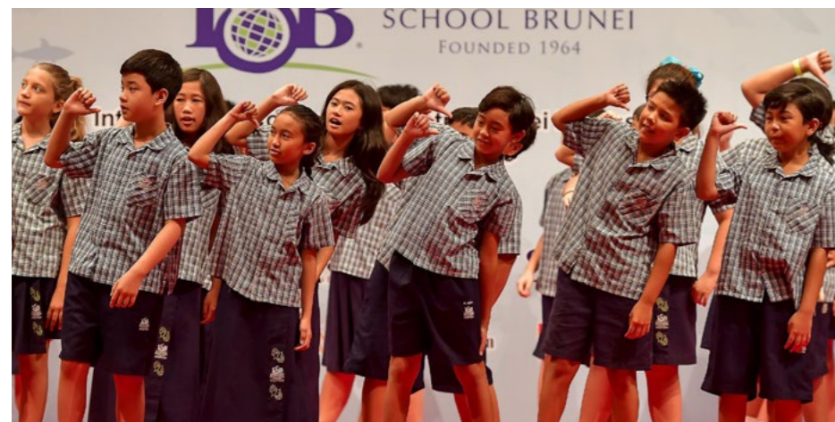
Yang Teramat Mulia Pengiran Muda 'Abdul Muntaqim ibni Duli Yang Teramat Mulia Paduka Seri Pengiran Muda Mahkota Pengiran Muda Haji Al-Muhtadee Billah performing at the 14 th International School Brunei Borneo Global Issues Conference (ISB-BGIC).

The four-day conference was attended by almost 300 secondary students from over 20 local and international schools across the country.