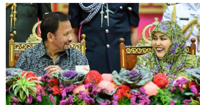
His Majesty Sultan Haji Hassanal Bolkiah Mu'izzaddin Waddaulah ibni Al-Marhum Sultan Haji Omar 'Ali Saifuddien Sa'adul Khairi Waddien, Sultan and Yang Di-Pertuan of Darussalam, and Her Majesty Duli Raja Isteri Pengiran Anak Hajah Saleha binti Al-Marhum Pengiran Pemancha Pengiran Anak Haji Mohamed Alam, during the get-together marking the Chinese New Year 2018.

Accompanying Their Majesties were His Royal Highness Prince Haji Al-Muhtadee Billah, the Crown Prince and Her Royal Highness Paduka Seri Pengiran Anak Isteri Pengiran Anak Sarah; His Royal Highness Prince 'Abdul Malik, His Royal Highness Prince Mohamed Bolkiah, His Royal Highness Prince Haji Sufri Bolkiah, His Royal Highness Prince Haji Jefri Bolkiah,