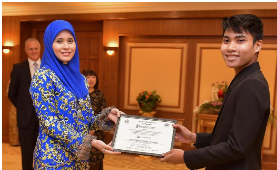
Her Royal Highness presenting a certificate of participation to one of the participants.

added that His Majesty's government has made concerted efforts to protect the country's maritime environment with initiatives like: Marine Protected Areas to conserve the coral reef ecosystem and fisheries productivity; being one of the first Asian country in banning the sale and import of all shark fin products; and the opening of the Marine Biodiversity Centre to rehabilitate and treat any marine life that is caught or discovered. Her Royal Highness went on to say that education campaigns regarding waste disposal have also been going strong for decades.