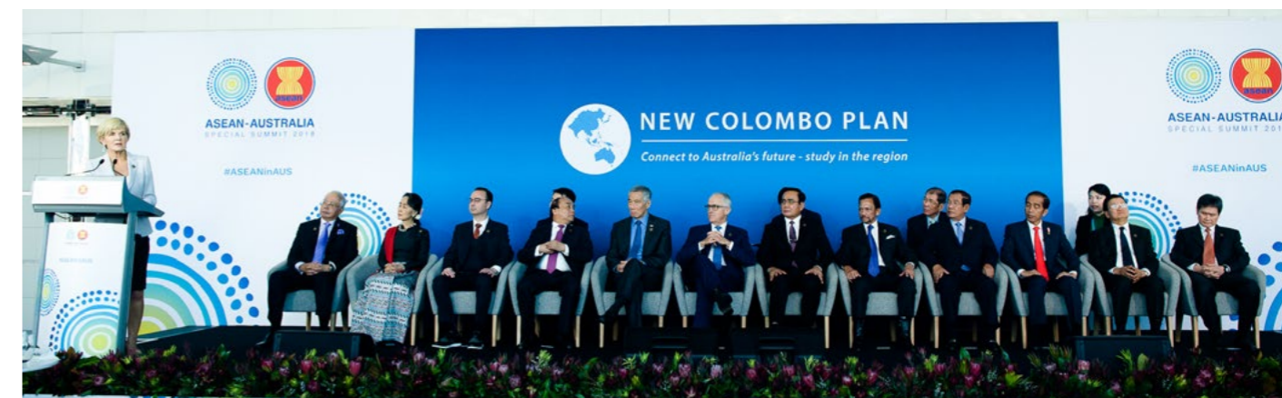
His Majesty, along with other ASEAN leaders, during the "New Colombo Plan" Afternoon Tea which was co-hosted by The Honourable Prime Minister of Australia and The Honourable Julie Bishop MP, Minister of Foreign Affairs of Australia.

SYDNEY, AUSTRALIA, March 17 - His Majesty Sultan Haji Hassanal Bolkiah Mu'izzaddin Waddaulah ibni Al-Marhum Sultan Haji Omar 'Ali Saifuddien Sa'adul Khairi Waddien, Sultan and Yang Di-Pertuan of Brunei Darussalam attended the ASEAN-Australia Special Summit 2018 which was held at the Sydney International Convention Center.