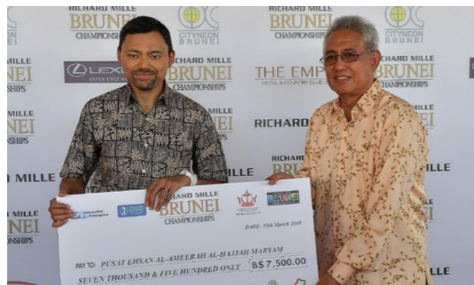
His Royal Highness presenting a donation cheque to Pusat Ehsan Al-Ameerah Al-Hajjah Maryam.