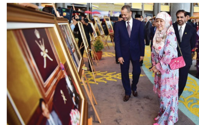
Her Royal Highness Princess Hajah Masna touring the exhibition.