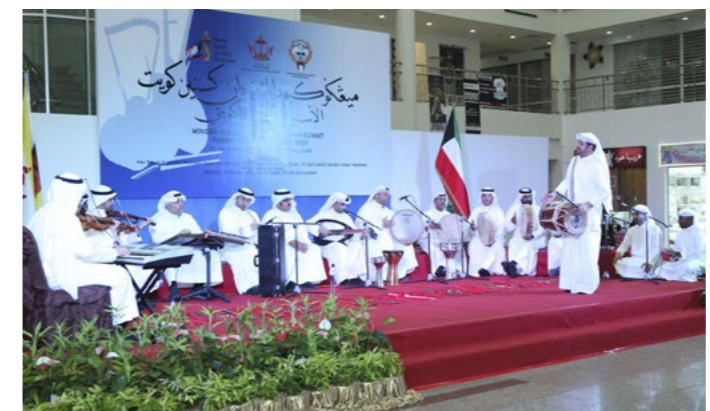
Cultural performances of Kuwait enlivening the ceremony.