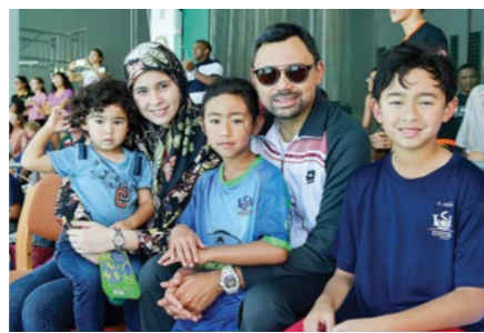
19. 3 rd Brunei Open and Masters Swimming Championship