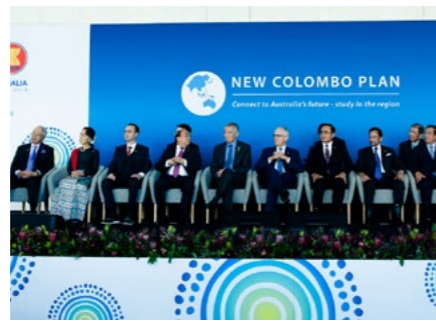
7. ASEAN-Australia Special Summit 2018 "New Colombo Plan" Afternoon Tea