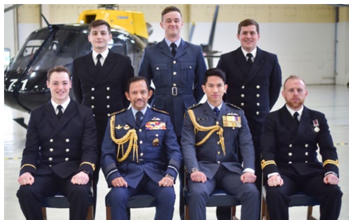
His Majesty in a group photo with His Royal Highness Captain Prince 'Abdul Mateen and other course participants.