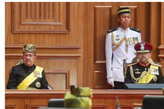
His Royal Highness Prince Haji Al-Muhtadee Billah, the Crown Prince and Senior Minister at the Prime Minister's Office as Ex-Officio Member (right) and His Royal Highness Prince Haji Sufri Bolkiah (left) during the 14 th Session of the Legislative Council.