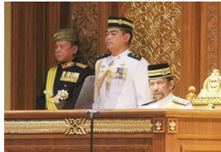
11. Opening Ceremony of the 14 th Session of the Legislative Council