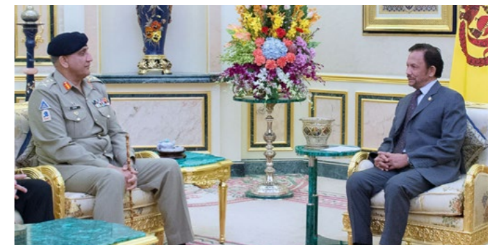
His Excellency General Qamar Javed Bajwa, Chief of Army Staff, Pakistan Army on March 26.