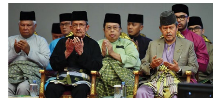
His Royal Highness Prince Mohamed Bolkiah and His Royal Highness Prince Haji Sufri Bolkiah.