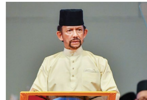
His Majesty Sultan Haji Hassanal Bolkiah Mu'izzaddin Waddaulah ibni Al-Marhum Sultan Haji Omar 'Ali Saifuddien Sa'adul Khairi Waddien, Sultan and Yang Di-Pertuan of Brunei Darussalam delivering a titah (royal speech) at the Finals of the 58 th National Al-Quran Reading Musabaqah for Adults 1493 Hijrah / 2018 Masihi at the International Convention Centre (ICC).