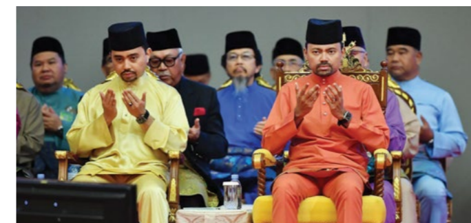
His Royal Highness Prince Haji Al-Muhtadee Billah, the Crown Prince and Senior Minister at the Prime Minister's Office and His Royal Highness Prince 'Abdul Malik.