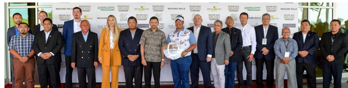
His Royal Highness Prince Haji Al-Muhtadee Billah in a group photo.

120 players from 20 countries participated in the championship. Brunei Darussalam was represented by nine players which consisted of five professionals and four amateurs. One of the local professional participants was Yang Amat Mulia Pengiran Muda Abdul Hakeem.