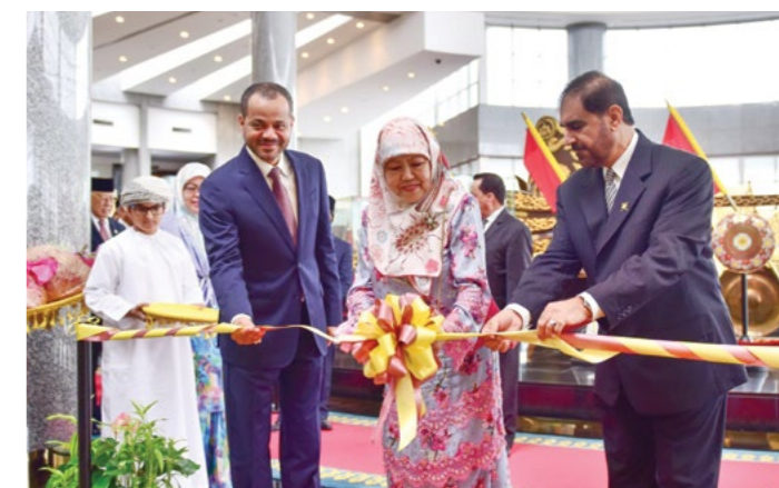
Her Royal Highness Princess Hajah Masna binti Al-Marhum Sultan Haji Omar 'Ali Saifuddien Sa'adul Khairi Waddien, Ambassador-at-Large at the Ministry of Foreign Affairs and Trade officiating the Commemorative Gallery Exhibition.

"We are proud that Oman and Brunei are the only sultanates officially recognised by the United Nations", said His Excellency.