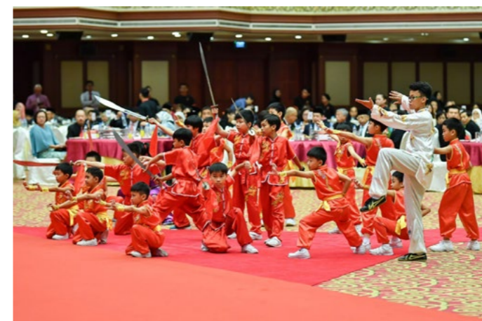
Cultural performances by the students of Chung Hwa Secondary School.