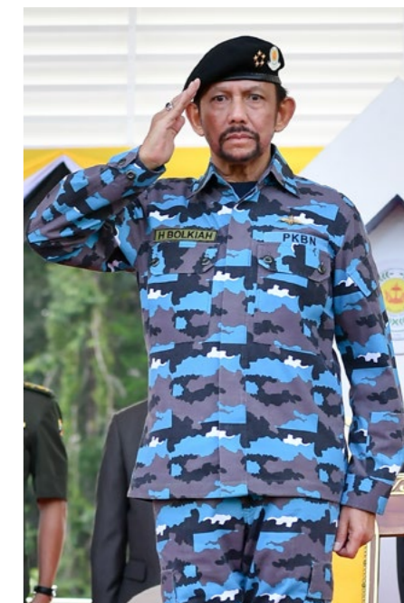
His Majesty Sultan Haji Hassanal Bolkiah Mu'izzaddin Waddaulah ibni Al-Marhum Sultan Haji Omar 'Ali Saifuddien Sa'adul Khairi Waddien, Sultan and Yang Di-Pertuan of Brunei Darussalam during the Passing Out Parade of the 7 th Intake of the PKBN.

strong values in both physical and spiritual aspects so they can be relied upon to face any obstacle or challenge.