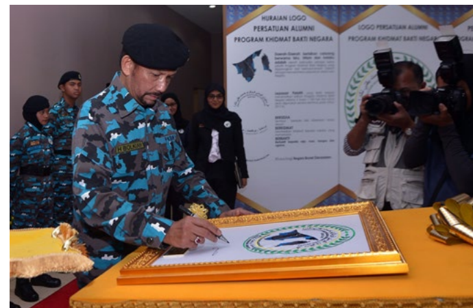
His Majesty signing the Buku Lembaran Kenangan (commemorative book).