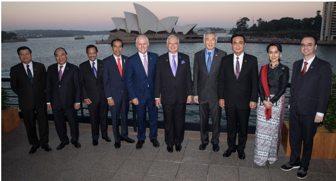
His Majesty in a group photo with other ASEAN Heads of State and Government during the Leaders' Dinner at Quay Restaurant, Circular Quay, Sydney.

SYDNEY, AUSTRALIA, March 17 - In the evening, His Majesty Sultan Haji Hassanal Bolkiah Mu'izzaddin Waddaulah ibni Al-Marhum Sultan Haji Omar 'Ali Saifuddien Sa'adul Khairi Waddien, Sultan and Yang Di-Pertuan of Brunei Darussalam attended a Leaders' Dinner hosted by The Honourable Malcolm Turnbull, Prime Minister of Australia. The event was held at Quay Restaurant, Circular Quay.