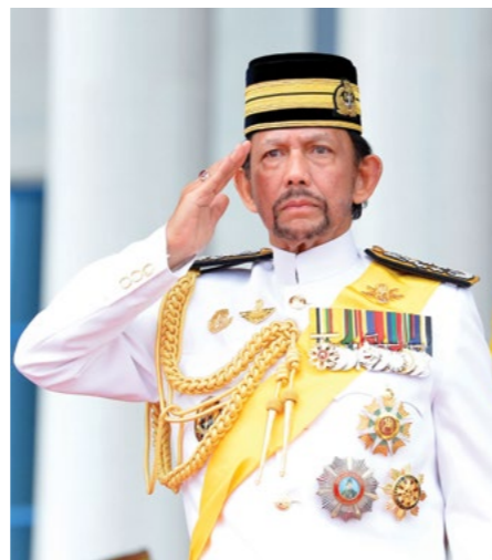
His Majesty in a Royal Salute during the singing of the national anthem.