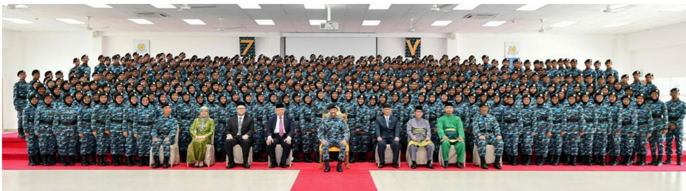
His Majesty in a group photo with the trainees of the 7 th Intake of the National Service Programme (PKBN).