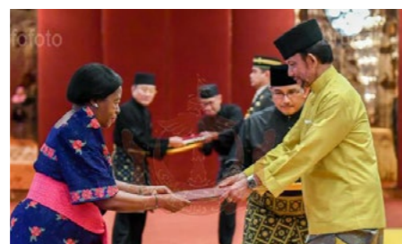
Her Excellency Dorothy Samali Hyuha, High Commissioner of the Republic of Uganda;