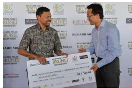
18. Richard Mille Brunei 2018 Championships Prize Presentation Ceremony