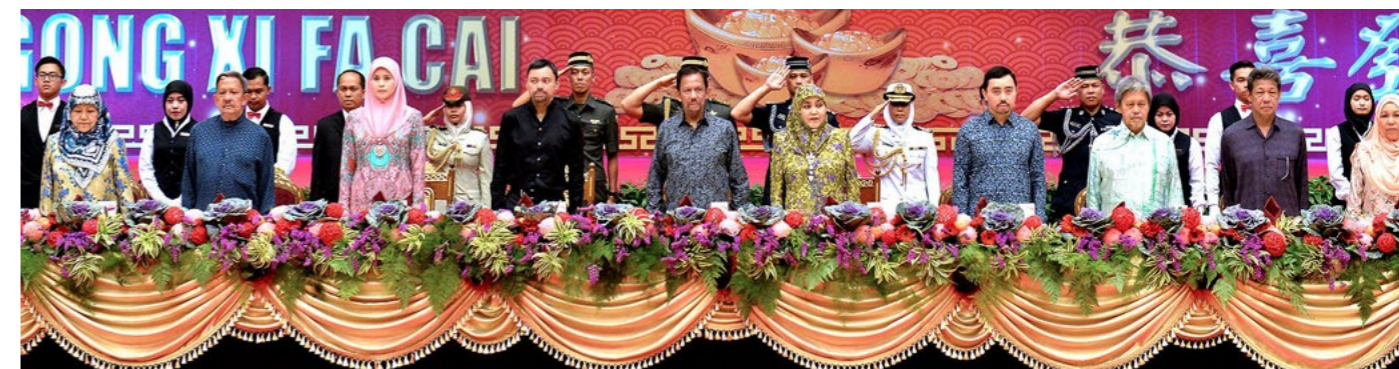
Their Majesties at the Chinese New Year 2018 get-together. Accompanying Their Majesties were His Royal Highness Prince Haji Al-Muhtadee Billah, the Crown Prince and Her Royal Highness Paduka Seri Pengiran Anak Isteri Pengiran Anak Sarah; and His Royal Highness Pengiran Muda 'Abdul Malik. Also in attendance were His Royal Highness Prince Mohamed Bolkiah, His Royal Highness Prince Haji Sufri Bolkiah, His Royal Highness Prince Haji Jefri Bolkiah, Her Royal Highness Princess Hajah Masna, and Her Royal Highness Princess Hajah Amal Umi Kalthum Al-Islam.

BANDAR SERI BEGAWAN, March 14 - His Majesty Sultan Haji Hassanal Bolkiah Mu'izzaddin Waddaulah ibni Al-Marhum Sultan Haji Omar Ali Saifuddien Sa'adul Khairi Waddien, Sultan and Yang Di-Pertuan of Darussalam, and Her Majesty Duli Raja Isteri Pengiran Anak Hajah Saleha binti Al-Marhum Pengiran Pemancha Pengiran Anak Haji Mohamed Alam, graced a get-together marking the Chinese New Year 2018 at International Convention Centre.