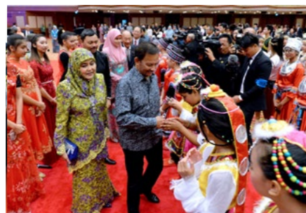
17. Chinese New Year get-together