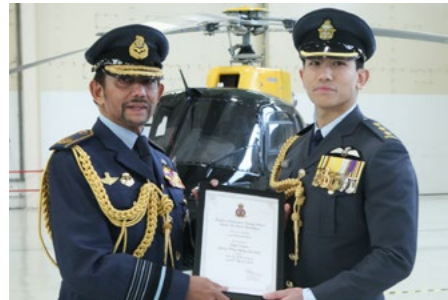
10. Presentation of the RAF Wing Badge and Certificate to His Royal Highness Captain Prince 'Abdul Mateen