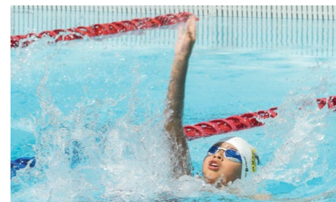
Yang Teramat Mulia Pengiran Muda 'Abdul Muntaqim participating in the 50-metre Backstroke category.