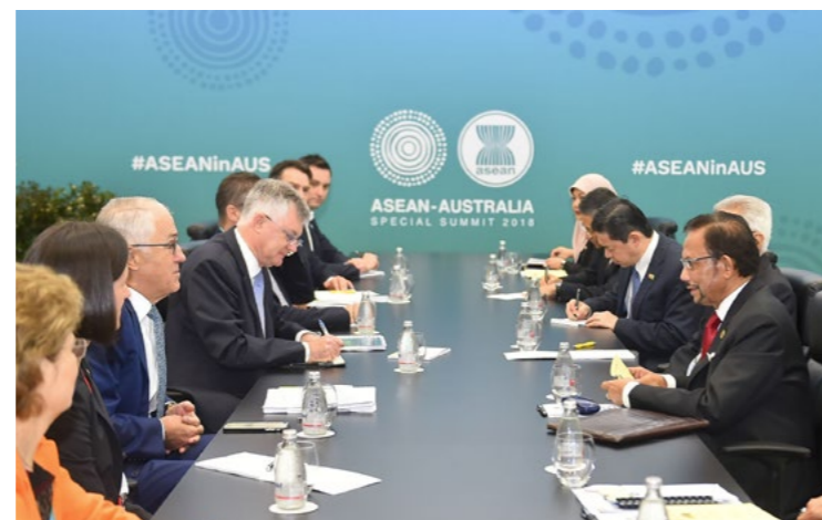
His Majesty and The Honourable Prime Minister of Australia during the meeting.

SYDNEY, AUSTRALIA, March 18 - His Majesty Sultan Haji Hassanal Bolkiah Mu'izzaddin Waddaulah ibni Al-Marhum Sultan Haji Omar 'Ali Saifuddien Sa'adul Khairi Waddien, Sultan and Yang Di-Pertuan of Brunei Darussalam attended a Meeting with The Honourable Malcolm Turnbull, Prime Minister of Australia. The Meeting was held at the Bilateral Room, Sydney International