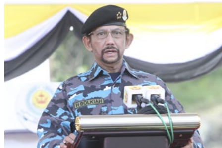
13. Equip PKBN trainees with strong values