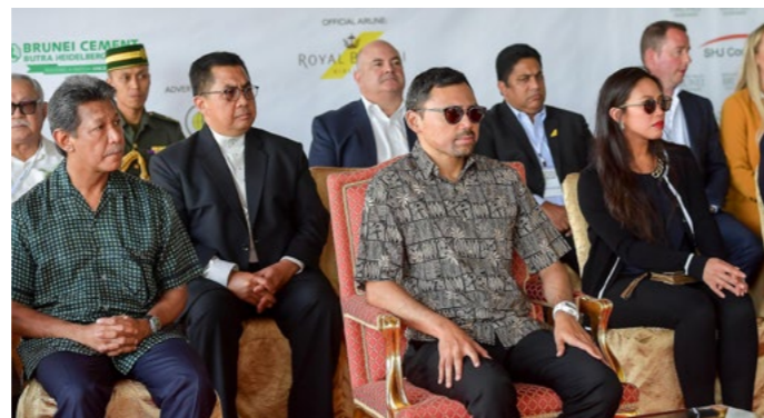
His Royal Highness Prince Haji Al-Muhtadee Billah ibni His Majesty Sultan Haji Hassanal Bolkiah Mu'izzaddin Waddaulah, the Crown Prince and Senior Minister at the Prime Minister's Office, His Royal Highness Prince Haji Jefri Bolkiah ibni Al-Marhum Sultan Haji Omar 'Ali Saifuddin Sa'adul Khairi Waddien and Her Royal Highness Princess 'Azemah Ni'matul Bolkiah binti His Majesty Sultan Haji Hassanal Bolkiah Mu'izzaddin Waddaulah.