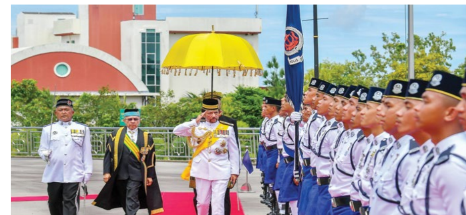
His Majesty Sultan Haji Hassanal the Sultan and Yang Di-Pertuan of Brunei Darussalam inspecting the Guard of Honour mounted by personnel of the Royal Brunei Police Force.

On this note, His Majesty stressed on the need to maintain the country's fiscal balance both in the short-term and long-term.