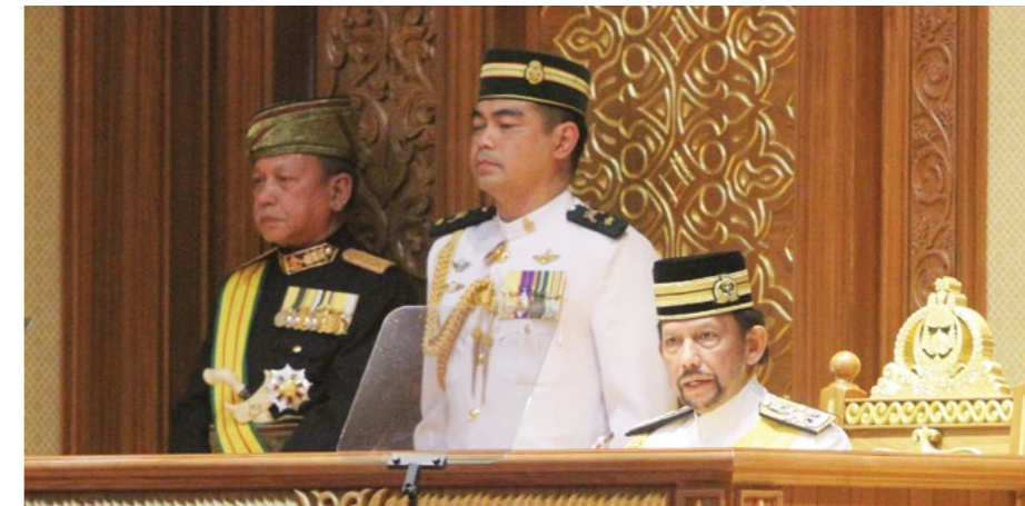
His Majesty Sultan Haji Hassanal Bolkiah Mu'izzaddin Waddaulah ibni Al-Marhum Sultan Haji Omar 'Ali Saifuddien Sa'adul Khairi Waddien, Sultan and Yang Di-Pertuan of Brunei Darussalam during a titah (royal speech) at the 14 th Session of the Legislative Council.

"Brunei Darussalam needs to be more active in diversifying the economy. This is justified, based on world oil prices often seen unpredictable. Though world oil prices have begun to rebound to favourable rates, they are still not enough to tackle weak economic growth," said His Majesty.