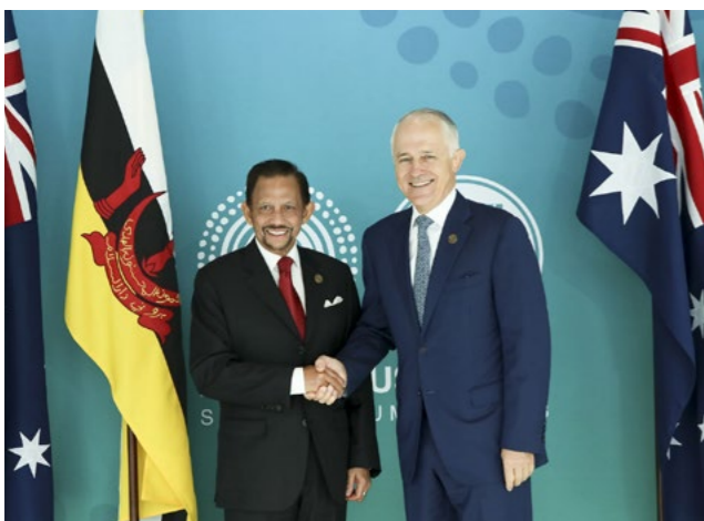
His Majesty the Sultan and Yang Di-Pertuan of Brunei Darussalam with The Honourable Malcolm Turnbull, Prime Minister of Australia.