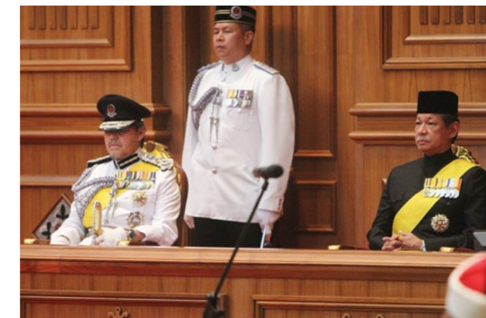
His Royal Highness Prince Mohamed Bolkiah (left) and His Royal Highness Prince Haji Jefri Bolkiah (right) during the 14 th Session of the Legislative Council.