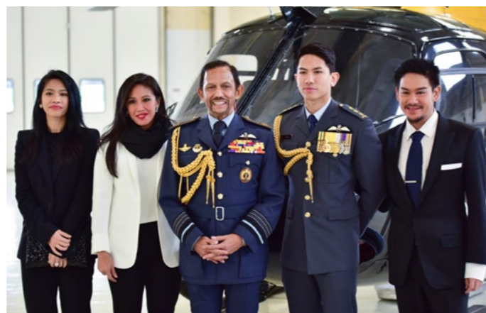
Also present at the graduation ceremony were His Royal Highness Prince Haji 'Abdul 'Azim, Her Royal Highness Princess 'Azemah Ni'matul Bolkiah, and Her Royal Highness Princess Fadzilah Lubabul Bolkiah.

Before leaving the ceremony, His Majesty joined His Royal Highness Captain Prince 'Abdul Mateen and other course participants for a group photo.