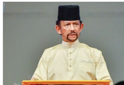
15. Al-Quran as the source of reference in life