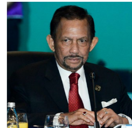
His Majesty during the Leaders' Plenary Session of the ASEAN-Australia Special Summit.

SYDNEY, AUSTRALIA, March 18 - His Majesty Sultan Haji Hassanal Bolkiah Mu'izzaddin Waddaulah ibni Al-Marhum Sultan Haji Omar 'Ali Saifuddien Sa'adul Khairi Waddien, Sultan and Yang Di-Pertuan of Brunei Darussalam attended the Leaders' Plenary Session of the ASEAN-Australia Special Summit which was held at the Sydney International Convention Centre.