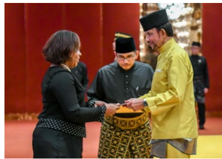
5. His Majesty receives Letters of Credence