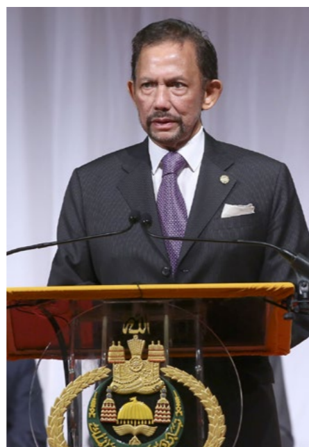
His Majesty the Sultan and Yang Di-Pertuan of Brunei Darussalam delivering a titah (royal speech) during the ceremony.

Before leaving the ceremony, His Majesty proceeded to mingle and meet with more than 300 citizens and residents of Brunei Darussalam consisting of students, government officials, as well as those on vacation in Australia. The ceremony also featured a Tausyeh performance by Bruneian students in Australia.