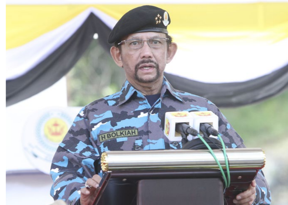
His Majesty Sultan Haji Hassanal Bolkiah Mu'izzaddin Waddaulah ibni Al-Marhum Sultan Haji Omar 'Ali Saifuddien Sa'adul Khairi Waddien, Sultan and Yang Di-Pertuan of Brunei Darussalam delivering a titah (royal speech) during the Passing Out Parade of the 7 th Intake of the National Service Programme (PKBN) at the PKBN Training Camp in Kampung Batu Apoi.

TEMBURONG, March 15 - His Majesty Sultan Haji Hassanal Bolkiah Mu'izzaddin Waddaulah ibni Al-Marhum Sultan Haji Omar 'Ali Saifuddien Sa'adul Khairi Waddien, Sultan and Yang Di-Pertuan of Brunei Darussalam in his titah (royal speech) expressed excitement with the enthusiasm shown by trainees during the recent National Day Celebration.