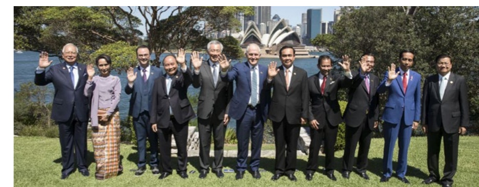
His Majesty in a group photo with other ASEAN Heads of State and Government during the Leaders' Retreat Session.