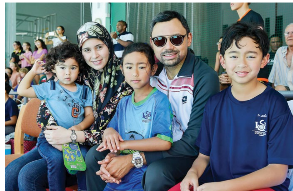
His Royal Highness Prince Haji Al-Muhtadee Billah ibni His Majesty Sultan Haji Hassanal Bolkiah Mu'izzaddin Waddaulah and Her Royal Highness Paduka Seri Pengiran Anak Isteri Pengiran Anak Sarah binti Pengiran Haji Salleh Ab Rahaman watched the 3 rd Brunei Open and Masters Swimming Championship. Also present were His Royal Highness's sons and daughter, Yang Teramat Mulia Pengiran Muda 'Abdul Muntaqim; Yang Teramat Mulia Pengiran Anak Muneerah Madhul Bolkiah; and Yang Teramat Mulia Pengiran Muda Muhammad Aiman.

Yang Teramat Mulia won gold medals in four categories, and broke the record for the 7-year-old girls category. Meanwhile, in the 100-metre Freestyle Relay, the ISB Hammerheads, participated by Yang Teramat Mulia, won silver.