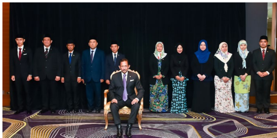
His Majesty with senior officers of the High Commission of Brunei Darussalam in Australia and the President and Vice President of the Brunei Darussalam Students' Union in Sydney.