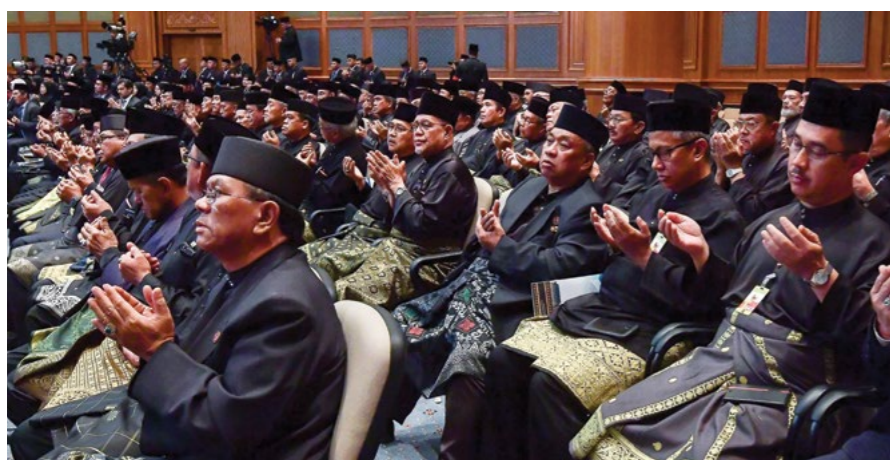
Among those present at the opening ceremony.