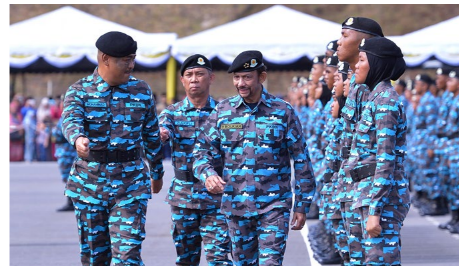
His Majesty inspecting the Guard of Honour comprising of 374 trainees.

His Majesty emphasises that the PKBN trainees should be equipped with