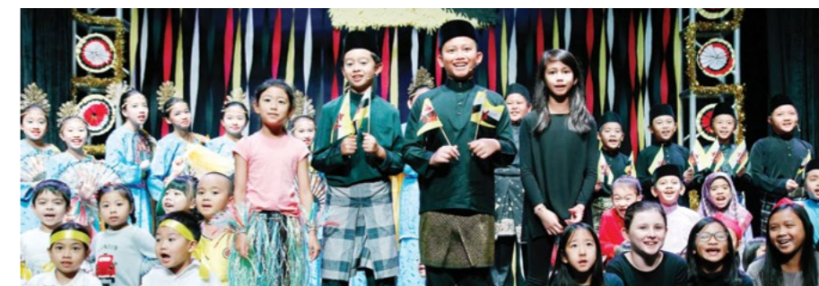
His Royal Highness Prince 'Abdul Wakeel and Her Royal Highness Princess Ameerah Wardatul Bolkiah performing in the cultural performance. Also participating were His Royal Highness the Crown Prince's children, Yang Teramat Mulia Pengiran Muda 'Abdul Muntaqim, and Yang Teramat Mulia Pengiran Anak Muneerah Madhul Bolkiah.

Also participating in the performance was children of His Royal Highness