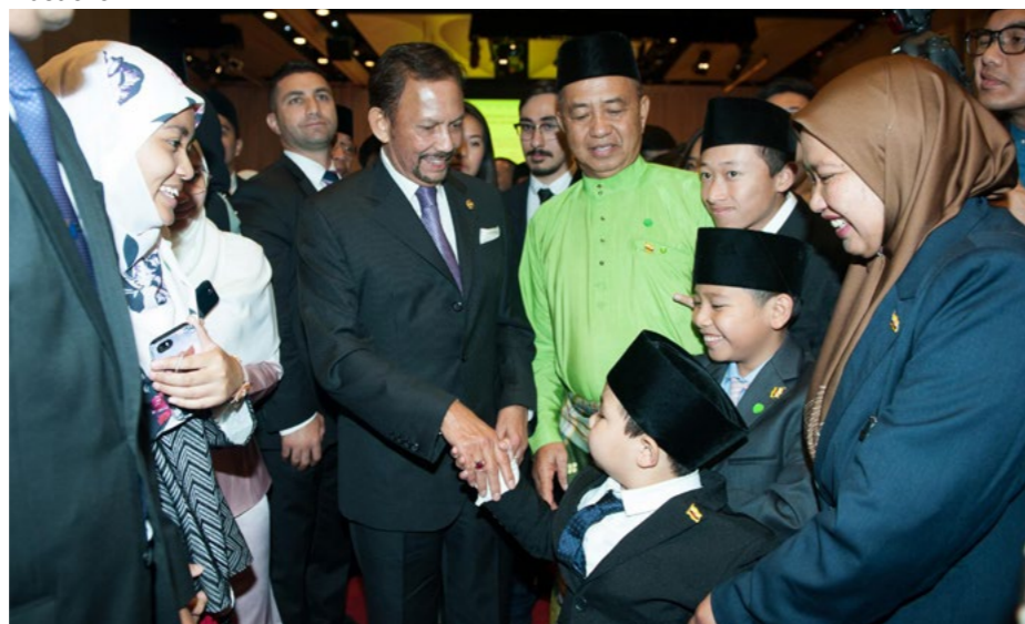
His Majesty meeting and greeting citizens and residents of Brunei Darussalam consisting of students, government officials, as well as those on vacation in Australia.