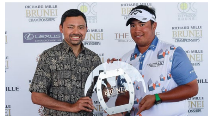
His Royal Highness presenting the grand prize to the winner of the Golf Richard Mille Brunei 2018 Championships, Kun Kiradech Aphibarrat from Thailand.