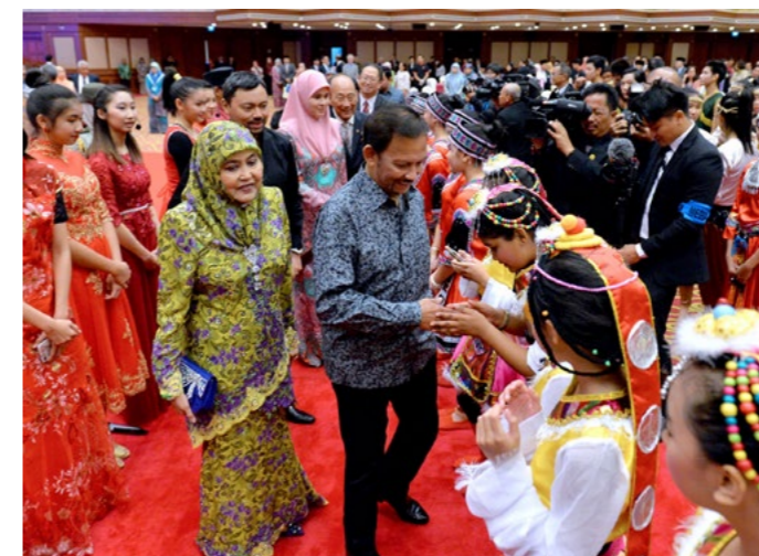
Their Majesties being greeted by the performers.

Before heading to the Plenary Hall, Their Majesties and other members of the Royal Family consented to join a group photo session with the organising committee. Their Majesties then received a pesambah (gift), followed by cultural performances presented by the students of Chung Hwa Secondary School.