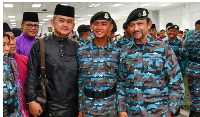
His Majesty during the junjung ziarah (meet and greet) with the PKBN trainees and their family members.

Before leaving, His Majesty received a junjung ziarah from the PKBN trainees and their family members.