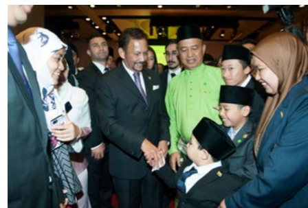
16. Get-Together Ceremony: Educated generation are priceless 'natural resources'