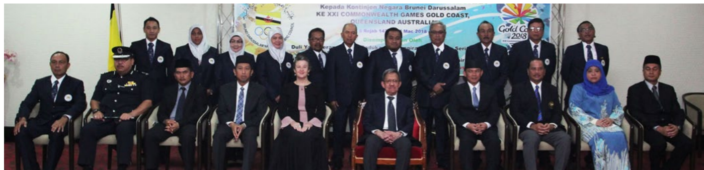
His Royal Highness Prince Haji Sufri Bolkiah ibni Al-Marhum Sultan Haji Omar 'Ali Saifuddien Sa'adul Khairi Waddien in a group photo with the contingents.