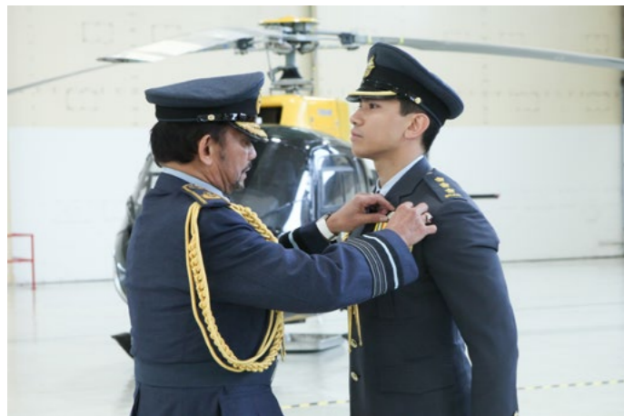
His Majesty the Sultan and Yang Di-Pertuan of Brunei Darussalam presenting the RAF Wing Badge and Certificate to His Royal Highness Captain Prince 'Abdul Mateen.