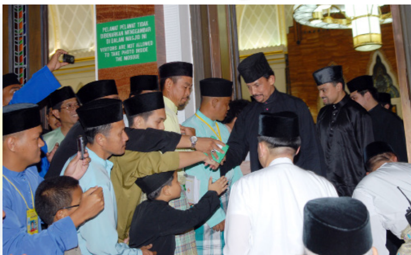
His Majesty and members of the royal family receive greetings from the public.

The thanksgiving ceremony, mass prayers and thanksgiving doa held in commemoration of the momentous occasion was held throughout the nation in mosques in all four districts.