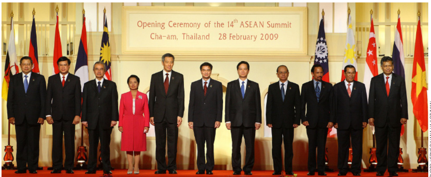
His Majesty in a group photo with other ASEAN leaders.

After the meetings, His Majesty and other ASEAN leaders proceeded to attend a working lunch with the ASEAN Business Advisory Council (ABAC) leaders, at which ASEAN leaders were presented with ASEAN Business Investment Summit (ASEAN-BIS) report.