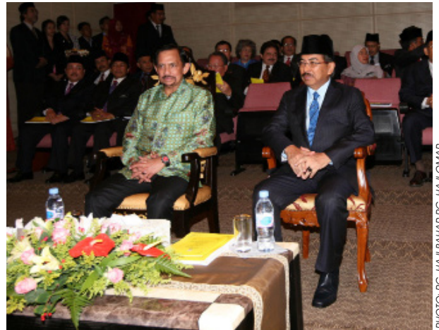
His Majesty at a briefing on Sabah's tourism industry and Sabah Development Corridor.

The official visit which was upon the invitation of the Governor of Sabah ended on February 4. His Majesty's last visit to Sabah was in 2001.