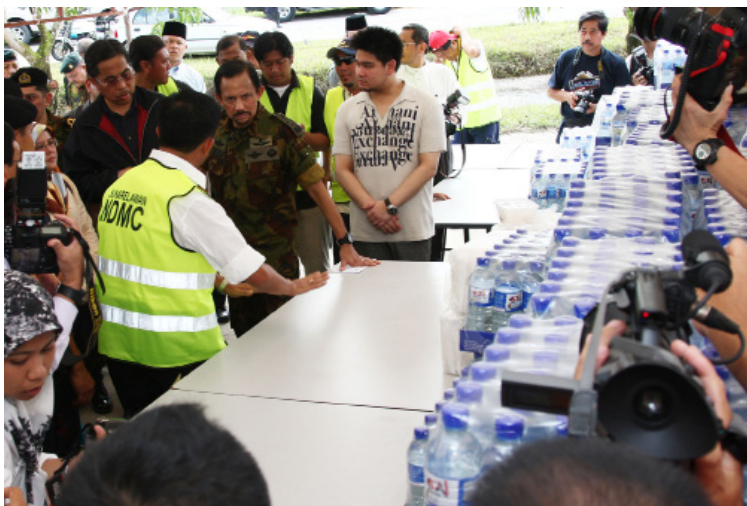
His Majesty and His Royal Highness at the food distribution area.

Also visited were Penapar Police Post, Layong Primary School, and residence of village head of Layong where His Majesty received greetings from members of the public. His Majesty then visited Command Post Lamunin based in Lamunin Fire and Rescue Station.