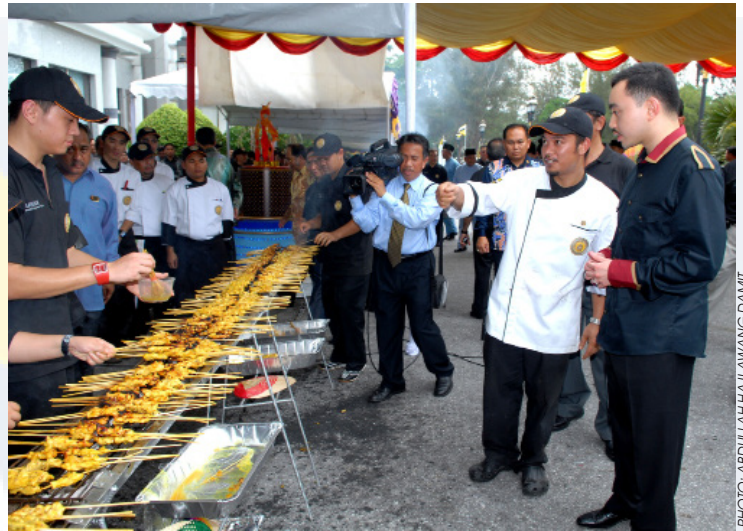
His Royal Highness takes a closer look on the largest serving grilled satay in the world.

This initiative was organised to answer the call made by His Majesty The Sultan and Yang Di-Pertuan of Brunei Darussalam in his royal speech to mark Hari Raya in 2001 for everyone to come forward and help