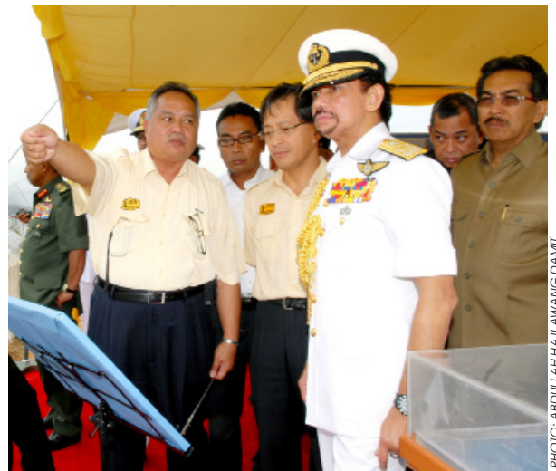
His Majesty at Teluk Sepanggar Royal Malaysian Navy.