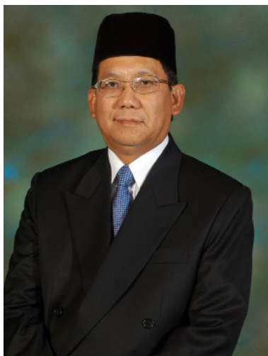
PHOTOGRAPHY DIVISION OF DEPARTMENT OF INFORMATION

Cancer can be prevented and curable. More than 30 per cent of cases can be prevented with knowledge and change of lifestyle. Use of tobacco, diet, physical