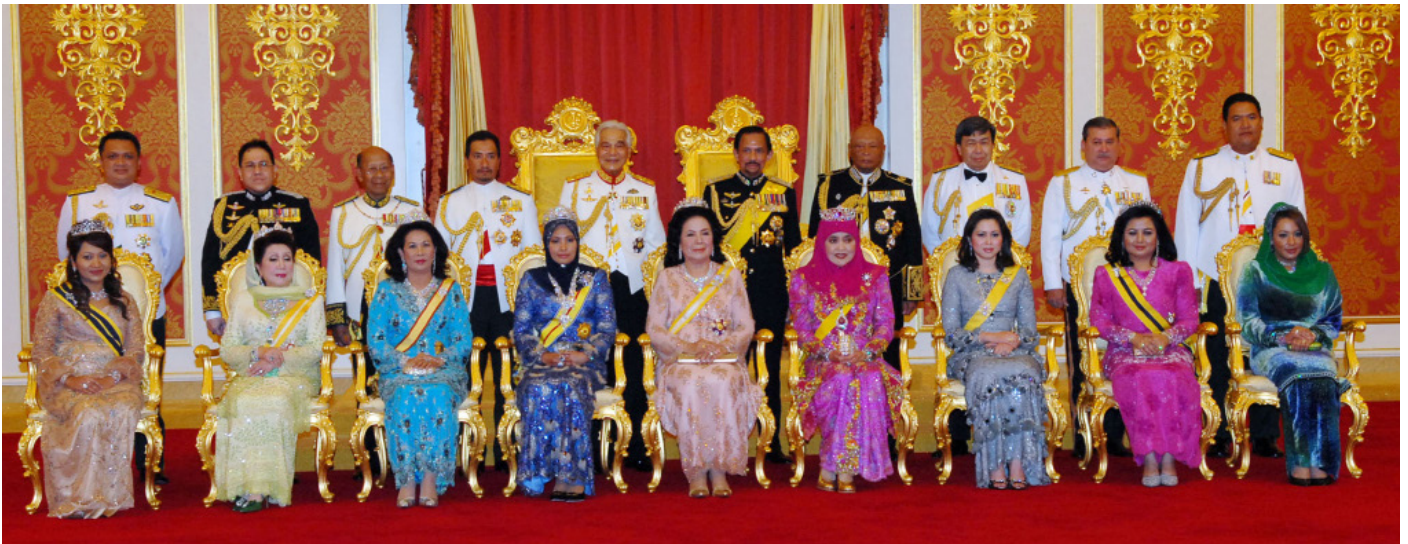
Group photo of Their Majesties and Her Royal Highness Pengiran Isteri with His Majesty Yang Di-Pertuan Agong of Malaysia, Her Majesty The Raja Permaisuri Agong and His Highness Kings and Her Highness Permaisuri of Malaysia.