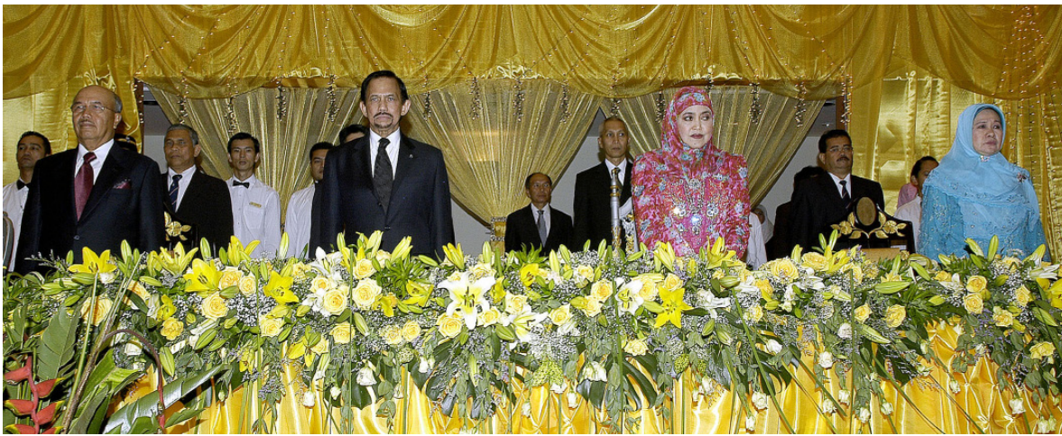
Their Majesties at a state banquet hosted by the Governor of Sabah.