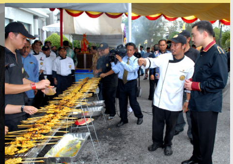
18 Brunei records the Largest Serving of Grilled Satay In The World