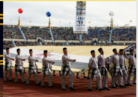
10/11 Brunei Darussalam's National Day Silver Jubilee Celebration 2009