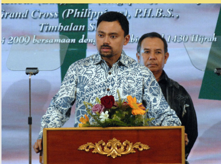
13 Brunei Shell Refinery achieves world standard excellence