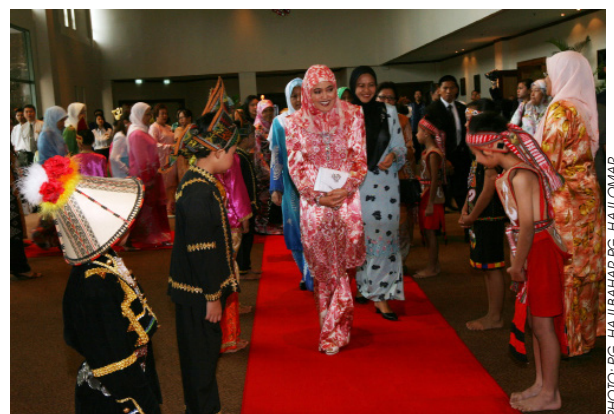
Her Majesty on arrival to a gathering to meet the children from welfare homes.