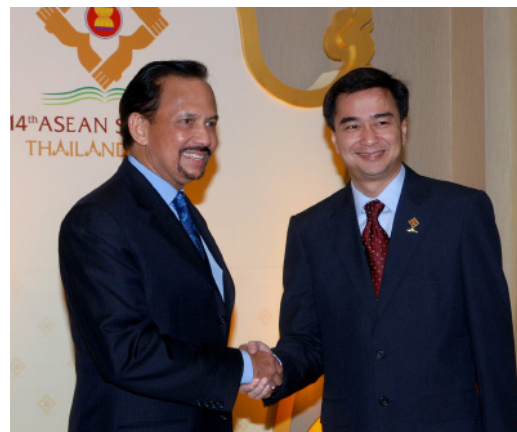
His Majesty held a bilateral meeting with His Excellency Abhisit Vejjajiva, Prime Minister of Thailand.

Accompanying His Majesty was His Royal Highness Prince Mohamed Bolkiah, Minister of Foreign Affairs and Trade. The gala dinner was held at the Mirigadayavan Palace.