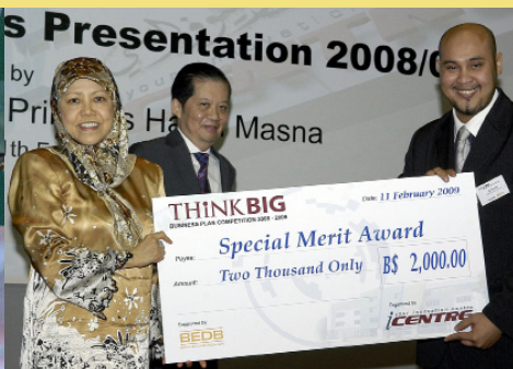
14 HRH presents prizes to 'Think Big' winners