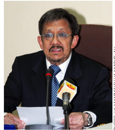
His Royal Highness delivers his sabda at the Brunei Darussalam's National Olympic Council.

Besides representatives of local sports associations, the meeting was also attended by senior officials of the Ministry of Culture, Youth and Sports.