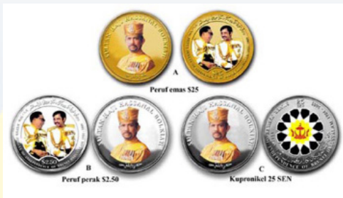
The commemorative coins.

All coins are with markings of 'Silver Jubilee of Independence of Brunei Darussalam 1984-2009' on the sides in both English and Jawi scriptures. Numatists can purchase the coins at the Brunei Currency and Monetary Board gallery at the Ministry of Finance.