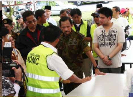
5 Royal visit to flashflood affected areas