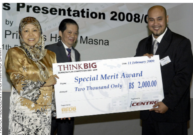
Her Royal Highness presents the special award to a representative of Met Group.

JERUDONG, February 11 - Her Royal Highness Princess Hajah Masna, Ambassador-at-Large at the Ministry of Foreign Affairs and Trade graced the prize presentation of 'Think Big Business Plan', at the The Empire Hotel and Country Club.