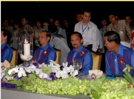
7 14th ASEAN Summit in Hua Hin, Thailand