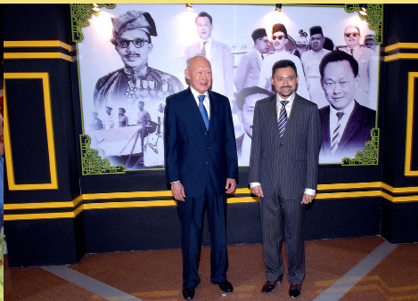
9 SOAS Memorial Lecture