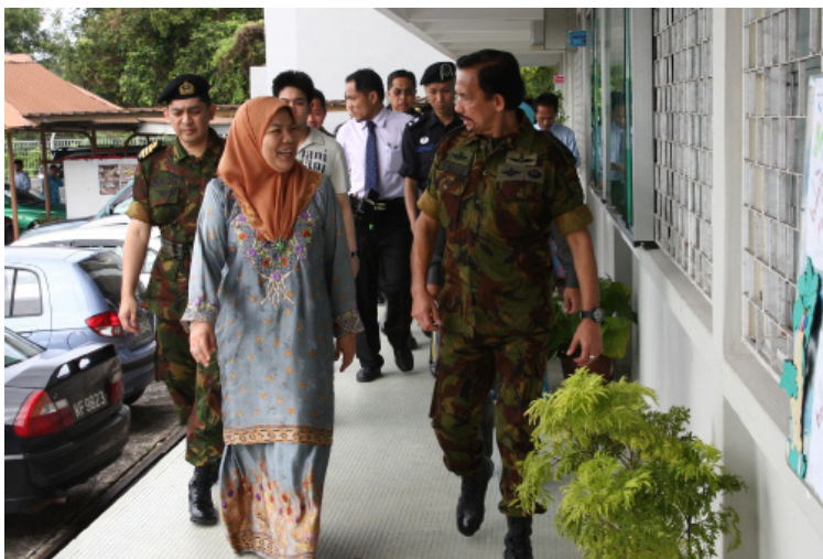
His Majesty visiting the Lubok Pulau Primary School.