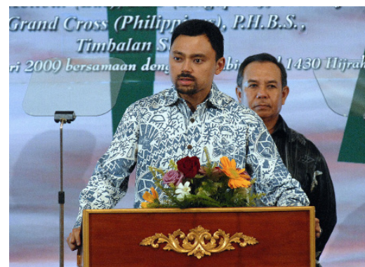
His Royal Highness delivers a sabda at a banquet to commemorate the 25 years of Brunei Shell Refinery's establishment.

His Royal Highness said, "After 25 years in operation, the ability to fulfil the needs for petroleum products through the existing refinery has become more