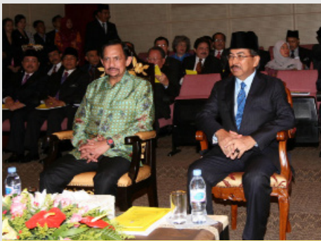
4 Their Majesties on official visit to Sabah