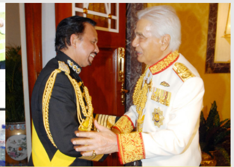
6 Royalty attend Silver Jubilee banquet