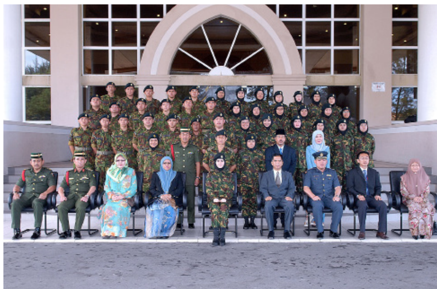
Her Royal Highness Paduka Seri Pengiran Anak Isteri Pengiran Anak Sarah in a group photo with guests and members of UBD's army cadet.

TUNGKU, February 21 - Universiti Brunei Darussalam (UBD) has established its first batch of army cadets, the first for a higher institution in the Sultanate.