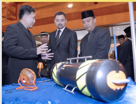
8 Crown Prince CIPTA Award 2011