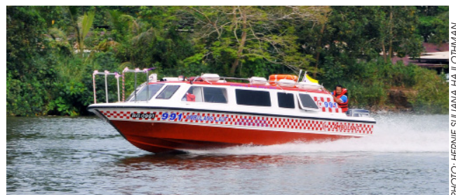
The Marine Ambulance 1 launched as an effort to further improve early treatment service and handling of emergency cases occurring at residences near or at Water Village.

Marine Ambulance Boat 1 is equipped with the most up-to-date equipment as those found in land ambulance vehicles. Besides handling emergency cases such as drowning and injuries as well as emergency cases involving large vessels that cannot anchor in Brunei's harbour, the marine ambulance will also be used to provide medical treatment during water sports events such as regatta.