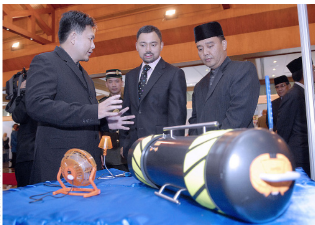
His Royal Highness looks on one of the creative products produced through CIPTA Award.

This was the 4 th year for ITB to organise such prestigious competition with support from Brunei LNG to among others aims to encourage inventions and innovations in Brunei Darussalam.