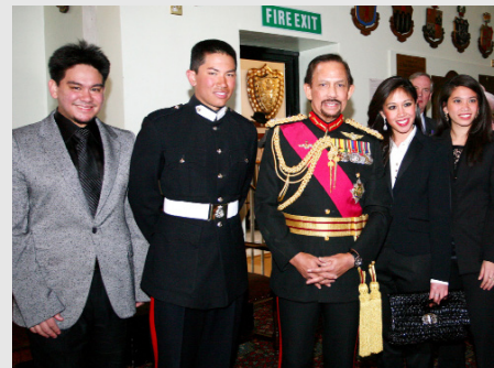
6 His Majesty attends Sovereign's Parade Royal Military Academy Sandhurst