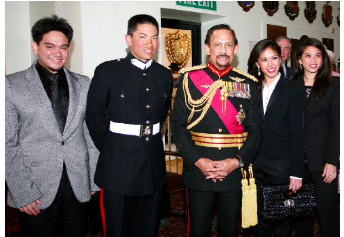
The Sovereign's Parade commissioning Course Number 102 also includes His Royal Highness Prince 'Abdul Mateen (second from left).

work starts now. Many of you will shortly find yourselves in command of soldiers on operations. It is a sobering thought, a most serious business, but one for which you are well prepared. I am sure that the pride of your parents today will be tinged with anxiety about your future.