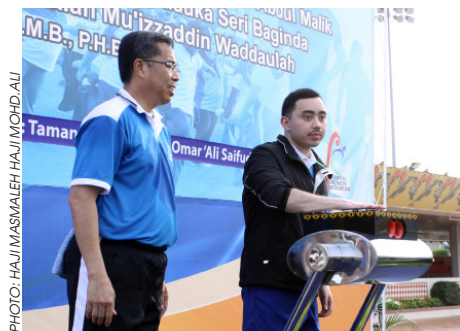
The Health Promotion Premier Walkathon launched by His Royal Highness Prince 'Abdul Malik.