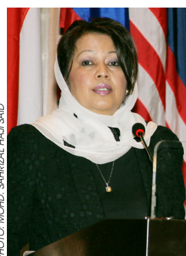
The Attorney General, Datin Paduka Dayang Hajah Hayati officiates the 6 th ASEAN Law Forum.

The forum was attended by senior law officials, representatives of the Ministry of Foreign Affairs and Trade, legal academics and members of the national law societies of eight ASEAN countries namely - Brunei Darussalam; Cambodia; Indonesia; Malaysia; Philippines; Singapore; Thailand; and Viet Nam.