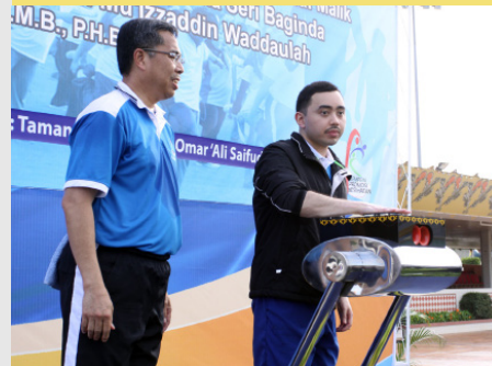
11 Health Promotion Premier Walkathon