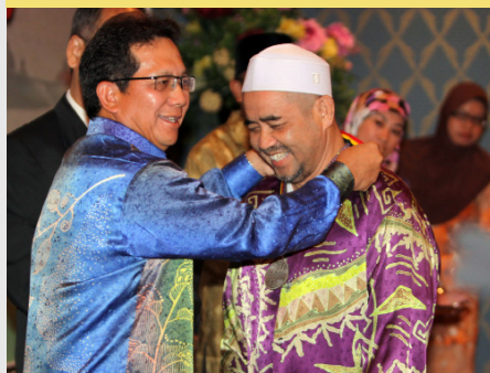
14 Architects, Professional Engineers and Quantity Surveyors Order introduced