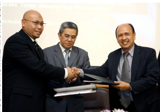
The contract signing is hoped to provide services that will connect all ministries.

PHOTO: AMPUAN HAJI MAHMUD AMPUAN HAJI TENGGAH