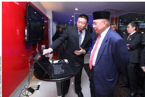
Minister of Communications received a briefing on AiTi's new website.

Besides these, a mini laboratory was also introduced where it enables locals to undergo training and to specialise in RFID.