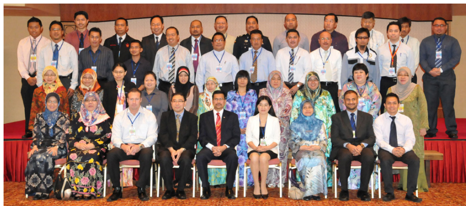
Participants of the meeting with Permanent Secretary at Ministry of Health (front row, fifth from right).

The meeting was held at Centrepont Hotel, Gadong.