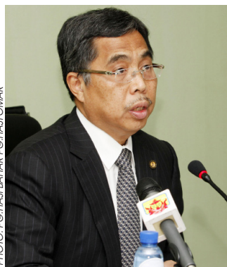
Minister of Health chairs the Health Promotion National Committee meeting.

BANDAR SERI BEGAWAN, April 7 – His Majesty The Sultan and Yang Di-Pertuan of Brunei Darussalam has consented for the Health Promotion National Committee to