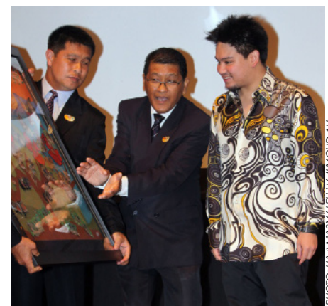
His Royal Highness receives a token of appreciation from SMARTER Brunei.

Besides raising funds, the charity also promoted among Bruneians that autistic children can also think for the future, act and solve problems. Over the past ten years, SMARTER has been preparing their autistic children to be part of the larger community. The Charity Gala Night also gave them the chance to show their unique ability, strength, skill, enthusiasm and talents.