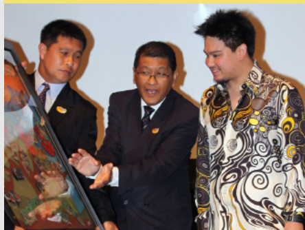
10 SMARTER Charity Gala Night