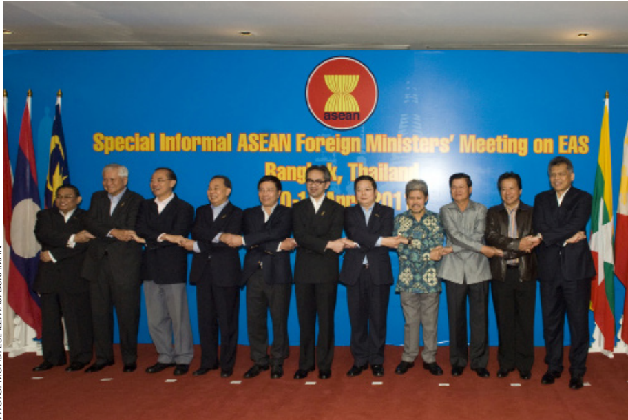
Group photo of Foreign Ministers attending the Special Informal ASEAN Foreign Ministers' Meeting on EAS.

BANGKOK, THAILAND, April 11 - His Royal Highness Prince Mohamed Bolkiah, Minister of Foreign Affairs and Trade, together with other Foreign Ministers and the Secretary-General of ASEAN attended the Special Informal Foreign Ministers' Meeting on the East Asia Summit (EAS). The meeting was chaired by His Excellency R. M. Marty Natalegawa, Minister of Foreign Affairs of Indonesia.