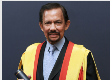
1 His Majesty receives honorary doctorate