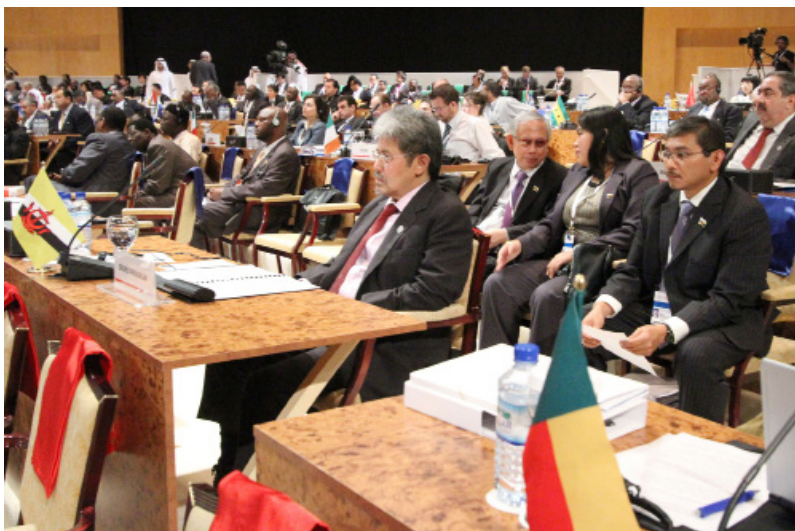
His Royal Highness at the Plenary Session.

His Royal Highness also joined fellow heads of delegations in a tour of IRENA exhibitions and attended a dinner at the Manaret Sa' diyat hosted by the Government of UAE to welcome all delegates. Also present at the dinner was His Highness Sheikh Abdullah bin Zayed Al Nahyan, Minister of Foreign Affairs of UAE.