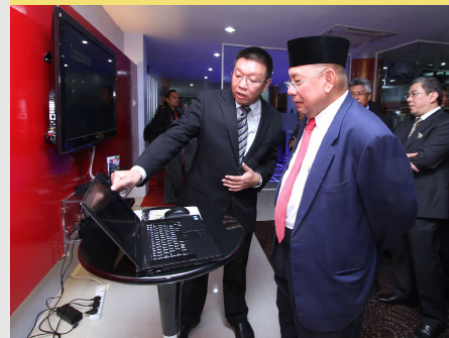
17 SMART Gallery showcases RFID applications