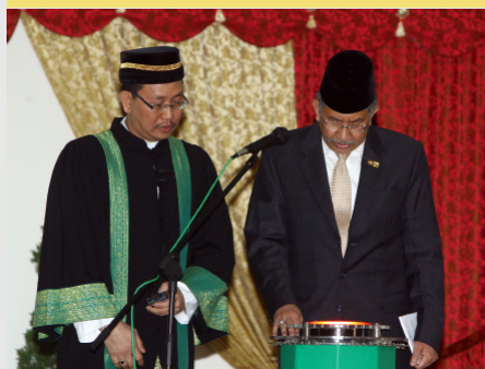
12 Syariah Court launched Law Report