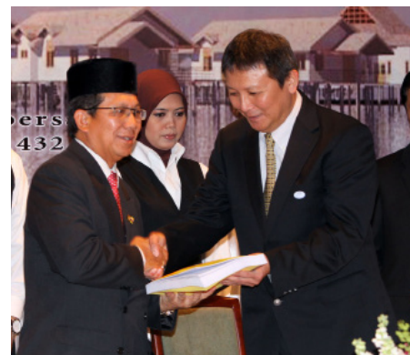
Minister of Development (left) and Director of Tobishima (Brunei) Sdn. Bhd. at the signing ceremony.