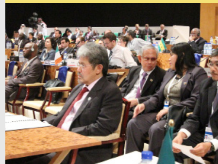
9 Brunei supports formation of IRENA