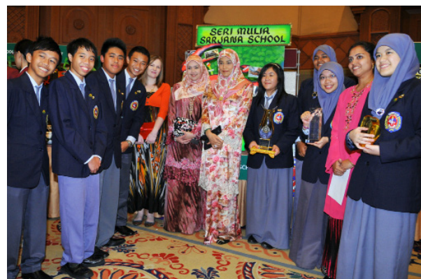
The 13 th PRYNSA's champion in group photo with Her Royal Highness Princess Hajah Rashidah Sa'adatun Bolkiah and Her Royal Highness Princess Hajah Majeedah Nuurul Bolkiah.

PRYNSA provides an opportunity for local youth to show their interest in nature, talents and capabilities by presenting to the country the findings of their research work carried out over a year. Since PRYNSA was first introduced 13 years ago, the programme has educated and exposed students to the world of scientific studies. It has also given students numerous useful experiences and educational assistance such as in teamwork and carrying out their study project.