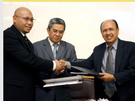
13 EG Bandwidth Services to connect all ministries