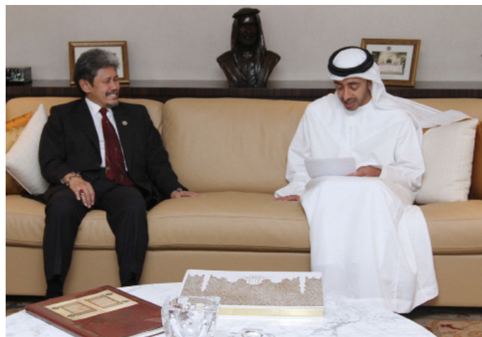
His Royal Highness and His Highness among others discussed the setting up of a Joint Commission between Brunei Darussalam and UAE.

The meeting was held at the Ministry of Foreign Affairs, Abu Dhabi.