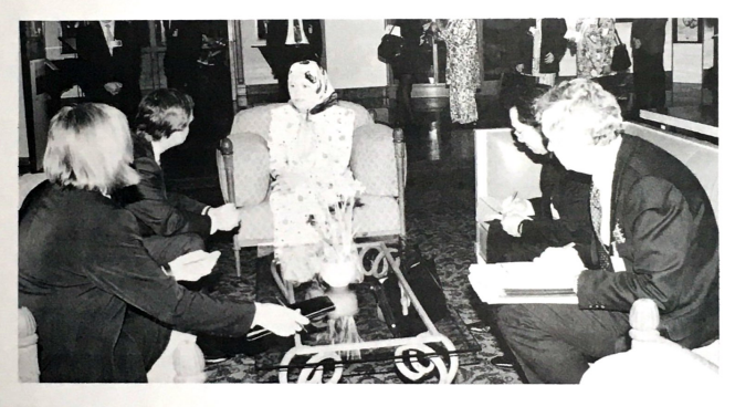
Her Royal Highness Princess Hajjah Masna, the Acting Minister of Foreign Affairs receiving His Excellency Mr. Martin Cullen, the Minister of State of the Republic of Ireland in audience during the Second Asia-Europe Meeting in Berlin.

Asian countries at the meeting comprise of the seven ASEAN member nations, namely, Brunei Darussalam, Malaysia, Singapore, Indonesia, Thailand, Vietnam and the Philippines as well as China, Korea and Japan. The 15 European Union countries are made up of Austria, France, Finland, Denmark, Belgium, Hellenic Republic, Ireland, Italy, Luxembourg, the Netherlands, Portugal, Spain, Sweden, Great Britain and the