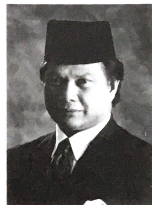
YAM Pengiran Laila Kanun Diraja Pengiran Haji Bahrin, Minister of Law and Attorney-General.

The Minister highlighted that the management of share investment required firm control and rule to ensure a more organised and proper implementation for the importance of both the brokers and customers. The management of Malaysia