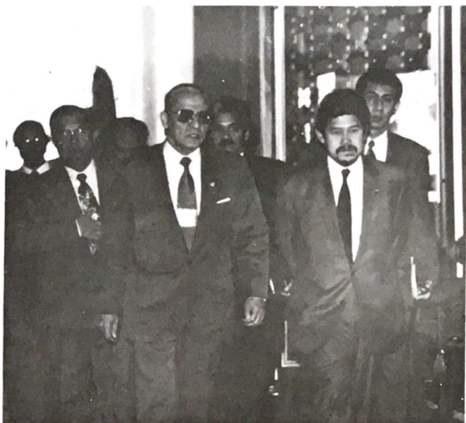
Above: His Royal Highness and Indonesian Foreign Minister, His Excellency Ali Alatas head for the conference room at the UN building for a meeting of Foreign Ministers of the Organisation of Islamic Conference (OIC) Member Countries.