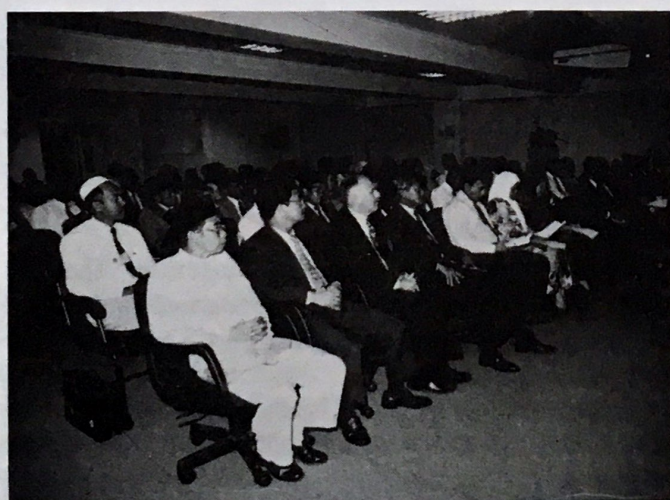
Some of the officials and participants present at the SEAMEO-VOCTECH Seminar on vocational and technical education management.

The appointment of share brokers in Malaysia and Singapore would enable IBB Securities Pte Ltd to provide facilities for those who have already been actively engaged in the investment of share of both countries.