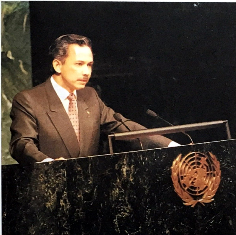
His Majesty Paduka Seri Baginda Sultan Haji Hassanal Bolkiah Mu'izzaddin Waddaulah, Sultan and Yang Di-Pertuan of Brunei Darussalam, addressing the 49th session of UNGA, said the world now needs a stable international environment to allow increase of economic cooperation through more trade and investments.