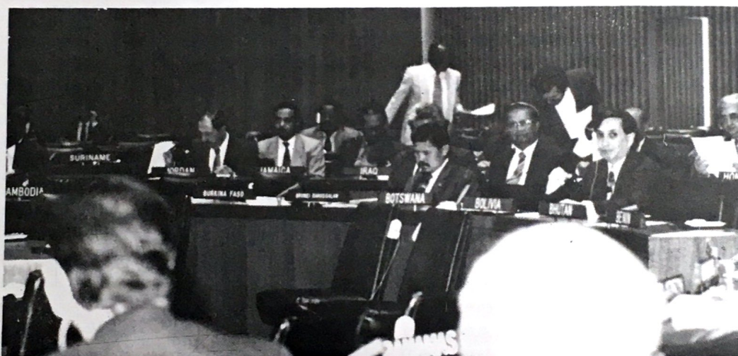
Above: His Royal Highness also attended a meeting of Foreign Ministers of the Non-Aligned Movement (NAM) Member Countries, held at the UN Headquarters during the 49th UNGA Session.

After the meeting, Brunei Darussalam led by His Royal Highness Prince Mohamed Bolkiah hosted a luncheon for the ASEAN Foreign Ministers and their respective delegations.