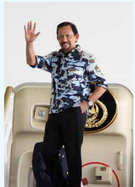
HIS Majesty Sultan Haji Hassanal Bolkiah Mu'izzaddin Waddaulah ibni Al-Marhum Sultan Haji Omar 'Ali Saifuddin Sa'adul Khairi Waddien, the Sultan and Yang Di-Pertuan of Brunei Darussalam and Her Majesty Duli Raja Isteri Pengiran Anak Hajah Saleha binti Al-Marhum Pengiran Pemancha Pengiran Anak Haji Mohamed Alam, consented to depart for Republic of Singapore.