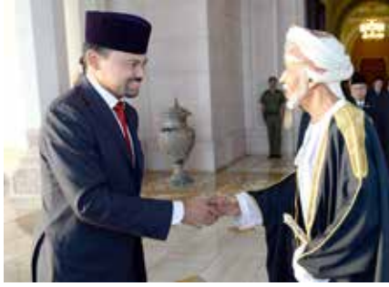
4 His Royal Highness exchange views with His Majesty Sultan Qaboos