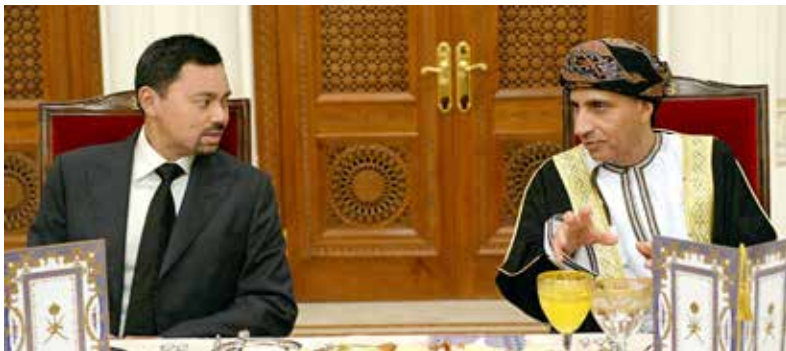
His Royal Highness Prince Haji Al-Muhtadee Billah ibni His Majesty Sultan Haji Hassanal Bolkiah Mu'izzaddin Waddaulah, The Crown Prince and Senior Minister at the Prime Minister's Office consented to attend the Official Dinner Ceremony hosted by His Highness Sayyid Fahad bin Mahmoud Al Said, the Deputy Prime Minister for the Council of Ministers of the Sultanate of Oman.

MUSCAT, February 4 - His Royal Highness Prince Haji Al-Muhtadee Billah ibni His Majesty Sultan Haji Hassanal Bolkiah Mu'izzaddin Waddaulah, The Crown Prince and Senior Minister at the Prime Minister's Office and Her Royal Highness Paduka Seri Pengiran Anak Isteri Pengiran Anak Sarah binti Pengiran Haji Salleh Ab Rahaman attended separate official dinner ceremonies.