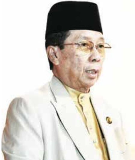
Minister of Religious Affairs (Center) during the opening of the Mosque Officers Excellence Seminar at Centrepoint Hotel Gadong.