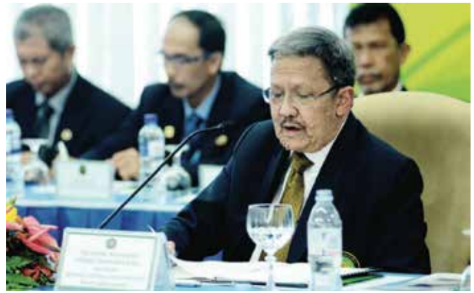
His Royal Highness Prince Haji Sufri Bolkiah ibni Al-Marhum Sultan Haji Omar 'Ali Saifuddien Sa'adul Khairi Waddien, President of the National Football Association of Brunei Darussalam (NFABD) delivering the sabda at the NFABD Ordinary Congress held at NFABD House, Jalan Pusat Persidangan, Berakas.

His Royal Highness highlighted these during the NFABD Ordinary Congress held at NFABD House, Jalan Pusat Persidangan. Whereas on the NFABD Secretariat matters, His Royal Highness stated that it is very important and needs to improve its capabilities