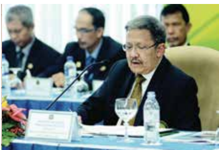
12 NFABD members urged to strengthen integrity of association