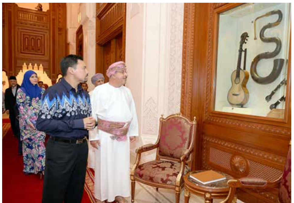
Their Royal Highnesses viewing several exhibits in the Royal Opera House Muscat.