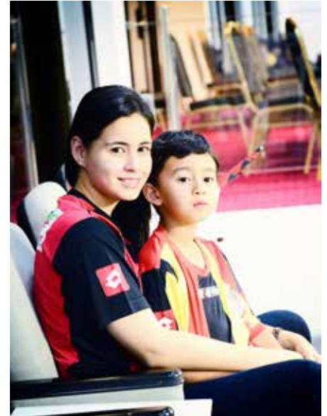
Her Royal Highness Paduka Seri Pengiran Anak Isteri Pengiran Anak Sarah binti Pengiran Haji Salleh Ab Rahaman and His Royal Highness Prince 'Abdul Muntaqim during the match.

His Royal Highness Prince Haji Al-Muhtadee Billah ibni His Majesty Sultan Haji Hassanal Bolkiah Mu'izzaddin Waddaulah, The Crown Prince and The Senior Minister at the Prime Minister's Office and Her Royal Highness Paduka Seri Pengiran Anak Isteri Pengiran Anak Sarah binti Pengiran Haji Salleh Ab Rahaman consented to attend a friendly match between Brunei DPMM FC and Kelantan FA, the winner of