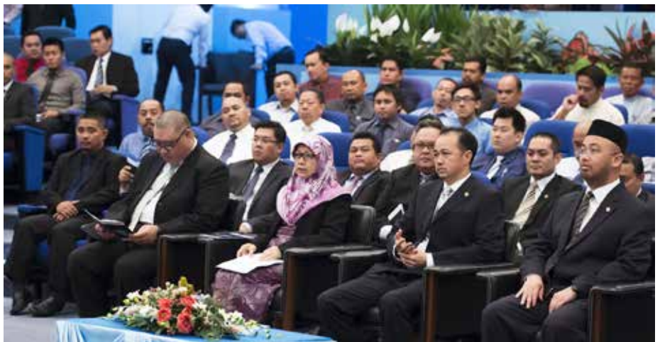
Acting Minister of Finance II (Second), Yang Mulia Dato Paduka Awang Haji Bahrin bin Abdullah launching the E-Payment Gateway service.

BANDAR SERI BEGAWAN, 29 January - The Ministry of Finance through the Treasury Department is implementing the E-Payment Gateway (EPG) System Project in line with the wishes of the Government of His Majesty to expand its e-government services and the rapid development of information-communications technologies. The implementation of this project directly reflects the development and enhancement of financial services infrastructure in the country.