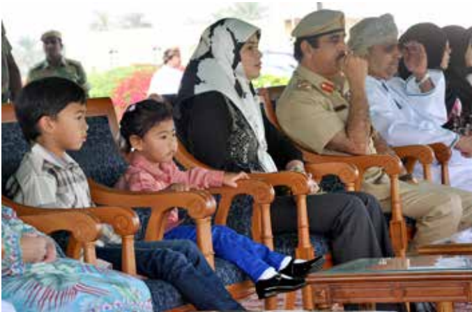
Her Royal Highness Paduka Seri Pengiran Anak Isteri Pengiran Anak Sarah binti Pengiran Haji Salleh Ab Rahaman, Yang Teramat Mulia Pengiran Muda Abdul Muntaqim and Yang Teramat Mulia Pengiran Anak Muneerah Madhul Bolkiah while watching the performance at the Royal Cavalry.

MUSCAT, February 5 - Her Royal Highness Paduka Seri Pengiran Anak Isteri Pengiran Anak Sarah binti Pengiran Haji Salleh Ab Rahaman visited the Royal Cavalry in Madinat Al Adiyat, Seeb.