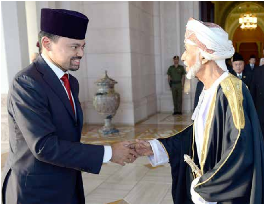
His Royal Highness Prince Haji Al-Muhtadee Billah ibni His Majesty Sultan Haji Hassanal Bolkiah Mu'izzaddin Waddaulah, Senior Minister at the Prime Minister's Office was welcomed by His Majesty Sultan Qaboos bin Said Al-Said.