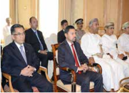
6 His Royal Highness attends the Oman vision 2040 briefing