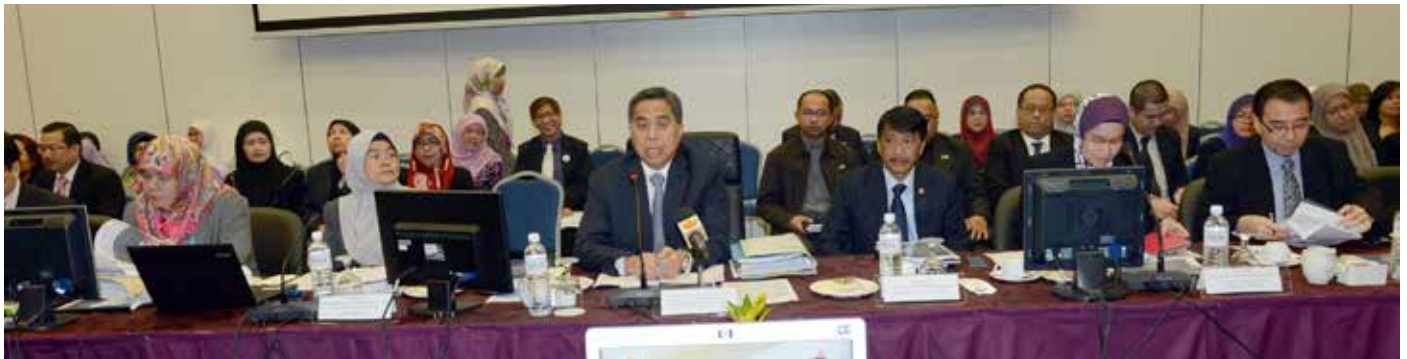
Minister of Health, Yang Berhormat Pehin Orang Kaya Johan Pahlawan Dato Seri Setia Awang Haji Adanan bin Begawan Pehin Siraja Khatib Dato Seri Setia Awang Haji Mohd. Yusof chairing the Muzakarah Session with Members of the Legislative Council (LegCo), held at Al 'Afiah Hall, Ministry of Health.

BANDAR SERI BEGAWAN, February 8 - The Ministry of Health will continue to implement various programmes and initiatives through strategic planning solely aimed at improving the health and well-being of the citizens and the people in the country.