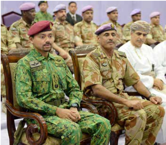
His Royal Highness Prince Haji Al-Muhtadee Billah ibni His Majesty Sultan Haji Hassanal Bolkiah Mu'izzaddin Waddaulah, The Crown Prince and Senior Minister at the Prime Minister's Office (PMO), General of the Royal Armed Forces Brunei (RBAF) consented to visit Special Forces Headquarters.

MUSCAT, February 5 - His Royal Highness Prince Haji Al-Muhtadee Billah ibni His Majesty Sultan Haji Hassanal Bolkiah Mu'izzaddin Waddaulah, The Crown Prince and Senior Minister at the Prime Minister's Office (PMO) consented to visit Sultan Special Forces Headquarters. His Royal Highness was greeted by Brigadier General Amir bin Salim bin Mubarak Al Amri, Commander of the Sultan Special Forces upon arrival.