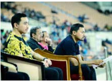
11 Brunei DPMM FC holds friendly match