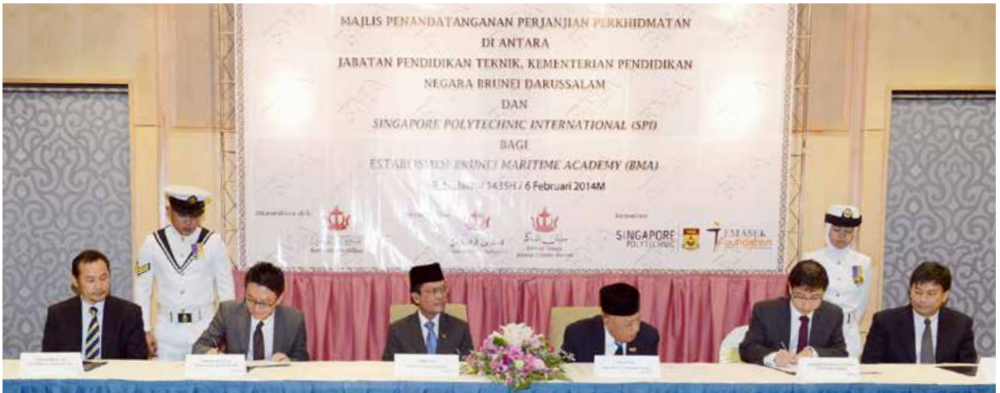
Yang Berhormat Pehin Orang Kaya Seri Kerna Dato Seri Setia (Dr.) Haji Awang Abu Bakar, Minister of Education and Yang Berhormat Pehin Orang Kaya Hamzah Pahlawan Dato Seri Setia Awang Haji Abdullah, Minister of Communications witnessing the Signing Ceremony of Service Agreement Between the Department of Technical Education, Ministry of Education and International Polytechnic of Singapore.