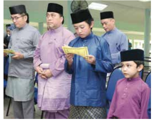
Grandsons of His Majesty the Sultan and Yang Di-Pertuan of Brunei Darussalam consented to join Dikir Marhaban.