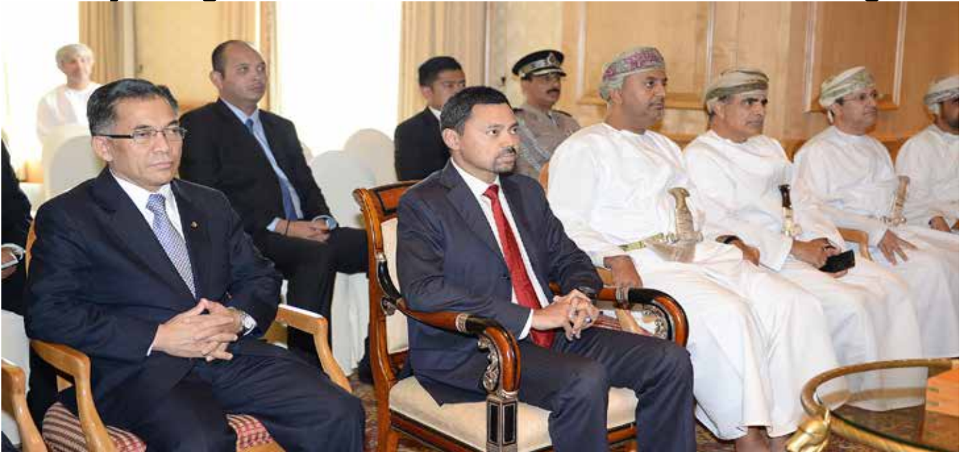
His Royal Highness Prince Haji Al-Muhtadee Billah ibni His Majesty Sultan Haji Hassanal Bolkiah Mu'izzaddin Waddaulah attending a briefing on Planning and Development of Sultanate of Oman.

MUSCAT, February 4 – His Royal Highness Prince Haji Al-Muhtadee Billah ibni His Majesty Sultan Haji Hassanal Bolkiah Mu'izzaddin Waddaulah, The Crown Prince and Senior Minister at the Prime Minister's Office (PMO), consented to attend The Planning and Development of Sultanate of Oman Ceremony held in Grand Hyatt Hotel's Special Room.