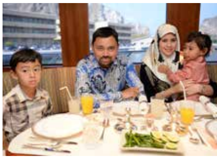
8 His Royal Highness, Her Royal Highness attend luncheon