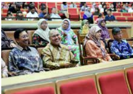
13 Her Royal Highness attends Japanese Traditional Music Concert