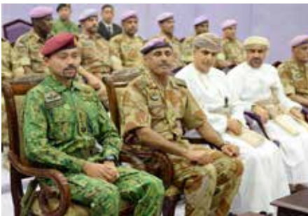
9 His Royal Highness visits Muscat