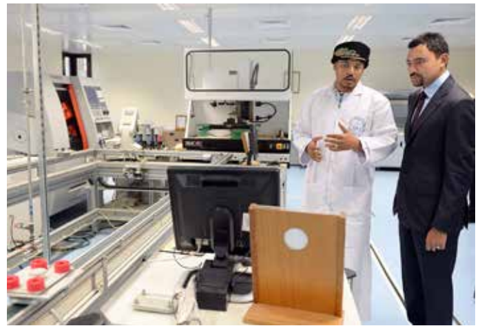
His Royal Highness was briefed on the parts of the laboratory equipment.