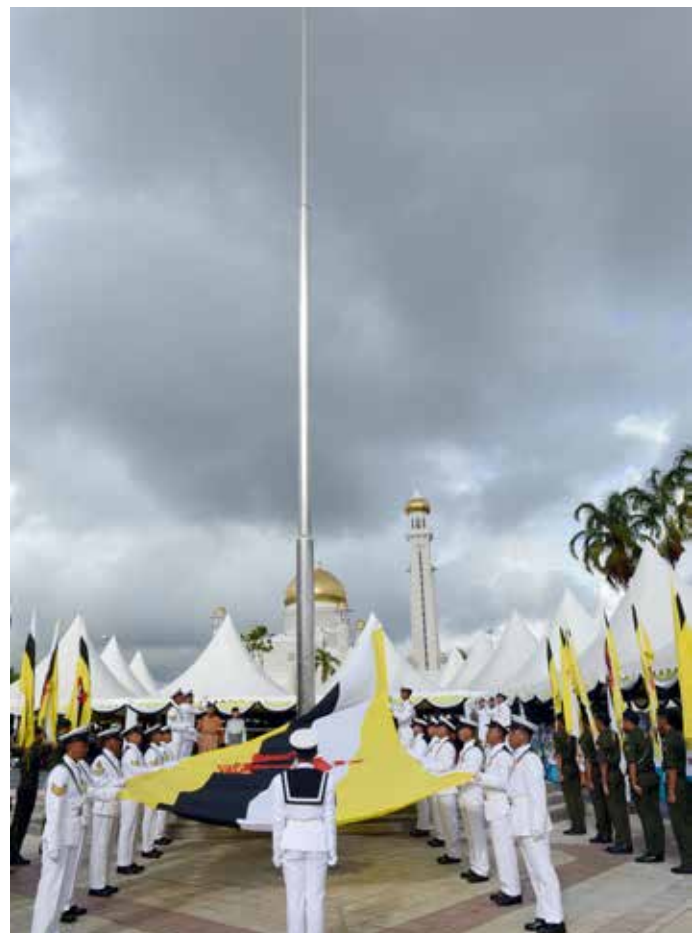
The giant sized national flag of Brunei Darussalam being raised by the Royal Brunei Navy (RBN).