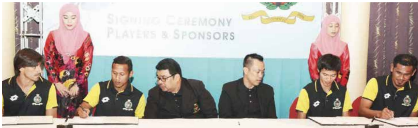
Club Manager and Team Manager of DPMM Football Club during the contract signing ceremony for the DPMM Football Club 2014.

The opening match of the DPMM Football Club will begin on February 22 on the outside court against Albirex Niigata team and on February 28 play home against the Warriors FC.