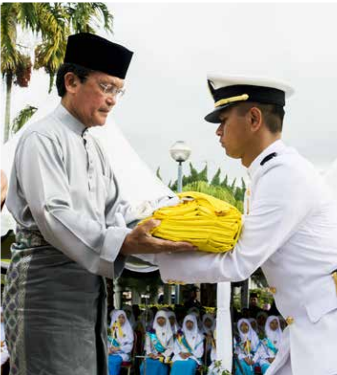
Yang Berhormat Minister of Education handing over the giant-sized national flag to the Royal Brunei Navy (RBN) at the Flag Hoisting Ceremony.

BANDAR SERI BEGAWAN, February 9 - A flag hoisting ceremony was held in the open space of Yayasan Sultan Haji Hassanal Bolkiah in conjunction with Brunei Darussalam's 30th National Day celebration.