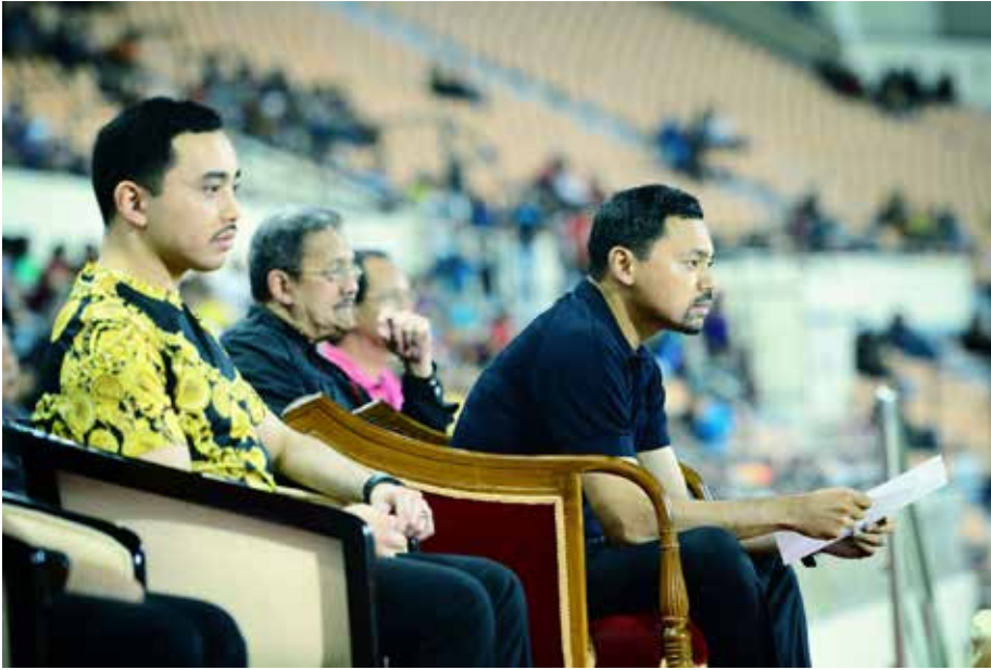
His Royal Highness Prince Haji Al-Muhtadee Billah ibni His Majesty Sultan Haji Hassanal Bolkiah Mu'izzaddin Waddaulah, The Crown Prince and The Senior Minister at the Prime Minister's Office, His Royal Highness Prince 'Abdul Malik and His Royal Highness Prince Haji Sufri Bolkiah during the match.