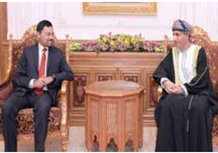
7 His Royal Highness holds bilateral meeting