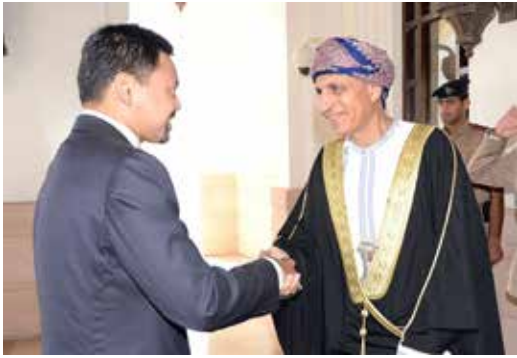
His Royal Highness Prince Haji Al-Muhtadee Billah ibni His Majesty Sultan Haji Hassanal Bolkiah Mu'izzaddin Waddaulah, The Crown Prince and Senior Minister in the Prime Minister's Office (PMO) welcomed by Deputy Prime Minister, His Highness Sayyid Fahad bin Mahmoud Al Said upon arrival at His Highness's office.