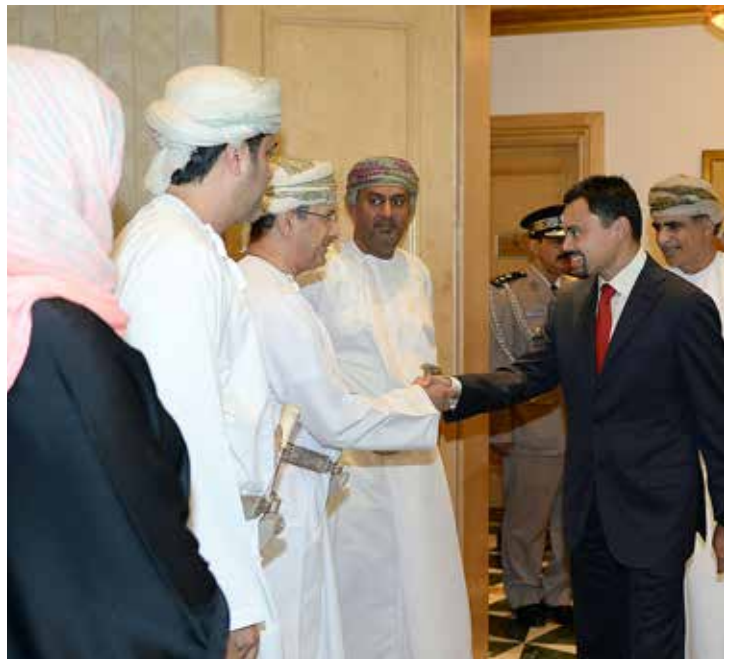
His Royal Highness being introduced to members of the Supreme Council for Planning of the Sultanate of Oman.