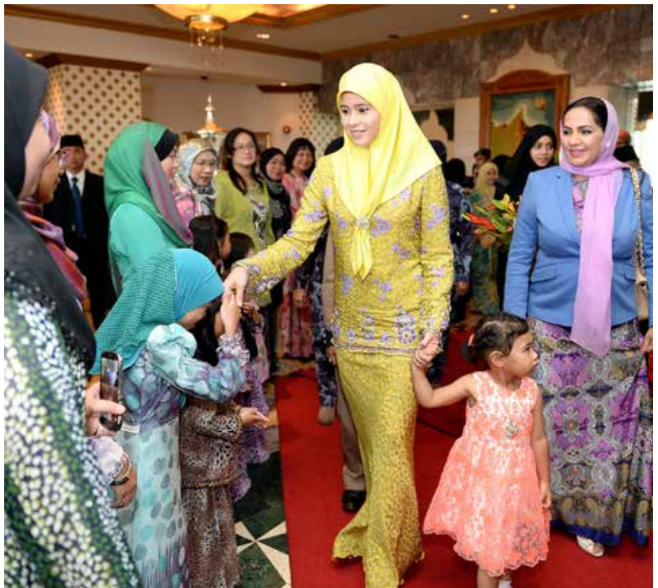
Her Royal Highness Paduka Seri Pengiran Anak Pengiran Anak Sarah binti Pengiran Haji Salleh Ab Rahaman receiving greetings from the people of Brunei Darussalam's in Muscat, Oman upon arrival at the Grand Hyatt Hotel.

of the Sultanate of Oman, His Highness Sayyid Fahad bin Mahmoud Al Said. Brunei Darussalam and the Sultanate of Oman established diplomatic relations on 24 March 1984. The Embassy of Brunei Darussalam in Muscat was established on 1 February 1980.