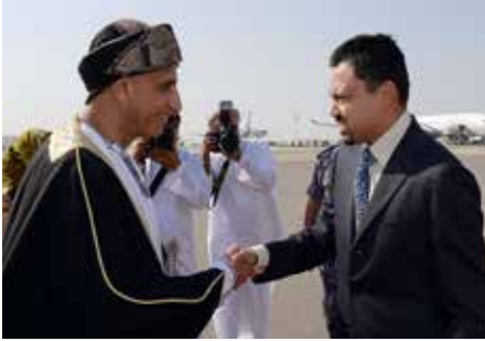
5 His Royal Highness visits Muscat, Oman