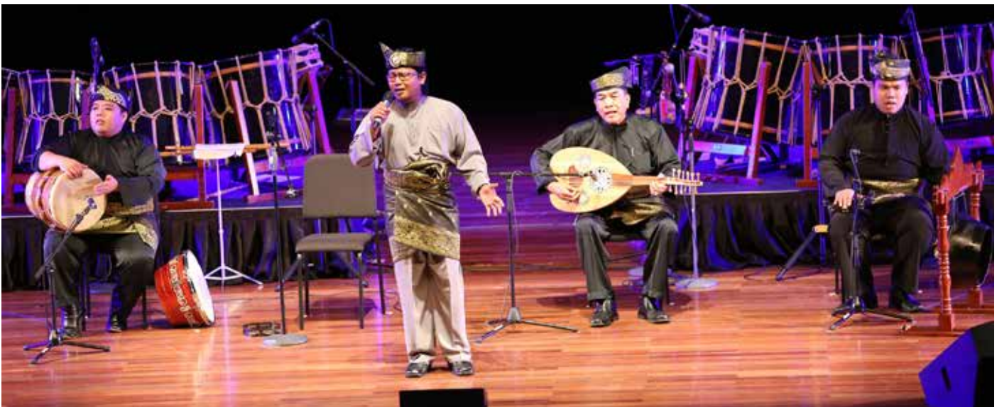
Culture performance by the Senandung Budaya Group.

Brunei Darussalam and Japan have established friendly relations through various cultural exchange between society, in addition to further strengthen the good relations between the two countries by providing more opportunities for cultural exchange. Cooperation and friendship between the two countries has become stronger since the establishment of diplomatic relations on 2 April 1984, which continues to strengthen and expand in various fields including trade and investment, education, culture, youth, industrial, agricultural and health.