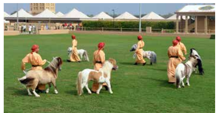
One of the performances during the visit to Royal Cavalry.

The country also has a high reputation and became the first Middle East country to become a full member of the 'World Arabia Horse Organization' (WAHO). Among the activities that Royal Cavalry participated were national and international horse racing competitions, as well as Arabian horses performances.