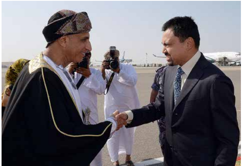
His Royal Highness Prince Haji Al-Muhtadee Billah ibni His Majesty Sultan Haji Hassanal Bolkiah Mu'izzaddin Waddaulah, Senior Minister at the Prime Minister's Office was greeted by His Highness Sayyid Fahad bin Mahmoud Al-Said, Deputy Prime Minister of Sultanate of Oman Ministers Council.

According to the press release of the Prime Minister's Office of Brunei Darussalam, His Royal Highness and Her Royal Highness' official visit to the Sultanate of Oman was hosted by Deputy Prime Minister for the Council of Ministers