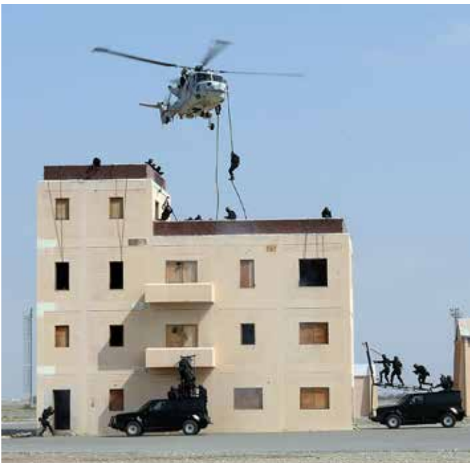
A part of military demonstrations shown during His Royal Highness's visit to Sultan Special Forces Headquarters.