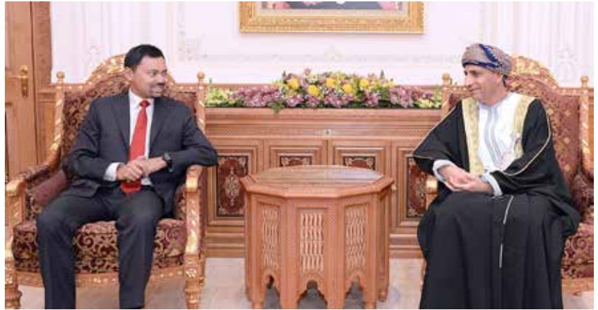
His Royal Highness and Deputy Prime Minister, His Highness Sayyid Fahad bin Mahmoud Al Said exchanging views on efforts to enhance cooperation.

MUSCAT, February 4 - His Royal Highness Prince Haji Al-Muhtadee Billah ibni His Majesty Sultan Haji Hassanal Bolkiah Mu'izzaddin Waddaulah, The Crown Prince and Senior Minister at the Prime Minister's Office (PMO) consented to hold a bilateral meeting with His Highness Sayyid Fahad bin Mahmoud Al Said, Deputy Prime Minister for the Council of Ministers held at His Highness's Office.