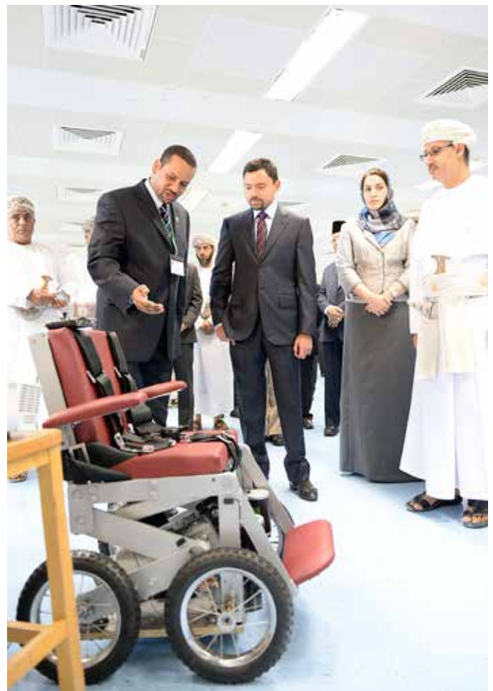
His Royal Highness visiting several laboratories such as NANO laboratories, Industrial Engineering labs, Research and Applied Analysis Unit at the College of Science.