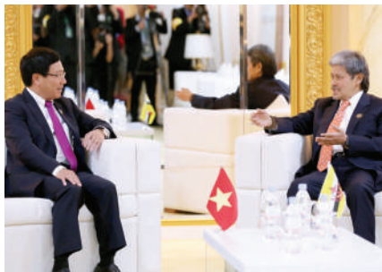
11. HRH Prince Mohamed Bolkiah holds bilateral discussions