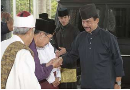
4. Doa Kesyukuran Ceremony for 67th Anniversary of His Majesty's Birthday Celebration