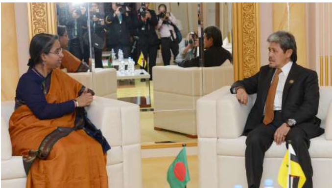
Her Excellency Doctor Dipu Moni, Foreign Minister of Bangladesh;