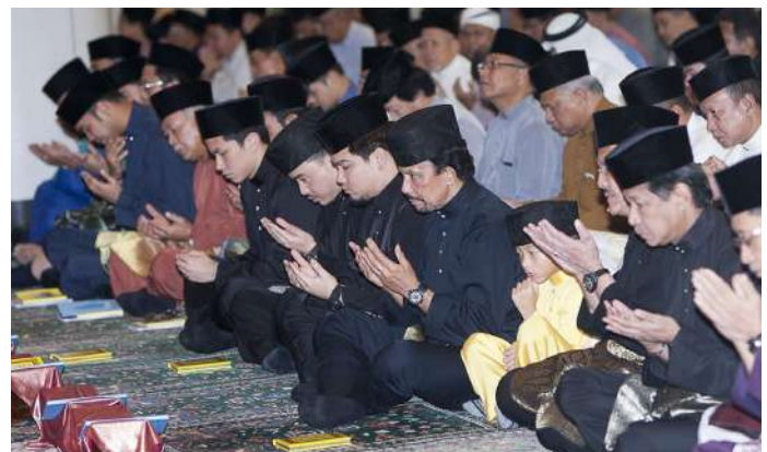
His Majesty the Sultan and Yang Di-Pertuan of Brunei Darussalam, and members of the royal family during the Doa Kesyukuran ceremony.

The Doa Kesyukuran Ceremony in conjunction with His Majesty's 67th Birthday Celebration marks the beginning of the