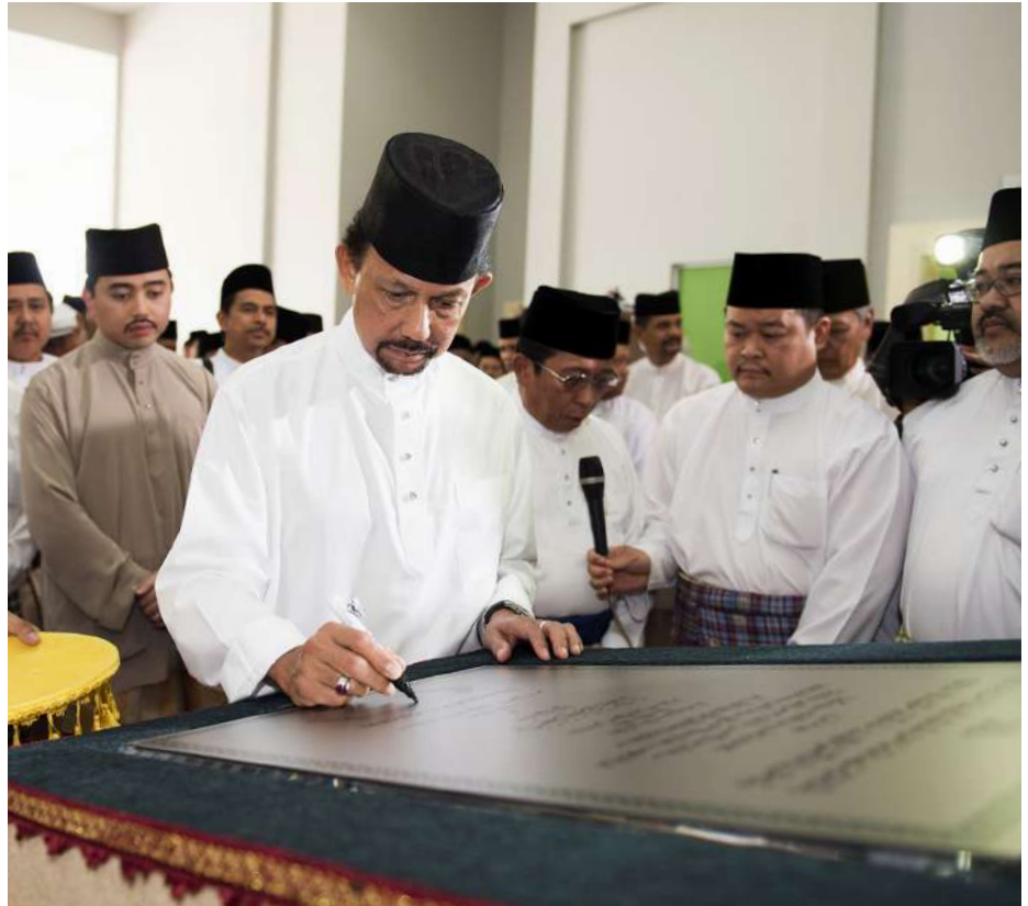
His Majesty Sultan Haji Hassanal Bolkiah Mu'izzaddin Waddaulah ibni Al-Marhum Sultan Haji Omar 'Ali Saifuddien Sa'adul Khairi Waddien, Sultan and Yang Di-Pertuan of Brunei Darussalam signing the Commemorative Plaque.

The construction work of the Jefri Bolkihah Mosque began in November 2011 and completed in 2013 under the 2007-