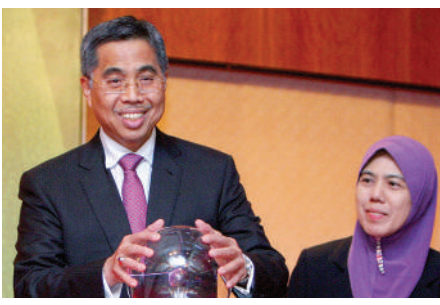
15. Scientific development, medical technology continues to be upgraded