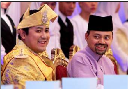
10. Their Royal Highnesses attends 'Majlis Istiadat Bersanding'