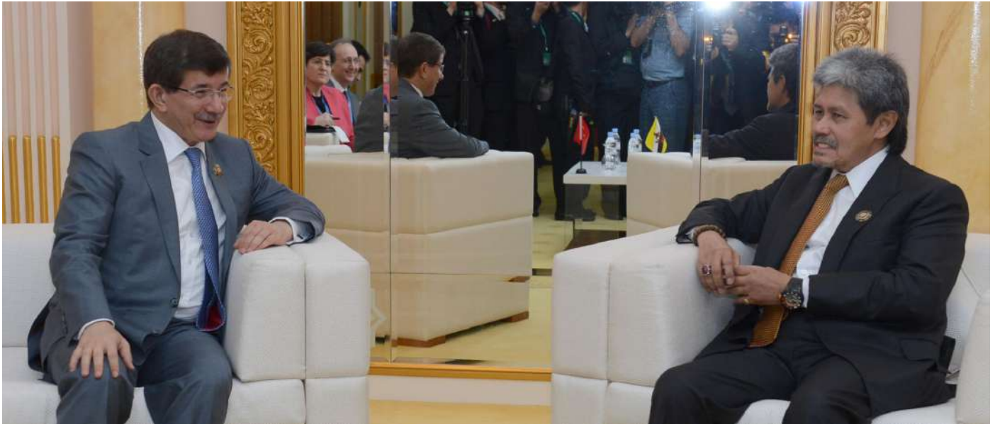
His Excellency Ahmet Davutoglu, Minister of Foreign Affairs of Turkey;