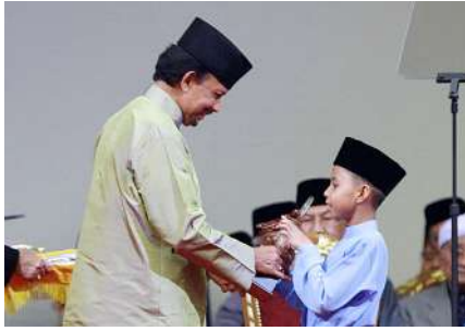
5. National Level Al-Qur'an Memorisation and Understanding Competition