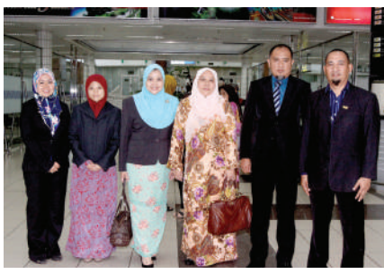
16. Government officials departs to Malaysia