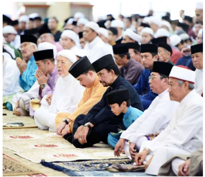
His Majesty the Sultan and Yang Di-Pertuan of Brunei Darussalam and members of the royal family together with the other congregants listening to the Friday sermons, which among others touched on the caution of the mosque as The Al-Mighty's Home ( Rumah Allah ) in the land that is holy place where Muslims devote themselves to Allah Subhanahu Wata'ala.

BANDAR SERI BEGAWAN, July 19. His Majesty Sultan Haji Hassanal Bolkiah Mu'izzaddin Waddaulah ibni Al-Marhum Sultan Haji Omar 'Ali Saifuddien Sa'adul Khairi Waddien, the Sultan and Yang Di-Pertuan of Brunei Darussalam consented to perform the first Friday Prayer at Rashidah Sa'adatul Bolkiah Mosque, Kampung Sungai Akar.