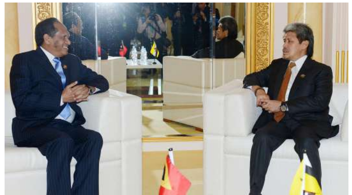
His Excellency Jose Luis Guterres, Foreign Minister of Timor Leste;