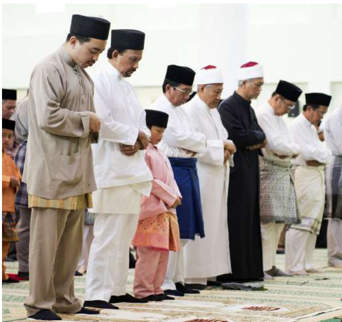
His Majesty the Sultan and Yang Di-Pertuan of Brunei Darussalam and members of the royal family proceed to join other congregants for Friday prayers.

With the opening of the mosque, the number of mosques, prayer room and prayer hall throughout the country is now 116.