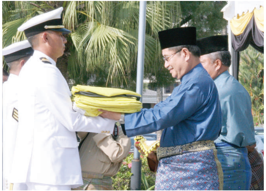
Yang Berhormat Pehin Udana Khatib Dato Paduka Seri Setia Ustaz Haji Awang Badaruddin bin Pengarah Dato Paduka Haji Othman, Minister of Home Affairs as the Chairman of the His Majesty the Sultan and Yang Di-Pertuan of Brunei Darussalam’s 67th Birthday Anniversary Celebrations National Committee handing over the giant national flag to a Royal Brunei Navy personnel.