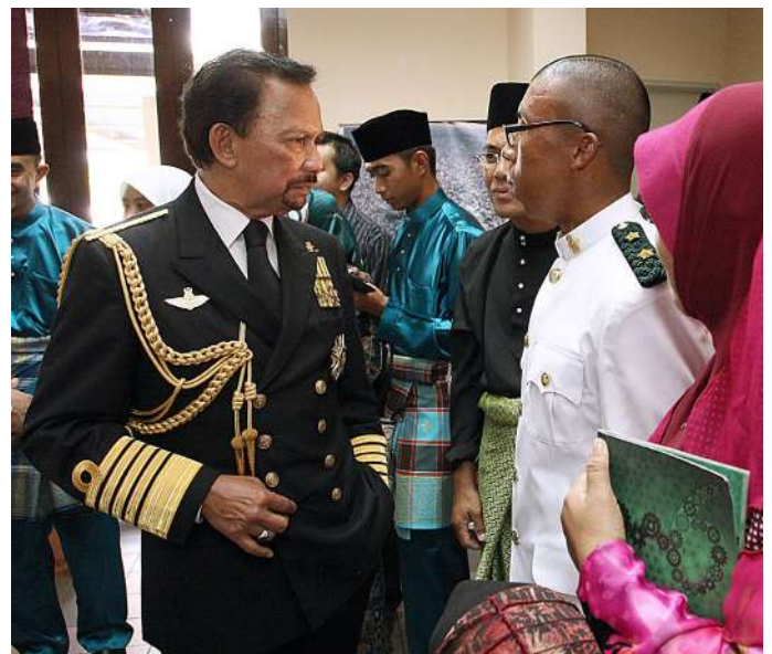
His Majesty mingling with one of the officer cadets and their parents at the award ceremony.

His Majesty also consented to sign the Royal Parchment and consented to receive the 'junjung ziarah' greetings from instructors and officers of the OCS and several foreign military officers. The event then ended with a group photo session.