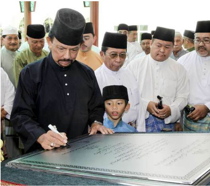
His Majesty Sultan Haji Hassanal Bolkiah Mu'izzaddin Waddaulah ibni Al-Marhum Sultan Haji Omar 'Ali Saifuddien Sa'adul Khairi Waddien, Sultan and Yang Di-Pertuan of Brunei Darussalam signing the Commemorative Plaque. Also in attendance were His Royal Highness Prince 'Abdul Malik and His Royal Highness Prince 'Abdul Wakeel.