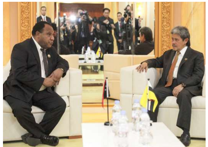
The Honourable Rimbink Pato, Minister of Foreign Affairs and Immigration of Papua New Guinea;