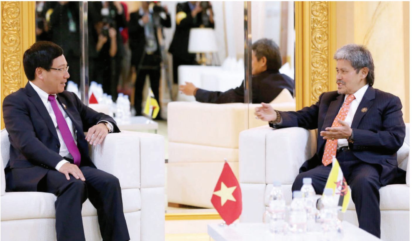
His Royal Highness Prince Mohamed Bolkiah Ibni Al-Marhum Sultan Haji Omar 'Ali Saifuddien Sa'adul Khairi Waddien, the Minister of Foreign Affairs and Trade with His Excellency Pham Binh Minh, Minister of Foreign Affairs of Viet Nam;

BANDAR SERI BEGAWAN, June 30 to July 1 – As the 46th ASEAN Ministerial Meetings, the 20th ASEAN Regional Forum and 3rd East Asia Summit Foreign Minister's Meeting were held in Bandar Seri Begawan, His Royal Highness Prince Mohamed Bolkiah Ibni Al-Marhum Sultan Haji Omar 'Ali Saifuddien Sa'adul Khairi Waddien, the Minister of Foreign Affairs and Trade held separate bilateral