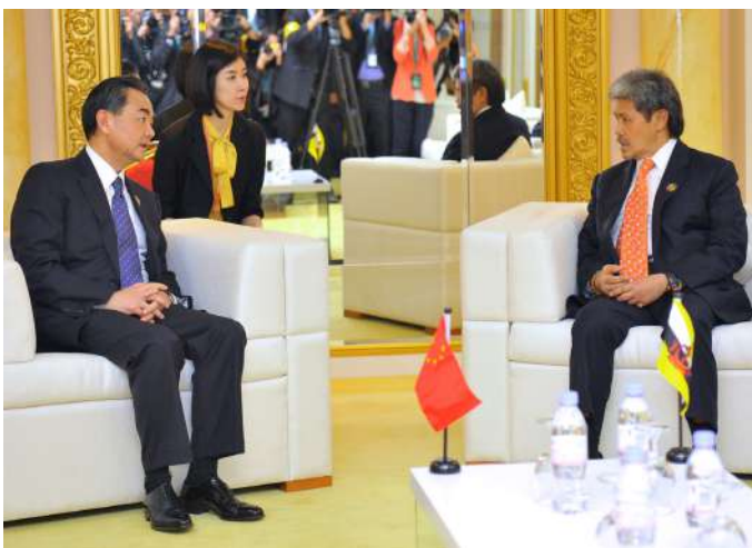
His Excellency Wang Yi, Minister of Foreign Affairs of China;

Excellency Jose Luis Guterres, Foreign Minister of Timor Leste; His Excellency Luvsanvandan Bold, Minister of Foreign Affairs of Mongolia; His Excellency John Baird, Minister of Foreign Affairs of Canada; His Excellency Sergey V. Lavrov, Minister of Foreign Affairs of Russia and His Excellency Kishida Fumio, Minister of Foreign Affairs of Japan.