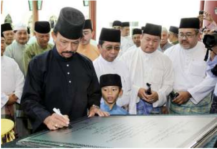
7. First Friday prayer at Rashidah Sa'adatul Bolkiah Mosque