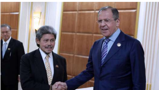
His Excellency Sergey V. Lavorv, Minister of Foreign Affairs of Russia