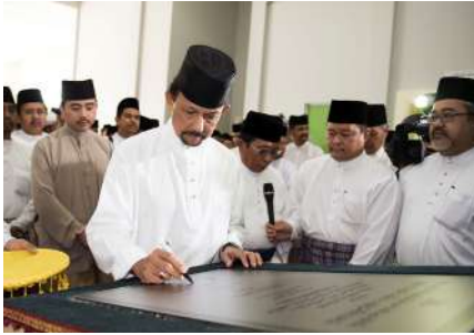
8. First Friday Prayer at Jefri Bolkiah Mosque