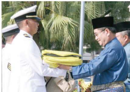
14. Giant National Flag marks start of birthday celebrations