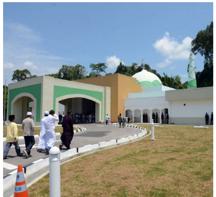
The Jefri Bolkihah Mosque, Kampung Batong began in November 2011 and completed in 2013 under the 2007-2012 National Development Plan (RKN) project costing almost BND2.1 million.