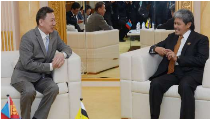
His Excellency Luvsanvandan Bold, Minister of Foreign Affairs of Mongolia;