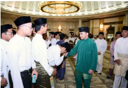
11. 67 times Khatam Al-Quran ceremony