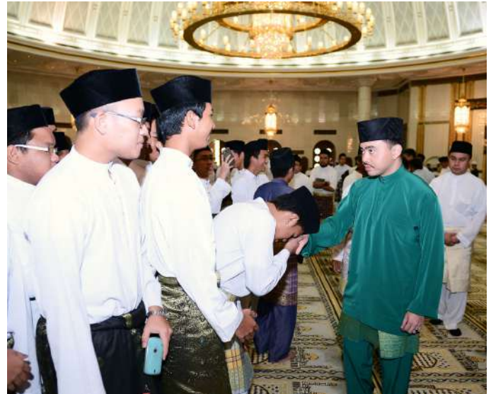
His Royal Highness Prince 'Abdul Malik receiving the junjung ziarah from the participants of Khatam Al-Qur'an 67 times for students and youths in conjunction with the anniversary of His Majesty's 67th birthday.

BANDAR SERI BEGAWAN, Monday, July 9. – His Royal Highness Prince 'Abdul Malik ibni His Majesty Sultan Haji Hassanal Bolkiah Mu'izzaddin Waddaulah consented to join students and youths in the 67 times Khatam Al-Quran (completion of all chapters in the Quran) ceremony held in conjunction with 67th Birthday Celebration of His Majesty Sultan Haji Hassanal Bolkiah Mu'izzaddin Waddaulah ibni Al-Marhum Sultan Haji Omar 'Ali Saifuddien Sa'adul Khairi Waddien, The Sultan and Yang Di-Pertuan of Brunei Darussalam.