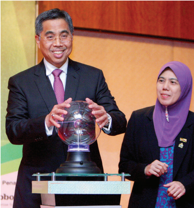
Yang Berhormat Pehin Orang Kaya Johan Pahlawan Dato Seri Setia Awang Haji Adanan bin Begawan Pehin Siraja Khatib Dato Seri Setia Awang Haji Mohd. Yusof, Minister of Health officiated the 2nd National Scientific Symposium.

BANDAR SERI BEGAWAN, July 7. – The National Scientific Symposium is an effort made by the Laboratory Services Department to increase knowledge about current scientific and technological developments in the field of laboratory medicine, as well as to share ideas and information with experts on the development of medical laboratory diagnostic services.