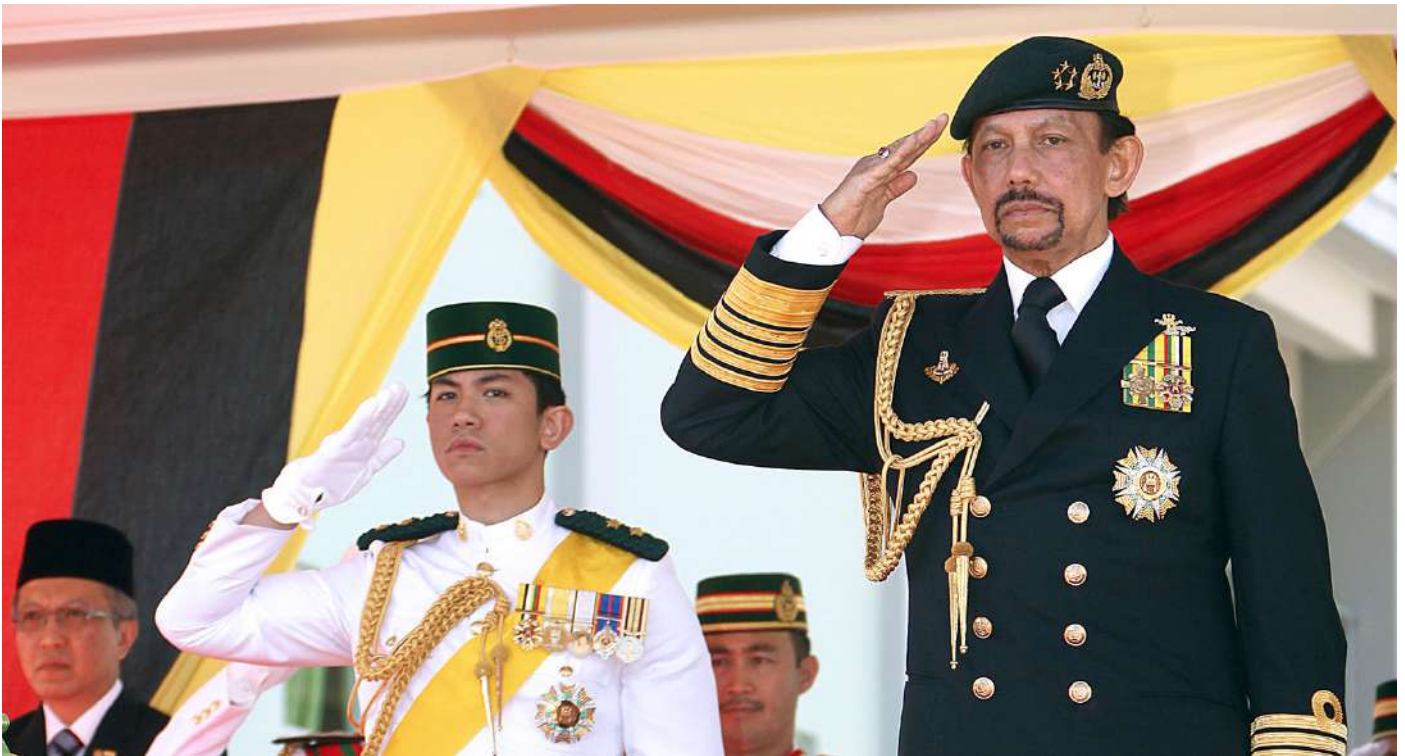
His Majesty Sultan Haji Hassanal Bolkhiah Mu'izzaddin Waddaulah ibni Al-Marhum Sultan Haji Omar 'Ali Saifuddin Sa'adul Khairi Waddien, Sultan and Yang Di-Pertuan of Brunei Darussalam, Minister of Defence and Supreme Commander of Royal Brunei Armed Forces (RBAF) receiving the Royal Salute.