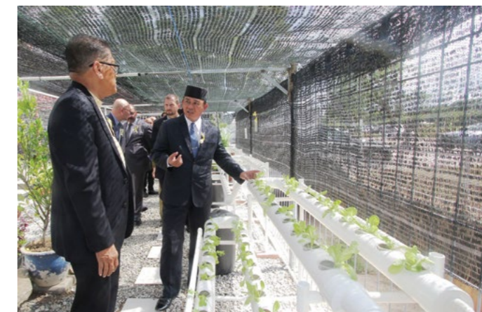
The Minister taking a closer look at the Smarter Brunei-Telbru Hydroponics Garden.

This year, WAAD carries the theme 'Assistive Technologies, Active Participation' where autism supporters across the world have begun to shift their focus from consciousness to acceptance.