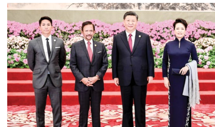
His Majesty Sultan Haji Hassanal Bolkiah Mu'izzaddin Waddaulah ibni Al-Marhum Sultan Haji Omar 'Ali Saifuddien Sa'adul Khairi Waddien, Sultan and Yang Di-Pertuan of Brunei Darussalam with His Excellency Xi Jinping, President of the People's Republic of China and spouse. Accompanying His Majesty was His Royal Highness Prince 'Abdul Mateen.

The Gala Dinner began with a speech from His Excellency President Xi Jinping, welcoming all the leaders and all of their delegation. The Gala Dinner also featured a number of cultural and musical performances.