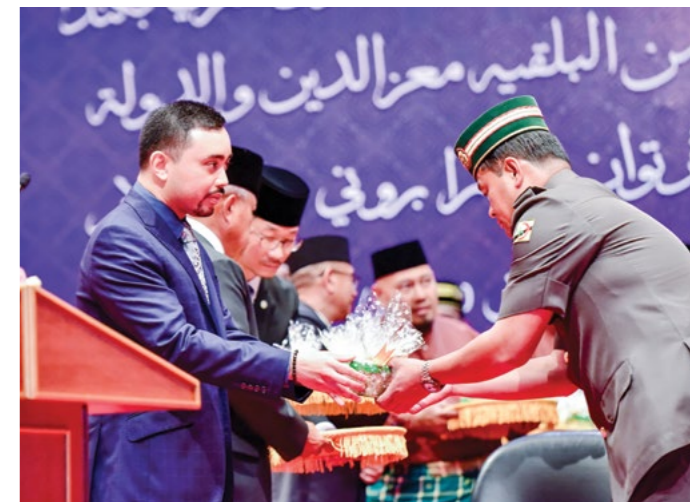
His Royal Highness presenting His Majesty's Personal Gift of Dates to a representative of the Royal Brunei Armed Forces.

His Royal Highness then delivered a sabda (royal speech) and presented His Majesty's Personal Gift of dates to Military Commanders as well as the Commandant of the Royal Brunei Armed Forces (RBAF) Training Institute; Formation Directors of the Royal Brunei Police Force; Penghulu Mukims and Heads of Village.