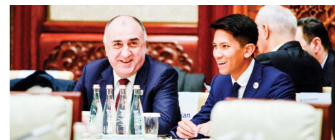
Accompanying His Majesty was His Royal Highness Prince 'Abdul Mateen.

After the first session, His Majesty attended a Working Luncheon