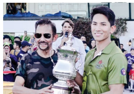
13. Charity Polo Day 2019