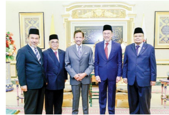
Yang Berhormat Dato' Seri Anwar bin Ibrahim, Member of Parliament of the House of Representatives (Port Dickson Parliamentary Constituency) and the President of the Parti Keadilan Rakyat, Malaysia on April 16.

His Majesty Sultan Haji Hassanal Bolkiah Mu'izzaddin Waddaulah ibni Al-Marhum Sultan Haji Omar 'Ali Saifuddien Sa'adul Khairi Waddien, Sultan and Yang Di-Pertuan of Brunei Darussalam received in audience at Istana Nurul Iman: