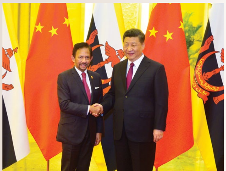
His Majesty Sultan Haji Hassanal Bolkiah Mu'izzaddin Waddaulah ibni Al-Marhum Sultan Haji Omar 'Ali Saifuddien Sa'adul Khairi Waddien, Sultan and Yang Di-Pertuan of Brunei Darussalam with His Excellency Xi Jinping, President of the People's Republic of China, which took place at East Hall, Great Hall of the People, Beijing.