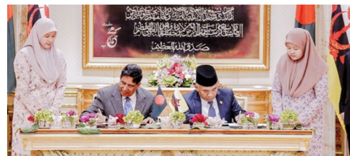
Yang Berhormat Dato Seri Setia Awang Haji Ali bin Haji Apong, Minister of Primary Resources and Tourism, on behalf of His Majesty's Government and His Excellency Mr. Muhammad Abdur Razzaque, the Honourable Minister for Agriculture on behalf of the Government of the People's Republic of Bangladesh signing the MoU on Scientific and Technical Cooperation in the field of Agriculture.

The Minister of Culture, Youth and Sports also signed on behalf of His Majesty's Government, the MoU on Cultural and Arts Cooperation. While signing on behalf of the People's Republic of Bangladesh was His Excellency Mr. K.M Khalid, the Honourable State Minister for Cultural Affairs.