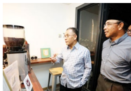
19. Launch of 2 nd BIBD Connects