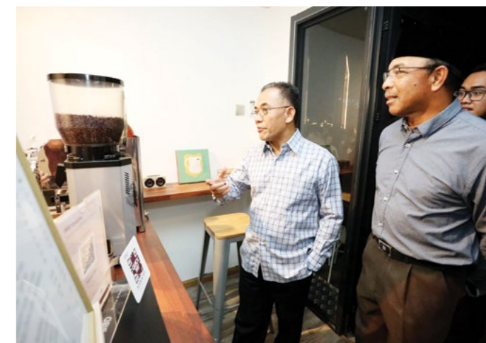
The Minister of Primary Resources and Tourism; and the Minister of Development touring one of the local food & beverages outlet housed at BIBD Connects.

Construction of the hub began on the 18 th of March 2019 and was completed in 30 days, showcasing Brunei's capabilities on modern architecture, and BIBD's collaboration with local designers and contractors in design-thinking new concepts, and making them into a reality.