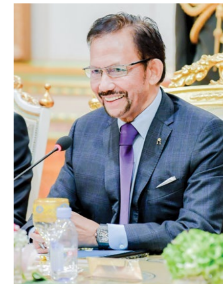
His Majesty the Sultan and Yang Di-Pertuan of Brunei Darussalam during the bilateral meeting with Her Excellency the Honourable Prime Minister of the People's Republic of Bangladesh.

Government of the People's Republic of Bangladesh.