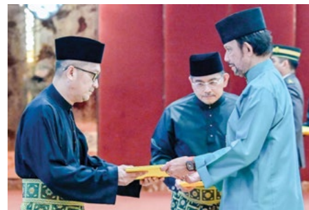
14. His Majesty presents Letters of Credence