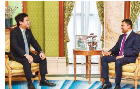
Special Advisor to the Prime Minister of Japan, His Excellency Kentaro Sonoura on April 23.