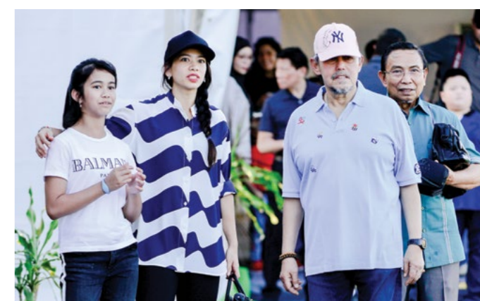
His Royal Highness Prince Mohamed Bolkiah, Her Royal Highness Princess Fadzilah Lubabul Bolkiah and Her Royal Highness Princess Ameerah Wardatul Bolkiah at the Charity Polo Day 2019.

His Majesty consented to present the trophy and prizes to the winners of the Polo match.