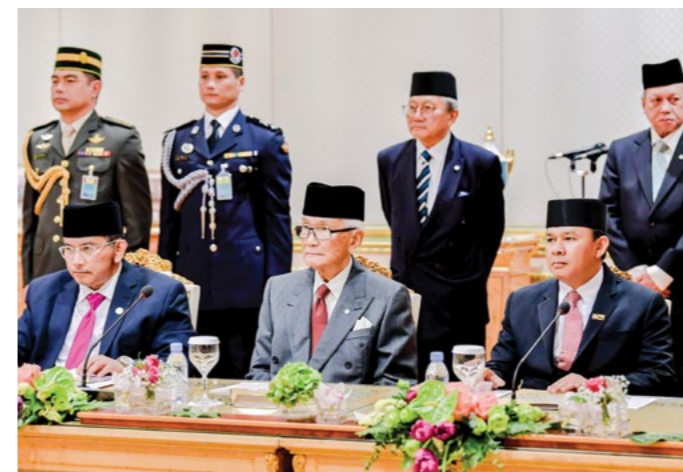
Among the Cabinet Ministers present during the bilateral meeting.