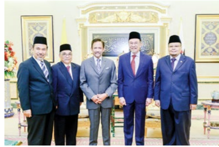
3. His Majesty receives audiences