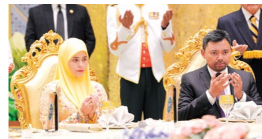
Also present at the Official Banquet were His Royal Highness Prince Haji Al-Muhtadee Billah, the Crown Prince and Senior Minister at the Prime Minister's Office and Her Royal Highness Paduka Seri Pengiran Anak Isteri Pengiran Anak Sarah binti Pengiran Haji Salleh Ab Rahaman; His Royal Highness Prince 'Abdul Malik; Yang Amat Mulia Pengiran Anak Isteri Pengiran Raabi'atul 'Adawiyah binti Pengiran Haji Bolkiah; and His Excellency A.K. Abdul Momen, the Honourable Foreign Minister.

The signing of Memorandums of Understanding (MoUs) today will strengthen further our relationship and will ensure that it continues to keep strong in the future," added His Majesty.