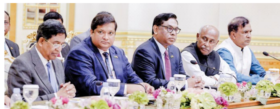
Among the delegation from the People's Republic of Bangladesh during the bilateral meeting.