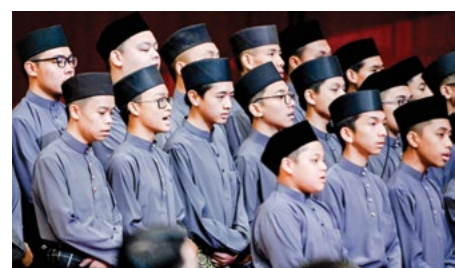
A mass recital of Sayyidul Istighfar by students of the Sultan Haji Hassanal Bolkiah Tahfiz Al-Quran Institute.