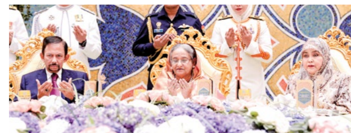
His Majesty Sultan Haji Hassanal Bolkiah Mu'izzaddin Waddaulah ibni Al-Marhum Sultan Haji Omar 'Ali Saifuddien Sa'adul Khairi Waddien, Sultan and Yang Di-Pertuan of Brunei Darussalam and Her Majesty Duli Raja Isteri Pengiran Anak Hajah Saleha binti Al-Marhum Pengiran Pemancha Pengiran Anak Haji Mohamed Alam with Her Excellency Sheikh Hasina, the Honourable Prime Minister of the People's Republic of Bangladesh during the Official Banquet at Istana Nurul Iman.

BANDAR SERI BEGAWAN, April 22 - His Majesty Sultan Haji Hassanal Bolkiah Mu'izzaddin Waddaulah ibni Al-Marhum Sultan Haji Omar 'Ali Saifuddien Sa'adul Khairi Waddien, Sultan and Yang Di-Pertuan of Brunei Darussalam and Her Majesty Duli Raja Isteri Pengiran Anak Hajah Saleha binti Al-Marhum Pengiran Pemancha Pengiran Anak Haji Mohamed Alam held an Official Banquet in honour of Her Excellency Sheikh Hasina, the Honourable Prime Minister of the People's Republic of Bangladesh and delegation who are on an Official Visit to the country.