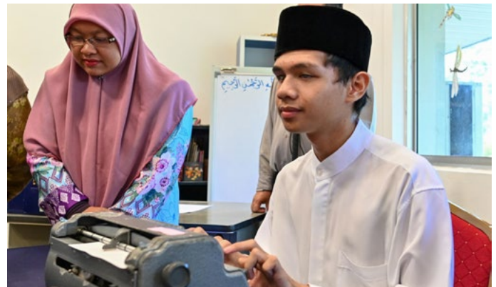
One of the visually impaired students trying the braille machine at the Braille, Orientation and Mobility Workshop.

Participants were also introduced to the braille machine as well as its functions, technical orientation and mobility in both theory and practical. Other than that, participants were also introduced to the functions, techniques and use of the White Crane.