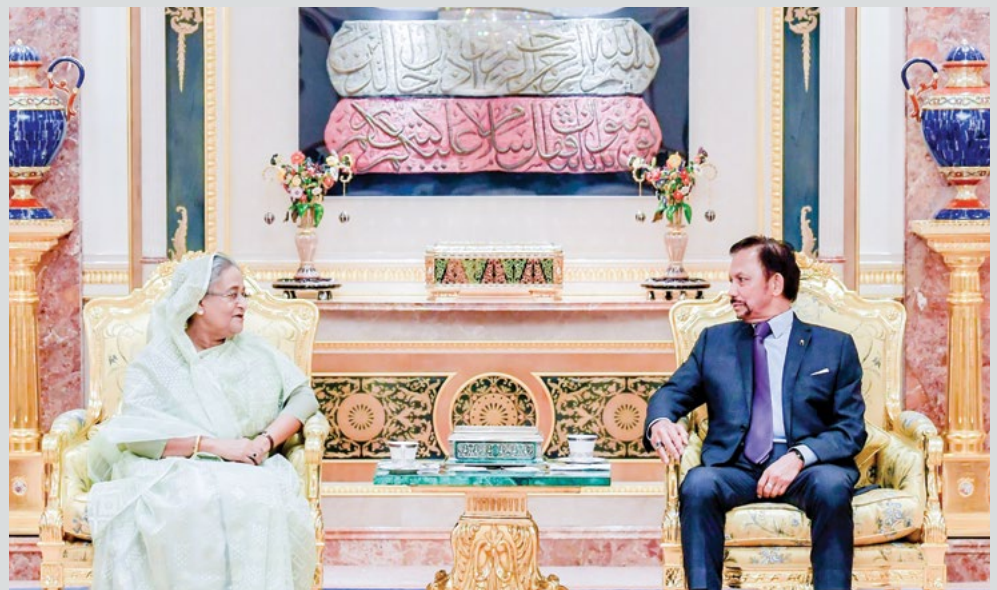
His Majesty Sultan Haji Hassanal Bolkiah Mu'izzaddin Waddaulah ibni Al-Marhum Sultan Haji Omar 'Ali Saifuddien Sa'adul Khairi Waddien, Sultan and Yang Di-Pertuan of Brunei Darussalam and Her Excellency Sheikh Hasina, the Honourable Prime Minister of the People's Republic of Bangladesh during the Audience Ceremony.