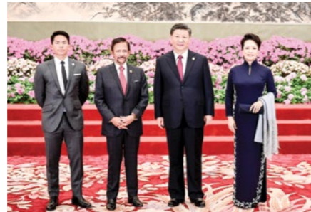
11. His Majesty attends Gala Dinner