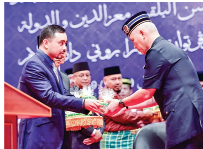
His Royal Highness Prince 'Abdul Malik ibni His Majesty Sultan Haji Hassanal Bolkiah Mu'izzaddin Waddaulah as the Chairman of the Yayasan Board of Governors presenting His Majesty's Personal Gift of Dates to a representative of the Royal Brunei Police Force.

BANDAR SERI BEGAWAN, April 16 - A total of 126 metric tonnes of Safawy dates were divided for all the Muslims in Brunei Darussalam, regardless of age and citizenship, where each person will receive a 300g box of dates.