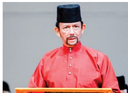
His Majesty Sultan Haji Hassanal Bolkiah Mu'izzaddin Waddaulah ibni Al-Marhum Sultan Haji Omar 'Ali Saifuddien Sa'adul Khairi Waddien, Sultan and Yang Di-Pertuan of Brunei Darussalam delivering a titah (royal speech) at the National Level Israk Mikraj celebration for 1440 Hijrah / 2019 Masihi at the International Convention Centre.

The verses describe the seven attributes that brings success and happiness in the world and Hereafter which include faith in Allah the Almighty, performing prayers