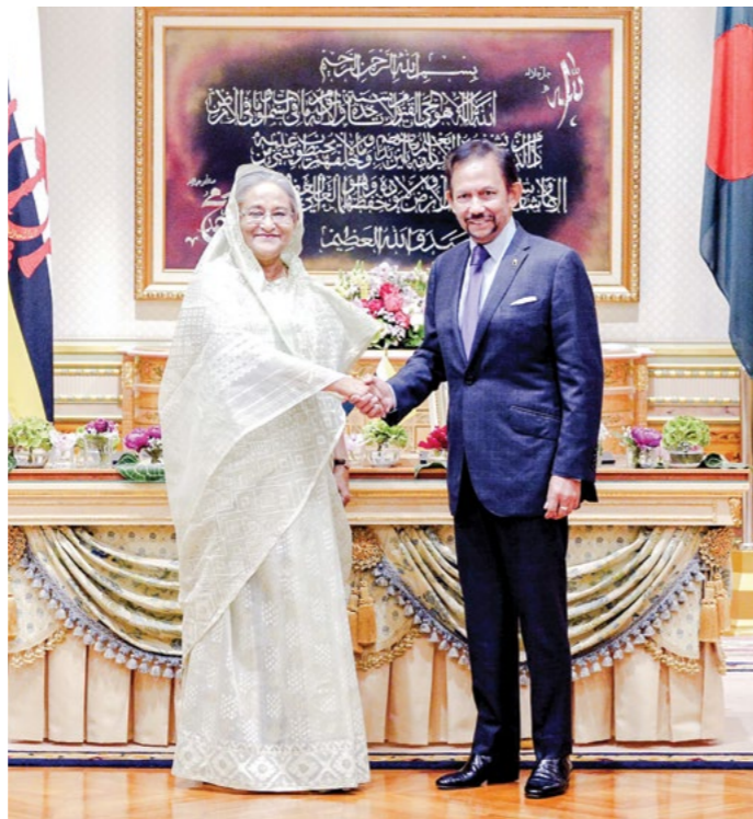
His Majesty the Sultan and Yang Di-Pertuan of Brunei Darussalam and Her Excellency the Honourable Prime Minister of the People's Republic of Bangladesh after the signing of Memorandum of Understandings (MoUs) between His Majesty's Government and Government of the People's Republic of Bangladesh.

The MoU on the Cooperation in the field of Youth and Sports was signed by Yang Berhormat Major General (Rtd) Dato Paduka Seri Haji Aminuddin Ihsan bin Pehin Orang Kaya Saiful Mulok Dato Seri Paduka Haji Abidin on behalf of His Majesty's Government and His Excellency Mr. Md. Zahid Ahsan Russel, the Honourable State Minister for Youth and Sports for the People's Republic of Bangladesh.