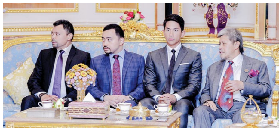
Also present at the Audience Ceremony were His Majesty's sons, brothers and sister; His Royal Highness Prince Haji Al-Muhtadee Billah, the Crown Prince and Senior Minister at the Prime Minister's Office; His Royal Highness Prince 'Abdul Malik; His Royal Highness Prince 'Abdul Mateen; and His Royal Highness Prince Mohamed Bolkih.