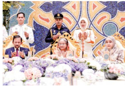
9. Official Banquet in honour of PM of People's Republic of Bangladesh's Official Visit