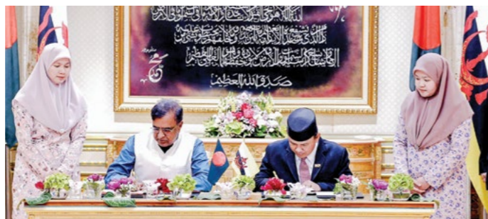
The Minister of Culture, Youth and Sports on behalf of His Majesty's Government and His Excellency Mr. K.M Khalid, the Honourable State Minister for Cultural Affairs on behalf of the People's Republic of Bangladesh signing the MoU on Cultural and Arts Cooperation.