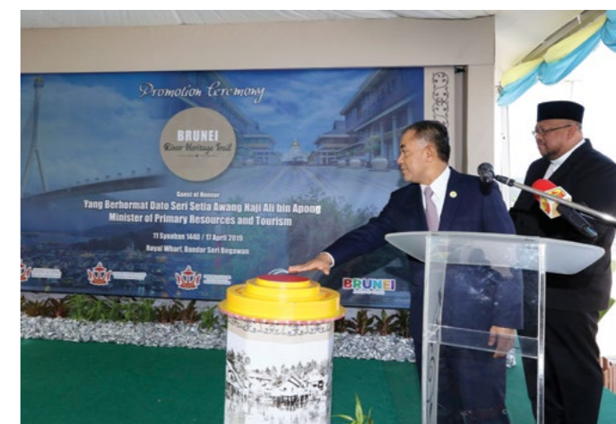
Yang Berhormat Dato Seri Setia Awang Haji Ali bin Haji Apong, Minister of Primary Resources and Tourism launching the 'Brunei River Heritage Trail' at the Royal Wharf.

Among those included in the 'Brunei River Heritage Trail' is the story of the history of the establishment of traditional houses on the river banks now known as Kampong Ayer; the legendary history of the island, among them the ' Jong Batu ', which tells the story of Nakhoda Manis and his mother; and ' Lumut Lunting ' - the story of war between the kings of Brunei with the Majapahit empire in the legend of ' Syair Awang Semaun '.