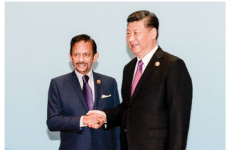
10. Trade connectivity, an important component