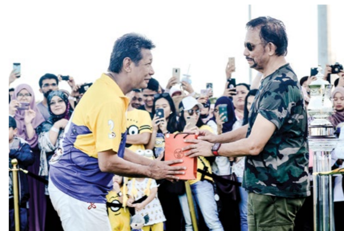
His Majesty presenting prizes to Team Minions, led by His Royal Highness Prince Haji Jefri Bolkiah (above) and to Team Smurfs, led by Her Royal Highness Princess 'Azemah Ni'matul Bolkiah (below).