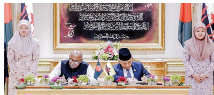
Minister of Primary Resources and Tourism, on behalf of His Majesty's Government and His Excellency Mr. Md. Ashraf Ali Khan Khasru, the Honourable State Minister for Ministry of Fisheries and Livestock on behalf of the Government of the People's Republic of Bangladesh signing the MoU on the Cooperation in the field of Fisheries.