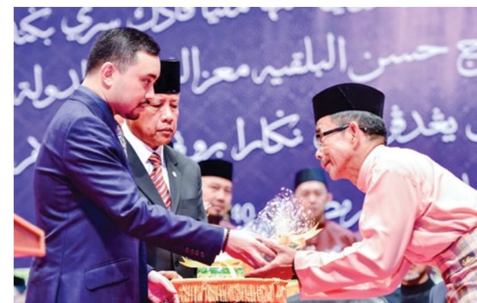
His Royal Highness presenting His Majesty's Personal Gift of Dates to one of the Penghulu Mukims and Heads of Village representing the citizens and residents in all districts.

To bless the ceremony, a Doa Selamat was read by the Chief Syarie Judge.