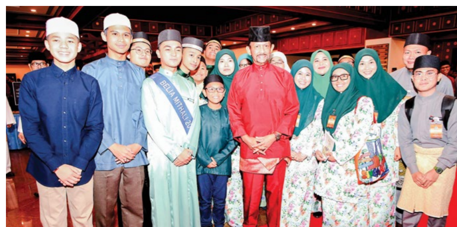
His Majesty in a group photo with students who performed the stage performance ' Kasih Illahi ' or 'Love of Allah'.

The theme of this year's celebration is ' Sembahyang Membentuk Umat Bertaqwa ' or 'Prayer Shapes a Pious Ummah'.