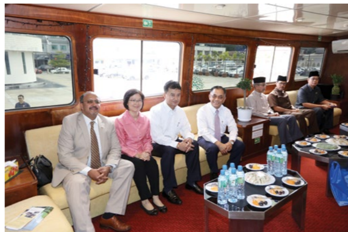
The Minister of Primary Resources and Tourism (fourth, left) with invited guests and Brunei Tourism Development Board Members onboard the Brunei River Cruise.

At the end of the event, the Minister along with invited guests and members of the Brunei Tourism Development Board were also taken aboard the Brunei River Cruise, which provided the opportunity to witness some of the interesting places offered in