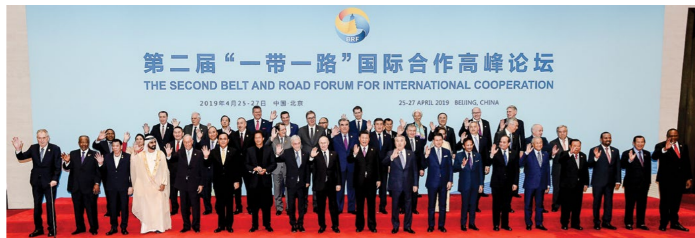
His Majesty in a memorial photograph session at the Welcoming Ceremony in conjunction with the 2 nd Belt and Road Forum for International Cooperation.