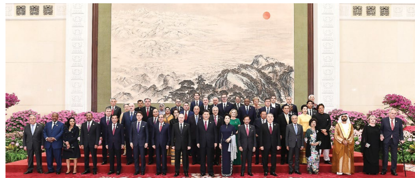
His Majesty with Leaders attending the Gala Dinner hosted by His Excellency President Xi Jinping in conjunction with the 2 nd Belt and Road Forum for International Cooperation. Also present was His Royal Highness Prince 'Abdul Mateen.