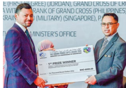
16. CIPTA Awards Ceremony