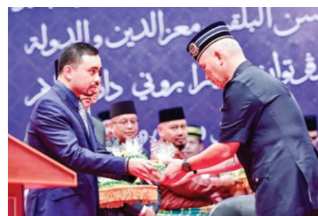
17. Launching of Distribution of His Majesty's Personal Gift of Dates