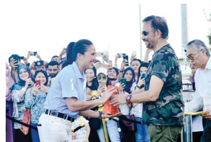
JERUDONG, April 21 - His Majesty Sultan Haji Hassanal Bolkiah Mu'izzaddin Waddaulah ibni Al-Marhum Sultan Haji Omar 'Ali Saifuddien Sa'adul Khairi Waddien, Sultan and Yang Di-Pertuan of Brunei Darussalam attended the Charity Polo Day 2019 at the Royal Brunei Polo and Riding Club.