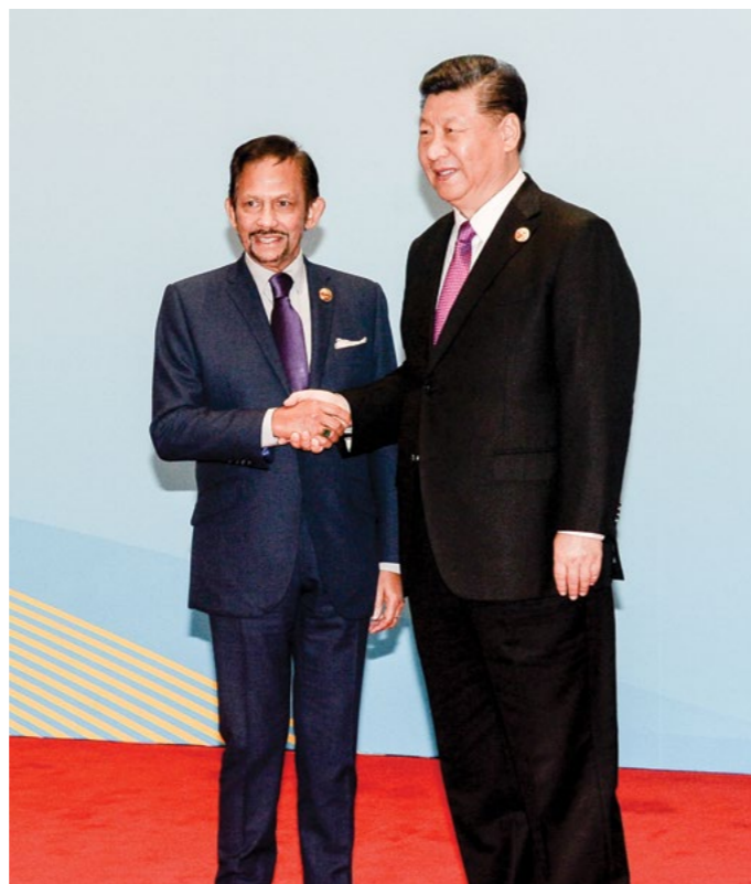
His Majesty being greeted by His Excellency Xi Jinping, President of the People's Republic of China at the Welcoming Ceremony in conjunction with the 2 nd Belt and Road Forum for International Cooperation, held at Yanqi Lake International Conference Center.

In the first session, His Majesty delivered a titah emphasising on the need to enhance trade connectivity; to reinforce a stable and transparent multilateral trading system; as well as to strengthen the regional engagement such as ASEAN and APEC in order to boost trade linkages and pro-growth and business-friendly