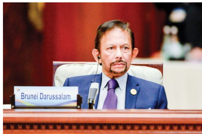
His Majesty Sultan Haji Hassanal Bolkiah Mu'izzaddin Waddaulah ibni Al-Marhum Sultan Haji Omar 'Ali Saifuddien Sa'adul Khairi Waddien, Sultan and Yang Di-Pertuan of Brunei Darussalam at the Leaders' Roundtable Session I : Boosting Connectivity to Explore New Sources of Growth.

BEIJING, April 27 - His Majesty Sultan Haji Hassanal Bolkiah Mu'izzaddin Waddaulah ibni Al-Marhum Sultan Haji Omar 'Ali Saifuddien Sa'adul Khairi Waddien, Sultan and Yang Di-Pertuan of Brunei Darussalam attended the Welcoming Ceremony in conjunction with the 2 nd Belt and Road Forum for International Cooperation. The ceremony was held at Yanqi Lake International Conference Center.