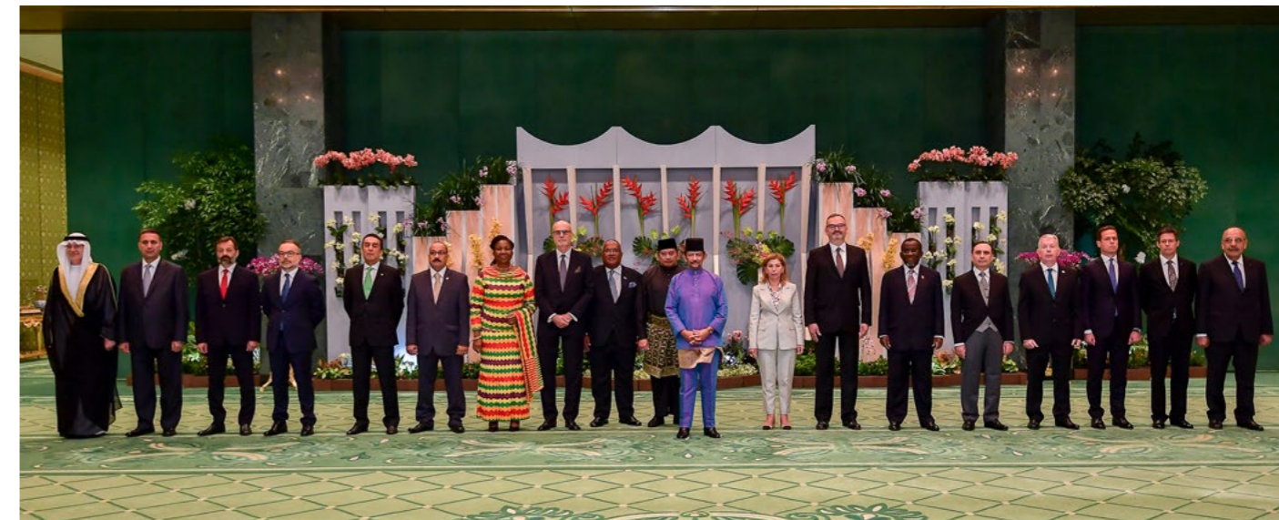
His Majesty Sultan Haji Hassanal Bolkiah Mu'izzaddin Waddaulah ibni Al-Marhum Sultan Haji Omar 'Ali Saifuddien Sa'adul Khairi Waddien, Sultan and Yang Di-Pertuan of Brunei Darussalam in a group photo with seventeen non-resident Foreign Envoys to Brunei Darussalam.

BANDAR SERI BEGAWAN, April 29 - His Majesty Sultan Haji Hassanal Bolkiah Mu'izzaddin Waddaulah ibni Al-Marhum Sultan Haji Omar 'Ali Saifuddien Sa'adul Khairi Waddien, Sultan and Yang Di-Pertuan of Brunei Darussalam, received Letters of Credence from seventeen non-resident Foreign Envoys to Brunei Darussalam. They were: