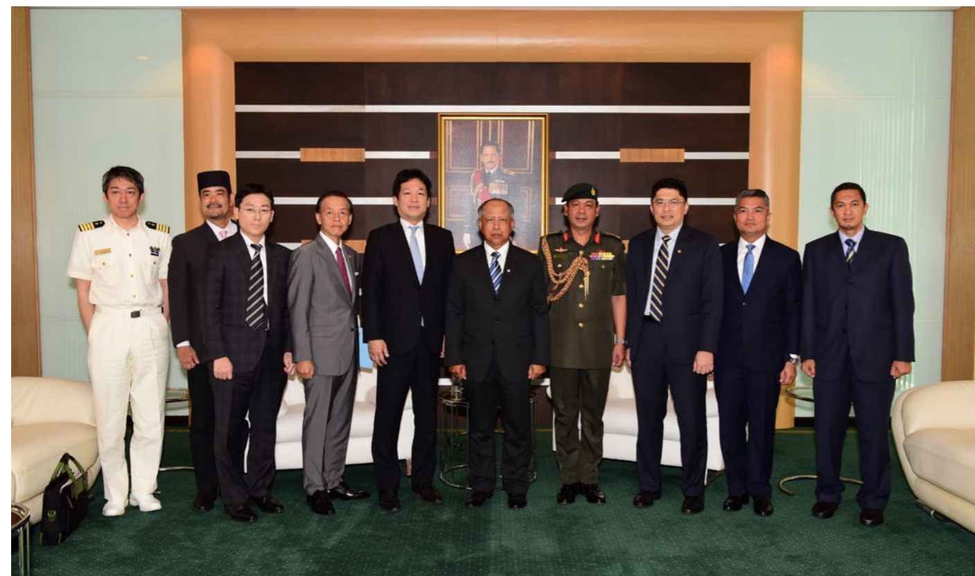
Yang Berhormat Pehin Datu Lailaraja Major General (Rtd) Dato Paduka Seri Haji Awang Halbi bin Haji Mohd. Yussof, Second Minister of Defence (fifth, right) during the courtesy call from His Excellency Kentaro Sonoura, Advisor to the Prime Minister (National Security) of Japan (fifth, left).

His Excellency is in Brunei Darussalam from the 22 nd until the 24 th of April 2019. His Excellency visited Brunei Darussalam previously in December 2017 to share on Japan's 'Free and Open Indo-Pacific Strategy'.