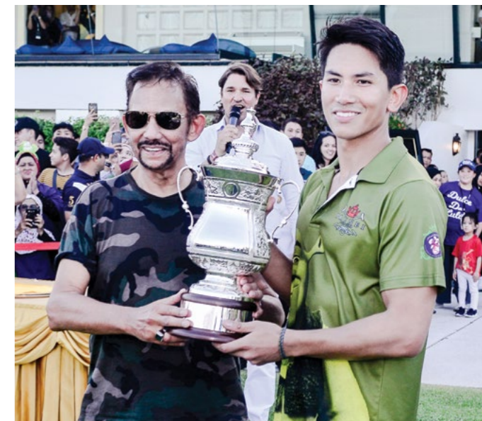
His Majesty Sultan Haji Hassanal Bolkiah Mu'izzaddin Waddaulah ibni Al-Marhum Sultan Haji Omar 'Ali Saifuddien Sa'adul Khairi Waddien, Sultan and Yang Di-Pertuan of Brunei Darussalam presenting a trophy to the champion of the Polo match, Team Shrek, led by His Royal Highness Prince 'Abdul Mateen, at the Charity Polo Day.

In second place was Team Smurfs, defeating Team Minions by 3 - 2.