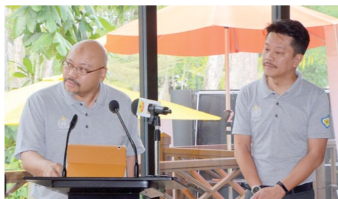
Yang Berhormat Dato Seri Setia Awang Abdul Mutalib bin Pehin Orang Kaya Seri Setia Dato Paduka Haji Mohammad Yusof, Minister of Transport and Infocommunications launching the Flash Flood Guidance System.

Also present were Yang Berhormat Members of Legislative