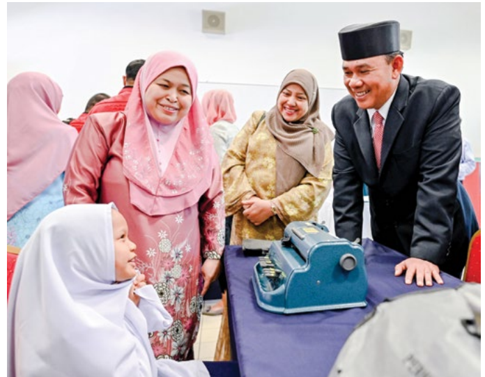
Yang Berhormat Major General (Rtd) Dato Paduka Seri Haji Aminuddin Ihsan bin Pehin Orang Kaya Saiful Mulok Dato Seri Paduka Haji Abidin, Minister of Culture, Youth and Sports witnessing the use of braille machines by the visually impaired students.

The Braille, Orientation and Mobility Workshop is divided into five sessions throughout the month of April until October. The first session will be held for 15 days, which already began on the 8 th of April until the 27 th of April 2019.