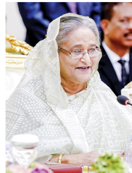
Her Excellency the Honourable Prime Minister of the People's Republic of Bangladesh delivering her speech during the bilateral meeting.

After the Bilateral Meeting, His Majesty, together with Her Excellency, witnessed the Signing of Memorandums of Understanding (MoUs) between the Government of His Majesty and the