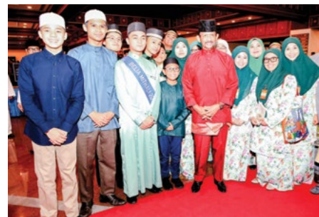
12. Prayer shapes a Pious Ummah