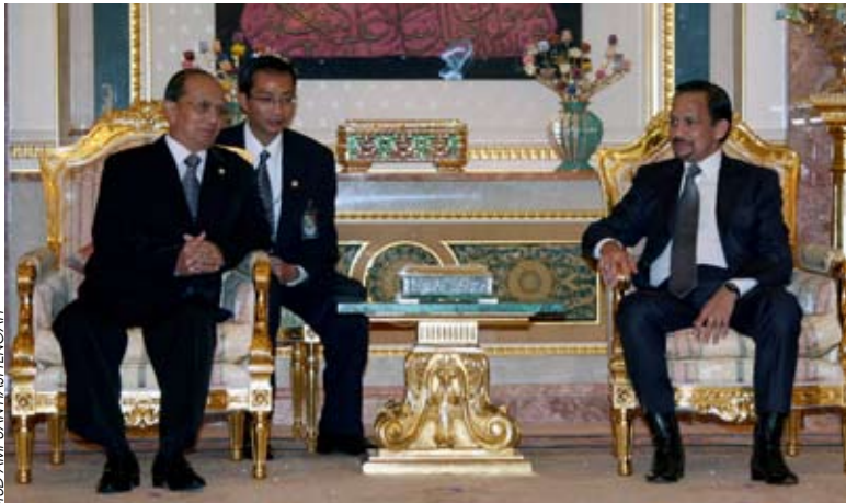
His Excellency General Thein Sein, the Prime Minister of Myanmar during audience to His Majesty.