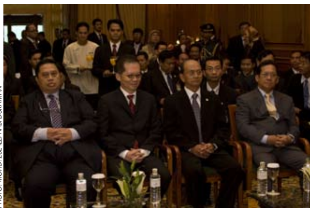
His Excellency General Thein Sein (second from right) at a briefing by the Brunei Economic Development Board.

BANDAR SERI BEGAWAN, January 18 - Myanmar's Prime Minister General Thein Sein was in Brunei Darussalam for a three-day visit starting January 16.