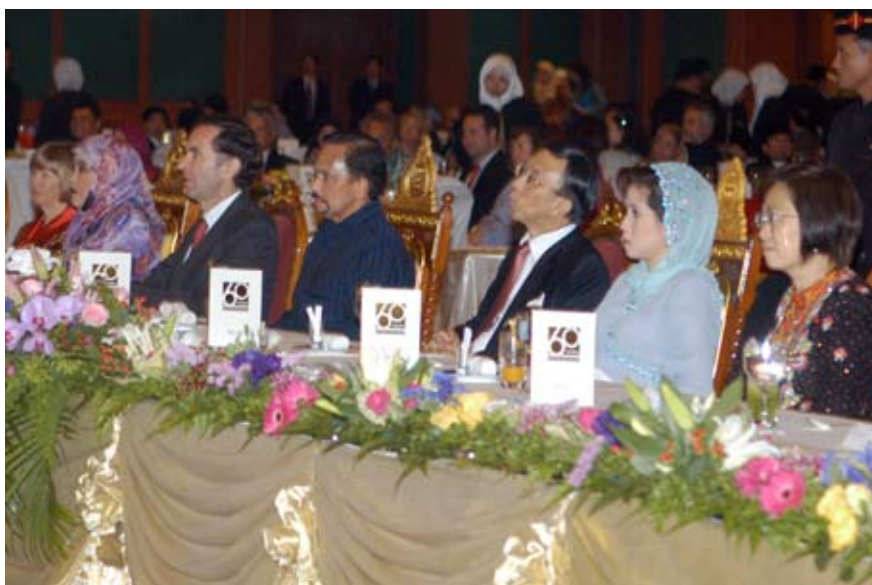
Their Majesties and Her Royal Highness Pengiran Isteri attend HSBC's 60 th year anniversary in Brunei.