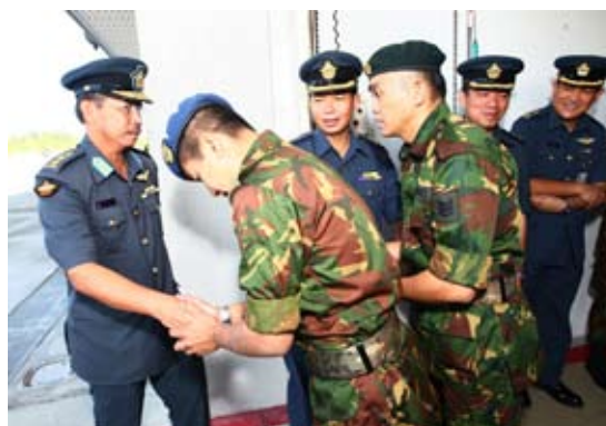
The Commander of Royal Brunei Land Forces and officials bid farewell to the second IMT troop.

The first group of the IMT left for the Philippines in September 2007.