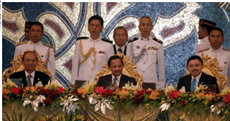
His Majesty and His Royal Highness the Crown Prince at a banquet hosted for His Excellency General Thein Sein.

ISTANA NURUL IMAN, January 16 — Brunei Darussalam and the Union of Myanmar have built a good working relationship through personal contacts and some extremely useful cooperations.