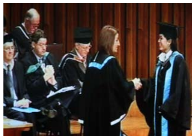
Her Royal Highness receives her degree at a convocation ceremony in London.

BANDAR SERI BEGAWAN, January 11 - Her Royal Highness Princess Fadzilah Lubabul Bolkiyah, the daughter of His Majesty Sultan Haji Hassanil Bolkiah Mu'izzaddin Waddaulah, The Sultan and Yang Di-Pertuan of Brunei Darussalam was awarded a Bachelors of Arts with Honours in International Studies from Kingston University. The convocation took place at Barbican Centre, London on January 9.