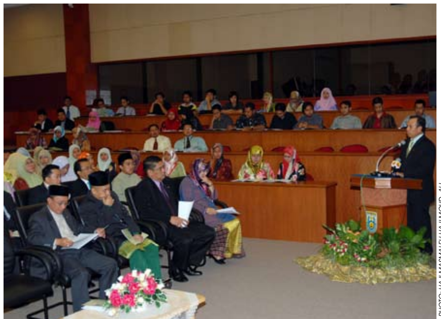
The Minister of Culture, Youth and Sports delivers his speech.