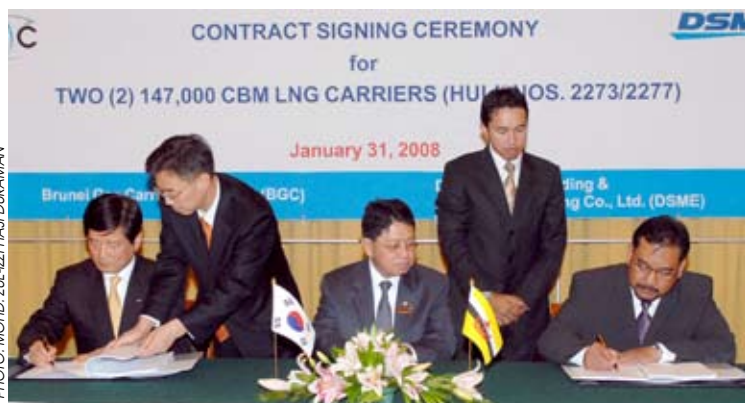
The contract signing ceremony was witnessed by the Minister of Energy at Prime Minister's Office (centre).

The signing ceremony was witnessed by the Minister of Energy at Prime Minister's Office, Pehin Orang Kaya Seri Utama Dato Seri Setia Haji Awang Yahya as BGC's Chairman for its Board of Directors.