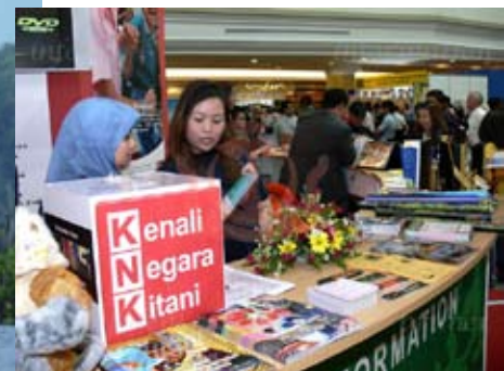
Brunei Darussalam is promoting herself as an eco-tourism destination where 78 per cent of the country's total land area is covered by forests with 40 per cent of the land is gazetted Forests Reserve.