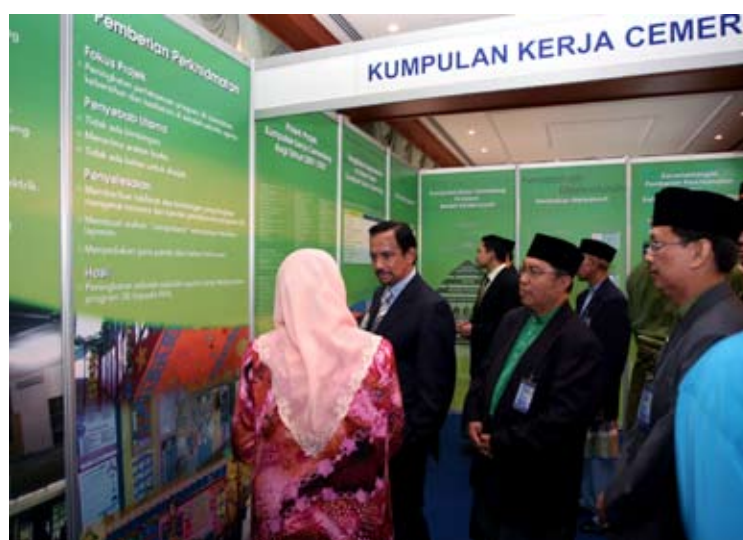
Various measures have been taken in ensuring a high quality of public services. One such measure is by introducing the Kumpulan Kerja Cemerlang.