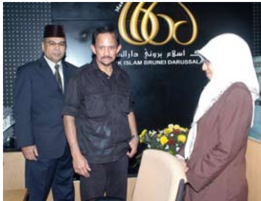
Both the public and private sectors have given strong support in enhancing business opportunities for the small- and medium-enterprises (SMEs).