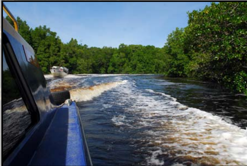
Scenery along the journey to Selirong Island