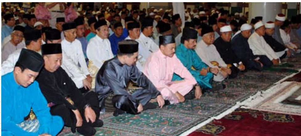
His Majesty and male members of royal family join mass Aidiladha prayer.