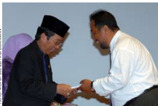
The Deputy Minister of Education launches the Guide Book Guidance Services and Counselling and Career Education Workshops for Schools in Brunei Darussalam.

BANDAR SERI BEGAWAN, January 24 - To ensure that the children of this nation receive formal education within an appropriate period in schools; and to enhance the quality of the education, the Ministry of Education have enforced the 'Compulsory Education Order 2007' that took effect from November 24, 2007.