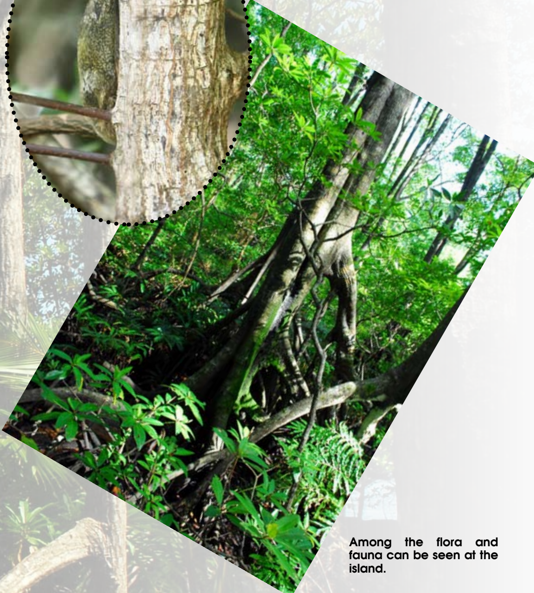
Among the flora and fauna can be seen at the island.