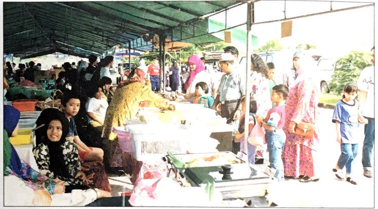
Pictures show a few of the Ramadan stalls with their wide range of food selection. As the day progresses and the time for breaking the fast draws closer, crowds begin to fill the area.

Indeed, none can be more enticing and appetising than the delicious, sweet traditional cakes or 'kueh', and spicy meat and sea-food dishes and other sizzling Brunei Malay cuisine which one can get from the Ramadan stalls to satisfy the palate after a long day's fast.