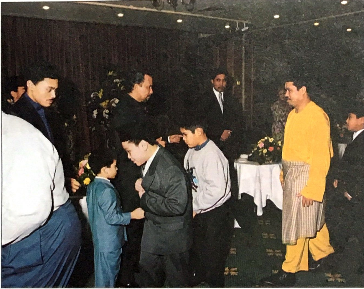
His Majesty Paduka Seri Baginda Sultan Haji Hassanal Bolkiah Mu'izzaddin Waddaulah, Sultan and Yang Di-Pertuan of Brunei Darussalam, in picture at left, and Her Majesty Paduka Seri Baginda Raja Isteri Pengiran Anak Hajjah Saleha and Her Royal Highness Pengiran Isteri Hajjah Mariam, picture below, lead members of the royal family at the audience they granted to Bruneians who are currently either serving at various Brunei agencies in the United Kingdom or studying and undergoing various training there.