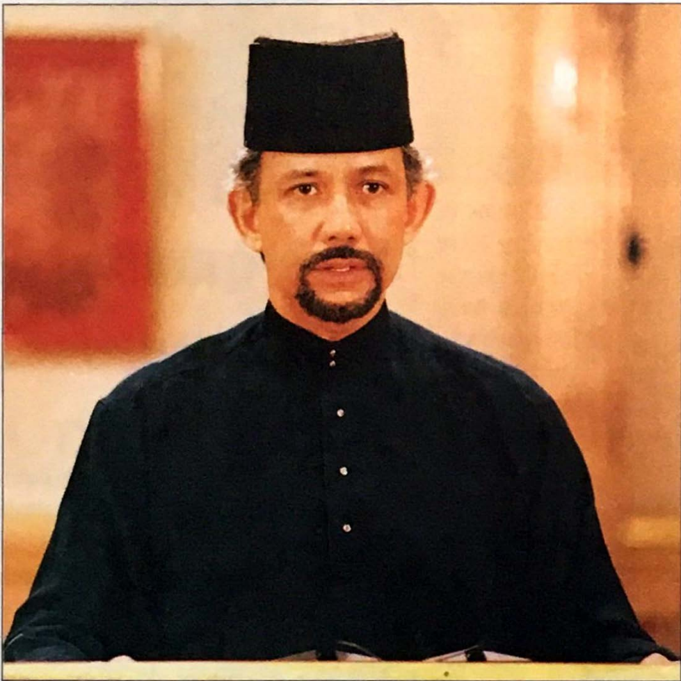
His Majesty Paduka Seri Baginda Sultan Haji Hassanal Bolkiah Mu'izzaddin Waddaulah, Sultan and Yang Di-Pertuan of Brunei Darussalam speaking to the nation on new year's eve, urging for effort to be continued to ensure that the country's development process run smoothly.