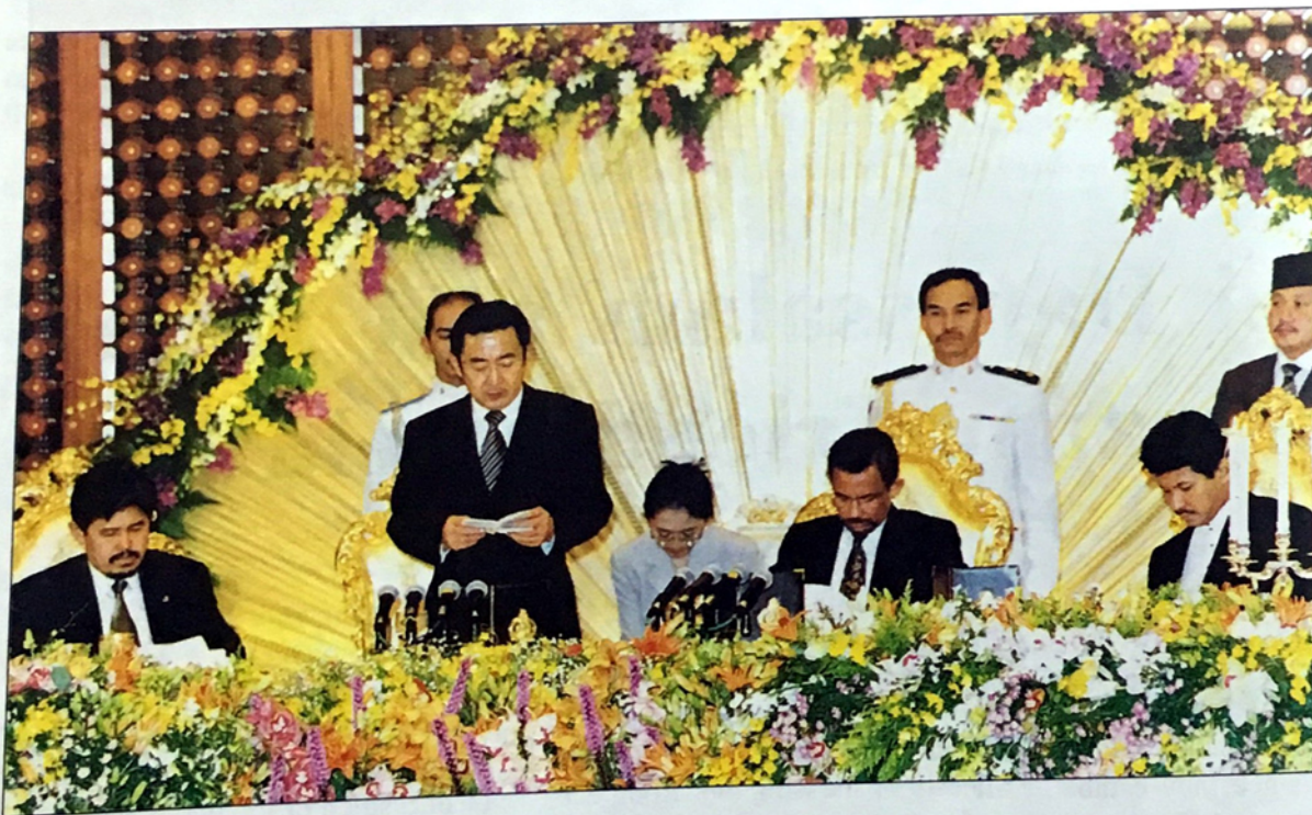
His Majesty The Sultan and Yang Di-Pertuan of Brunei Darussalam, picture above, and Japanese Prime Minister His Excellency Mr. Ryutaro Hashimoto, picture left both spoke of the close, friendly relations between their two countries at a dinner held in honour of the Japanese leader. Both stressed that the good Brunei Darussalam-Japan working relationship avails room to further cooperation.

• from page 5 (Brunei Darussalam and Japan enjoy warm, friendly relations)