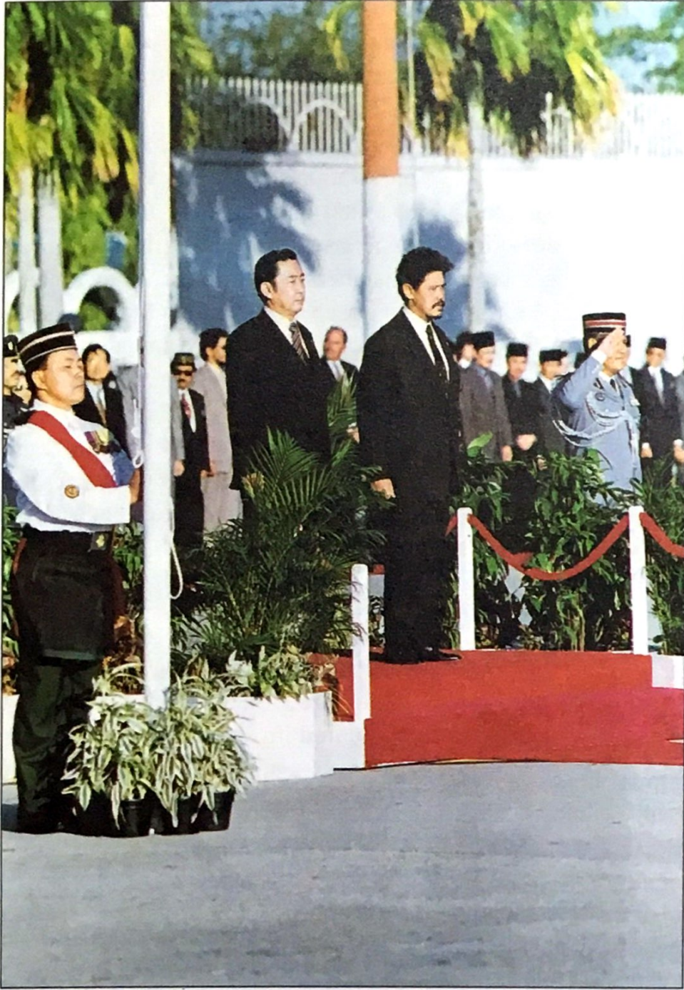
Accompanied by His Royal Highness Prince Mohamed Bolkiah as personal representative of His Majesty The Sultan and Yang Di-Pertuan of Brunei Darussalam, His Excellency Mr. Ryutaro Hashimoto takes the salute during a guard of honour at his official welcoming ceremony, left, and below, the Japanese Prime Minister inspecting the guard of honour contingent.