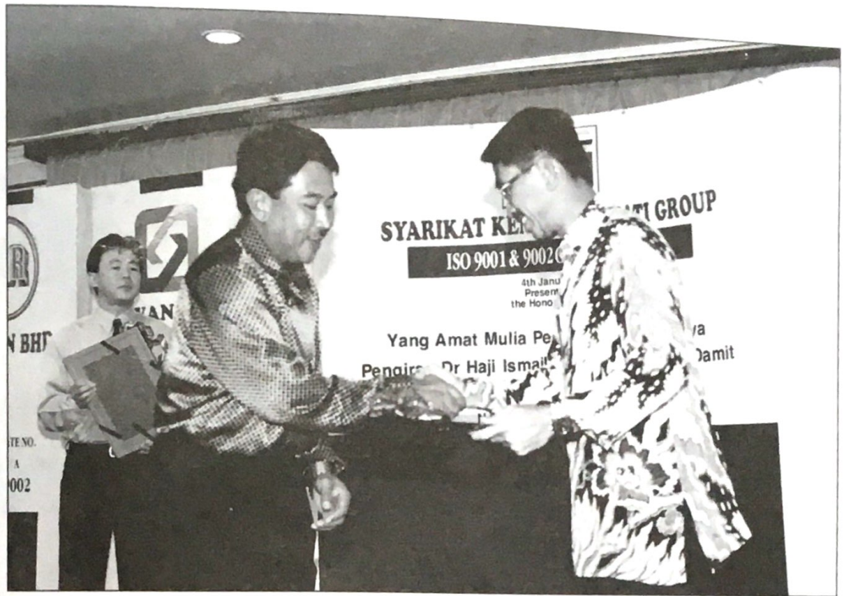
The Minister of Development, Yang Amat Mulia Pengiran Indera Wijaya Pengiran Dr. Haji Ismail, right in picture above, called for creation of mechanisms to enable large firms assist their smaller counterparts toward achieving quality management shortly before he presented the ISO 9001 Certificate to a local company.

Besides vision and far-sightedness, entrepreneurs also need the necessary