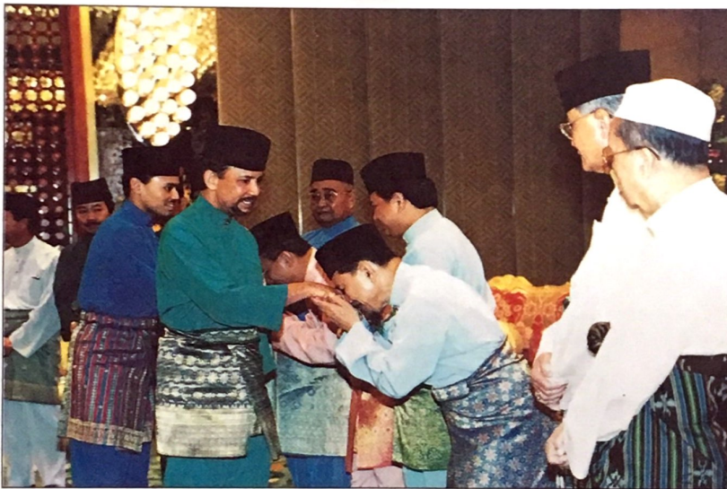
Above and below: His Majesty exchanges greetings and chatting with local dignitaries and foreign VIPs including foreign diplomats when he granted them an audience at Istana Nurul Iman on the first day of Hari Raya Aidilfitri.