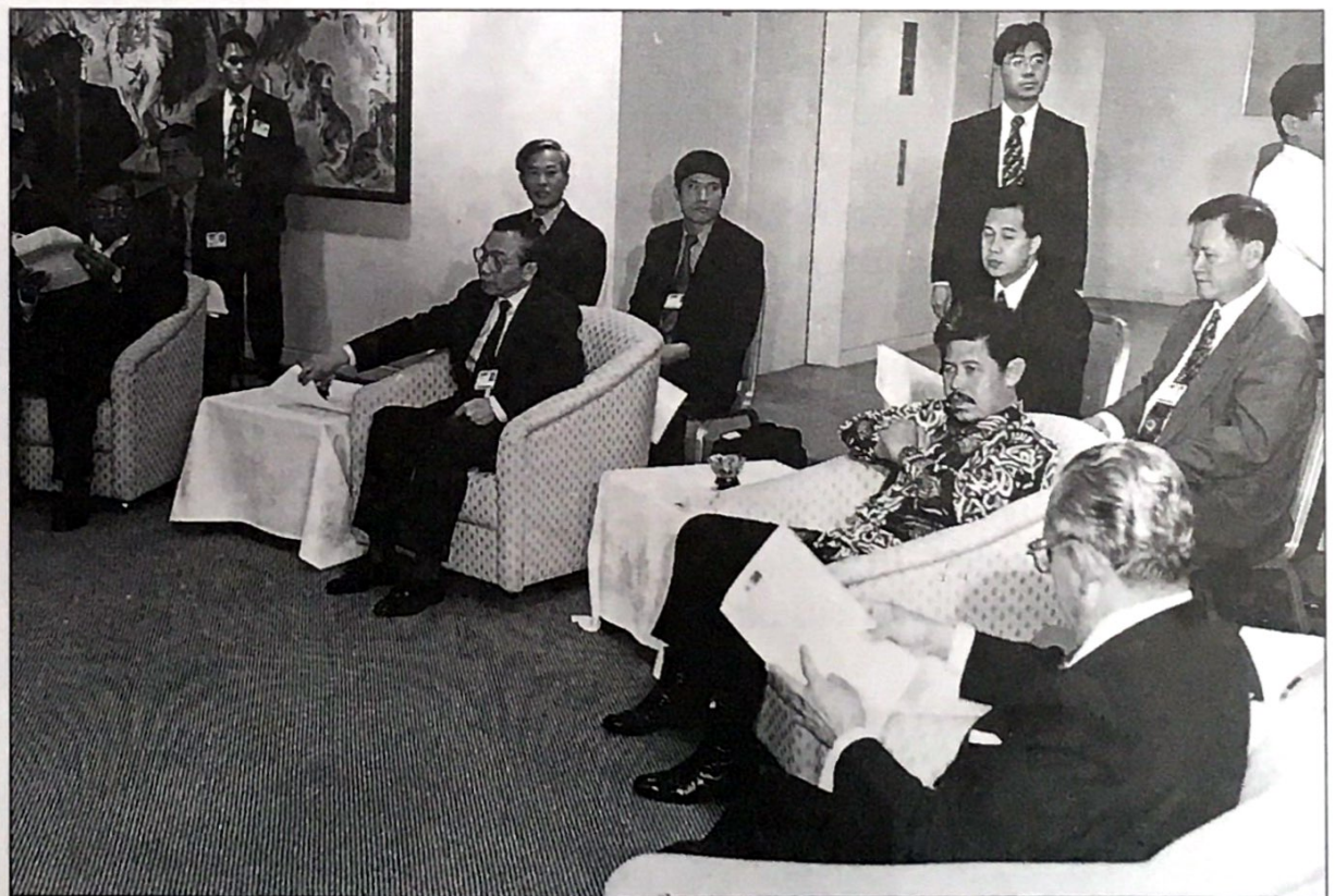
Above: The Brunei Darussalam Foreign Affairs Minister (5th from left) joins his counterparts from the ASEAN member countries and those of the European Union to pose for a group photograph at their latest meeting in the Republic of Singapore, while picture below shows His Royal Highness in the midst of discussion with some of his ASEAN counterparts.

economic flows between the two regions will drive the dynamo in ASEAN-EU relations. As economic links strengthen, they noted that the role of the private sector will become more vital.