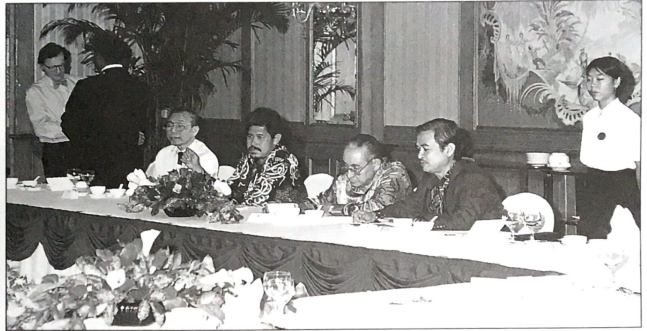
Above: His Royal Highness Prince Mohamed Bolkiah, Minister of Foreign Affairs of Brunei Darussalam at a dinner with other ASEAN and EU Foreign Ministers.

The ministers also noted the importance of the ASEAN-EU Partenariat, ASEAN-EU Industrialist Roundtable and the Junior EU-ASEAN Managers Exchange