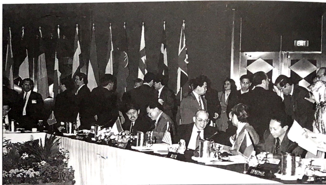
Brunei Darussalam's Minister of Foreign Affairs, His Royal Highness Prince Mohamed Bolkiah consulting with the ministry's permanent secretary during a session of the Twelfth ASEAN-European Union Ministerial Meeting (AEMM).

The next issue of the Brunei Darussalam newsletter will appear on 28 February 1997. If there are events relating to our country you would like featured in this newsletter please call us on Tel: 02-383941 or better still, send us a report with a picture, if possible. All editorial rights reserved.