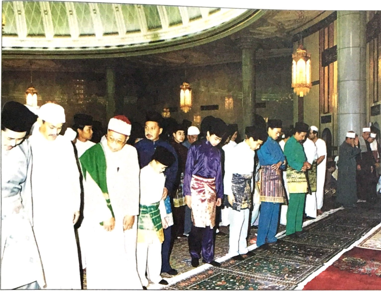
Left: His Majesty The Sultan and Yang Di-Pertuan of Brunei Darussalam and other members of the royal family comprising Their Royal Highnesses Prince Mohamed Bolkiah, Prince Haji 'Abdul 'Azim, Prince 'Abdul Malik and Prince 'Abdul Mateen joined other Muslims in a Hari Raya Aidilfitri prayer at the Omar Ali Saifuddien mosque in the capital, Bandar Seri Begawan.