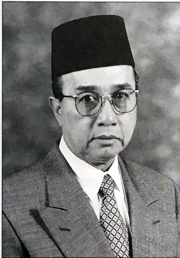
The Minister of Industry and Primary Resources, Yang Berhormat Pehin Orang Kaya Setia Pahlawan Dato Seri Setia Awang Haji Abdul Rahman calling for the pooling of initiatives between the chambers of commerce in Brunei Darussalam so as to figure in the international market.

Such a role could bring a meaningful contribution in supporting the country's economic