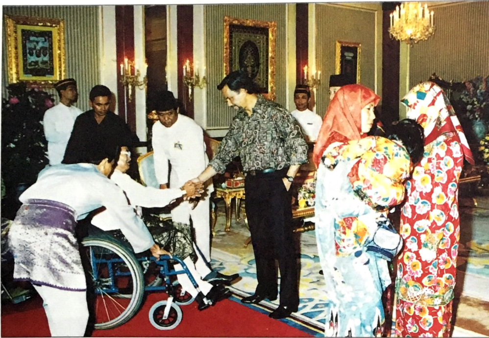
Hari Raya Aidilfitri is an occasion when all should rejoice, and the less fortunate members of society are not forgotten in sharing the joy of the season's festivity. Picture at left shows His Majesty The Sultan and Yang Di-Pertuan of Brunei Darussalam and his children greeting orphans and handicapped people during a Hari Raya Aidilfitri party at Istana Nurul Izzah given by the ruler and his family.