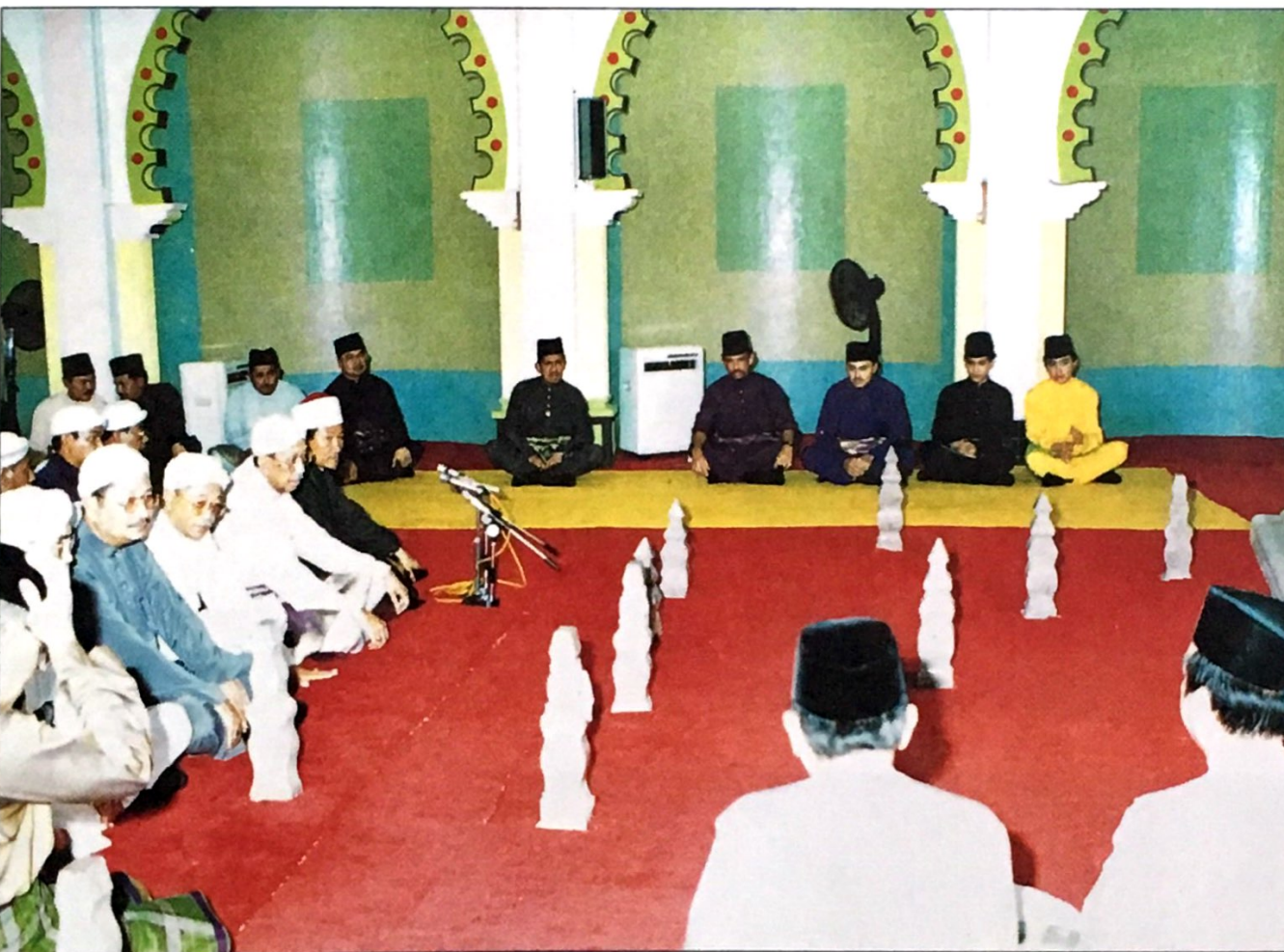
Centre: The Brunei monarch at a 'bertahlil' (offer of prayer) at the royal mausoleum in memory of his late father, Al-Marhum Sultan Haji Omar Ali Saifuddien Sa'adul Khairi Waddien and late mother, Al-Marhumah Duli Raja Isteri Pengiran Anak Damit. Other members of the royal family also present were Their Royal Highnesses Prince Haji Al-Muhtadee Billah, Prince Haji Sufri Bolkiah, Prince Haji 'Abdul 'Azim and Prince 'Abdul Malik.