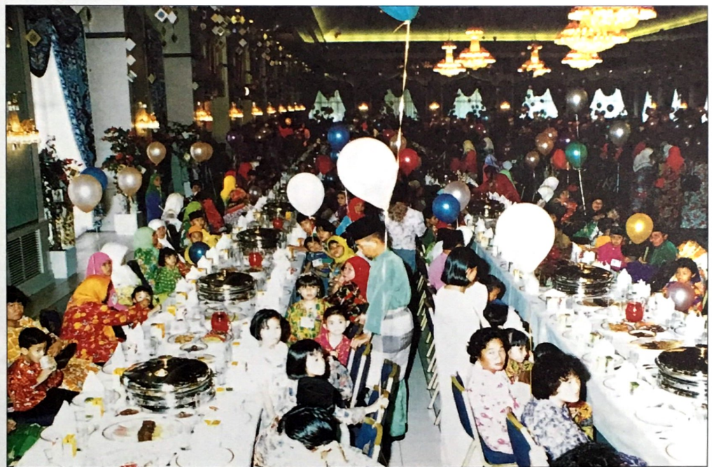
Some 4,000 orphans and handicapped who were present at the Hari Raya party at Istana Nurul Izzah had a real treat and plenty of fun at the function, picture at right.