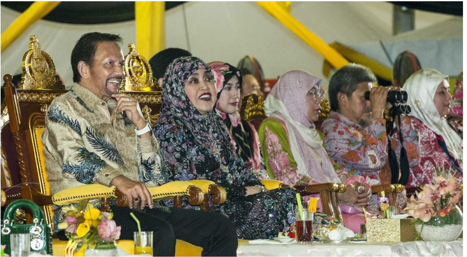
The Opening Ceremony of the Raja Isteri Pengiran Anak Hajah Saleha Bridge became one of the historical events under the reign of His Majesty the Sultan and Yang Di-Pertuan of Brunei Darussalam, in the efforts of the modernisation of Bandar Seri Begawan. The opening ceremony included laser lights and fireworks, followed by the Procession of Decorated Floats and Boats.