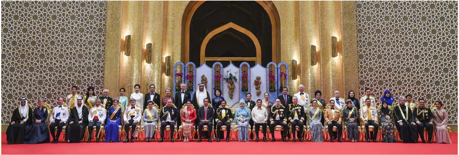
His Majesty Sultan Haji Hassanal Bolkiah Mu'izzaddin Waddaulah ibni Al-Marhum Sultan Haji Omar 'Ali Saifuddien Sa'adul Khairi Waddien, Sultan and Yang Di-Pertuan of Brunei Darussalam and Her Majesty Duli Raja Isteri Pengiran Anak Hajah Saleha binti Al-Marhum Pengiran Pemancha Pengiran Anak Haji Mohamed Alam and members of the Royal Family in a group photo with Royal Dignitaries and Heads of State / Government of their representatives.