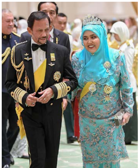
His Majesty Sultan Haji Hassanal Bolkiah Mu'izzaddin Waddaulah ibni Al-Marhum Sultan Haji Omar 'Ali Saifuddien Sa'adul Khairi Waddien, Sultan and Yang Di-Pertuan of Brunei Darussalam and Her Majesty Duli Raja Isteri Pengiran Anak Hajah Saleha binti Al-Marhum Pengiran Pemancha Pengiran Anak Haji Mohamed Alam proceeding to the Royal Banquet.