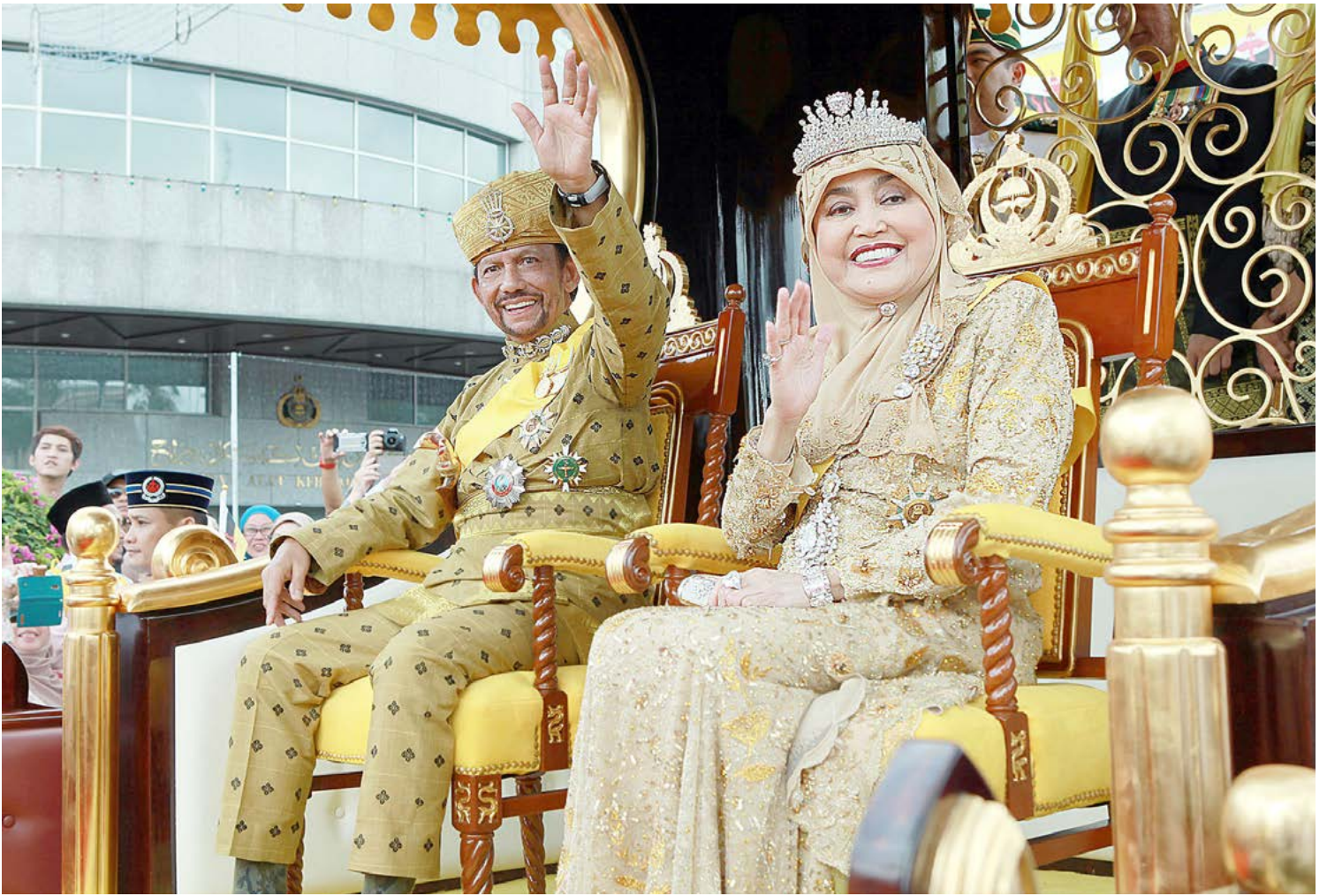
The gleeful and joyful faces that can be seen during the celebration from people and residents who have come from all over the country celebrating as one, the Golden Jubilee Celebration of His Majesty the Sultan and Yang Di-Pertuan of Brunei Darussalam's Accession to the Throne.