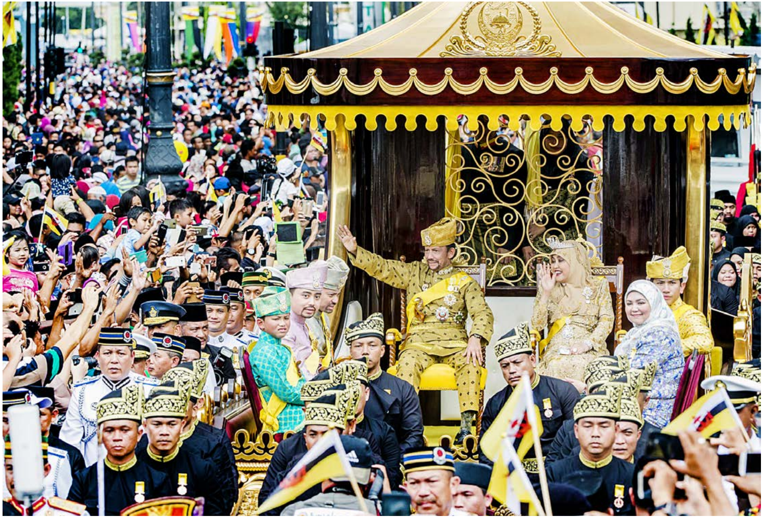
Almost 90,000 people of all walks of life came to witness the historic moment of the Royal Procession surrounding Bandar Seri Begawan in conjunction with the Golden Jubilee Celebration of His Majesty the Sultan and Yang Di-Pertuan of Brunei Darussalam's Accession to the Throne.