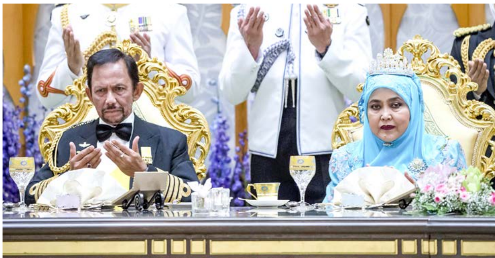
The Royal Banquet in conjunction with the Golden Jubilee Celebration of His Majesty the Sultan and Yang Di-Pertuan of Brunei Darussalam's Accession to the Throne was held on Friday, the 6th of October 2017 corresponding to the 15th of Muharam 1439 Hijrah, at the Istana Nurul Iman.