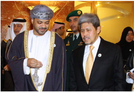
11 Minister of Foreign Affairs and Trade attends 41 st Session of the Council of Foreign Minister