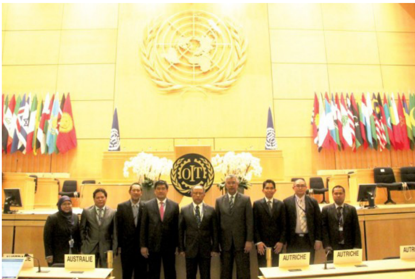
The Deputy Minister of the Ministry of Home Affairs at the 103 rd International Labour Organisation Conference.

A large-scale blood-donation campaign will also be held in conjunction with World Blood Donors Day 2014 throughout the country.