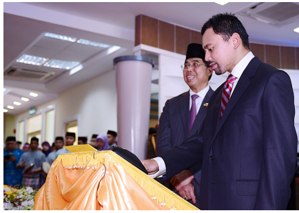
9 Deputy Sultan opens new Minister of Health Pharmaceutical Services building