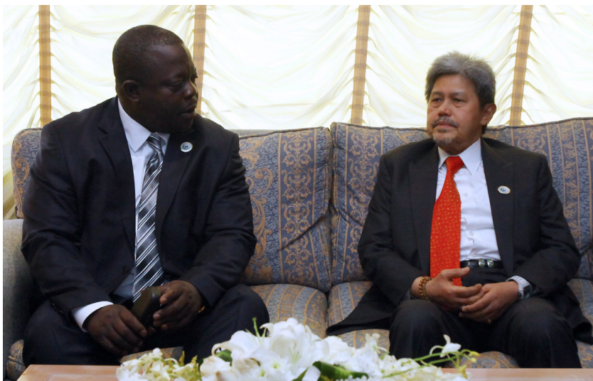
His Royal Highness held a bilateral meeting with the Foreign Minister of Gambia.