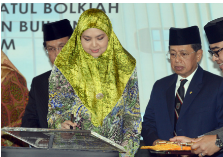
13 Princess officiates 10 th International Nursing and Midwifery Conference