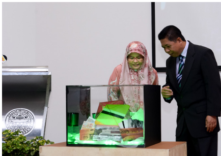
14 Importance of archive to nation's development