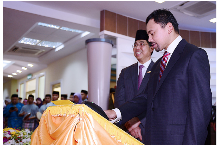
His Royal Highness signed an inauguration plaque.