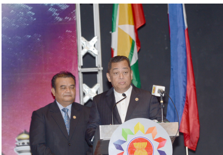
17 ASEAN needs to embrace the right technology to combat crime, urges Minister of Energy