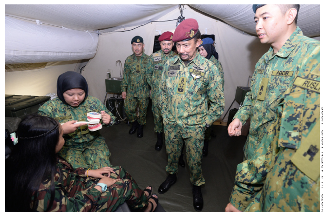
Accompanying His Majesty were his sons, His Royal Highness Crown Prince General Al-Muhtadee Billah, His Royal Highness Prince 'Abdul Malik and His Royal Highness Prince 'Abdul Wakeel.