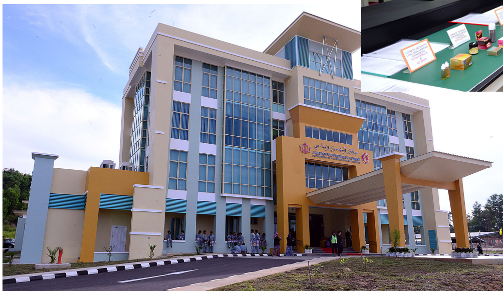
The facade of the MOH Pharmaceutical Service Building.