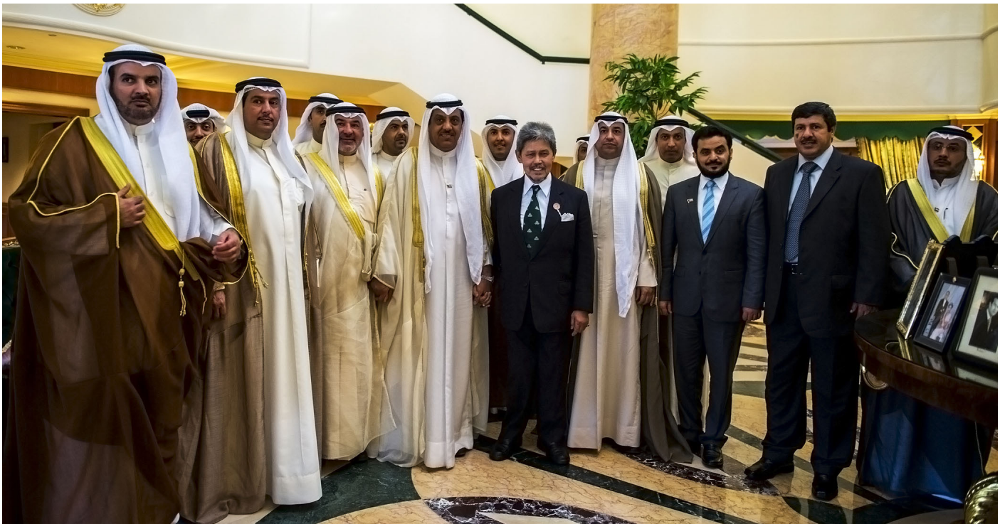
His Royal Highness Crown Prince consented to present the Championship Trophy to the Minister of Development.