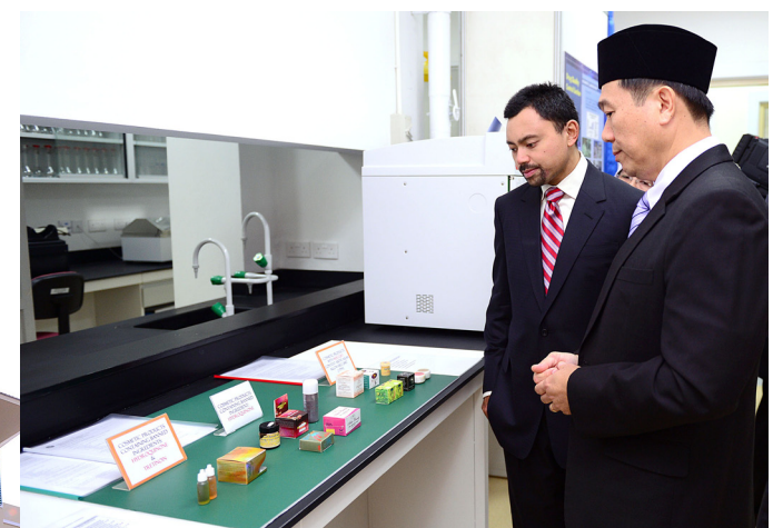
His Royal Highness taking a look at one of the laboratories.