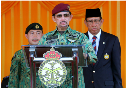
1 Royal's Brunei Armed Forces celebrate 53 rd Anniversary