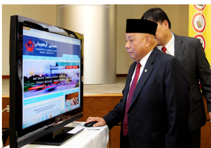
19 Ministry of Communications to introduce more stable and secure Land Transport System