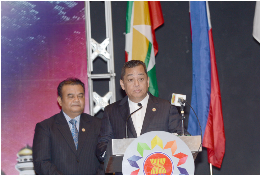
The Minister of Energy at the Prime Minister's Office officiated the 14 th SOMTC