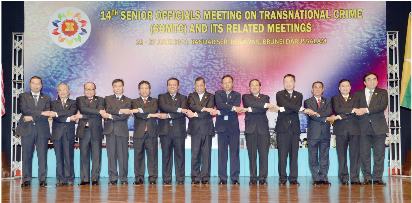
The Minister of Energy joined in the group picture.