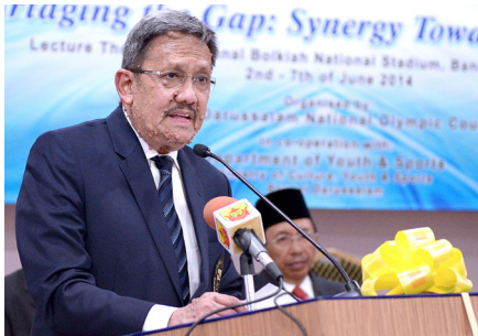
12 'Be a clean athlete and be a national pride,' says His Royal Highness Haji Sufri Bolkiah