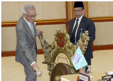
16 Sultanate hosts ASEAN Inter-Parliamentary Assembly