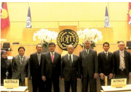
15 Brunei Darussalam attends 103 rd ILO conference