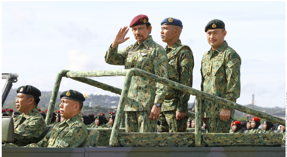
His Majesty inspects the Grand Guard of Honour.